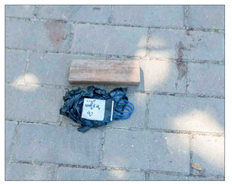
A homemade mine found near BEPS-7 in No 7 East Ward of Thakayta Township was deactivated.

PDF terrorists detonated the planted homemade mines near the fence of the No 7 Basic Education Primary School in No 7 east ward in Thakayta Township, Yangon Region, at around 12:10 pm on 1 January.