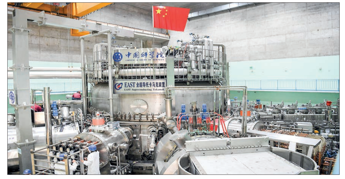
The experiment at the experimental advanced superconducting tokamak (EAST), or the "Chinese artificial sun," also realized a plasma temperature of 160 million degrees Celsius, lasting for 20 seconds.

This time, steady-state plasma operation was sustained for 1,056 seconds at a temperature close to 70 million degrees Cel-