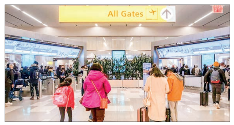
Travelers walk to a security check point at LaGuardia Airport in New York, on 24 December 2021.

AIR travel continued to be severely disrupted in the United States on Saturday, with bad weather in parts of the country adding to the impact of a mas-