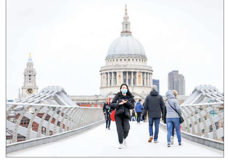
A person wearing a mask walks across the Millennium Bridge in London, Britain, on 9 March 2020.

The health secretary, writing in the Daily Mail, said England "welcomed in 2022 with