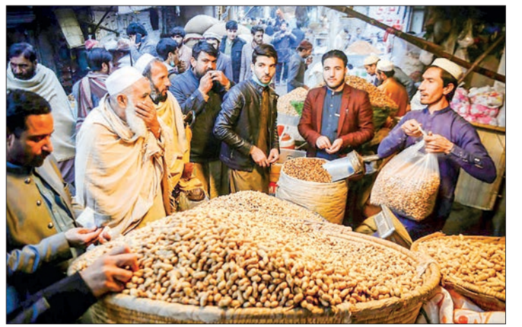
People buy peanuts at a shop in northwest Pakistan's Peshawar on 9 December 2020.

According to the PBS data, in rural areas, non-food inflation was higher than that recorded in urban areas - a reversal of the trend that is usually witnessed where urban areas experience higher inflation. Citing the finance ministry report, the Pakistani publication reported that the global commodity prices surged to unprecedented levels, putting pressure on currencies and pushing inflation around the world to higher levels.—ANI