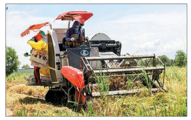
The leading upland rice growing provinces are Rotanak Kiri, Kampong Cham and. Siem Reab in Cambodia.

Cambodia's rice export to China exceeds 300,000 tons for 1<sup>st</sup> time last year