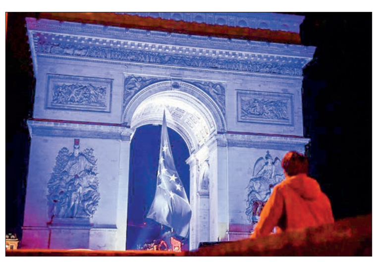
The EU flag was installed to mark the debut of France's helm of the EU Council.

FRENCH authorities removed a temporary installation of the European Union flag from the Arc de Triomphe monument in Paris on Sunday, after right-wing opponents of President Emmanuel Macron accused him of "erasing" French identity.