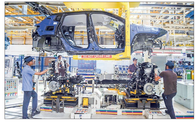
In fiscal year 2021, the automobile sector in India saw an equity inflow from foreign direct investments worth approximately 1.6 billion US dollars. In this photograph taken on 23 July 2019 workers assemble a car at a FCA India Automobiles manufacturing facility in Ranjangaon, some 200km east of Mumbai.

This will enable the transfer of an amount of more than Rs 20,000 crore to more than 10 crore beneficiary farmer families, said PMO. — ANI ■