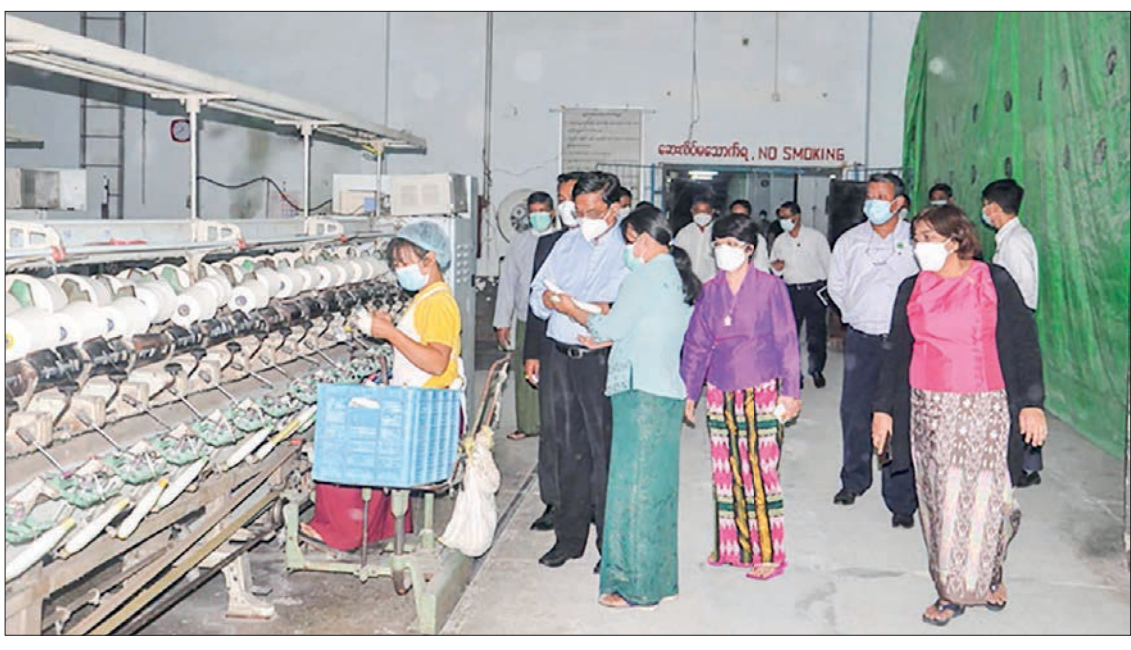
Union Minister for Industry Dr Charlie Than views round production process of Textile Factory (Paleik).

With the development of the textile industry, all those involved in the garment sector will have