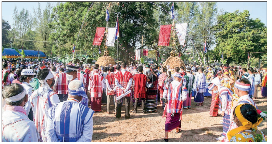
Kayin national races joyfully participate in 2716 Kayin New Year Day in Hpa-an Township on 2 January 2022.