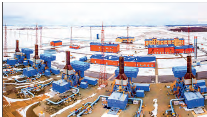
The pipeline, opened in 1994, runs over 2,000 kilometres (1,242 miles) to Germany from the city of Torjok in central Russia, transiting through Belarus and Poland.

WITH the arrival of winter in Europe and energy prices soaring, tensions are running high over the provision of gas from Russia – especially through the Yamal-Europe pipeline that runs through Poland and Belarus.