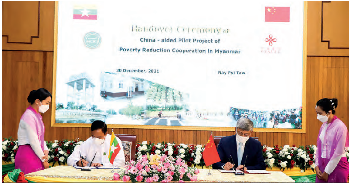
Myanmar and China sign the document to hand over the China-aided Pilot Project of Poverty Reduction Cooperation in Myanmar.

During the event, the Chinese Ambassador Mr Chen Hai said the project was conducted in Cambodia, Laos and Myanmar due to the proposal of Chinese Premier Mr Li Keqiang at the East Asia Summit held in Nay Pyi Taw 2014. The pilot projects were implemented in two villages of Myanmar despite the challenges during the outbreak of COVID-19. The efforts of China-Myanmar employees are also