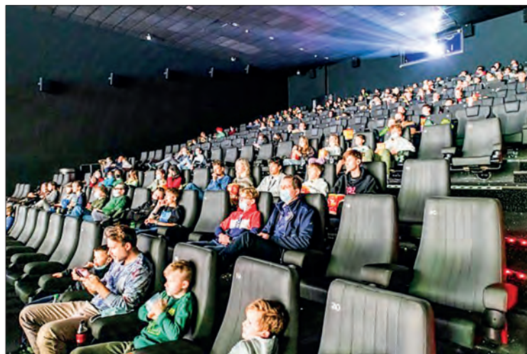
The court decision is not subject to appeal and while it does not directly give cinemas the green light to reopen immediately, such a development appeared only to be a matter of time.

the court ruling in detail,” De Croo’s office said in a statement Tuesday, promising that “all necessary consultations” would rapidly follow.