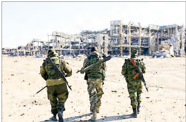
Pro-Russian rebels sappers walk toward the destroyed Donetsk international airport on 13 October 2015.

PRESIDENT Joe Biden will offer his Russian counterpart Vladimir Putin a diplomatic path forward on the Ukraine crisis in a telephone call Thursday, a US official said, setting the tone for security talks next month.