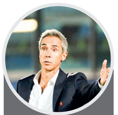
Paulo Sousa is the new coach of Flamengo after agreeing to sever his ties with the Poland national team.

to give joy, titles and to bring the team close to more than 40 million fans."