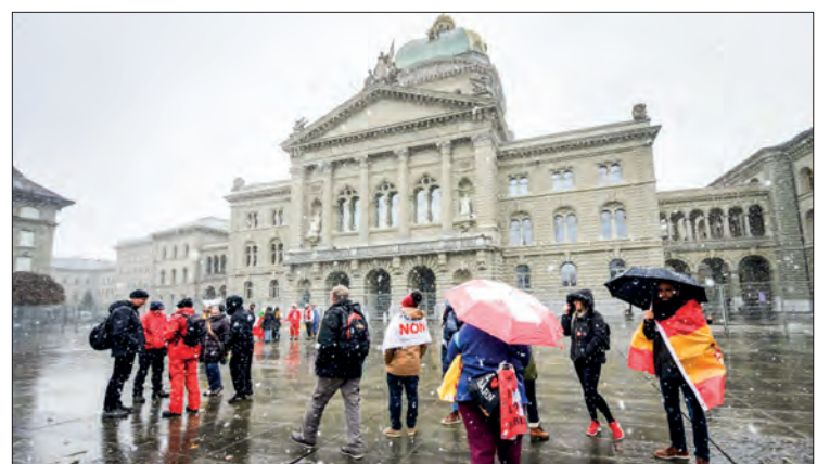
Protesters against the current measures to tackle the spread of the coronavirus demonstrate under snow in front of the Swiss House Parliament on 28 November.

“The department has decided to put the implementation of the revised policy changes on hold, while taking all... comments and inputs received into consideration.”—AFP ■