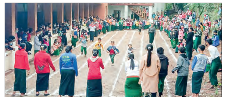
Sports events in action in Kengtung. PHOTO: AUNG ZIN MYINT

The sports events were also organized at basic schools in Kengtung Township in advance marking the 74 th Independence Day and the prize winners will be awarded on 4 January. — Aung Zin Myint (IPRD)/GNLM