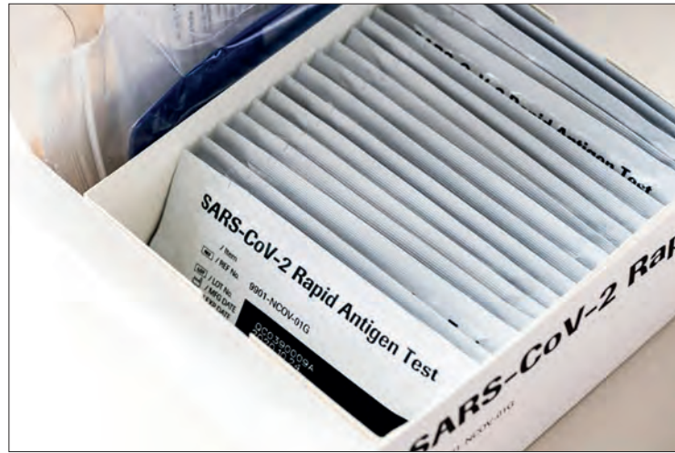
A box with rapid antigen tests for the coronavirus (Covid-19), at the university hospital in Halle/Saale, eastern Germany.

tinue to authorize the use of antigen tests -- which work by detecting surface proteins of the coronavirus -- and that individuals should continue to use them in accordance with the instructions.