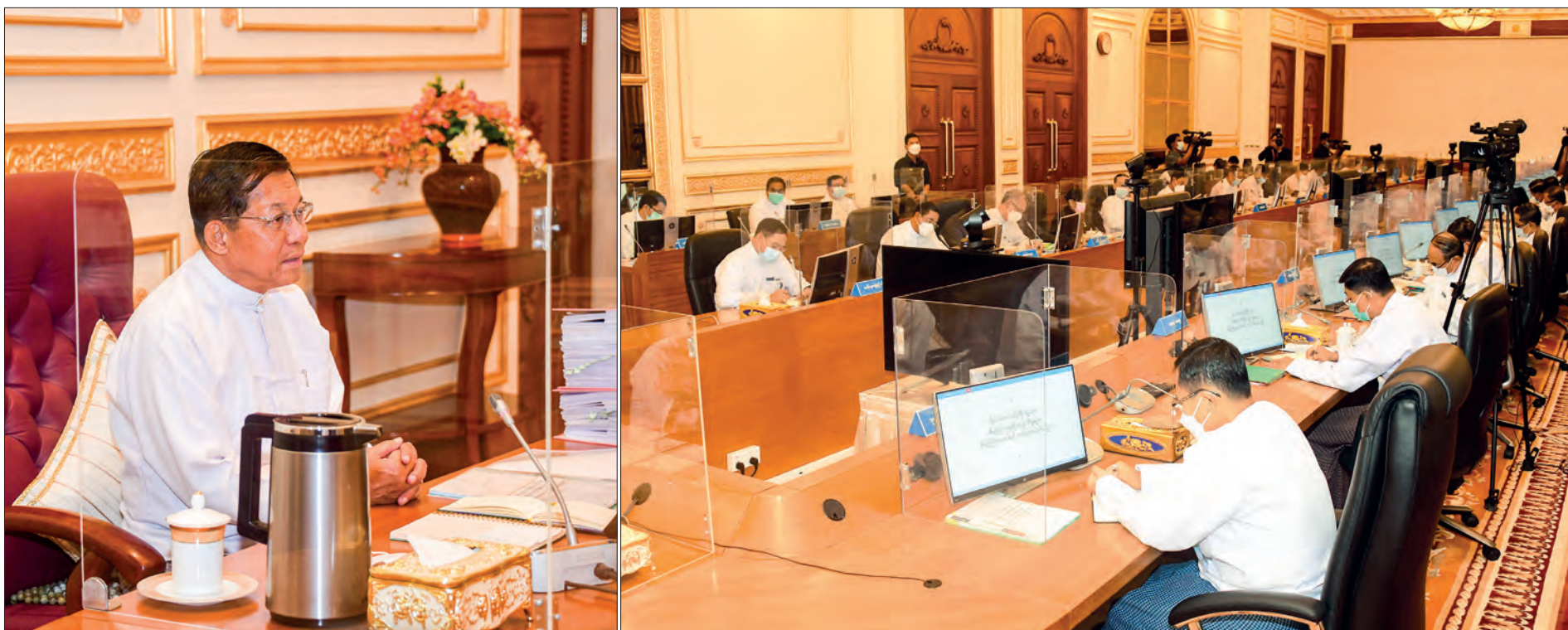
State Administration Council Chairman Prime Minister Senior General Min Aung Hlaing addresses the meeting 4/2021 of the Union government of the Republic of the Union of Myanmar in Nay Pyi Taw on 30 December 2021.

IT is expected that peace talks will be held in the future to boost the benefits related to the peace, said Chairman of the State Administration Council Prime Minister Senior General Min Aung Hlaing at the meeting 4/2021 of the Union government of the Republic of the Union of Myanmar at the office of SAC Chairman in Nay Pyi Taw yesterday morning.