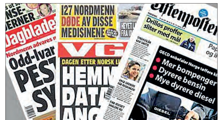
Norway's second-largest media group on Wednesday said a ransomware attack has halted the publication of some of its local newspapers in print for the foreseeable future.

Nedregotten added that the company was "not going to enter into a dialogue" about the ransom.—AFP ■