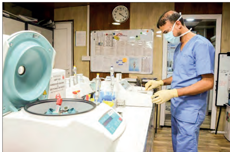
Years of conflict have left much of Iraq's health sector struggling, prompting organizations like MSF to seek to fill the gap.

"The doctor had inserted a platinum plate, but it was not done right. I tried to find another