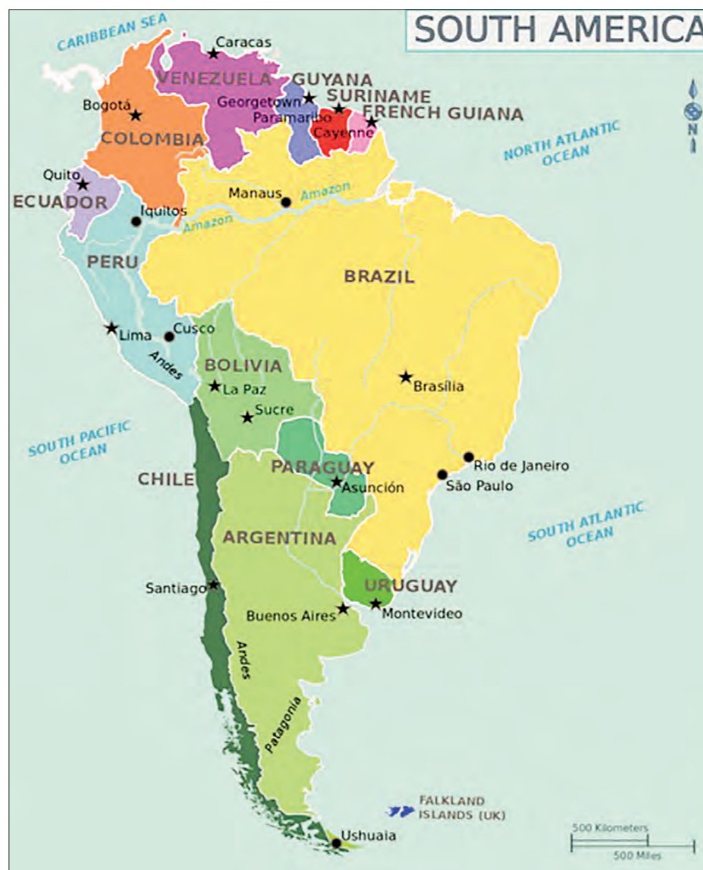
Contemporary political map of South America: Source; Wikipedia, the free encyclopaedia

By THAN HTUN (MYANMAR GEOSCIENCES SOCIETY)