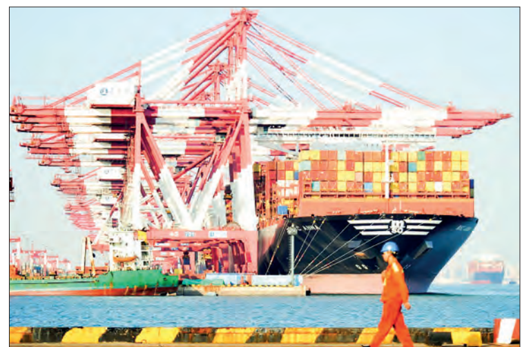
The Port of Qingdao is a seaport on the Yellow Sea in the vicinity of Qingdao, Shandong Province, People’s Republic of China.

China is pursuing a holistic approach to national security and taking more active steps to integrate into the process of economic globalization, the white paper said.—Xinhua ■