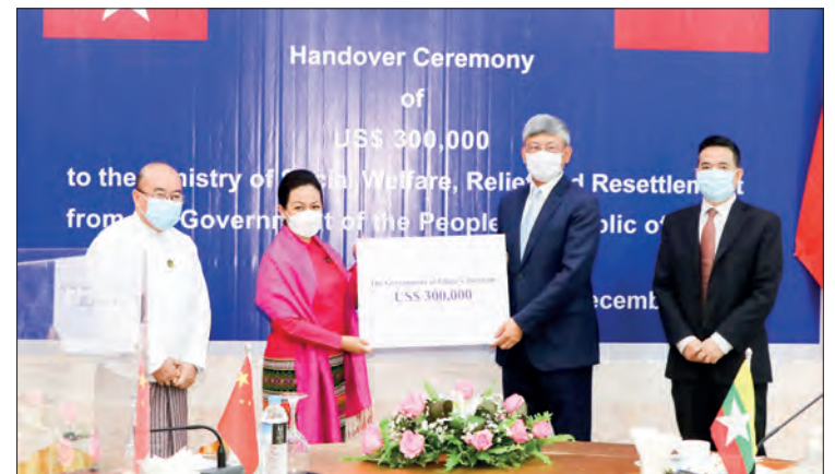
The MoSWRR Union minister receives US$300,000 donation from China.

She said that further steps include repatriation of displaced persons and social harmony activities are essential and the establishment of the University of