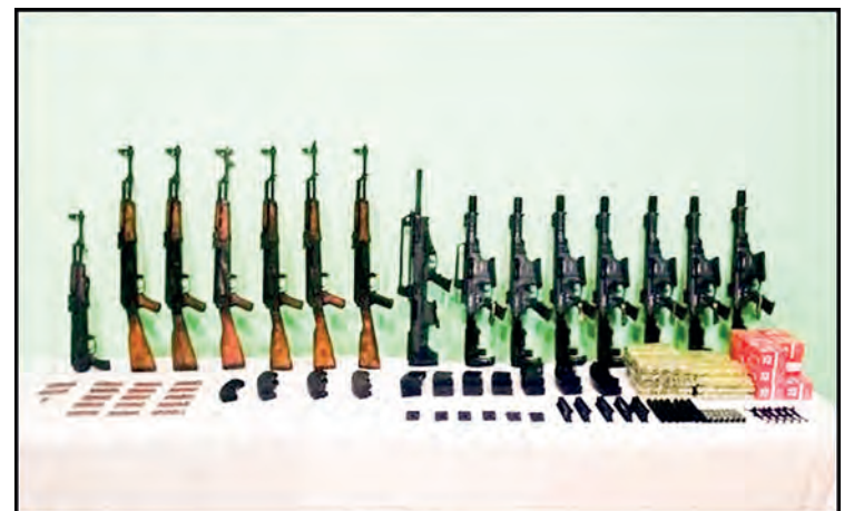
Seized assorted weapons.

In such doing, 21 terrorists, including two former Hluttaw Representatives from terrorist NUG and those who participated in the CDM campaign were arrested with seven assort-