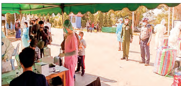
Reception processes are underway for Myanmar returnees.

It is reported that officials from the respective Military Command Headquarters visited the site and coordinated the necessary work.