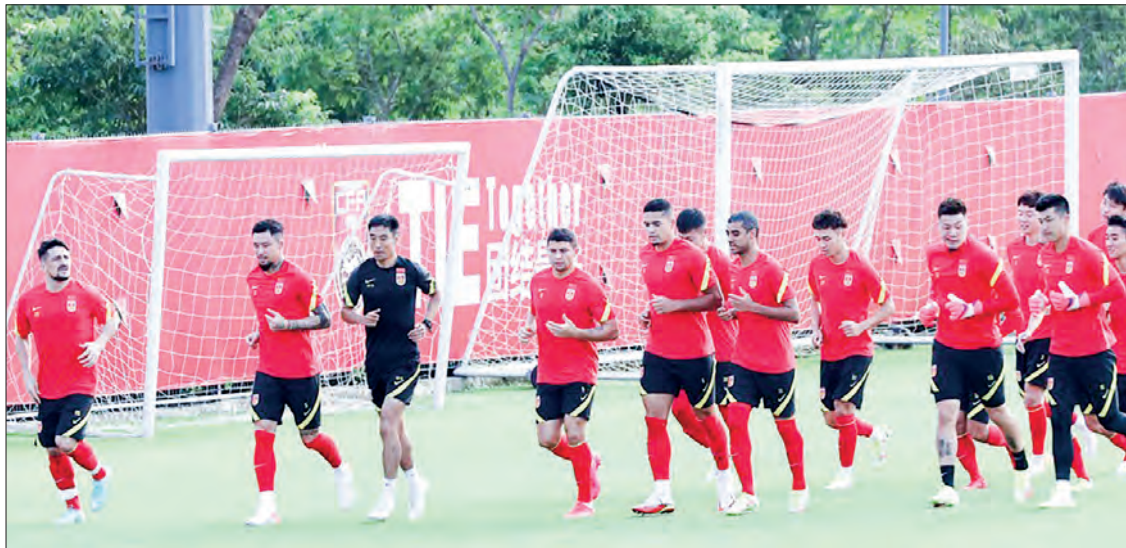
Chinese men's national football team attend a training session in Shanghai on 18 Aug 2021.