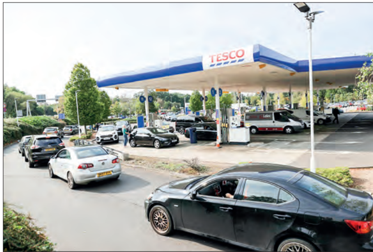
A line of vehicles at a Tesco station in Camberley, England.

The most spectacular surge was that of Europe’s reference gas price, Dutch TTF, which hit 187.78 euros per megawatt hour in December – 10 times higher compared with the start of the year. The spike has been fuelled by geopolitical tensions surrounding Russia, which supplies one third of Europe’s gas.