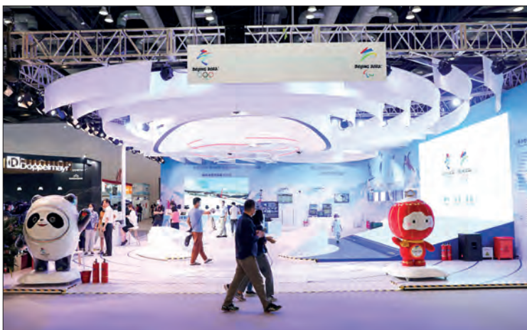
People visit the Beijing 2022 Winter Olympic Games and Winter Paralympic Games exhibition area at the World Winter Sports Exhibition Hall of the 2020 China International Fair for Trade in Services (CIFTIS) in Beijing, capital of China, 5 Sept 2020. Together with the CIFTIS, the World Winter Sports (Beijing) Expo is held in Beijing.

CHINA on Tuesday satirized US visa applications for officials of the country to attend the 2022 Beijing Olympics, saying it is puzzling as Washington has pledged