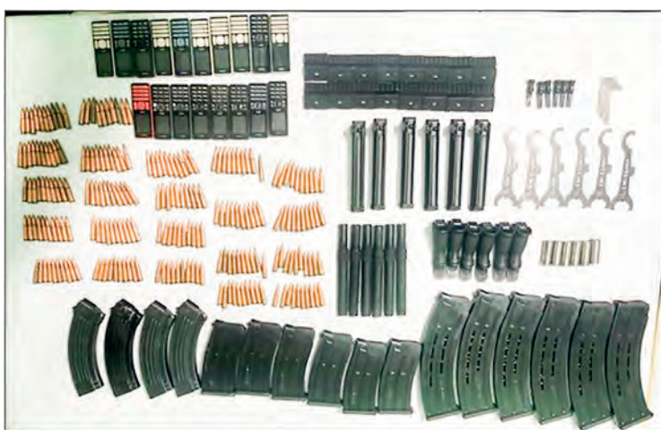
Confiscated arms and ammunition.