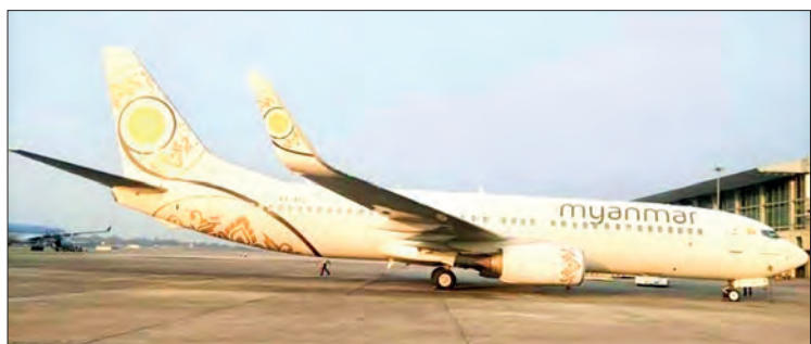
One of the aircraft in the MNA Fleet.

MYANMAR National Airlines (MNA) will operate relief flights and special relief flights to India, Thailand, Singapore, Malaysia and the Philippines in January 2022, according to the airlines.