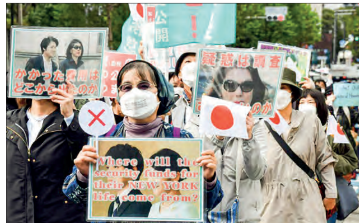
A march to protest against the marriage of Japan's former Princess Mako to Kei Komuro in Tokyo.

JAPAN'S imperial family is facing extinction due to a shortage of eligible emperors, but some experts say the ideas floated in a government inquiry for boosting the dwindling number of royals are out of touch.