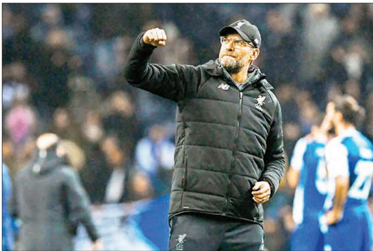
Liverpool manager Jurgen Klopp wants the League Cup semi-finals played over one-leg.

LIVERPOOL manager Jurgen Klopp and Tottenham boss Antonio Conte have called for January's League Cup semi-finals to be switched to one-legged ties to ease fixture congestion.