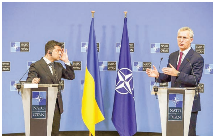
Ukrainian President Volodymyr Zelensky, left, and NATO Secretary General Jens Stoltenberg are seen at a news conference at the European Union headquarters in Brussels on 16 December.

RUSSIAN Foreign Minister Sergey Lavrov said on Wednesday he expects negotiations with the United States over Moscow's security demands to begin in January, with growing