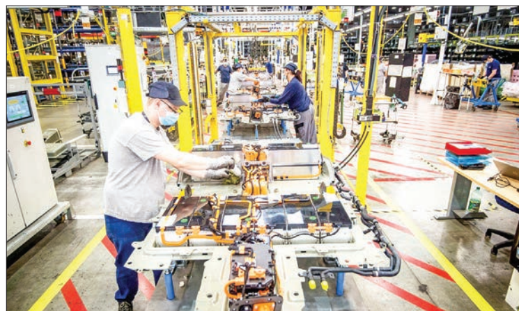
Car production makes up 41 per cent of industrial output in Slovakia.

The shortage wreaked havoc on the two countries that were Czechoslovakia until a peaceful split in 1993, and which are