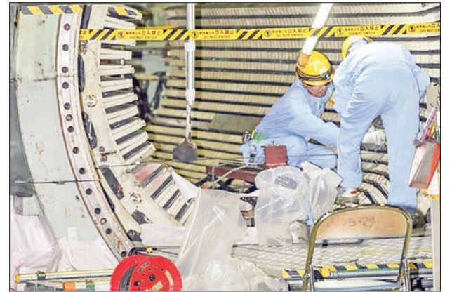
Workers dismantle the Unit 2 reactor at Chubu Electric Power Co.'s Hamaoka nuclear power plant in Omaezaki, Shizuoka prefecture.