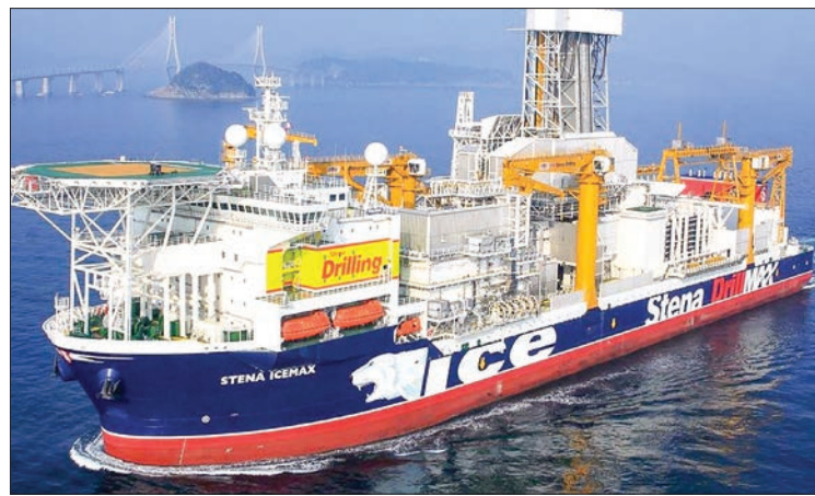
Stena IceMAX is the world's only 6 th Generation Ice-Class Harsh Environment dual-activity dynamically positioned (DP3) drillship, capable of drilling in water depths up to 10,000ft.

"With the appraisal drilling in Glafcus 2, the drilling programme resumes in the EEZ of Cyprus," Energy Minister Natasa Pilides tweeted on Wednesday. "We worked with our licensees to ensure the safety of their activities