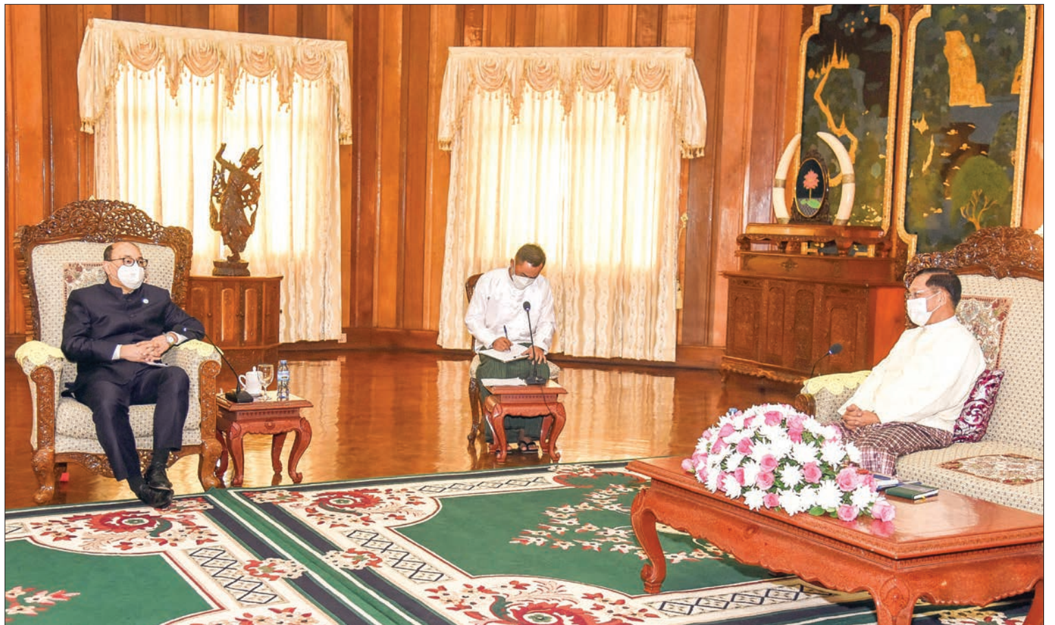
State Administration Council Chairman Prime Minister Senior General Min Aung Hlaing receives Shri Harsh Vardhan Shringla, Foreign Secretary of the External Affairs Ministry of India at the parlour of the Zeyathiri Beikman on Konmyinthta of Yangon Command Headquarters on 23 December 2021.

At the meeting, they frankly exchanged views on exchange of goodwill visits of two governments and two armed forces of Myanmar and India, promotion of bilateral trade due to both side cooperation, situation to manage the direct trade between the two countries, direct maritime trade process, further cooperation in development of border regions, prospects of investment from India in necessary infrastructures for generating electricity in Myanmar, training and teaching, technological assistance of India in development of agriculture and livestock sectors, sales and contribution of vaccines by India for prevention, control and treatment of COVID-19, discharging of State responsibilities by the Tatmadaw under the Constitution (2008) due to voting fraud in the 2020