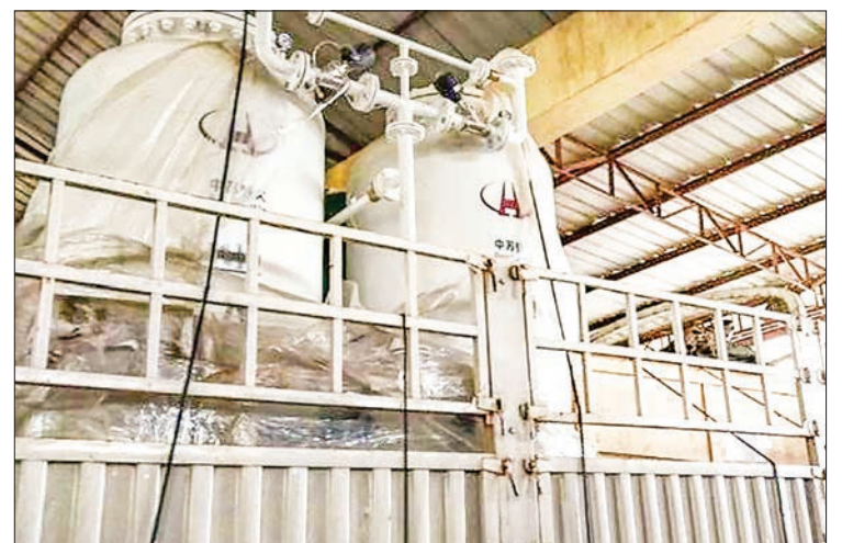
One of the imported oxygen plants.

It is reported that the Ministry of Commerce is coordinating with relevant departments and treatment of COVID-19 as well as contact persons for inquiries can be reached through the Ministry's Website —www.commerce.gov.mm.—MNA