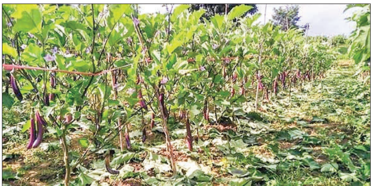
The eggplant price is ranging between K800 and K1,000 per viss in the retail market. Now, the eggplant growers are happy, making a good profit, said U Sai Hla Win, an eggplant grower from Naungkat village.

The eggplant price is ranging between K800 and K1,000 per viss in the retail market. Now, the eggplant growers are happy, making a good profit, said U Sai Hla Win, an eggplant grower from Naungkat village. —Khin Lay (Hsipaw IPRD)/GNLM