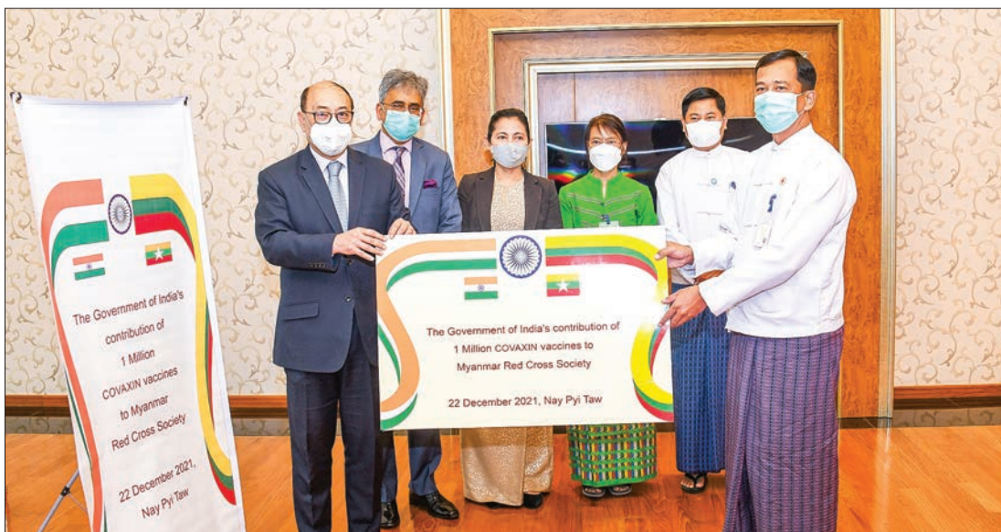
The handover event to present one million doses of Covaxin donated by India to Myanmar in progress.

THE handover ceremony to deliver 1 million doses of COVAXIN donated by the Government of India to Myanmar was held on 22 December 2021 at the VIP Lounge of Nay Pyi Taw International Airport. At the ceremony, Shri Harsh Vardhan Shringla, Foreign Secretary of India, handed over COVID-19 vaccines to U