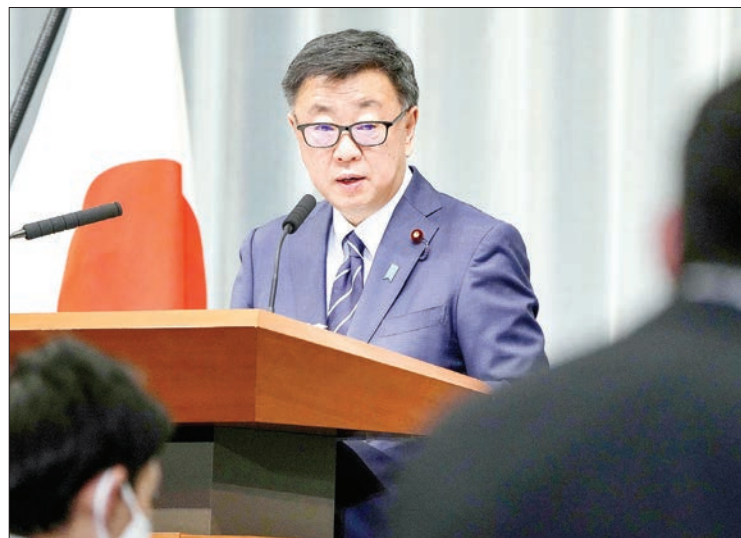
Chief Cabinet Secretary Hirokazu Matsuno holds a press conference in the prime minister's office in Tokyo on 23 Dec 2021.

"We have requested the US side to thoroughly implement the maximum measures to prevent the spread of infections," Chief Cabinet Secretary Hirokazu Matsuno said during a regular news conference. Matsuno said he has received an explanation that the