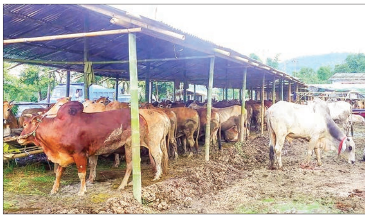
The Ministry of Commerce permitted live cattle export in late 2017 intending to eliminate the illegal export market, creating more opportunities for breeders and promoting their interests.

We are not trading the cattle through legal channels because those legitimate routes are currently closed. It has been closed