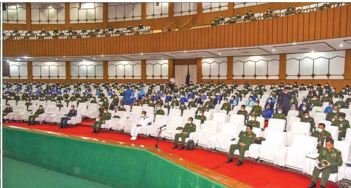
State Administration Council Chairman Commander-in-Chief of Defence Services Senior General Min Aung Hlaing addresses the meeting with commandants, senior officer instructors and lecturers of the Defence Services Medical Academy, the Defence Services Institute of Nursing and Paramedical Science and the Defence Services (Army) Officers Training School (Hmawby) in Mingaladon Station in Yangon yesterday.

AS a good follower will be an outstanding leader , systematic training must be given to trainees to become good followers. Trainers need to focus on giving training to trainees to have qualified ones rather than the quantities. As the military discipline is the backbone of the Tatmadaw, it is necessary to emphasize training for trainees to have good morals and discipline, said Chairman of the State Administration Council Commander-in-Chief of Defence Services Senior General Min Aung Hlaing in meeting with commandants, senior instructor officers, senior officer lecturers and teachers from the Defence Services Medical Academy, the Defence Services Institute of Nursing and Paramedical Science and the Defence Services (Army) Officers Training School (Hmawby) at the Convocation Hall of the DSMA in