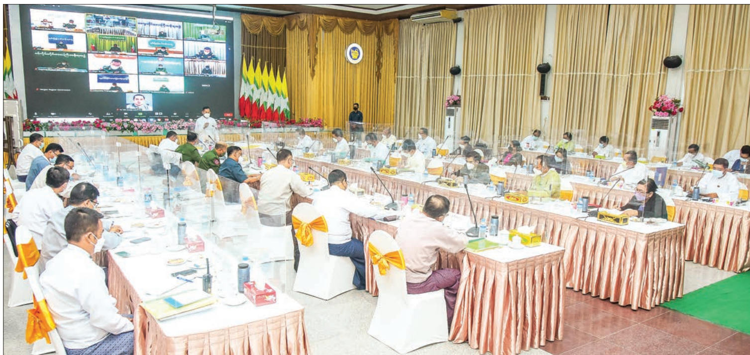
State Administration Council Vice-Chairman Deputy Prime Minister Vice-Senior General Soe Win addresses the 1/2021 meeting of the Illegal Trade Eradication Steering Committee in Nay Pyi Taw yesterday.

VICE-CHAIRMAN of the State Administration Council Deputy Prime Minister Vice-Senior General Soe Win, in his capacity as Chairman of the Illegal Trade Eradication Steering Committee, presided over the 1/2021 committee meeting yesterday.