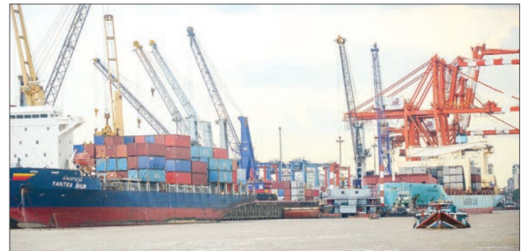
Overseas-going merchant vessels are seen loading and unloading at Yangon Port.

Meanwhile, the value of trade through the border this FY was estimated at $1.25 billion, which plunged drastically from $2.207 billion registered last FY.