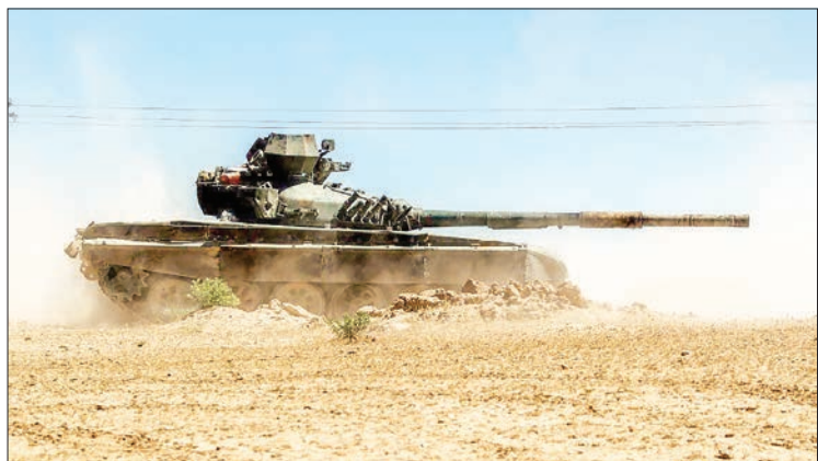
Iran will be mounting an anti-missile system on the turrets of T-72M tanks to protect them against attacks.

IRAN is to mount an anti-missile system on the turrets of T-72M tanks to protect them from attack, the Fars news