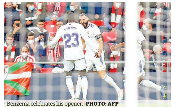
Benzema celebrates his opener.

Earlier Atletico's shaky defence of their La Liga crown took another big hit with injured duo Antoine Griezmann and Stefan Savic absent.—AFP ■