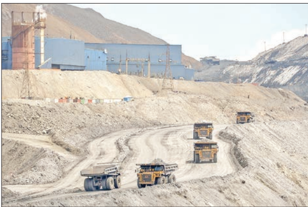
Kyrgyzstan's giant Kumtor gold mine accounted for 12.5 per cent of GDP in 2020.

Centerra has strongly denied the accusations and the two parties are currently locked in international arbitration pro-