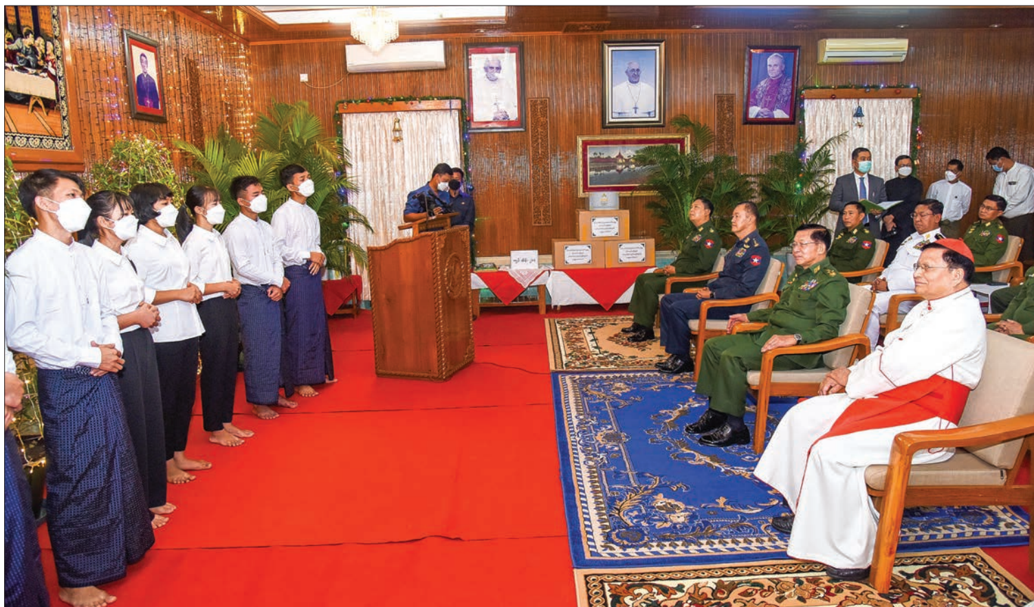
The Senior General views the collective Christmas wishes to mark the 2021 Christmas, yesterday.

The Tatmadaw actively participated in the national political safeguarding activities for ensuring the peace and prosperity of the State.