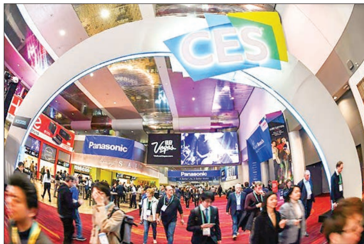
The Las Vegas-based Consumer Electronics Show (CES), seen here in 2020, plans to make its grand return to in-person attendance in January 2022, but the omicron variant threatens its viability.