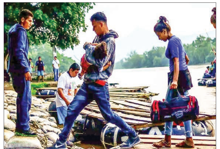
Representational image: Applications for refugee status in Mexico have roughly tripled this year compared with 2020, the government said Tuesday, in the face of a relentless influx of US-bound migrants.

Underscoring the dangers facing them, a horrific road accident on 9 December left 56 undocumented migrants dead after the truck transporting them overturned.—AFP ■