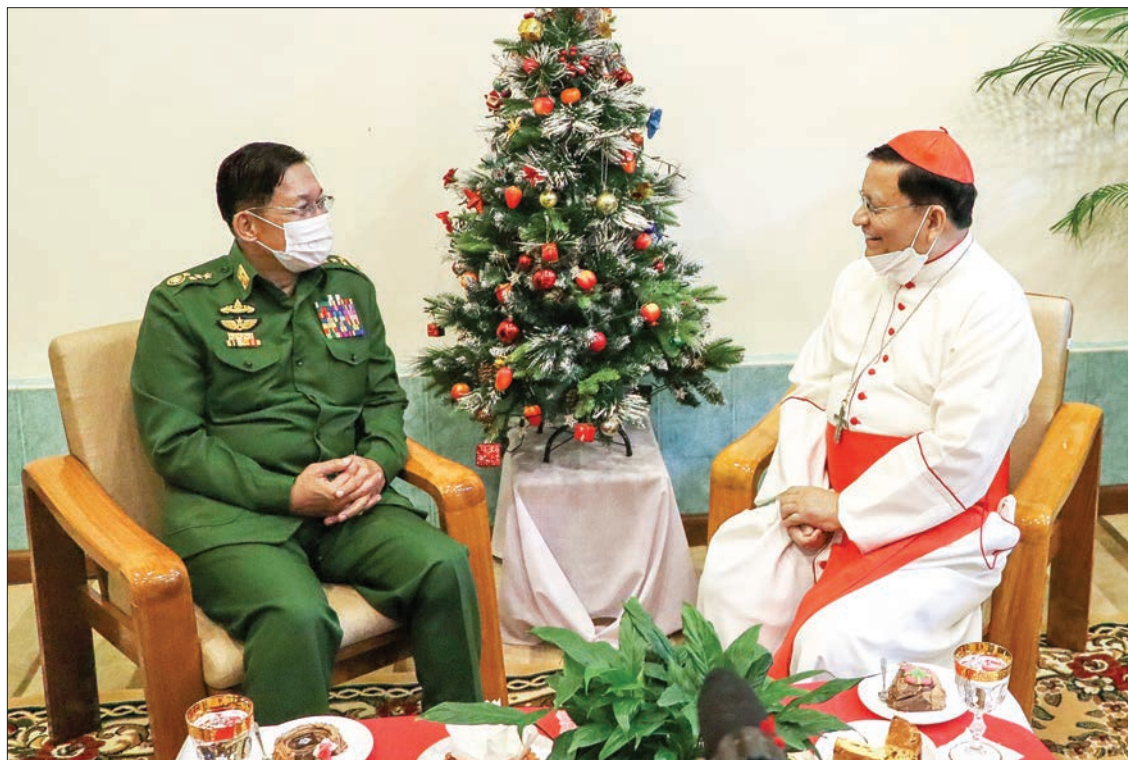
Senior General Min Aung Hlaing meets Cardinal Charles Bo yesterday.

Cardinal Charles Bo shared the Christmas good news and wishes with all. The Cardinal gave bless of Christmas for all Myanmar to enjoy happiness and prosperness on the auspicious Christmas occasion. The Cardinal prayed for all Myanmar people to have genuine peace and enjoy physical and mental wellbeing as well as peace, prosperity and happiness.