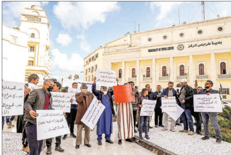
Libyan activists had gathered outside the Tripoli Municipality on 15 December 2021, to protest any possible postponement of national elections, but the delay happened on 22 December 2021, two days before the scheduled vote.

On Wednesday, the chairman of the parliamentary committee overseeing the vote wrote to the