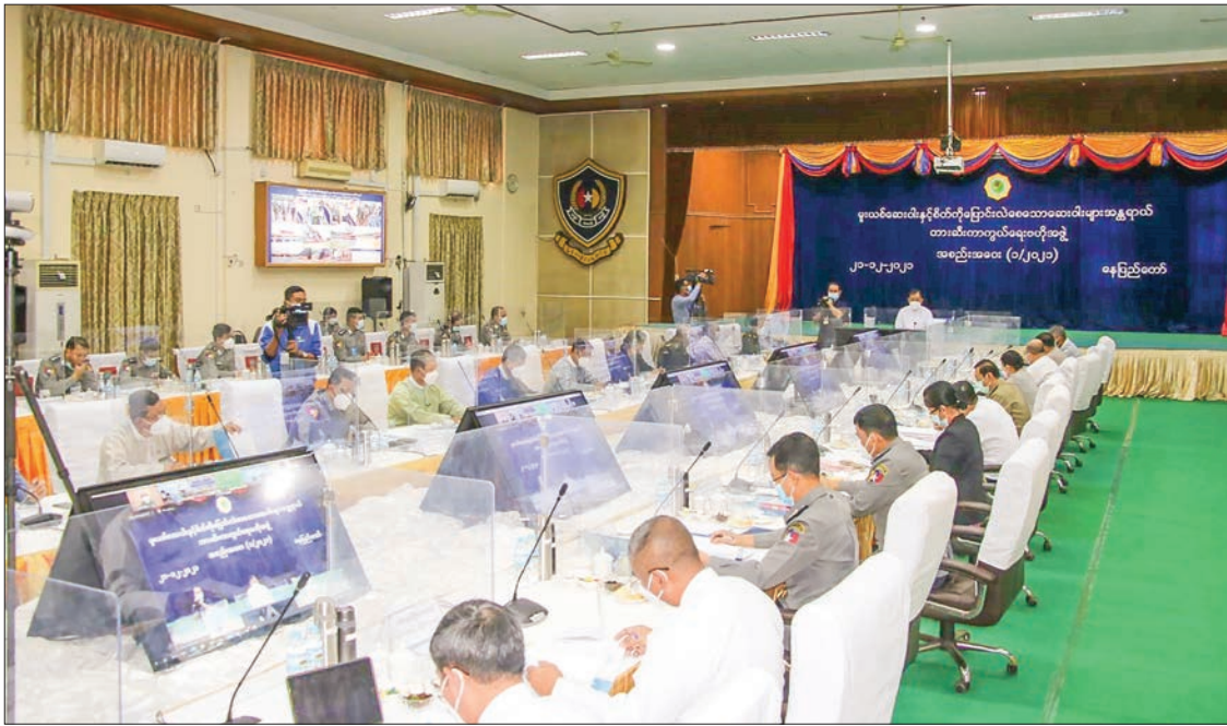
THE Central Committee on Drug Abuse Control held a meeting 1/2021 at the hall of Myanmar Police Force in Nay Pyi Taw on 21 December afternoon under the health guidelines of the COVID-19. Member of the State Administration Council Chairman

of CCDAC Union Minister for Home Affairs Lt-Gen Soe Htut said the new Narcotic Drug and Psychotropic Substances Law was enacted on 14 February 2018. Special operations on drug abuse control have so far been launched 34 times. Thanks to alternative development projects, the poppy sowed acreage of Myanmar has been declining yearly. A total of 33,100 hectares of poppy plantation in 2019, 29,500 hectares in 2020, 508 metric tons in 2019 and 405 metric tons in 2020.