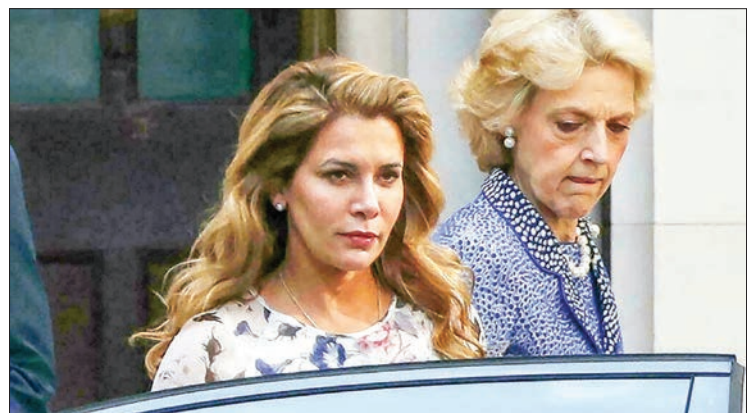
Princess Haya Bint Al Hussein, the former wife of Dubai’s Sheikh Mohammed bin Rashid Al-Maktoum, leaves the Royal Courts of Justice with her lawyer Baroness Fiona Shackleton in London on 31 July 2019.

THE ruler of Dubai was on Tuesday ordered to pay his former wife and children around £550 million ($730 million) in what is thought to be the highest divorce settlement set by an English court.