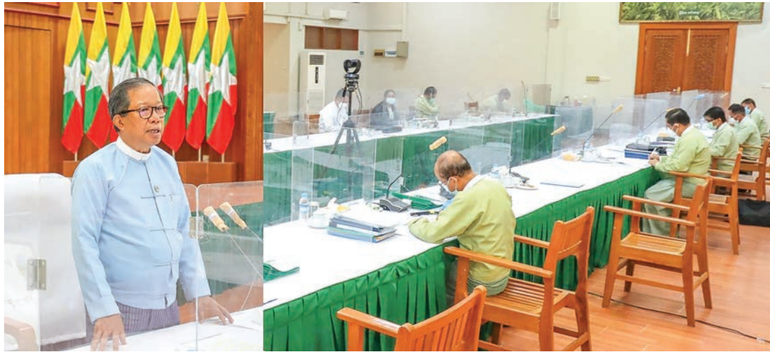
The MoALI Union Minister addresses the coordination meeting on the development of the fisheries sector.

Union Minister U Tin Htut Oo of the Ministry of Agriculture, Livestock and Irrigation addressed the meeting to conduct effective research for water resource management, strengthen public-private partnership in research methodology, carry out research on freshwater and salt-water fish and shrimp species which have high potentials to bolster hatch rate of the resident fish species, implement sustainable hatcheries, make efforts to establish Fisheries University for genetic technologies, extend vocation courses for fisheries in-