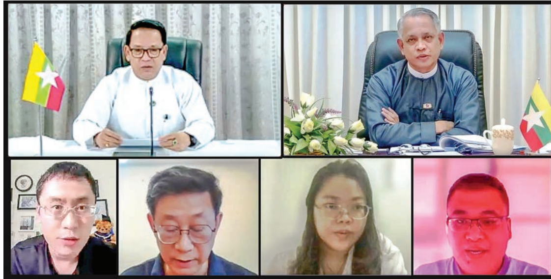
The Union Ministers are pictured in giving the online interview to the foreign media correspondents.

Union Minister U Maung Maung Ohn said the government and the people successfully overcame the challenges of the COVID-19 third wave. At present, basic education schools are being opened and a plan is underway to reopen universities