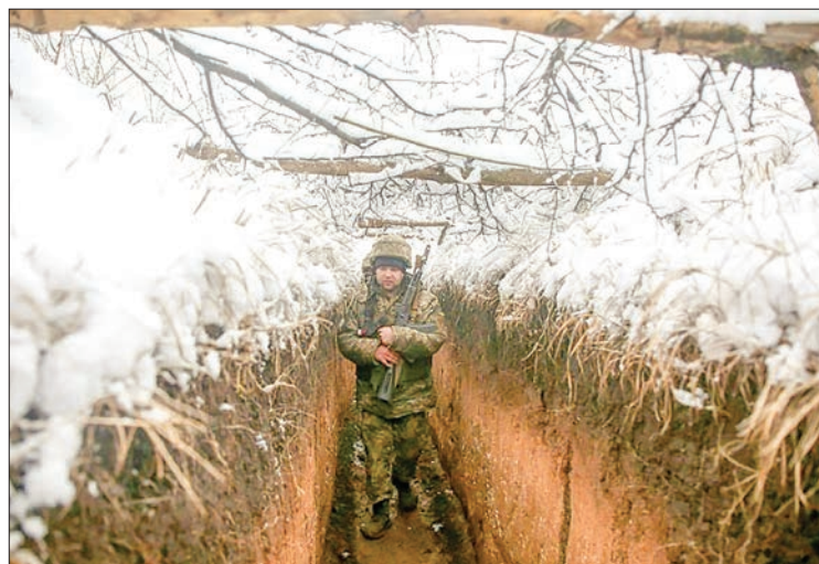
The fighting in eastern Ukraine has claimed more than 13,000 lives.

Russia denies plotting an invasion and has demanded legal guarantees over its security from the United States and NATO, demanding the alliance stop an eastward expansion.—AFP ■