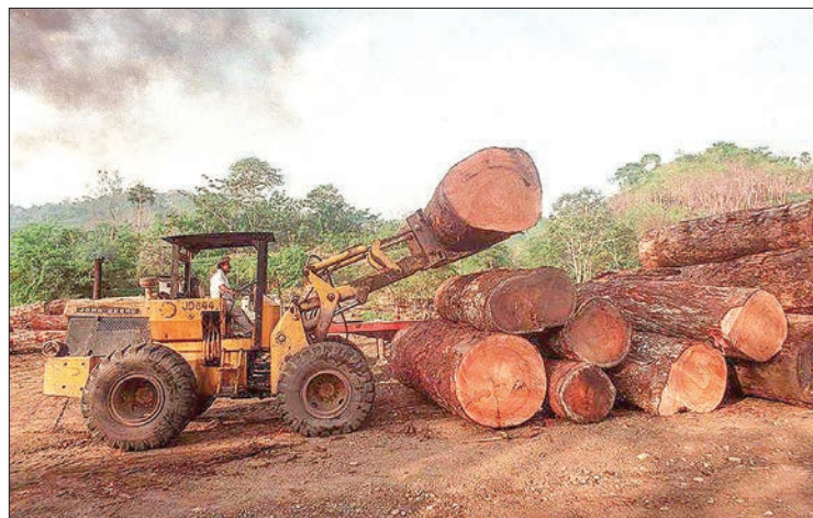
Canada is the world's largest exporter of softwood lumber while the United States is the largest market.

OTTAWA said Tuesday it will challenge US anti-dumping and countervailing duties on Canadian softwood lumber, saying they