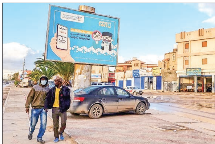
Workers in Libya’s capital Tripoli pass an electoral billboard reading in Arabic, ‘Register and vote before missing your chance’ — but a postponement of the ballot is widely expected.

On Tuesday, two leading presidential candidates from western Libya, ex-interior minister Fathi Bashagha and former deputy prime minister Ahmed Maiteeq, met in Benghazi with eastern strongman Khalifa Haftar, who is also seeking the presidency.—AFP ■