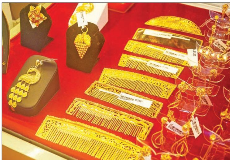
One of the jewellery outlets.

"Gold export is not going well. Only through the TT system, the trade will go smooth. As the transaction is permitted only with LC, the trade is completely halted. We have