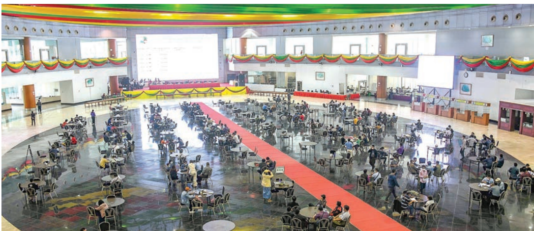
Gem merchants are seen purchasing pearl and jade via an open tender system.