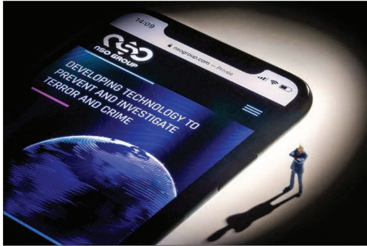
NSO has consistently denied any wrongdoing and defended use of its Pegasus software

"Using this type of programme to fight the opposition