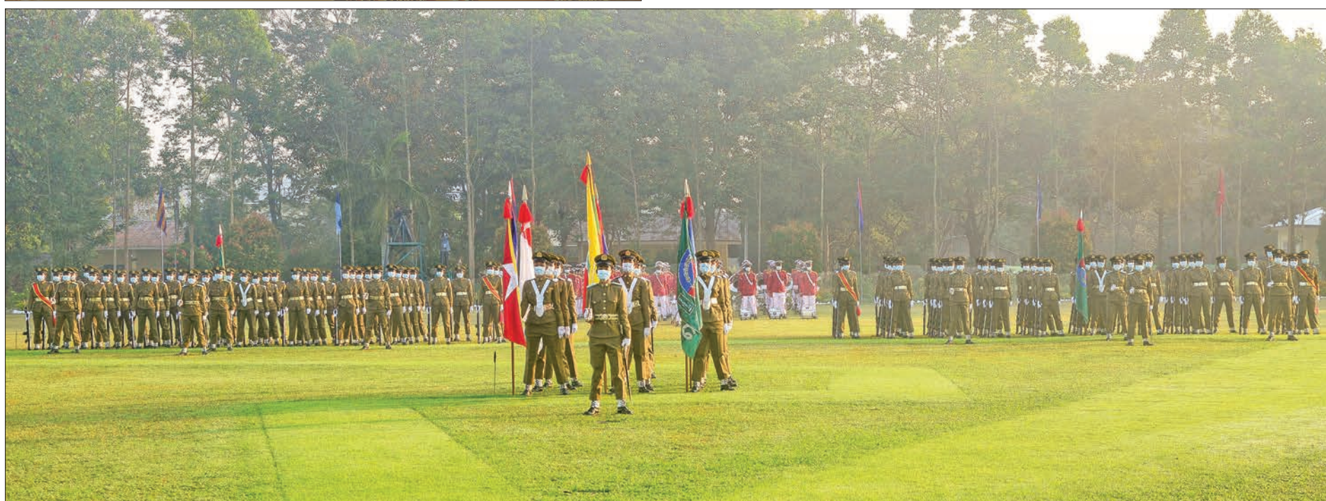
State Administration Council Chairman Commander-in-Chief of Defence Services Senior General Maha Thray Sithu Min Aung Hlaing addresses the cadet companies of the Eighth Intake of Graduate Female Cadet Course at the parade ground of the Defence Services (Army) Officers Training School (Hmawby) in Yangon on 22 December 2021.