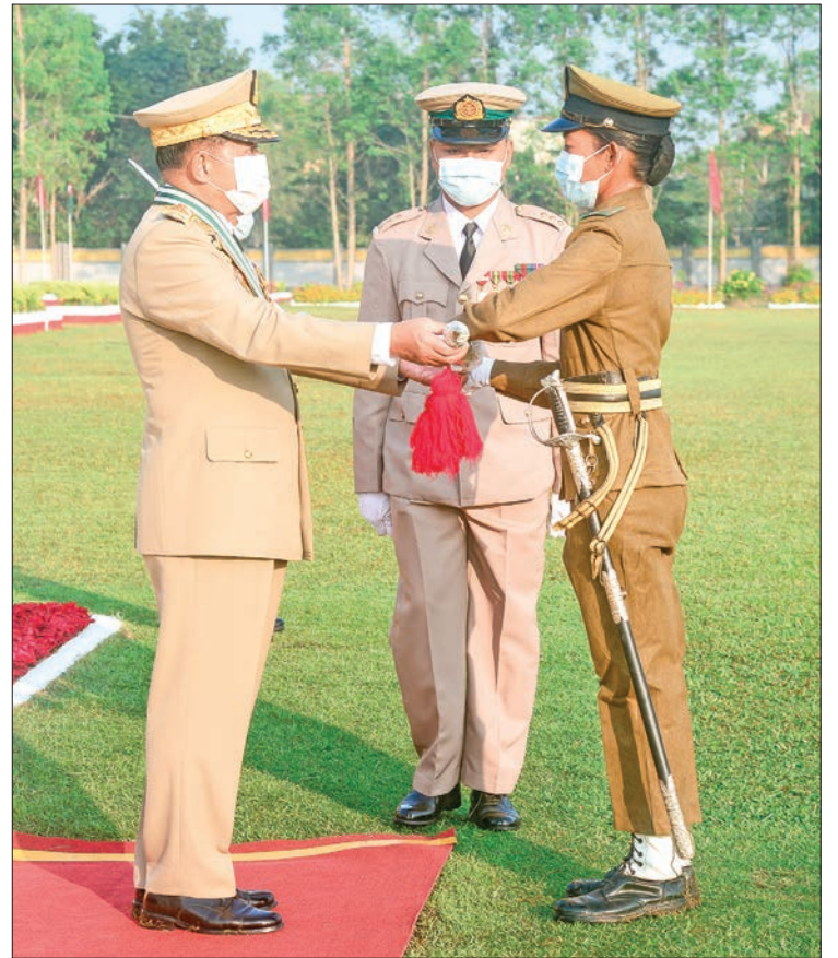
The Senior General presents the silver sword to Best Cadet awardee.

and lifestyles. As they can secure victory with hard work, they have to continuously apply the basic practice of hard work throughout their lives. As female military personnel are being turned out for the State and the Tatmadaw due to demand, they have to uplift their capacity to be reliable and good leaders with self-control. If they cannot control themselves, they will derail from their goals, and if they indulge themselves, they may face loss. Hence, they have to seek their ways of life with righteousness, hardworking and self-control for upgrading the prestige of the Tatmadaw. They do take pride in joining the Tatmadaw with the spirit of serving the State defence duty. They have to maintain the sound foundation given by the training school with a set aim for the improvement of their lives. — MNA