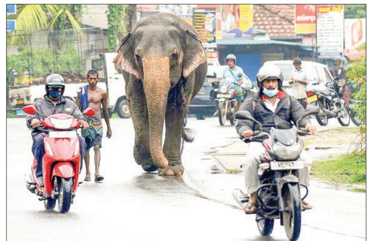
A mahout rides an elephant among the traffic down a street in Piliyandala, a suburb of Sri Lanka's capital, Colombo.

"Given the dollar crisis, we may have to introduce fuel rationing unless consumption is brought down." The CPC and Lanka IOC, the island's sole fuel retailers, hiked petrol prices more than 10 per cent to 210 rupees ($1.05) per litre, with smaller raises for kerosene and diesel. Traders in Sri Lanka have struggled to get dollars to finance imports of food, medicine and raw materials after the island's tourism-dependent economy was hammered by the pandemic.—AFP ■