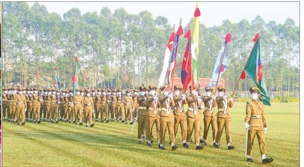
State Administration Council Chairman Commander-in-Chief of Defence Services Senior General Maha Thray Sithu Min Aung Hlaing returns the salute of the female cadet companies at the OTS parade ground (Hmawby) in Yangon yesterday.