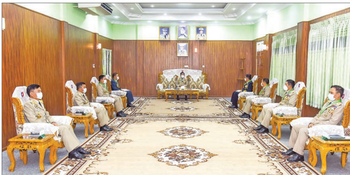
State Administration Council Chairman Commander-in-Chief of Defence Services Senior General Maha Thray Sithu Min Aung Hlaing receives the four best and excellent awardees at the parlour of the OTS headquarters yesterday.