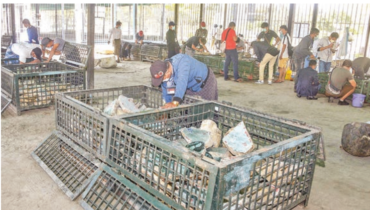
Gem traders are seen observing the jade lots at the emporium.

tal of 1,110 lots, including 330 pearl lots and 780 jade lots were put on sale under the open tender system. The local and foreign merchants openly observed pearl and jade lots displayed at the hall and a total of 952 lots, including 330 pearl lots and 622 jade lots, were sold out during the five-day emporium, according to the Myanmar Gems Emporium Central Committee.