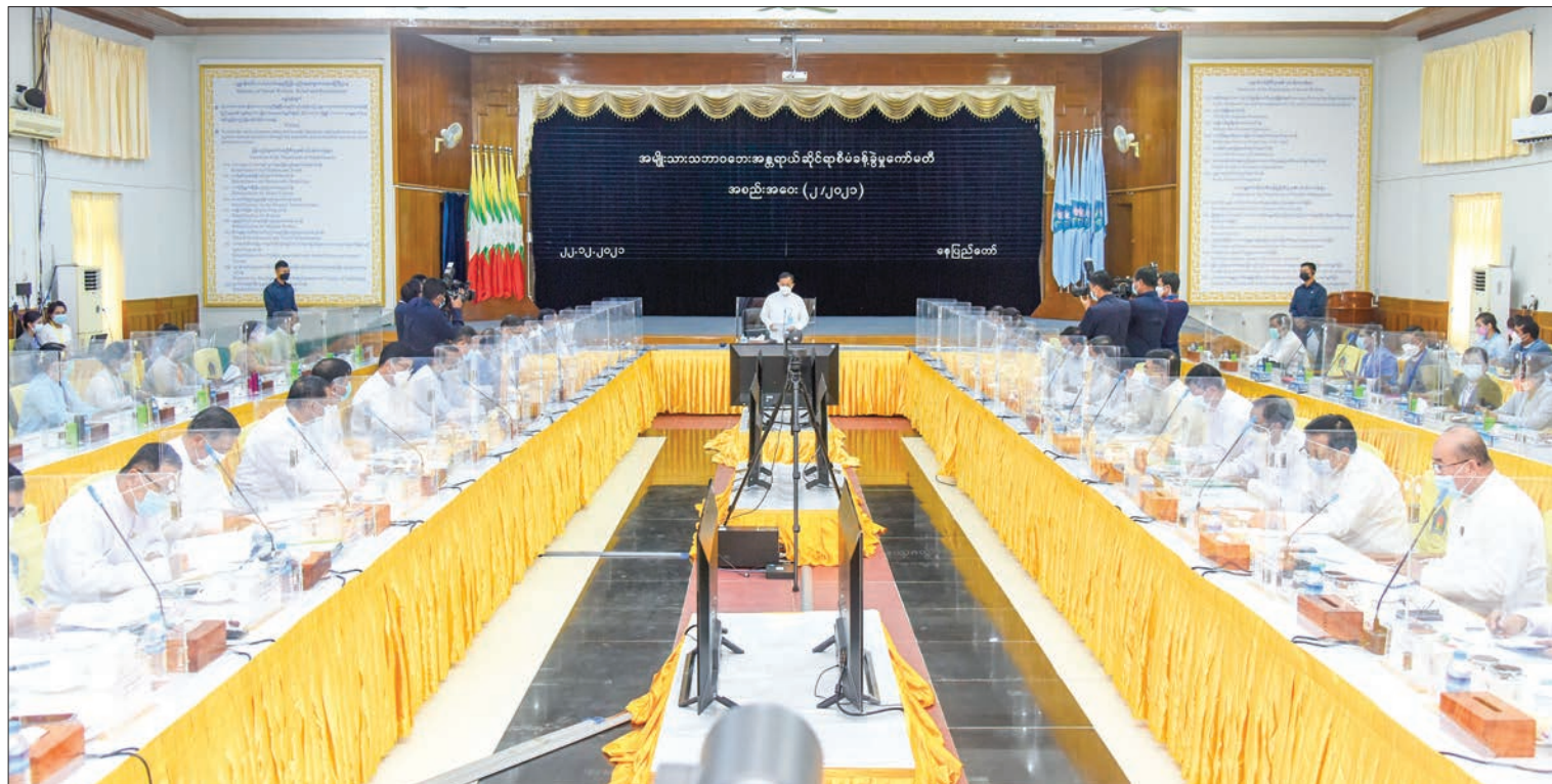
State Administration Council Vice-Chairman Deputy Prime Minister Vice-Senior General Soe Win addresses the meeting 2/2021 of the Natural Disaster Management Committee in Nay Pyi Taw on 22 December 2021.

In observing the latest period of breaking out the natural disasters in seasons, although the lesser number of natural disasters may happen in the cold season, the Department of Mete-