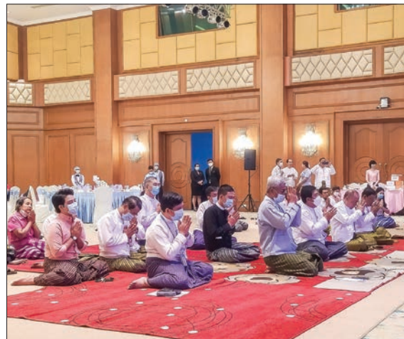
The 11 th ceremony for paying respect to the elderly music entertainers in progress.

“At today’s event, we were unable to invite all the senior musicians, but only 15 were in-