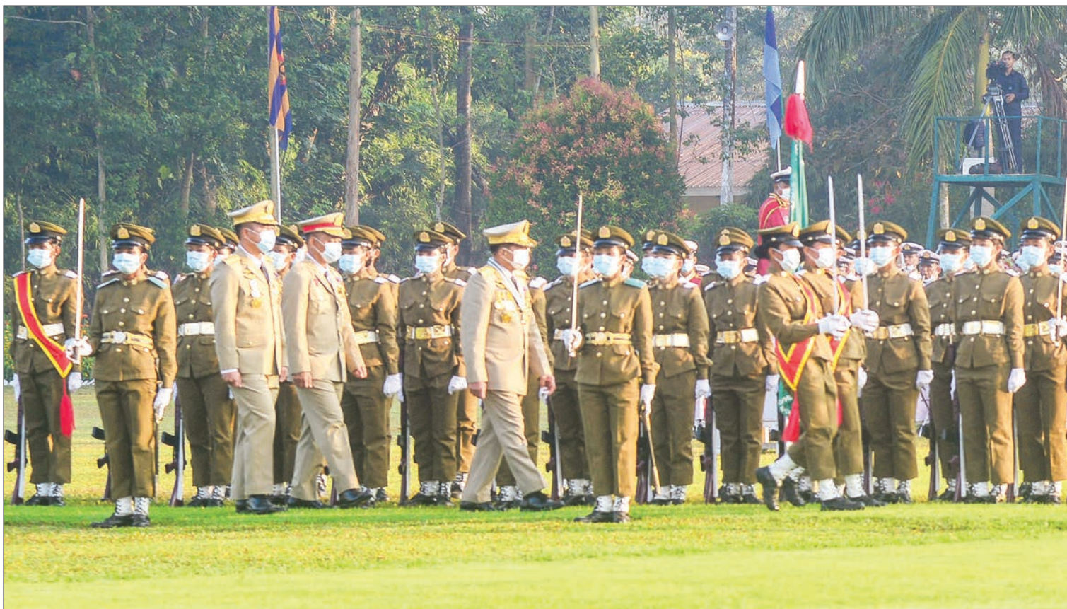
The Senior General inspects the female cadet companies at the OTS (Hmawby) parade ground in Yangon yesterday.

In utilizing human resources to develop the country, there is no gender discrimination. Every country tends to carry the National Interest in performing the development of human resources. As women make up over 52 per cent of the total population in the country, we have been promoting the role of women.