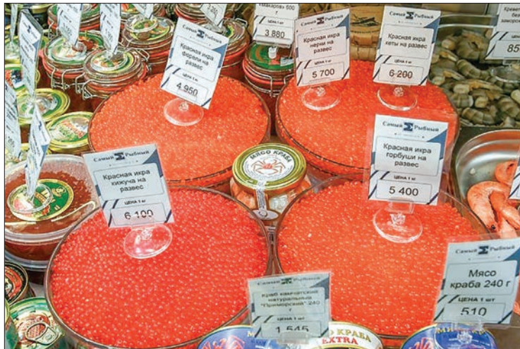
Red caviar, a favourite among Russians for New Year's Eve, is the most expensive it's been in more than 20 years.

"Everything is getting more expensive but wages aren't going