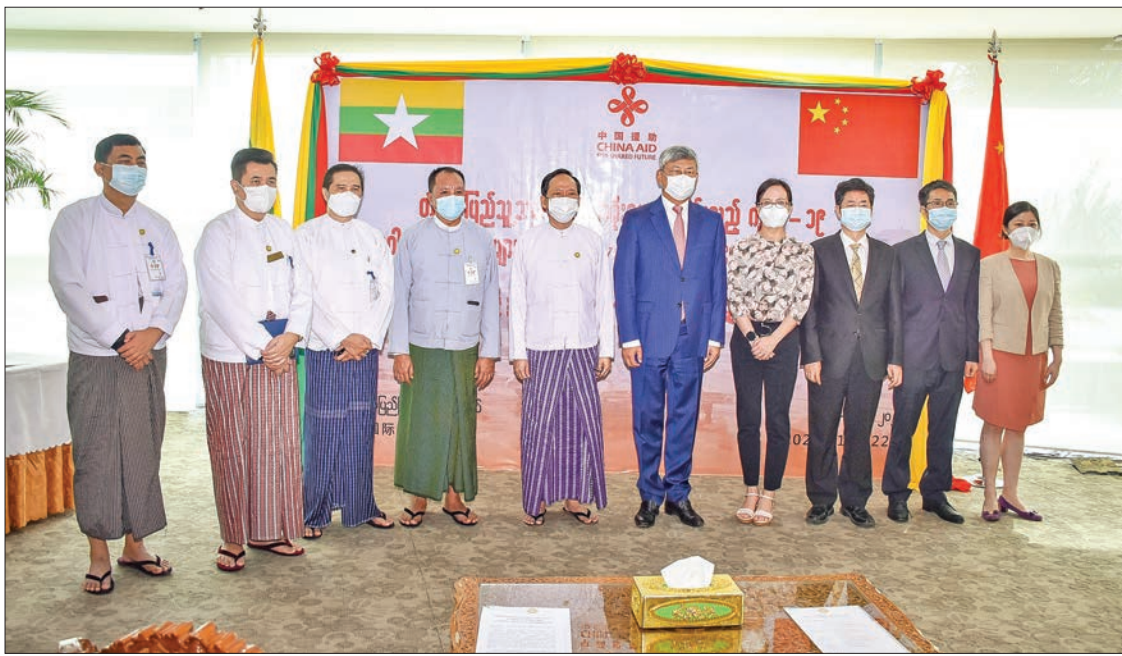
China-donated Sinovac vaccines handover event in progress.

ONE million doses of COVID-19 vaccines donated by the People's Republic of China to Myanmar arrived at Yangon International Airport by CZ 8083 Airlines at 10 am yesterday.