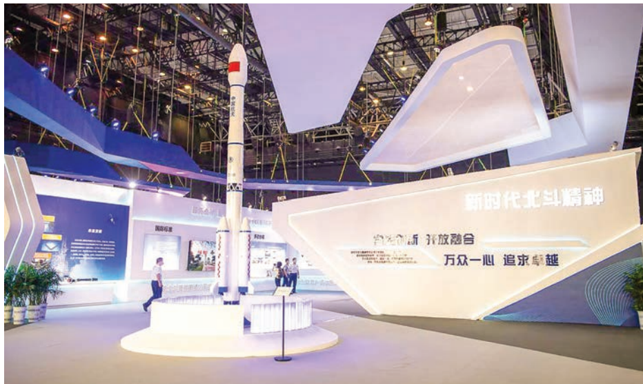
Photo taken on 16 September 2021 shows the first International Summit on BeiDou Navigation Satellite System (BDS) Applications, in Changsha, Central China's Hunan province.

China officially commissioned BDS on July 31, 2020, opening the new BDS-3 system to global users.