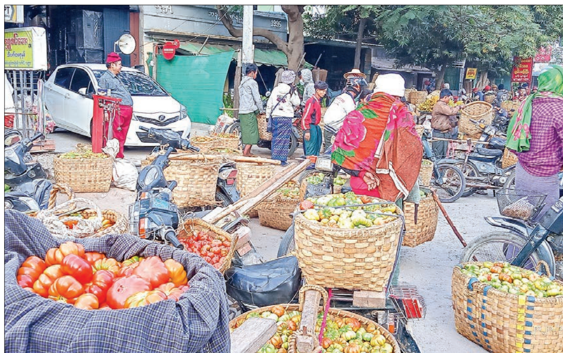
The price of tomatoes in the Monywa market fetched K1,800 per viss on 22 December, K2,300 per viss on 21 December and K2,500 per viss in these days.

ABOUT 20,000 visses of winter tomato are destined for Monywa market daily, it is learnt from the local traders on 22 December.