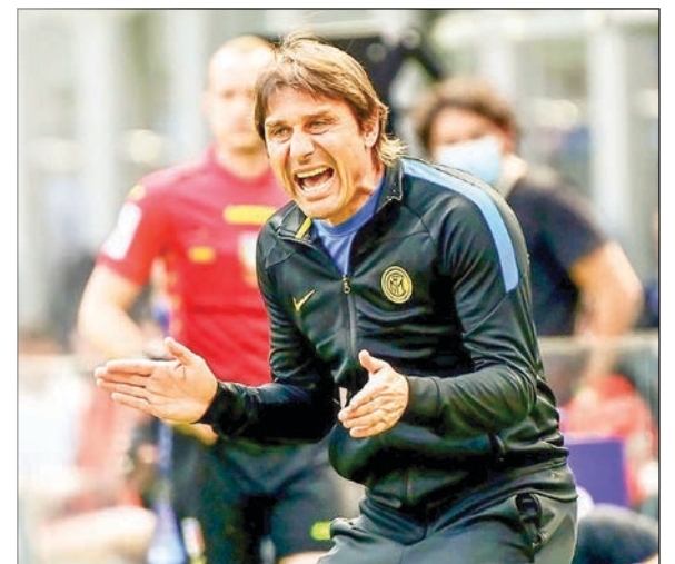
Tottenham manager Antonio Conte described UEFA's decision to throw his side out of the Europa Conference League as "incredible" and suggested Spurs will launch an appeal through the courts.

"I can't accept this. We are very, very dis-