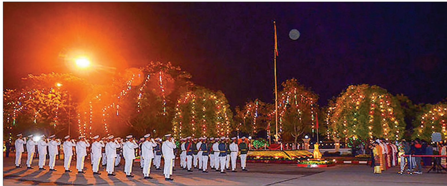
Guard of Honour and attendees salute the State Flag at the ceremony to celebrate the 70 th Independence Day in Nay Pyi Taw.