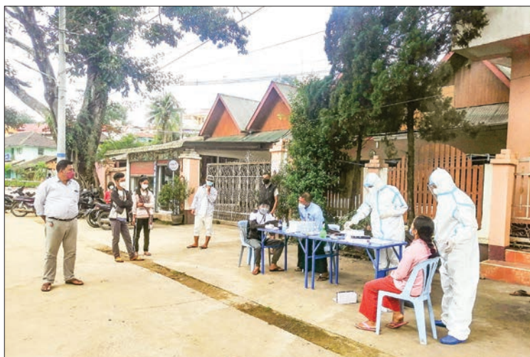
Kengtung locals receive free test for COVID-19. PHOTO: AUNG ZIN MYINT (IPRD)

On 19 December, a total of 377 people took COVID-19 tests at Naungnun joint inspection camp, general hospital and township health department of Kengtung Township and the results showed negative. — Aung Zin Myint (IPRD)/GNLM