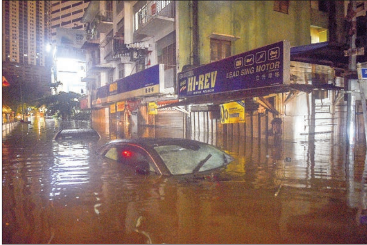
Cars are seen in flood water caused by heavy rain in Kuala Lumpur early on 19 December 2021.

MORE than 50,000 people have been forced from their homes in Malaysia and at least seven are dead after the country faced some of its worst floods for years, officials said Monday.