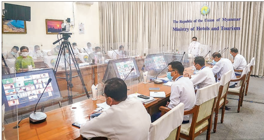
MoHT Union Minister Dr Htay Aung joins the virtual meeting of the Tourism Committee 2/2021 in Nay Pyi Taw yesterday.

At the meeting, the Union Minister, in his capacity as Chairman of the Working Committee, said that the COVID-19 epidemic was a genetic mutation and that it was spreading locally and in some neighbouring countries.