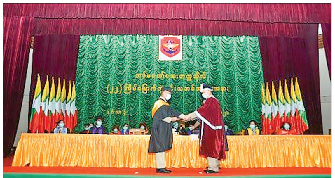
The 22 nd Convocation of the Defence Services Medical Academy in progress.

To date, the DSMA has conferred master degrees in medical science on 2,136 students, PhDs in Basic Medicine and Clinical Practice on 138 students, postgraduate diplomas in medical education on 207 students, and postgraduate diplomas in medicines on 189 students. At present, there are four trainee officers are attending the 26 th postgraduate course of medical science, 167 trainee officers in the 27 th , 232 trainee officers in the 28 th , and 304 trainee officers in the 29 th postgraduate course of medical science, total-