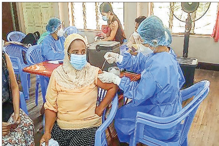
Locals gets inoculated against COVID-19 in Mon State.

State, 8,740 people from seven districts in Mandalay Region and 1,544 people from Toungoo and Htantabin townships, Bago Region respectively.