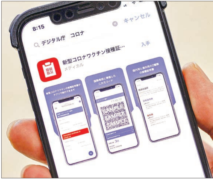
Photo taken on 20 December 2021, shows a smartphone screen displaying the Japanese government's COVID-19 vaccination certificate app.