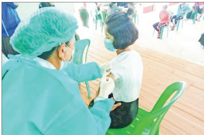
Inoculation is underway for students aged 12 and above in Bhamo.

The Ministry of Health also handed over the vaccination certificates of the students for being fully immunized against