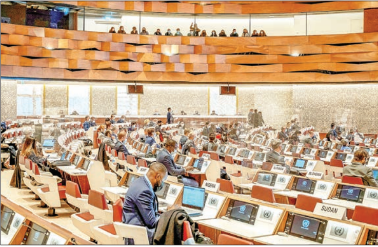
Delegates attend a meeting of the review conference of the Convention on Certain Conventional Weapons, (CCW) focussing on lethal autonomous weapons systems (killer robots) at the United Nations in Geneva on 17 December 2021.

JAPAN, the United States and other countries have blocked any advancement in UN talks toward legally binding measures to ban and regulate the development and use of lethal