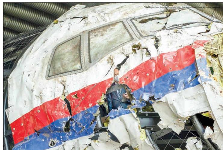
Trial judges and lawyers are seen inside as they view the reconstructed wreckage of Malaysia Airlines Flight MH17, at the Gilze-Rijen military airbase, southern Netherlands, on 26 May 2021.

DUTCH prosecutors will this week set out their sentencing demands for four men on trial in absentia over the downing of