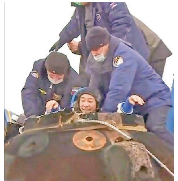
Screenshot image from Roscosmos Twitter account shows Japanese entrepreneur Yusaku Maezawa (C) upon returning to Earth aboard a Russian Soyuz spacecraft following his 12-day trip to the International Space Station.

Maezawa's trip to the ISS is believed to have cost around 10 billion yen ($88 million). While some people have criticized it as an "indulgence by a wealthy person," the trip likely expanded the public's interest in space. — Kyodo ■