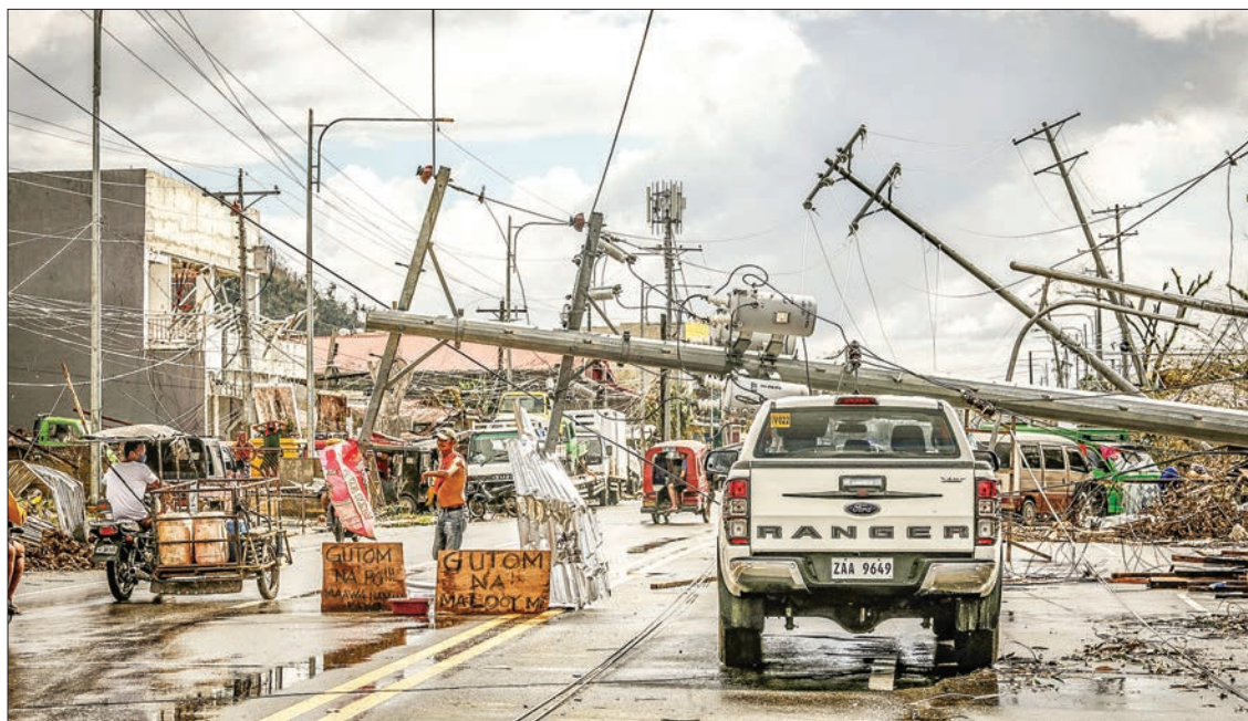
Fallen electric pylons block a road while a sign asking for food (L) is displayed along a road in Surigao City, Surigao del norte province, on 19 December 2021, days after super Typhoon Rai devastated the city.

THE death toll from the strongest typhoon to hit the Philippines this year surpassed 200 on Monday, as desperate survivors pleaded for urgent supplies of drinking water and food. The Philippine Red Cross reported “complete carnage” in coastal areas after Typhoon Rai left homes, hospitals and schools “ripped to shreds”.