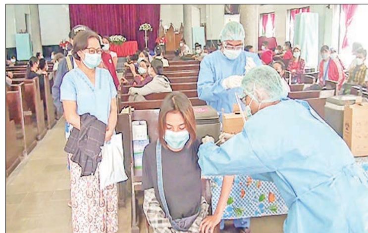
Vaccination programme is underway for residents in Bago Region.

Doctors and nurses from public hospitals, medical teams, relevant healthcare workers in collaboration with volunteers have already jabbed COVID-19 vaccines to 5,304 people from 12 townships in northern Shan State, 2,640 people from five townships in eastern Shan State, 9,765 people from 14 townships in Kayin and Mon states, 6,320 people from Myeik and Pulaw townships in Taninthayi Region, 4,272 people from three townships in Yangon Region, 26,500 people from 26 townships in Ayeyawady Region, 15,995 people from 10 townships in Rakhine