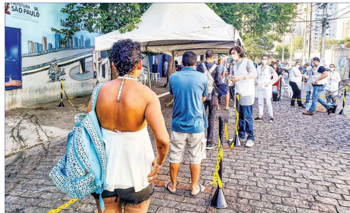
Médicins Sans Frontières (MSF) provides care to vulnerable people during COVID-19 response in Brazil.

Dr Etienne warned that vaccine inequity continues to divide the region, saying "if we don't