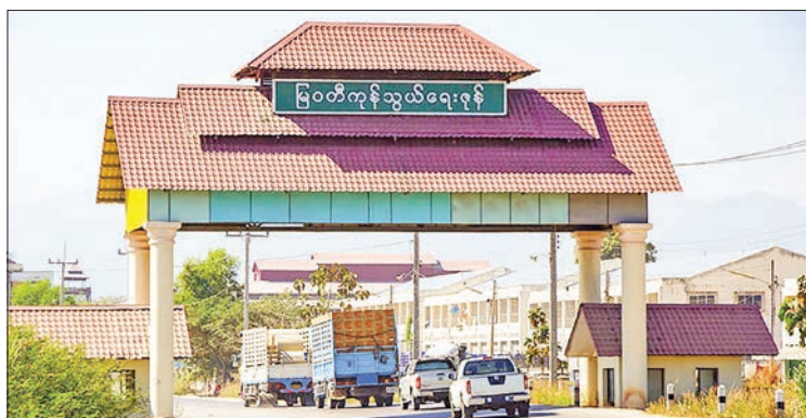
Thailand is Myanmar's second-largest trade partner and third-largest foreign investor.

Thailand is Myanmar's second-largest trade partner and third-largest foreign investor. — ACM/GNLM