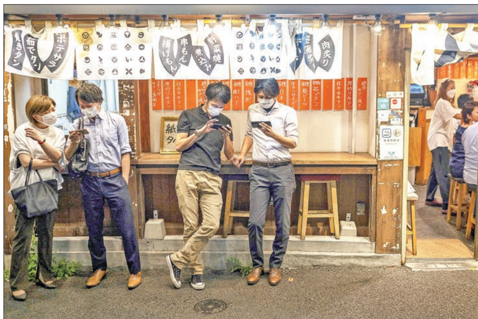
Evening diners wait for vacant seats at a restaurant in Tokyo on 24 September 2021.

The central bank, which has implemented a massive asset-buying programme to keep borrowing costs low for companies and consumers, owned 44.1 per cent of the outstanding debt