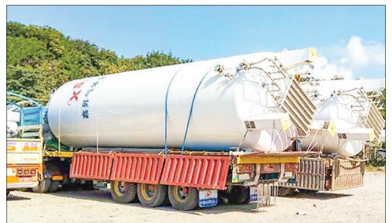
Boxers carrying liquid oxygen are ready to distribute them to states and regions.

Officials from the relevant departments are cooperating to facilitate and ex-