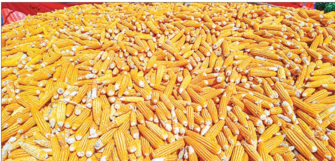
Of 2.3 million tonnes, the majority of corn was delivered to Thailand, whereas the remaining corn was conveyed to China, India and Viet Nam.

THE prices of corn remain unchanged these days, touching around K700 per viss (a viss equals 1.6 kilogrammes), market's data showed. The exchange rate is correlated with corn price stability. The fixed exchange rate is quite stable at present so the corn price is expected to remain stable, the traders said.