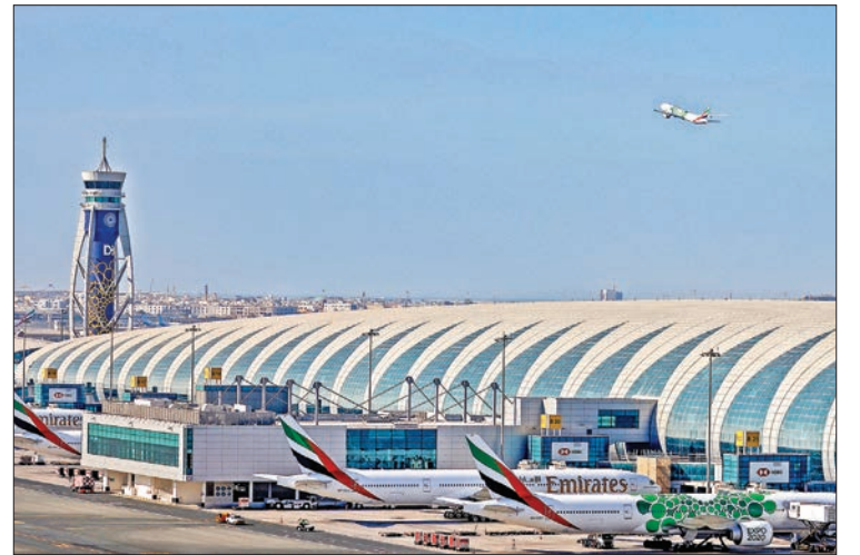
A picture shows a view of the Dubai International Airport on 1 February 2021.

But coronavirus infection numbers are again on the rise, with the UAE recording 285 cases on Sunday, compared to just 92 last week. — AFP ■