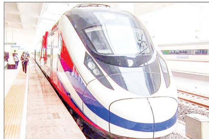
(FILES) This file frame grab from Lao National TV video footage taken on 16 October 2021 via AFPTV shows the Lane Xang bullet train at the Vientiane Railway Station in Vientiane.

Laos faces having to stump up vast sums of cash to pay for the rail line, which was set up as a Laos-China joint venture under Beijing’s vast, trillion-dollar Belt and Road infrastructure initiative (BRI). — AFP ■