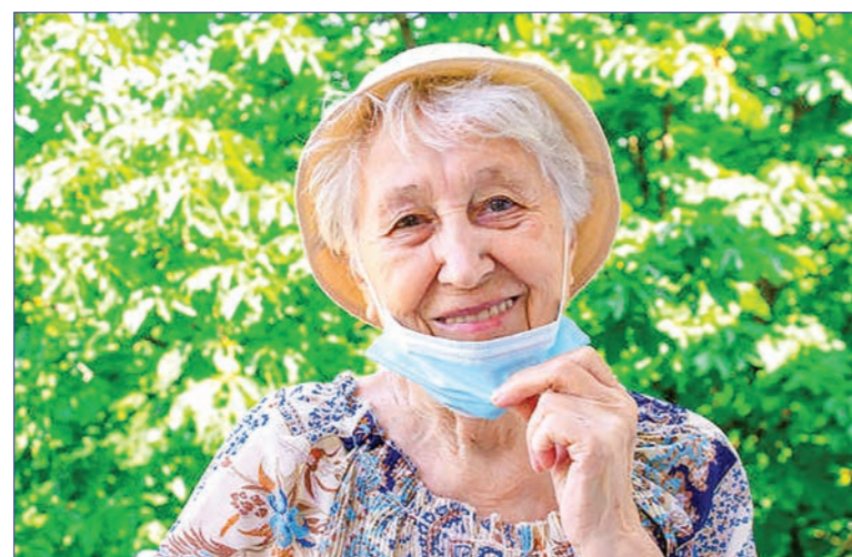
Representative image: Living with Parkinson's does not put you at a higher risk of contracting COVID-19, but it does make it harder for you to recover if you contract it.

It's unknown whether these interactions also occurred within neurons of the human brain, but if so, they could help explain the possible link between COVID-19 infection and Parkinson's disease, the researchers said.