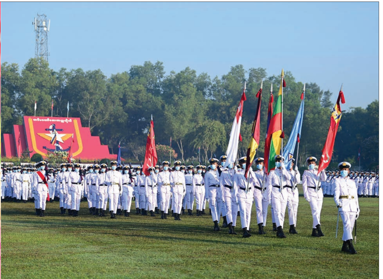
State Administration Council Chairman Commander-in-Chief of Defence Services Senior General Maha Thray Sithu Min Aung Hlaing receives the salute of the cadet companies at the parade ground of the Defence Services Medical Academy in Yangon on 20 December 2021.

I N order to raise the life span of our country, it is necessary to upgrade the level of living standards, literacy and economy, said Chairman of the State Administration Council Commander-in-Chief of Defence Services Senior General Maha