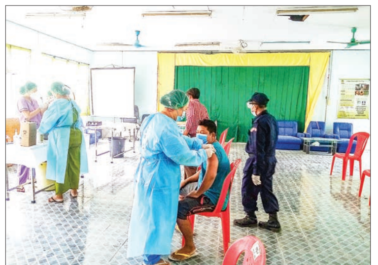
Singaing locals get jabbed against COVID-19.

ward/village administrators, and members of charity associations are carrying out health campaigns to raise awareness of COVID-19 variants, including Omicron as well as to prevent and contain the disease transmission. They are also working together to spray pesticides in wards and villages and also monitoring the compliance of the guidelines set by the Ministry of Health and local rules and regulations. — Nyo Nyo Win (IPRD)/GNLM