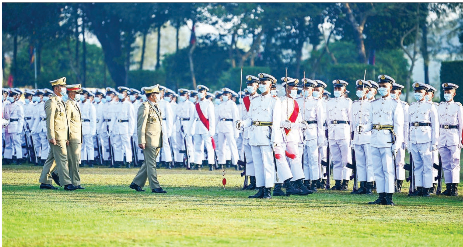
State Administration Council Chairman Commander-in-Chief of Defence Services Senior General Maha Thray Sithu Min Aung Hlaing inspects the cadet companies of the Defence Services Medical Academy in Yangon on 20 December 2021.

In his speech, the Senior General urged those outstanding cadets to practise self-control for themselves with conscience, mindfulness and content not to lose their goals. They have to repay the debt of gratitude to the Tatmadaw with the behaviour of a good soldier for obtaining knowledge and skills from the Tatmadaw and also repay the debt of gratitude to the parents who nurtured them from childhood to the life of university students. They also serve the Tatmadaw members and their families with healthcare services. They all have to successfully meet the goals with self-control and hardworking as well as sustain the prestige of nationality and that of a good soldier. — MNA