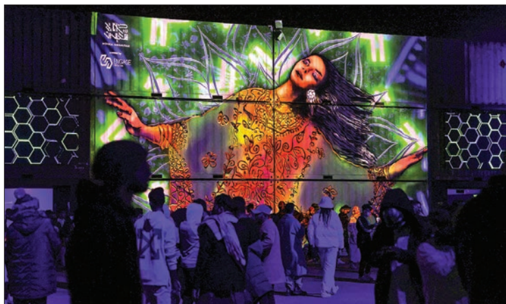
People attend the Soundstorm music festival, organized by MDLBEAST, in Banban on the outskirts of the Saudi capital Riyadh on 16 December 2021.

International entertainers and musicians — including superstar French DJ David Guetta — performed at the event despite boycott calls over Saudi Arabia's human rights record.