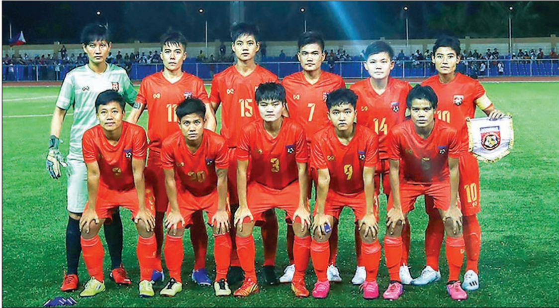
Myanmar women's national football team is currently at the third standing in ASEAN.