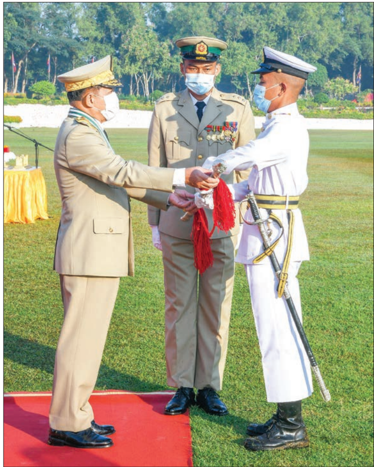
The Senior General presents the silver sword to Best Cadet awardee.