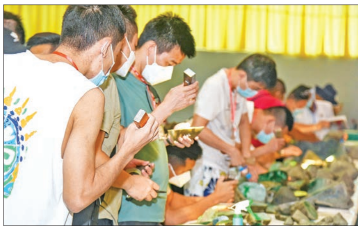
Gem traders are seen evaluating the jade lots.