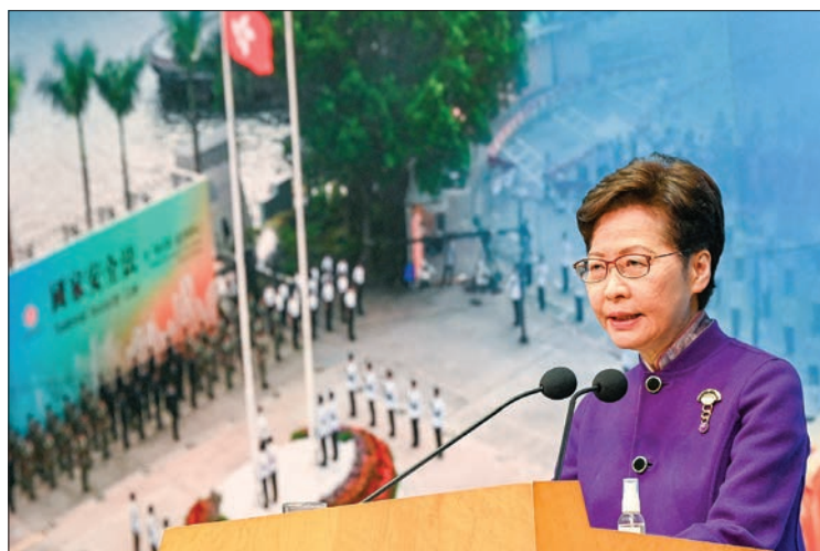
Hong Kong Chief Executive Carrie Lam speaks during a press conference at the government headquarters in Hong Kong on 20 December 2021.

Hong Kong’s chief executive Carrie Lam defended the new system and played down the turnout. “Hong Kong is now back on