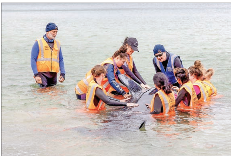
This photo taken on 11 December 2021 shows a group of volunteers from New Zealand whale rescue charity Project Jonah being taught how to save a stranded whale by a group instructor, at Scorching Bay in Wellington. Real strandings are all-too common in New Zealand, which has one of the highest rates in the world, with about 300 animals beaching themselves annually.

A two-tonne rubber whale can take on a life of its own in the frigid shallows of a windswept New Zealand beach, particularly when a bedraggled group of would-be rescuers is trying to wrestle it into a harness.