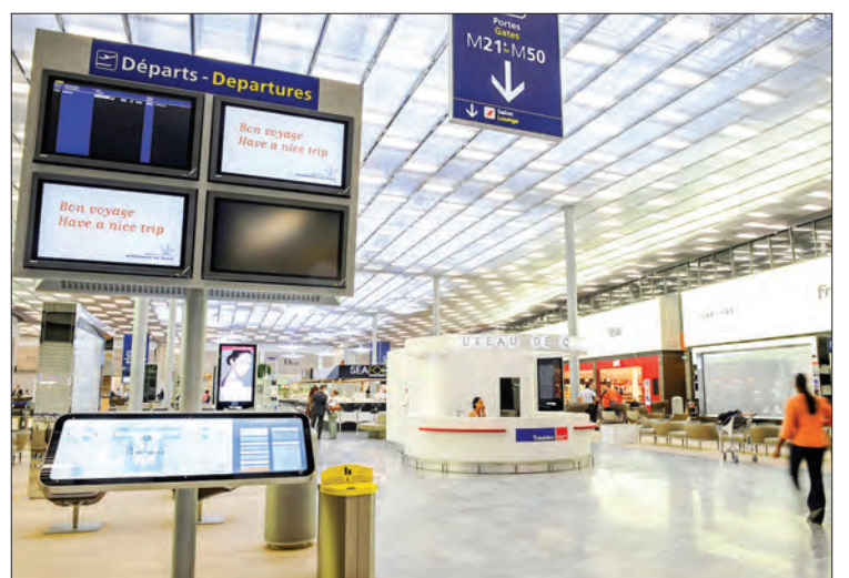
Paris Charles de Gaulle Airport also known as Roissy Airport, is the largest international airport in France and one of the busiest airports in Europe. PHOTO: AFP

“People (coming back) will have to register on an app and will have to self-isolate in a place of their choosing for seven days—controlled by the security forces—but this can be shortened to 48 hours if a negative test is carried out in France,” he said.—AFP ■