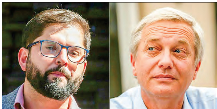
Gabriel Boric (L) and Jose Antonio Kast face off in Chile's runoff election.

A Chile in the throes of profound change will choose a president Sunday from polar opposite candidates vying for votes among an apathetic and alienated elec-