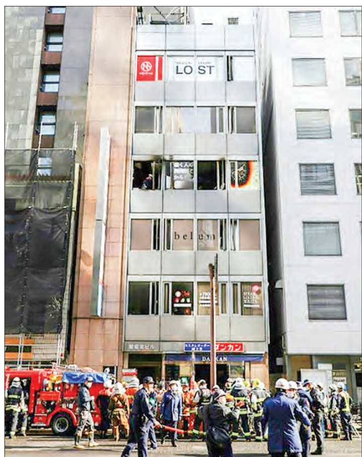
The blaze, in a busy business area near Kitashinchi train station in the city in western Japan, had been put out after half an hour.

“She leaned out (from a window) and was saying things like ‘Please help’... She seemed very weak. Maybe she inhaled lots of smoke,” the woman said.—AFP ■