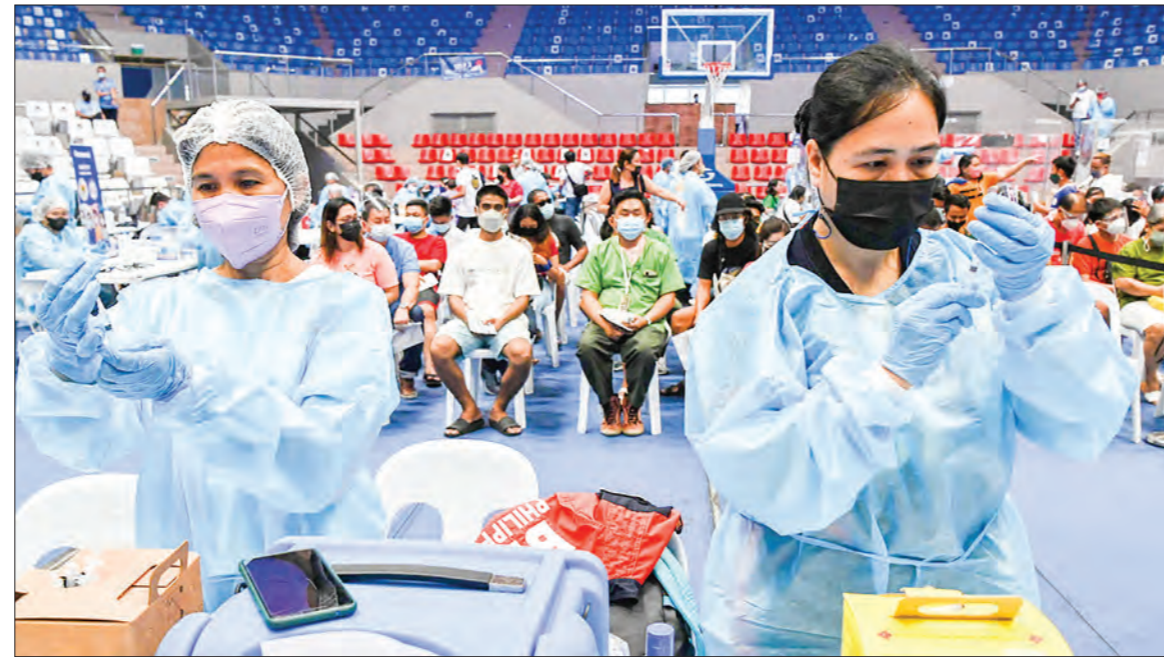
Further research is needed to better understand Omicron's potential to escape protection against immunity induced by vaccines, WHO said.

In the minutes and hours after the virus first comes calling, signalling proteins send out alarms to