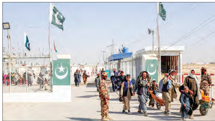
Thousands of Afghans trying to escape the misery at home have flocked to their country's southern border with Pakistan.

Pakistan, which is already hosting about 3 million Afghan refugees, half of them unregistered, initially refused to allow