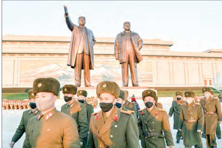
Military personnel visit Mansu Hill in Pyongyang on 17 December 2021, the 10th anniversary of the death of former North Korean leader Kim Jong Il.