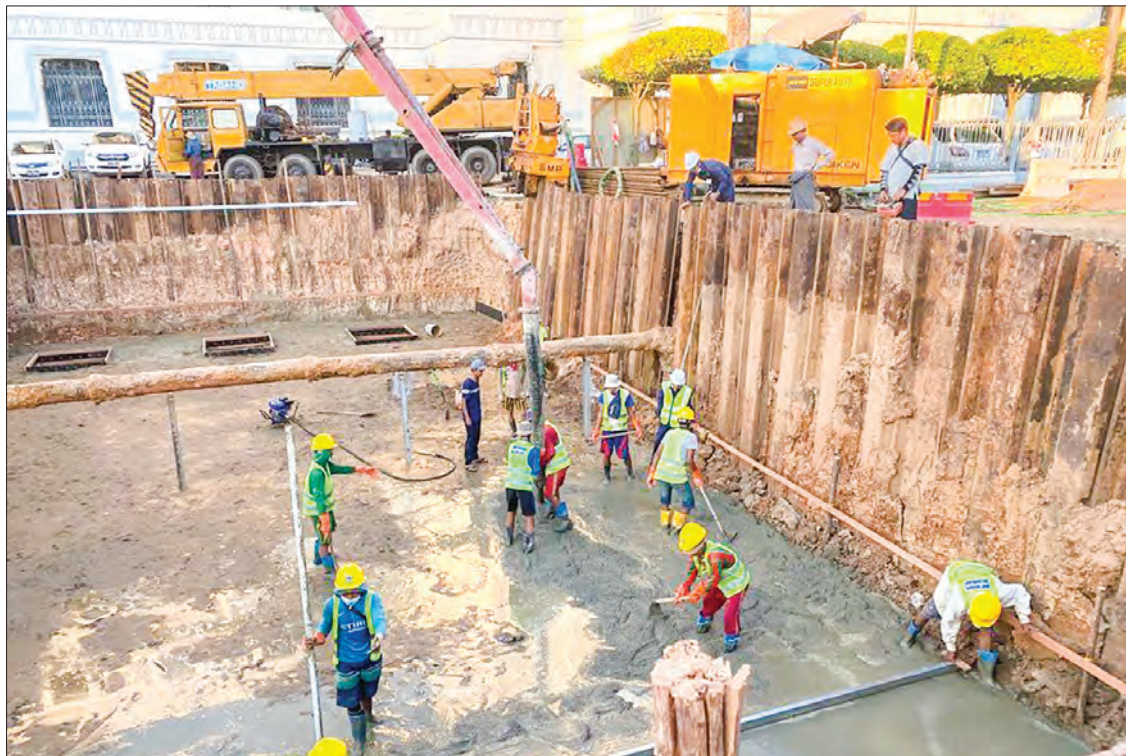
The reinforced concrete ground tank in the compound of Yangon City Hall can store up to 100,000 gallons of water.

The sanitation and drainage system will improve after the project. This project commenced on 21 November 2021 and it is slated to finish in the second week of January 2022, YCDC stated. — Pwint Thitsar/GNLM