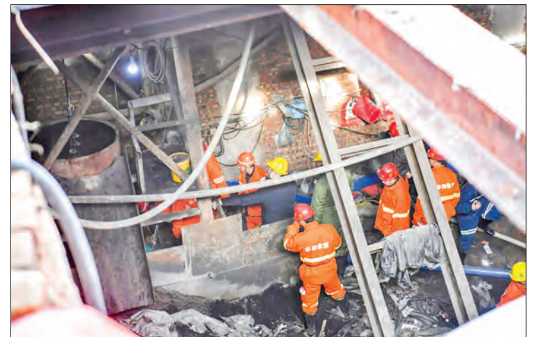
In this photo released by China’s Xinhua News Agency, rescuers work at a coal mine at Duxigou Village of Xixinzhuang Township in Xiaoyi City in northern China’s Shanxi Province, Thursday, 16 December 2021. More than 20 people were trapped after a coal mine was flooded in the city of Xiaoyi, north China’s Shanxi province, as a result of illegal mining, local authorities said Thursday.

Seven suspects have been detained over the accident, and police said they were searching