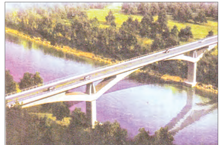
An aerial view of No 2 Kunlong Bridge.

THE No 2 Kunlong Bridge is under construction marking China-Myanmar friendship over Thanlwin River along Lashio-Hsenwi-Kunlong-Chinshwehaw-China border trade road near Kunlong Township in Shan State (North) by China Yunnan Sunny Road Bridge Co., Ltd.