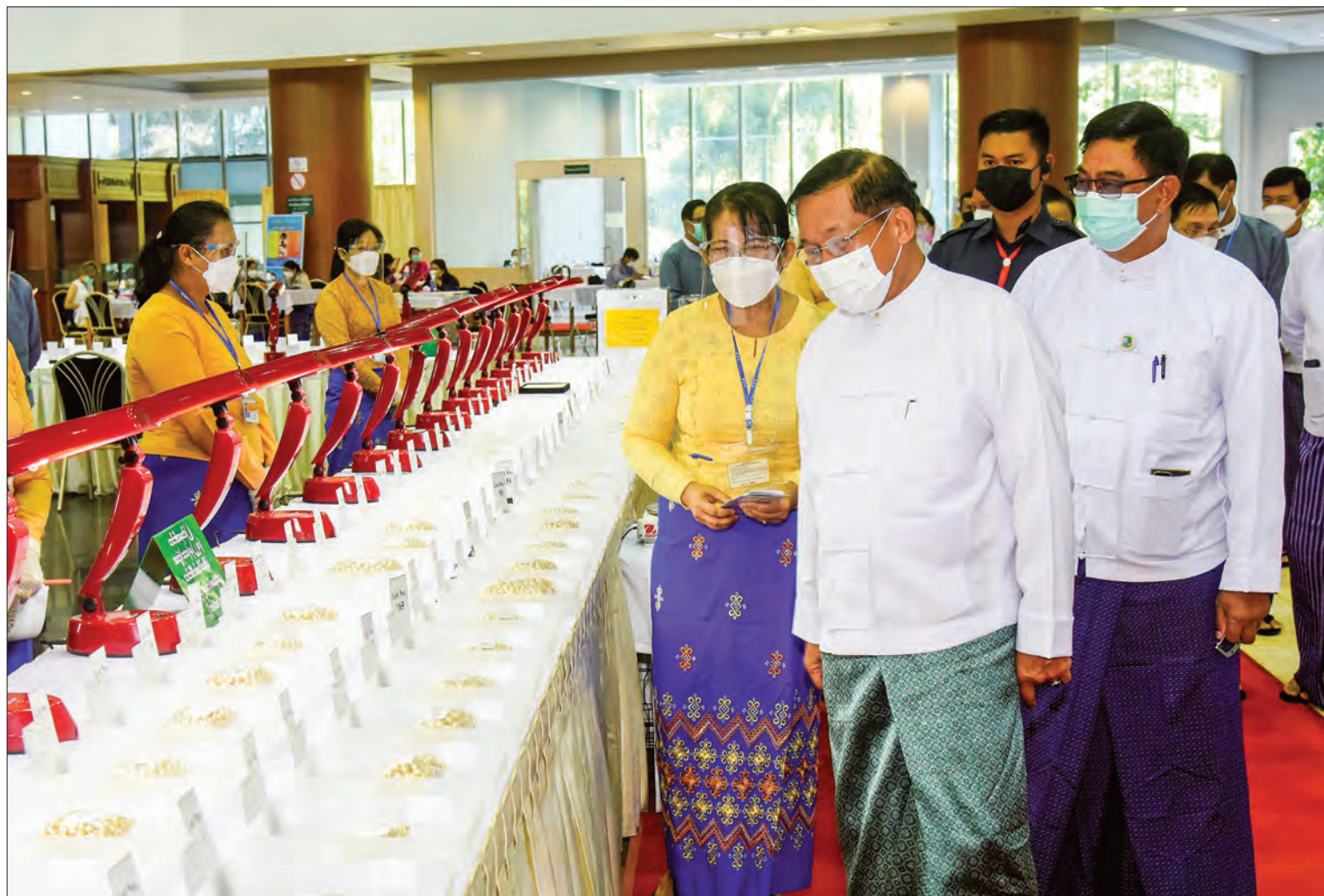
State Administration Council Chairman Prime Minister Senior General Min Aung Hlaing looks into the pearl display at the Mini Gems Emporium 2021 at Mani Yadana Jade Hall in Nay Pyi Taw on 17 December 2021.

The Senior General and party viewed around the lots of pearl and jade displayed at the emporium.