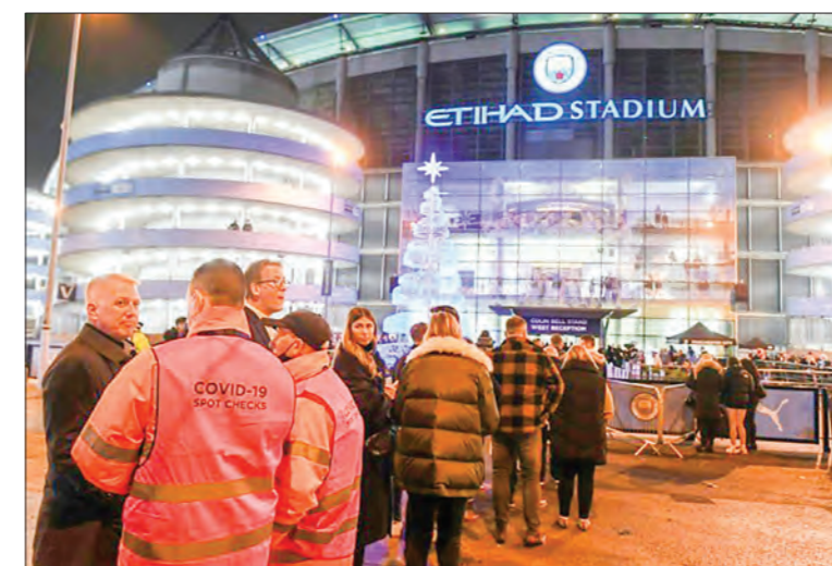
Scientists have predicted the true figure of those already infected with Omicron in Britain could be as high as 200,000 a day.

25 December due to concerns that children, among whom infection rates are the highest, could pass it on to older relatives.