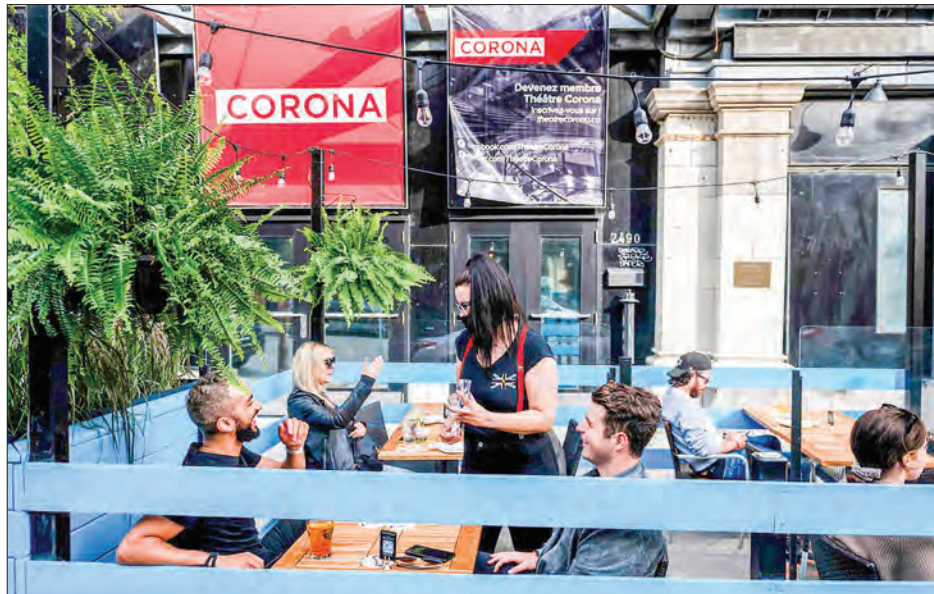
Quebec cuts capacity limits in stores, bars, restaurants to 50% as of Monday.

The Quebec vaccination campaign will be sped up, reducing the interval between the second dose and the booster from six months to three. But boosters are still not yet available to all age groups, as was announced Wednesday in neighbouring Ontario, the most populous province in Canada.—AFP ■