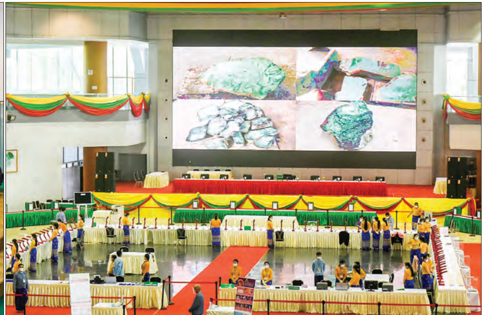
State Administration Council Chairman Prime Minister Senior General Min Aung Hlaing viewed the documentary video clip on preparation to hold the Mini Gems Emporium yesterday.