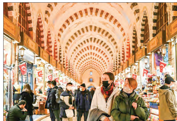
The lira has lost more than half its value since the start of the year as President Recep Tayyip Erdogan pushes for lower interest rates.

policymakers bow to Erdogan's wishes to bring down borrowing costs despite soaring inflation. This unorthodox approach has wiped out the value of people's saving and thrown swaths of Turkish society below the official poverty line.—AFP ■