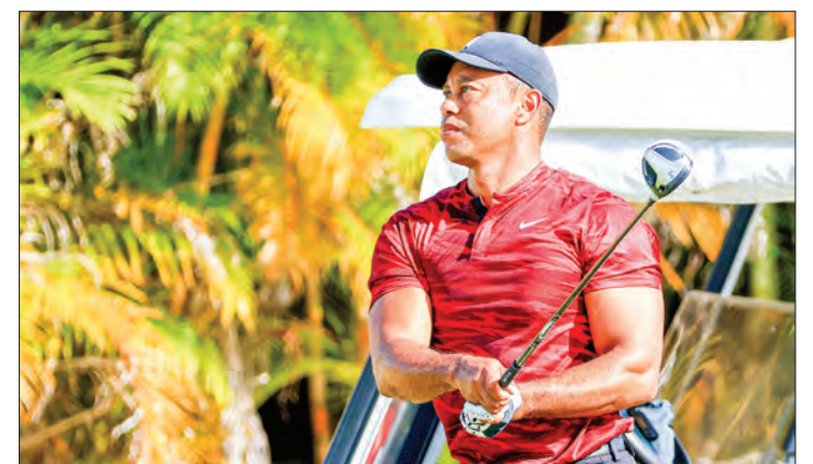
Tiger Woods hits balls on the range during the final round of the Hero World Challenge at Albany Golf Course on 5 December 2021.