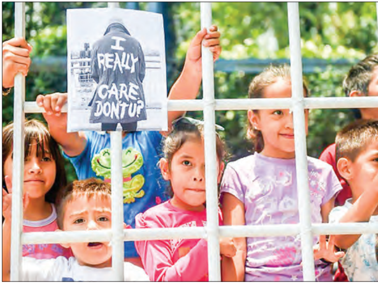
Children take part in a protest against US immigration policies outside the US embassy in Mexico City on 26 June 2018.