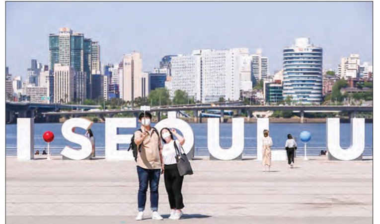
People take selfies at Yeouido Hangang Park in Seoul, South Korea, 6 May 2020.

The country reported 7,622 new cases on Wednesday, with most centering on Seoul and the neighboring Gyeonggi Province, while the number of critically ill patients marked a record-high 989, according to health authorities. As of Thursday, the rate of South Koreans who are fully vaccinated reached 81.5 percent and the percentage of those who received booster shots stands at 17.3.—Kyodo ■