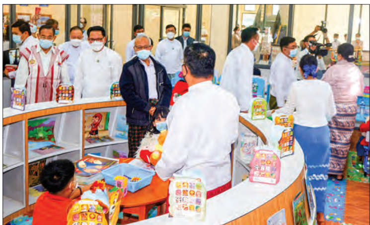
The SAC members and Union ministers look around the Community Centre.

They also visited Relic Hair, Relic Tooth, Relic Rib pagodas and inspected the Shwewady Rakhine sarongs and bamboo tablecloths manufacturing industry of Thandwe Township. — MNA