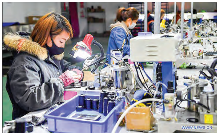
Workers manufacture speaker components at a factory in Yaozhou District of Tongchuan City, northwest China's Shaanxi Province, 12 March 2020.

But the pace of expansion was the slowest since the economy contracted in 1976, the final year of the 10-year-long Cultural