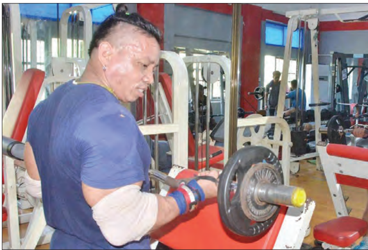
Bodybuilders are taking training ahead of the XXXI SEA Games to be held in Viet Nam in May 2022.

AS XXXI Southeast Asian Games to be held in Viet Nam from 12 to 23 May 2022 is drawing to a close, Myanmar athletes and bodybuilders are training hard intensively.