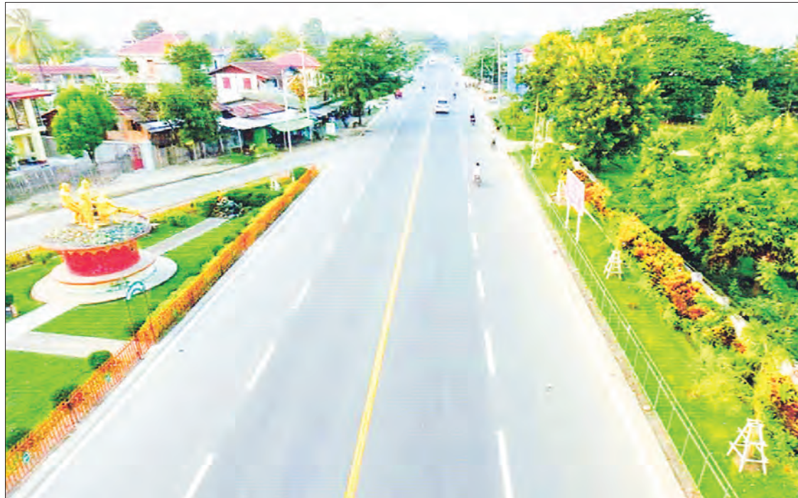
Kachin State Highways Department under the Ministry of Construction upgraded the earthen road into AC road for 56 routes with 2,080 miles and five furlongs in length to improve the transport system of the state.

The government also invited E.O.I to upgrade 53 miles and three furlongs long Moegaung (Parhote)-Kamine-Phakant