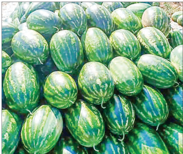
The Kyinsankyawt border post between Myanmar and China, which was earlier suspended for the COVID-19 pandemic, has been reopened starting from 26 November on a trial run.

The Kyinsankyawt border post between Myanmar and China, which was earlier suspended for the COVID-19 pandemic, has been reopened starting from 26 November on a trial run.