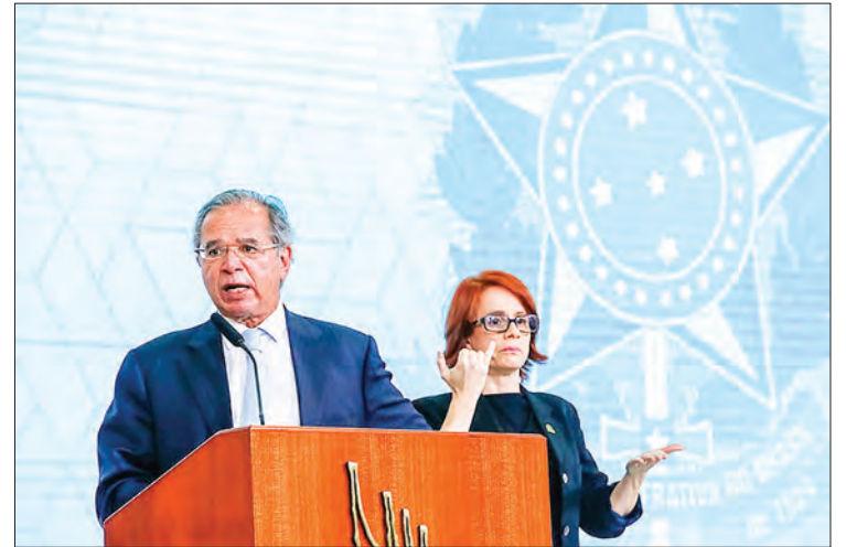
Brazil's Economy Minister Paulo Guedes.

The IMF said it had maintained the office to "facilitate dialogue," but Guedes said that was no longer needed. "They've been here long enough. There was a lot of imbalance in the relationship," he said. Guedes and Bolsonaro have been at pains to shore up confidence in Brazil's recession-hit economy as the president heads toward elections next October with his popularity at an all-time low.—AFP ■