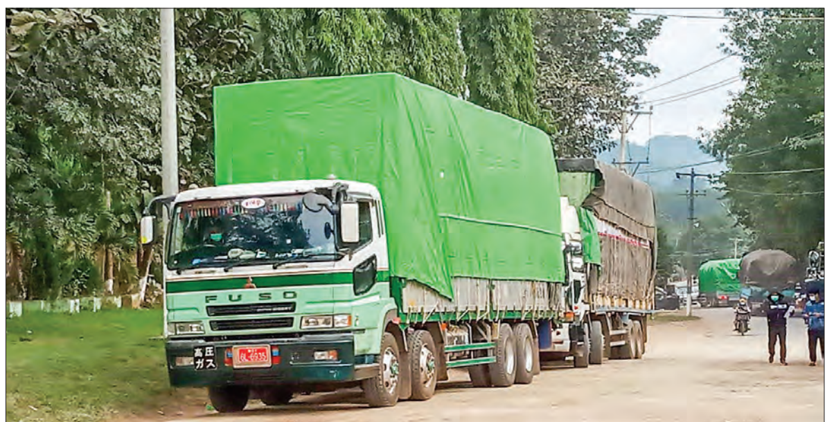
Lorries carrying anti-Covid equipment are seen transporting them to states and regions.

It is reported that the Ministry of Commerce is coordinating with relevant departments, treatment of COVID-19, as well as contact persons for inquiries can be reached through the Ministry’s Website – www.commerce.gov.mm . — MNA