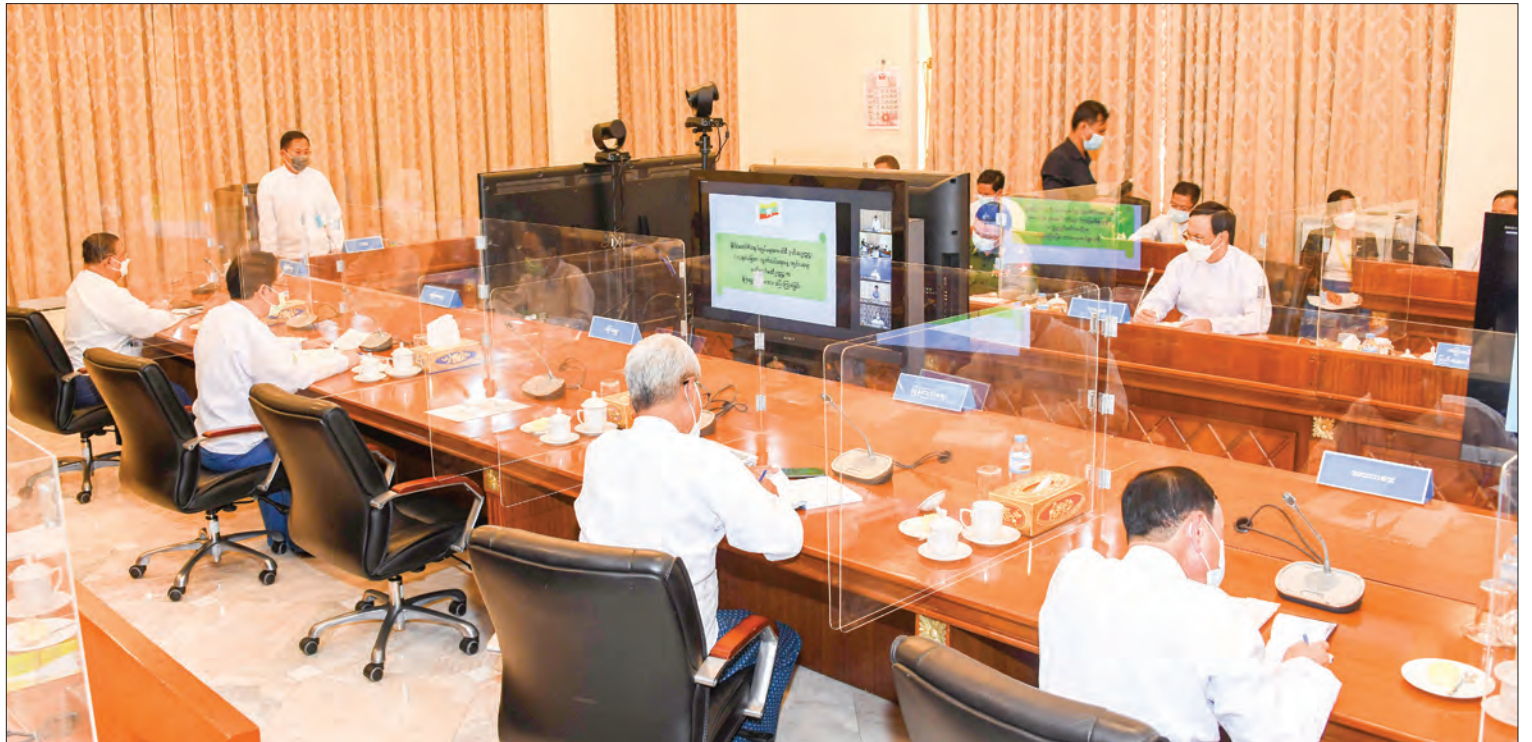
State Administration Council Vice-Chairman Deputy Prime Minister Vice-Senior General Soe Win addresses the third meeting of the Central Committee on Organizing the 74 th Anniversary of Independence Day 2022 in Nay Pyi Taw yesterday.

Speaking on the occasion, the Vice-Senior General said relevant subcommittees have discussed matters related to successful marking the 74 th Anniversary of Independence Day at the first and second meetings. Today's meeting focuses on the latest accomplishment of the assignments and remaining tasks and needs to fulfil the