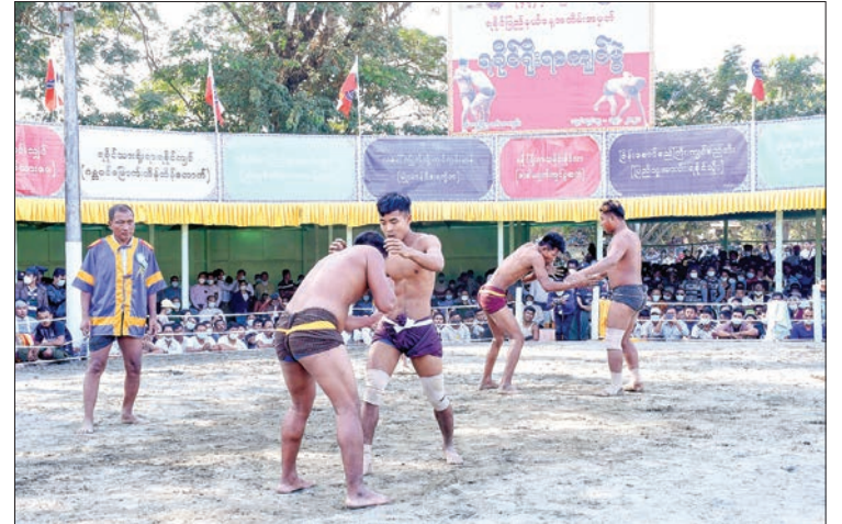
Rakhine's traditional wrestling contest.

The SAC members and party also visited Sakka Muni Thunzetta Pagoda in Lawka Nanda Pagoda precinct and inspected the renovation works on Lawka