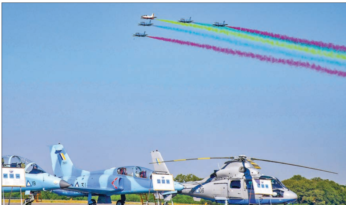
Fighters are seen saluting the Senior General in a composite arrow formation.