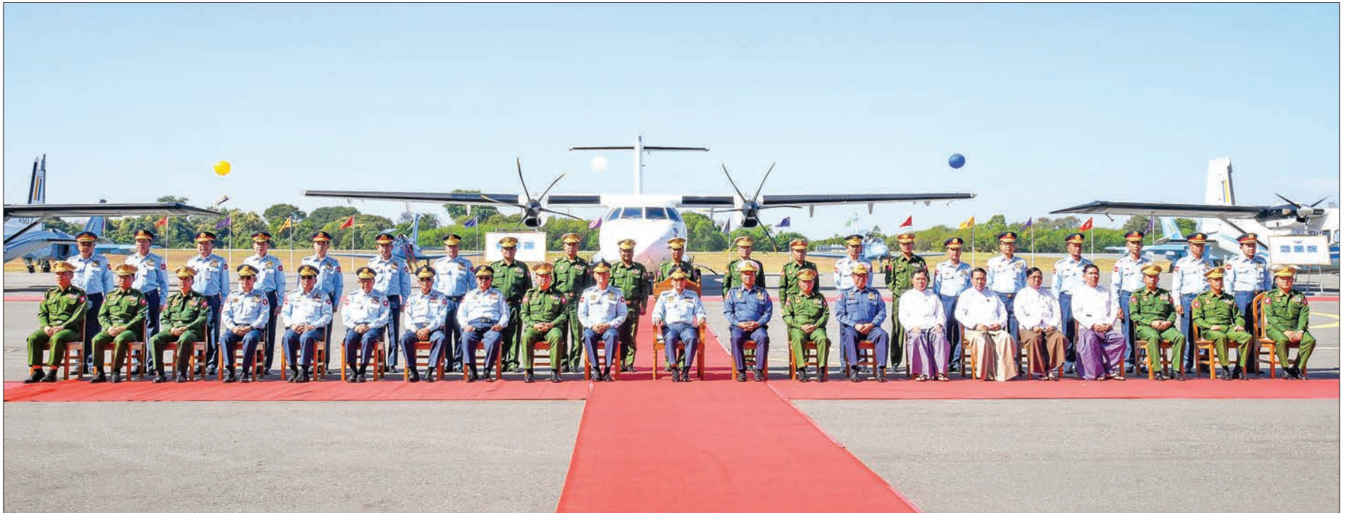
State Administration Council Chairman Commander-in-Chief of Defence Services Senior General Min Aung Hlaing poses for the group documentary photo at the event yesterday.