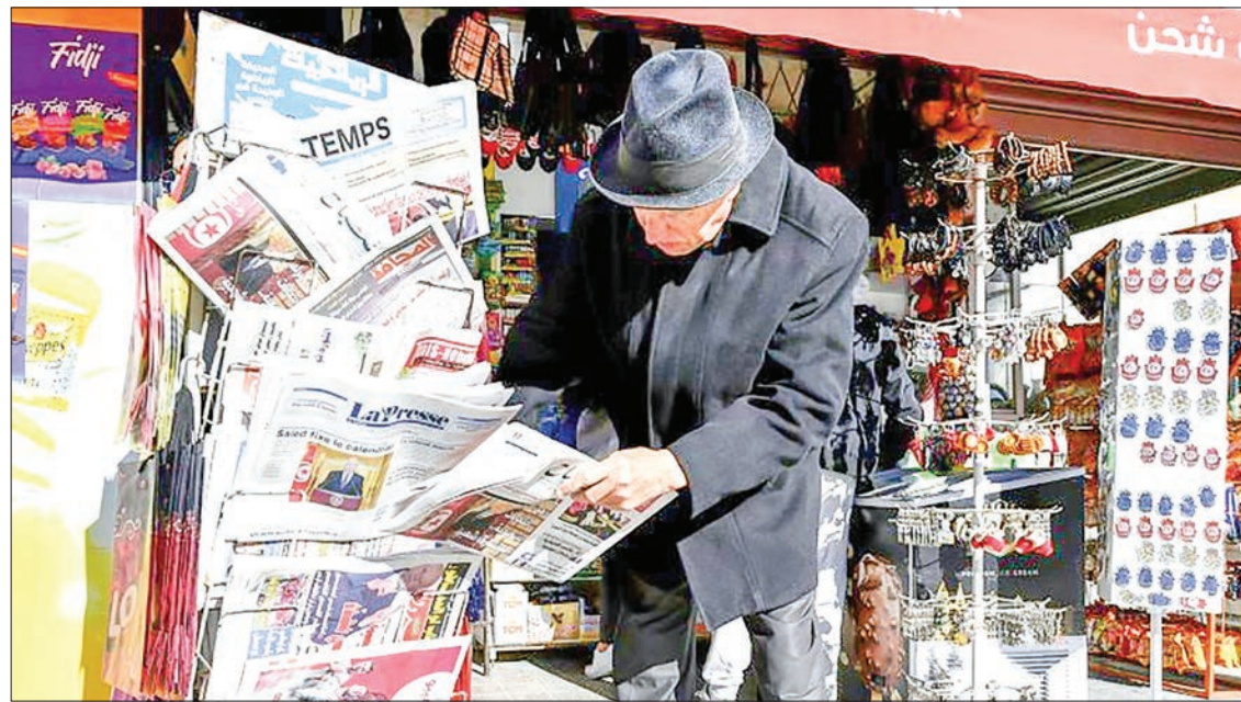
A Tunisian man checks newspapers on a stand on Habib Bourguiba Avenue in the capital Tunis on 14 December 2021.

OPPONENTS of Tunisian President Kais Saied on Tuesday slammed his decision to extend a months-long suspension of parliament, accusing him of dealing another blow to the country's nascent democracy.