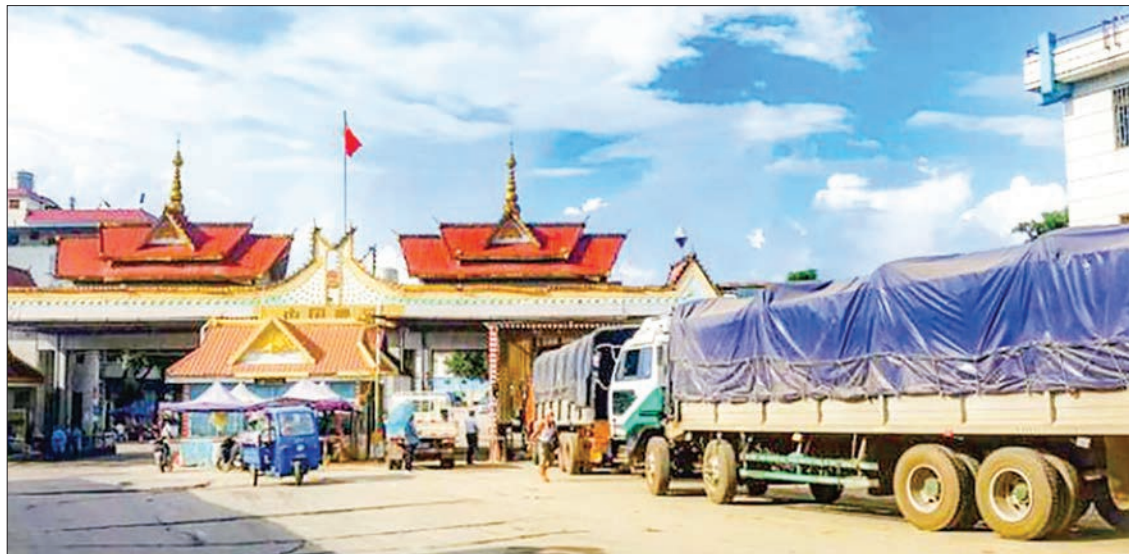
Myanmar conducted US$4.057 billion worth of cross-border trade through Muse posts in the financial year 2020-2021, with exports valued at $2.9 billion and imports worth $1.15 billion, the trade data indicated.

Myanmar conducted US$4.057 billion worth of