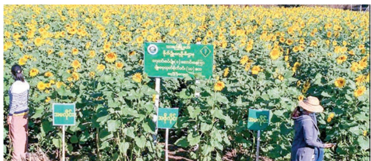
About 25 acres of winter sunflower for seed production have been cultivated in Thazi Township, Mandalay Region to boost the edible oil production.