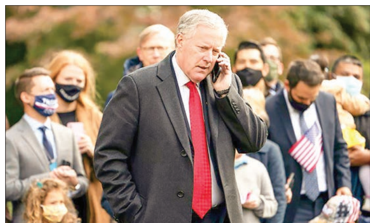
Mark Meadows faces becoming the first White House chief of staff in half a century to be prosecuted.

The panel is investigating Trump's efforts to overturn his defeat in the November 2020 election in the run-up to the Capitol riot — as well as the help he got from Meadows and others.—AFP ■