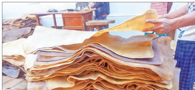
More than 200 acres of rubber has been cultivated in Homalin Township since 2015. The acres grew year over year, and the number of rubber acres reached 8,187 in 2021, according to the township Agriculture Department.

More than 200 acres of rubber has been cultivated in