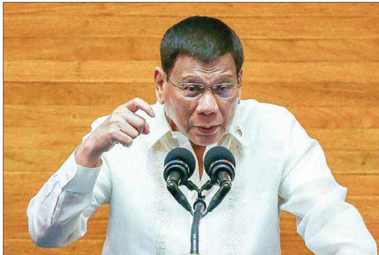
Rodrigo Duterte is constitutionally barred from seeking re-election as president.

Duterte decided to withdraw from the May elections to "better focus" on the government's pan-