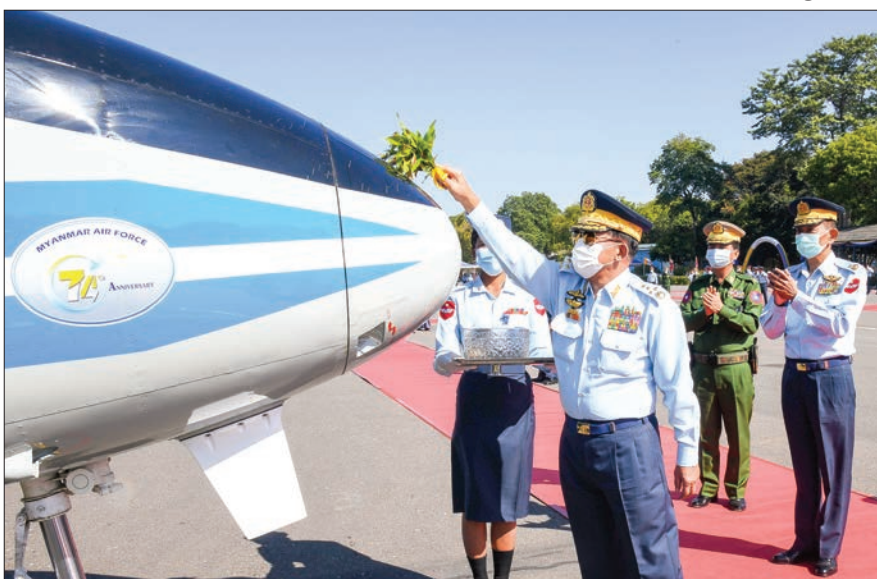
The Senior General sprinkles the scented water on the commissioned aircraft.