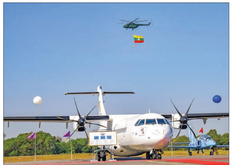
One transport helicopter hanging State Flag salutes the Senior General.