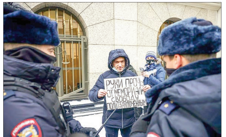
Russia's Supreme Court is hearing a request to shut down Memorial, the country's most prominent right group.

ard saying "Hands off Memorial" was detained, the group said.