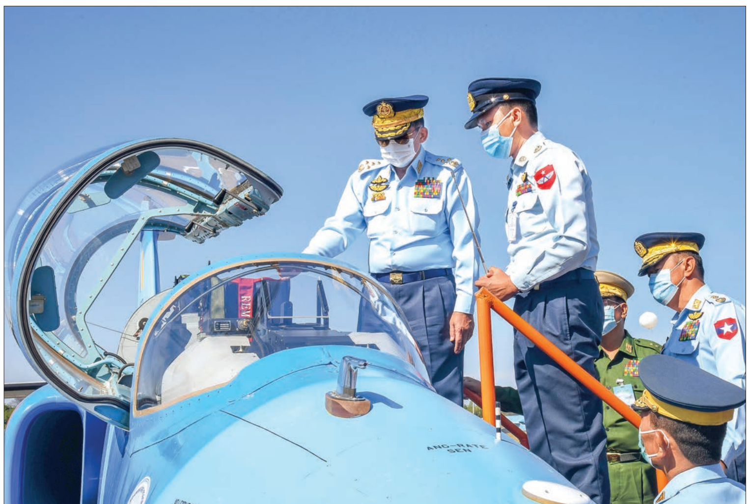
Chairman of the State Administration Council Commander-in-Chief of Defence Services Senior General Min Aung Hlaing observes one of the training jets at the 74 th Anniversary of the Tatmadaw (Air) event in Meiktila on 15 December 2021.