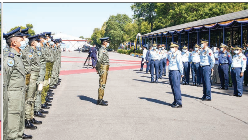
The Senior General greets the pilots who participated in the event.