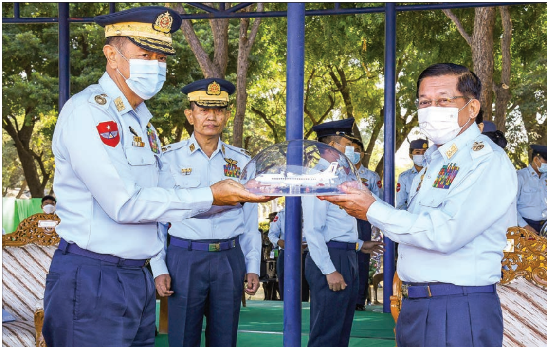
The Commander-in-Chief (Air) presents the miniature aircraft to the Senior General.