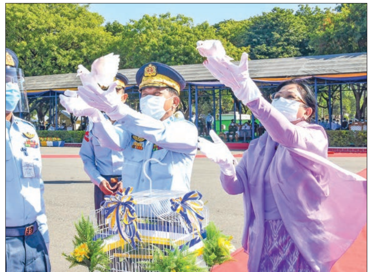
The Senior General and wife release 74 birds.