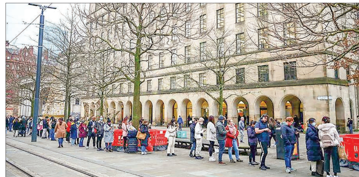
Members of the public wait for a dose of a COVID-19 vaccine, as they queue outside Manchester Town Hall, which is being used as a COVID-19 walk-in vaccination centre, in Manchester, north west England, on 14 December.

The announcement came as a real-world study from South Africa showed two doses of the Pfizer-BioNTech vaccine was 70 per cent effective in stopping severe illness from the new variant, a result called encouraging by researchers, though it represents a drop compared to earlier strains. Data for the new pill, which hasn't yet been authorized any-