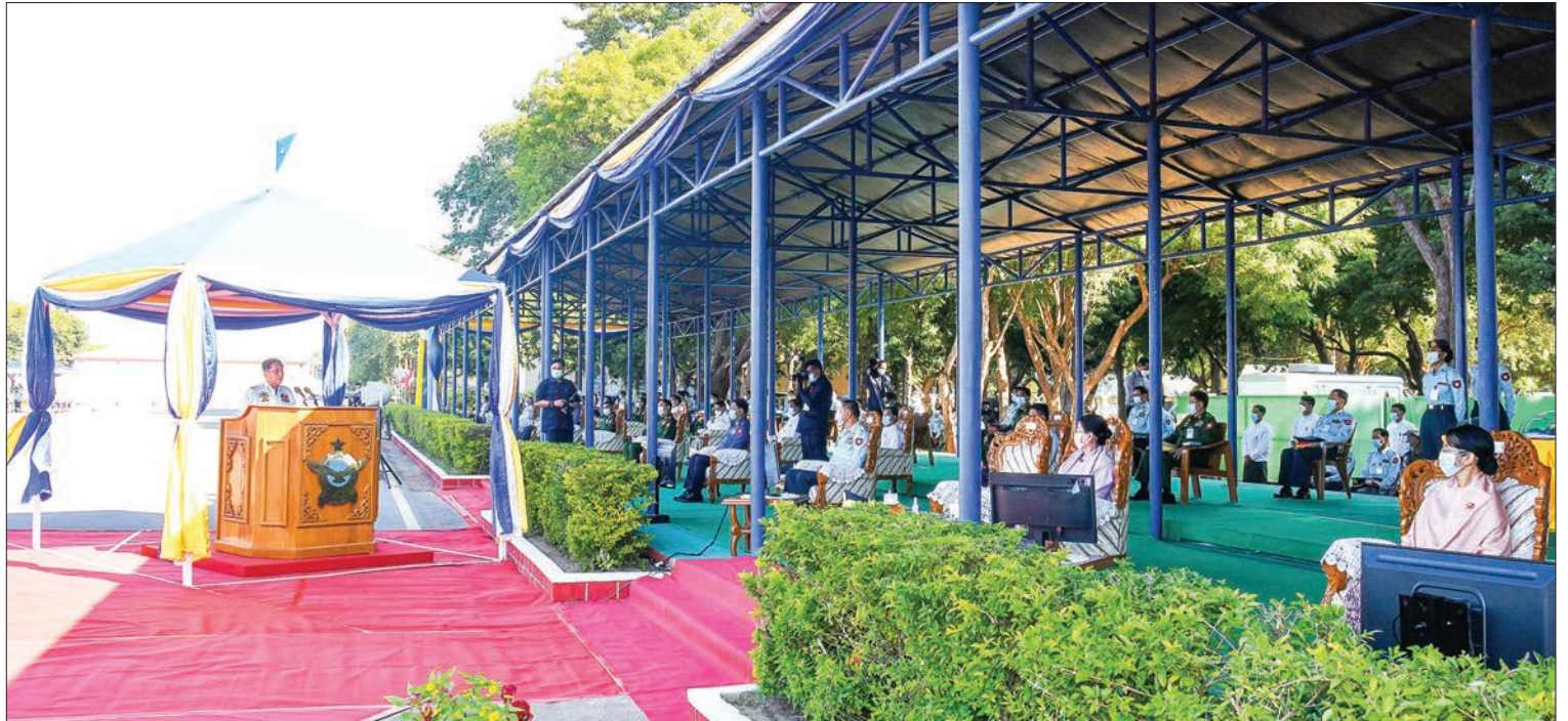
State Administration Council Chairman Commander-in-Chief of Defence Services Senior General Min Aung Hlaing speaks on the occasion of the 74 th Anniversary of Tatmadaw (Air) yesterday.

The Senior General stressed the need for all Tatmadaw members to emphasize the military unity and organizational measures and try hard to be ready to fight through constant training and military awareness.