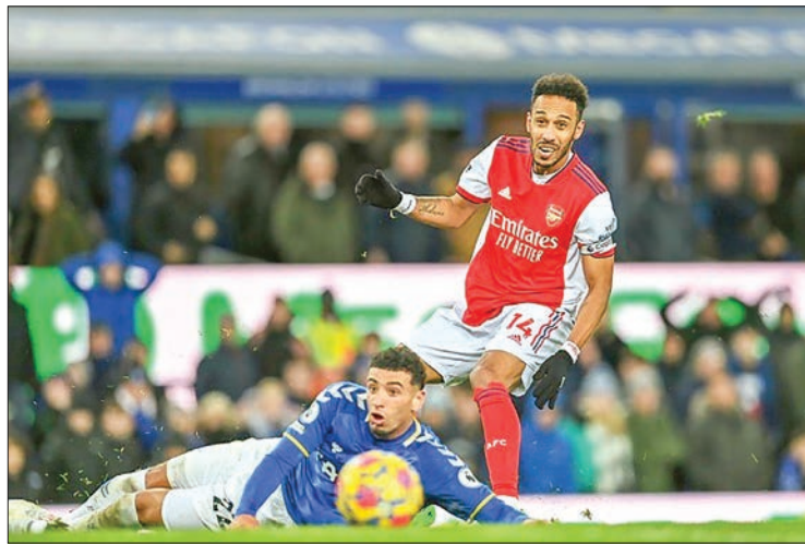
Arsenal striker Pierre-Emerick Aubameyang.

clear he could not let one individual's behaviour influence the mood of the entire club.