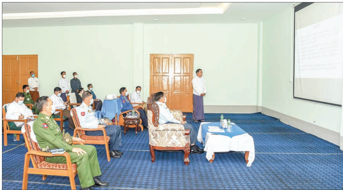
The Senior General hears the report on the progress of Myanmar's earth observation.

TECHNOLOGIES taught with funds of the State must be efficiently applied at home, said Chairman of the State Administration Council Prime Minister Senior General Min Aung Hlaing in inspecting the Myanmar Aerospace Engineering University in Meiktila yesterday afternoon.