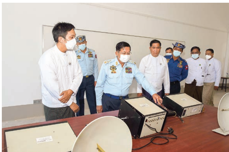
The Senior General and party view around the Myanmar Aerospace Engineering University in Meiktila on 15 December 2021.

Union minister for Science and Technology Dr Myo Thein Kyaw reported on the progress of Myanmar's earth observation for the launching of the satellite, sending of scholarship students abroad under the transfer