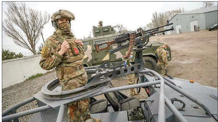
Eastern European countries such as Ukraine are on the front lines of the west's standoff with Russia. Ukrainian National Guard servicemen take part in a military drill near the Azov Sea port of Mariupol in April.