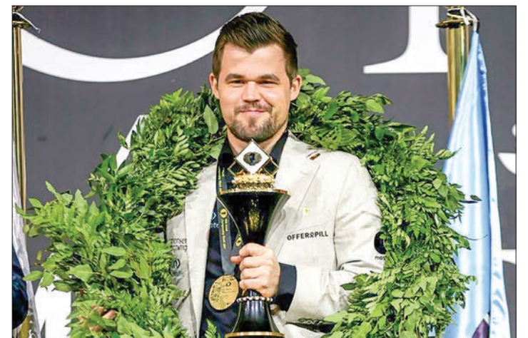
'It doesn't mean as much anymore as it once did,' said Magnus Carlsen of his fifth chess world title.

He said that only Firouzja excites him as a possible challenger. The 18-year-old won an 11-round 108-payer tournament in Riga in November that decided the eight qualifiers for a candidates competition to who will play off for the right to face Carlsen next year.—AFP ■