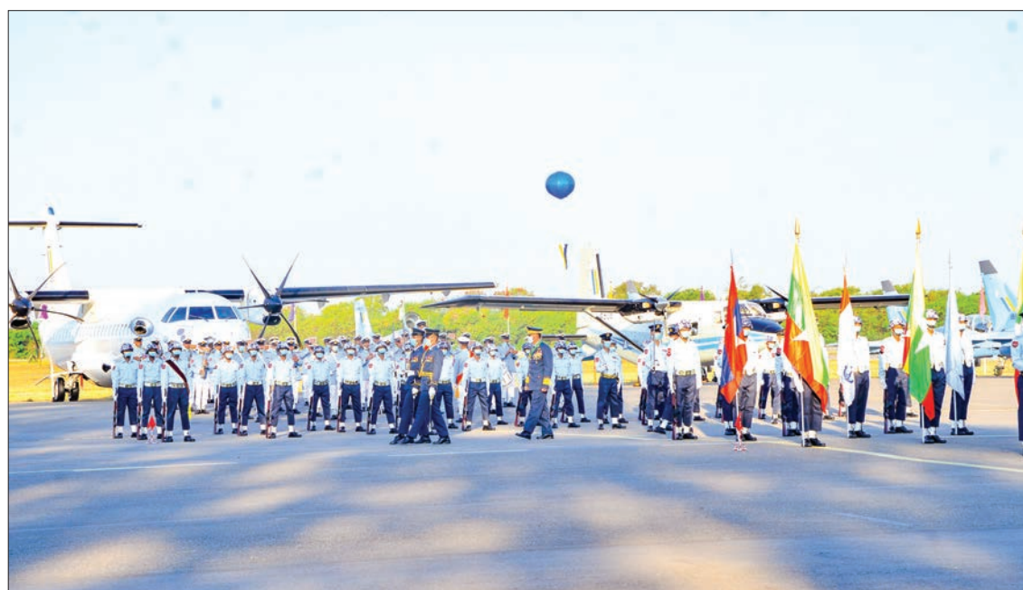
A military parade is held to mark the 74 th Anniversary of Tatmadaw (Air) in Meiktila yesterday.

First, the Commander-in-Chief (Air) and those present at the ceremony received the Five Precepts from the Sayadaw of Sasana Waiponla Learning Centre and