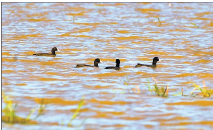
In Moeyungyi Wildlife Sanctuary.

MORE than 3,000 tourists visited the 25,600-acre Moeyungyi Wildlife Sanctuary and Wetlands at the start of the tourist season in early November.