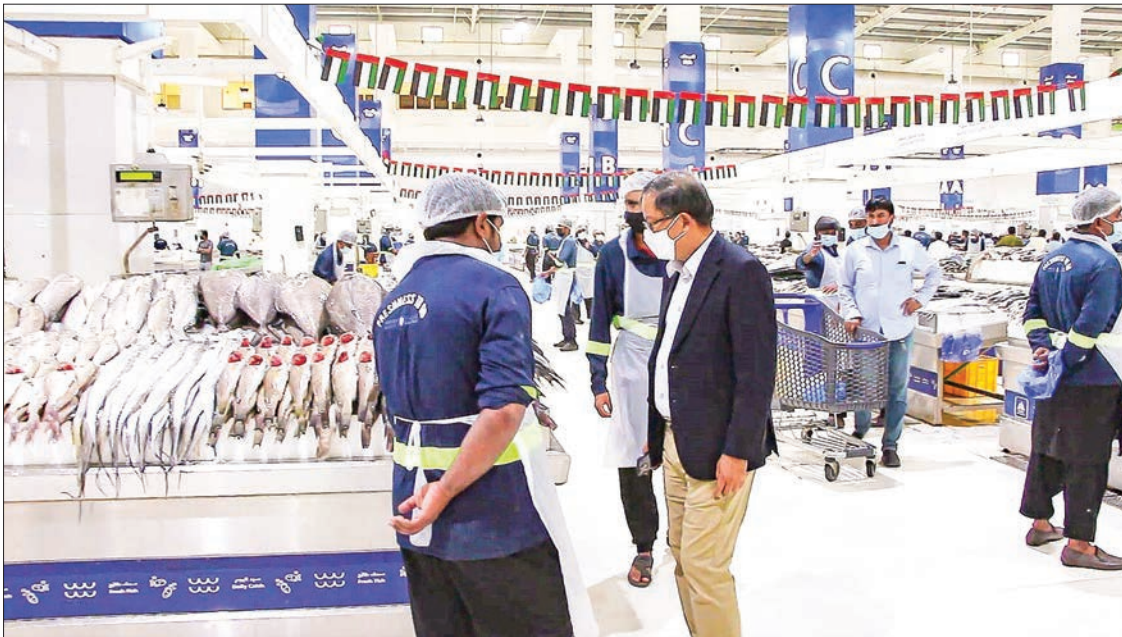
Myanmar delegation looks around the AgraMe AquaMe exhibition in Dubai of the United Arab Emirates.

A Myanmar delegation led by Union minister for Agriculture, Livestock and Irrigation U Tin Htut Oo who was in Dubai, United Arab Emirates to attend the ASEAN Summit on Sustainable Oceans visited exhibitions at