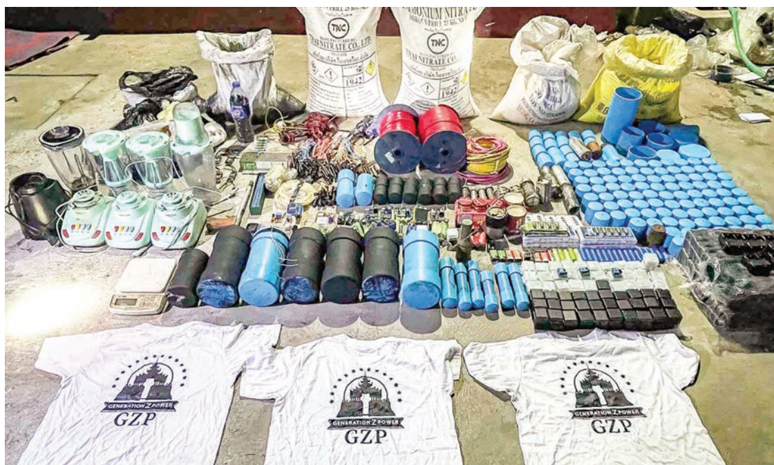
Confiscated weapons, explosives, ammunition and related items.

The security forces investigated to arrest the terrorist groups as quickly as possible. On 12 December evening, the police arrested one suspect who participated in the terrorist at-