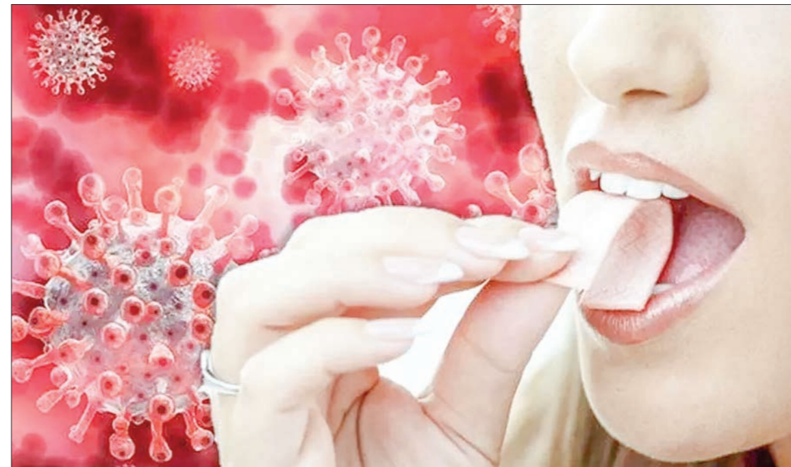
Scientists developing chewing gum that may cut Covid spread.