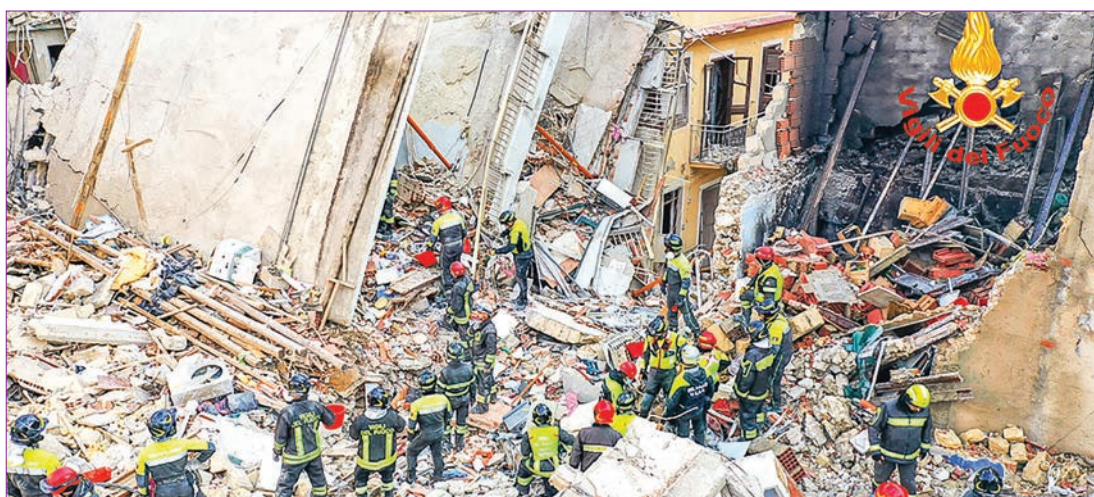
This handout picture taken and released by Italian Firefighters (Vigili del Fuoco) on 12 December 2021 shows firefighters working after a four-storey apartment building collapsed, following a gas explosion, in Ravanusa on 12 December 2021.

a four-storey apartment building, in the central residential district of the town of nearly 11,000 inhabitants, according to Italy’s civil protection agency. Images from the scene showed a mass of concrete rubble, wooden beams and mangled steel in a large empty space, with neighbouring buildings charred and damaged.— AFP ■