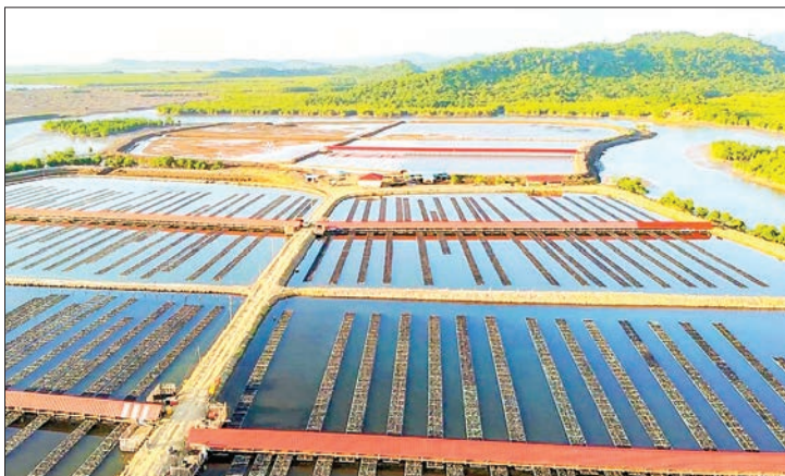
The soft-shell crabs from Rakhine State are delivered to the US, Australia, Japan, Hong Kong and the countries in Europe. The crab processing companies produce 15 tonnes per month and approximately 200 tonnes per year in Rakhine State.

by the companies in Thandwe city earned US$2.5 million in the 2018-2019 financial year, $3.8 million in the 2019-2020 FY and $4.66 million in the 2020-2021 FY.