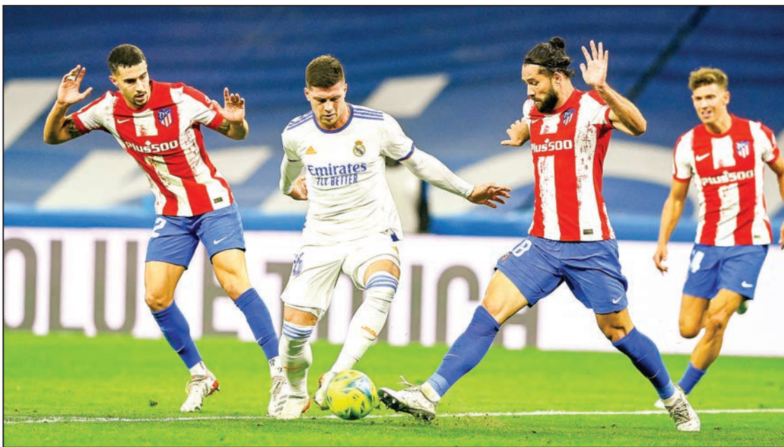
Real Madrid's Serbian forward Luka Jovic (C) vies with Atletico Madrid's Brazilian defender Felipe (R) during the Spanish league football match between Real Madrid CF and Club Atletico de Madrid at the Santiago Bernabeu stadium in Madrid on 12 December 2021.

REAL Madrid strengthened their already-commanding position in the title race on Sunday by defeating Atletico Madrid 2-0 to move 13 points clear of the defending champions in La Liga.