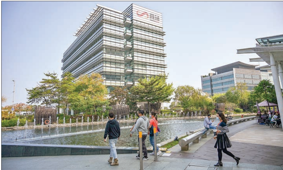
A view of the headquarters of SenseTime, a Hong Kong-based artificial intelligence company with offices in China, Singapore, Japan, Abu Dhabi and the United States is seen in Hong Kong on 13 December 2021.

the markets this week following a two-day policy meeting.