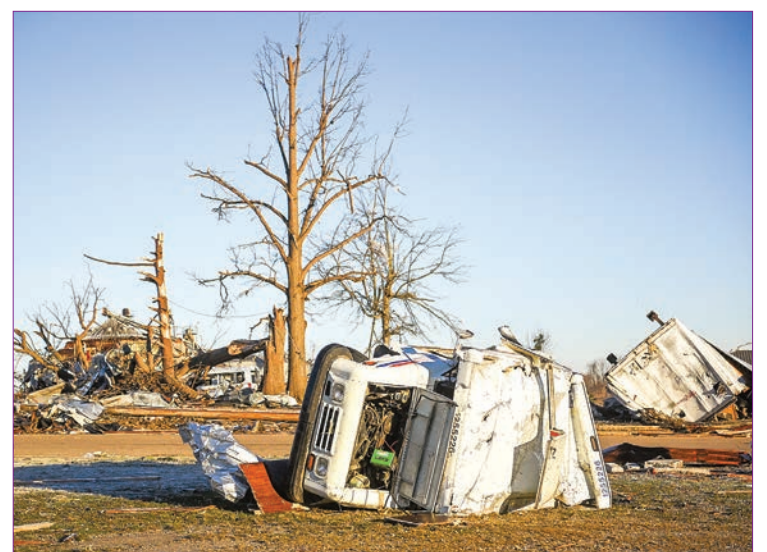
Tornado damage is seen after extreme weather hit the region 12 December 2021, in Mayfield, Kentucky.

IN Mayfield, a US town razed by the weekend’s tornadoes, locals say they are driven by their Christian faith to clear the rubble, collect supplies and turn their churches into shelters for those left homeless by one of the most devastating storm outbreaks in American history.