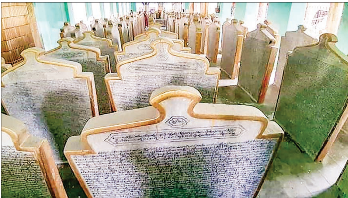
Ledi stone inscription. PHOTOS: LU LAY

The cost was K124,218 plus 13 pe and six pya and the southern and western parts of the stone inscription were damaged from bombing during World War II.— Lu Lay/GNLM