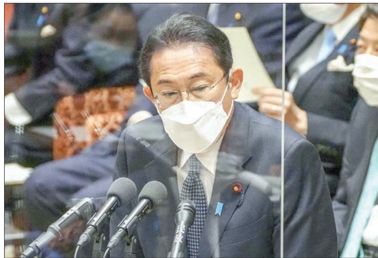
Prime Minister Fumio Kishida speaks in the parliament in Tokyo on 13 December 2021.

ate around 500 people wishing to leave Afghanistan, including locals who worked for Japanese agencies. However, the troops only evacuated one Japanese as well as 14 Afghans at the request of the United States by the end of their mission on 31 August. Current law limits the SDF to carrying out evacuations from a "safe place." "I understand it is important to make preparations in nonemergency situations so that we can fully respond in evacuating Japanese nationals when they face a crisis overseas," Kishida added. — Kyodo ■