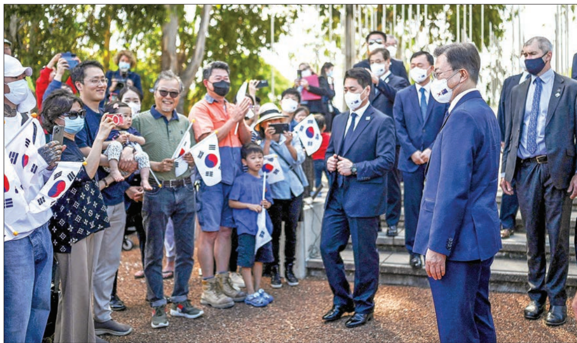
South Korea's President Moon Jae-in (R) greets members of the public after laying a wreath at the Australian National Korean War Memorial in Canberra on 13 December 2021, on the second day of his three-day official visit to Australia.

Moon stressed that South Korea wanted to promote a free and open Pacific region, but also