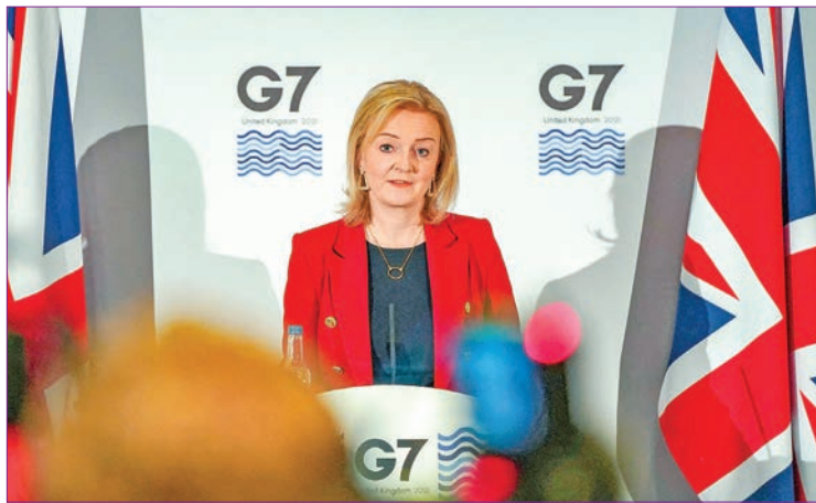
Britain's Foreign Secretary Liz Truss speaks at a press conference on the final day of the G7 foreign ministers summit in Liverpool, north-west England on 12 December 2021.

“There is still time for Iran to come and agree this deal,” she told a news conference.