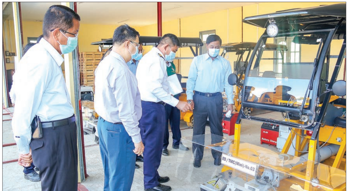
The MoTC Union minister inspects the Machinery Workshop (Mahlwagon) of the Myanma Railways (MR).

He finally inspected the new rail-track maintenance equipment and other materials and instructed the necessary things regarding the proper use of machinery and Function Test. — MNA