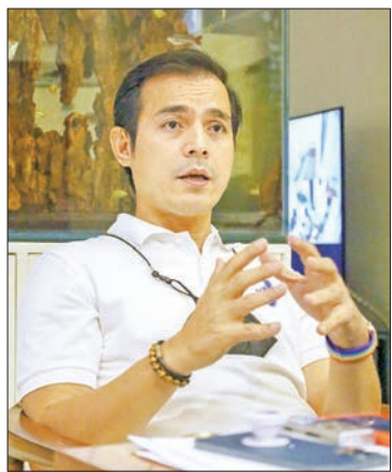
Philippine presidential candidate and Manila Mayor Francisco Domagoso, popularly known as "Isko Moreno," speaks in an interview with Kyodo News in Manila on 10 December 2021.

PHILIPPINE presidential candidate and Manila Mayor Francisco Domagoso has said he wants to beef up the country's naval forces amid China's expansive maritime claims in the South China Sea.