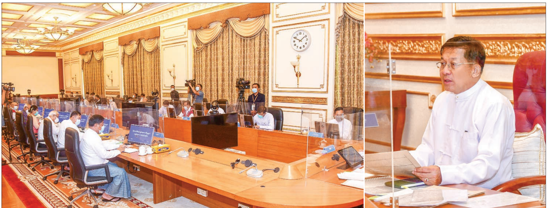
Chairman of the State Administration Council Prime Minister Senior General Min Aung Hlaing addresses the SAC meeting 18/2021 in Nay Pyi Taw on 13 December 2021.

A CTION is being taken against the officials who committed malpractice and related persons in the election, said Chairman of the State Administration Council Prime Minister Senior General Min Aung Hlaing at the meeting 18/2021 of the State Administration Council at the Office of the SAC Chairman, in Nay Pyi Taw yesterday afternoon.