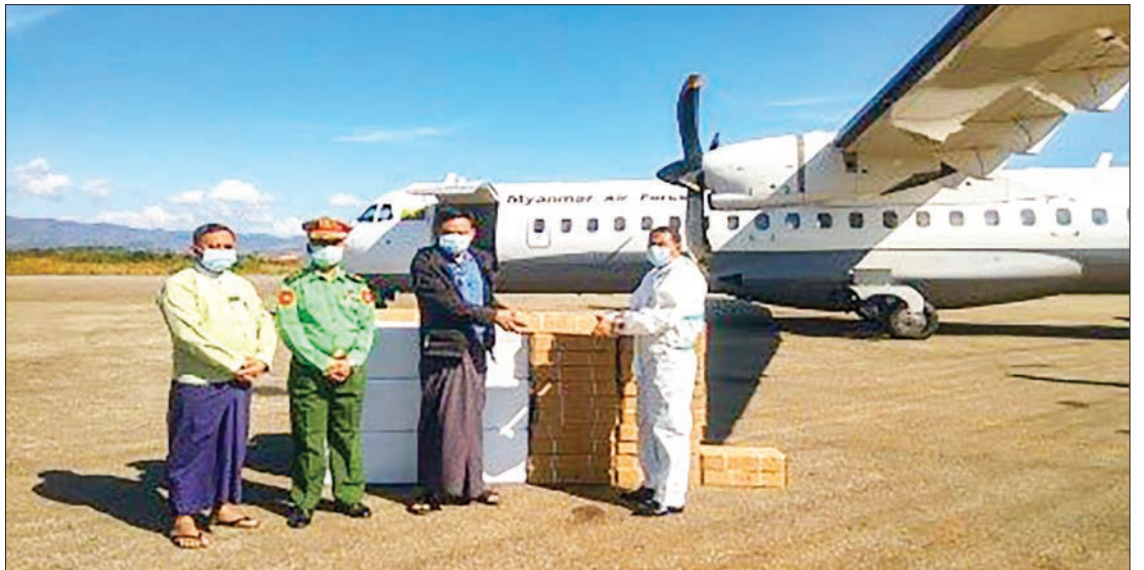
Vaccines arrive at Lashio airport.

Officials from the respective townships received the vaccines and will distribute them to respective townships, it is reported.—MNA