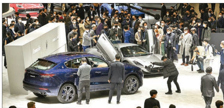
Visitors look at cars during a press preview of the Seoul Mobility Show at KINTEX exhibition hall in Goyang on 25 November 2021.

SOUTH Korea's export logged double-digit growth in the first 10 days of December on the back of the continued global demand recovery from the COVID-19 pandemic, customs office data showed on Monday.