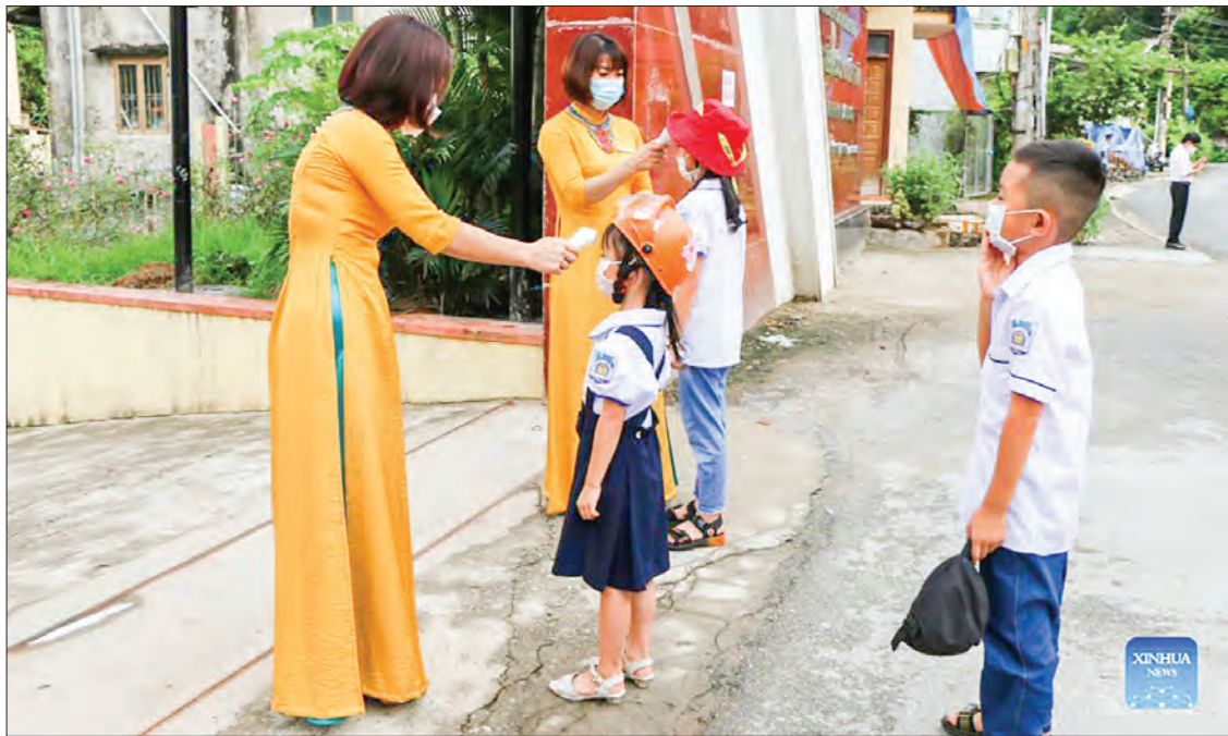
Primary school students have their temperature taken before entering school in northern Vietnam's Yen Bai province, 5 September 2021. Over two-thirds of Vietnam's 63 provincial-level localities started their new school year on Sunday amid the worst ever wave of COVID-19 infections in the country, Vietnam News Agency reported.

According to a plan announced Tuesday, it targets completing the booster vaccination