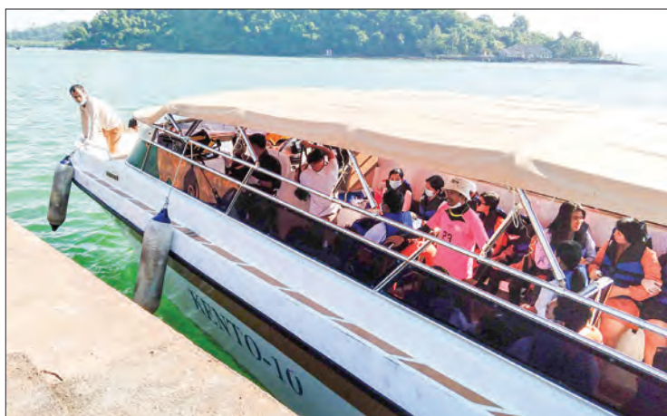
A speed boat carrying travellers is ready to start trip to islands.