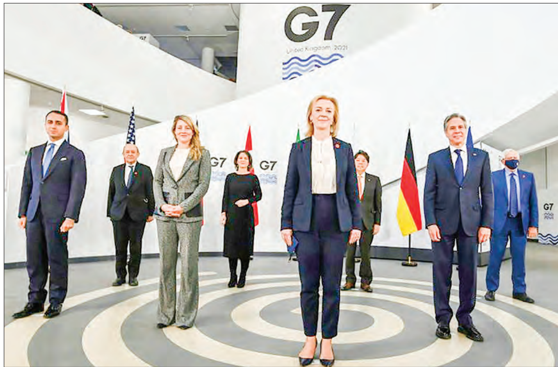
G7 foreign ministers met in Liverpool, northwest England, for talks about Russia's military build-up on the border with Ukraine, an assertive China and other threats.

The meeting — at which ministers want to present a united front against authoritarianism — is the last in-person gathering of Britain's year-long G7