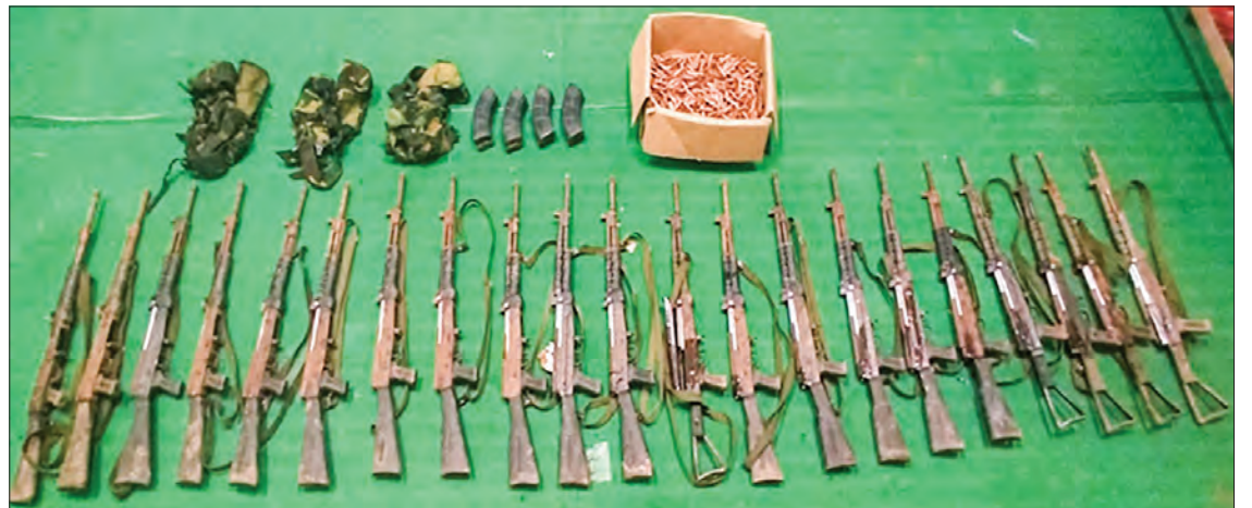
Assorted small arms were seized from PDF terrorists in Mogok Township from on 3 December.

The suspects admitted that the seized arms were transported from Tonegyi Village of KIA's 34th battalion area to Mogok Township by Zaw Myo Tun (aka) Oak Gyi of Padamyar Myay PDF with the communication of Soe Myint (still at large) in the second