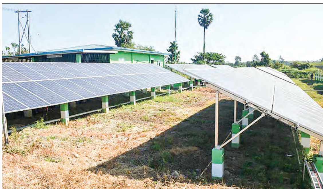
Solar panels are absorbing sunray to generate electricity at Solar Mini Grid Project in Myanaung Township.

A team led by Ayeyawady Region Chief Minister U Tin Maung Win, accompanied by Colonel Kyaw Swa Hlaing, Region Minister for Security and Border Affairs, Police Col Tin Zaw Tun, Region Minister for Transport and other officials concerned joined the ceremony of launching the solar power mini-grid project in Bantbwagon of Myanaung Township and formally cut the ribbon at the event on yesterday afternoon.