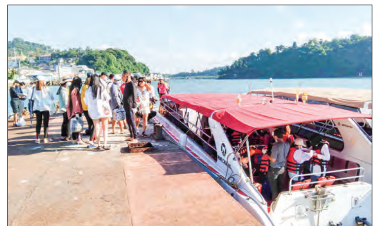
Crew members are preparing to launch trips to exotic islands in Kawthoung Township.