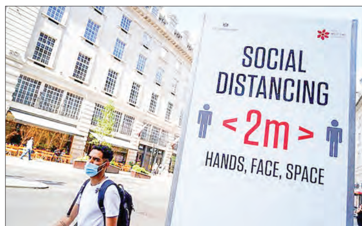
A pedestrian wearing face covering due to Covid-19, walks past a sign asking members of the public to social distance, in central London on 7 June 2021.

Meanwhile, experts also estimate that if it continues to