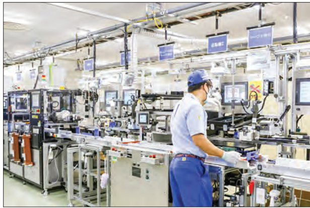
A total of 18,932 local subsidiaries of Japanese firms, as well as branches and offices of Japanese companies, in 82 countries and territories were polled, with 7,575, or 40 per cent, giving valid responses.

MORE than 60 per cent of overseas affiliates of Japanese companies expect to post operating profits in