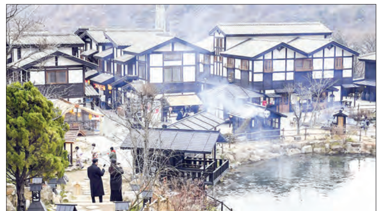
Photo taken in November 2021 shows a theme park that opened in South Korea's Dongducheon themed on Japan's Edo period (1600s-1860s).

"I've always wanted to travel to Japan, and after realizing that this place is nearby, I decided to make a visit," said 30-year-