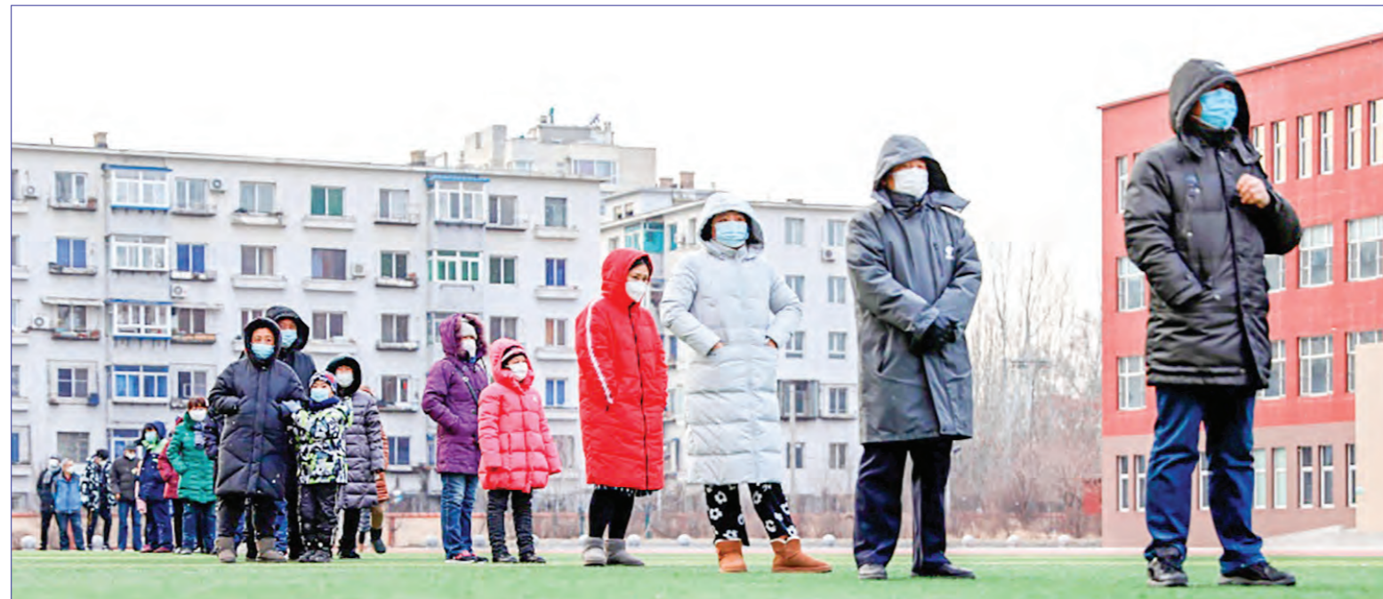
In this photo released by China's Xinhua News Agency, people wait in line for coronavirus tests in Shenyang in northeastern China's Liaoning Province, Monday, 11 January 2021.