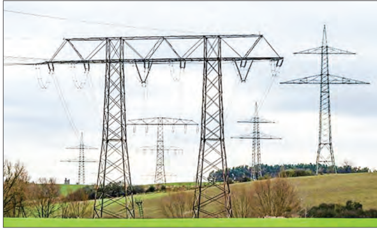
A growing number of Germans are fighting against the construction of electricity pylons near their homes, a trend that risks slowing down the transition to renewable.

The new network is intended to supply the region with wind