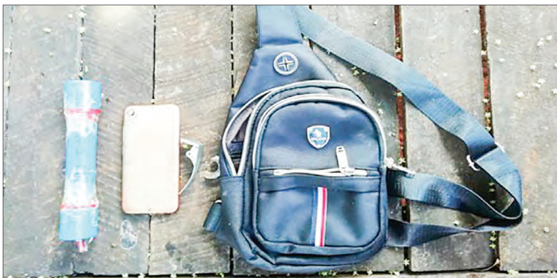
Some items of equipment were seized from terrorists who committed grenade attack on Kyaukme Township education office on 11 December.

It is reported that necessary interrogations are being carried out to ensure that the detainees are prosecuted in accordance with the law, and security forces are continuing to provide security for the towns/villages.—MNA