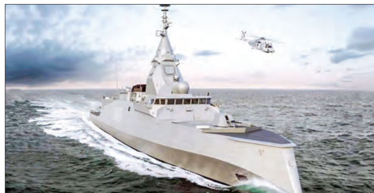
Athens has signed a deal with Paris to buy three French Belhara class frigates for €3 billion.

possible level. The Greek prime minister himself has announced it," the source told AFP on Saturday. On Friday the US State Department said it had approved the sale for $6.9 billion of four Lockheed Martin combat frigates, known as multi-mission surface combatant ships. The announcement suggested France faced a fresh commercial arms deal threat after the US wrested away a massive submarine contract for Australia in a shock announcement on 15 September that ruptured relations between Washington and Paris.—AFP ■