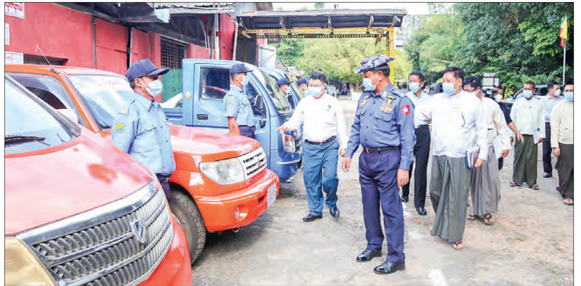
Union Minister Admiral Tin Aung San views round departmental vehicles at No 3 Workshop of Road Transport (Mayangon) on 11 December.

In the afternoon, the Union Minister visited No 3 Workshop of Road Transport (Mayangon) and he highlighted uplift of the morale and capacity of department, safety of staff and vehicles and clearance of irregularities by strictly follow-