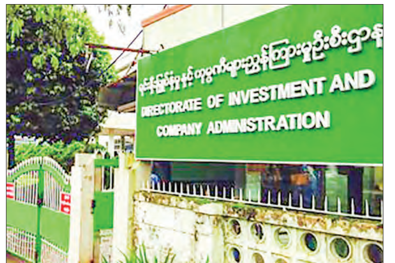
Directorate of Investment and Company Administration handles movements of companies with local and foreign investments.

Next, the COVID-19 surge and the political changes led to the drastic fell in this year’s FDI sector compared with that of previous years. Myanmar attracted foreign direct investment of more than $3.79 billion in the last financial year 2020-2021 from 48 enterprises.—KK/GNLM