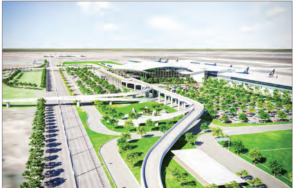
Noi Bai International Airport prepares to welcome a number of foreign visitors.

ic and tourism recovery and enable overseas Vietnamese to return to their homeland for the upcoming Lunar New Year, Vietnamese Deputy Prime Minister Pham Binh Minh said in the government directive. While the resumption of international flights is necessary, effective pandemic control must also be ensured, Minh said, urging relevant authorities and aviation businesses to work actively to realize the approved plan and make recommendations for adjustments in accordance with the actual situation. — Xinhua ■