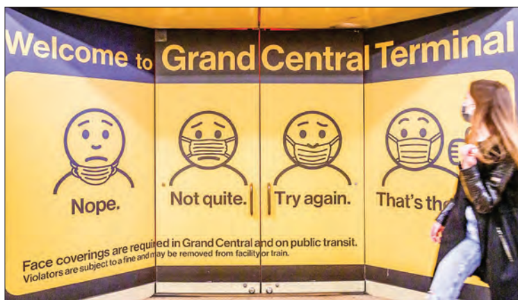
Fully vaccinated people 'can participate in indoor and outdoor activities, large or small, without wearing mask or physical distancing', the director of the US Centers for Disease Control and Prevention said.

THE state of New York will impose mandatory masking for