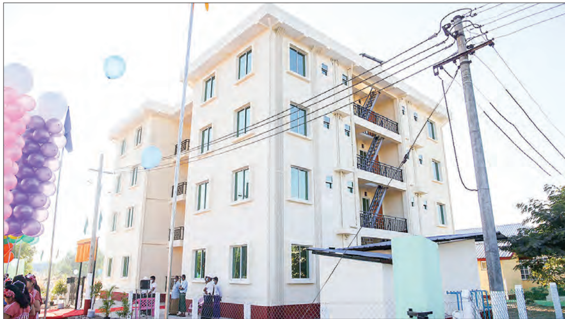
Photo shows already-commissioned staff housing building in Hpa-an.