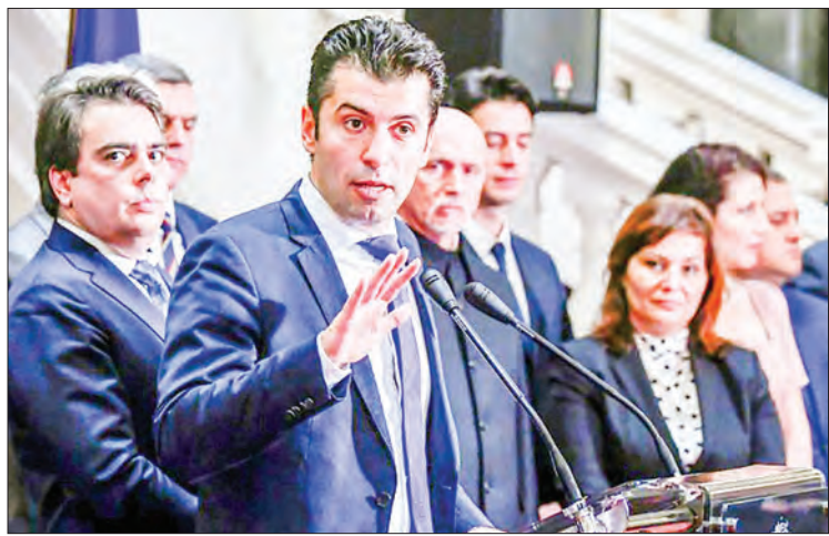
Kiril Petkov has pledged to fight graft in corruption-plagued Bulgaria.

BULGARIA'S PM-designate Kiril Petkov, whose new anti-graft party won general elections last month, said on Saturday he hoped to take office on Monday as the head of