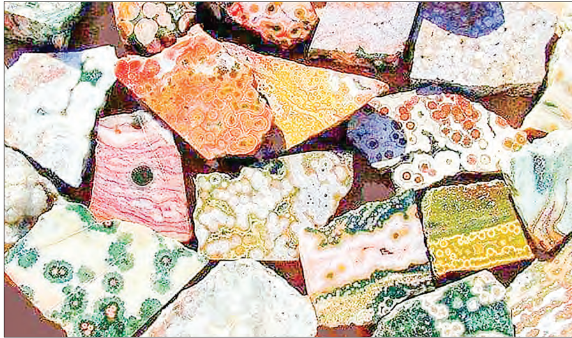
Pieces of petrified wood are displayed at the market.

“The souvenir market is usually relying on tourists. However, the market is sluggish as it