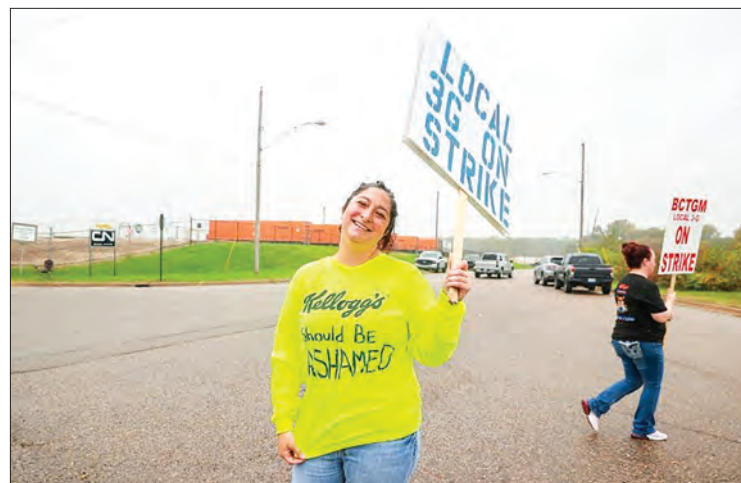
Kellogg's plant workers remain on strike after rejecting the company's latest contract offer.

US President Joe Biden slammed Kellogg's management for replacing striking workers and urged the breakfast cereal giant