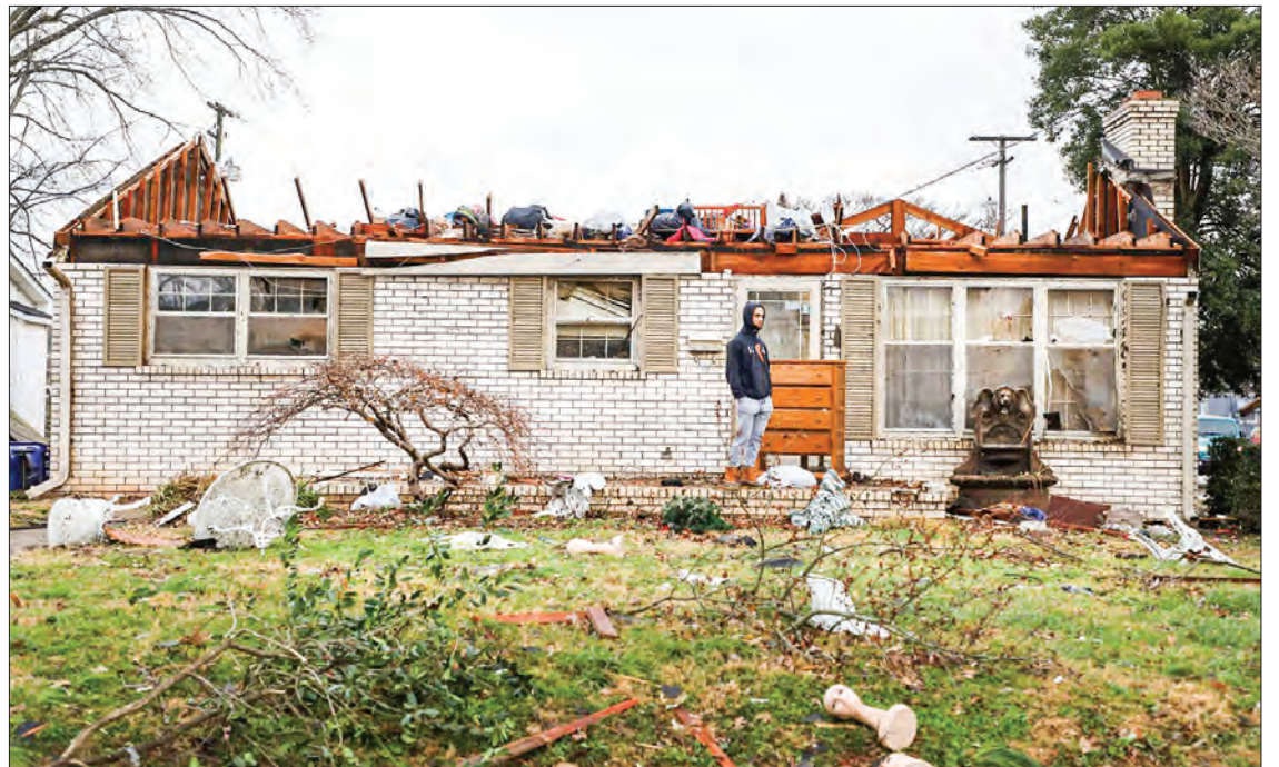
A person stands among the damage and debris in Bowling Green, Kentucky, on Saturday, 11 December.

US media video footage shows many collapsed buildings and houses left in the aftermath of the tornadoes in Kentucky and other affected states. President Joe Biden, who was briefed on the disaster, tweeted, "We're working with Governors to ensure they have what they need as the search for survivors and damage assessments continue." — Kyodo ■