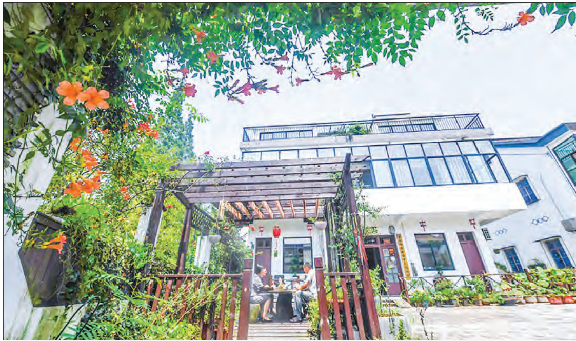
People enjoy themselves at a homestay in Xincang Village of Haining City in Jiaxing, east China's Zhejiang Province, 26 August 2021.

The country should create and accumulate social wealth continuously, and at the same