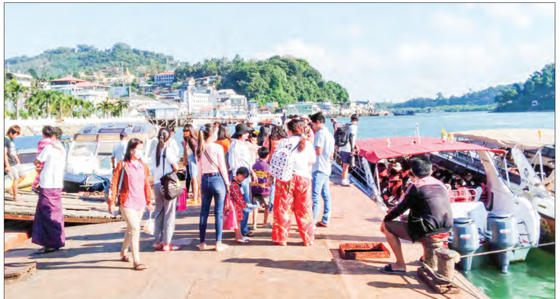
Flocks of travellers are seen on jetty in Kawthoung.

As measures to prevent and control the transmission of the disease, every traveller is required to present the proof of being vaccinated for twice against the COVID-19 disease and to wear face masks and gloves along the trip. As it is a sea voyage, it is necessary for all tourists to comply with the regulations of the Directorate of Hotels and Tourism and tourism companies so as not to endanger the lives of tourists, as well as the natural resources and ecosystems of the sea.—Kyaw Soe (Kawthoung)/GNLM