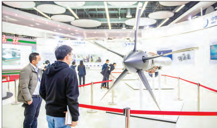
People view the exhibits at China International Rail Transit and Equipment Manufacturing Industry Exposition in Zhuzhou, Central China's Hunan province, 8 December 2021.

CUTTING-EDGE Chinese technologies have attracted enterprises from the United States, Germany, France and other countries at an international expo held in Zhuzhou city, central China's Hunan province.