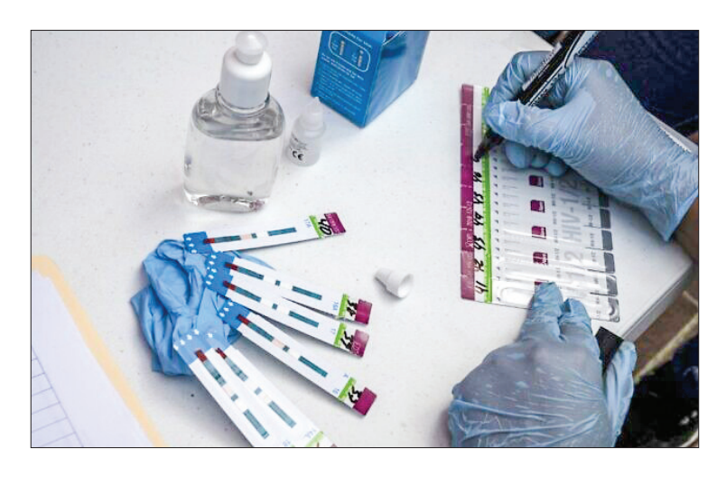
A health worker verifies the process of rapid HIV/AIDS tests taken from passersby at Morelos Square in Caracas, Venezuela, on 3 December 2021.

AN experimental HIV vaccine based on mRNA -- the same technology used in two highly successful Covid-19 vaccines -- has shown promise in experiments in mice and monkeys, according to a study published Thursday in Nature Medicine.