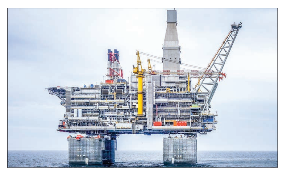
ExxonMobil is one of the world's largest publicly traded international oil and gas companies.

consortium discovered a huge natural gas reserve off Cyprus in Block 10, the island's largest find to date, holding an estimated five