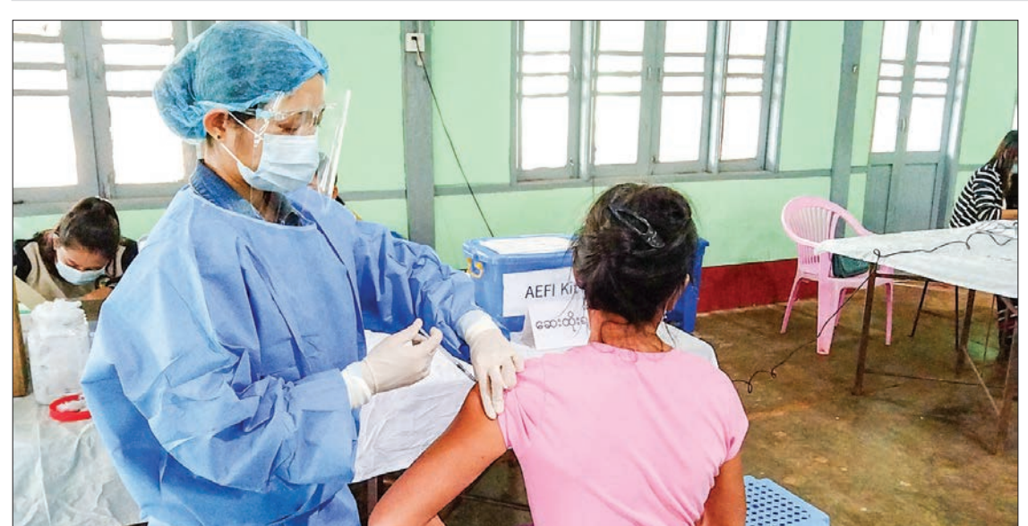
Inoculation drive in Namtu.

HEALTH officials gave the second dose of Sinopharm 18-year-old IDPs at township hall of Namtu in Pamheit Quarter, Namtu Township, Kyaukme District, northern Shan State yesterday morning.