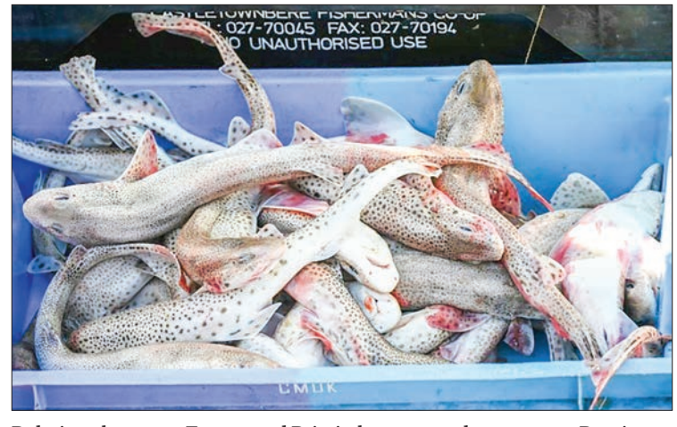
Relations between France and Britain have soured over a post-Brexit fishing rights dispute.

AN EU deadline for Britain to grant licences to dozens of French fishing boats appeared to expire Friday without a final breakthrough in talks, despite France's threat to seek European legal action.