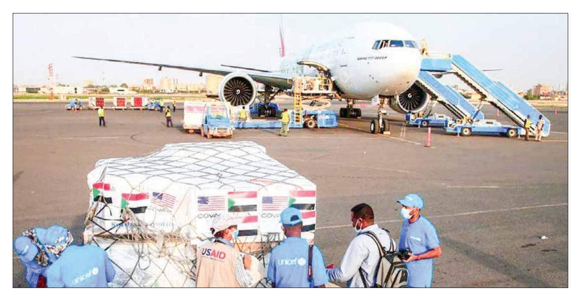
Wealthy countries have received over 16 times more Covid-19 vaccines per person than poorer nations that rely on the Covax programme backed by the World Health Organization.

On so-called "breakout infections" among individuals already