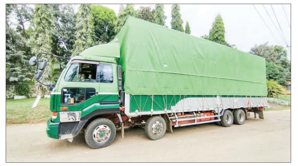
Anti-Covid devices are transported by a lorry to where necessary.

It is reported that the Ministry of Commerce is coordinating with relevant departments and treatment of COVID-19 as well as contact persons for inquires can be reached through the Ministry's Website -www.commerce.gov.mm. — MNA