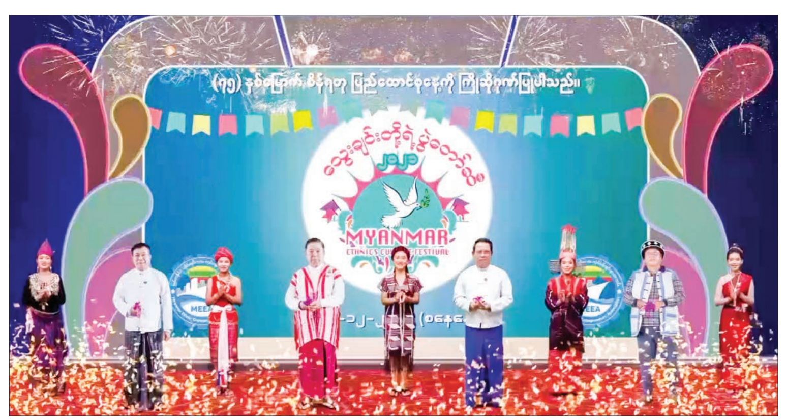
Union Ministers U Saw Tun Aung Myint and U Maung Maung Ohn, Deputy Minister U Zaw Aye Maung and MEEA Chair U Yaw Set virtually cut the ribbon to inaugurate the 3<sup>rd</sup> Myanmar Ethnic Cultural Festival 2021 in Nay Pyi Taw yesterday.

(The full text of the opening address delivered by Chairman of