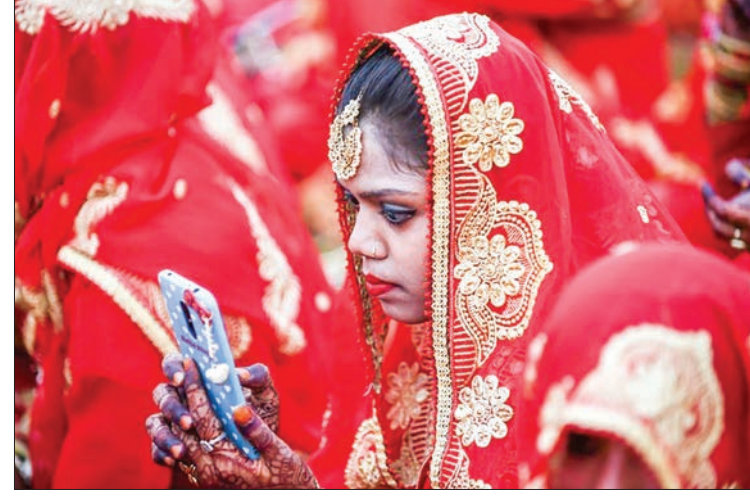
ICANN says the internet could be made much more accessible for people whose languages do not use the Latin alphabet.

These days it's theoretically possible to type an address in more than 150 scripts, including obscure ones like ancient Egyptian hieroglyphs, and watch the page load.