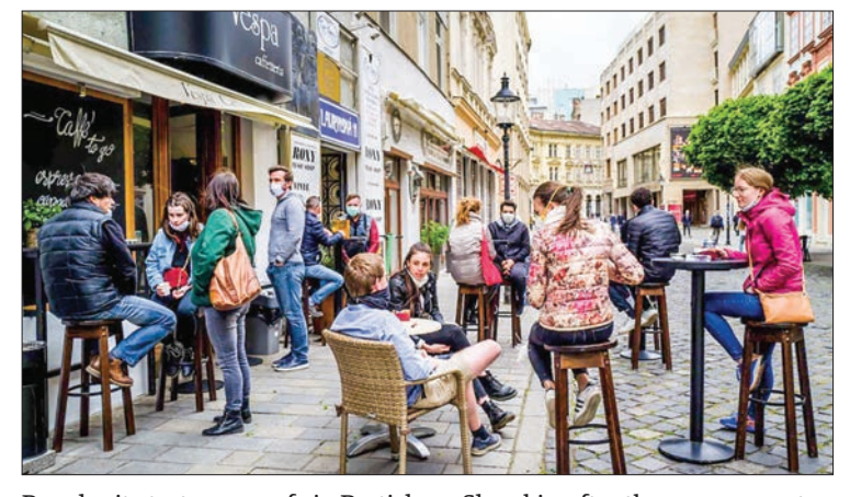
People sit at a terrace cafe in Bratislava, Slovakia, after the government loosened restrictions to contain the coronavirus on 6 May.

THE Slovak government allowed shops, ski resorts and churches to reopen Friday to those who are vaccinated or have recovered from Covid, despite having the highest infection rate in the world. The EU member of 5.4 million people, which went into partial lockdown late last month, registered 1,099 cases per 100,000 people over the past seven days, according to an AFP tally. The decision to ease restrictions came after public criticism of the government's policies over not being able to go Christmas shopping or make plans for the holidays. "The Covid situation is still very seri-