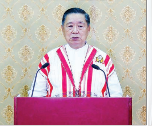
MoEA Union Minister U Saw Tun Aung Myint.