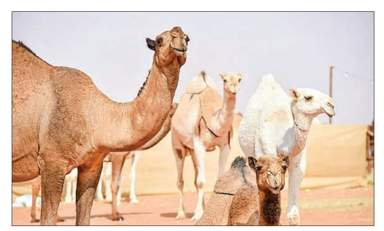
The King Abdulaziz Camel Festival is an annual bedouin event held in the desert northeast of Riyadh that lures breeders from around the Gulf with prize money of up to $66 million.

eant in Saudi Arabia has been hit by a cheating scandal after 43 entrants were disqualified for botox injections and other cosmetic enhancements.