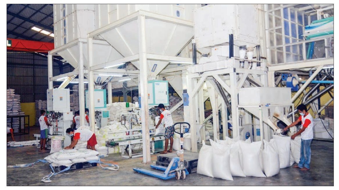
This year, the rice price has been rising steadily since last May, and only the price stabilized in October.

The Pawkywe (80 marks) is priced at K32,500 per bag while the Pawkywe (90 marks) is selling for K33,800 per bag. The price of Eaimahta rice (80