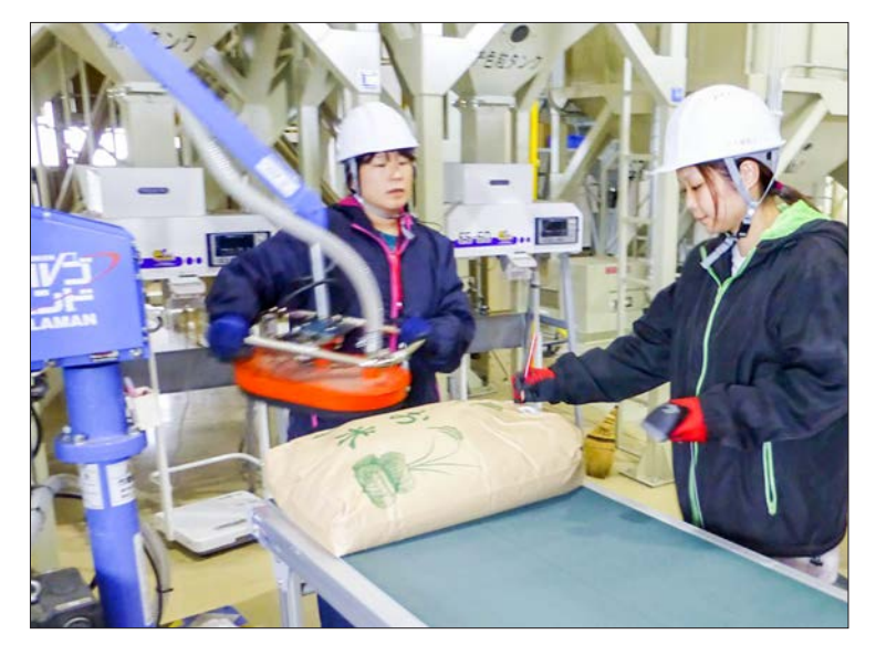
Photo taken on 9 November 2018, shows rice grown in Fukushima being measured for radioactive substances in Kawauchi village in Fukushima Prefecture.

proof of having passed a check for radioactive materials when these products are shipped into Britain. The eight prefectures are Miyagi, Yamagata, Ibaraki, Gunma, Niigata, Yamanashi, Nagano and Shizuoka. If the restrictions are lifted, the certificates of origin now required for these farm products harvested or processed in Japanese prefectures other than the nine will also become unnecessary for exporting to Britain.—Kyodo