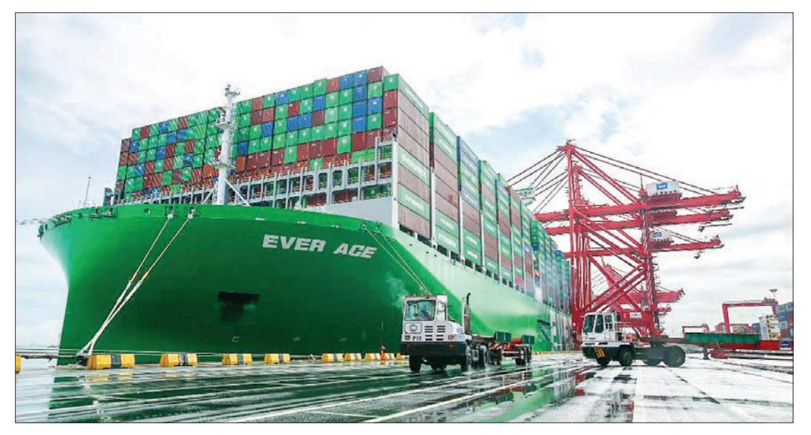
Photo taken on 6 October 2021 shows the world's largest container vessel "Ever Ace" at the Colombo Port in the Sri Lankan capital.

SRI Lankan exporters are optimistic about growth in exports, despite increases in global freight and shipping costs, local media citing a survey reported here Friday. According to data from the bi-annual Export Barometer Survey by the Ceylon Chamber of Commerce (CCC) and the United States Agency for International Development (USAID), 48 per cent of respondents expected moderate to high growth in exports, while 45 per cent expected a moderate to high increase in capacity utilization in the next six months.