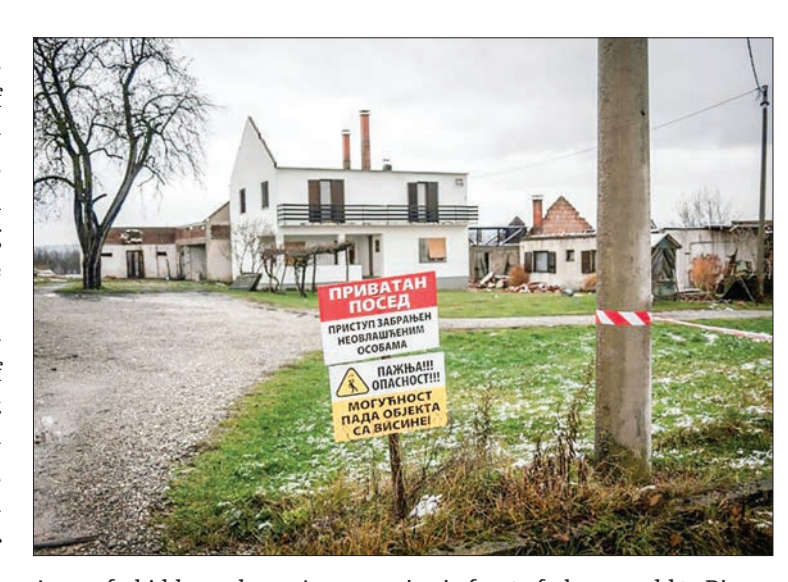
Access forbidden -- danger! warns a sign in front of a house sold to Rio Tinto, which has been paying top dollar to buy property where it wants to mine.

Billions are at stake with Anglo-Australian mining giant Rio Tinto boasting that the project has the potential to add a full percentage point to Serbia's gross domestic product and provide thousands of jobs. In a matter of years, this impoverished corner of Serbia nestled against the Bosnian border could be transformed into one of the industrial engines turbocharging Europe's transition to lower-car-