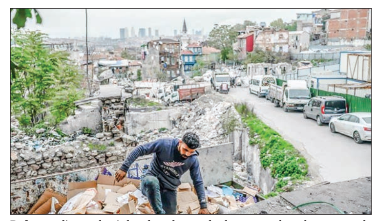
Refugees dig up plastic bottles, glass and other waste they then sort and sell in bulk.

SHROUDED by acrid smoke, a young Afghan crouches sorting waste he has pulled from the trash bins of Istanbul, anxious that Turkey will soon strip him of even this subsistence.