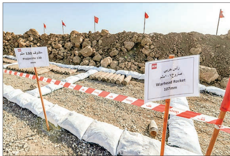
Munitions recovered by Global Clearance Solutions (GCS), a private demining company, near the northern Iraqi hamlet of Hassan-Jalad.

Iraq's successive conflicts have left a deadly legacy, from