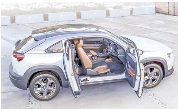
Supplied photo shows Mazda Motor Corp.'s MX-30 Self-empowerment Driving Vehicle that can be driven using hands only. by hand to act as a break and a ring on the steering wheel that can function as an accelerator.

MAZDA Motor Corp. on Thursday began accepting reservations for purchase of a modified SUV that can be controlled solely with the use of hands by drivers who are physically disabled. The MX-30 Self-empowerment Driving Vehicle, a modified version of the MX-30 SUV that is set to be released in January, is equipped with a lever on the left side of the driver that can be depressed