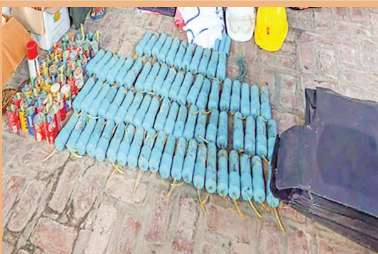
Seized homemade mines.