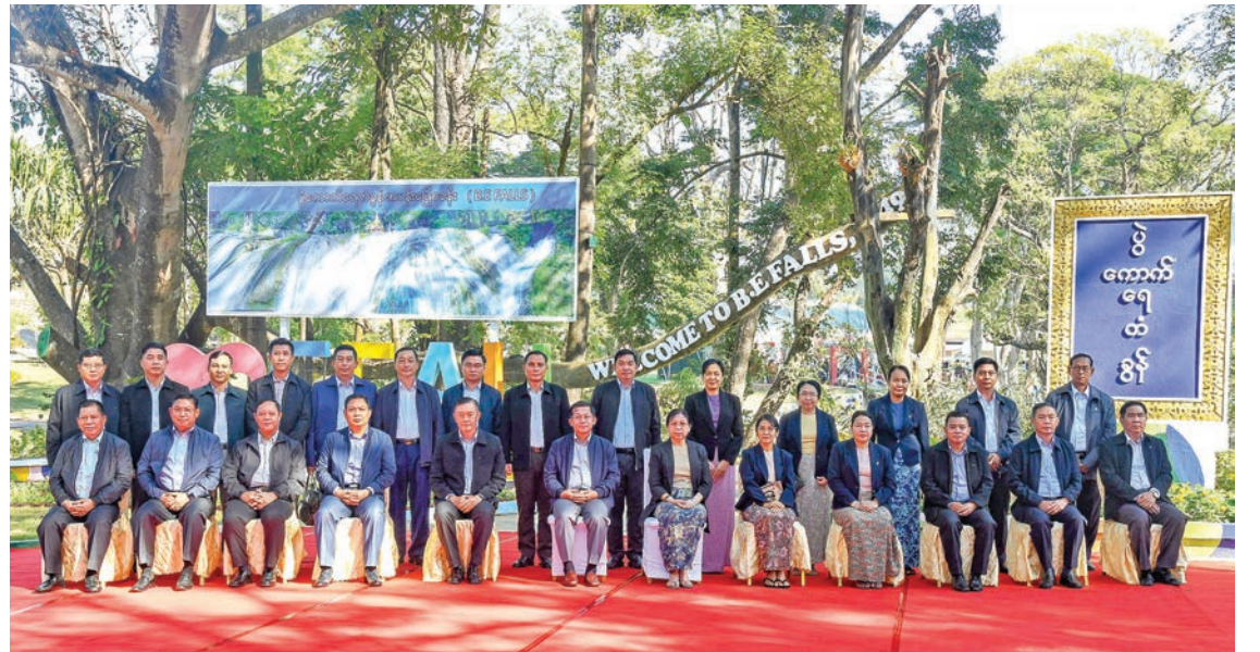
The Senior General and party take the group photo.

The Chairman of the State Administration Council Prime Minister, and party posed for group photo and took a tour of the BE Fall which includes the construction of the world-class LED glass bridge, motorcars