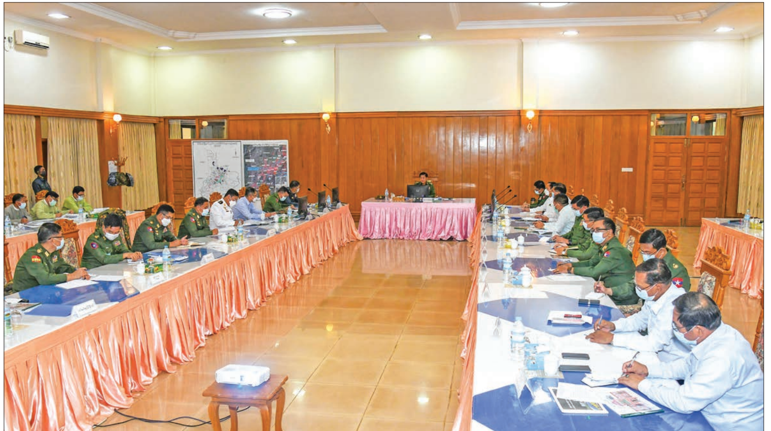
State Administration Council Chairman Prime Minister Senior General Min Aung Hlaing makes the speech at the meeting with the Mandalay Region cabinet members and departmental officials yesterday.

PyinOoLwin must be shaped as a clean city and green city as well as a beautiful city. It is necessary to ensure proper flow of water in the creek which flows from Kandawgyi and Kandawgale in PyinOoLwin and Gelaung Creek. Keeping