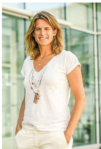
French former world number one Amelie Mauresmo.