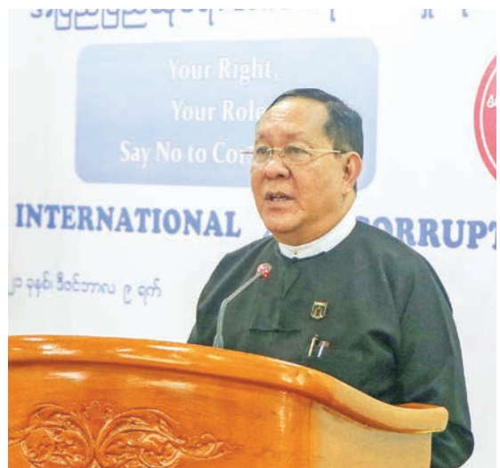
Union Chief Justice U Htun Htun Oo.