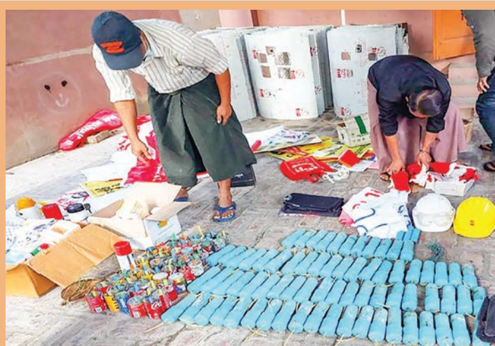
Seized homemade mines and other materials.

and clothes used in protests and Thura Aung mainly provided needed materials, food and accommodation for protestors.