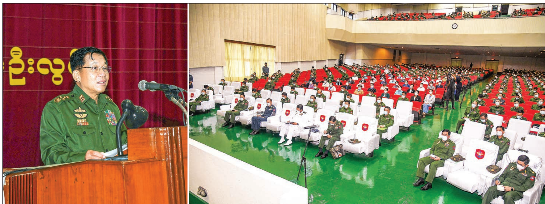
Chairman of the State Administration Council Commander-in-Chief of Defence Services Senior General Min Aung Hlaing addresses the meeting with the commandants of the Defence Services Academy and Defence Services Technological Academy and senior officer instructors in PyinOoLwin on 9 December 2021.

T HOSE qualified instructors at the military academies turning out military leaders must give systematic training combined with their lit-