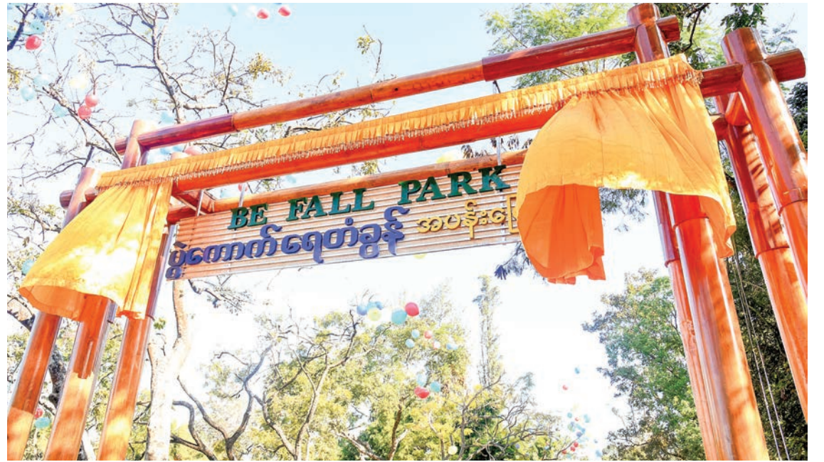
State Administration Council Chairman Prime Minister Senior General Min Aung Hlaing formally inaugurates the upgraded Pwekawk Waterfall Resort (BE Fall) in PyinOoLwin on 9 December 2021.