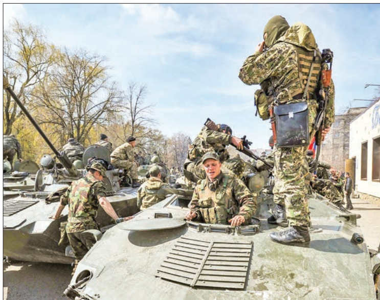
Armed men wearing military fatigues gathered on armoured personnel carriers in the eastern Ukrainian city of Slovyansk in this undated picture.

The Bucharest group comprises Bulgaria, the Czech Republic, Estonia, Hungary, Latvia, Lithuania, Poland, Romania and Slovakia.