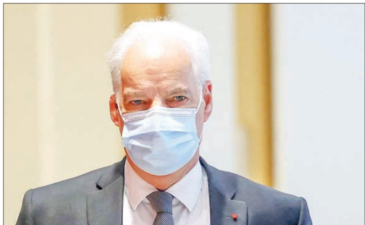
Alain Griset, who worked in the Finance Ministry and oversaw relations with small and medium-sized businesses, was convicted of submitting an incomplete wealth declaration to the government transparency authority.

THE French minister in charge of small and medium-sized companies resigned on Wednesday after being convicted for failing to declare all of his assets.