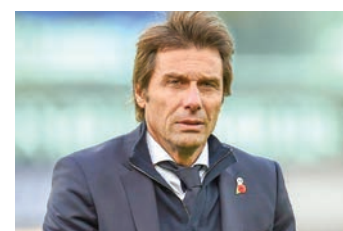
Tottenham manager Antonio Conte.

TOTTENHAM Hotspur announced the postponement of Thursday's Europa Conference League clash with Rennes following a severe coronavirus outbreak at the Premier League club, but their French opponents called into question the decision.