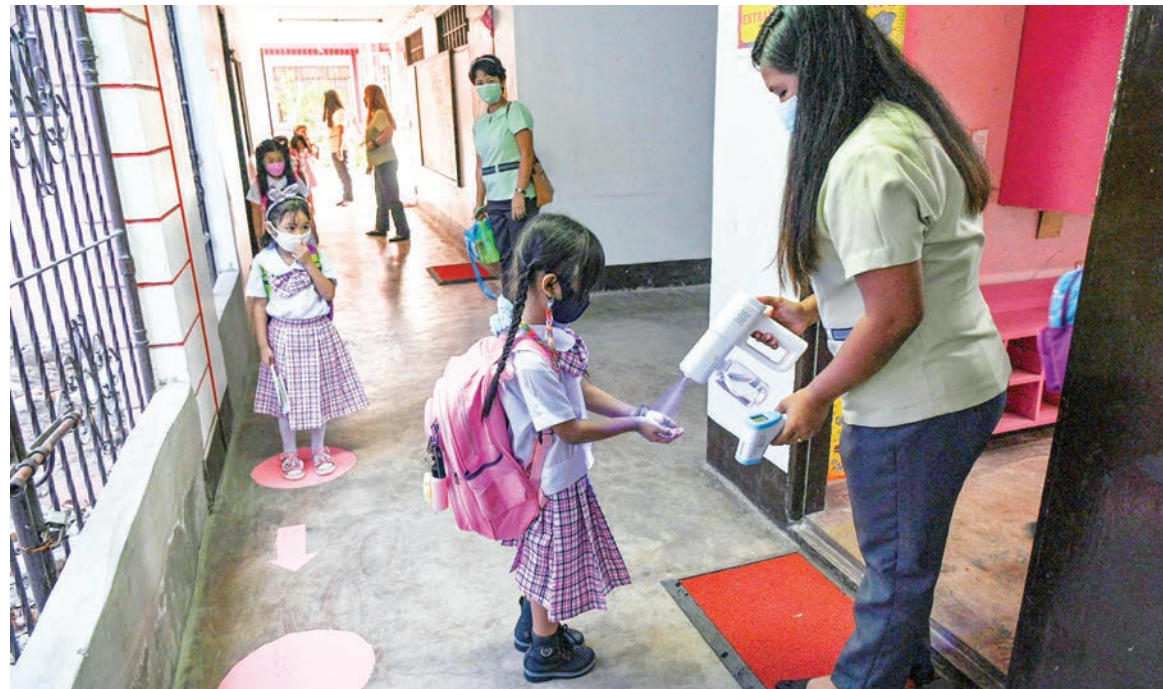
A teacher (R) disinfects and checks the temperatures of students before classes at Ricardo P. Cruz elementary school in Taguig city, suburban Manila on 6 December 2021, after authorities loosened Covid-19 coronavirus restrictions to allow limited in-person classes in the capital city.

Even if it does turn out that Omicron causes less severe disease, Tedros warned against slack-