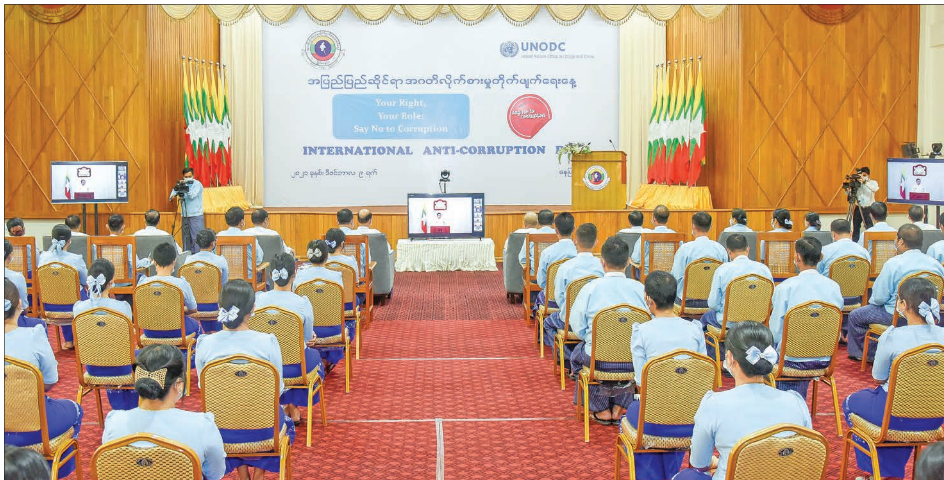
International Anti-Corruption Day 2021 event is underway in Nay Pyi Taw yesterday.