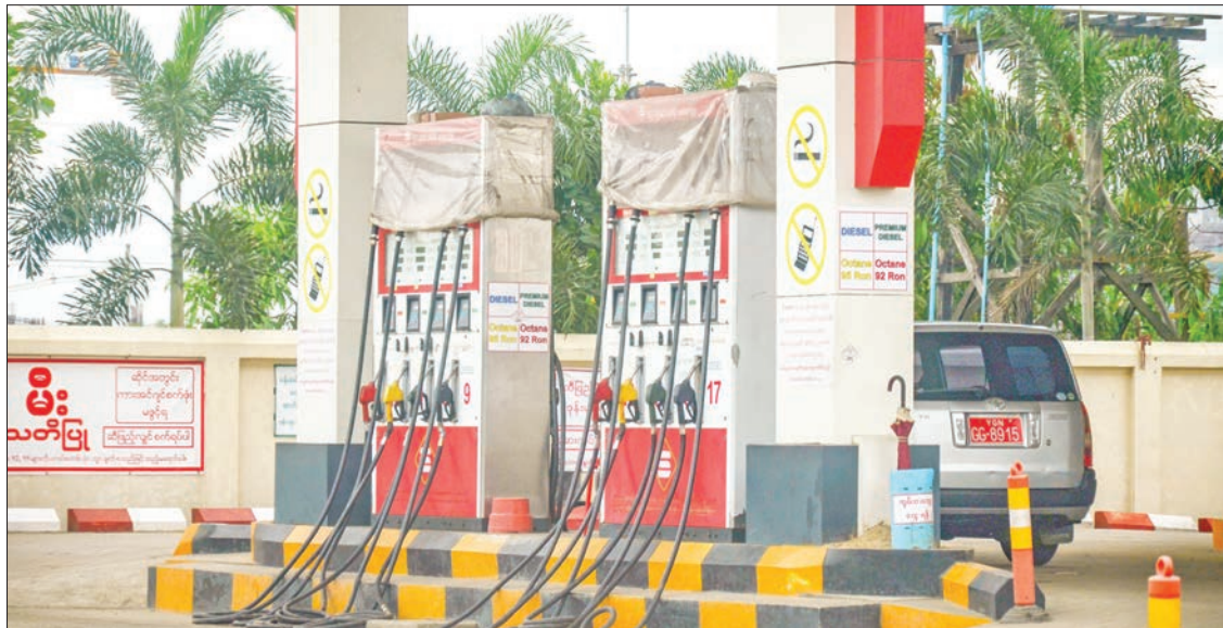
A local fuel filling outlet in Yangon.

The consumers can complain about overcharging for fuel