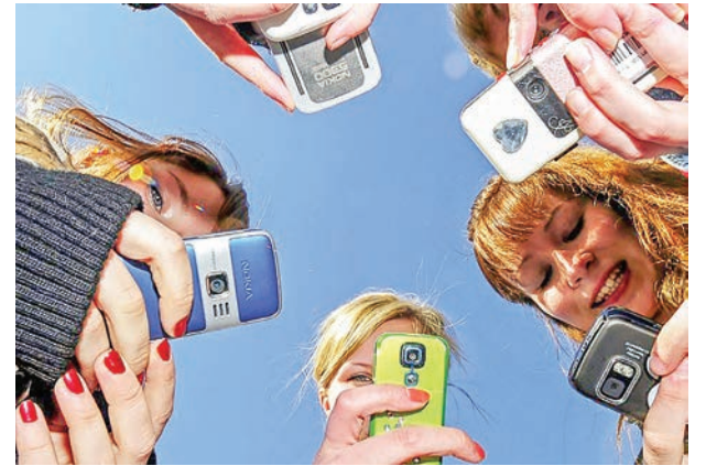
The European Union's abolition of roaming fees has been one of the bloc's most popular initiatives.

rotating presidency. "The 'roam like at home' policy has made communication easier and cheaper whenever people are travelling in Europe," said Slovenia Public Administration minister Bostjan Koritnik. He called it one of the EU's "greatest success stories".—AFP ■