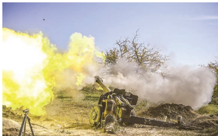
An Armenian soldier fires artillery on the front line on 25 October 2020, during the ongoing fighting between Armenian and Azerbaijani forces over the breakaway region of Nagorno-Karabakh.

Nagorno-Karabakh is an ethnic Armenian region of Azerbaijan that broke away from Baku's control in the early 1990s after the collapse of the Soviet Union.—AFP ■