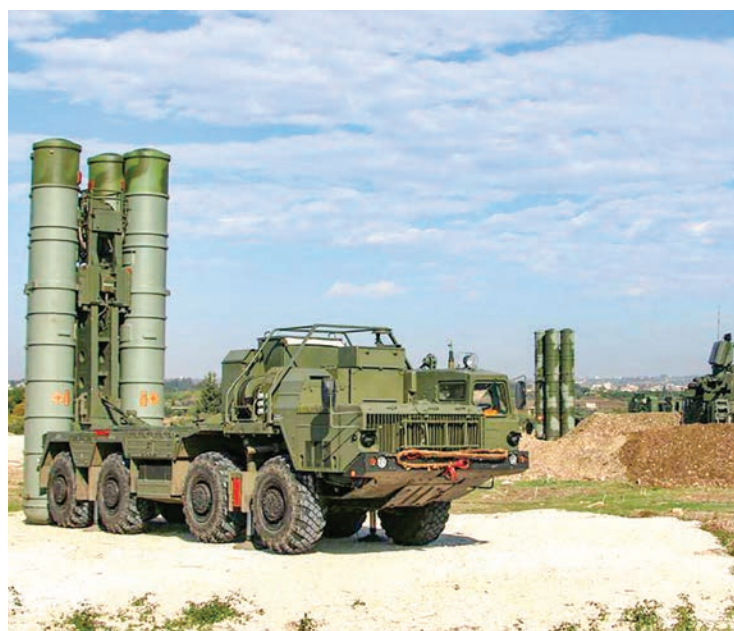
Russia's S-400 air defence missile systems at the Hmeimim air base in the Syrian province of Latakia.

The deal has been implemented. We witnessed at times on part of the United States to undermine this cooperation and to make India obey US orders to follow American vision to how this region should develop, and our Indian friends clearly and firmly explained that they are a sovereign country and they will decide whose weapons to buy and who is going to be a partner of India in this and other areas," Lavrov said.—ANI ■