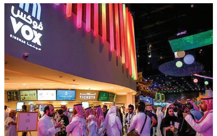
Saudi Arabia only allowed cinemas to reopen in 2018 after a decades-long ban.

"The thought of organising a film festival in Saudi Arabia was unimaginable just five years ago," said Egyptian art critic Mohamed Abdel Rahman.—AFP ■