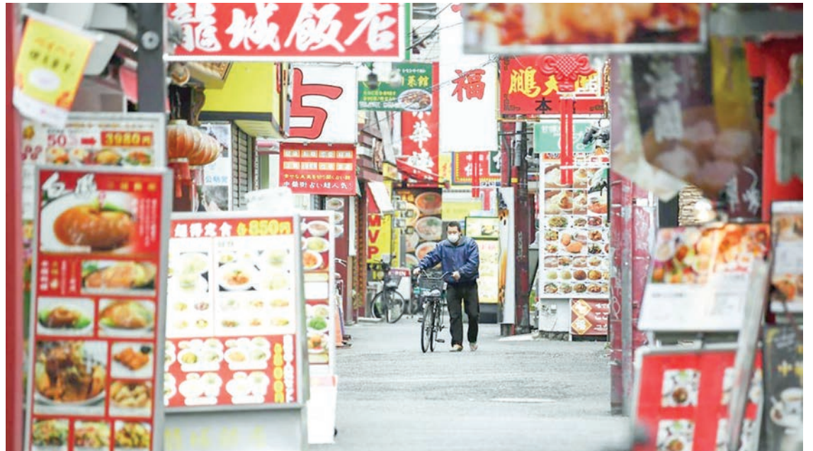
Expenditure on food, including on eating out, fell 0.9 per cent for the third straight month of decrease, as people bought less seafood, meat and vegetables to cook at home. A man walks a bicycle through an almost empty street in Yokohama, near Tokyo, on Sunday afternoon.

By component, spending on furniture and household amenities such as tables, sofas and washing machines dropped 16.7 per cent from a year earlier as purchases were lifted last year by the 100,000 yen per person cash handouts aimed at easing