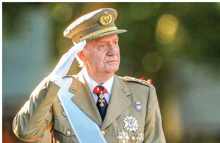
Lawyers for Spain's former king Juan Carlos I are arguing he has immunity from English courts in a civil case brought by his former lover.

SPAIN'S former king Juan Carlos I is seeking immunity from the English courts after his ex-lover accused him of spying on and harassing her, a London court was told on Monday.