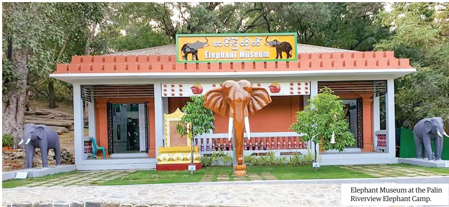
Elephant Museum at the Palin Riverview Elephant Camp.