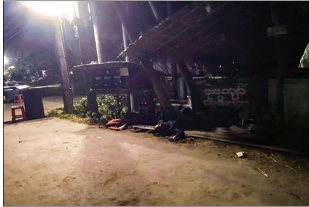
Attack on the police outpost in Kawhmu Township.

Similarly, at about 3:30 am yesterday, terrorists attacked Kan Kaung police outpost beside the Yangon-Mandalay Expressway in Meiktila Township of Mandalay Region using grenades and homemade bombs.