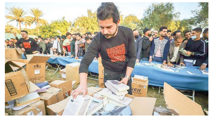
Volunteers at the 'I am an Iraqi, I read' festival in Baghdad listened to requests and distributed books to visitors for free.

Galleries have opened and festivals have blossomed, attracting crowds eager to make up for lost time. The Gallery opened its doors barely a month ago, but visitors queue around the corner on opening night of any show.—AFP ■