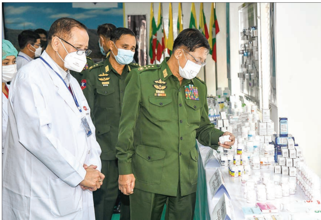
The Senior General views the medicines manufactured by the Myanmar Pharmaceutical Factory (PyinOoLwin).

the factory, the Senior General underlined the need for manufacturing and distribution of quality medicines and for raising the public awareness on side effects of combined drugs easily used by the people.