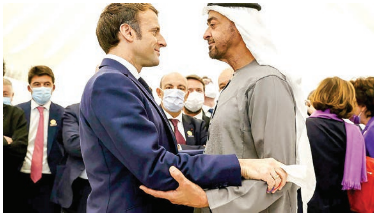
French President Emmanuel Macron (L) is greeted by Abu Dhabi's Crown Prince Mohammed bin Zayed al-Nahyan in Dubai on the first day of his Gulf tour, before the signing of the arms deal.