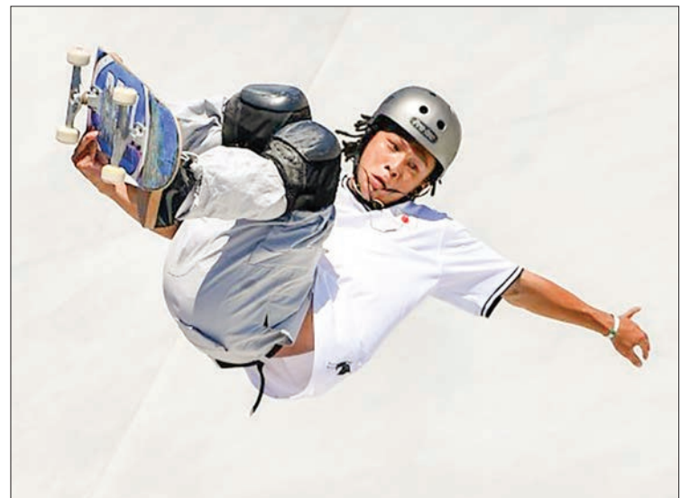
Japan's Ayumu Hirano became a dual Olympian when he competed in the skateboard park event at the Tokyo Games this year.

Hirano made his Olympic debut as a 15-year-old at the 2014 Sochi Games, finishing second behind Iouri "iPod" Podladtchikov in the snowboard halfpipe. He claimed silver again in Pyeongchang four years later, losing out to American legend Shaun White for gold.