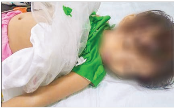
A child is dead due to a bomb blast by terrorists.

A five-year-old girl was killed in a grenade attack by terrorists in Chanmyathazi Township, Mandalay Region.