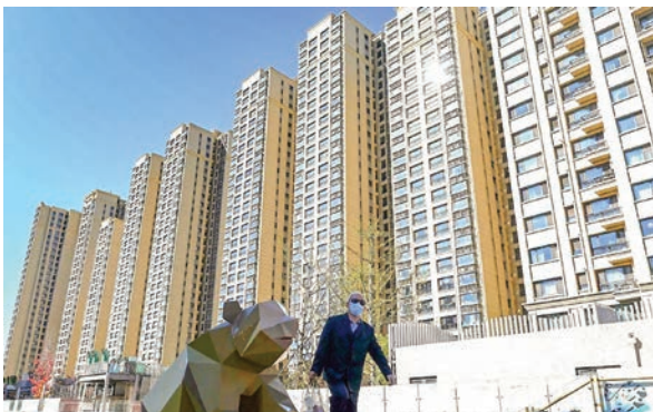
Evergrande is China's second-largest developer by volume. A housing complex in Beijing developed by China Evergrande Group, on 21 October 2021.

poised to take a leading role in the restructure, analysts told AFP. Evergrande, with a debt pile of over $300 billion, is the most prominent firm to have buckled under the crackdown, but others have also suffered. The real estate industry is a top growth driver for the world's second biggest economy and the debt crisis has raised fears of a spillover into other key sectors.—AFP ■