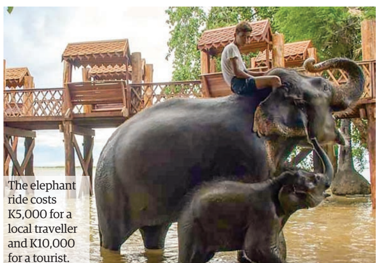
The elephant ride costs K5,000 for a local traveller and K10,000 for a tourist.

There are seven elephants at Palin Riverview Elephant Camp. Myanmar implemented elephant-based tourism, developed eco-tourism sites and opened elephant camps near rivers and mountain ranges.