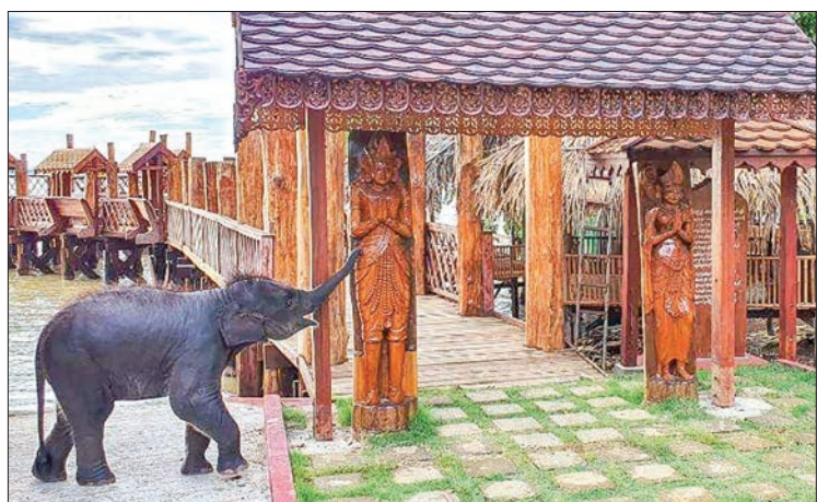
The Elephant Riverview Camp officially began on 28 March 2018, and about 22 elephant camps have been opened in states and regions so far to reinforce the connection between the humans and animals.