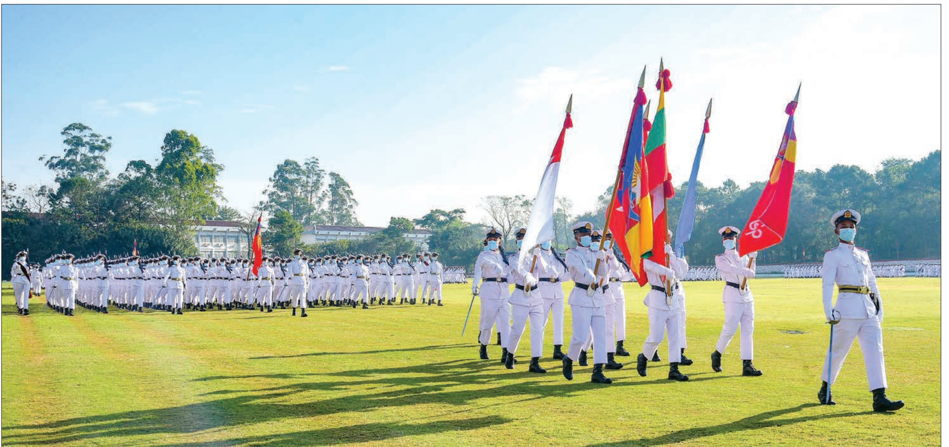
State Administration Council Chairman Commander-in-Chief of Defence Services Senior General Maha Thray Sithu Min Aung Hlaing takes the salute of the cadet companies at the DSA parade ground in PyinOoLwin on 7 December 2021.