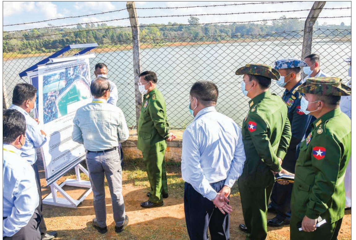
The Senior General inspects the maintenance works of Kandawgyi Lake.