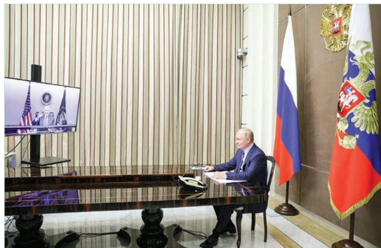
Russian President Vladimir Putin attends a meeting with US President Joe Biden via a video call in the Black Sea resort of Sochi on 7 December 2021.

Moscow calls invasion talk “hysteria”. Instead, Putin intends to tell Biden that he sees Ukraine's growing alliance with Western nations as threat to Russian security — and that any move by Ukraine to join NATO would be crossing a red line. — AFP ■