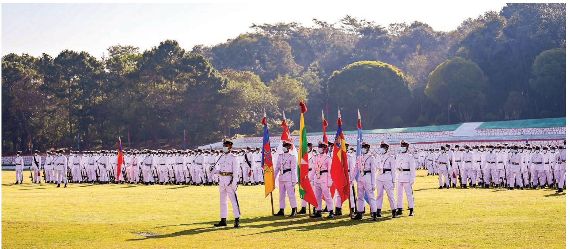
State Administration Council Chairman Commander-in-Chief of Defence Services Senior General Maha Thray Sithu Min Aung Hlaing addresses the cadet company at the DSA parade ground in PyinOoLwin on 7 December 2021.

As the State and the Tatmadaw turned out those cadets to become good leaders in the future, they have to dutifully serve their assignments with loyalty based on training from the DSA and control themselves so as to repay the debt of gratitude to the State and the Tatmadaw. They themselves need to uplift their lives for meeting the goals. They all have to be loyal to the State and the Tatmadaw as well as their families along their lives applying the good practices. — MNA