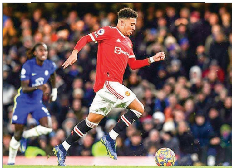
Jadon Sancho's move from Borussia Dortmund to Manchester United led to a profit for Bundesliga clubs in the latest transfer window.