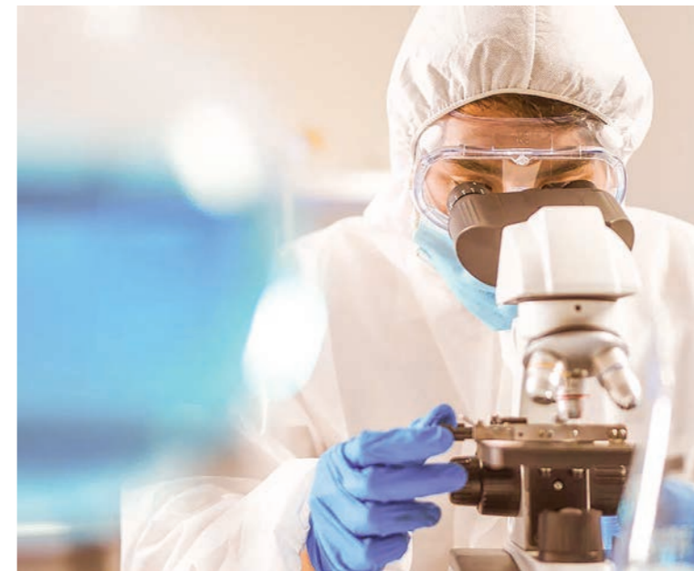
Scientists are able to target certain variants for detection, researchers said.

In this application, researchers printed fluorescent human ACE2 proteins - the cellular targets of the virus's infamous spike protein - on a slide. They also printed spike proteins specific