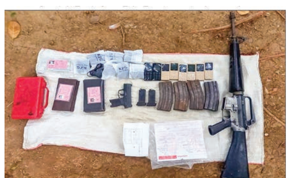
Seized weapons and ammunition in Ngaputaw Township on 5 December 2021.