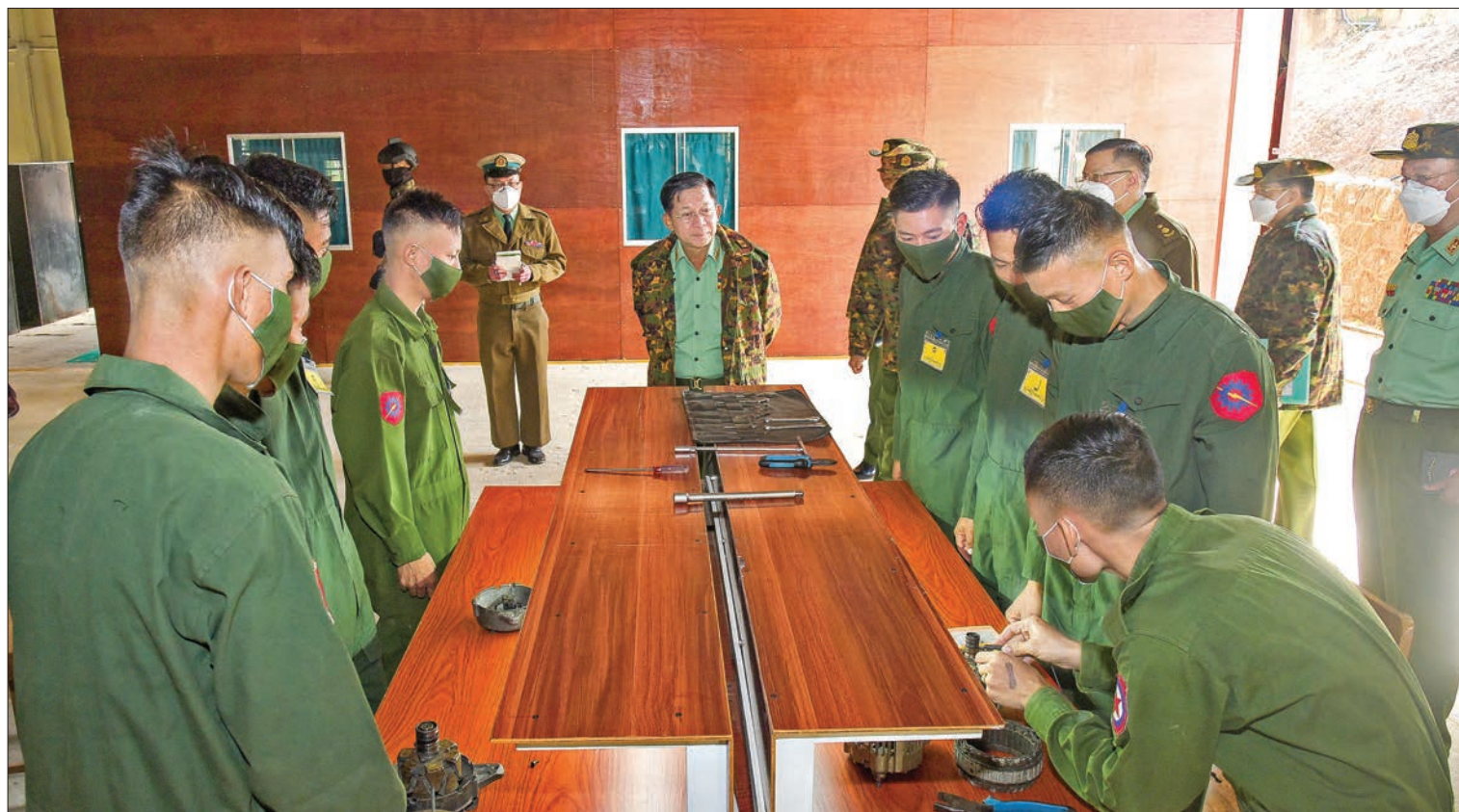
State Administration Council Chairman Commander-in-Chief of Defence Services Senior General Min Aung Hlaing views the practical works of the trainees with the use of teaching aids at the local mechanical engineering school in PyinOoLwin yesterday.