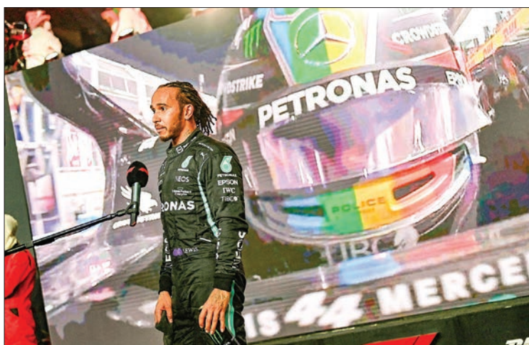
Mercedes' British driver Lewis Hamilton speaks to the press after winning the Formula One Saudi Arabian Grand Prix at the Jeddah Corniche Circuit in Jeddah on 5 December 2021.

LEWIS Hamilton kept his hopes of an eighth world championship title alive with a thrilling victory