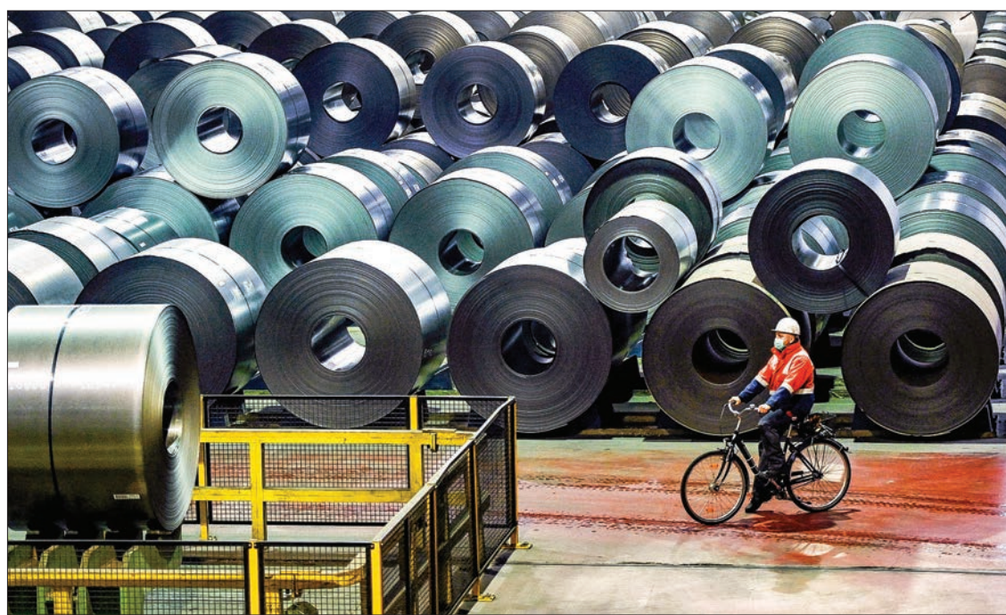
An employee cycles past cold-rolled steel on coils in a hall at the ThyssenKrupp plant in Duisburg, western Germany on 16 November 2021. PHOTO: AFP

Wearing a traditional Chinese dress known as a hanfu, passing from one stand to another with her phone at the end of a cane, the 32-year-old has racked up around 60,000 subscribers. — AFP ■