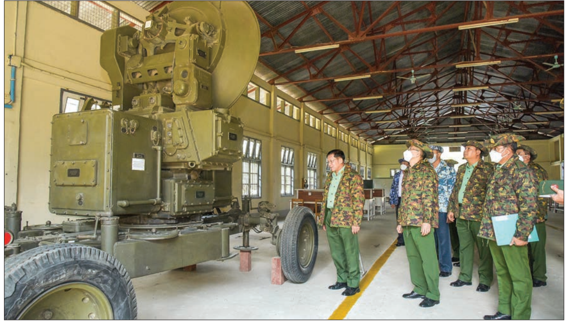
The Senior General inspects the mechanical engineering school yesterday.

Next, the Senior General cordially conversed with the trainees in the training process and inspected progress in extending the buildings to upgrade the training school. — MNA