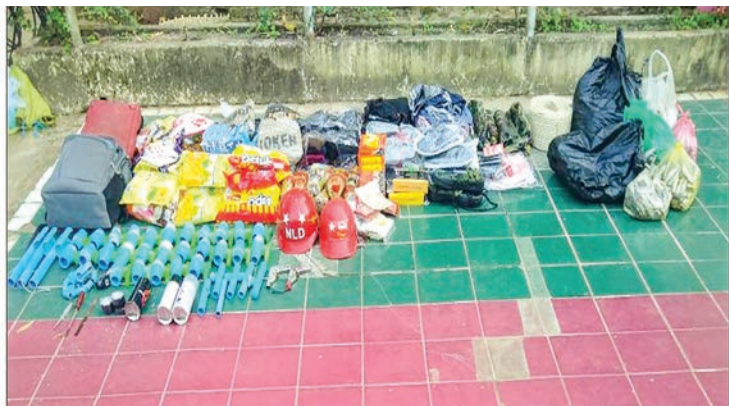
Seized explosives and related items in Pathein Township on 2 December 2021.

It is reported that actions will be taken against them under the law, and the people are requested to work together for the peace and stability of the country by secretly reporting any movement or information of the terrorists and that they will be rewarded, according to the MPF. — MNA