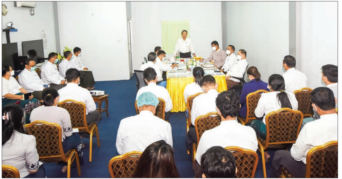
The MoI Union minister provides guidance to the staff of The Global New Light of Myanmar newspaper yesterday.

forts of MRTV for broadcasting modern, active and interesting