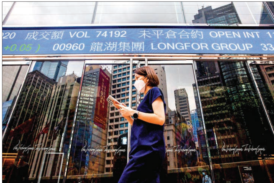
A woman walks past a digital sign showing stock market information in the Central district of Hong Kong on 5 November 2021.

Tracking virus fears — as well as signs of a looming hawkish shift in