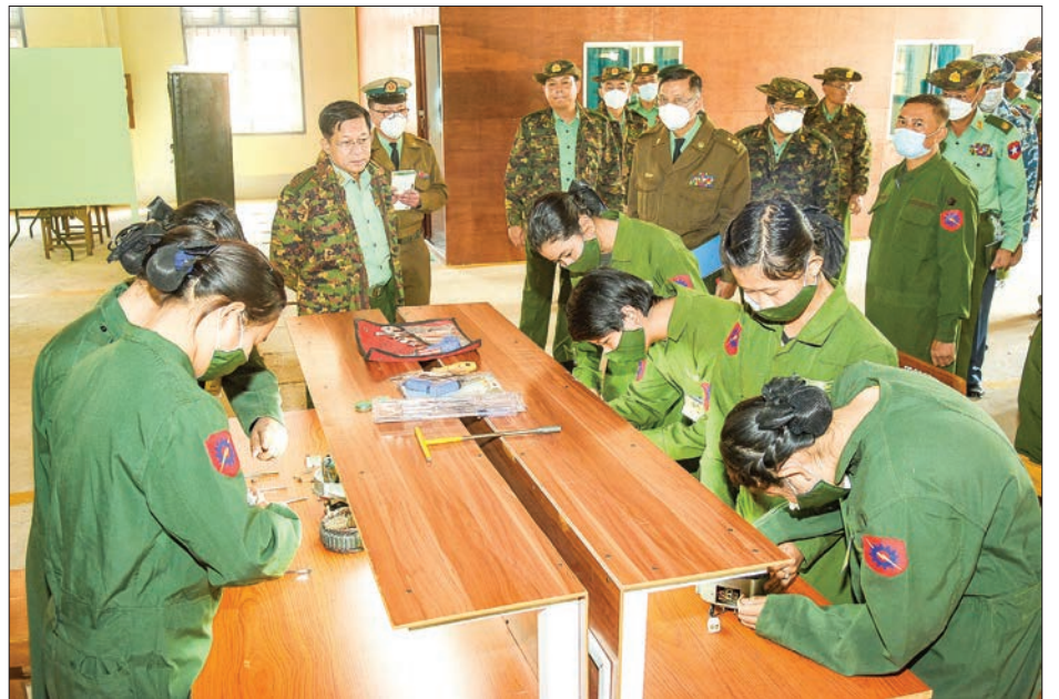
The Senior General views the practical works of trainees with the use of teaching aids.