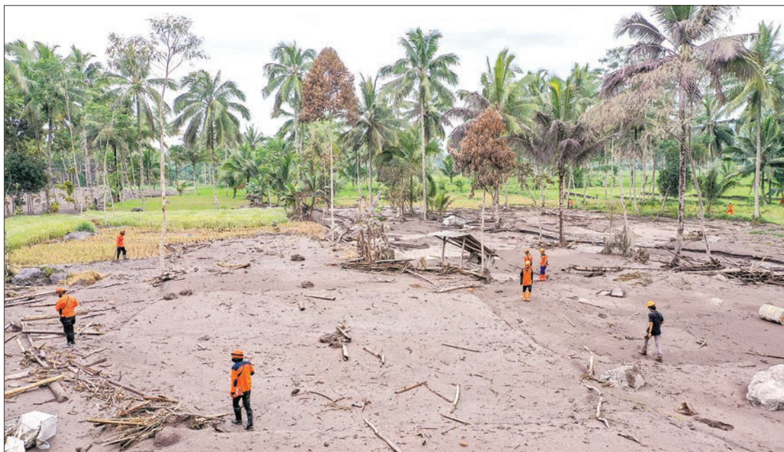
This aerial picture shows members of a search and rescue team (orange and green) conduct a search operation for missing people at the Sumberwuluh village on 6 December 2021 in Lumajang following a volcanic eruption from Mount Semeru that killed at least fourteen people.

"I'm still hoping my son will be found... Every time I hear victims have been found, I hope it