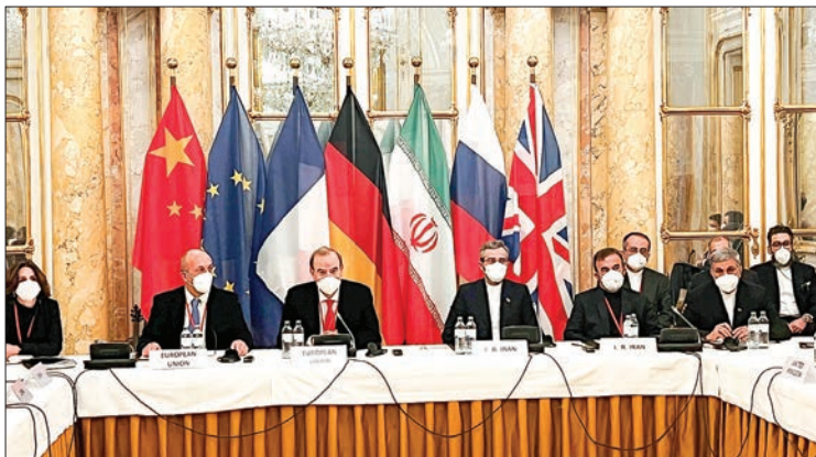
This handout photo taken and released on 3 December 2021 by the EU delegation in Vienna shows representatives from Iran (R) and the European Union (L) attending a meeting of the joint commission on negotiations aimed at reviving the Iran nuclear deal in Vienna, Austria.

The landmark 2015 nuclear accord was initially agreed between Iran and Britain, China, France, Germany, Russia and the United States. — AFP ■