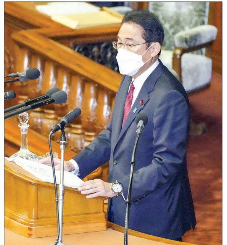
Prime Minister Fumio Kishida delivers his policy speech at the House of Representatives chamber in the parliament in Tokyo on 6 December 2021.

Kishida also reiterated his government will short-