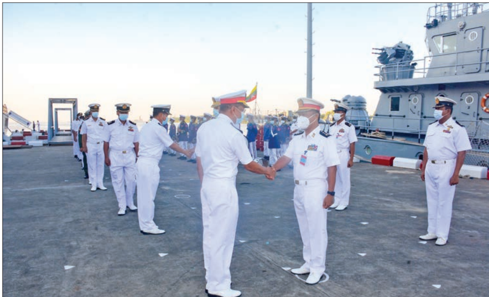
Warship Kyansittha arrives back in Yangon.