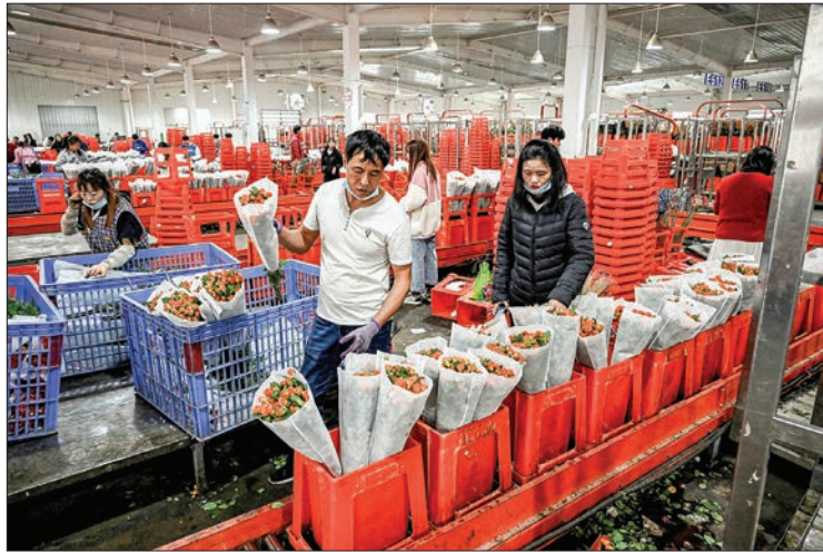
This photo taken on 22 October 2021 shows employees sorting flowers in a warehouse at the Dounan Flower Market in Kunming in southwestern China's Yunnan province. Demand for cut flowers has soared in China as standards of living have risen, with the southern province of Yunnan at the epicentre of that boom thanks to its all-year mild climate.

yuan (6.25 dollars) for those that order right away," the 23-year-old says — a sales pitch she hones for eight hours a day delivered at lightning speed.