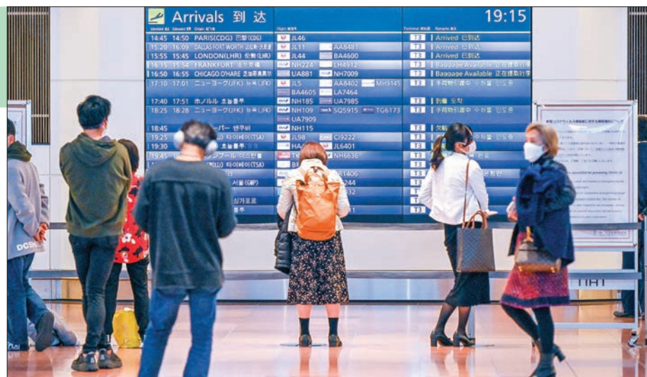
People stand in front of an arrivals board at Tokyo's Haneda international airport on 1 December 2021, as Japan suspended all new flight bookings into the country in response to the Omicron Covid variant.

The Omicron variant has already been detected in dozens of countries including the United States, Australia and parts of Europe since being first reported by South Africa last month. — Kyodo ■