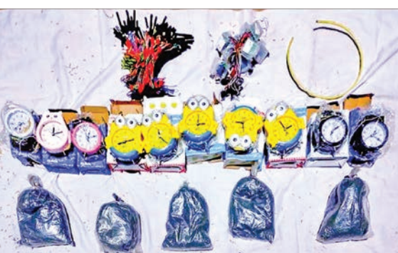
Confiscated explosives in Pathein on 4 December 2021.