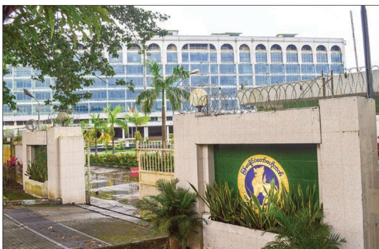
The Central Bank of Myanmar (CBM).

The domestic consumption of edible oil is estimated at 1 million tonnes per year. The local cooking oil production is just about 400,000 tonnes. To meet the self-sufficiency in the domestic market, about 700,000 tonnes of cooking oil are yearly imported. — NN/GNLM