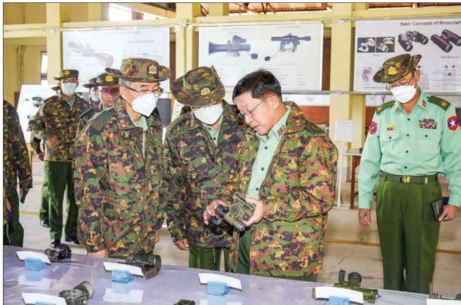
The Senior General looks into the teaching aids.