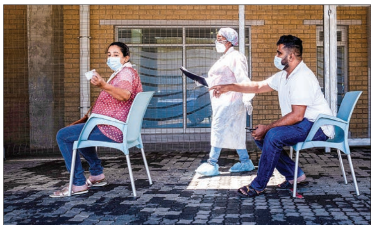
People queue for a PCR Covid-19 test at the Lancet laboratory in Johannesburg on 30 November 2021.

SOUTH African President Cyril Ramaphosa on Monday urged citizens to get vaccinated as the country battles an unprecedented surge in cases driven by the new Omicron variant. The number of daily infections rose five-fold in the space of a week, from 2,828 on 26 November to 16,055 last Friday.