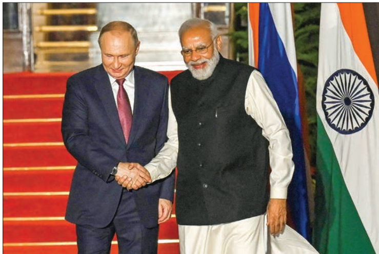
India's Prime Minister Narendra Modi (R) greets Russian President Vladimir Putin before a meeting at Hyderabad House in New Delhi on 6 December 2021.

In its efforts to address a rising China, Washington has set up the QUAD security dialogue with India, Japan, and Australia, raising concerns in both Beijing and Moscow. India was close to the Soviet Union during the Cold War, a relationship that has endured, with New Delhi calling it a "special and privileged strategic partnership". "The friendship between India and Russia has stood the test of time," Modi told Putin at a virtual summit in September. "You have always