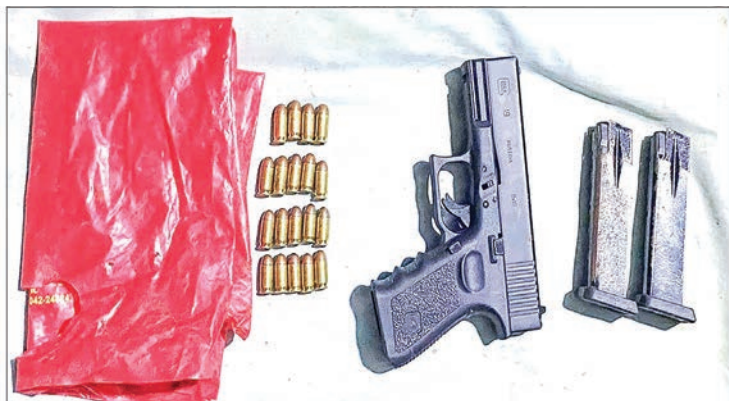
Seized weapons and ammunition in Pathein Township on 4 December 2021.