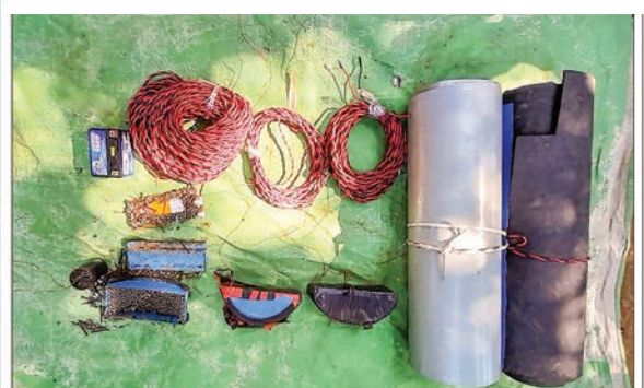
Confiscated items in Ngaputaw Township on 5 December 2021.