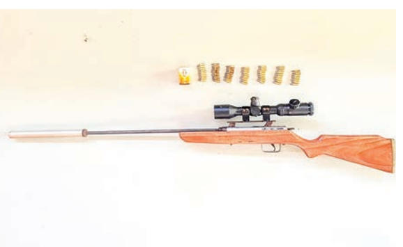
Seized firearms and ammunition in Pathein on 5 December 2021.