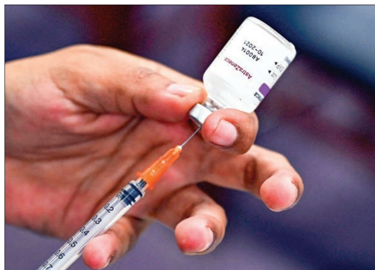
A health worker prepares a dose of the AstraZeneca/Oxford Covid-19 vaccine in Santa Cruz, Bolivia on 18 October 2021, as the country began giving third doses to all health workers, adults over 60 and people with underlying diseases.

It is significantly cheaper and easier to deliver than others, and is credited with increasing vaccine access in poorer countries. — AFP ■