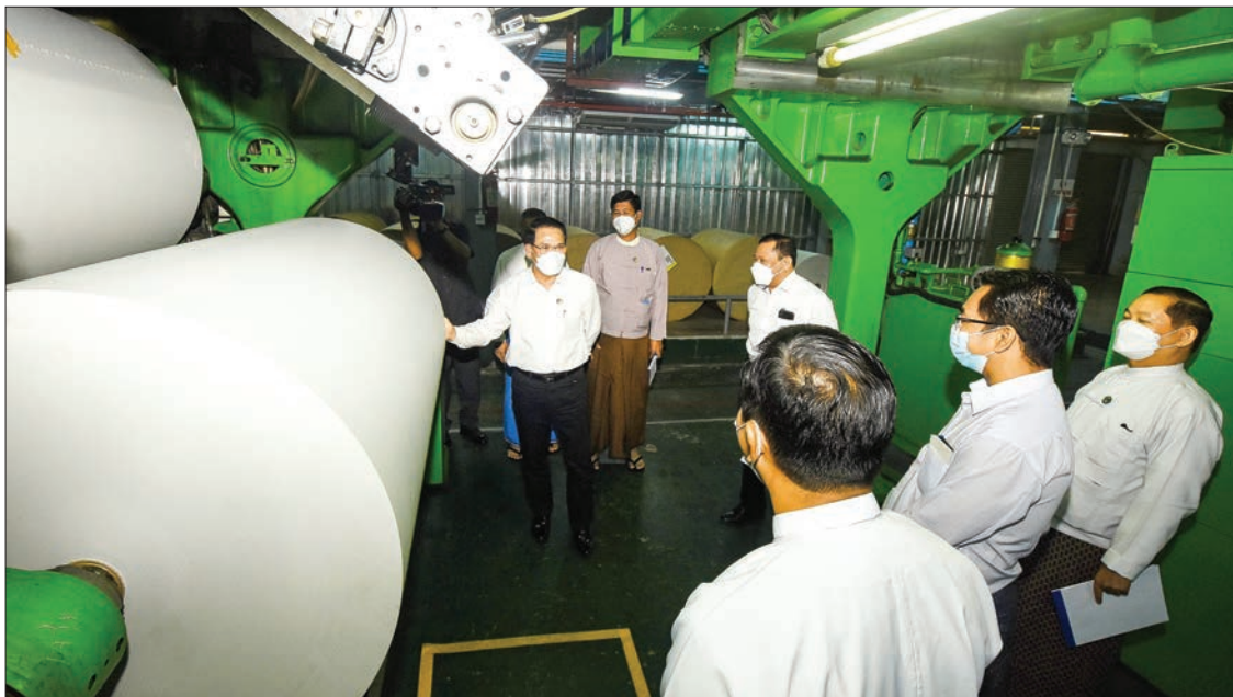
The MoI Union minister inspects the newspaper printing machine of The Global New Light of Myanmar.

The News and Periodicals Enterprise runs state-owned daily newspapers The Myanmar Alinn and The Mirror and The Global New Light of Myanmar newspaper, a joint venture with a private company. —MNA