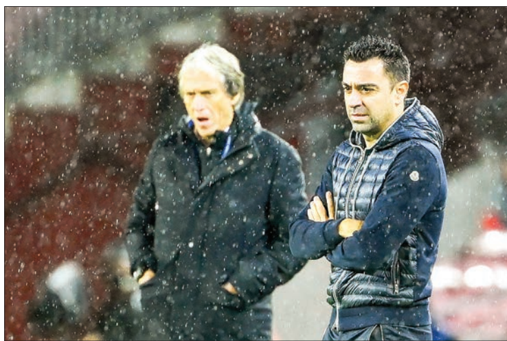
Barcelona's Spanish coach Xavi (R) attends the UEFA Champions League Group E football match between FC Barcelona and SL Benfica, at the Camp Nou stadium in Barcelona on 23 November 2021.