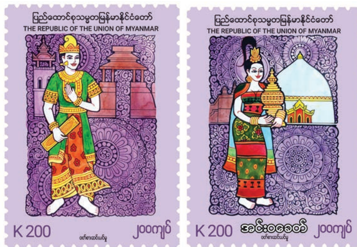
New postage stamps.

IN a bid to portray Myanmar's cultural heritage, rediscover the traditional costume of men and women from generation to generation and draw the attention of the youth, Myanmar Post under the Ministry of Transport and Communications will issue two new postage stamps (worth K200 each) at 9:30 am on 8 December 2021 (5 th Waxing of Nadaw 1383 ME), depicting the costumes of men and women in Inwa era. The new series will be sold at Central Post Office in Nay Pyi Taw, General Post