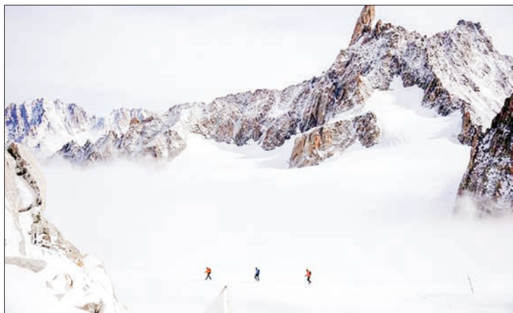
Three climbers walk at an altitude of 3400 metres on 11 September 2013 near the Dent du Géant (Giant's tooth), in the Mont Blanc massif in France and Italy.

"The stones have been shared this week" in two equal lots valued at around 150,000 euros ($169,000) each, Chamonix mayor Eric Fournier told AFP.