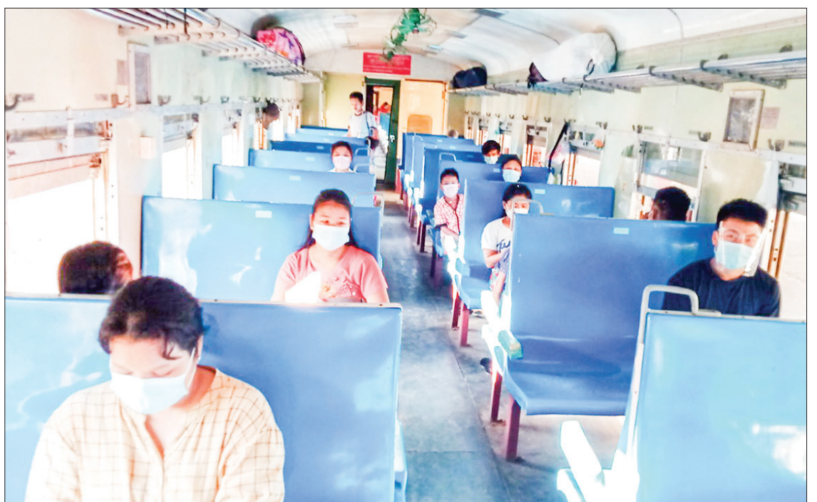
Passengers take a seat aboard carriage of train being run by Myanmar Railways as usual.

MR currently runs the passenger trains and cargo trains, and will extend the train routes depending on the increasing numbers of passengers and cargos.—MNA