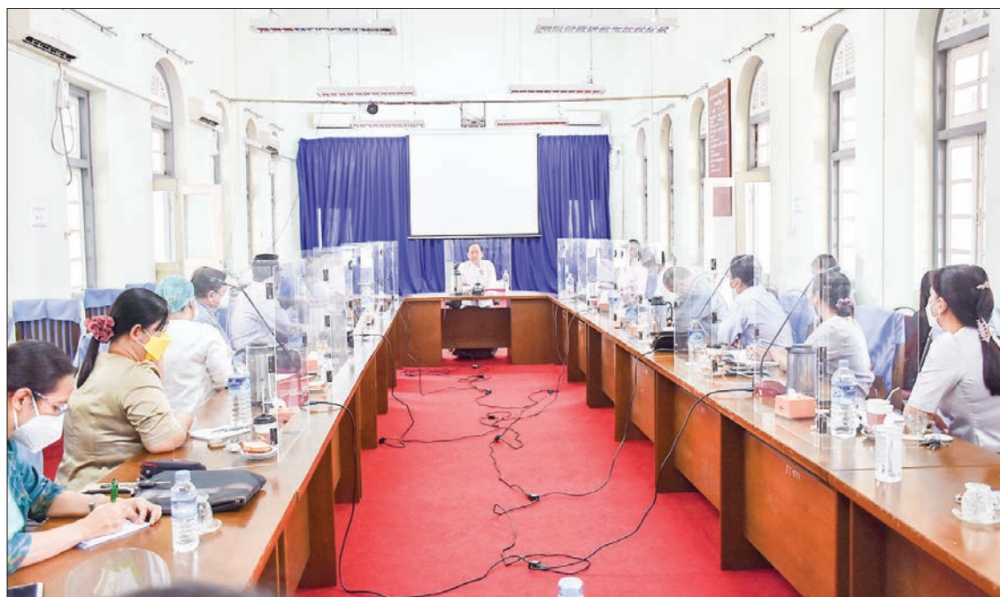
Union Minister Dr Thet Khine Win meets officials of General Specialty Hospital (500-bed) in Yangon.

UNION Minister for Health Professor Dr Thet Khine Win inspected the General Specialty Hospital (500-bed) in