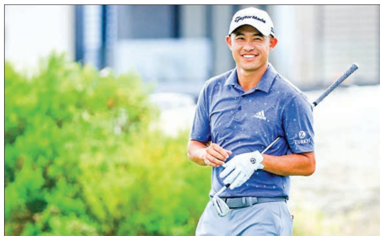
World number two Collin Morikawa seized the lead after Saturday's third round of the Hero World Challenge in the Bahamas.

Reigning British Open champion Morikawa, who got engaged earlier in the week, can