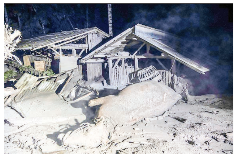
The eruption left at least 11 villages coated in volcanic ash, submerging houses and smothering livestock.

bridge in Lumajang and prevented rescuers from immediately accessing the area and those trapped in shelters.