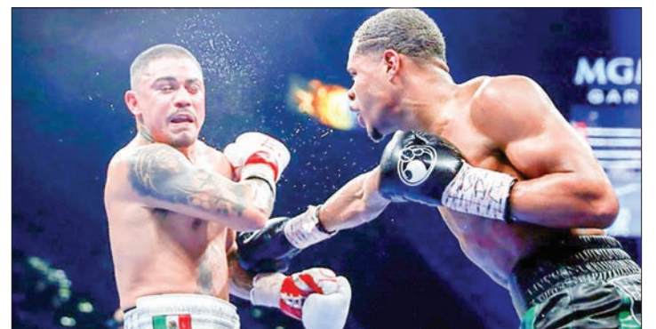
WBC 135-pound champion Devin Haney (right) punches Joseph Diaz in a title fight at MGM Grand Garden Arena in Las Vegas.

Haney proved to be too fast and too skilled for fellow American Lopez, who constantly moved forward but lacked an effective jab and didn't take advantage during the few moments he had Haney covering up. The 29-year-old Diaz came on strong in the 12th but by then it was too late as Haney had already won the majority of the rounds. Two judges scored it 117-111 and the third had it 116-112 for Haney.—AFP ■