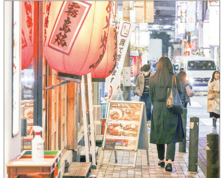
People walk along a street filled with restaurants and bars in Tokyo's Shimbashi area on 3 December 2021.

With concerns about a potential sixth wave of infections remaining strong, 70.4 percent of 8,174 firms that responded to a survey said they would not hold end-of-year or New Year parties regardless of whether a state of emergency or other COVID-19 measures are in place. — Kyodo ■