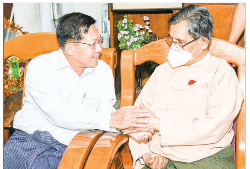
Chairman of State Administration Council Prime Minister Senior General Min Aung Hlaing cordially greets former Commander-in-Chief of Defence Services Patron of the National League for Democracy (NLD) former General U Tin Oo.