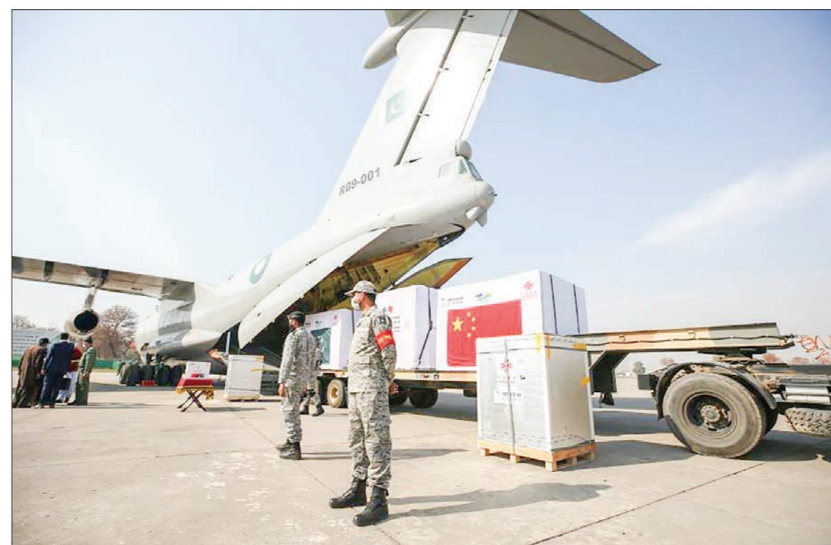
A handover ceremony of a batch of China-donated COVID-19 vaccine is held at Noor Khan Air Base near Islamabad, Pakistan, 1 February 2021.

It has already completely vaccinated nine out of 10 of its people.