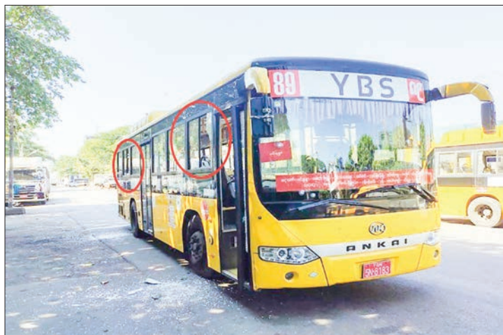
Damaged parts are seen at YBS buses in homemade mine blast in Kyimyindine Township on 5 December.

A homemade mine exploded at the corner of Panbingyi road and upper Kyimyindine road in Makyeetan (South/West) Ward in Kyimyindine Township of Yangon Region yesterday.