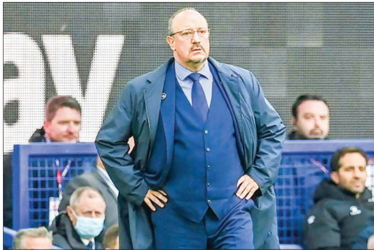
Everton manager Rafael Benitez is under pressure after a 4-1 thrashing by Liverpool.

IF any Everton manager could ill afford the club's worst home defeat to Liverpool for 39 years, it was Rafael Benitez.