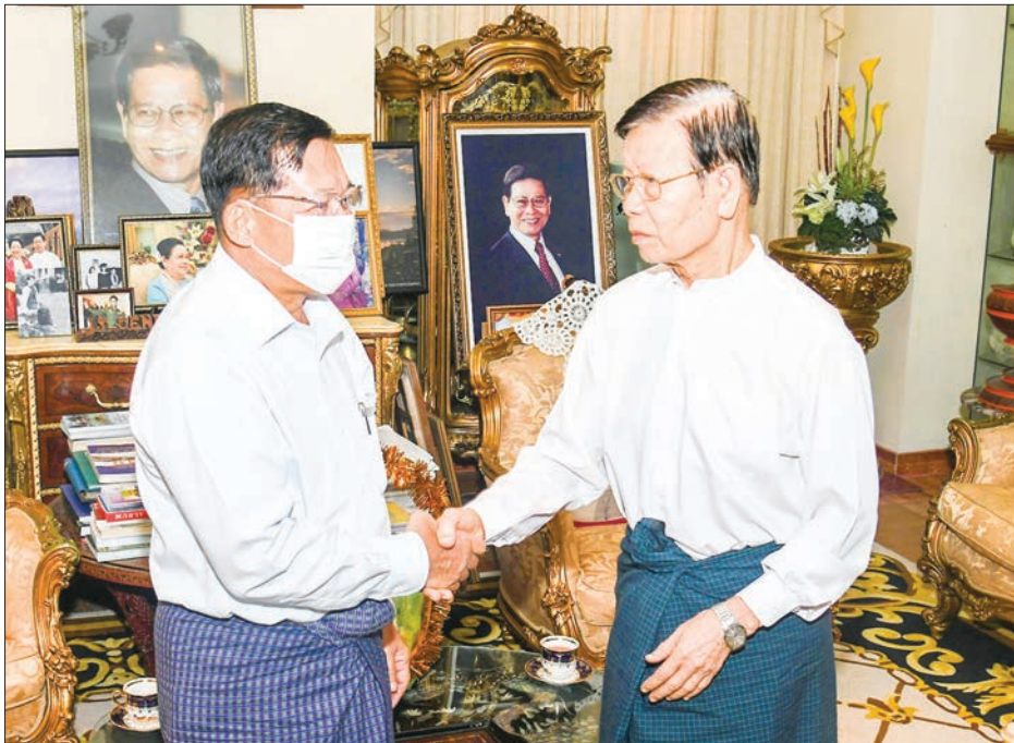
Chairman of State Administration Council Prime Minister Senior General Min Aung Hlaing greets former Prime Minister of SPDC former General U Khin Nyunt.