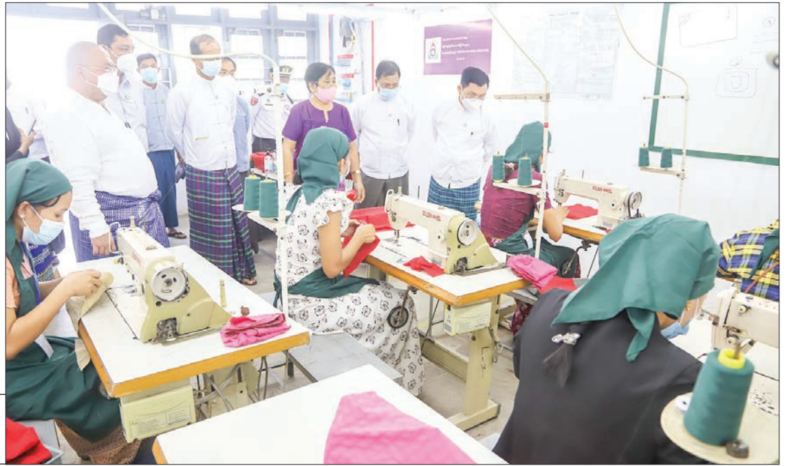
Female workers participate in skill contest of garment factory in Dekkhinathiri Township.

Then, he inspected the sewing machine skill tests of 50 garment workers. The Union Minister and party also went to the Assessment Centre of Lat War Co., Ltd in Yeni. Factory officials clarified the factory operations and skill test processes. The Union Minister then checked the sewing machine operation skill tests of 50 Chindwin Tagun garment factory workers.—MNA