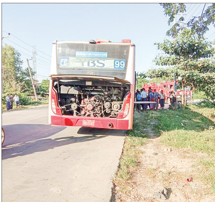
A YBS bus damaged in fire set on by terrorists in Dagon Myothit (Seikkan) Township.

tion against the perpetrators under the law, according to the MPF.—GNLM