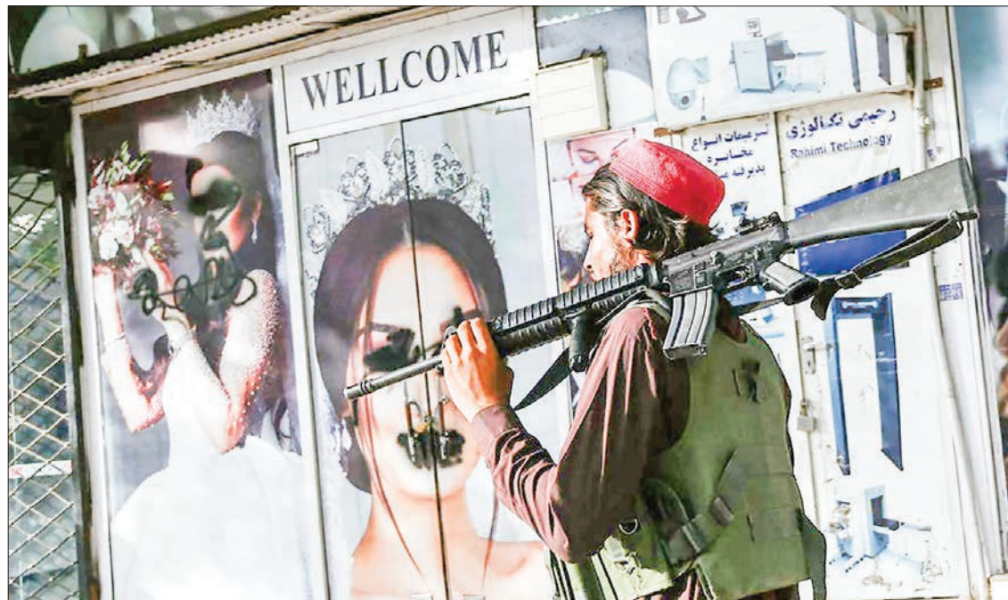
The Taliban has faced mounting criticism over human right problem in Afghanistan, with the United States and other world powers condemning the hardline Islamist group over reported "summary killings" of former members of the Afghan security forces. A Taliban fighter walks past a beauty salon with images of women defaced using a spray paint in Shar-e-Naw in Kabul on 18 August 2021.

Early this week Human Rights Watch (HRW) released a report that it says documents the summary execution or enforced disappearance of 47 former members of the Afghan National Security Forces, other military personnel, police and intelligence agents "who had surrendered to or were apprehended by Taliban forces" from mid-August through October.—AFP ■