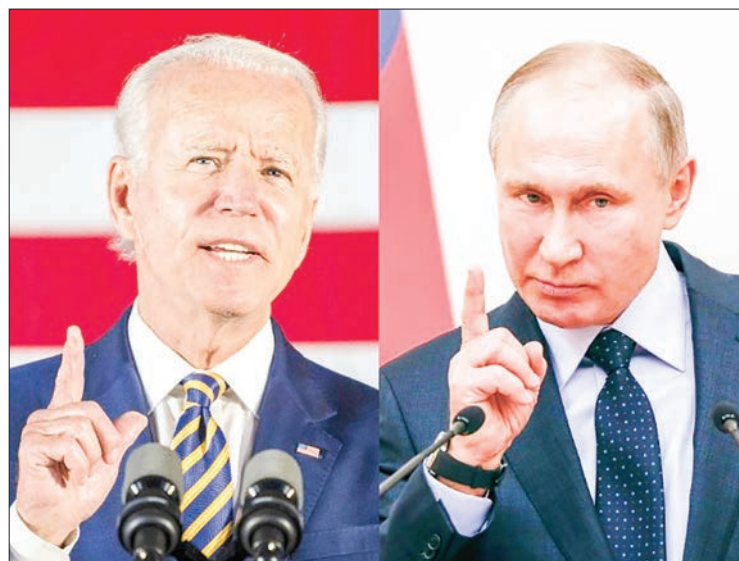
The White House confirmed that Biden would hold a secure video call with Putin on Tuesday.

RUSSIAN President Vladimir Putin and his US counterpart Joe Biden will hold talks by video conference on Tuesday, the Kremlin and Washington said, as tensions rise over Ukraine.