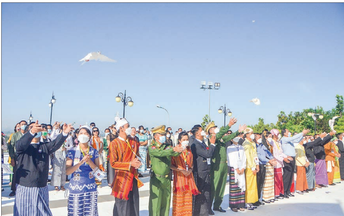
Attendees to 8th ceremony of paying tributes to fallen hero tatmadawmen release doves for ensuring perpetual peace in Nay Pyi Taw.

A ceremony to pay tributes to fallen Tatmadawmen who sacrificed life for the State in discharging duties of State security, rule of law and existence of sovereignty in successive eras took place at the Memorial to Fallen Heroes (Nay Pyi Taw) in Zeyathiri Township of Nay Pyi Taw Council Area yesterday.