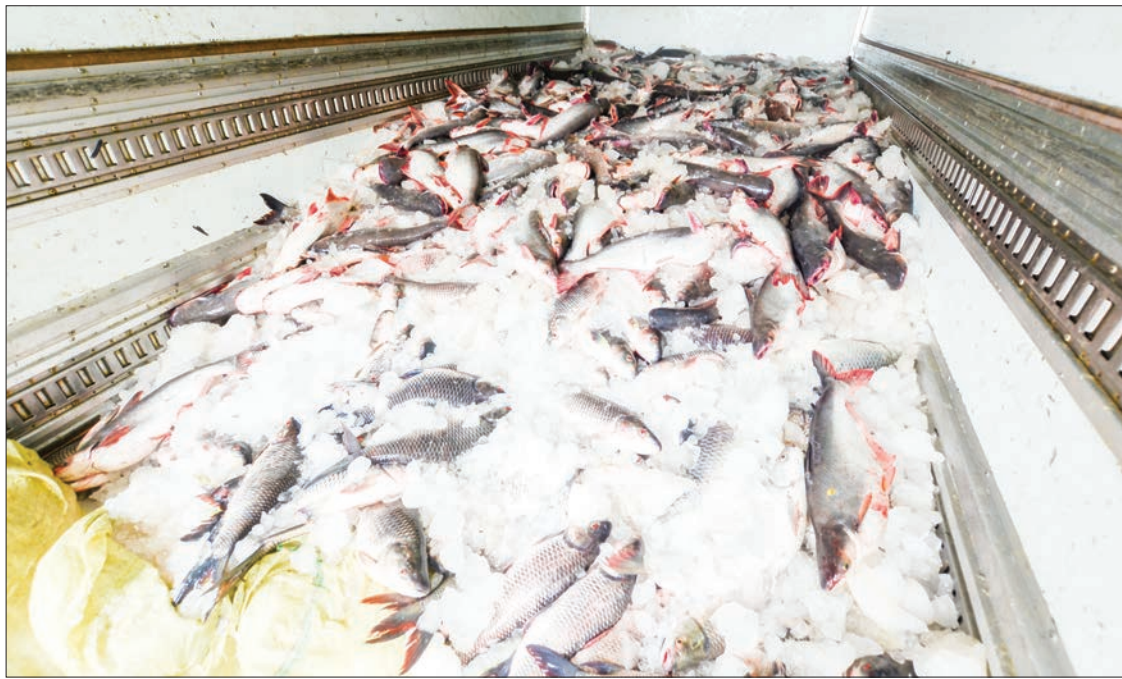
Photo shows frozen fish at cold storage work place as preparation for exportation.

Moreover, the Myanmar Fisheries Federation (MFF) is