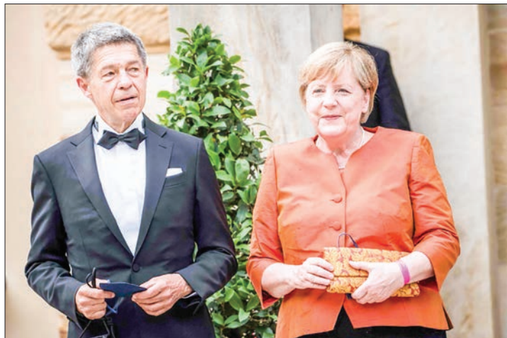
Merkel may wish to spend more time with her husband Joachim Sauer in Hohenwalde in the former East Germany where they have a holiday home.

SHE was called "the leader of the free world" against authoritarian populists on the march in Europe and the United States, but Angela Merkel is wrapping up a historic 16 years in power with a mixed legacy at home and abroad.