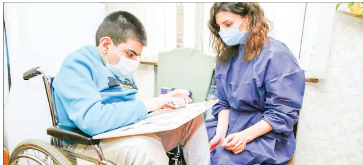
A disabled boy continues his education during the COVID-19 pandemic in Armenia.

One in every five women is likely to experience disability in her life, while for children, that figure is one in ten.