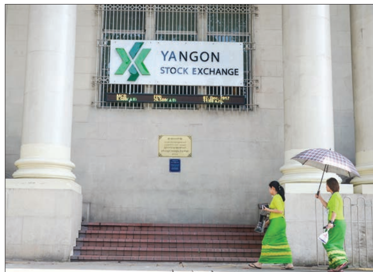
Photo shows building of Yangon Stock Exchange in Yangon Region.

years ago to improve the private business sector. It disseminates rules and regulations regarding the stock exchange and knowledge of share trading through stock investment seminars. The stock exchange has also sought the government's support to get more public companies to participate in the stock market and help more institutional investors, such as financing companies, investment banks, and insurance companies, to emerge.—KK/GNLM