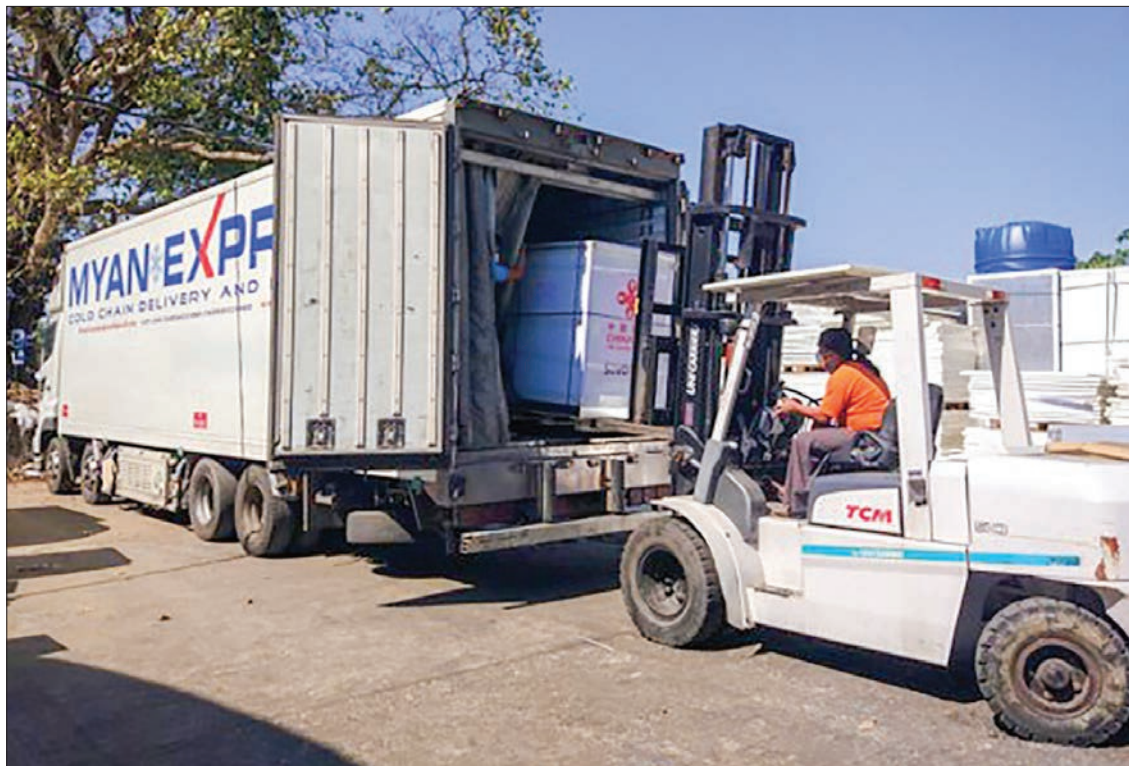
Cartons of medical supplies are being unloaded from cold chain delivery logistic truck.

Authorities from each township have received all the vaccines and they will be distributed to the public as soon as possible in accordance with the target population groups, officials added. —MNA