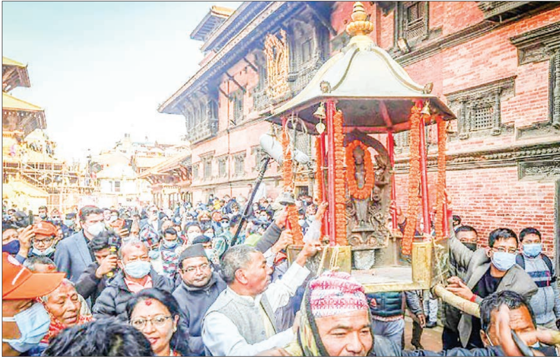
Devotees carry the sculpture in a palanquin, in Patan on the outskirts of Kathmandu.

A centuries-old sculpture of two Hindu gods was re-installed at its temple in the Nepali capital Kathmandu on Saturday, nearly 40 years after it was stolen and later emerged in the United States.