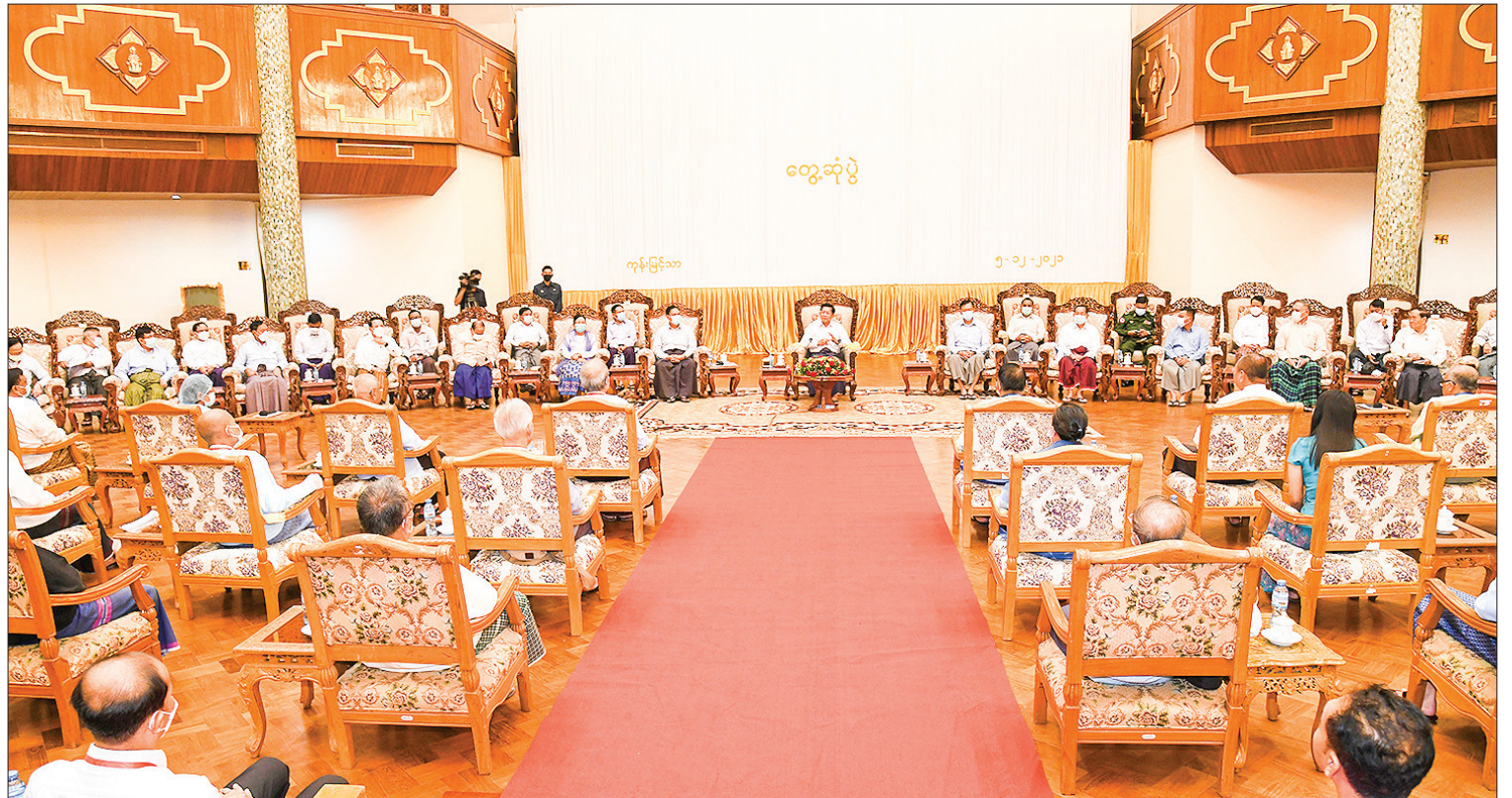
Chairman of State Administration Council Prime Minister Senior General Min Aung Hlaing meets Chairman and officials of Interfaith Friendship Organization (Central).

The Senior General continued that they are temporarily serving the State responsibilities depending on the emergence of situation. The government is on the path leading to the Union based on democracy and federalism the people chosen and will not derail from the path. They did not create the situation of po-