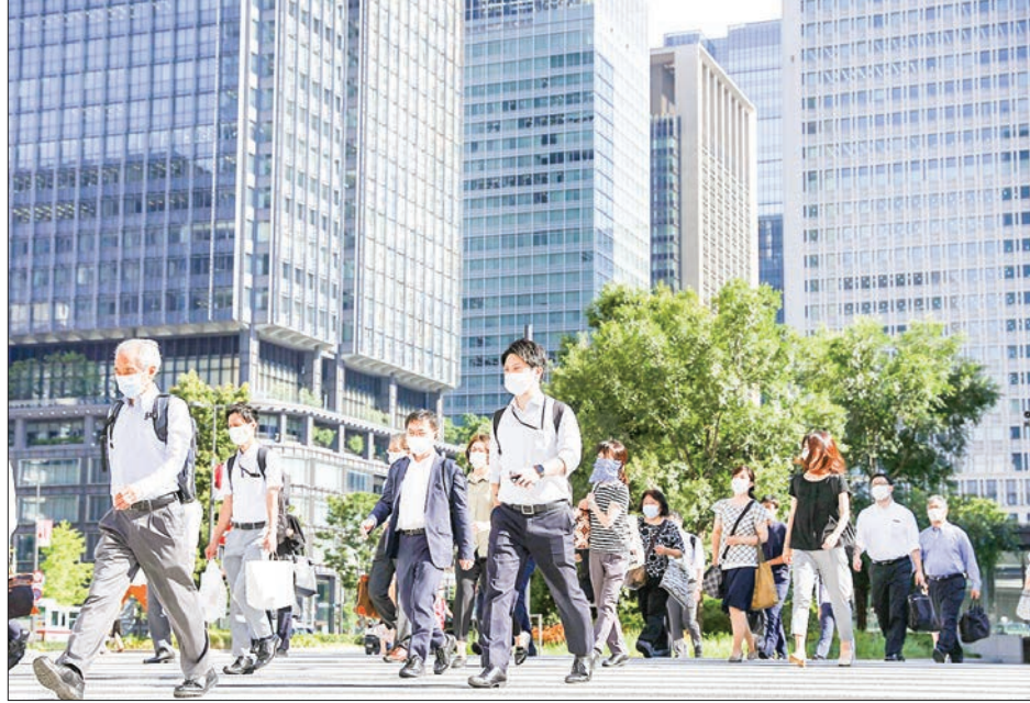
People wearing face masks walk in Tokyo's Marunouchi business district on 2 August 2021.

NEARLY half of Japanese firms will raise wages even without further tax incentives for company pay hikes that the government is planning to introduce next fiscal year, according to a survey by a credit research company.