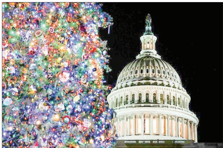
Avoiding a government shutdown is one of a number of urgent priorities Congress must deal with before Christmas.

THE US Congress approved a stopgap funding bill Thursday in a rare show of cross-party unity to keep federal agencies running into 2022 and avert a costly holiday season government shutdown.