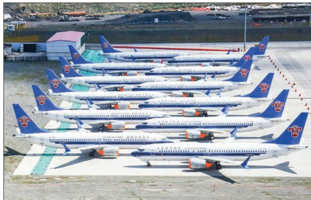
Chinese authorities cleared the way for the 737 MAX to resume after a lengthy grounding.

Aviation insiders expect it will be another four to six weeks before the jets