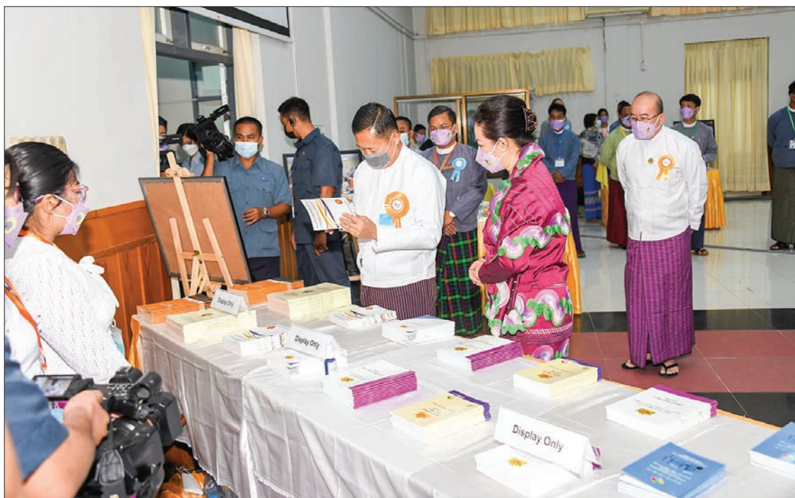
The Vice-Senior General views the books and documentary photos at the event.

Myanmar has been annually holding the ceremony to mark the International Day of Persons with Disabilities 28 times as of 1994. Myanmar signed the UN Convention on the Rights of Persons with Disabilities on 7 December 2011.