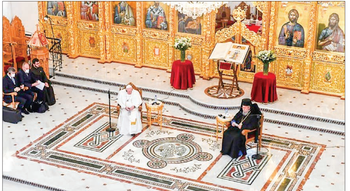
The pope is seeking to improve historically difficult relations between the Roman Catholic and Greek Orthodox Churches.

Ahead of the mass, the pope visited the Holy Archbishopric of the Greek Orthodox Church of Cyprus in Nicosia, seeking to improve historically difficult relations between the Roman