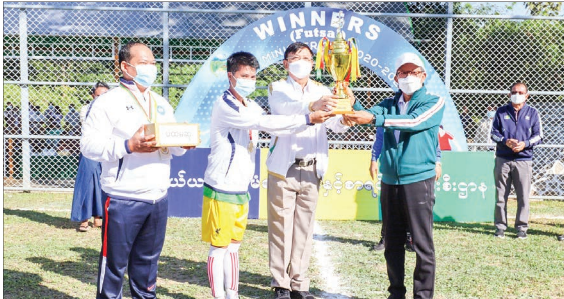
The Union Minister's Cup is awarded at the Ministry Futsal Stadium yesterday.

"We are encouraging professional training in various sports to develop good team-