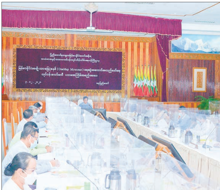
The Myanmar National Mapping System Implementation Working Committee holds the first meeting virtually.

THE Department of Forest held the first meeting of the National Land Use, Myanmar National Mapping System (OneMap Myanmar) Implementation Working Committee yesterday afternoon through videoconferencing.