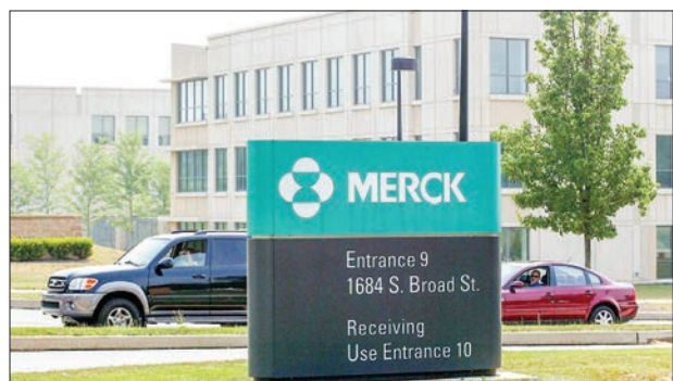
The pharmaceutical giant is making its oral antiviral drug widely available for all the world.

THE Japanese arm of US pharmaceutical giant Merck & Co. said Friday