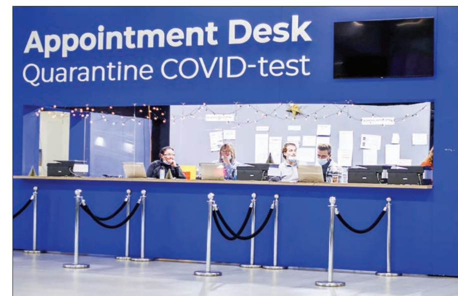
An appointment desk for a COVID-19 test.

The variant's detection and spread represent a major challenge to efforts to end the pandemic, with several nations