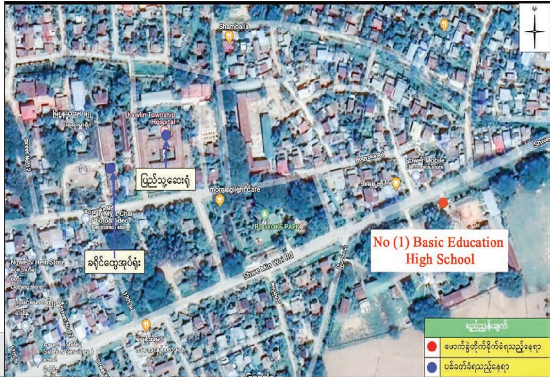
Terrorists attack with grenades, homemade bombs and mines, and destroy schools and training schools.

It is reported that security forces are investigating to identify the perpetrators and take action against them under the law. — MNA