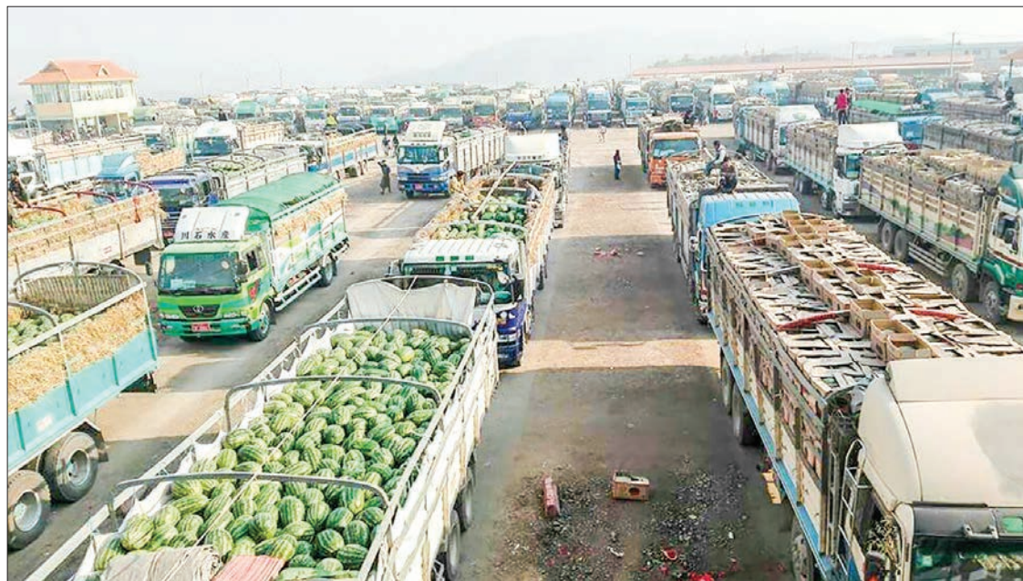
Sino-Myanmar border trade expects revival as lorries full of watermelon are exporting them to China.

Besides, the Chinese's customs system has been transformed from a border trade system to a normal trade system. It has been also reported that the export tax will be levied on the overseas shipping system which has been delayed due to the pending changes in China's