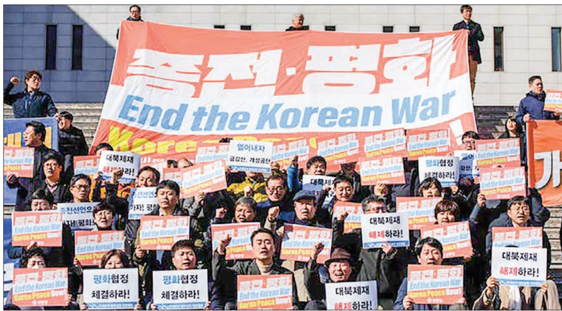
Pro-peace activists attend a rally calling for a formal end to the Korean War in central Seoul on 26 February 2019. - US President Donald Trump and North Korean leader Kim Jong Un will meet for dinner in Hanoi before their previously announced talks the next day, the White House said.

CHINA'S top diplomat, Yang Jiechi, has expressed support for Seoul's push for the declaration of a formal end to the 1950-1953 Korean War, Yonhap News Agency reported Friday, citing South Korea's Embassy in Beijing.