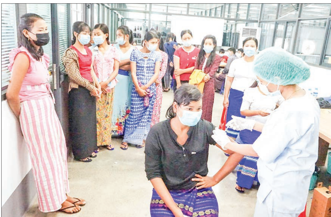
Inoculation drive for workers in Pakokku Township, Magway Region.

OFFICIALS gave COVID-19 vaccines (1st dose) to insured workers who are covered by the social security system under the social security programme at Myanmar Efforts Garment Factory Company, Pantaingchyon Village, Pakokku Township, Magway Region on 2 December.