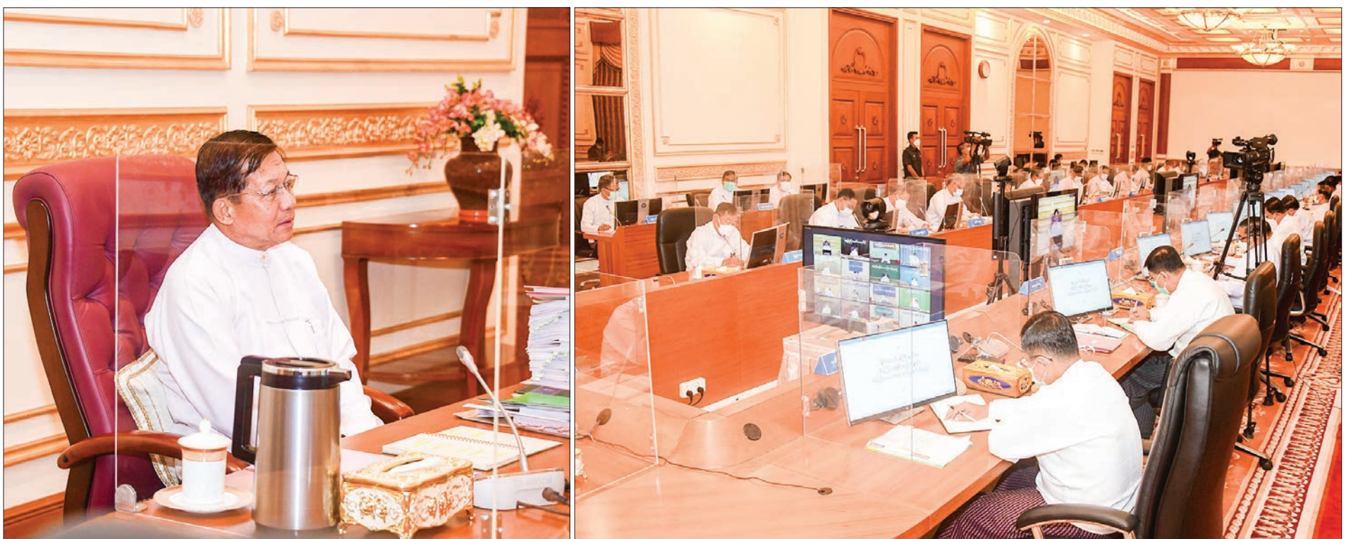
State Administration Council Chairman Prime Minister Senior General Min Aung Hlaing addresses the meeting 3/2021 of the Union government in Nay Pyi Taw on 3 December 2021.

DURING the surging of COVID-19, Myanmar implemented the five-point consensus of the ASEAN amid various difficulties, said Chairman of the State Administration Council Prime Minister Senior General Min Aung Hlaing at the meeting 3/2021 of the Union government at the office of the SAC Chairman in Nay Pyi Taw yesterday afternoon.