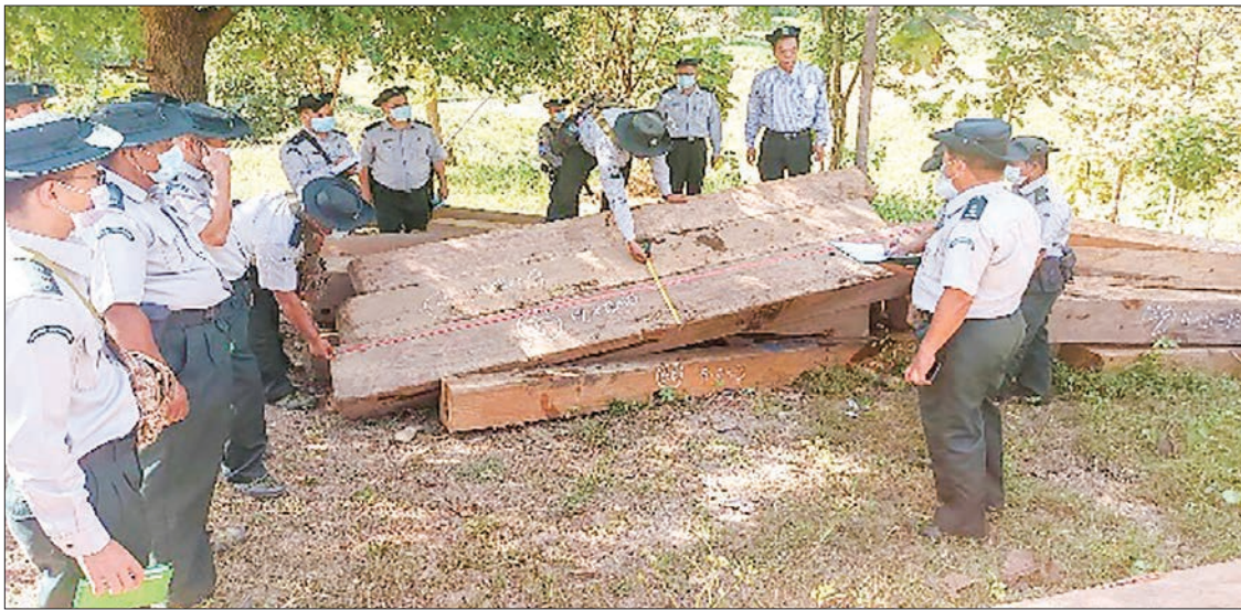
Confiscated timber is seen due to the efforts of the Forest Department.

wood and 28.5204 tonnes of others in regions/states, including the Nay Pyi Taw Council Area and arrested seven suspects with seven vehicles, according to the department. —Nyi Nyi Than (Nay Pyi Taw)/GNLM