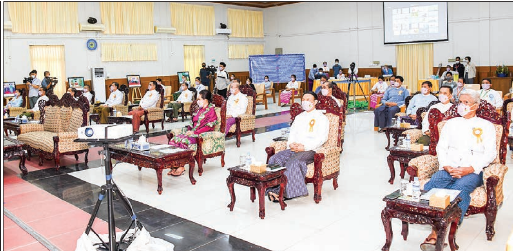
State Administration Council Vice-Chairman Deputy Prime Minister Vice-Senior General Soe Win speaks on the event to mark the International Day of Persons with Disabilities 2021 in Nay Pyi Taw yesterday.

COVID-19. A national committee and a working committee were formed for effectively implementing the Rights of Persons with Disabilities Law, 2015 and the Rights of Persons with Disabilities Rules 2017 in Myanmar with adopting the decisions at their meetings to fulfil the education, employment, healthcare, social and legal needs of the persons with disabilities in the projects and work procedures.