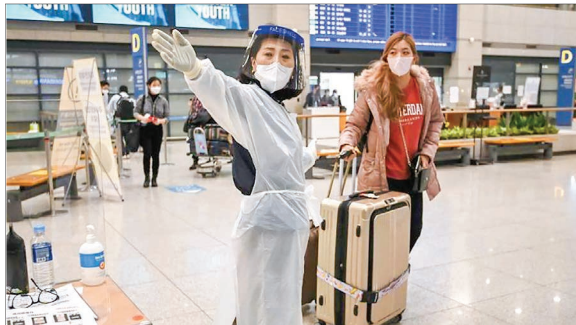
The first confirmed case of the Omicron variant was in South Africa on 9 November, with infections spreading rapidly in the country.

of the infected people are young, and younger people have generally shown milder symptoms throughout the pandemic.