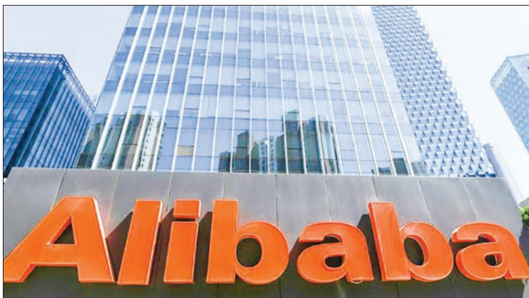
Any data held by Alibaba can be accessed by the Chinese government.

CHINESE e-commerce leader Alibaba Group's role as a "worldwide partner" of the Paris 2024 Olympic Games has sparked a behind-the-scenes battle to prevent it from hosting and accessing sensitive data.