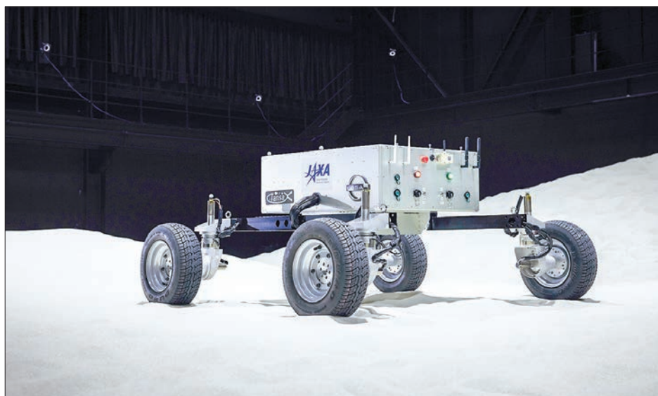
A prototype of a lunar rover developed by Nissan Motor Co. and the Japan Aerospace Exploration Agency.

Honda Motor Co. has been studying a circulative renewable energy system to provide oxygen, hydrogen and electricity for use in long-term extraterrestrial exploration projects.—Kyodo ■