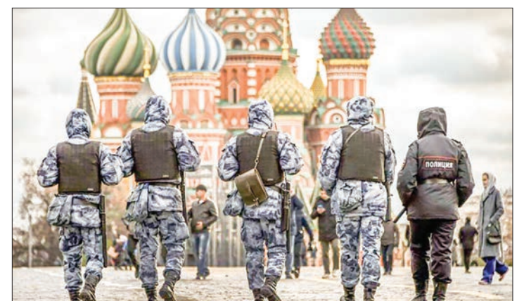
Russian police and National Guard servicemen patrol Red Square in Moscow on 20 October 2021.

It did not specify where or when the attack was to take place.—AFP ■