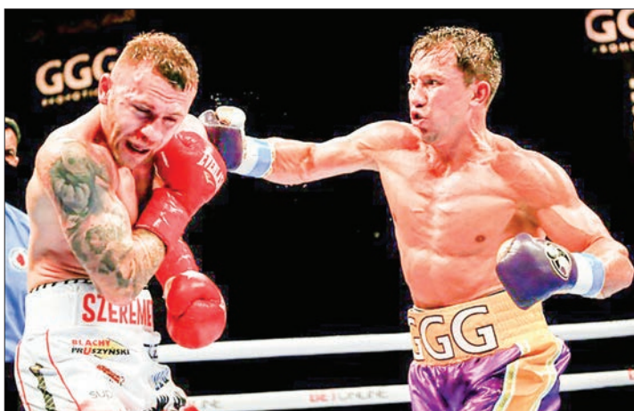
Gennady Golovkin's world title fight against Ryota Murata has been postponed.

IBF middleweight champion Golovkin, also known as "GGG", tweeted that he was "deeply disappointed", but "the health and safety of the public must always be the priority". "I look forward to returning to the ring against Ryota as soon as possible," added the 39-year-old. — AFP ■