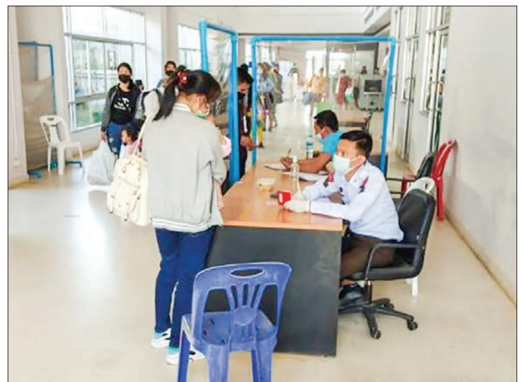
Returnees check in at the reception desk.

are isolated at the designated places. — MNA