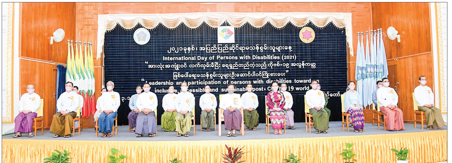
The Vice-Senior General poses for the group documentary photo at the event.

A national committee and a working committee were formed for effectively implementing the Rights of Persons with Disabilities Law 2015 and the Rights of Persons with Disabilities Rules 2017 in Myanmar by adopting the decisions at their meetings to fulfil the education, employment, healthcare, social and legal needs of the persons with disabilities in the projects and work procedures, said Chairman of National Committee for Rights of Persons with Disabilities Vice-Chairman of the State Administration Council Deputy Prime Minister Vice-Senior General Soe Win.