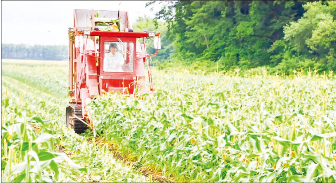
The export value of Japanese agriculture, forestry and seafood products this year is certain to surpass 1 trillion yen ($8.8 billion) for the first time, the agricultural ministry said Friday.

THE export value of Japanese agriculture, forestry and seafood products this year is certain to surpass 1 trillion yen ($8.8 billion) for the first time, the agricultural ministry said Friday.