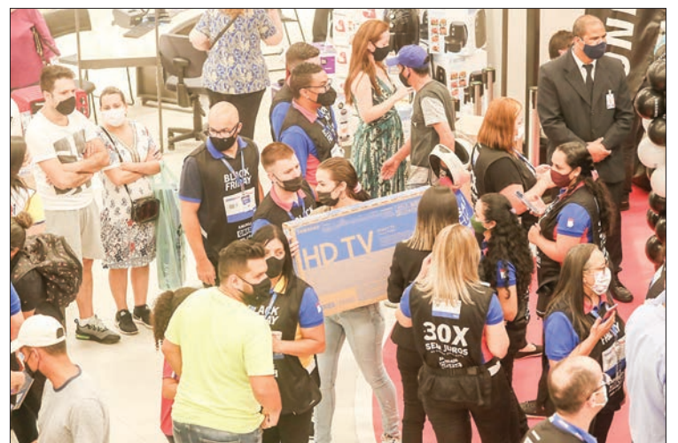
Shoppers buy TV sets at a megastore during a Black Friday sale in Sao Paulo, Brazil, on 25 November 2021.

Agricultural production fell 8.0 per cent, while manufacturing was flat and the services sector grew 1.1 per cent. Brazil's services industry was boosted by an improvement in the health situation in a country hard hit by the global pandemic.