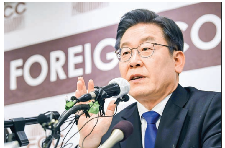
Lee Jae Myung, the presidential candidate of South Korea's ruling Democratic Party, speaks at a press conference with foreign media in Seoul on 25 November 2021.

tions have sunk to their lowest point in decades following South Korean Supreme Court rulings in 2018 that ordered Mitsubishi Heavy and another Japanese company to compensate groups of Koreans for forced labor during its 1910-1945 colonial rule of