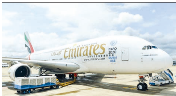
The Nigerian government has lifted the suspension it placed on the Emirates from flying to and from the West African country without conditions.

According to reports by local media, Emirates subjected Nigerian travelers to additional rapid antigen tests as against its stipulated negative PCR test at the Lagos and Abuja airports before departure.