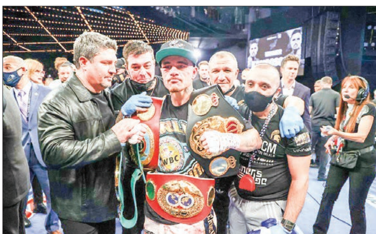
George Kambosos celebrates his split decision win against Teofimo Lopez during championship bout for Lopez's undisputed lightweight title at The Hulu Theater at Madison Square Garden on November 27, 2021 in New York, New York.

AUSTRALIA'S George Kambosos used a high-energy attack and a stinging overhand right to become the unified lightweight boxing champion with a shocking