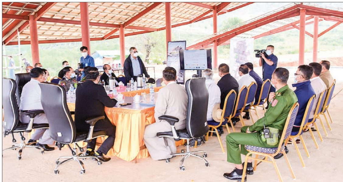
Union Minister for Information U Maung Maung Ohn meets local authorities and officials of Forever Yay Wati Company Ltd in Pindaya.

his pleasure for turning out the new generations of fine arts arenas in production of film and TV broadcasting in Pindaya. He urged all to systematically produce the films meeting the international standard and to seek the foreign market. He said he believes successful process of television broadcasting in Pindaya endowed with natural scenes, peace and tranquility and smooth transport facilities. But, it is necessary to maintain the soil damage due to erosion. The Union Minister pledged to give aid for improvement of the film industry together with Shan State government as success in the work process at Pindaya will reflect the development of the region. The Shan State Chief Minister explained plans of the state government for imple-