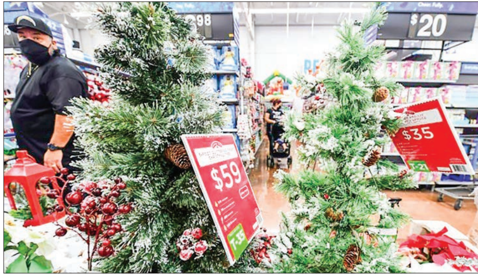
Shoppers in Rosemead, California on November 22, 2021.

But consumer advocates say they carry the same risks as credit cards