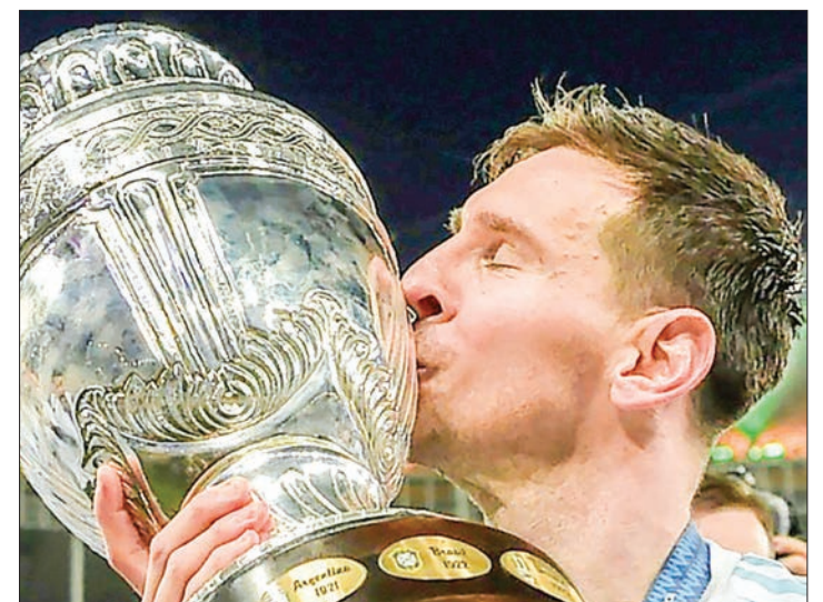
Argentina's Lionel Messi kisses the trophy after winning the 2021 Copa America.

ROBERT Lewandowski threatens to deny Lionel Messi a record-extending seventh Ballon d'Or title as the prestigious awards ceremony returns Monday after it was cancelled last year because of the pandemic.