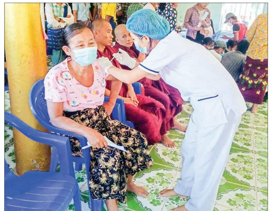
Health staff injects Sinopharm COVID-19 vaccine to over 18-year-old people and Buddhist monks in Ngaputaw Township on 27 November.

The village administrators supervised the vaccination site and members of the fire brigade; healthcare officials and clerks provided necessary assistance, according to the Rural Health Centre.—Nu Nu Aye (IPRD)/GNLM