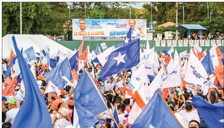
Supporters of Tegucigalpa's mayor and presidential candidate for the ruling National Party Nasry Asfura, aka 'Papi a la Orden' attend the campaign's closing event.

HONDURAS is bracing itself for potential violence as more than five million people vote on Sunday to replace President Juan Orlando Hernandez, a controversial figure accused of drug trafficking in the United States.