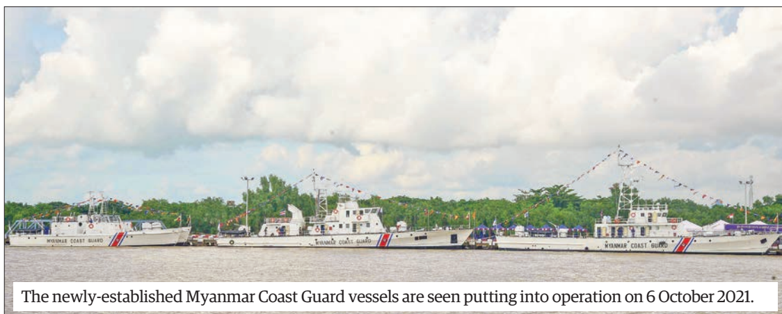
The newly-established Myanmar Coast Guard vessels are seen putting into operation on 6 October 2021.