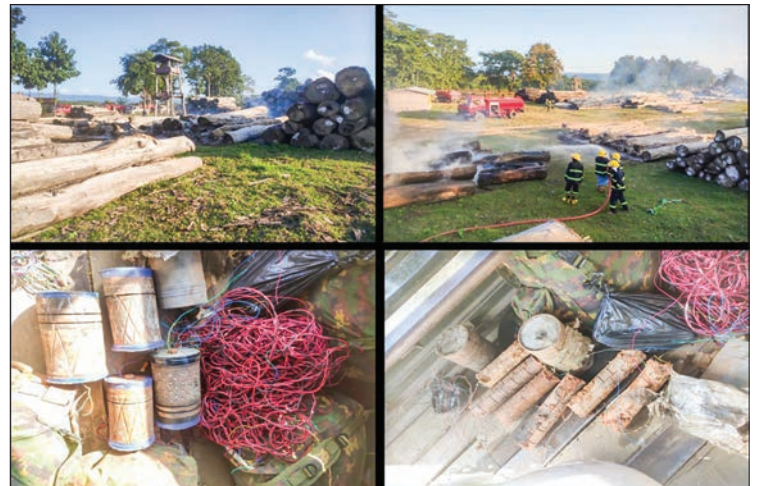
Piles of timber logs of government were set on fire in Kalay Township.