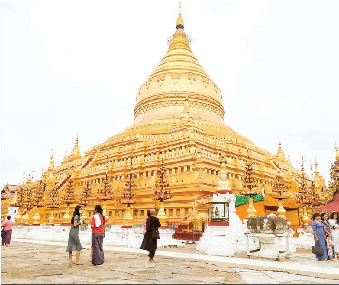
Pilgrims and visitors are seen on terrace of Shwezigon Pagoda in Bagan Cultural Heritage Zone.