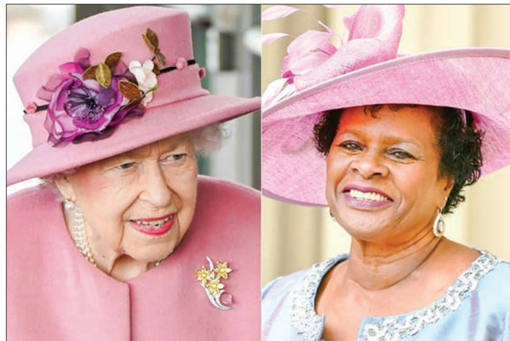
Britain's Queen Elizabeth II will be replaced as head of state of Barbados by Dame Sandra Mason, the island's governor general.