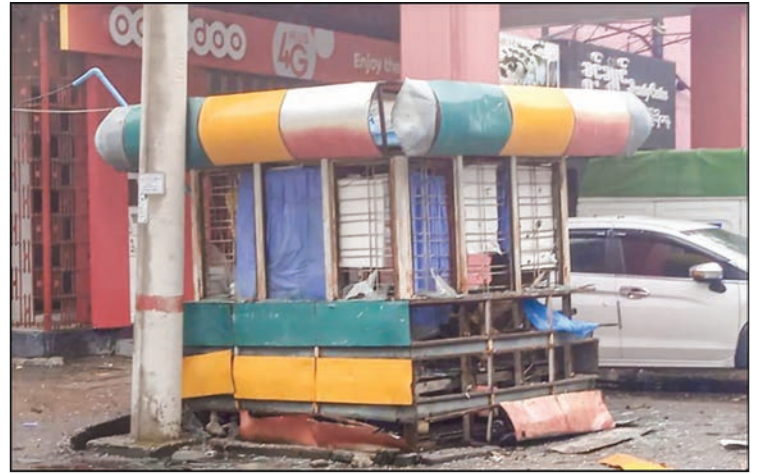
A traffic police post was damaged in homemade bomb blast in Lanmadaw Township.

The people is urged to work together to prevent terror acts such as mine planting and setting fire to the State owned and private property by the terrorists for ensuring development, peace and stability of the State, and if they receive information about the terrorist activities, they should secretly contact the nearest security forces and cooperate with them until the terrorists can no longer stand.—MNA