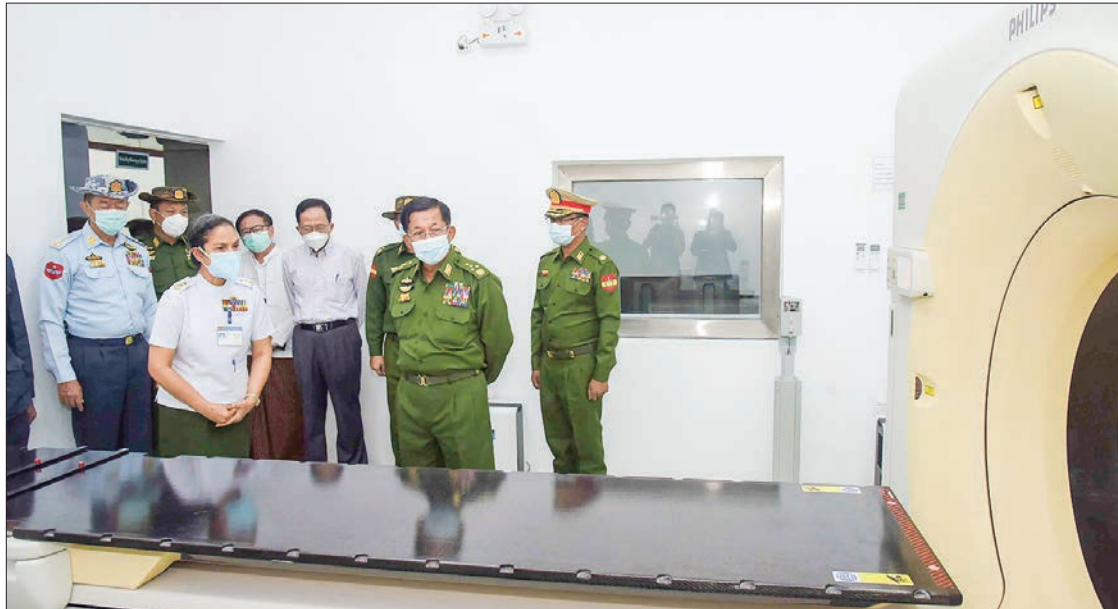
SAC Chairman Commander-in-Chief of Defence Services Senior General Min Aung Hlaing visits radiation department of military hospital in Aungban, Shan State on 2 October 2021.

The Commander-in-Chief of Defence Services also visited the Eastern Command headquarters to meet with Tatmadaw officers, other ranks and families of