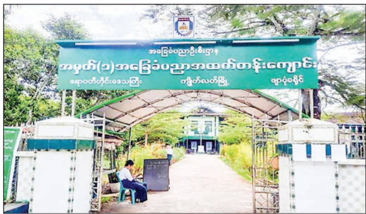
Entrance to Kyaiklat BEHS-1.

The people are urged to work together to prevent killing of good service personnel by the terrorists for ensuring development, peace and stability of the State, and if they receive information about the terrorist activities, they should secretly contact the nearest security forces and cooperate with them until the terrorists can no longer stand.—MNA