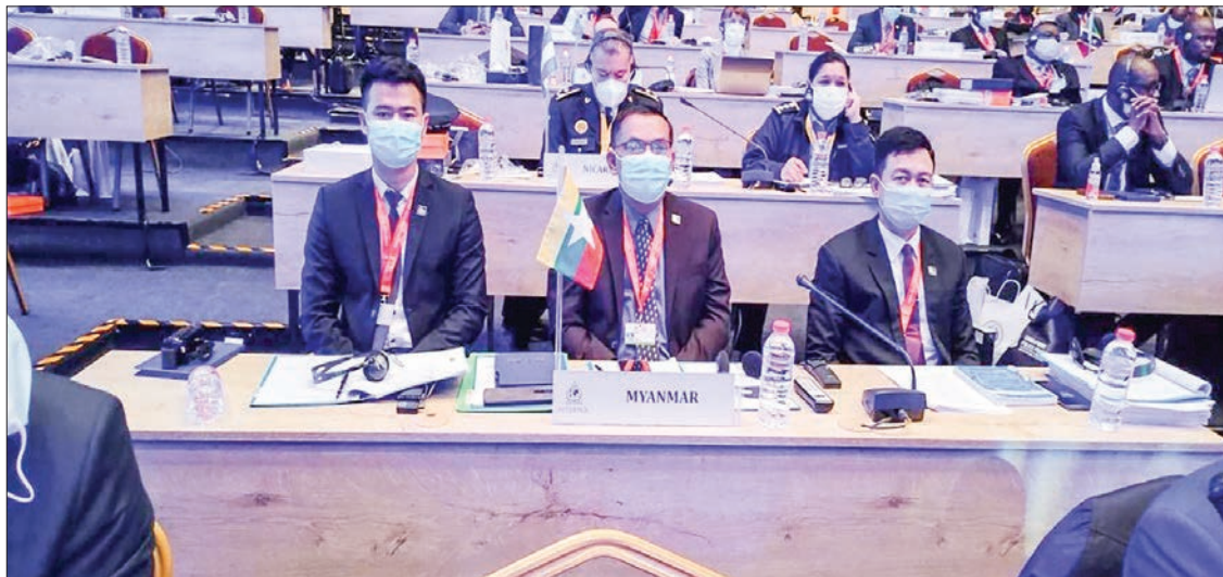
Deputy Minister for Home Affairs Chief of MPF Lt-Gen Than Hlaing attends 89 th session of INTERPOL General Assembly in Istanbul.

A Myanmar delegation led by Deputy Minister for Home Affairs Chief of Myanmar Police Force Lt-Gen Than Hlaing attended the 89 th Session of INTERPOL General Assembly in Istanbul, Turkey, between 23 and 25 November at the invitation of INTERPOL.