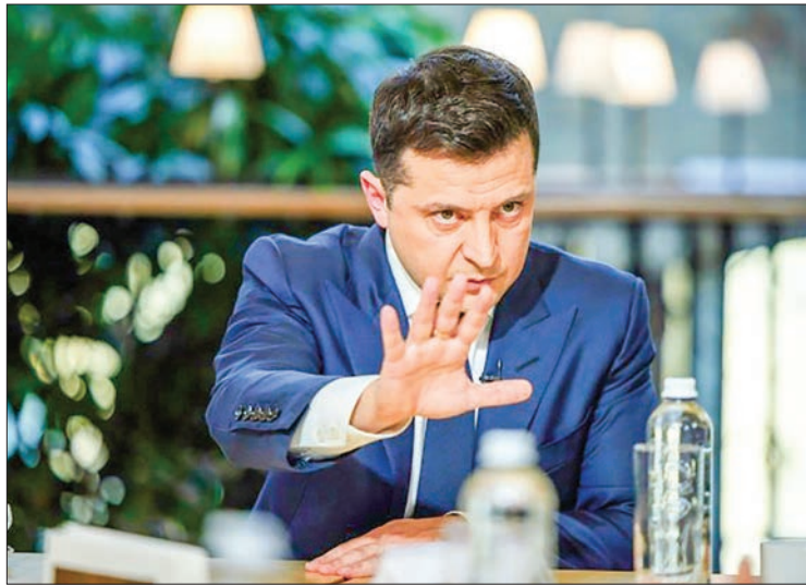
Ukrainian President Volodymyr Zelensky.

UKRAINIAN President Volodymyr Zelensky said on Friday that he is ready for a dialogue with Russia over the Donbas crisis, the government-run Ukrinform news agency reported.