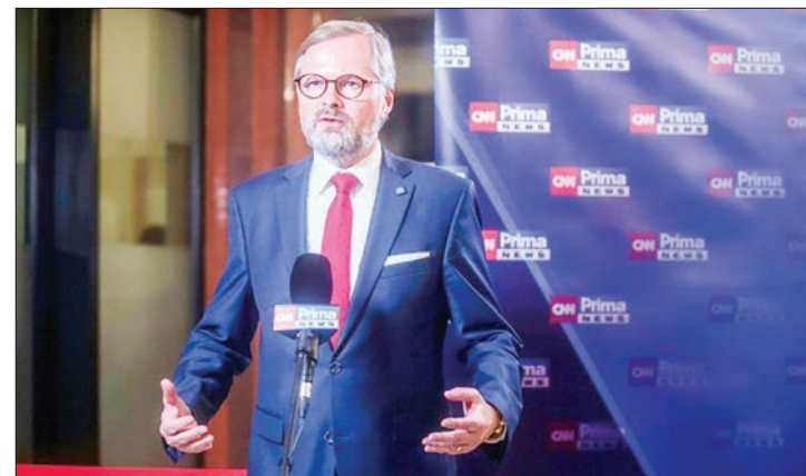
The Czech Republic's Civic Party leader Petr Fiala is to take over as prime minister after forming the centre-right Together alliance.

Zeman, a left-winger with a soft spot for Russia and China, had originally been expected to name Fiala as prime minister on Friday, a day after he was released from Prague's military hospital. But he was rushed back to hospital on the same day after testing positive for Covid. — AFP ■