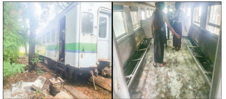
Damaged locomotive was burnt in Pinyinana.