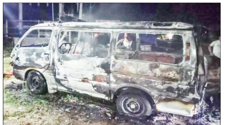
An ambulance of social welfare association was set in blaze in Thabeikkyin Township.