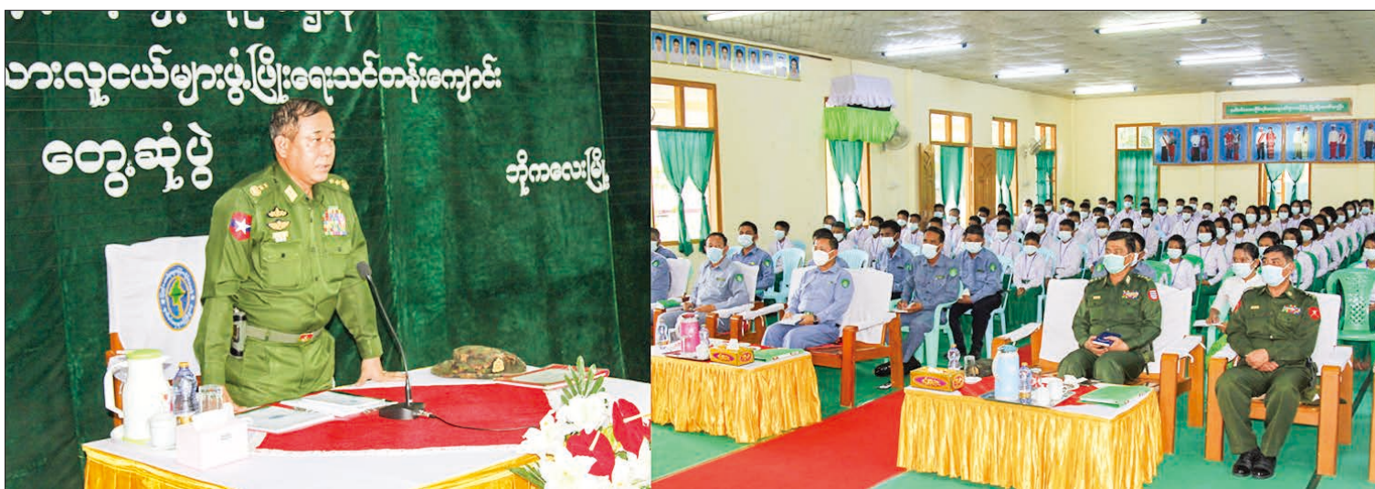
Union Minister Lt-Gen Tun Tun Naung meets principal, teachers and students of Border Area National Race Vocational Training School in Bogale on 27 November 2021.

UNION Minister for Border Affairs Lt-Gen Tun Tun Naung, Ayeyawady Region Minister for Security and Border Affairs Colonel Kyaw Swa Hlaing and officials inspected training schools in Ayeyawady Region from 26 to