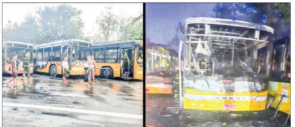
Five buses of YBS (89) were set on fire in Kyimyindine Township.