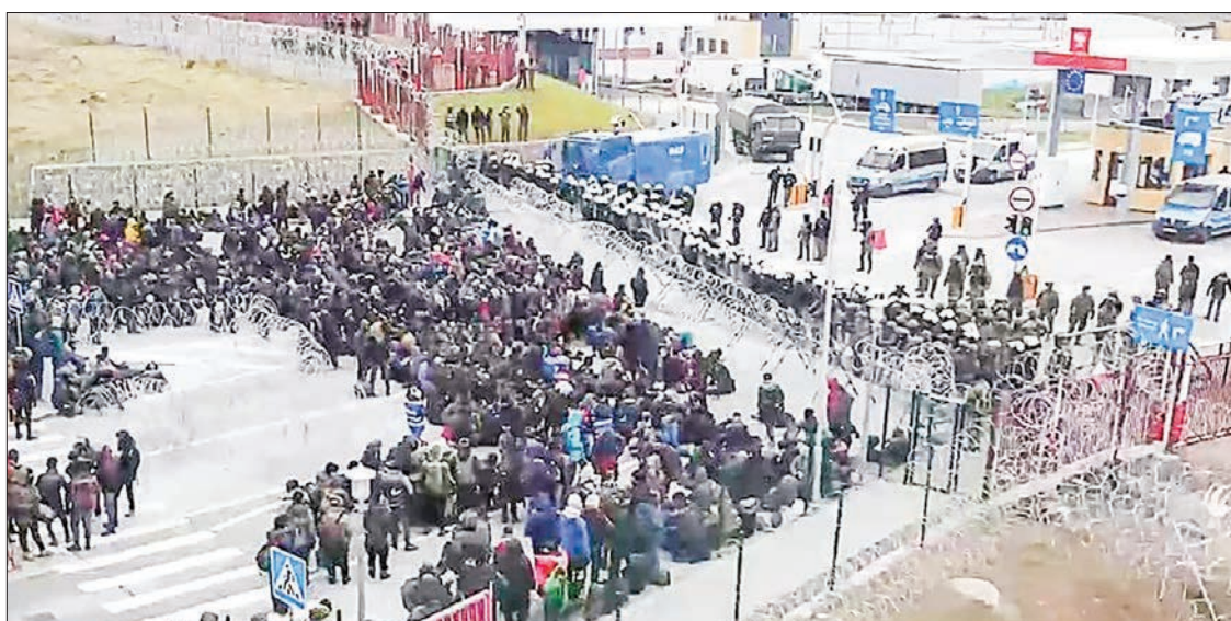
Thousands of migrants are stuck on the Polish-Belarusian border. Poland has refused to let the migrants enter EU territory.

PRESIDENT of Belarus Alexander Lukashenko on Friday met with refugees stranded on the border between Belarus and Po-