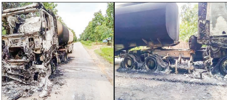
A fule bowser burnt by PDF terrorist group was seen in Htigyaying Township.