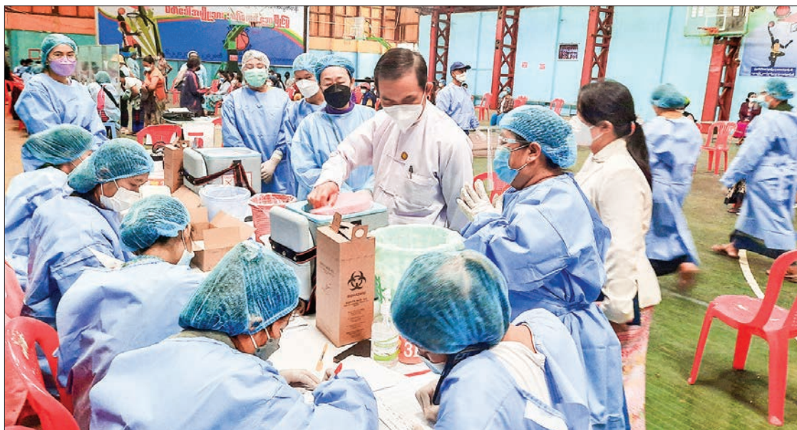
Health officials take preventive measures of COVID-19 in meeting with health staff in Shan State.

The Deputy Minister and field study team met the Shan State Chief Minister and Ministers, military commanders, relevant administration bodies, departmental officials of respective districts and townships and health officials. During the meeting, the deputy minister stressed the neces-