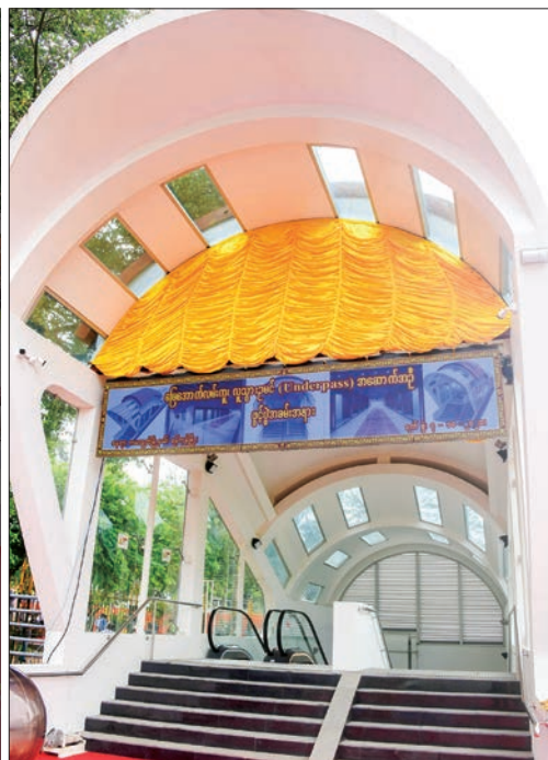
State Administration Council Chairman Prime Minister Senior General Min Aung Hlaing presses the ceremonial button to open the Underpass on Pyay Road in Yangon on 7 October 2021.

Hlaing inspected the Tatmadaw Heavy Industries facilities. During the inspection tour, he stressed the importance of having the capacity to manufacture adequate numbers of utility vehicles, such as oil bowsers, water tankers, garbage trucks, sprayers and fire trucks, not only for the Tatmadaw but also for municipal work and firefighting.