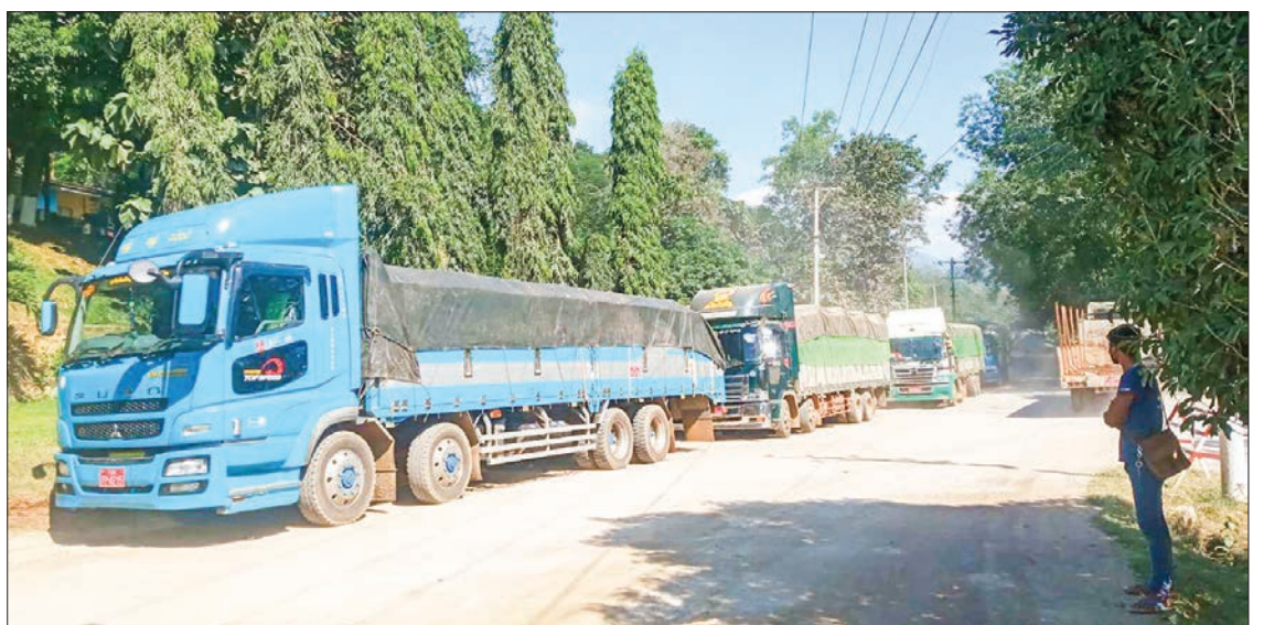
Cargo trucks carrying medical equipment rolling on the road in a row are leading to regions and states.

It is reported that the Ministry of Commerce is coordinating with relevant departments, treatment of COVID-19, as well as contact persons for inquiries can be reached through the Ministry's Website—www.commerce.gov.mm. — MNA