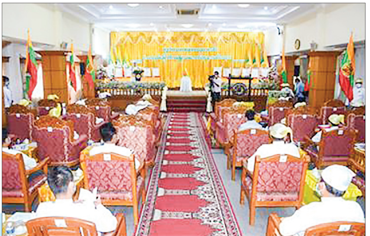
YMBA's 101 st National Victory Day ceremony takes place at Zabuthiri Beikman in Mayangon Township on 28 November 2021.

The ceremony ended with singing the Zartiman song.—MNA