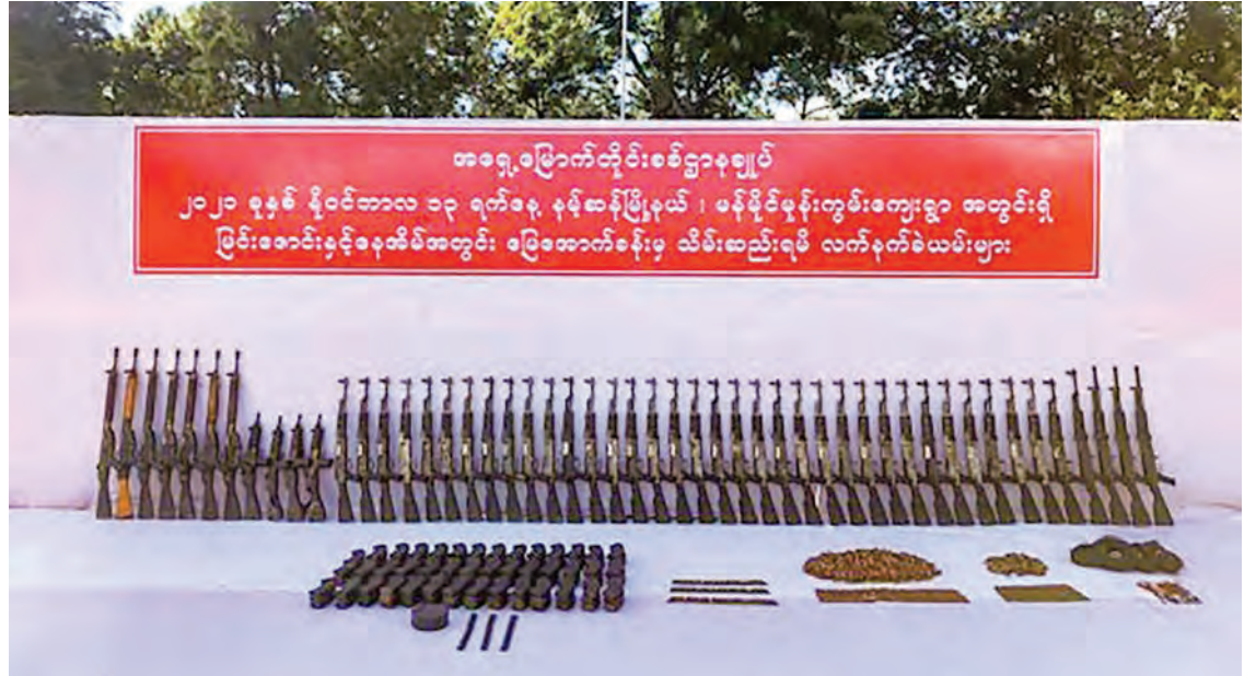
Confiscated weapons and ammunition in Namsang.