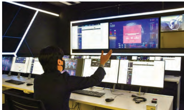
A Panasonic Corp. official talks about the company's security system to monitor cyberattacks against internet-connected cars at a mock-up surveillance centre in Tokyo on 22 Oct 2021.

the company's system is capable of doing just that.—Kyodo