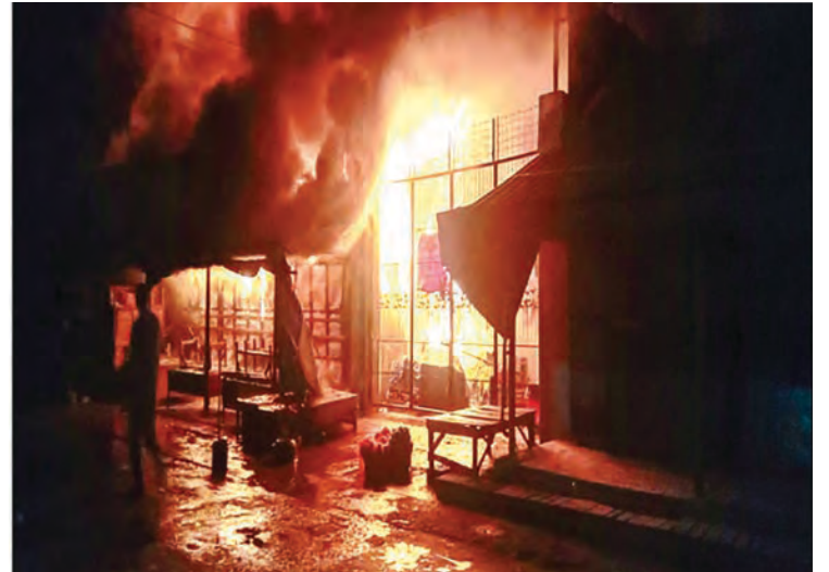
Fire on stalls at Nawngkhio market on 8 June 2021.