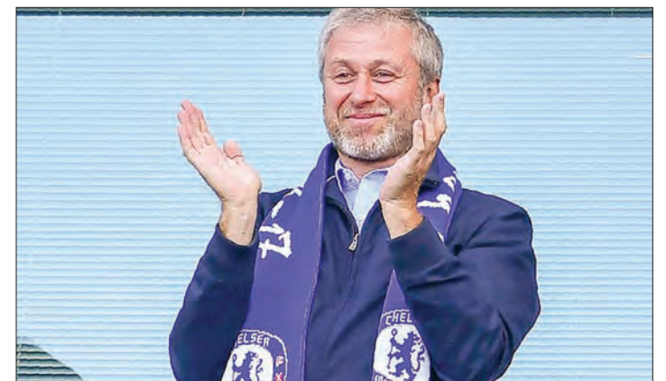
Chelsea's Russian owner Roman Abramovich turned his club into a superpower.

He brought Jose Mourinho to Stamford Bridge in 2004, with the Portuguese boss winning the Premier League title in his first season in charge as the Blues ended a 50-year wait to be crowned champions of England. — AFP ■