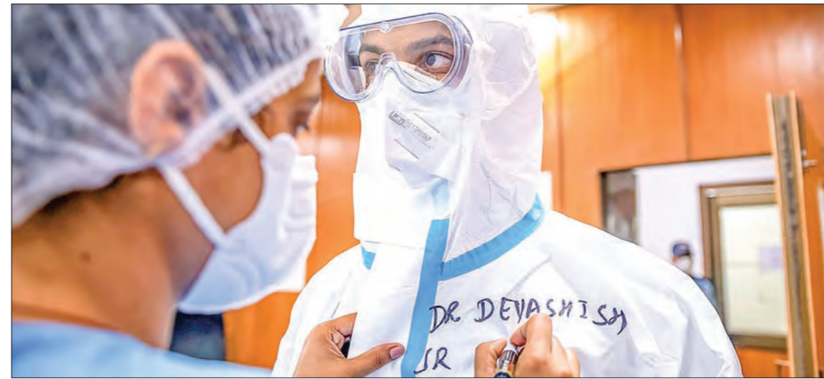
A nurse prepares a physician for the COVID ward at a hospital in New Delhi, India.

The co-chairs highlighted a growing momentum for a UN global summit as well as increasing support for a new top-level political leadership Global Health Threats