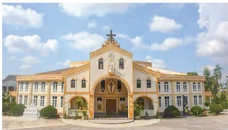
Christ the King Cathedral.

All 48 patients were systematically handed over to the Loikaw People’s Hospital for medical treatment, it is reported. — MNA