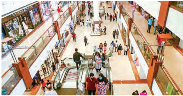
People visit Select City Mall after authorities eased a lockdown imposed as a preventive measure against the Covid-19 coronavirus, in New Delhi on 19 June, 2021.