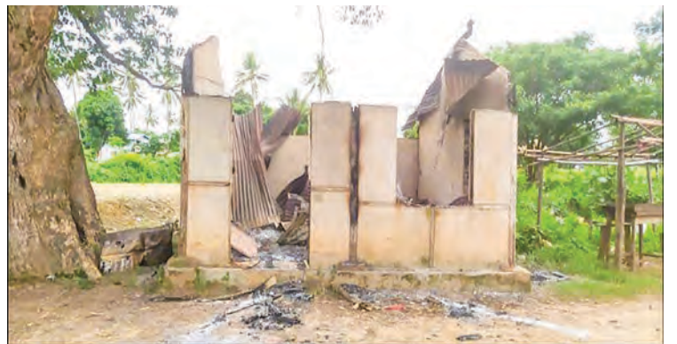
Arson attack on market committee office in Ottarathiri Township on 26 June 2021.