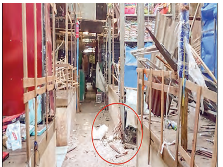
Sound bomb blast at Thaton Myoma market on 4 May 2021.