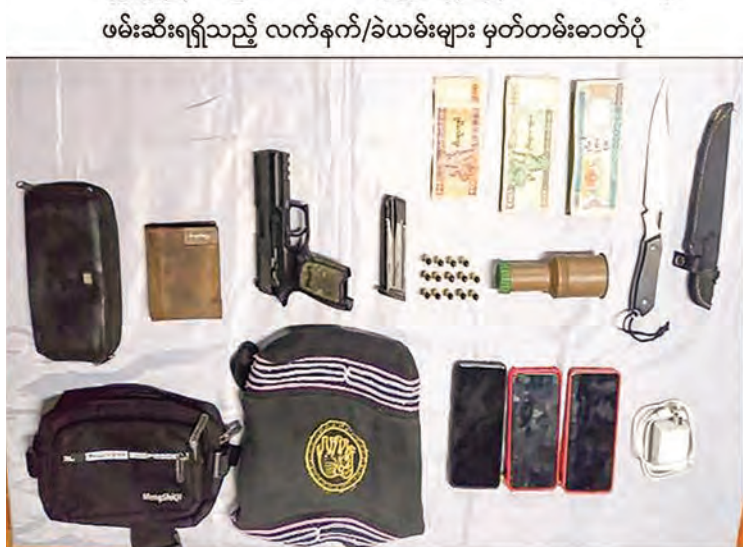
Seized firearms and ammunition in Amarapura Township.