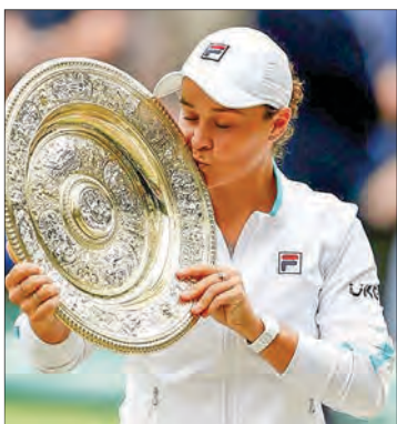
World number one Ashleigh Barty has got engaged to her long-time boyfriend.