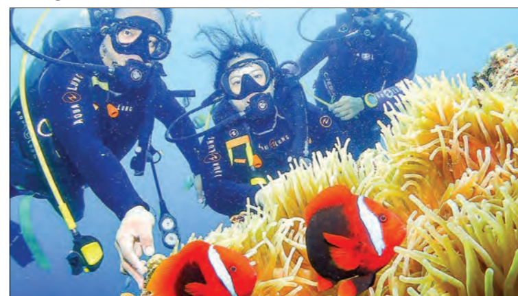
After more than a year in the doldrums, tourism in the coastal Mabini town, known as the "birthplace" of scuba diving in the Philippines, is enjoying a rebound with visitors returning to see the beautiful seaside scenery and explore rich species underwater.