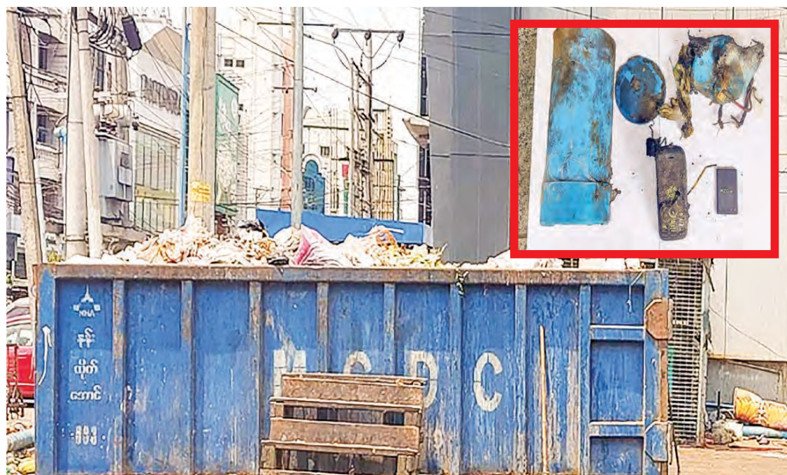
Two sound bombs blast in Chanayethazan and Maha Aungmye townships.

The people are urged to work together to prevent terrorist acts such as mine planting and setting fire by the terrorists for ensuring development, peace and stability of the State, and if