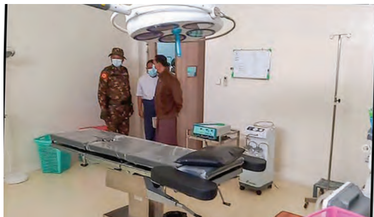
Unofficial operating theatre.