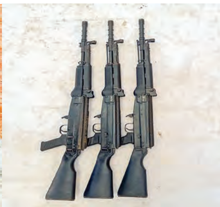
Seized 3 Type-81 assault rifles.

heavy and small arms, including an FN-6 shoulder-to-air missile, were recovered from Homin village, 7 kilometres north of Man Mai Mong Kwan village.