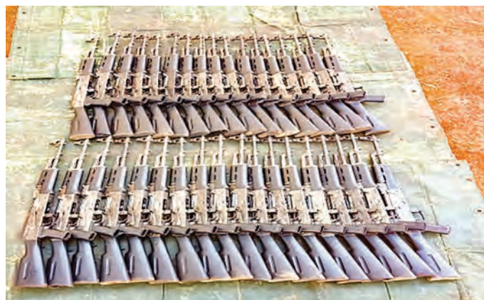
Seized 35 Type-56 assault rifles.