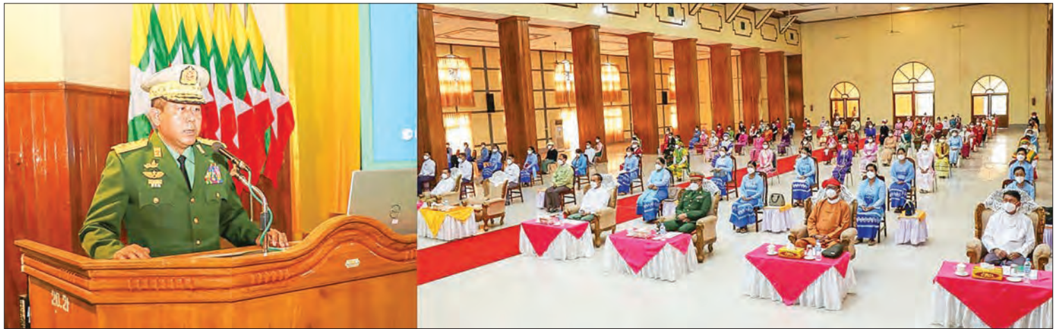
The graduation ceremony of the 5-year Education Degree Course No 4 of the University for the Development of the National Races of the Union in progress.

He said the University for the Development of the National Races (Sagaing) was established to provide the national races with higher education to develop education officers who would involve in the develop-