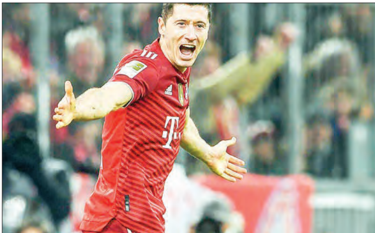
Robert Lewandowski set a new single-season Bundesliga record with 41 goals.

ROBERT Lewandowski is in the running to retain his Best FIFA Men's Player award after he was named Monday on an 11-man shortlist alongside Karim Ben-