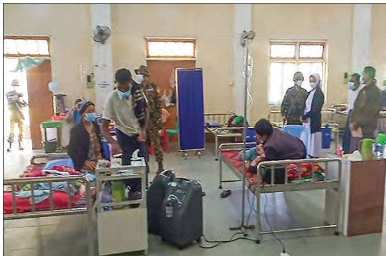
Patients under unofficial medical treatment.