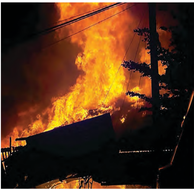
Arson attack on Kangyidaunt Myoma market on 1 June 2021.