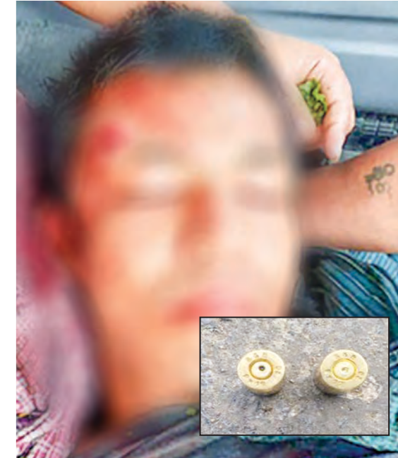
Chit Ko (dead).