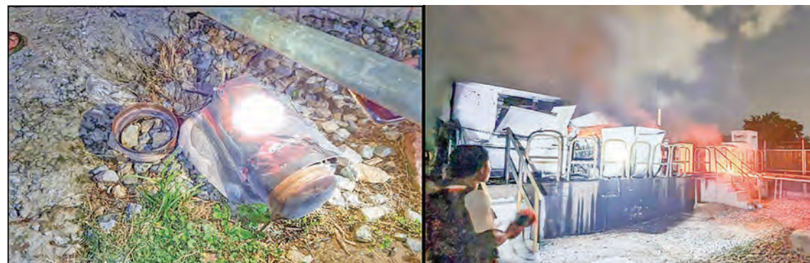
Ravages are seen after handmade bomb blast at Mytel tower in Amarapura Township.