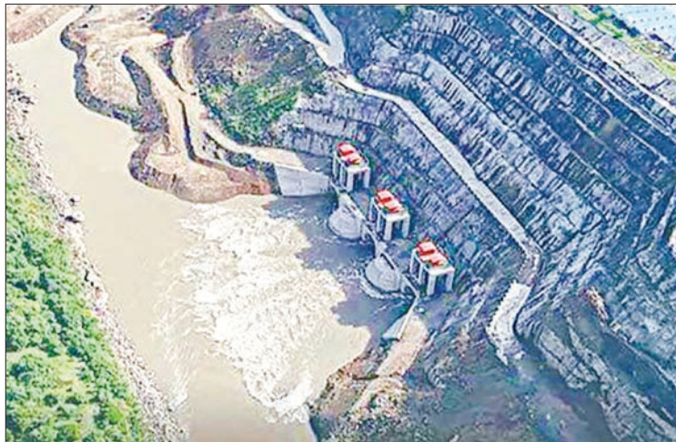
A view of the under-construction 720MW Karot hydropower project.

THE Karot Hydropower Project, a major pilot project under the China-Pakistan Economic Corridor (CPEC), successfully closed the gates of the diversion tunnels on Saturday, starting reservoir