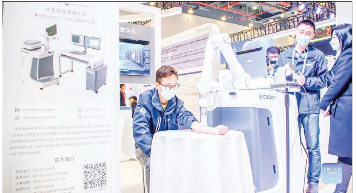
A staff member demonstrates a 5G remote diagnostic platform at China 5G+ Industrial Internet Conference in Wuhan, central China's Hubei Province, 19 November, 2021. China 5G+ Industrial Internet Conference runs from 19 to 21 November.

There is also an exhibition of "5G + Industrial Internet" achievements. The exhibition area has increased from 5,900 square meters last year to 9,100 square meters this year, and four themed exhibition areas have been established: network and scene, platform, security and industry application. The conference has also set up an interactive area to provide visual, scenario-based, immersive and interactive experiences for non-professional audiences. — Xinhua ■