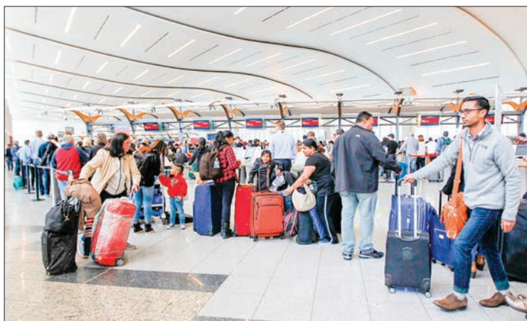
Airline passengers arrive to stand in line at the Delta Airlines international counter at Hartsfield-Jackson Atlanta International Airport in Atlanta on 18 December 2017.

It said the incident occurred after a “prohibited item” was identified inside a passenger’s baggage by an X-Ray machine at a checkpoint.