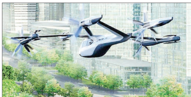
South Korea is planning to begin offering urban air mobility services as early as 2025 in a limited capacity, working with automaker Hyundai and other partners.

S. KOREAN companies will strengthen the cooperation to speed up the commercialization of UAM (Urban Air Mobility), which is expected to grow to 730 trillion won in the global market by 2040.