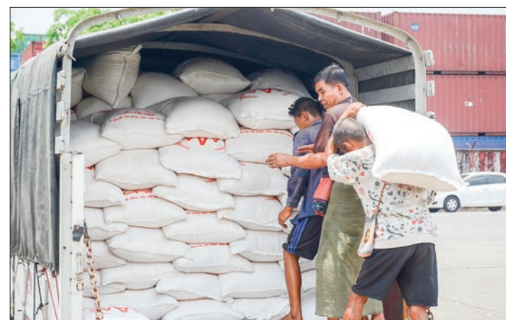
A worker is carrying bags of rice aboard the cargo truck.

China is the main buyer of Myanmar rice, followed by Ivory Coast, the Philippines, Viet Nam and Guinea. Meanwhile, Myanmar exported broken rice primarily to China, followed by the Netherlands, Belgium, Spain and France.