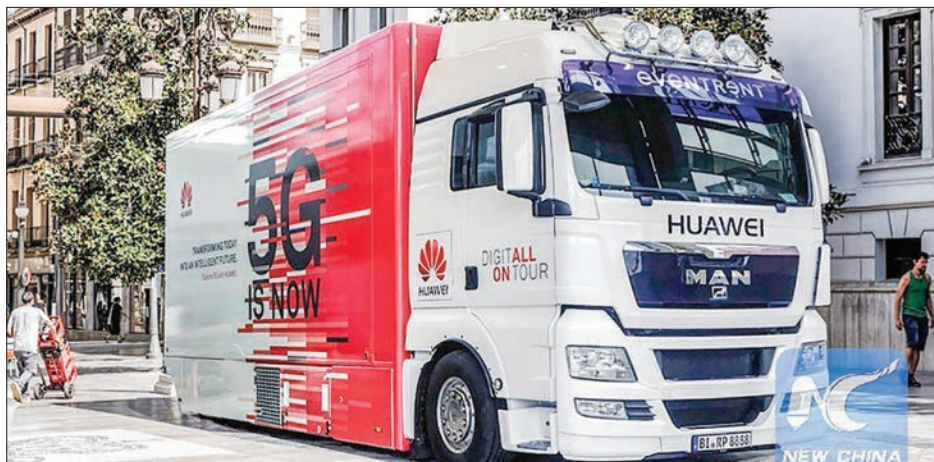
The Huawei 5G truck roadshow is a demonstration center for Huawei's 5G technologies.

Badly hit by the COVID-19 pandemic, the tourism-reliant nation registered an economic contraction of 6.1 percent last year, the worst in more than 20 years. However, the pandemic has significantly accelerated the adoption of digital technologies in