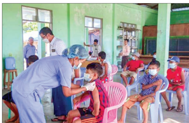
Health staff vaccinates school children in Htantabin Township.

A total of 3,433 students have been vaccinated in the township from 15 to 21 November, officials stated.—Zin Min Htike (Htantabin)/GNLM