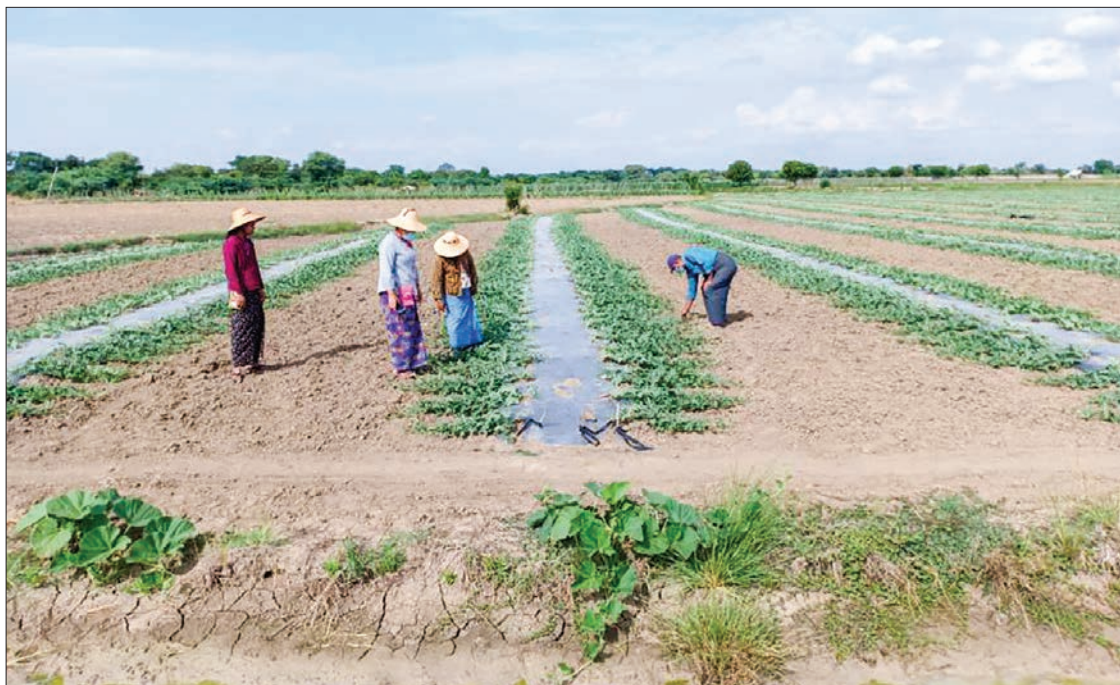
Watermelon plants are under care in the field of crops in ChaungU Township, Sagaing Region.

“Those growers who have kept the seeds cultivate the watermelon this year. Those who