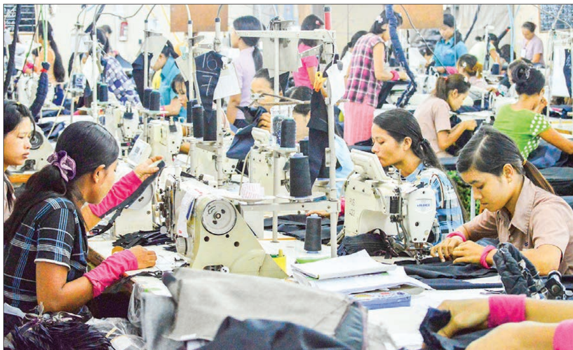
Female workers are busy in production of CMP products at garment factory.

THE imports of raw materials by CMP (cut-make-pack) businesses edged up to US$179.9 million as of 5 November in the current mini-budget period 2021-2022 (Oct-Mar), which reflects a slight increase of $24.5 million compared with the year-ago period, according to the Ministry of Commerce.