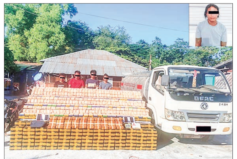
Suspects are seen with seized drugs in Aungmyethazan Township.

Police filed charges against the suspects under the law, and further investigation is being conducted to expose other perpetrators involved the cases. — MNA