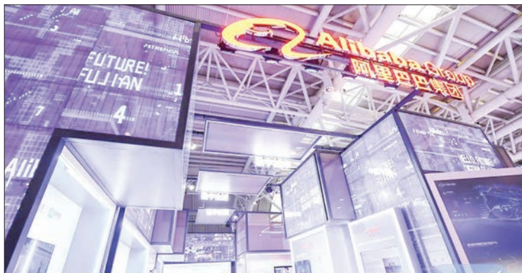
Photo taken on 5 May, 2019 shows the booth of Alibaba Group at the 2 nd Digital China Exhibition in Fuzhou, southeast China's Fujian Province.

CHINESE tech giants including Alibaba Group and Tencent Holdings were fined Saturday for failing to report corporate acquisitions, adding to an anti-monopoly crackdown by the ruling Communist Party.