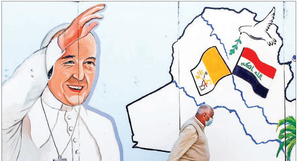
An Iraqi man walks by a mural depicting Pope Francis on the outer walls of Our Lady of Salvation church, in Baghdad, Iraq, ahead of the pontiff's visit in March.