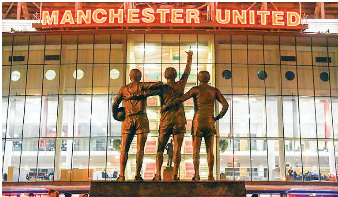
Manchester United sacked Ole Gunnar Solksjaer on Sunday. Manchester United are seeking their fifth new manager since Alex Ferguson stepped down.

MANCHESTER United ended Ole Gunnar Solksjaer's three-year reign as manager at Old Trafford on Sunday following a run of one win in seven Premier League games.