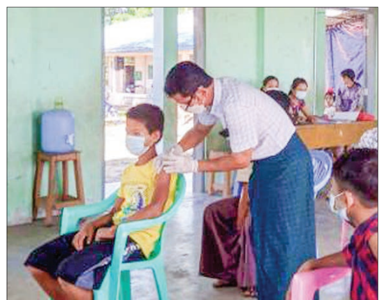
A student receives COVID-19 vaccine in Htantabin Township.