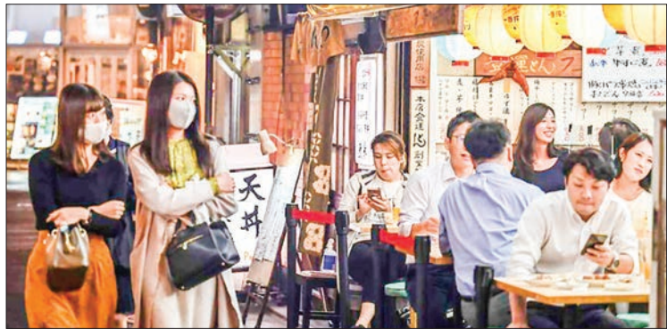
People gather at an izakaya restaurant during a rainy evening in Tokyo on 7 October, 2020.

JAPAN will formally decide Friday to remove an existing spectator cap on attendance at large-scale events and relax rules on food establishments, mostly relating to any future COVID-19 state of emergency, local media reported.