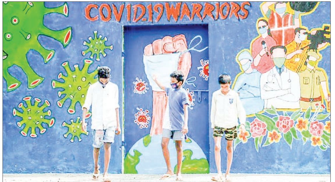
The ministry said the federal government was committed to amplifying India's vaccine coverage and expanding its scope to the far ends of the country.

Information provided by the Indian government said until Saturday morning over 1.15 billion vaccinations have been carried out in the country. — Xinhua ■