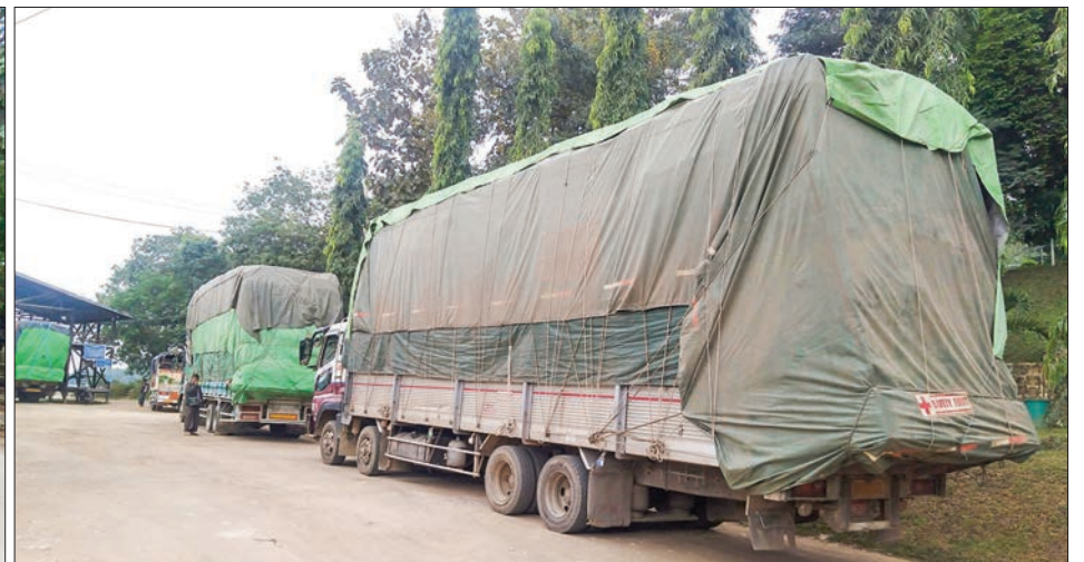
Cargo trucks loaded with medical supplies are rolling along the road to distribute them to regions and states.

THE Ministry of Commerce is arranging the smooth transport of medical supplies for COVID-19 prevention, control and treatment activities through aviation, maritime and border