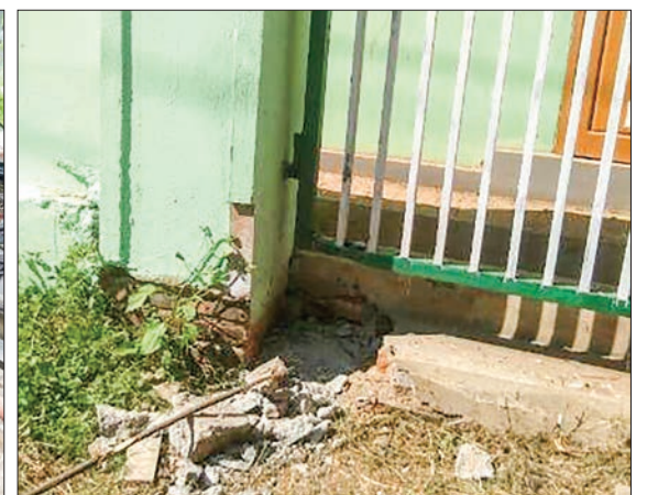
Photo taken on bomb blast at Magway Region Education office on 11-11-2021.