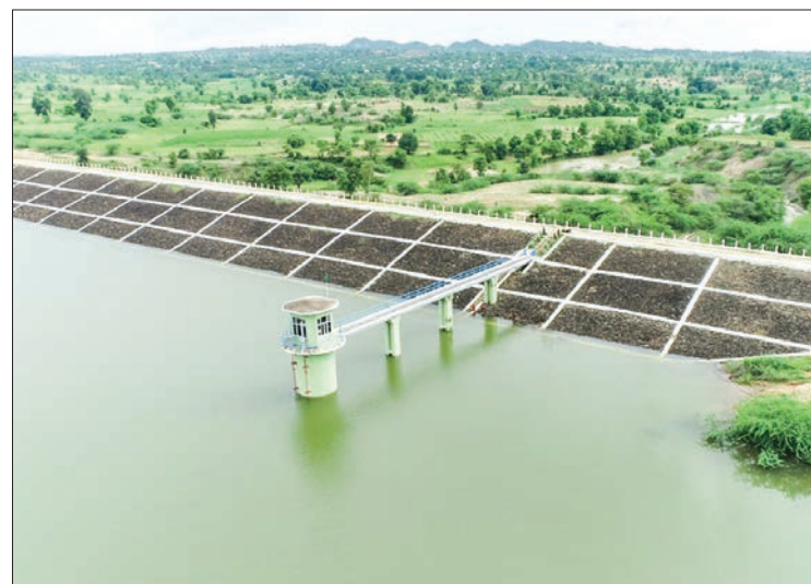
An aerial view shows storage of water at Natmauk Dam in Natmauk Township. PHOTO: THIN THIN MYAT (NATMAUK)

Under the close supervision of U Htein Lin, staff in charge of the township Irrigation and Water Utilization Management Department, is constantly monitoring the flood situation, and local people under the dam have been informed promptly.—Thin Thin Myat (Natmauk)/GNLM