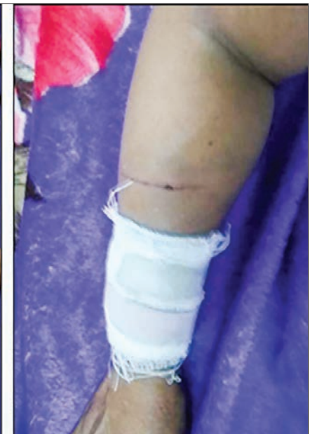
A male sanitation worker was injured in home-made mine blast at Tawkywein station Hospital in Kyaukdaga Township.