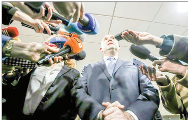
Bulgaria’s incumbent President Rumen Radev says he regrets not helping topple Boyko Borisov’s regime sooner.

BULGARIANS vote on Sunday to elect their president, a largely ceremonial role that the current incumbent has transformed and put at the heart of the struggle against corruption in the EU’s poorest country.