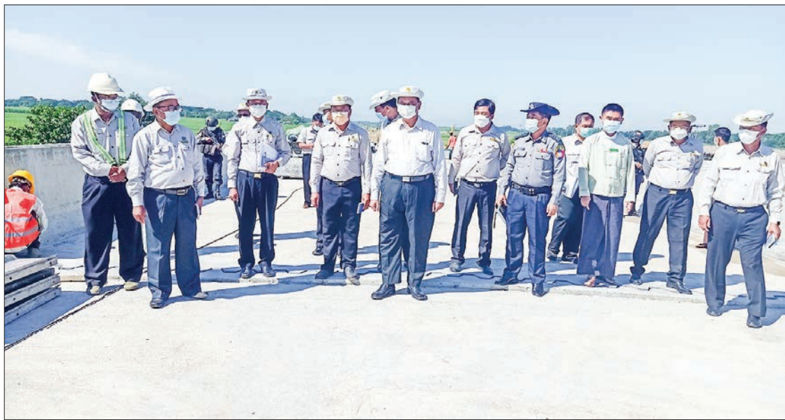
Union Minister for Construction U Shwe Lay views progress of building bridge.

UNION Minister for Construction U Shwe Lay inspected the maintenance of Pyu-Okphyat-Mone Road carried out by Toungoo District Department of Highways, Bago Region on 20 November.