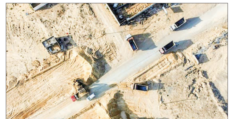
Egypt worked behind the scenes to mediate a ceasefire in the 11-day conflict between Israel and armed Islamist factions that devastated the Gaza Strip and pledged a $500 million package to rebuild the impoverished coastal enclave.