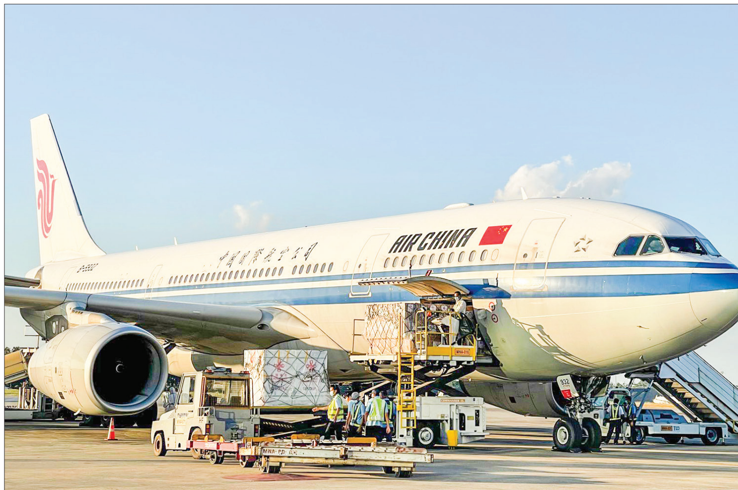
Packages of Sinovac COVID-19 vaccines donated by the People's Republic of China are being unloaded from plane of Air China airlines at Yangon International Airport on 21 November 2021.

The Ministry of Health requested the people to accept COVID-19 vaccinations without fail, take the second time vaccination on the scheduled or in the nearest set period at nearby vaccination centres and urge the family members and friends to take fully vaccinations without fail.—MNA