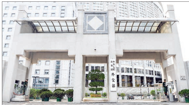
China has decided to downgrade the diplomatic relations with Lithuania to the level of charge d’affaires, the Chinese foreign ministry said on Sunday. PHOTO: XINHUA

That prompted a fierce rebuke from China. It withdrew its ambassador from Lithuania and demanded Vilnius do the same, which it eventually did.—AFP ■