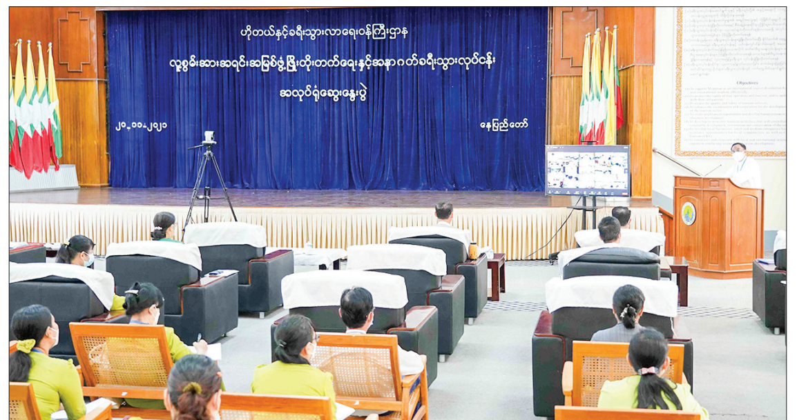
The MoHT workshop on human resources development and future tourism is convened in Nay Pyi Taw on 20 November 2021.