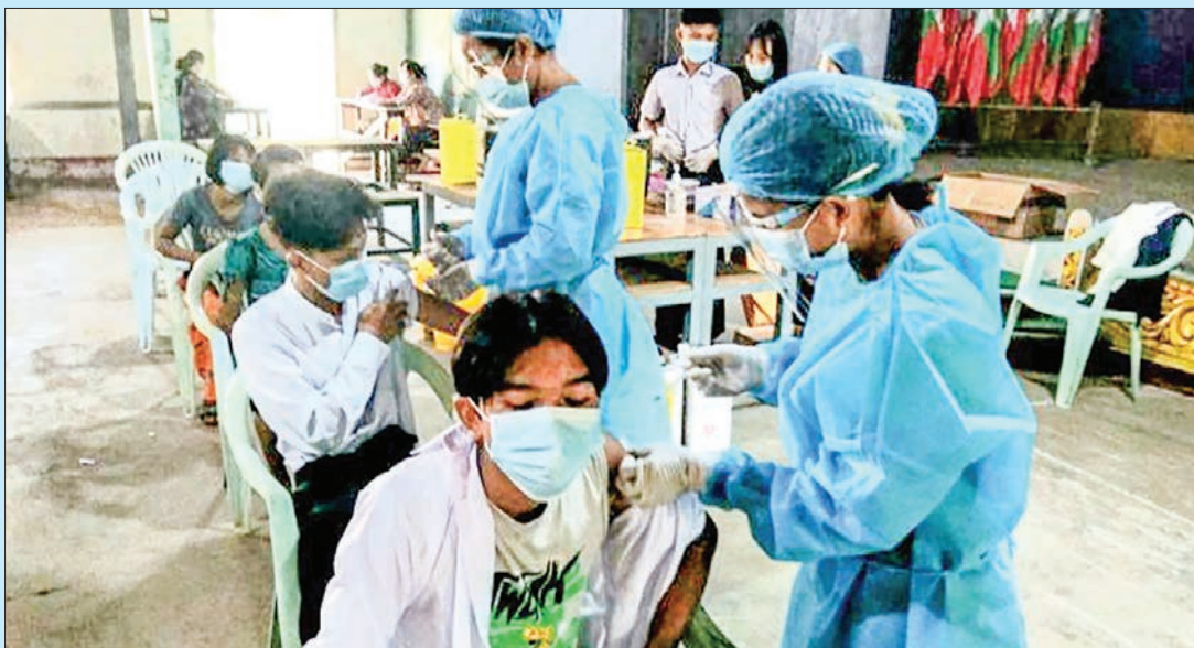
12-year-old students get jabbed against COVID-19 in Pauk Township.