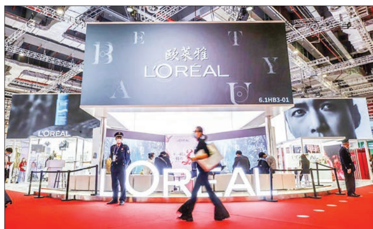
A visitor walks past the booth of L'Oréal at the Consumer Goods exhibition area during the third China International Import Expo (CIIE) in Shanghai, east China, 7 Nov 2020.

FRENCH cosmetics brand L'Oréal Paris has apologized after consumers filed complaints over the price differences in the label's mask products during this year's Singles Day shopping spree.