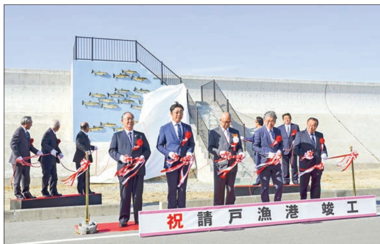
Photo shows Namie Mayor Kazuhiro Yoshida (L, front row) cuts the ribbon at a ceremony in Fukushima Prefecture on 20 Nov 2021.