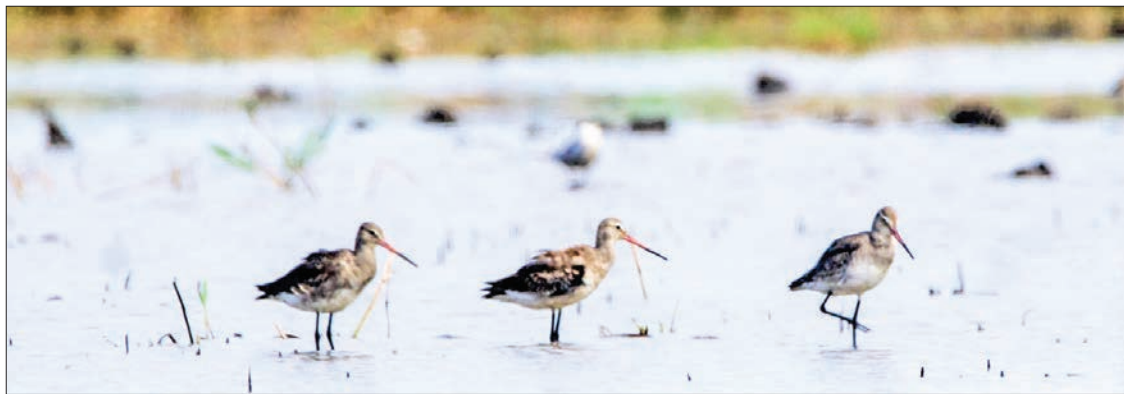
Winter refuge birds are seen at the Moe Yoon Gyi Sanctuary in Bago Region.

ter in the sanctuary and a new species of seagull entered the sanctuary for the first time last year. This year, 11 species of