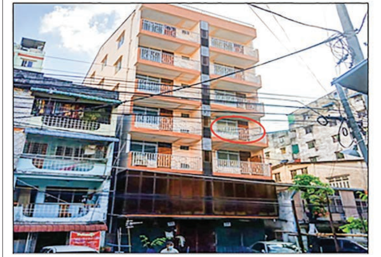
တာမွေမြို့နယ်၊ မေတ္တာညွန့်ရပ်ကွက်၊ ဝဏ္ဏသီရိလမ်း၊ အမှတ်(၅၁)၊ (၃)လွှာ(B) မှတ်တမ်းဓာတ်ပုံ