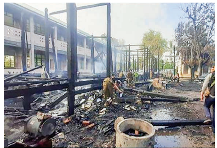
Ravages are seen after arson attack in Kalay.

The public is urged to work together to prevent the terrorists, and if they receive information about the terrorist movement, they should contact the nearest security forces and cooperate with them until the terrorists can no longer stand, authorities stated. — MNA