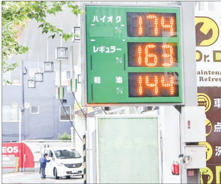
Photo taken on 13 Oct 2021, shows a gas station in Tokyo. The average price for regular gasoline stood at 162.10 yen ($1.4) per litre in Japan on 11 Oct, hitting its highest level since October 2014 amid a recent global surge in crude oil prices.

Reserves releases will likely be implemented in collaboration with the United States, the sources said. Responding to a question in a press briefing Friday about the possibility of a coordinated emergency stockpiles release with Japan and other countries, White House Press Secretary Jen Psaki said Washington has been in discussions with leaders from various countries to ensure there is adequate supply of crude oil, but stopped short of