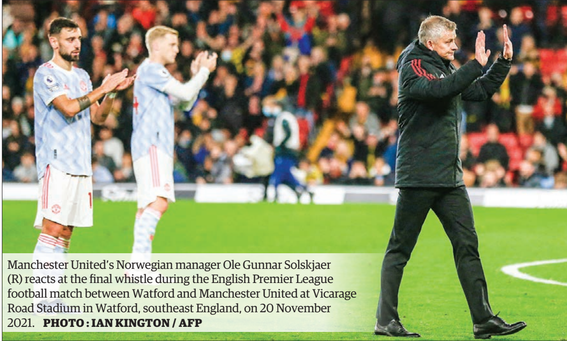
Manchester United's Norwegian manager Ole Gunnar Solskjaer (R) reacts at the final whistle during the English Premier League football match between Watford and Manchester United at Vicarage Road Stadium in Watford, southeast England, on 20 November 2021.

MANCHESTER United slumped to another damaging defeat for manager Ole Gunnar Solskjaer in losing 4-1 at Watford on Saturday as Chelsea thrashed Leicester to extend their Premier League lead to six points.