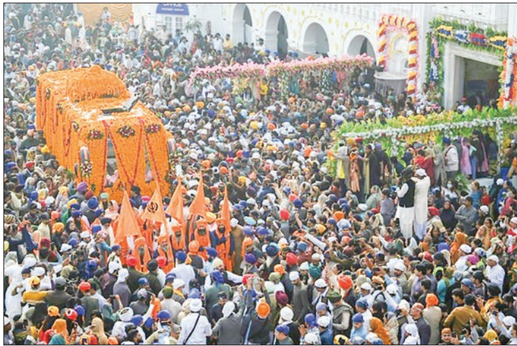
Pilgrims surround a bus carrying the Guru Granth Sahib (Sikh holy book) on the birth anniversary of Guru Nanak Dev, the founder of Sikhism.