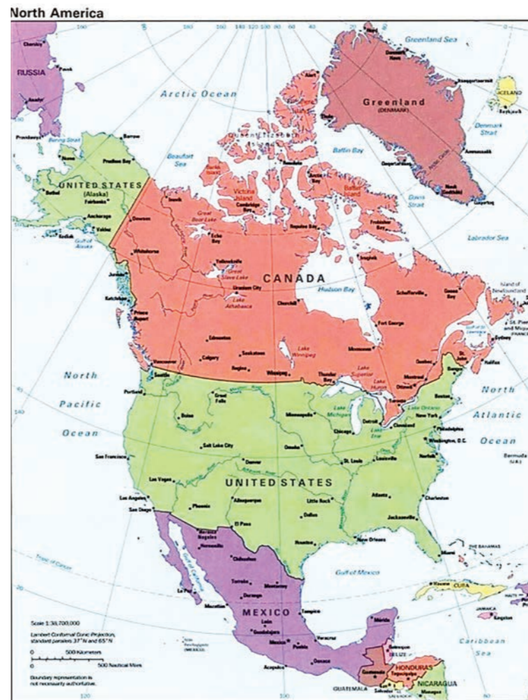
Map of North American Continent.