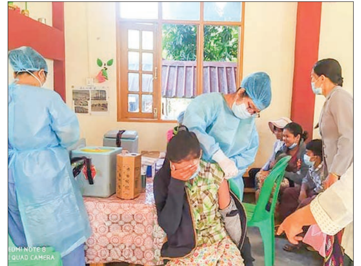
Inoculation programme is underway in Sedoktara.

The vaccination will continue for the rest of the students so that they could access education as soon as possible as well as to effectively prevent the spread of the COVID-19 disease. — Township IPRD/GNLM