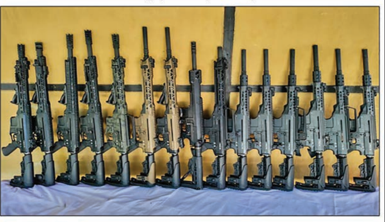
သယ်နိုးကျွန်းမြို့နယ်၊ သုဝဏ္ဏ၊ (၂၉)ရပ်ကွက်၊ သုခိတာလမ်း၊ အမှတ်(၆၇)နေအိမ်မှ သိမ်းဆည်းရမိသော MK-12 မှတ်တမ်းဓာတ်ပုံ