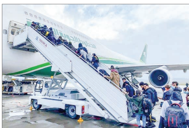
Iraqi migrants preparing to fly home from Minsk airport, Belarus.

According to the Kremlin, Lukashenko and his main ally, Russian President Vladimir Putin, spoke by phone Friday and