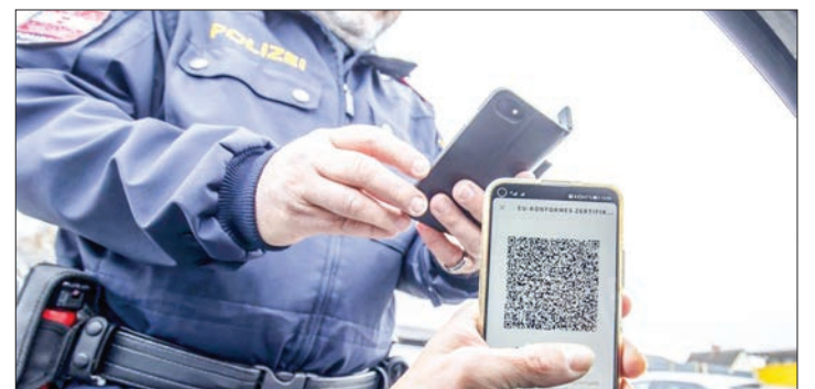
An Austrian police officer checks a driver's digital vaccination certificate.