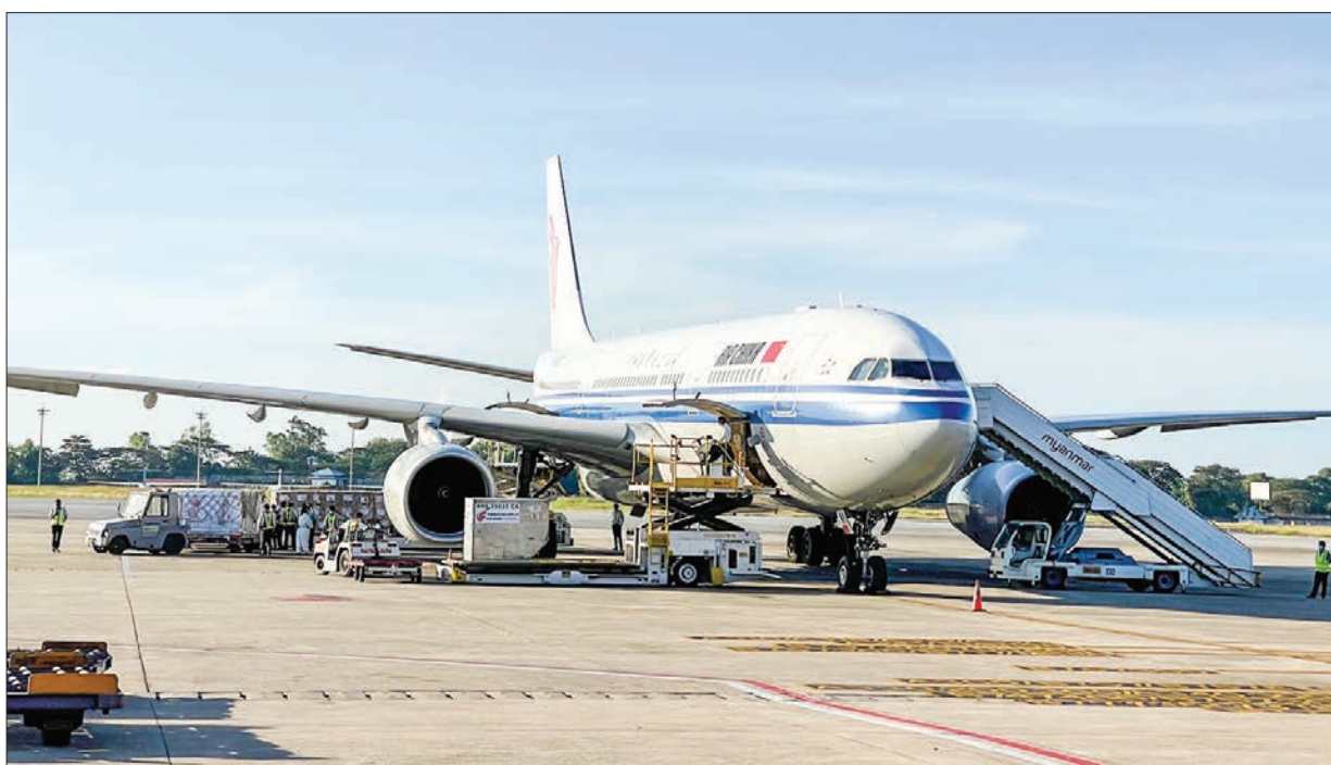
The second batch of one million doses of Sinovac COVID-19 vaccine and syringes arrive in Yangon International Airport on 20 November 2021.

THE Ministry of Health is targeting to control the COVID-19 disease and giving the COVID-19 vaccines to people in Nay Pyi Taw Union Territory, States and Regions according to priority groups.