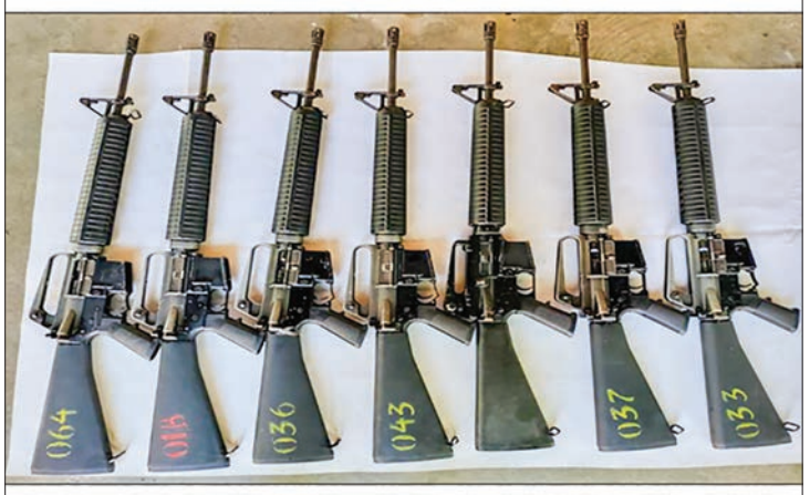
Confiscated M16s and Mk12s in Thingangyun Township.