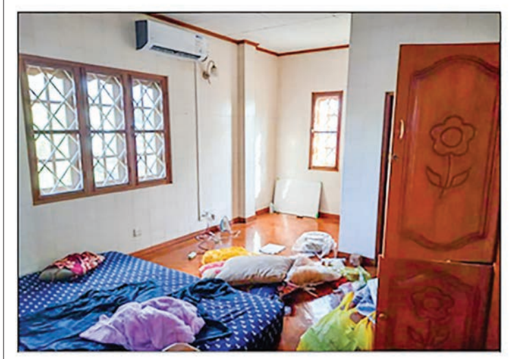
Myitta Nyunt ward, Tamway Township.

in Yangon were identified. Security forces conducted search operations in these places, and the following 18 places were found without any terrorists.