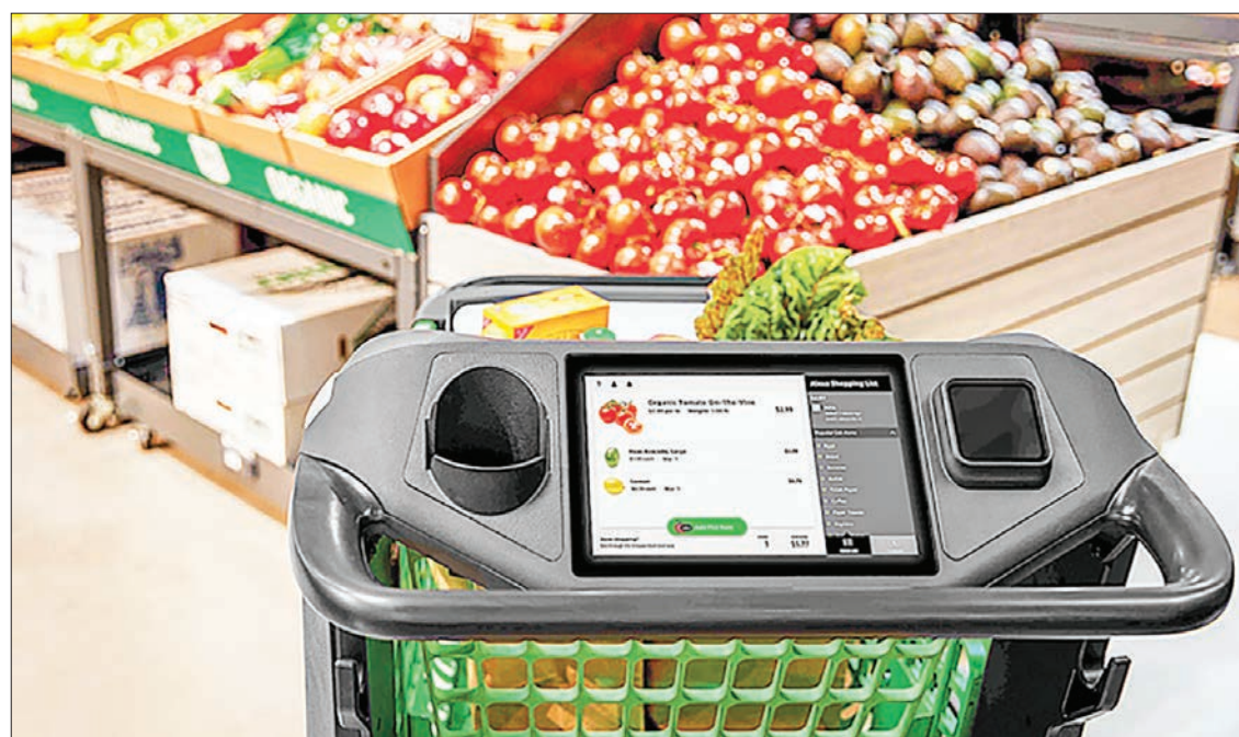
Despite a predicted record holiday spending season, prices rising at the fastest pace in 30 years in the United States will dampen the Christmas spirit for one in ten Americans.

As of the end of September, Japan has reserves for 242 days of domestic consumption, including joint stockpiles with oil-producing countries.—Kyodo ■