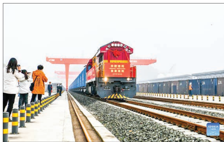
The first direct China-Europe freight train linking southwest China's Guizhou Province and Russia's Moscow sets out from Guiyang, southwest China's Guizhou Province, 18 Nov 2021.

The inland province plans to launch more China-Europe freight train services to destinations such as Poland and Germany.—Xinhua ■