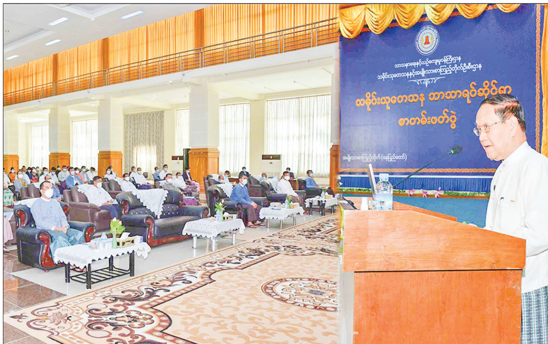
The paper reading session of the Ministry of Religious Affairs and Culture is in progress.

The seminar aimed to approach the history of Myanmar from various perspectives in order to contribute to the country