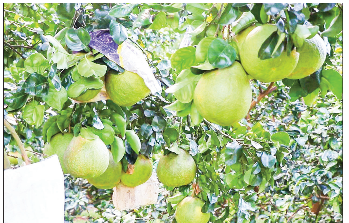
Myanmar has over 20 species of pomelo. But only a few pomelo species are more marketable products in foreign countries. There are over 5,000 acres of pomelo across the country. PHOTO: AUNG MYO THU (MUDON)

The pomelo fruit price is ranging between K1,000 and K5,000 per one depending upon the size. — Aung Myo Thu (Mudon)/GNLM