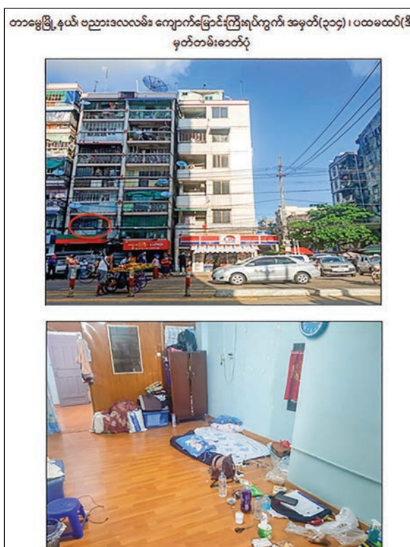
Kyaukmyaung Gyi ward, Tamway Township.

grenades, 180 homemade mines, 163 TNT rounds of ammunition, 9 rounds of C4 ammunition, 800 detonators, 12 satellite phones and related explosives) at No 67, Thukhita road, (29) ward, Thingangyun Township. Security forces also found and confiscated 39 assorted firearms, 76 assorted magazines, and 5,200 rounds of ammunition in No (142), Ngwe Taik Soe, Py-