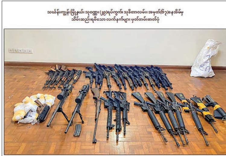
Seized weapons, ammunition and explosives in Thingangyun Township.

Road, South Okkalapa Township - No (23), Khanmarsaung road, Taunglonepyan ward, Mingala Taung Nyunt Township - No (710), Ngamoeyate (3) street, Thingangyun Township - No (523), Ngamoeyate (4) street, Thingangyun Township - 5 th floor, No (291), Thamein Bayan Road, Kyipwayay ward, Thingangyun Township Security forces continued the operation in the rest of the places, and found and confiscated five smoke bombs, 5 22-point