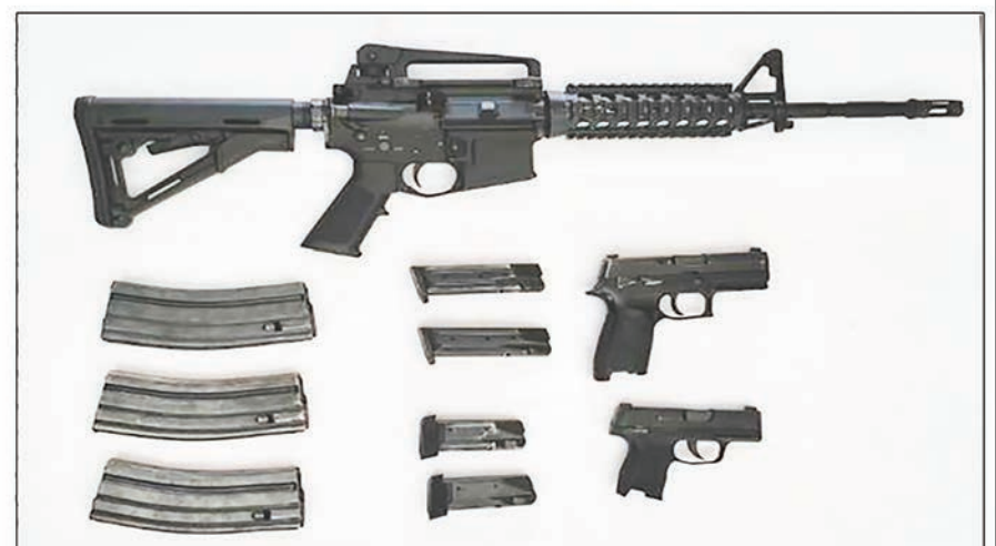
Seized weapons and ammunition from the room of Phyo Zeyar Thaw.