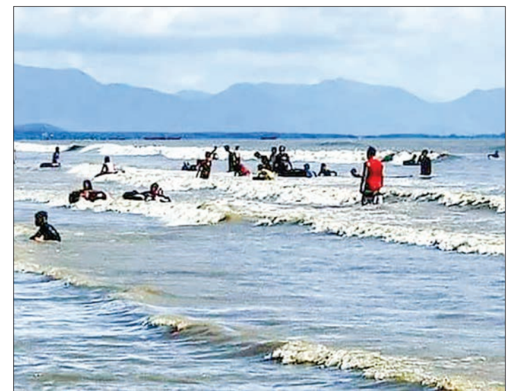
Revellers are seen on the Setse Beach.

THE people across the nation travelled to the Setse beach in Thanbyuzayat Township of Mon State on the full moon day of Tazaungmon.