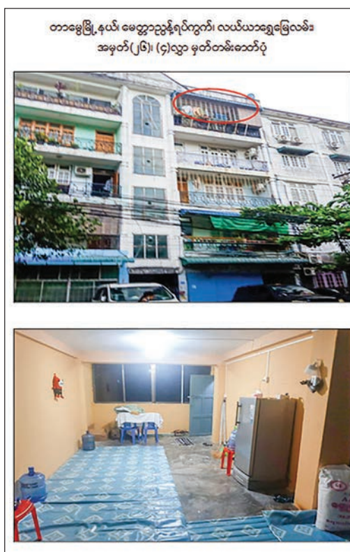
Myitta Nyunt ward, Tamway Township.

bullets and related items used in homemade bomb in No (878), Thadayone street, 47 ward, Dagon Myothit (North) Township, and seven M16 guns, eight AK-47s, 15 Mk12s, three M4 A1, three FCG-9s, two Snipers, one Carbine, 11 pistols, 128 homemade pistols, 50 M16 magazines, 14 AK-47 magazines, 30 Mk12 magazines, 6 FCG-9 magazines, 30 magazines of pistol, 3,850 rounds of 5.56 ammunition, 250 rounds of 7.62 ammunition, 610 rounds of pistol ammunition, 2,700 rounds of 12-volt ammunition, 150 rounds of point-45 ammunition, 1,000 rounds of AK-47 ammunition, 26 40mm bombs, six bombs, 30 items related to Mk12, 18 grenades, 15 grenades, 138 homemade bombs, three big homemade bombs, 39 homemade bombs, 25 bags of gunpowder, 43 bags of homemade gunpowder, 800 detonators, 9 rounds of 1.25 pounds C4 gunpowder, 153 rounds of 0.25 pounds of TNT gunpowder, 14 transistors, 16 keypad phones, seven watches, 12 satellite phones, one radio, five vises of 2.5 inches iron nail (altogether 50 assorted firearms, 128 homemade pistols, 130 assorted magazines, 8,560 assorted rounds of ammunition, 26 40mm bombs, six mines, 33 assorted