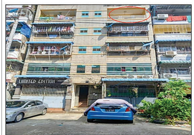
တာမွေမြို့နယ်၊ မေတ္တာညွန့်ရပ်ကွက်၊ မာလာနွယ်လမ်း၊ အမှတ်(၇၆၄)၊ (၄)လွှာ မှတ်တမ်းဓာတ်ပုံ