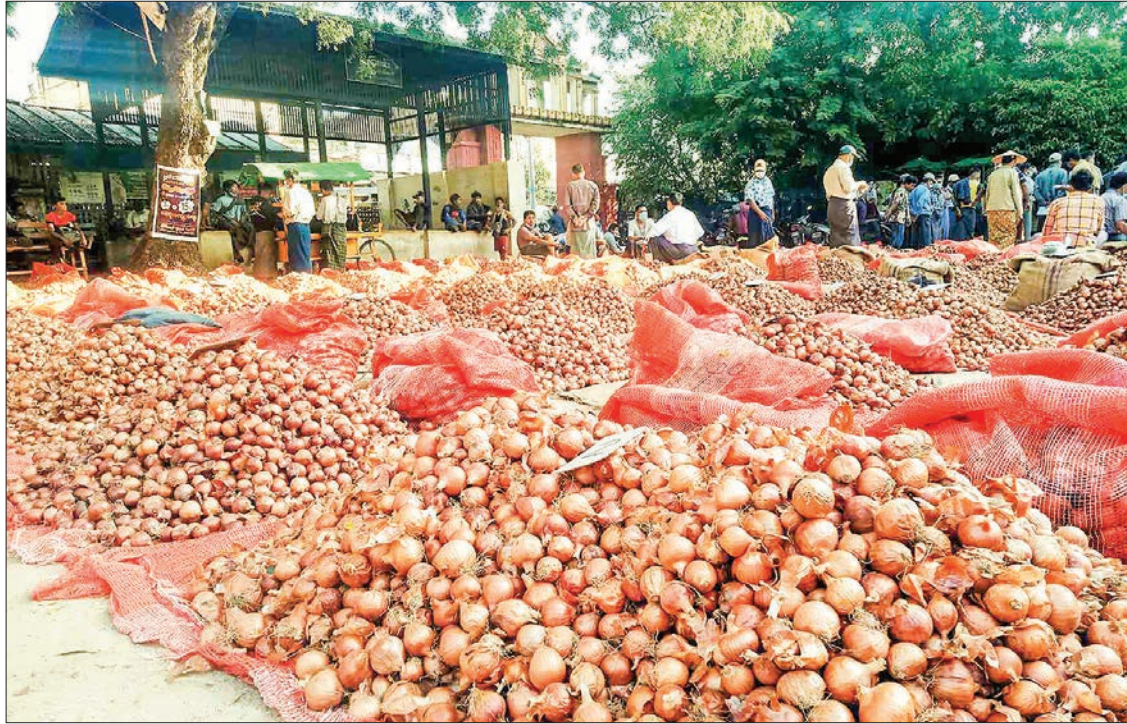
More than 200,000 visses of onions enter the Pakokku market in Pakokku Township, Magway Region on a daily basis but demand is still weak.

In previous years, onions cost between K1,800 and K2,000 per viss. Demand for onions in the local market has fallen sharply due to a huge drop in local demand.