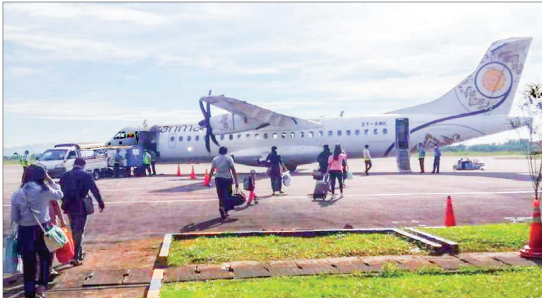
For the convenience of travellers, the Yangon-Myeik-Yangon flight was resumed on 19 November following the health standards and the COVID-19 precaution measures.

The Yangon-Myeik-Yangon route will be operated daily. And Myeik-Dawei and Myeik-Kawthoung flights will be operated from time to time,” said U Aung Moe San, an in-charge of the Myeik branch of the Myanmar National Air-