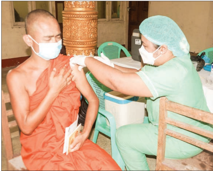
Vaccination drive in Bahan Township.

TO curb COVID-19 disease in Bahan Township, Yangon Region, COVID-19 vaccination continued in the township and people, including elderly persons and civil servants, participated in the activities yesterday at Mingala Market Dhamma