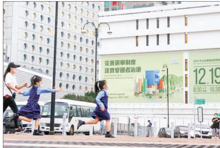
People walk in Hong Kong on 19 Nov 2021, in front of a banner that reads "Ensure Patriots Administering Hong Kong", ahead of a legislative election in December.

The city's No. 2 leader praised the revamped electoral system, pointing out that the candidates were from a "mix of different backgrounds and strata." He also warned those intending to boycott the election that calling on others to cast blank votes would be in violation of the law