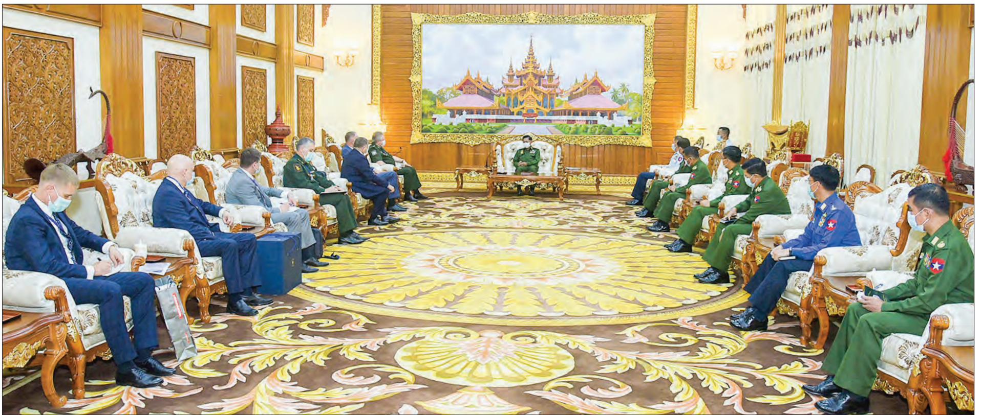
State Administration Council Chairman Commander-in-Chief of Defence Services Senior General Min Aung Hlaing receives the delegation headed by the Chairman of the Russian-Myanmar Military Technological Cooperation Joint Commission Deputy Director of FSMTC of Russia and the Deputy Director-General of JSC "Rosoboronexport" Company in Nay Pyi Taw on 12 November 2021.