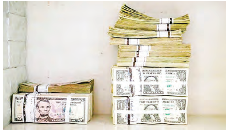
The US dollar against Myanmar Kyat has fallen because the Central Bank of Myanmar (CBM) issued the instruction on 9 November that the foreign exchange transactions must be carried out within ± 0.5 per cent of the reference rate established by the CBM.

CBM is selling the US dollar at an auction rate intending to keep the exchange rate stable. The bank reportedly sold $30 million in November in the auction market. The CBM reportedly sold