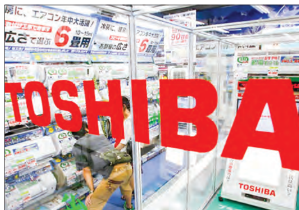
In this 20 July 2015, file photo, shoppers watch air conditioners displayed at an electronics store in Tokyo.

TOSHIBA Corp. said Friday it will split into three listed firms that would focus on infrastructure, devices and semiconductors, in a major overhaul of the embattled Japanese conglomerate facing intense pressure from foreign activist shareholders.