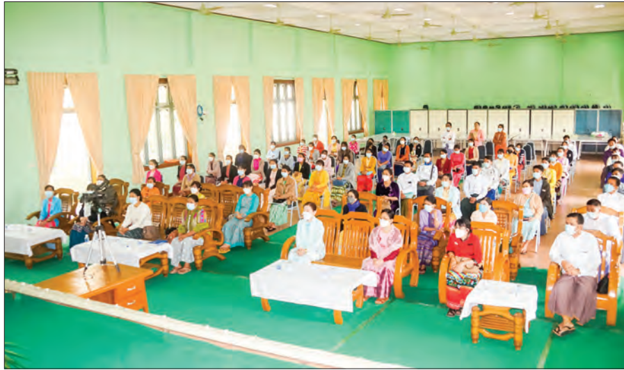
The MoU Signing Ceremony between Kengtung University and Iloilo Science and Technology University of the Philippines in progress online.

WITH the aim of enhancing educational cooperation, Kengtung University, the Ministry of Education of the Republic of the Union of Myanmar, and the Iloilo