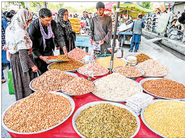
Customers choose dried lentils sold by a vendor at a roadside stall.

AFGHANISTAN is "at the brink of economic collapse" and the international community must urgently resume funding and provide humanitarian assistance, Pakistan's foreign minister warned Thursday at a meeting with US, Chinese, Russian and Taliban diplomats in Islamabad.