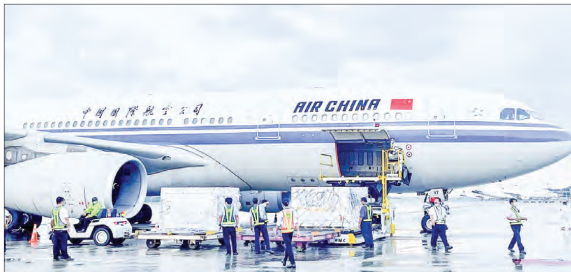
With the donated one million doses of the vaccine and another one million doses purchased from China, which both arrived yesterday, the vaccination against COVID-19 will be continued for the students over the age of 12 across Myanmar.

The Union Minister expressed words of appreciation for the donation at the ceremony and it was concluded in the evening after discussions on issues such as cooperation for COVID-19 immunization, increased monitoring and deployment of health workers along the border, including in Shan State and Kachin State, to reopen the border trade posts and to ensure timely treatment, and implementation of the Myanmar Centre