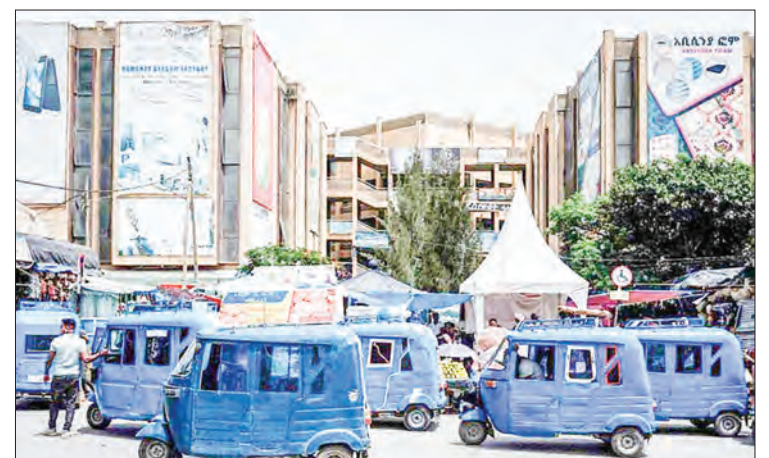
Rebels in Ethiopia's Tigray region have taken control of the regional capital Mekele.