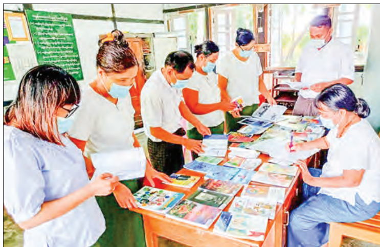
Government staff are seen borrowing books from the IPRD mobile library.

"Those who cannot go to the library can grab the opportunities to read from the mobile library. We will launch further services weekly for the people to be able to return the old books and bor-