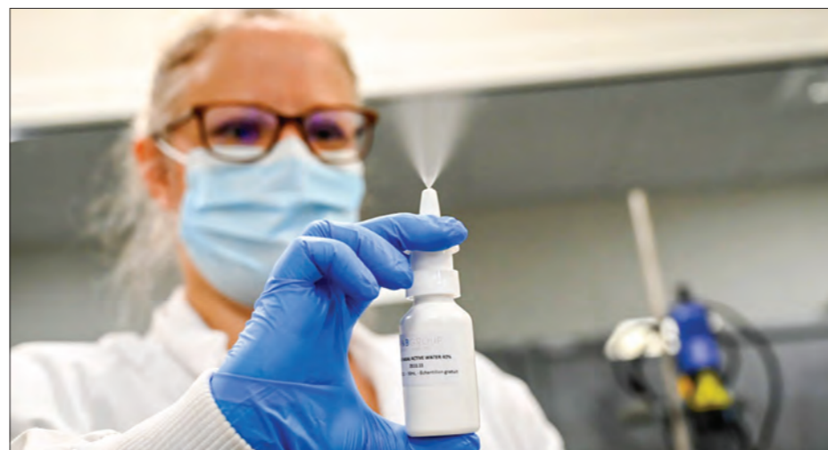
A laboratory worker tests a nasal spray at the Pharma and Beauty factory in Saint-Chamas, south eastern France, on 21 January 2021.

"This covers the entire range of technologies," she told a live interaction