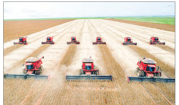
Brazil is the world's largest soybean producer, and number three for maize. Combine harvesters crop soybeans during a demonstration for the press, in Campo Novo do Parecis, in Mato Grosso, Brazil, on 27 March 2012.

The IBGE forecast an increase of 0.8 per cent or 11 million tonnes for soybean production in 2022. Projections for wheat and rice are down.—AFP ■