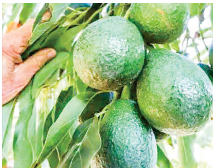
The avocado was introduced into Myanmar over 70 years ago and has become a major fruit in the country.

THE prices of avocado have risen to a record due to reduced harvests from major producers, it is learnt.