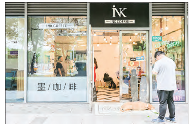
Photo taken on 29 May 2021 shows INK, a cafe in the Hongqiao Business District of Shanghai, east China.

The Moshi-based Tanzanian Coffee Board (TCB) has held the competition since last year, selecting the top 10 coffee varieties of each category and posting the scores and rankings online.—Xinhua ■