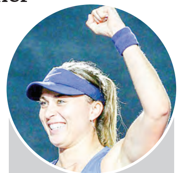
Spain's Paula Badosa celebrates her victory over Aryna Sabalenka of Belarus in the WTA Finals in Guadalajara, Mexico.

The Spaniard next faces Greece's Maria Sakkari, who