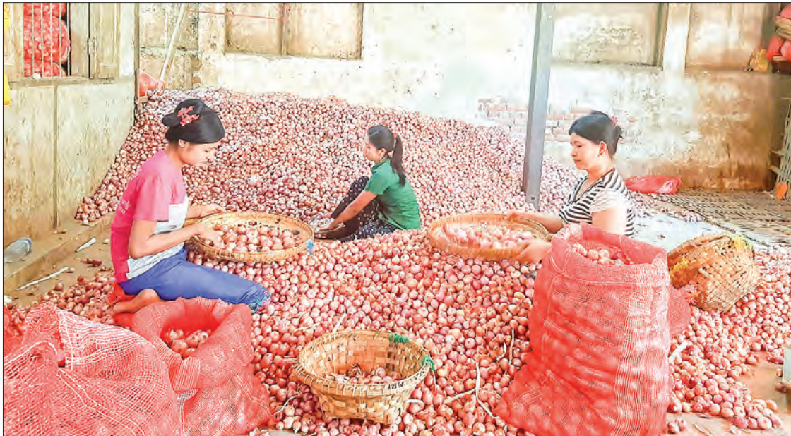
The price of onion has decreased by over K200-K300 per viss depending on the variety and size of the onion, according to the onion market.

Although China purchased the onion from Myanmar in the previous years, this year the price has been falling due to the closure of the Sino-Myanmar border checkpoints during the COVID-19 period.