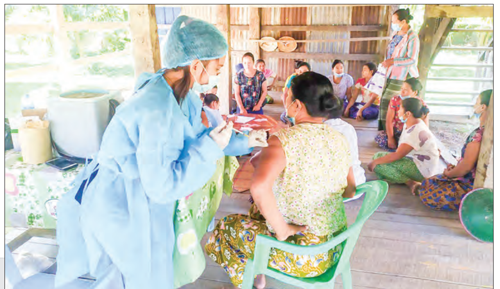
An above 45-year-old female gets inoculated in Homalin Township.

tered at the monasteries of Khataung Pwint Setkya, Pokethoe and Naung-sankyin villages and B.E.H.S Branch in Natnan Village. A total of 915 people — 366 males and 549 females were vaccinated against COVID-19. — E Set (Homalin)/GNLM