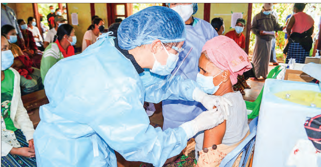
Inoculation drive is underway in northern Shan State.

Staff from the district health department vaccinated 534 people on the first day of the second dose of the COVID-19 vaccine and the remaining people will be vaccinated on the second day, according to the General Administration Department.