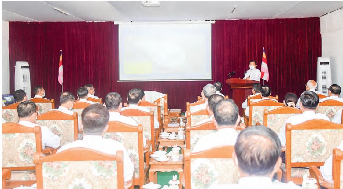
The Senior General explains the plans to build the world-highest stone sculptured Buddha Image.

M ARAVIJAYA Buddha Image is being carved with the aim of showing firmly flourishing of Theravada Buddhism in Myanmar to the world, ensuring peace and tranquillity in the country, contributing to the visits of local and foreign travellers to the regional development and the State development, said Chairman of the State Administration Council Prime Minister Senior General Min Aung Hlaing in explaining carving and building the image in the Buddha Park of Dekkhinathiri Township in Nay Pyi Taw to State level officials at the Buddha Park yesterday