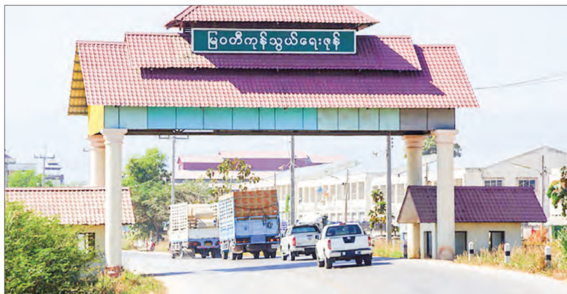
Myawady border trade zone.

Myanmar primarily exports corn, natural gas, fishery products, coal, tin concentrate (SN 71.58 per cent), coconut (fresh and dry), beans, and bamboo shoots to Thailand. It imports capital goods such as machinery, raw industrial goods such as cement and fertilizers, consumer goods such as cosmetics and food products from the neighbouring country. — KK/GNLM