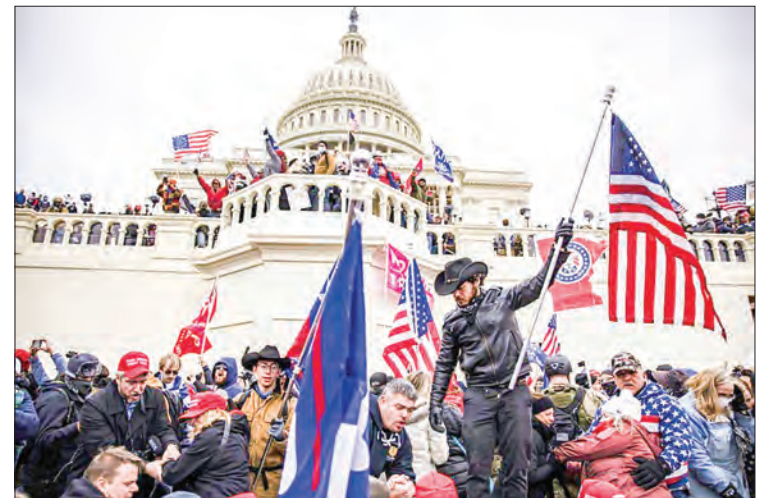
Pro-Trump supporters storm the US Capitol in Washington in January.

On 6 January, hundreds of Trump rampaging supporters overran Congress and delayed a joint session to confirm that Joe Biden had won the November 2020 election and would become