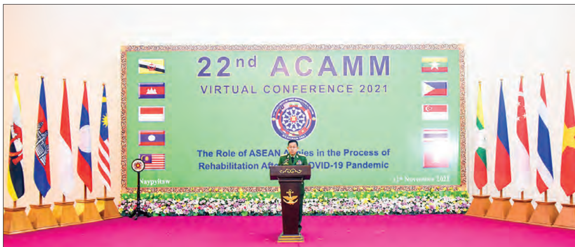
The Vice-Senior General speaks at the virtual conference of the 22nd ASEAN Chiefs of Army Multilateral Meeting yesterday.

THE role of the military institution would play a key role to some extent in global countries where respective governments lead the rehabilitation tasks in short- and long-term plans, said Vice-Chairman of the State Administration Council Deputy Commander-in-Chief of Defence Services Commander-in-Chief (Army) Vice-Senior General Soe Win at the 22nd ASEAN Chiefs of Army Multilateral Meeting through virtual conferencing yesterday morning.