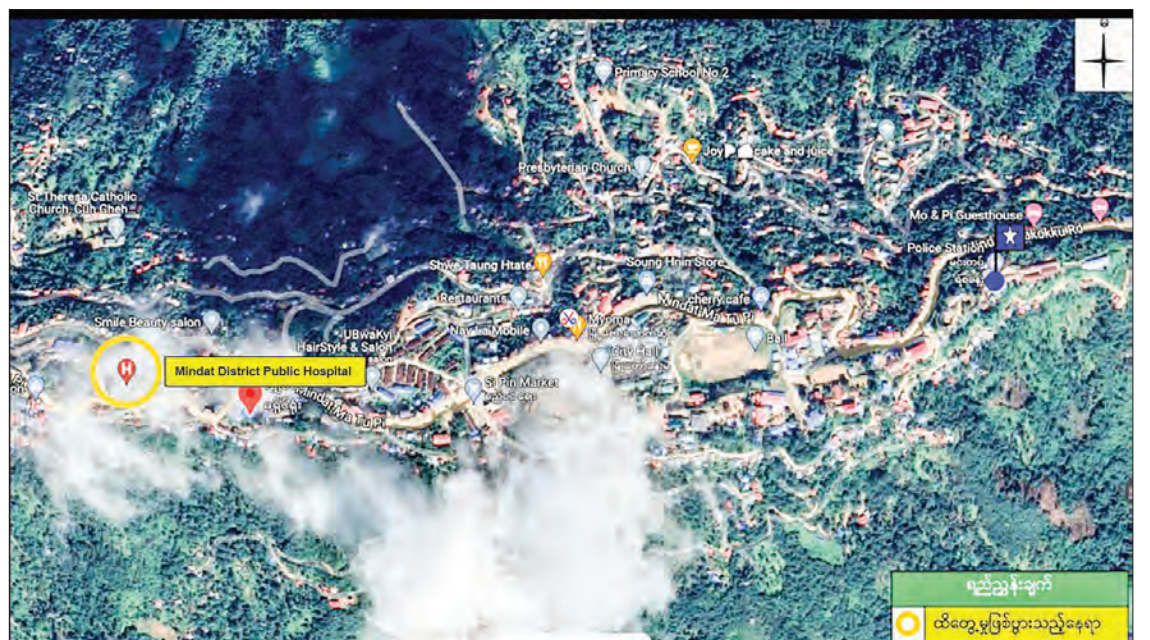
The place of incidence.

It is also reported that security forces are conducting a search operation to arrest and take action against the perpetrators of the above incidents. — MNA