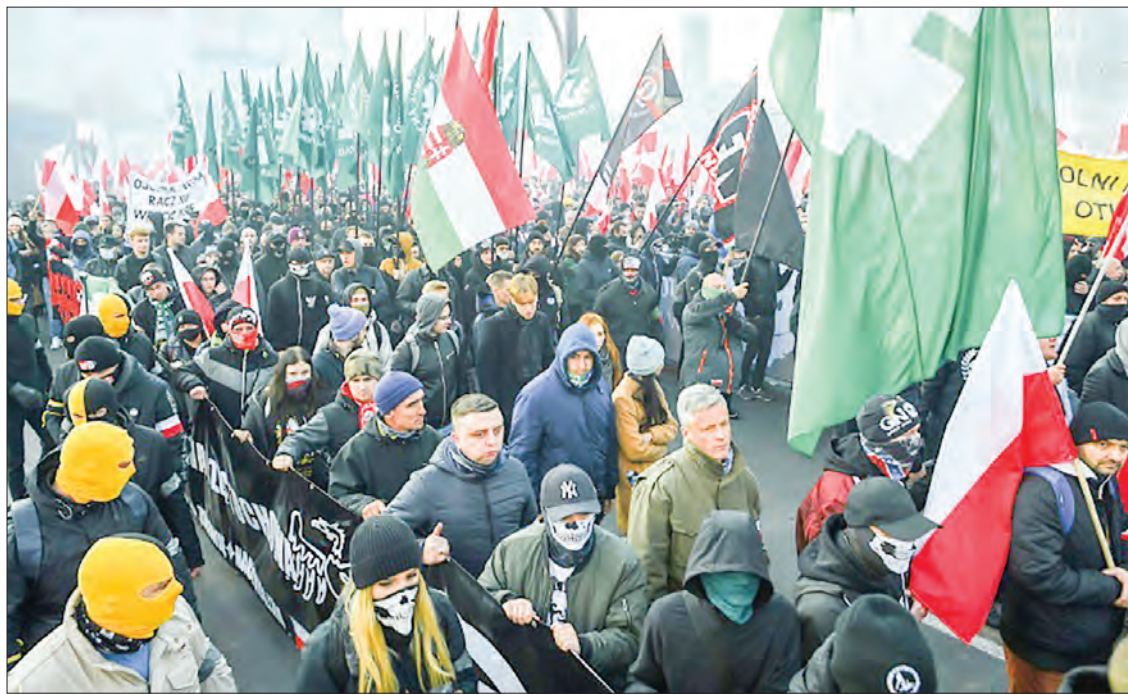
Warsaw's central square was covered with red and white smoke -- the colour of the national flag.

Poland regained its independence on November 11, 1918 after it was partitioned between the Russian empire, Prussia and the Austro-Hungarian Empire for 123 years.—AFP ■