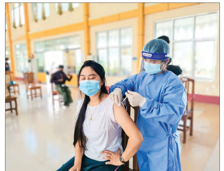
A Hopang local gets jabbed against COVID-19.

THE health officials offered the second dose of vaccines to people aged over 18 at City Hall in Yone Gone Ward of Hopang Township of Wa Self-Administered Division in Shan State (North) yesterday.