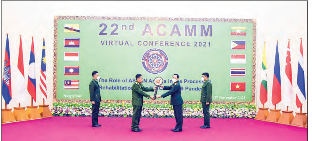
The Vice-Senior General presents the AARM Flag and ACAMM Stand to the Vietnamese Military Attaché in behalf of the Deputy Chief of the General Staff of the Vietnam People's Army at the handover event for host duty.