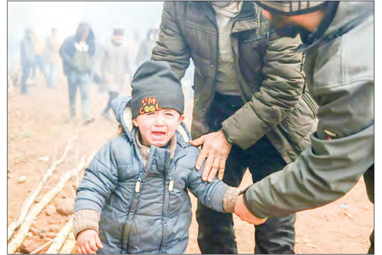
Pressure is building to address the plight of hundreds of migrants, mainly Kurds from the Middle East, who are stuck at the Belarus-Poland border in freezing weather.

EUROPEAN countries and the US condemned Belarus Thursday over a crisis that has seen hundreds of migrants trapped on its border with Poland, after an emergency meeting at the UN Security Council on the tense standoff between Minsk and the EU.