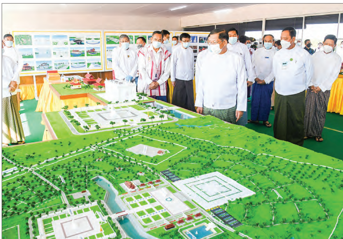
The Senior General views the scale-model of the Buddha Image.

Upon completion, the image would be 63 feet high and