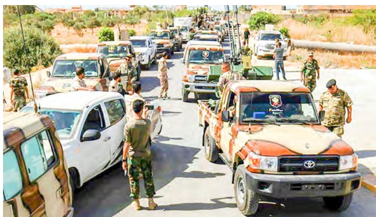
Members of the pro-Haftar eastern Libyan National Army gather in the city of Benghazi in June 2020; the UN estimates that 20,000 mercenaries and foreign fighters are deployed in Libya.

The commission is tasked with implementing a ceasefire brokered by the UN in October last year between the rival eastern and western camps.—AFP ■