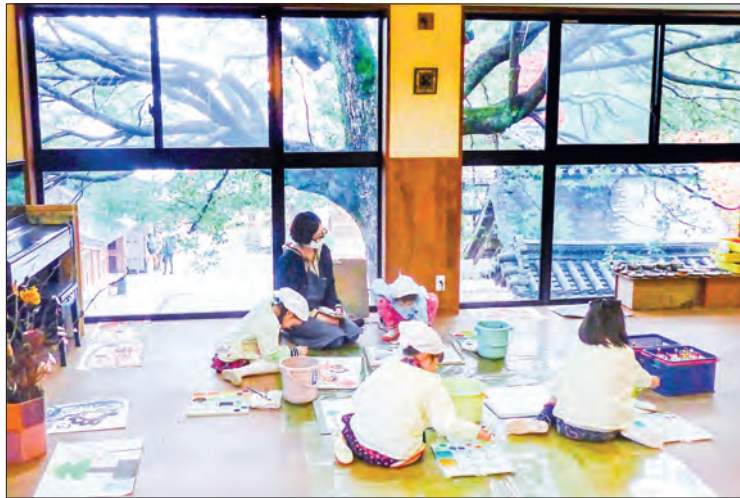
Japan's new stimulus package with fiscal spending expected to exceed 30 trillion yen ($263 billion) will include wage hikes for care workers, nursery school staff and nurses. Children draw pictures at the Iwaya Nursery School in Kyoto.

The government is seeking to pass a supplementary budget during an extraordinary parliamentary session to be convened by year-end to fund the package, which will also include a subsidy program for domestic tourism and financial support for struggling households and students.