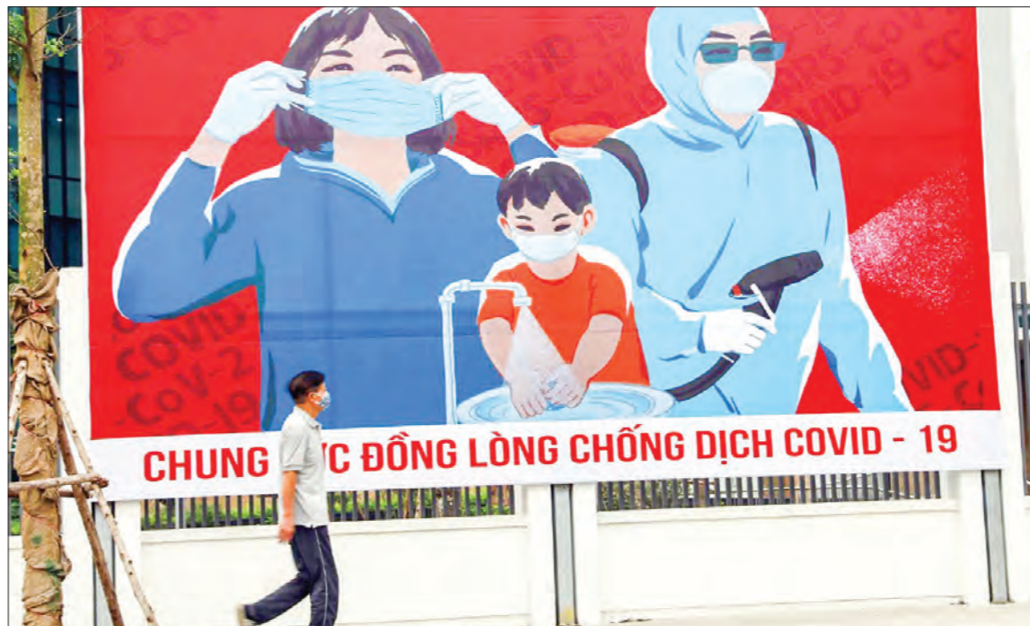
A man walks past a Covid-19 fight poster in the capital city of Hanoi, Vietnam, on 1 April 2020.

In the latest circular released on Tuesday, Prime Minister Pham Minh Chinh called for further step-