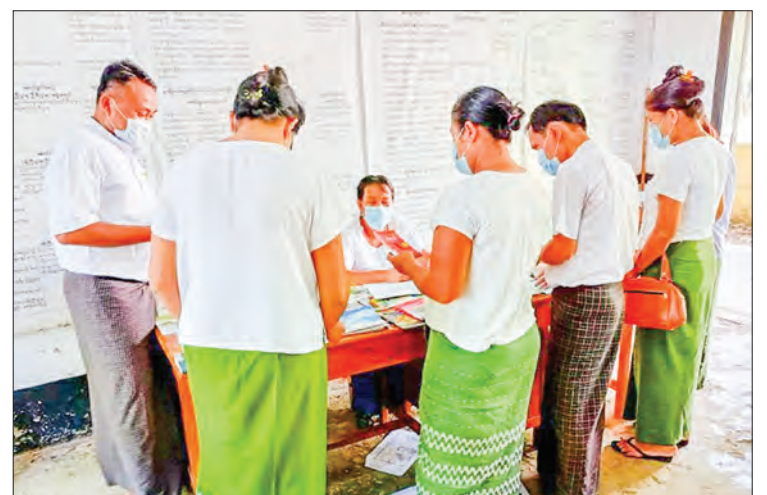
Government staff are seen borrowing books from the IPRD mobile library.