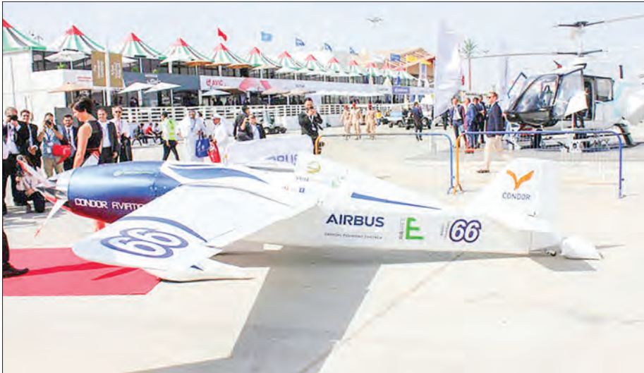
Official unveiling of the world's first electric race plane at Dubai Airshow 2019. The E-Racer model on display at the Dubai Airshow is nicknamed 'White Lightning'.

Air traffic has bounced back since then, though it was still 53 per cent lower in September than its pre-pandemic levels. Air shows usually serve as a platform for companies to announce orders of aircraft, but expectations are