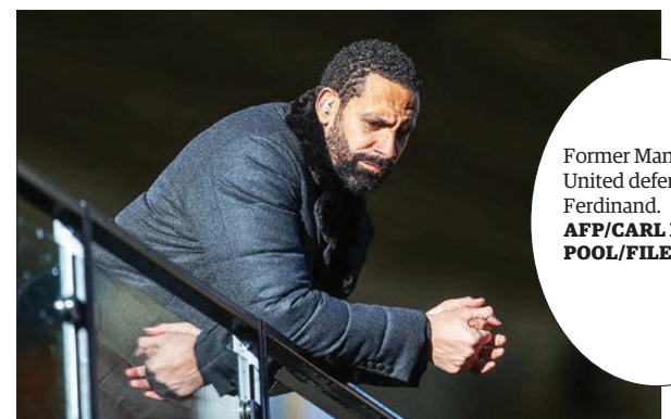
Former Manchester United defender Rio Ferdinand.

RIO Ferdinand has called for Ole Gunnar Solskjaer to hand over the Manchester United manager's "baton" after a string of damaging results left the club well off the pace in the Premier League.