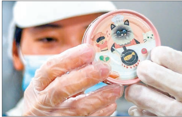
Scientists in Taiwan have developed cat food developed from silkworm pupae.

LICKING its lips imperiously, a ginger cat mops up every last morsel of food from its curly whiskers, clearly undaunted by its supper's rather unusual base ingredient -- silkworm pupae.