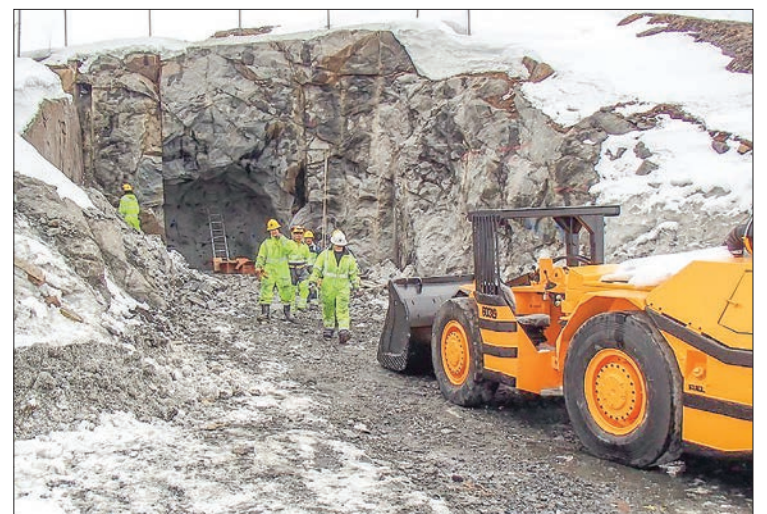
Students emerge from the KTI mine-training facility in Sisimiut, Greenland. The country is banking on the emergence of a mining sector that would generate income and jobs.

The IA won 12 seats in the 31-seat Greenlandic national assembly, beating its rival Siumut, a social democratic party that had dominated politics in the island territory since it gained autonomy in 1979. On Tuesday 12 MPs in the national assembly voted to ban uranium mining, with nine voting against. The IA had campaigned against exploiting the Kuannersuit deposit, which is located in fjords in the island's south and is considered one of the world's richest in uranium and rare earth minerals.