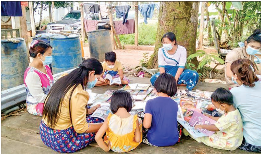
Children are seen reading books from the IPRD mobile library.

THE Information and Public Relations Department (IPRD) conducted a mobile library field visit in Pyigyimandaing town of Kawthoung District in Taninthayi Region yesterday.