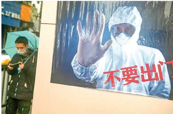
Beijing’s rigorous anti-virus stance has been used as political capital to extol the virtues of China’s leaders.

But the current outbreak has hit more than 40 cities, and