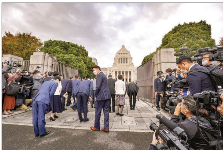
Lawmakers head to the parliament in Tokyo in the morning on 10 November 2021.

The government set up a number of committees for realizing Kishida's vision of a "new capitalism" that focuses on economic growth and redistribution of wealth, and he held phone talks with world leaders, including US President Joe Biden to realize a free and open Indo-Pacific region, Matsuno said