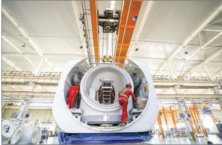
Employees work at a wind turbine plant of Goldwind Science and Technology Co., Ltd. in Hami, northwest China's Xinjiang Uygur Autonomous Region, 25 April 2020.

PACIFIC Rim trade and foreign ministers agreed to push for a freeze on fossil fuel subsidies at a virtual summit Wednesday but host Prime Minister Jacinda Ardern of New Zealand said more "bold" action on climate change was needed.