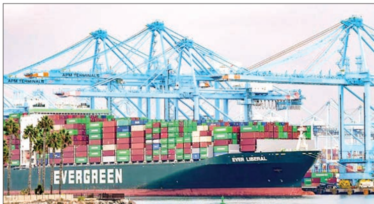
Snarls at American ports have exacerbated supply chain woes that are threatening to wreak havoc on the 2021 Christmas shopping season.

SNARLS at American ports have exacerbated supply chain woes that are threatening to wreak havoc on the 2021 Christmas shopping season.