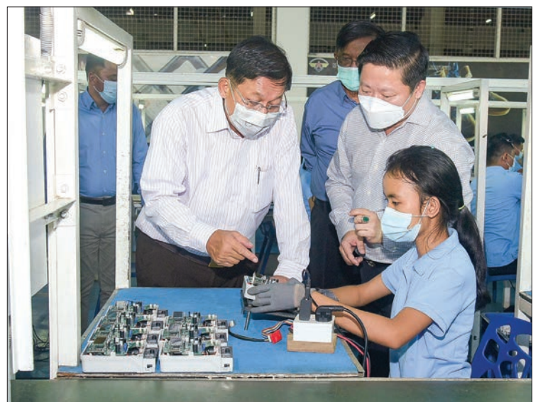
The Senior General views around the factories in the Indagaw Industrial Zone (top and left photos).

their electric bills, arrange electrification across the nation, review the electric bills in comparison with those of ASEAN countries and the international community for creating cheap rate of electric bills for the people. The Senior General stressed the need to reduce the use of firewood in cooking at villages not to cause environmental impacts. To be able to reduce the use of firewood, it is necessary to increase the generation of electricity while