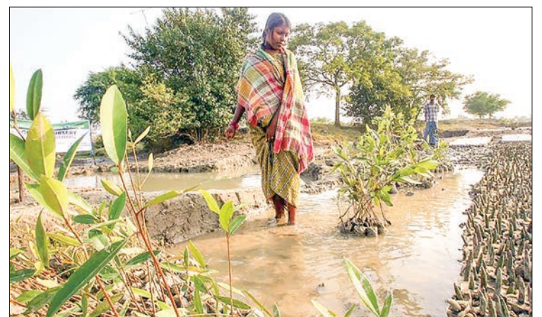
This file picture from 2008 shows mangrove seedlings planted at a nursery in the Sunderbans.

They can help fight climate change by sequestering millions of tonnes of carbon each year in their leaves, trunks, roots and the soil.—AFP ■