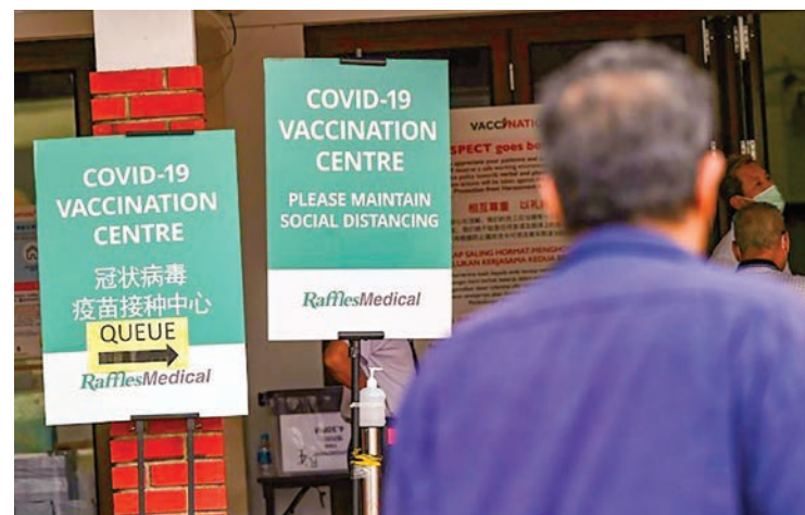
Singapore has said it will stop paying the coronavirus medical bills of people who are unvaccinated by choice.

world’s highest vaccination rates, with 85 per cent of its 5.5 million population fully inoculated.