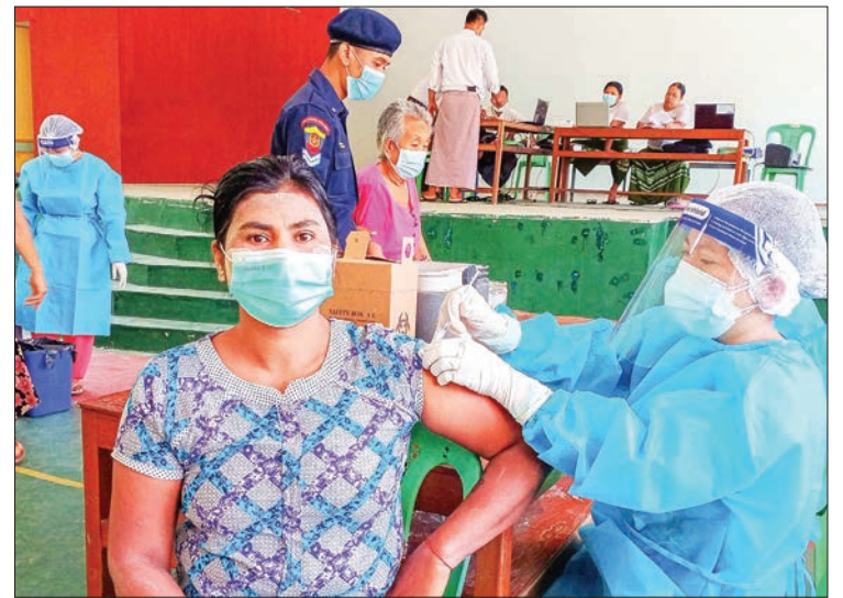
A Kyaukpyu resident gets vaccinated against COVID-19.