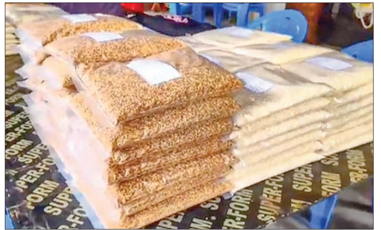
Myanmar's Shwebo Pawsanmhwé Growers and Exporters Association, with the support of GRET Myanmar together with France, is making efforts for Shwebo Pawsan to get the internationally recognized Geographical Indicating (GI) designation.

Pawsan rice was previously grown in the Ayeyawady delta region. Now, it is cultivated across the country. There are about 1.3 million acres of Pawsan rice crop every year. Pawsan varieties vary in different regions and harvest seasons.