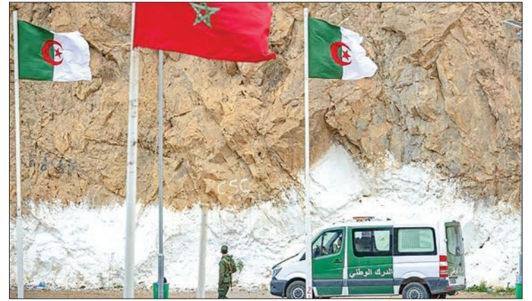
Closed since 1994, the border between Algeria and Morocco has been tightly sealed since 2013 ending visits between the many families that straddle the frontier.

The frontier has been sealed ever since, and there is little prospect of it opening soon as tensions mount once again between Rabat and Algiers.—AFP ■