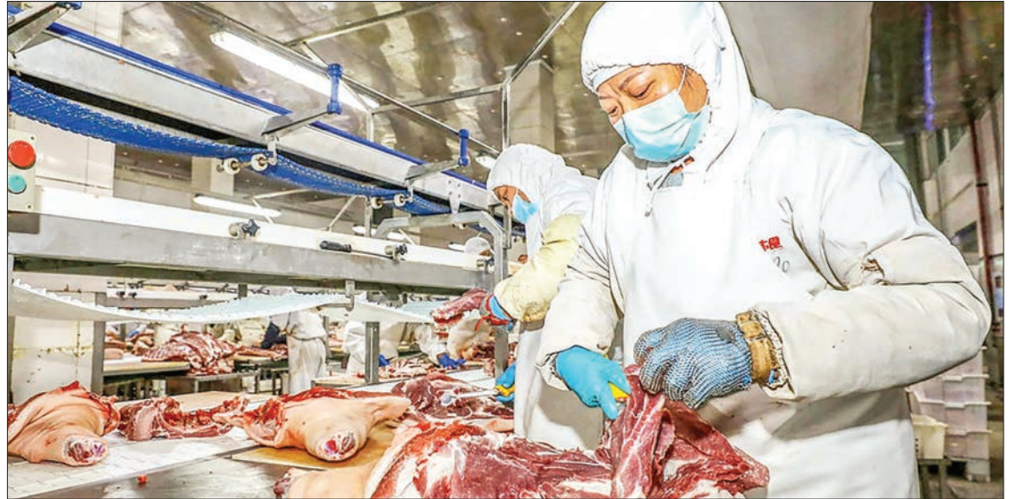
This photo taken on 7 November 2021 shows workers processing pork meat at a facility in Huaian in China's eastern Jiangsu province.