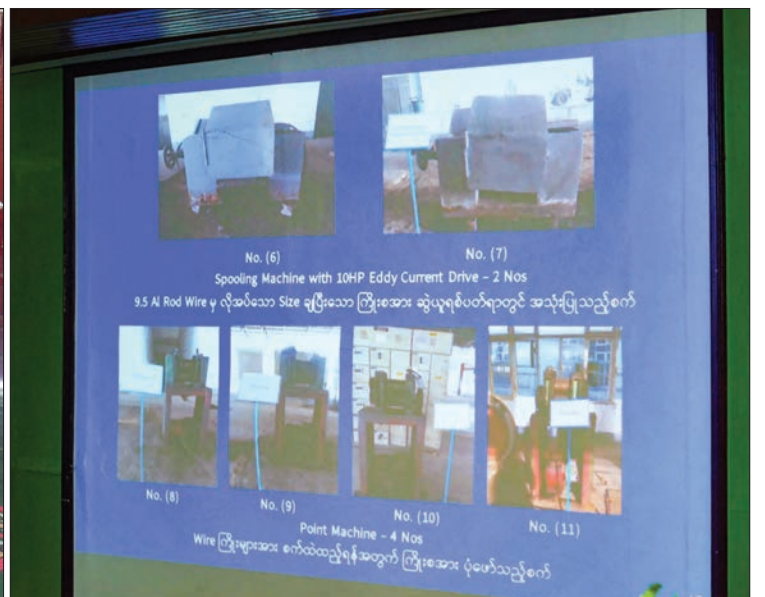
The Senior General hears the reports on the background history and production processes of the Indagaw Industrial Zone.

FROM PAGE-1 bills in connection with the mobile banking systems, control of electricity loss to some extent, connection with other urban tasks, inspection on consumption of electricity in time, Union Minister for Electricity and Energy U Aung Than Oo on needs of electric meters across the nation and supply of electricity. In his response, the Senior General instructed officials to resume operation of the halted machines, systematically