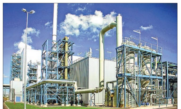
A carbon capture and storage plant in Germany.

an Australian one that's focused on technology not taxes and this Fund backs in Australian companies to find new solutions," Morrison said in a statement. However, in order to establish the fund, the government must first pass legislation expanding the remit of the CEFC to allow it to invest in CCS.—Xinhua ■