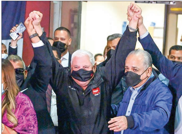
The former Panamanian leader was accused of embezzling public funds to spy on his opponents when he was in power.

PANAMA'S ex-president Ricardo Martinelli was acquitted on Tuesday in a trial for alleged espionage against opponents of his government when he was in power between 2009 and 2014.