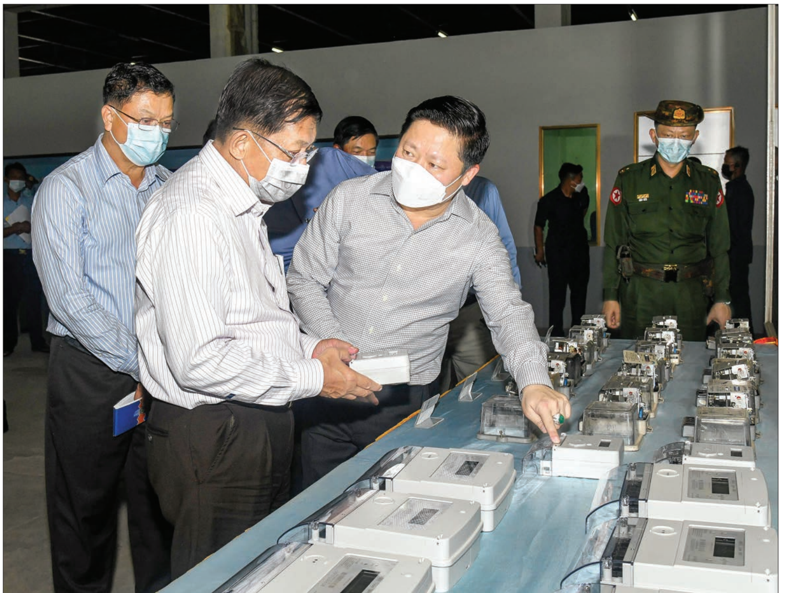
State Administration Council Chairman Prime Minister Senior General Min Aung Hlaing views the electric meters at Ever Meter Factory in Indagaw Industrial Zone of the Bago Region on 10 November 2021.