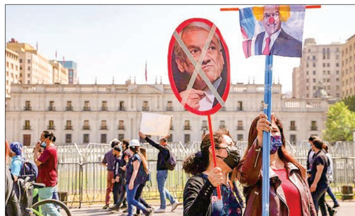
This is the second impeachment case brought against Chilean President Sebastian Pinera, who has faced waves of popular unrest.