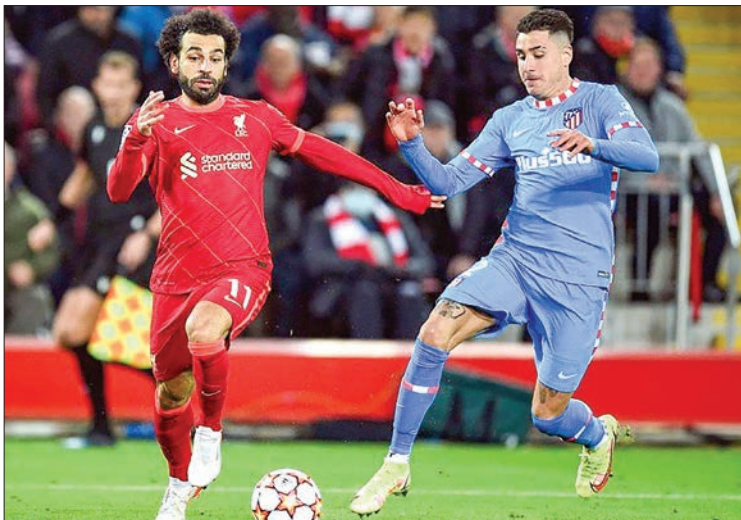
Egypt captain Mohamed Salah (L) playing for Liverpool against Atletico Madrid in the Champions League at Anfield.

LIVERPOOL marksman Mo Salah leads Egypt against Angola this weekend with the clear