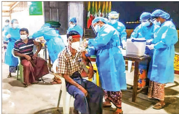
Vaccination is underway in Pakokku.

A total of 47,686 people, including 10,336 monks and nuns, 5,010 elderly people, 5,857 healthcare staff and fam-