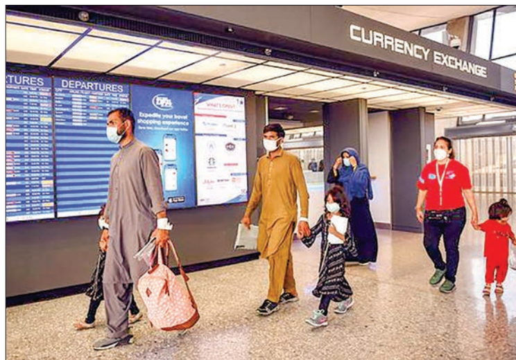
A volunteer helps Afghan refugees to board a bus after arriving on a flight at Dulles International Airport in Chantilly, Virginia on 23 August 2021.

Some 70,000 Afghans have landed in the United States as part of “Operation Allies Welcome”, launched amid the August evacuation of tens of thousands of people from Afghanistan, as the country fell to the Islamist Taliban following the withdrawal of US troops from the country. Afghans who arrived in the United States on or after 30 July this year will be able to take advantage of simplified procedures to get a prized “green card”, or permanent resident status, as well as various work permits, the DHS said in a statement. They will also not have to