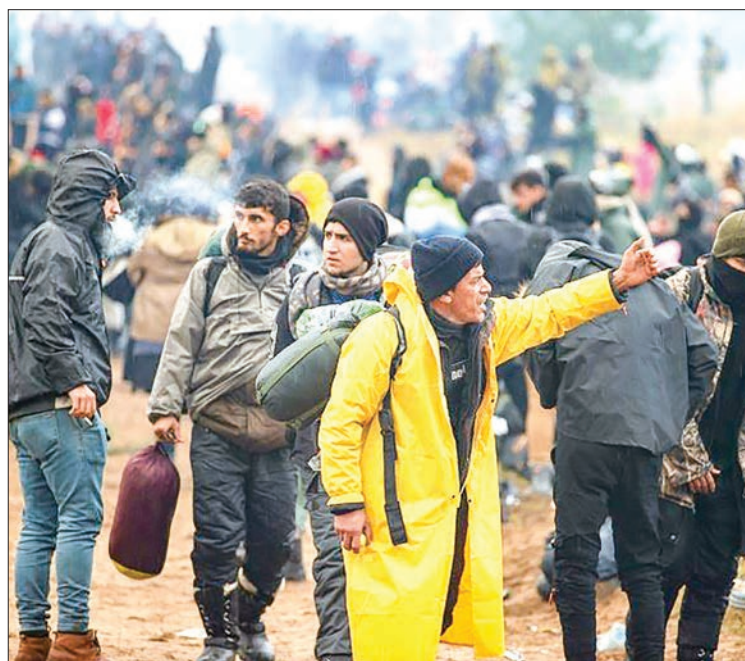
Western powers have accused Belarus of using the migrants as political pawns.

POLAND said it blocked a bid by hundreds of migrants to illegally enter the country from Belarus on Monday, warning of an "armed" escalation as thousands more massed near the border.