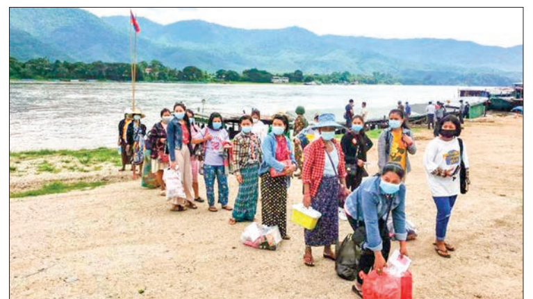
Returnees from Laos queue up for the reception process.

Tachilek has been accepting Myanmar nationals returning from Laos since 30 July, and a total of 4,354 male and female returnees have been repatriated, officials added. — Yar Say (IPRD)/GNLM