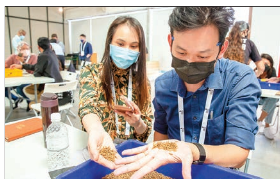
ASEAN Youth Fellows learning about how the black soldier fly is used to turn food waste into high-value biomaterials for industrial use during a visit to biotech start-up Insectta.

partnerships among the ASEAN communities, and the role youths can play in amplifying impactful voices responsibly to build a sustainable future.