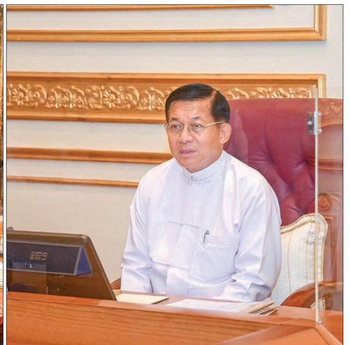
State Administration Council Chairman Prime Minister Senior General Min Aung Hlaing addresses the SAC meeting 17/2021 in Nay Pyi Taw on 9 November 2021.

I T is necessary to emphasize that the country can be built with the strength of educated persons but non-educated ones, said Chairman of the State Administration Council Prime Minister Senior General Min Aung Hlaing at the meeting 17/2021 of the State Administration Council at the SAC Chairman's Office yesterday afternoon.