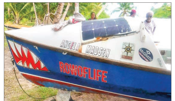
The late US Paralympian and ocean rower Angela Madsen's boat has washed up on a Marshall Islands atoll, locals say.

was never recovered and spent more than a year drifting the ocean currents. Marshall Islander Benjamin Chutaro said it washed up in late October on the shore of Mili Island, about 120 kilometres (75 miles) east of the capital Majuro. Chutaro supplied AFP with pictures of a vessel with Madsen's name and "Rowoflife" prominently emblazoned on the side, as well as the distinctive jaws illustration the adventurer's boat had on its bow.—AFP ■