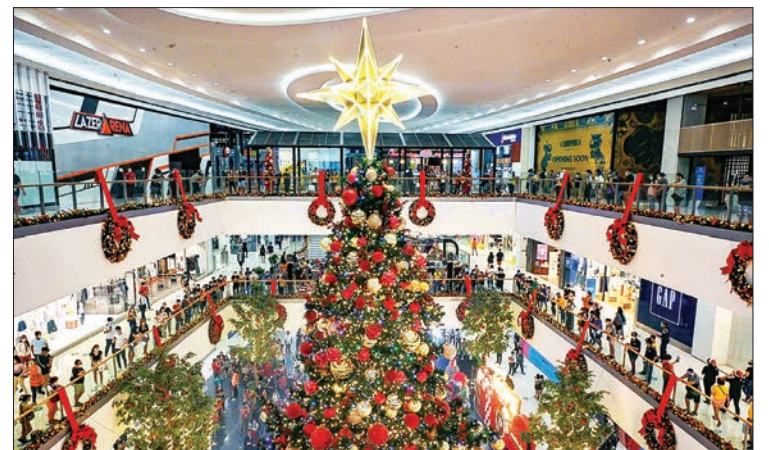
A lighting ceremony for a 18.29-metre-tall Christmas tree at the Mall of Asia in Manila.

will take the Philippines more than a decade to return to its pre-pandemic growth path.