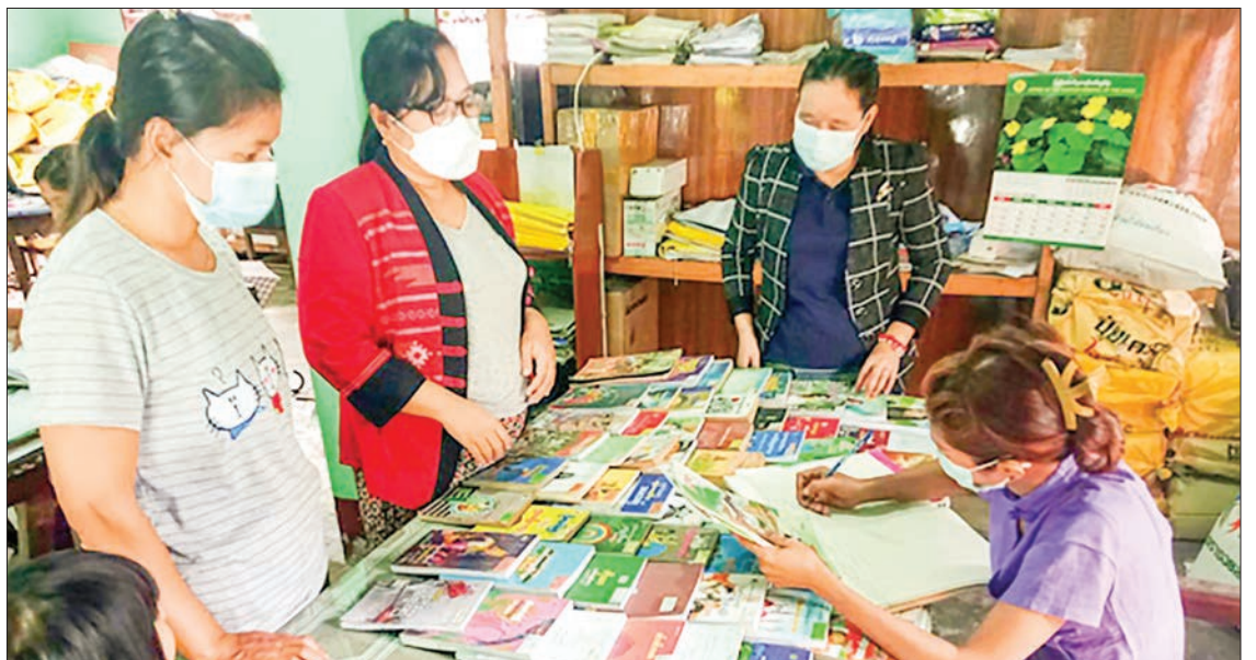
Readers are seen borrowing books from the mobile library.

In addition to debut books and educational talk shows, there are also books and magazines available to readers and bulletins are being rented out to the public, officials said.—Yin Yin Win (IPRD)/GNLM