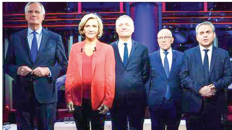
Les Republicains candidates for the 2022 presidential election Michel Barnier, Valerie Pécresse, Philippe Juvin, Eric Ciotti and Xavier Bertrand (from left) took part in their first televised debate Monday, hosted by news channel LCI.

Polls currently suggest that none of the Republicans (LR)