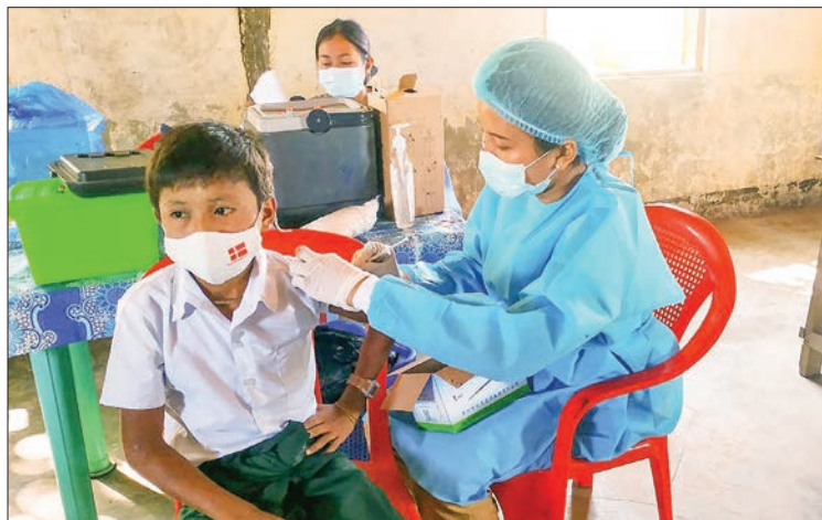
Vaccination programme for schoolchildren aged 12 plus is underway in Maungtaw.

the body temperatures, blood pressure of the students. There are 7,297 students aged over 12 to receive vaccines at 53 sites of Maungtaw Township and 109 students were vaccinated against COVID-19 on 8 November. A total of 5,939 students received their first dose of vaccines between 17 October and 8 November. — Thet Lwin Soe (IPRD)/GNLM