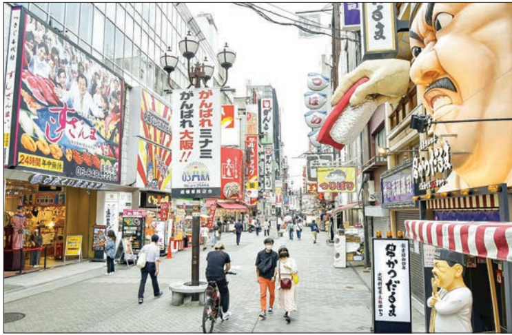
Businesses have welcomed the government's decision to lift the COVID-19 state of emergency in Tokyo and across 18 prefectures.

BUSINESS sentiment among workers with jobs sensitive to economic trends in Japan jumped in October to its highest level since January 2014 as the government lifted the state of emergency over the coronavirus, and eateries and retailers began recovering from the pandemic fallout, official data showed Tuesday. The diffusion index of confidence measuring the current mood compared with three months earlier among "economy watchers," such as taxi drivers and restaurant staff, climbed 13.4 points from September to 55.5, up