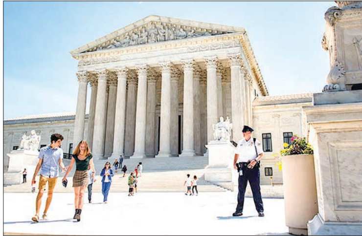
The US Supreme Court is seen in Washington, D.C., on 24 June 2019.

A district court in California dismissed the plaintiffs' claim, accepting the FBI argument that state secrets risked being