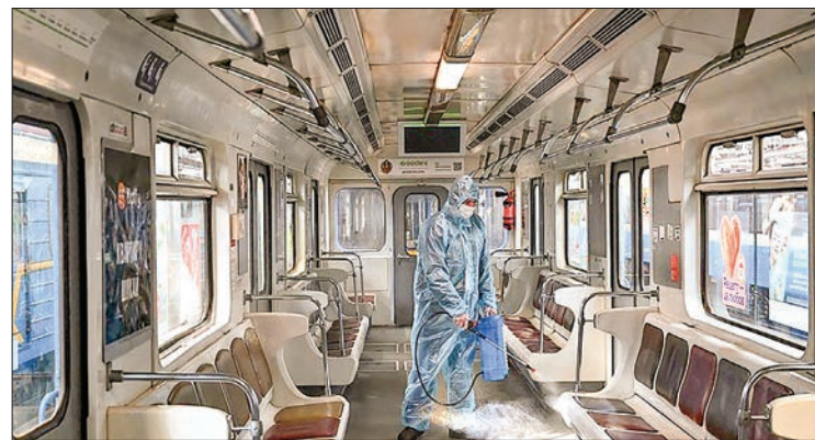
An employee wearing a protective suit disinfects a metro carriage in Kiev on 8 November 2021, amid the ongoing coronavirus disease (Covid-19) pandemic.

According to a WHO tally on 31 October, the number of confirmed coronavirus infections had increased by 3.02 million in a week, rising for the second week in a row. While many countries are reopening their economies in line with mass vaccination progress, the WHO has said it is important for people to wear masks in crowded environments