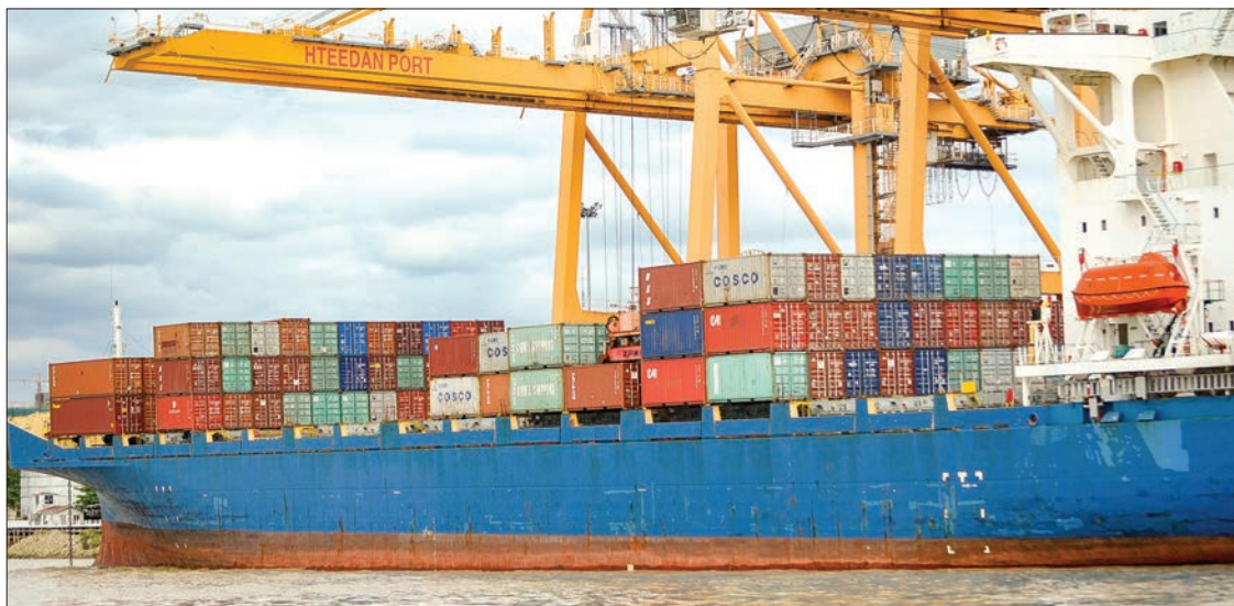
The top 10 import countries to Myanmar are China, Singapore, Thailand, Malaysia, Indonesia, India, Viet Nam, Japan, the Republic of Korea and the US, as per data of the Ministry of Commerce.

Last month, capital goods, such as auto parts, vehicles, machines, steel, and aeroplane parts were brought into the country. Their import value was estimated at $170.18 million. The figure