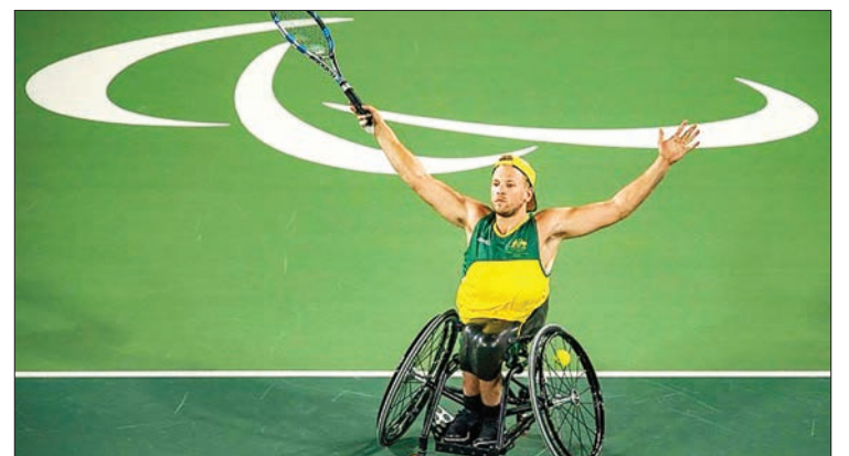
Dylan Alcott celebrates winning gold at Tokyo Paralympics in September.

"Without tennis I wouldn't be sitting here in front of you talking to you today, potentially sitting here at all, if I'm honest. I owe it everything. —AFP ■