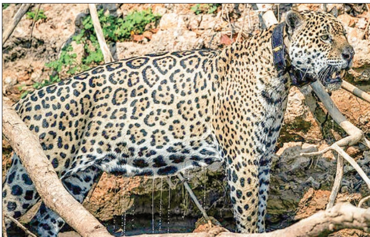
Ousado, a wild jaguar, was badly burned in devastating wildfires in Brazil in 2020; the destruction of the Amazon is putting many species at risk.

Scientists say that is the point at which a vicious circle of deforestation, wildfires and climate change could damage the rainforest so badly it dies off and turns to savannah — with catastrophic consequences for its more than three million species of plants and animals. — AFP ■