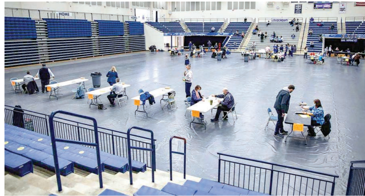
The United States has administered 429442508 doses of COVID-19 vaccines in the country as of 6 November morning.

The federal government on 4 November unveiled its new COVID-19 standards for businesses, "its biggest push yet to encourage widespread vaccination," reported CBS. However, the new rule has raised questions about the process for implementing, costs and timing of the requirements for