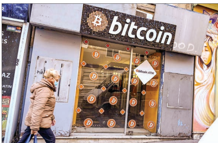
The world cryptocurrency market is worth more than $3 trillion for the first time, according to calculations Monday, as mainstream investors increasingly jump on board. A bitcoin ATM shop in Marseille, France.

THE world cryptocurrency market is worth more than $3 trillion for the first time, according to calculations Monday, as mainstream investors increasingly jump on board.