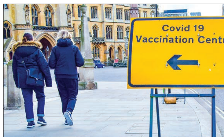
Walk-in sites in England are now offering booster jabs without having to book an appointment.

But from Monday, they can make their appointment after five months, although they will still only be able to actually receive the booster after six months.—Xinhua ■