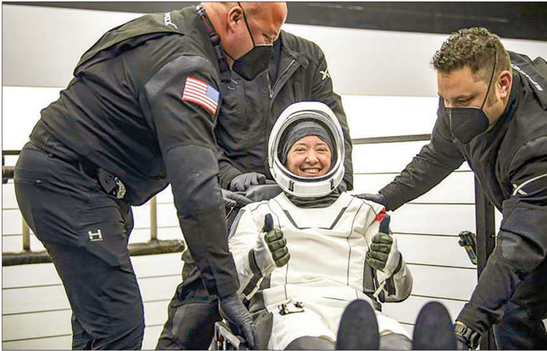
NASA astronaut Megan McArthur gives a thumbs up after being helped out of the SpaceX craft.