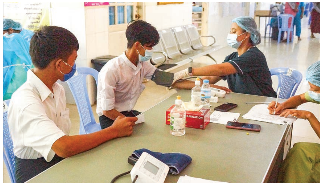
Immunization drive in Nay Pyi Taw.

HEALTH officials gave the first dose of Sinovac COVID-19 vaccines to over 12-year-old schoolchildren and over 18-year-old people at People's Hospital (50-bed) in Pobbathiri Township, Ottara District, Union Territory in Nay Pyi Taw yesterday morning. Officials from Pobbathiri Township General Adminis-