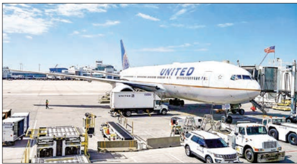
A United Airlines plane sits at the gate at Denver International Airport on 30 July.

United Airlines had announced on 6 August that its employees should be vaccinated or risk be-