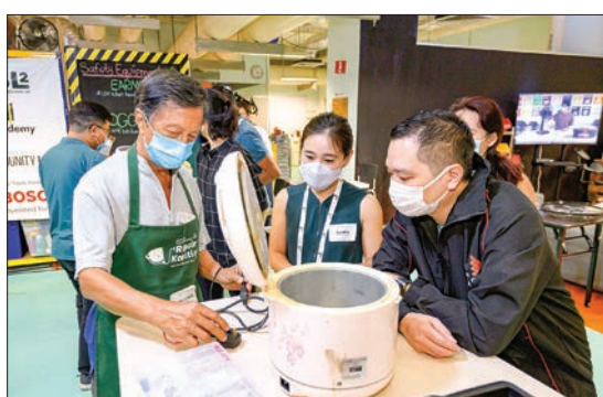
ASEAN Youth Fellows visiting the Repair Kopitiam initiative by the Sustainable Learning Lab (SL2) and learning about how it brings different communities together through repair to combat the throw-away culture for a sustainable world.