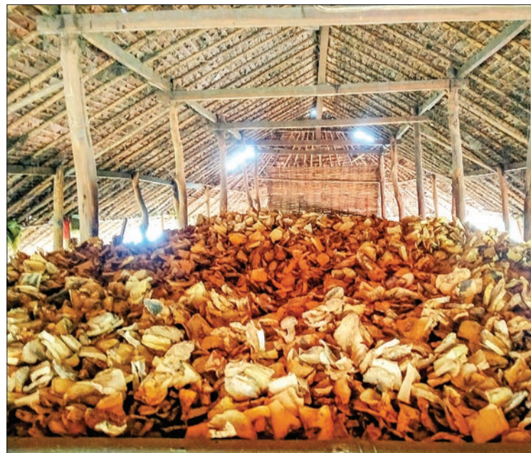
The elephant foot yam is destined to the commodity depots from Hpa-an, Mawlamyine, Mandalay, Muse, Shweli towns through Paing Kyone town. Then, those are exported to China.

Elephant foot yam production is one of the lucrative businesses. The yams are harvested between August and mid-December.