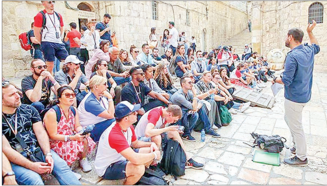
Tourists visit the Church of the Holy Sepulchre in the Old City of Jerusalem on 1 November 2021.