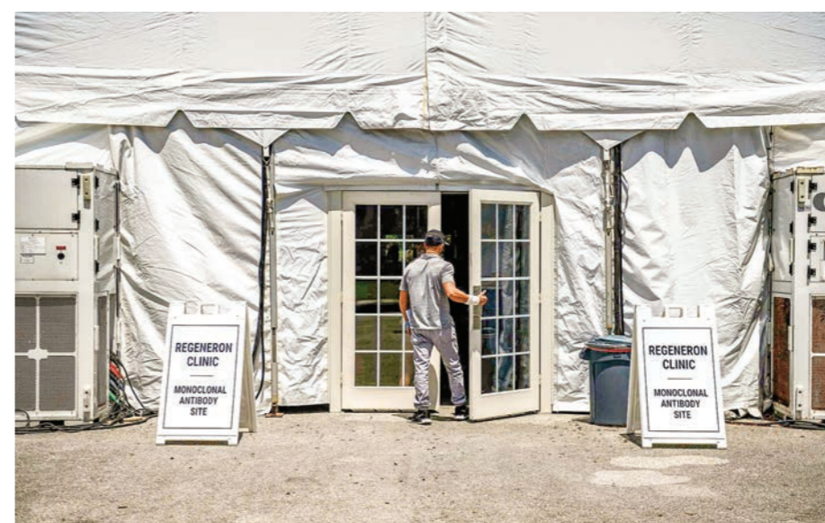
A man enters the Regeneron Clinic at a monoclonal antibody treatment site in Pembroke Pines, Florida, on 19 August 2021.