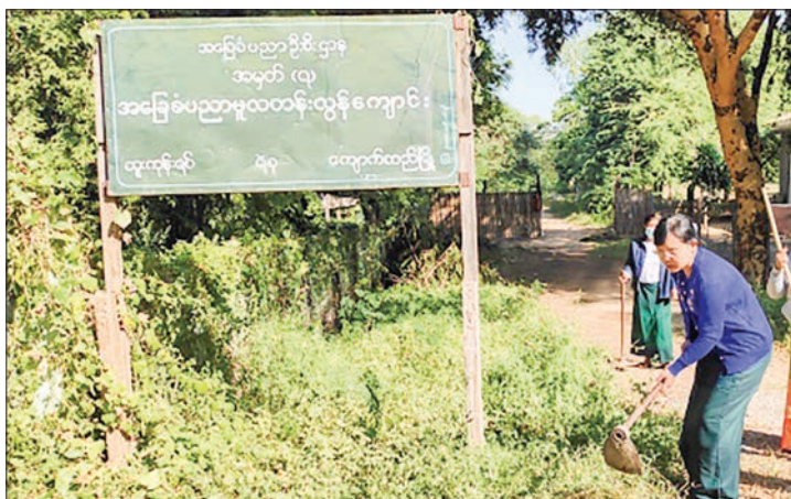
Teachers clean school environs for reopening of basic education school in Kyaukse Township.