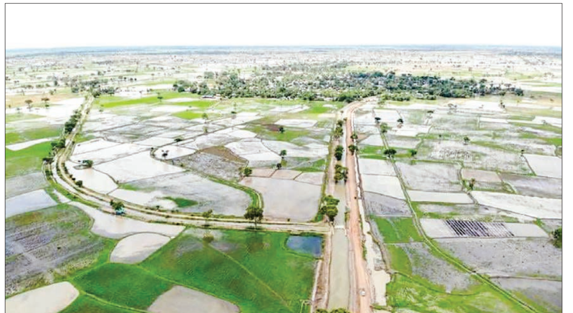
An aerial view of farmlands where Shwebo Pawsan paddy strain is grown.

A GI is a specific intellectual property right that designates a product from a specific region and whose characteristics result in both the natural conditions of its origin and the expertise of local producers.