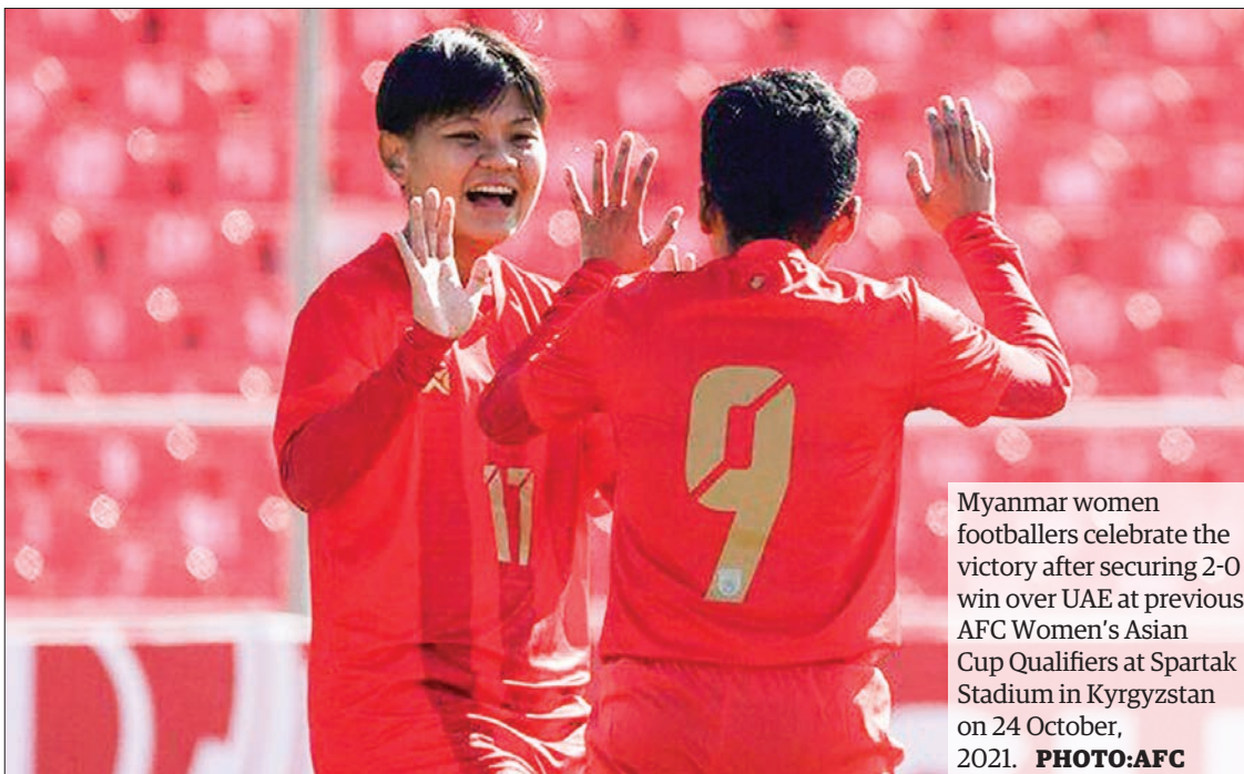
Myanmar women footballers celebrate the victory after securing 2-0 win over UAE at previous AFC Women's Asian Cup Qualifiers at Spartak Stadium in Kyrgyzstan on 24 October, 2021.

THE final group matches of the 2022 Asian Cup Women's Championship, in which Myanmar national women's team participating, have now been announced.