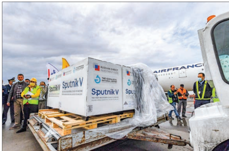
A shipment of Russia's Sputnik V COVID-19 vaccines arrives at the Tunis-Carthage International Airport in Tunisia, Tunisia, on 9 March.

RUSSIA complained Saturday about lack of international recognition for its Sputnik V Covid-19 vaccine at a G20 summit, where leaders agreed to step up global inoculation efforts.