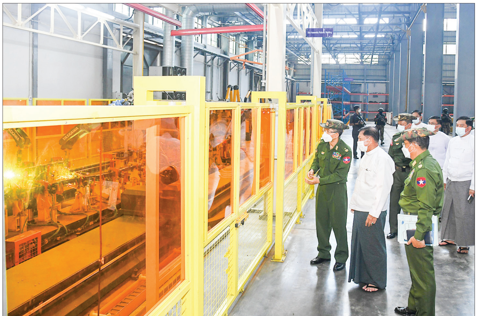
State Administration Council Chairman Prime Minister Senior General Min Aung Hlaing views assembling of vehicle at Tatmadaw Heavy Industry.

In his response to the reports, the Senior General stressed the need to manufacture a large number of quality automobiles such as oil bowlers, water tankers, garbage vans, sprayers and fire trucks not only for the Tatmadaw but for the municipal tasks and fire-fighting tasks. Quality vehicles must be distributed to regions and states. Further research must be done for manufacturing the high-tech vehicles meeting