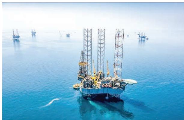
Saudi Arabia, the world's largest oil exporter, has pledged to go carbon-neutral by 2060.

THE climate crisis does not look like good news for the oil industry, but Saudi Arabia is sniffing an opportunity that could help retain its energy