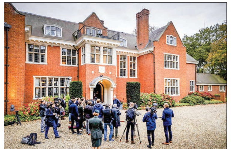
Informateur Johan Remkes (C) arrives at the De Zwaluwenberg estate for talks on the formation of a new government in Hilversum, The Netherlands, on 27 October 2021.

But seven months after Dutch voters went to the polls it was very much back to square one, with a future coalition government most likely resembling the one that stepped down in January over a childcare scandal.