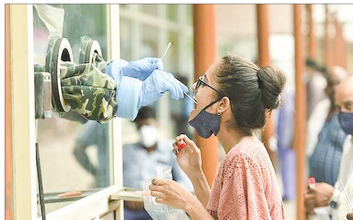
A health worker tests a visitor for Covid-19 testing.

The latest survey was based on samples taken from 28,000 people. "The kits that are used for sero survey just detect the presence of antibodies against the virus - it cannot tell the difference between antibodies due to a previous infection or immu-