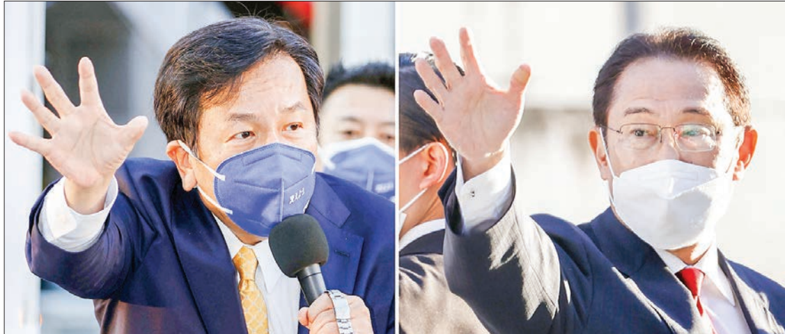
Combined photo shows Japanese Prime Minister Fumio Kishida (R) and Yukio Edano, leader of the main opposition Constitutional Democratic Party of Japan, making stump speeches in Machida in Tokyo and the capital's Tachikawa, respectively, on 30 October 2021, a day before a general election.

After taking office in early October, Kishida pledged to listen to people's voices and held talks with business operators and others during election campaigning, apparently to draw a contrast with Suga, who was criticized for being out of touch with public sentiment in the fight against the novel coronavirus pandemic.