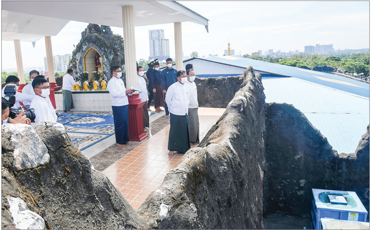
Chairman of State Administration Council Prime Minister Senior General Min Aung Hlaing views renovation process at Maha Pasana Cave.

In his response to the reports, the Senior General said renovation must be undertaken systematically as the cave is the nobly religious site. Just minor damage of historic building is not to be repaired but preserved with proper systems for long term existence with the use of designs and materials under detailed consideration. As water infiltration may cause damage to the building, growing of plants for prevention of water infiltration must be cleared. It is necessary to divide the tasks into sectors for carrying out fully renovation of Maha Pasana