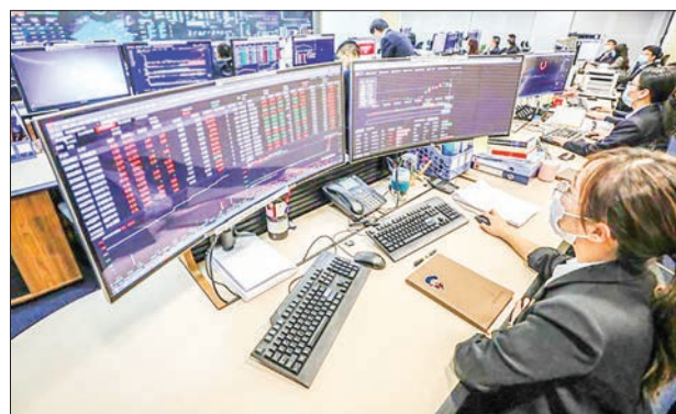
Staff members are busy at work at the Beijing Stock Exchange on 14 September. The new bourse, registered on 3 September, aims to nurture an array of specialized and innovative small and medium-sized enterprises.

the financing needs of various entities. — Xinhua ■