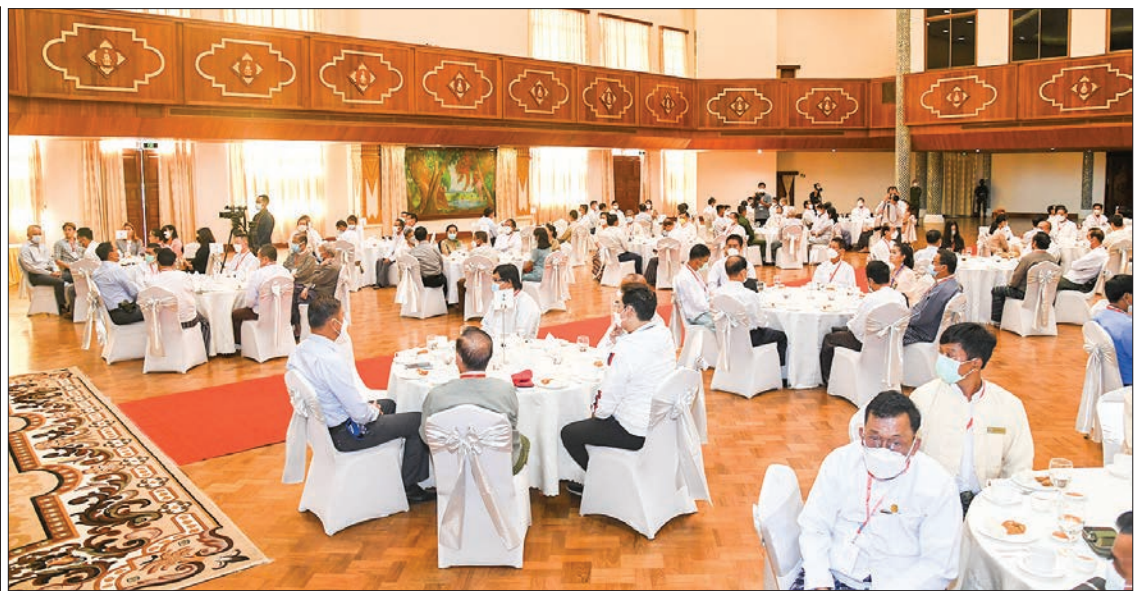
Chairman of State Administration Council Prime Minister Senior General Min Aung Hlaing meets artistes from literary, film, theatrical performer and musical industries.

I F artistes love the motherland, they need to encourage the education for improvement of the nation, said Chairman of the State Administration Council Prime Minister Senior General Min Aung Hlaing yesterday afternoon at the meeting with artistes from literary, film, theatrical performer and musical industries at Zeyathiri Beikman on Konmyinthta of Yangon Command Headquarters.