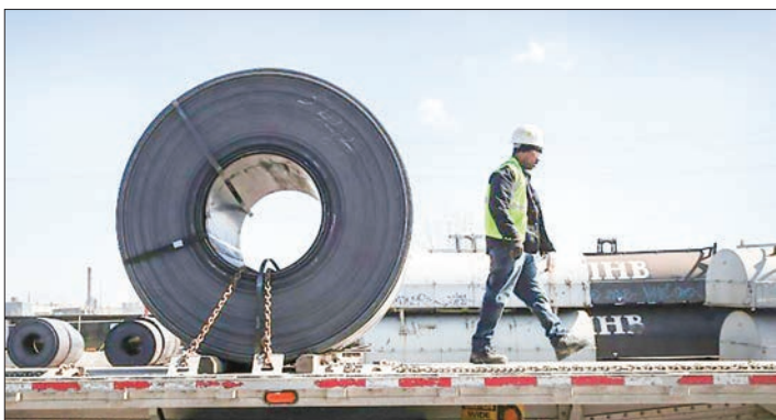
Steel is loaded onto a truck for shipping at the NLMK Indiana steel mill on 15 March 2018 in Portage, Indiana.

Unions argue the law has improved the lot of couriers, whose numbers have exploded in recent years in Spain to around 30,000 according to industry associations. — AFP ■