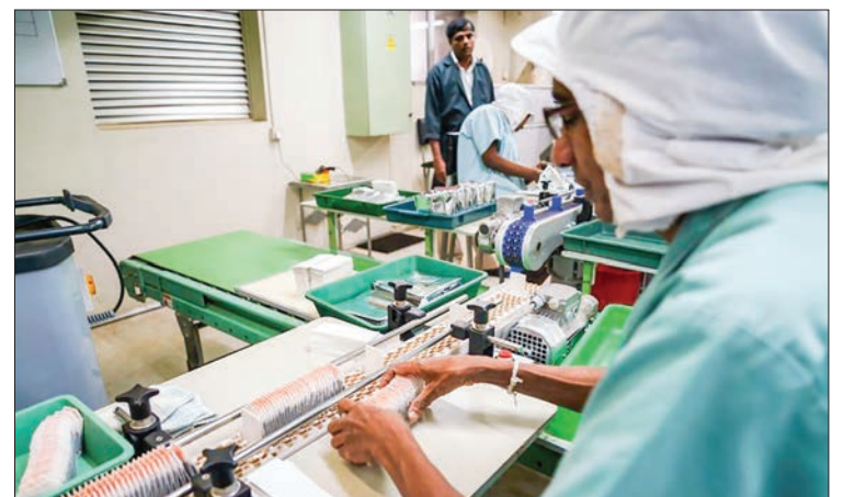
Staff members work on the production line of organic teas at Stassen Exports Private Limited in Colombo, Sri Lanka, 28 Oct 2019.

"The growers have come forward to cultivate tea adopting the new system. By adopting this plantation method, it will be possible to make a revolutionary change in the tea industry within the next three years," the minister said. The minister said tea should be grown on a fresh fertile land, tea plants will be provided free of charge and financial assistance will also be provided for land preparation from next year