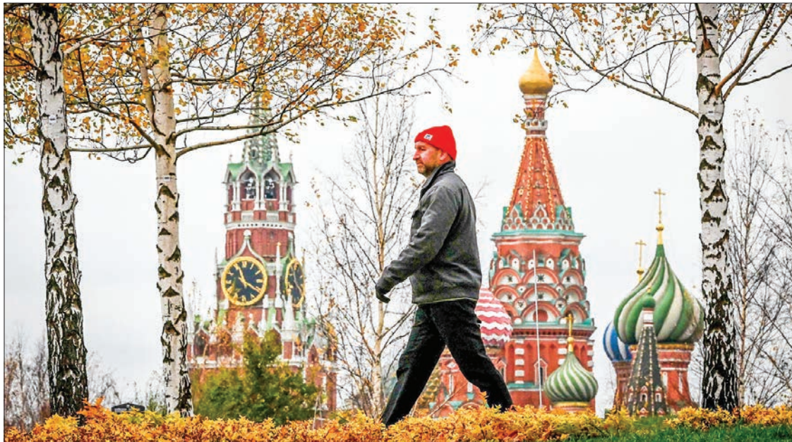
The Kremlin this week said epidemiologists had raised "concerns" after polls cited by news agencies showed one-third of Russians planned to travel during the holiday period.

Even though several jabs have been freely available for months, just 32.5 per cent of the population have been fully vaccinated, according to government