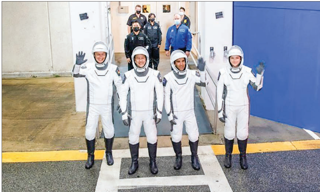
Americans Tom Marshburn (second from left), Raja Chari (second from right) and Kayla Barron (right) as well as German Matthias Maurer (left) of the European Space Agency, will spend six months on the orbital outpost.

be impossible, “a backup opportunity” is available on November 4, SpaceX said on its website.