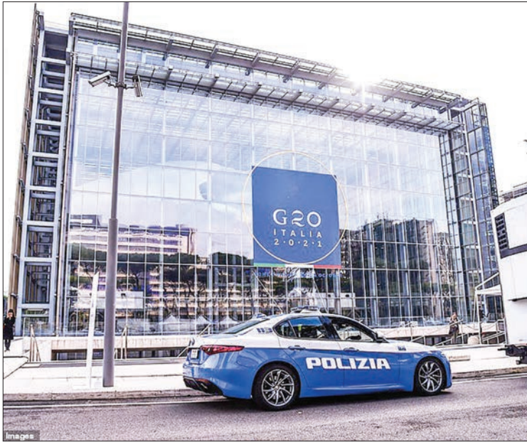
The "La Nuvola" convention center in the EUR district of Rome, where the upcoming G20 summit of heads of states will be held.

LEADERS of the Group of 20 major economies gathered Saturday for two days of talks in Rome to look into the impact of rising inflation amid the uneven global recovery from the coronavirus pandemic and to show support for an international corporate tax reform deal.