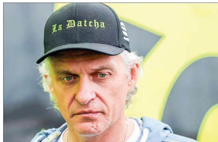
Oleg Tinkov, owner of Tinkoff Bank and Tinkoff Cycling Team, paid $509 million to settle US tax evasion charges.

RUSSIAN billionaire Oleg Tinkov was required to pay nearly $509 million to settle US charges of tax evasion, the US Justice Depart-