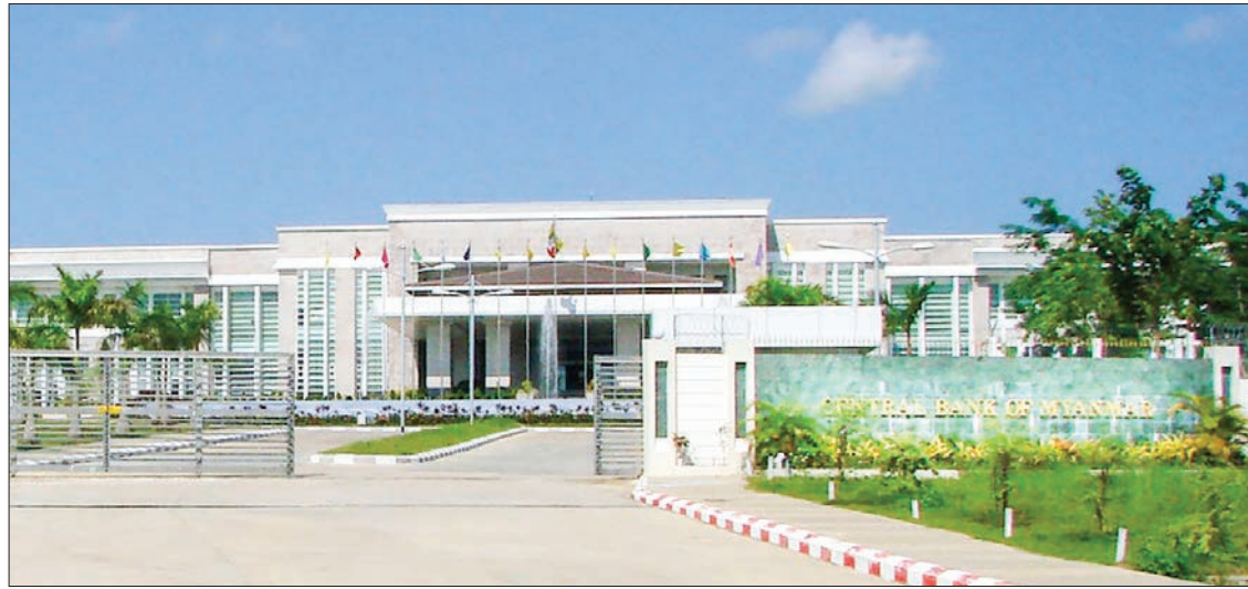
Photo depicts building of Central Bank of Myanmar.

In a bid to strengthen the local currency and govern the market volatility, the CBM reportedly sold about 6.8 million dollars on 3 February 2021, $12