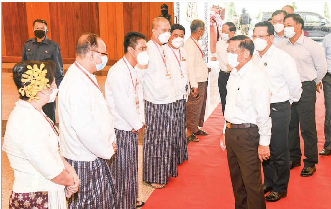
Chairman of State Administration Council Prime Minister Senior General Min Aung Hlaing greets artistes.

In his speech, the Senior General said literary, motion picture, music and theatrical performer organizations maintain the good history. Those from the fine arts arena politically participated in the independence struggle. They mobilized all the people to restore peace of the country after the post-independence period. They also participated in the all sectors when the governments ruled the country in successive eras. They not only politically participated in the independence struggle but also carried out development of the country depending on the policies of the government after the country had regained the independence. All artistes motivated the entire people to be active and participate in the moves of respective eras. They persuaded the people into the situation of the State with entertainments in successive eras by preserving the Myanmar traditional culture