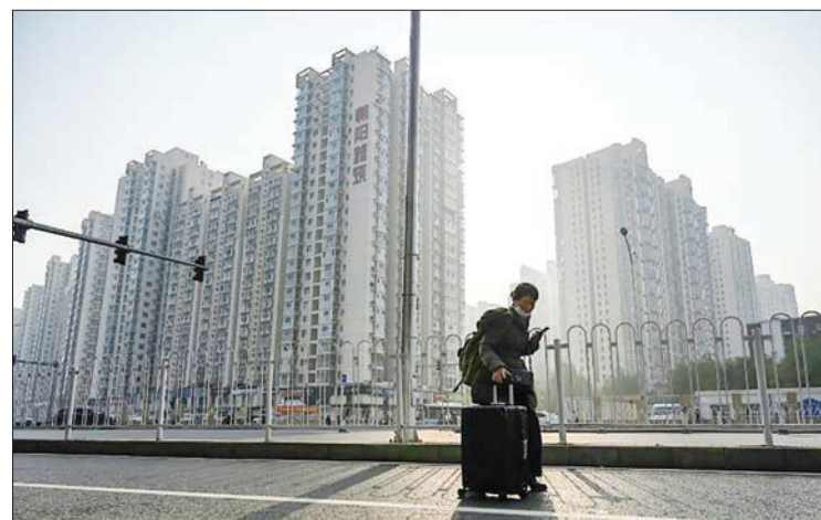
Rising cases have forced Chinese authorities to resort to tough steps to eradicate the resurgence of the virus.

In Beijing, authorities ordered all cinemas closed until November 14 in the capital's Xicheng district, which lies west of Tiananmen Square and is home to over a million people. China announced