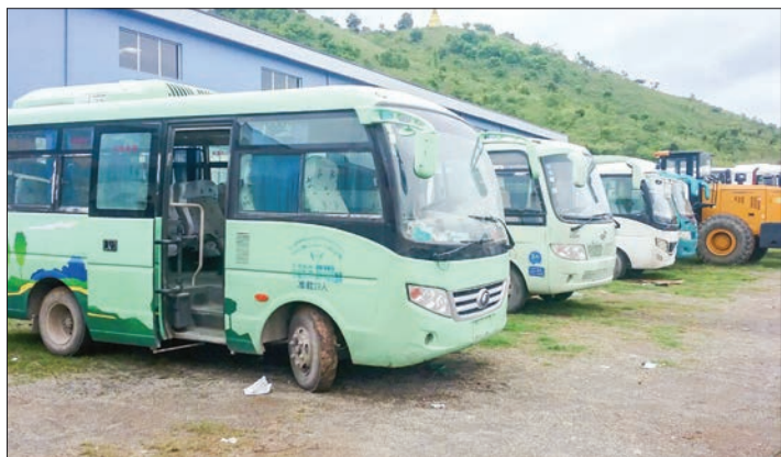
Mini-buses stop at border trade post.

MYANMAR'S external trade as of 22 October in the current mini-budget year 2021-2022 (Oct-March) sank to US$1.4 billion, which shows a drastic drop of $263 million as against the year-ago period, the Ministry of Commerce's data showed.