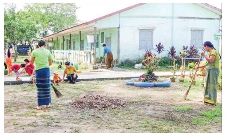
Teachers and education staff carry out sanitation at basic education school before reopening of school.

In front of the Township Information and Public Relations Department, a notice board was displayed for parents and teachers to obey COVID-19 disease preventive measures for the safety of the school children, officials added.