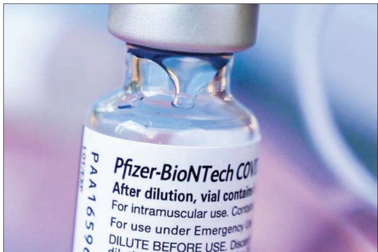
The United States on Friday authorized the Pfizer COVID vaccine for children aged five-to-11 after a committee of experts this week found its benefits outweighed the risks.

THE United States on Friday authorized the Pfizer COVID vaccine for children aged five-to-11 after a committee of ex-