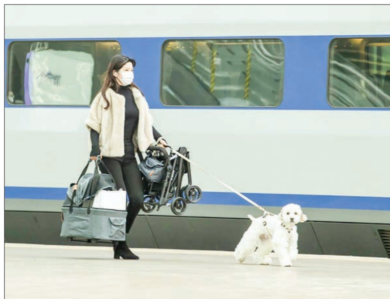
A woman wearing a face mask prepares to board her train at Seoul Station in Seoul, South Korea, Feb. 10, 2021.

SOUTH Korea planned to launch the so-called "living with COVID-19" guideline from November as the full vaccination rate topped the key precondition of 70 percent, the health ministry said on 29 October.