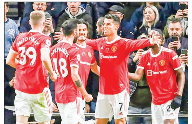
Cristiano Ronaldo celebrates his goal for Manchester United against Tottenham.

Solskjaer chose to bring back France defender Raphael Varane against Spurs for his first game for the club since October 2, switching to a central back three, with Shaw and Aaron Wan-Bissaka pushing forward. — AFP ■