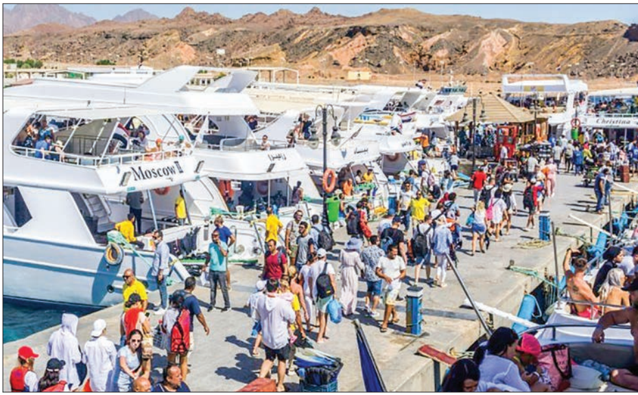
Russian tourists are beginning to flood back to Egypt's Red Sea resort of Sharm el-Sheikh six years after a terror attack that downed a Metrojet plane killing 224 mostly Russian passengers.

The attack was claimed by the so-called Islamic State jihadist group, which has a presence in the