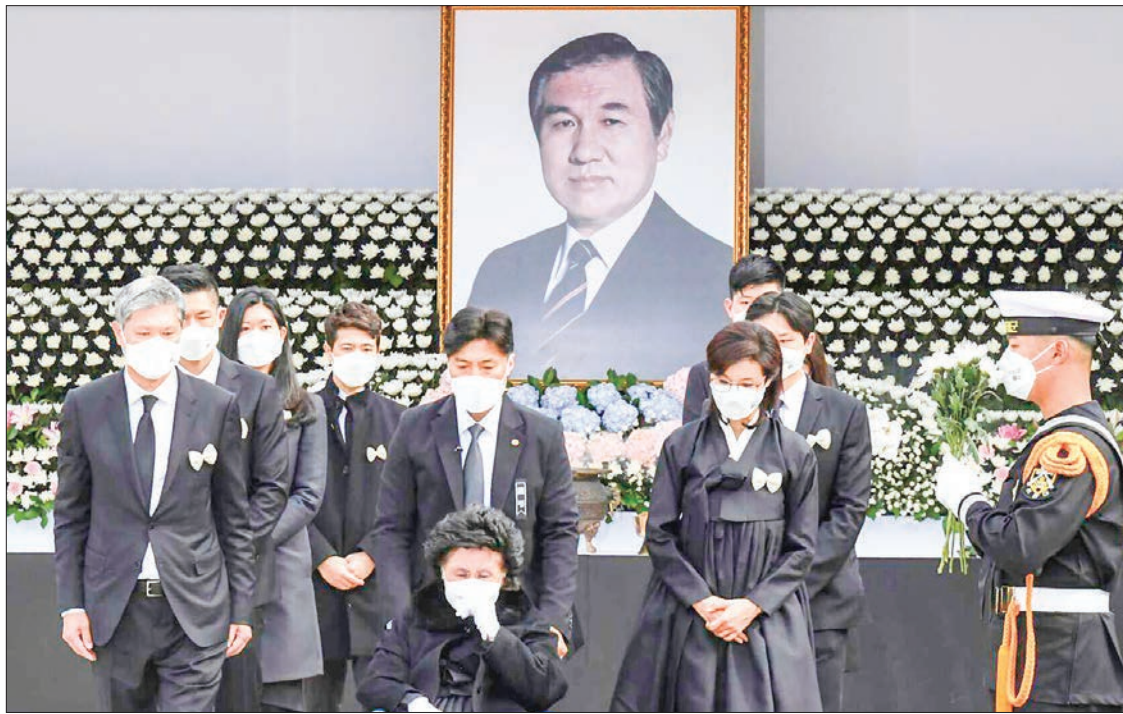
Bereaved family members attend a memorial service for former South Korean President Roh Tae Woo on 30 October 2021, in Seoul.

the 1980 crackdown on the pro-democracy uprising in the