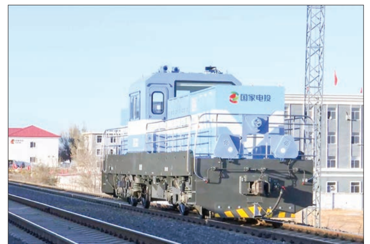
The hydrogen energy locomotive project was jointly launched by the Inner Mongolia subsidiary of the State Power Investment Corporation Limited (SPIC), CRRC Datong Co, Ltd., and the Hydrogen Energy Co, Ltd. of SPIC.

THE first China-developed hydrogen fuel cell hybrid locomotive started a trial run on Friday on a railway line for coal transport in north China’s Inner Mongolia Autonomous Region.