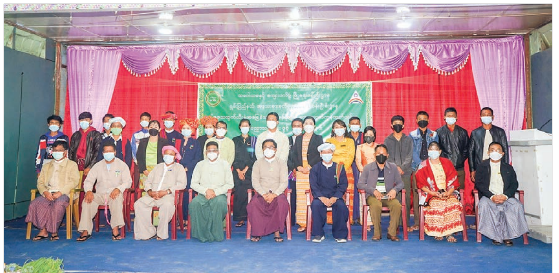
Trainees and officials are posing for documentary photo at value-added food production training course in Aungban.

ACCORDING to the instructions of the Head of State and the Union Minister, Shan State Small-scale Industry Department conducted the value-added food production training based on vegetables and crops in No (2) Ward of Aungban of Kalaw Township in Southern Shan State yesterday.