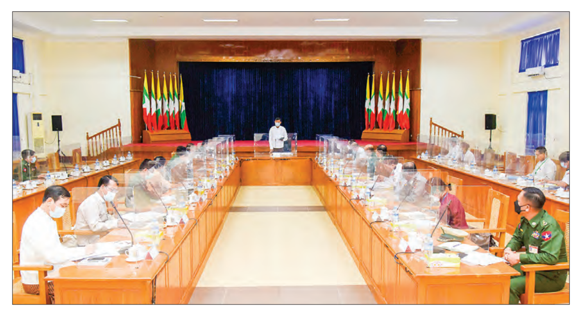
The MoD Union Minister chairs the meeting 2/2021 of the Committee on Prevention of Recruitment of Child Soldiers yesterday.

General Mya Tun Oo, Chairman of Committee on Prevention of Recruitment of Child Soldiers, presided over the (2/2021) committee meeting yesterday.