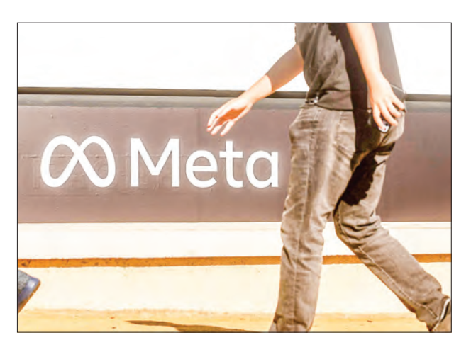
A newly unveiled logo for Meta, the new name for Facebook's parent company, outside the company's headquarters in Menlo Park, California, on 28 October.

"The metaverse is the next frontier in connecting people, just like social net-