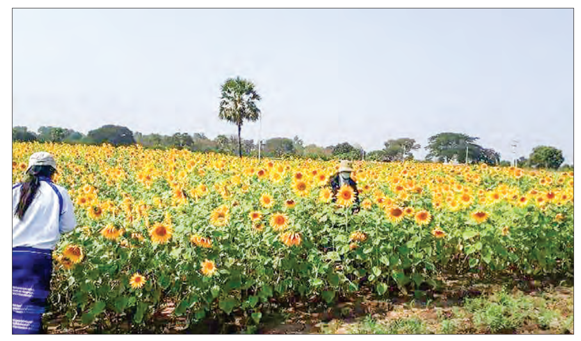
The staff from the township agriculture department is conducting awareness activities for the sunflower growers to improve sunflower yield and cultivate good quality sunflower seeds under the GAP farming system.

The staff from the township agriculture department is conducting awareness activities for the sunflower growers to improve sunflower yield and cultivate good quality sunflower seeds under the GAP farming system.