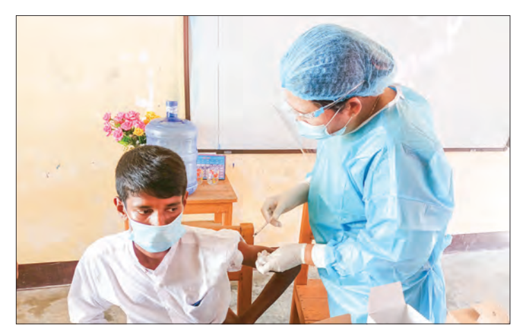
An above 12-year-old receives the first dose of Covid vaccine in Buthidaung.

The vaccination started on 16 October and 7,280 students have been vaccinated against COVID-19 by 28 October.