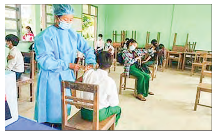
Vaccination drive for schoolchildren in Machanbaw.

THE officials used Sinopharm and Sinovac COVID-19 vaccines to vaccinate the middle and high school students aged 12 and above in Machanbaw Township of Putao District in Kachin State. A total of 209 students received their vaccines between 26 to 28 October.