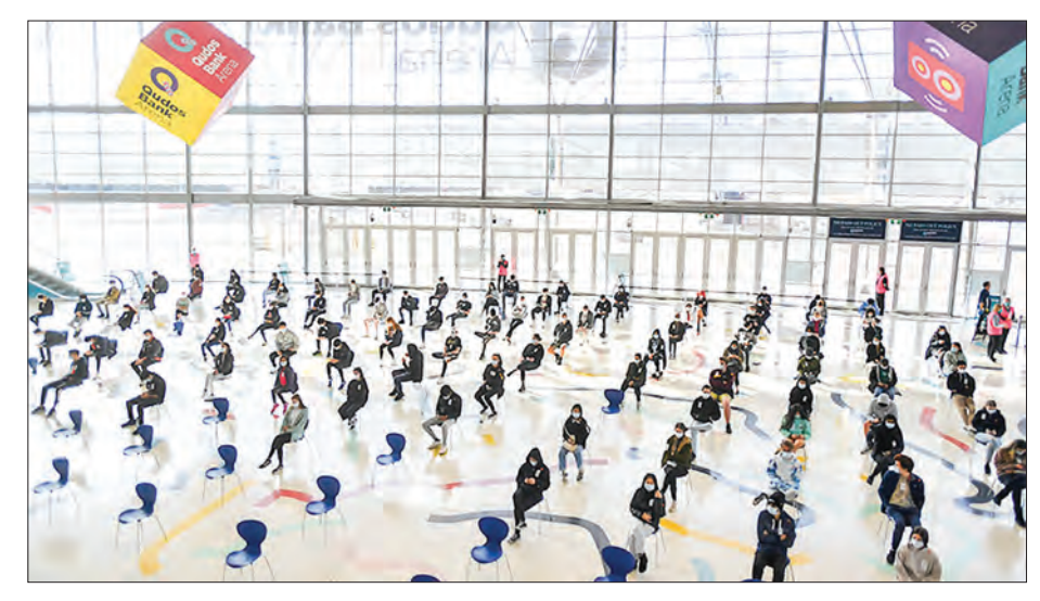
Students wait for their turn to receive their first dose of the Pfizer COVID-19 vaccine in Sydney on 15 August 2021.