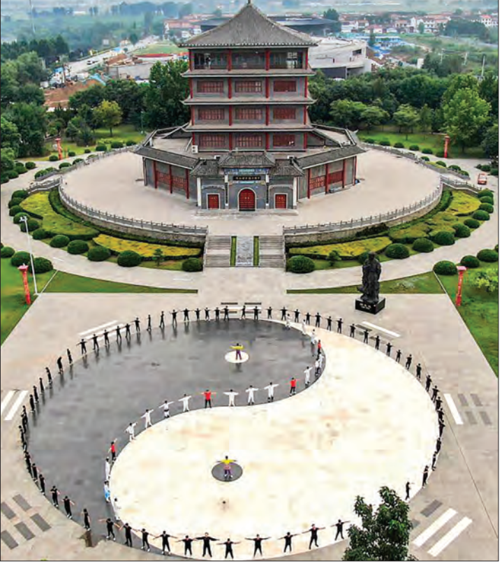
Aerial photo taken on 1 July 2021 shows people practising Taijiquan at Chenjiagou Village, Wenxian County, Jiaozuo City of central China's Henan Province, 1 July 2021.

It is the common responsibility of Asian countries to conserve, carry forward and harness Asian cultural heritage as Asian countries are closely connected and share a natural bond of affinity, said Hu Heping, China's culture and tourism minister, when addressing the conference jointly hosted by China's National Cultural Heritage Administration and the Beijing municipal government.—Xinhua ■