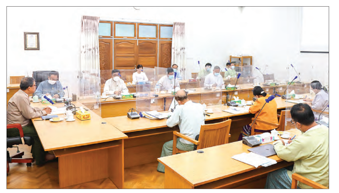
The MoALI Union Minister addresses the coordination meeting to set up a new Fisheries Institute.

The fisheries institute will produce skilled fish farming professionals to improve livestock production and provide job opportunities for young people who have passed the matriculation exam who are interested in fisheries.