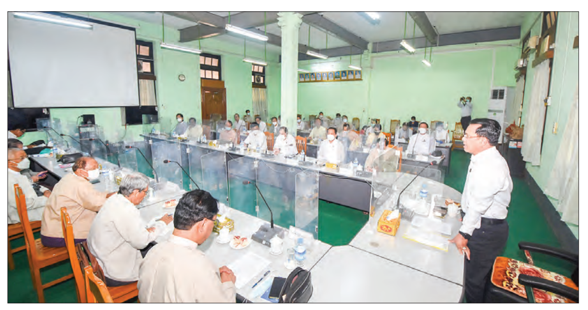
The MoI Union Minister makes the opening speech at the meeting with the members of National Literary Award and Sarpay Beikman Manuscript Award Selection Committees yesterday.

During the meeting, the Union Minister said the Ministry of Information is very important as it is dealing with various media platforms, and the literary scholars who attended the meeting are regarded as invaluable figures of the nation and are highly respected. He said the Prime Minister also recognizes people in the