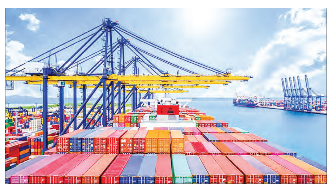
ASEAN and Russia recently agreed to enhance and widen economic cooperation at the 10th ASEAN Economic Ministers (AEM)-Russia Consultations held in September 2021, including by adopting a revised ASEAN-Russia Trade and Investment Cooperation Work Programme for the 2021-25 period.