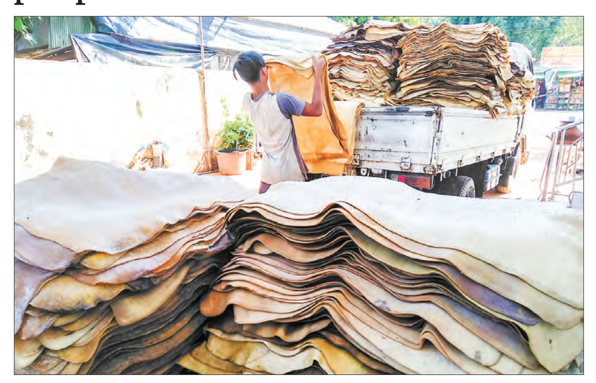
As of August of the financial year 2020-21, the county generated US$425.25 million revenue from the export of raw rubber, according to data released by the Ministry of Commerce.

MYANMAR rubber price has dropped down to below K1,000 per pound, according to the domestic rubber market.