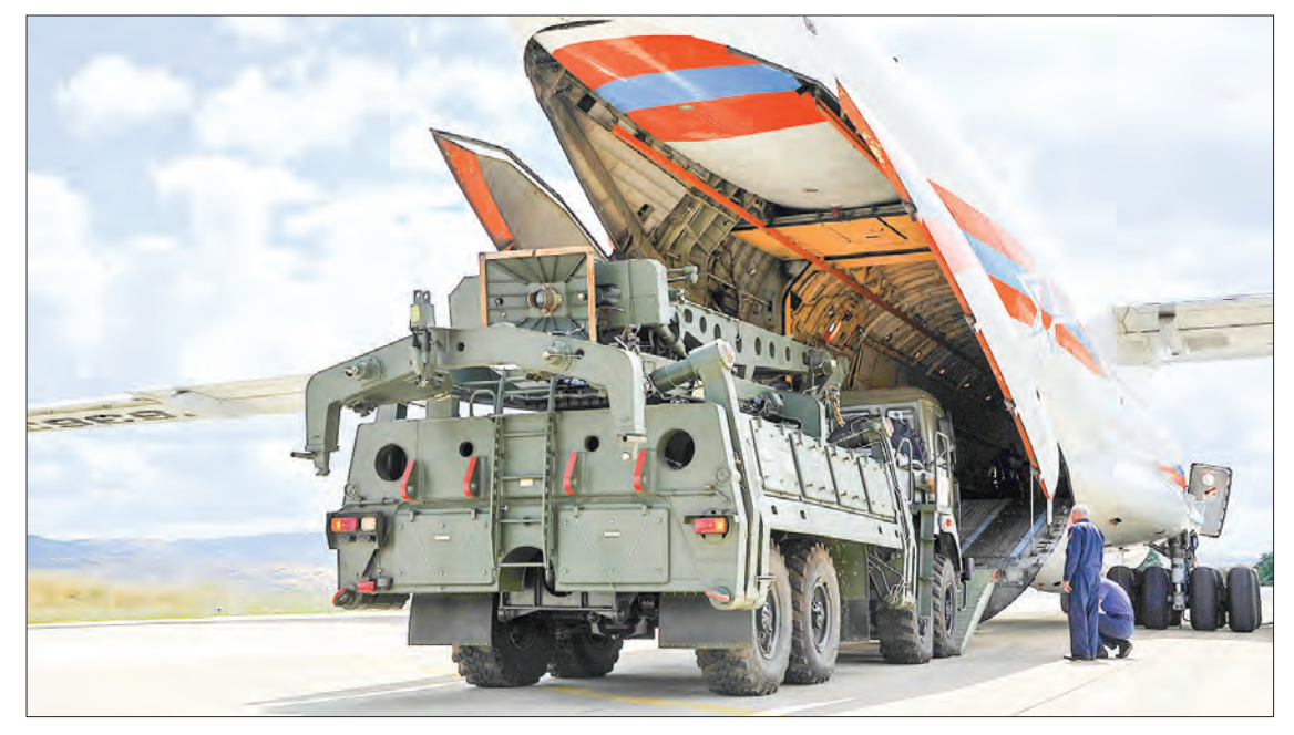
Turkey's plan to buy the US-made F-35 stealth fighter was cancelled after Ankara decided to acquire Russia's S-400 air defence system. A military cargo plane unloads Russian S-400 missile defence system components in Turkey in July 2019.

THE United States is discuss- forced the cancellation of the terpart Hulusi Akar, saying in ing Turkey's request to buy F-16 fighters after a deal for more advanced F-35s was scrapped due to Ankara's purchase of a Russian missile system, officials said.