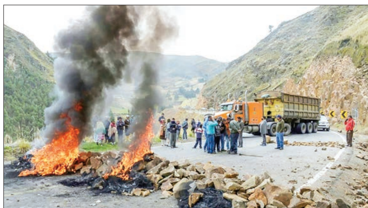
Indigenous people block a road linking the coast and the mountain areas, near Zumbahua in Ecuador on 26 Oct 2021 ahead of a protest against the economic policies of the government, including fuel price hikes, amid a state of emergency.

Saudi officials are putting the finishing touches to launch the King Abdullah Financial District (KAFFD), a multi-billion-dollar project announced in 2006, with many companies expected to be based there.—AFP ■