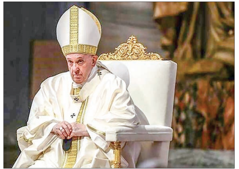
Pope Francis has expressed his ‘pain’ at the scandal surrounding former Church-run schools for indigenous children in Canada but has not gone so far as to offer the apology that indigenous leaders are still calling for.

Her comments were echoed by Canada’s Crown-Indigenous Relations Minister Marc Miller, who told reporters in Ottawa the visit is “welcome news” and that the hope is Pope Francis will present “a full and complete apology to indigenous people” during the trip.—AFP ■