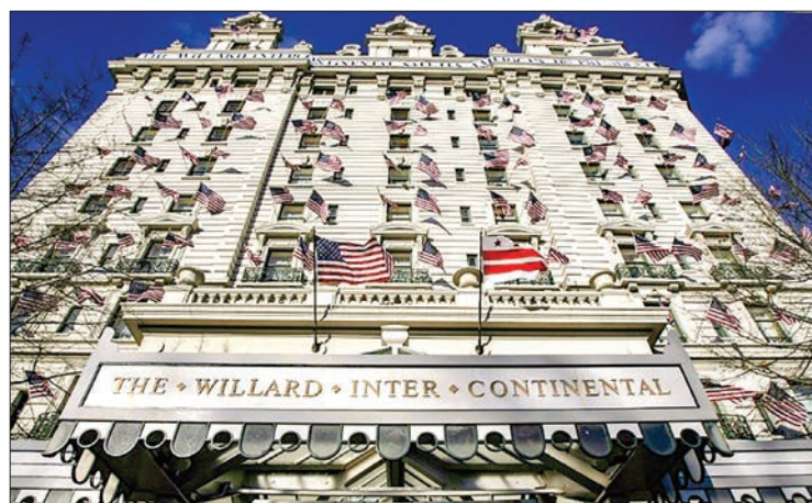
Investigators are examining whether a group of powerful Trump backers used a "war room" in the luxury Willard InterContinental hotel in Washington to incite the 6 January attack on the US Capitol.

Bannon, who rejected a subpoena to testify in the Jan-