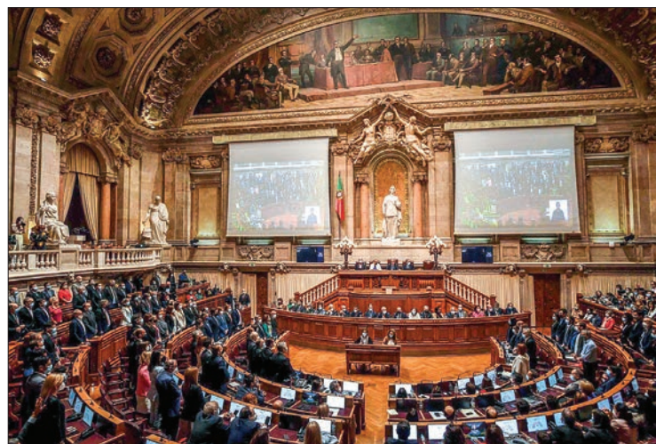
President Marcelo Rebelo de Sousa warned he would call elections if government spending plans were blocked.

President Marcelo Rebelo de Sousa warned he would call elections if government spending plans were blocked