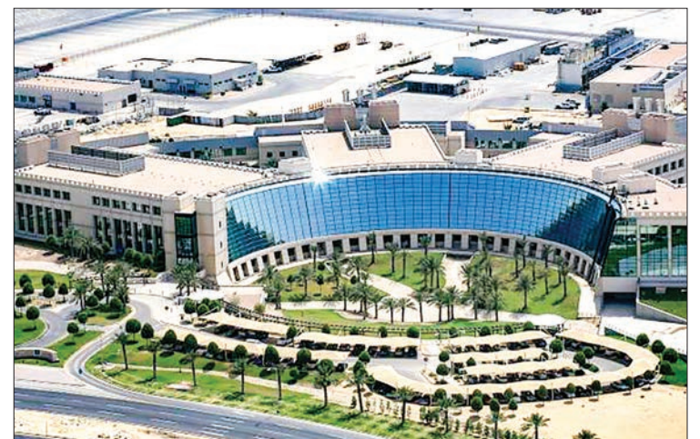
Saudi Aramco’s Dhahran Research and Development Centre: the new measure will include contracts made by foreign companies with the state oil company.

He did not disclose the names of the firms.