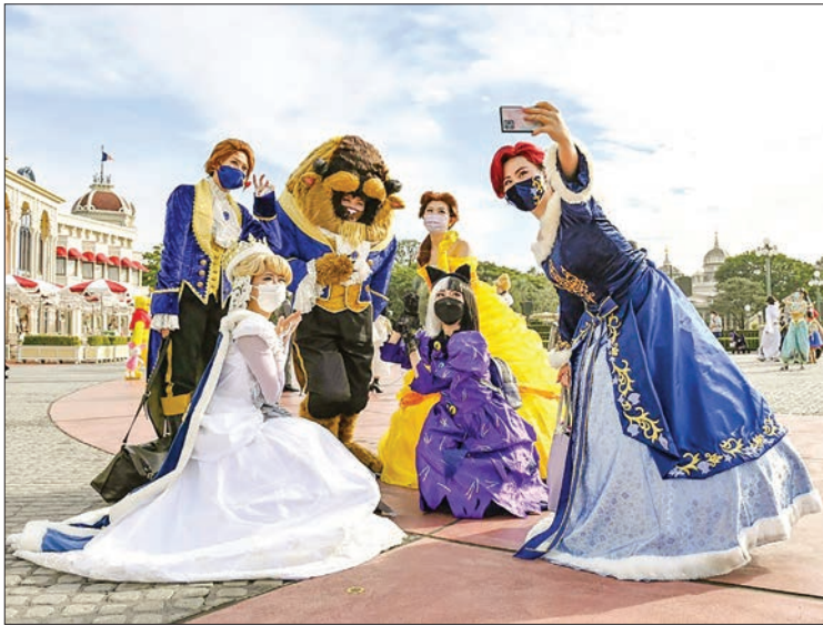
COVID-19 restrictions that were in place until recently have delayed a recovery in the services sector. Visitors to Tokyo Disneyland in Urayasu near Tokyo pose for a photo during a Halloween event on 25 Oct 2021. The event was cancelled last year due to the coronavirus pandemic.