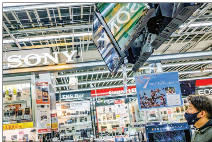
The Sony logo is displayed at an electronic goods store in Tokyo on 28 April 2021.

Sony is studying joining hands with TSMC after the Taiwanese chip manufacturer said earlier this month that it is planning to build an advanced chip-making factory in Japan in 2022 and start operations there in 2024.—Kyodo News ■