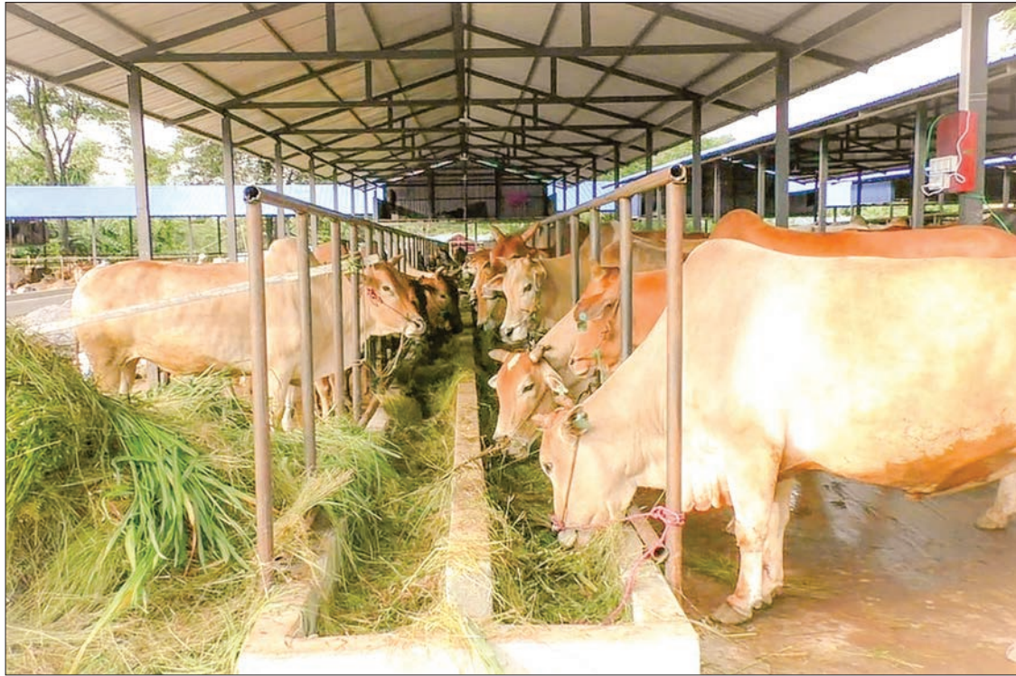
Myanmar's live cattle export is heavily relying on the China market due to a good price although Myanmar has other external markets such as Laos, Thailand, Malaysia and Bangladesh.

Following about 15,000 heads of cattle stranded in Muse last year, traders em-