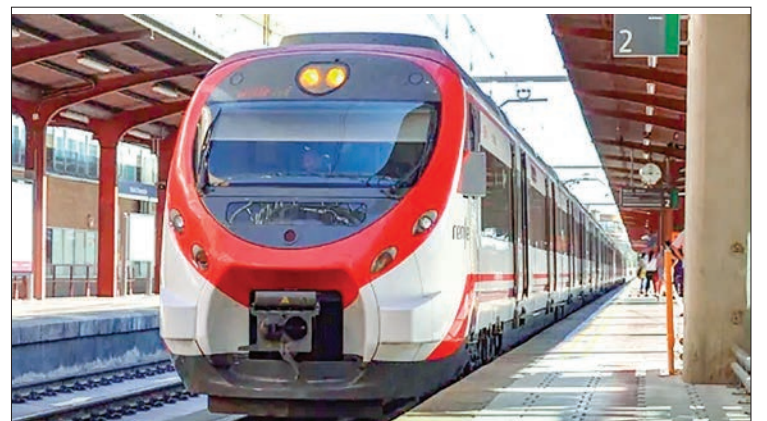
Spanish railway company Renfe wants to begin a high-speed train service between Paris and London, taking advantage of the slots still available in the tunnel under the English Channel, the company said on 26 October.

The Spanish company expects to operate its service with its own trains, starting with a minimum of seven, and believes taking a share of the London-Paris line will help it enter the French market.—AFP ■