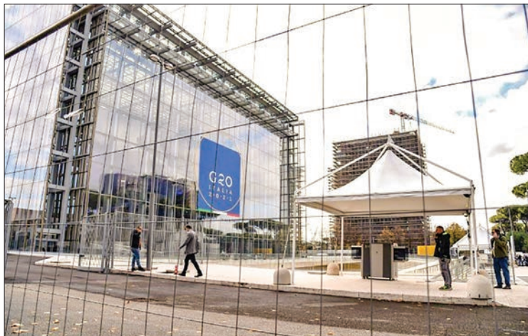
A view of the futuristic 'Nuvola' centre.

Instead, leaders will gather in a futuristic convention centre known as the "Nuvola" (cloud), featuring a suspended structure inside a glass and steel box, in a southern suburb with more easily