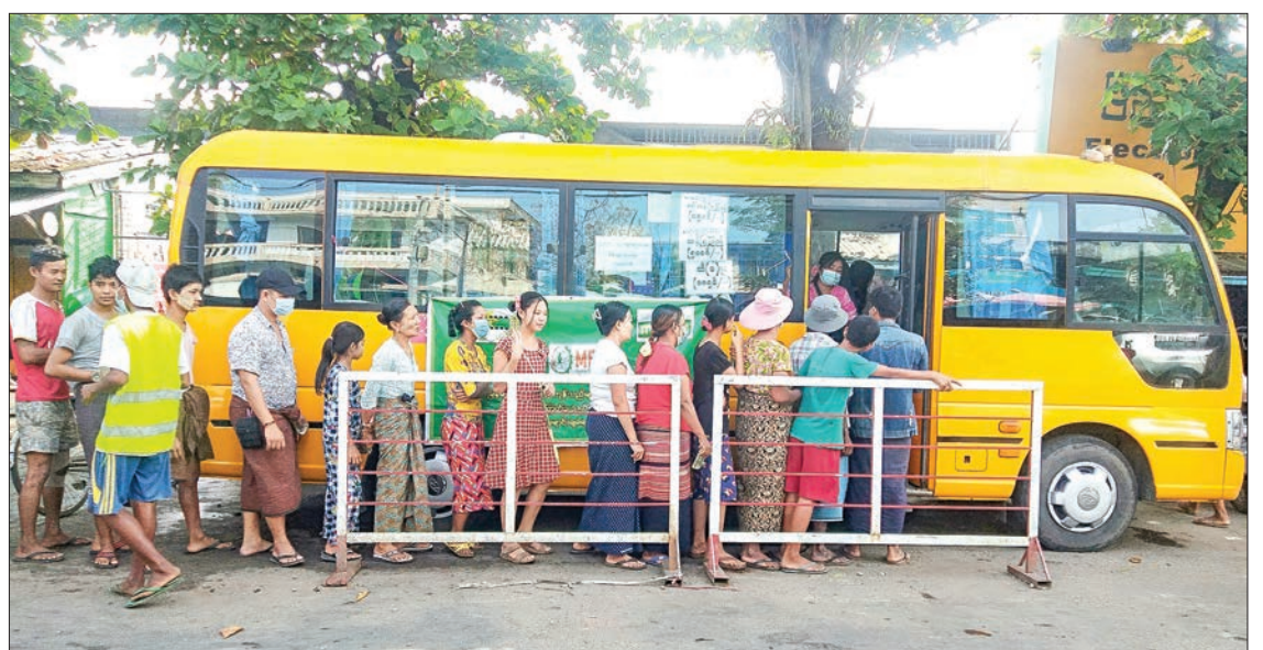
Consumers are seen purchasing basic foodstuffs from the mobile market vehicle in Thongwa.

Chairman of the Township Administration Body U Soe Thein and members, members of the township police force and officials from the Township Development Committee provided necessary assistance.