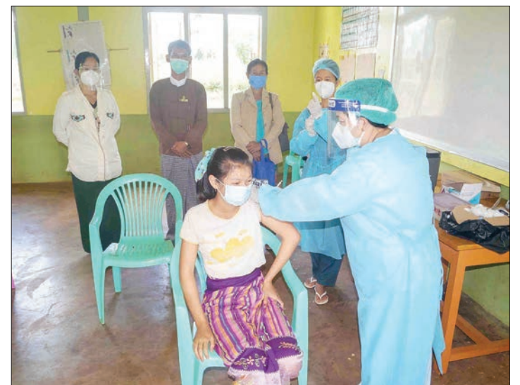
Inoculation drive is underway in the Pa-O Self-Administered Zone.

Students aged 12 and above from basic education schools in the remaining townships will be vaccinated at designated areas accordingly to the COVID-19 regulations, officials said. — MNA