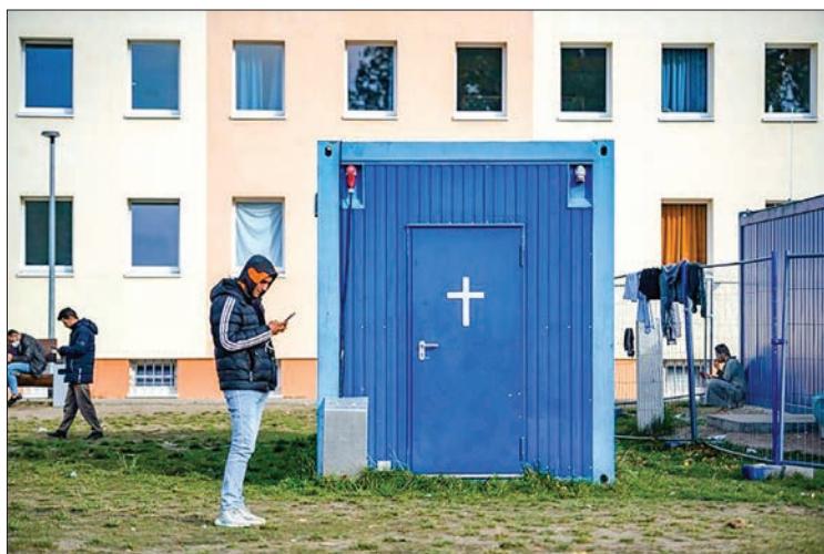
More than 6,100 illegal migrants who have entered Germany via Poland from Belarus since the beginning of this year, most of them from the Middle East, according to German authorities.