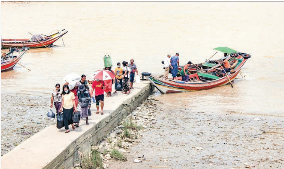
A powerboat is seen commuting passengers at one of the boat jetties in Dala.

THE motorboat service businesses have recovered and the jetties in Dala Township receive over 66 per cent of the passengers, said an in-charge of the township motorboat supervision team. Earlier, the number of passengers has registered only 25 per cent.