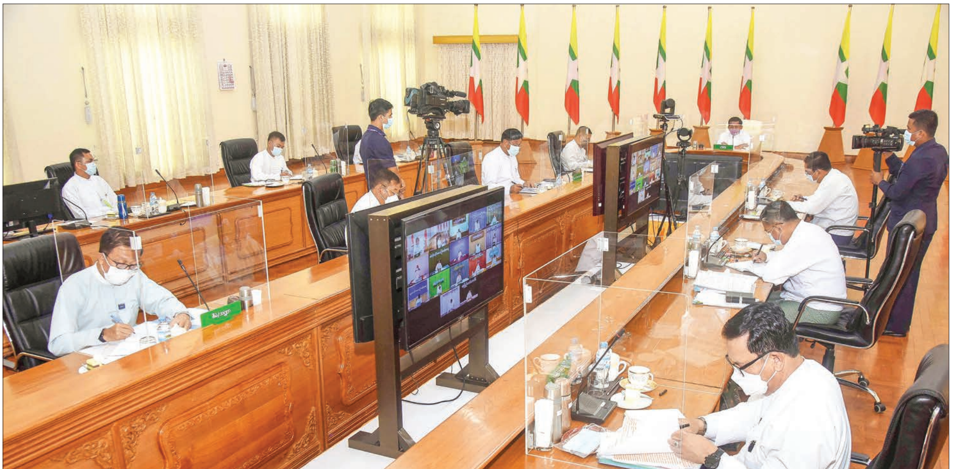
State Administration Council Chairman Prime Minister Senior General Min Aung Hlaing addresses the thirteenth meeting on the COVID-19 prevention, control and treatment in Nay Pyi Taw on 28 October 2021.

People need to take care of their health to reduce spending on State funds, while government must strive for earning income by increasing trade and production: Senior General