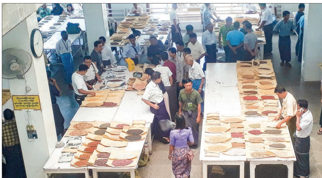
Currently, Myanmar shipped 2,013,125.777 tonnes of beans and pulses to foreign markets through border routes and sea routes from 1 October 2020 to 24 September 2021 in the current financial year 2020-21, fetching over US$1,556.659 million, according to the figure released by the ministry.

THE price of black bean plummeted to K680,000 per tonne in a month in the local market, according to Yangon Region Chambers of Commerce and Industry (Bayintnaung Commodity Exchange).