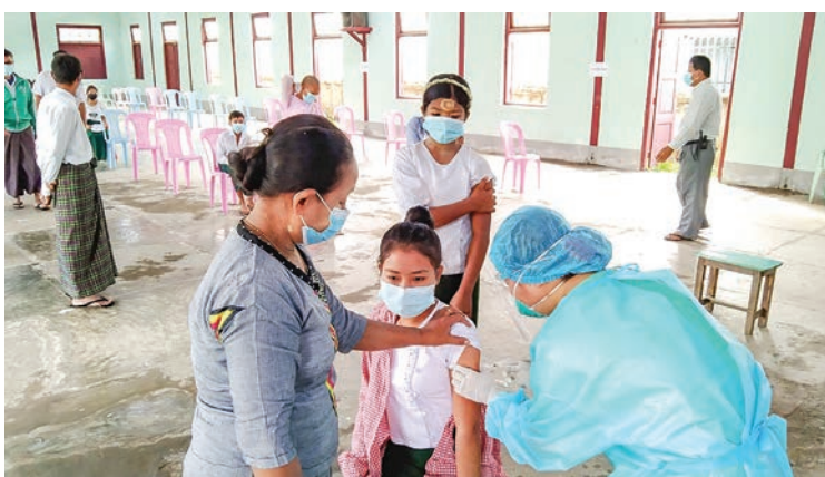
Students aged 12 and above get jabbed in Moegaung, Kachin State.

HEALTHCARE officials gave Sinovac COVID-19 vaccines to students aged 12 and over at No.2 Basic Education High School in Moegaung, Mohnyin District, Kachin State at 9 am yesterday.