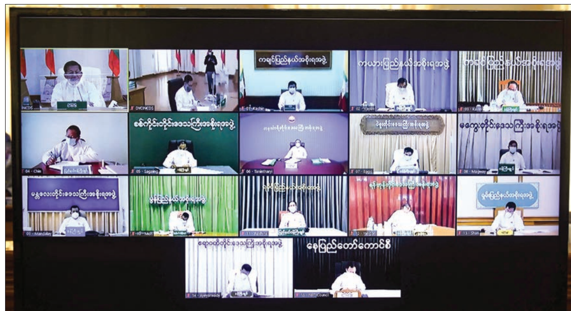
The Chief Ministers of the states and regions attend the COVID meeting online.

Concerning the production of the COVID-19 vaccine, the Senior General said, "We are trying hard to produce COVID-19 vaccines. We hold meetings with Chinese authorities as well as Russian ones. Yesterday, the delegation from Russia told me how they can do