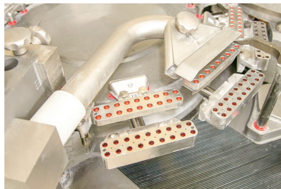
Merck has said it can manufacture 10 million courses of the Covid-19 drug by the end of the year

Merck's deal with MPP is "a positive step towards creating broader access to treatment as quickly as possible," the World Health Organization (WHO) said