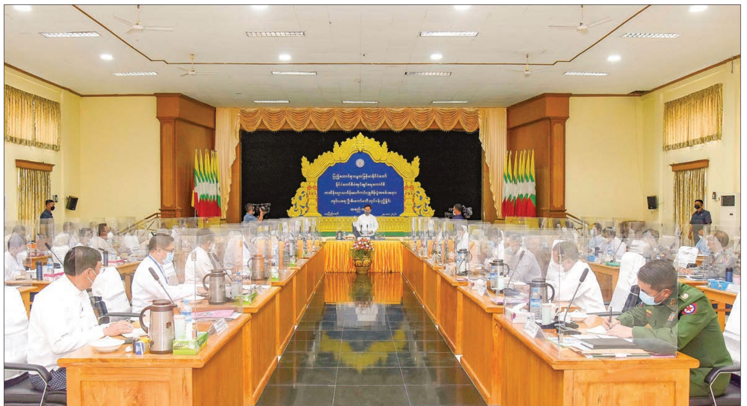
State Administration Council Vice-Chairman Deputy Prime Minister Vice-Senior General Soe Win makes the address at the coordination meeting to hold the 2021 SAC Kathina Robe Offering Ceremony in Nay Pyi Taw yesterday.

Kathina robes will be donated to 18 members of the Sangha—nine Ovadacariya Sayadaws