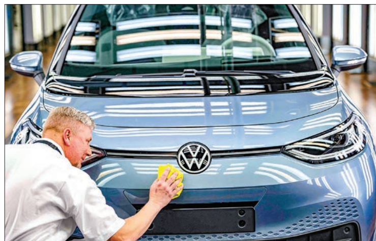
An employee checks the surface of an "ID 3" electric car of German carmaker Volkswagen, at the "Glassy Manufaktur" (Glaeserne Manufaktur) production site in Dresden, Germany, 8 June 2021.

By contrast, bottom-line net profit rose by 5.6 per cent to 2.9 billion euros. A year earlier, earnings had been hit by the economic fallout from the coronavirus pandemic. Vehicle deliveries were down 24 per cent in the third quarter, while demand in key market China "could also not be met", VW said.—AFP ■