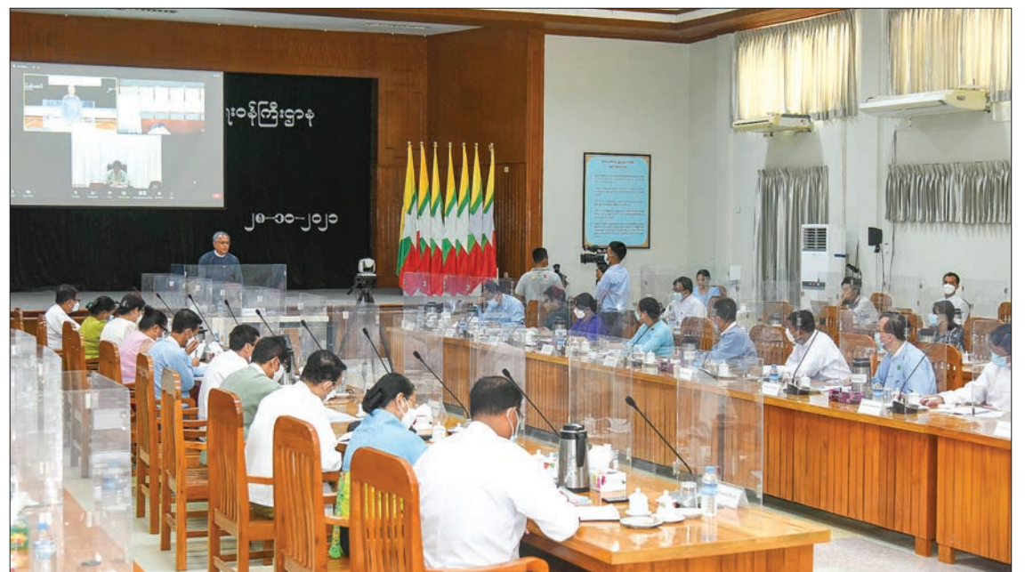
The meeting on the implementation of the ASEAN Economic Community (AEC) in progress.

Moreover, he discussed the possibility of Bilateral Free Trade Agreements with major