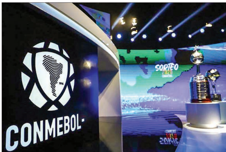
Picture of the Copa Libertadores, left at right, and Copa Sudamericana trophies taken during the draw for the next rounds of the football tournaments at the South American Football Confederation headquarters in Luque, Paraguay, on 23 Oct 2020.

SOUTH American football governing body CONMEBOL on 27 October rejected a FIFA proposal to hold the World Cup every two years.