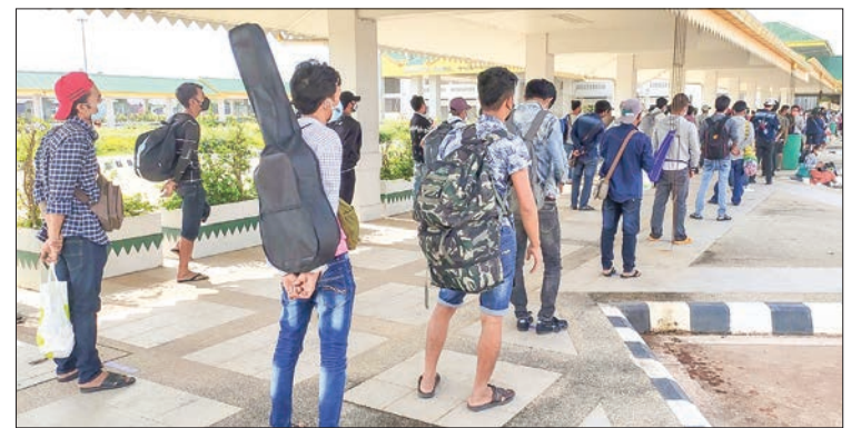
Returnees queue up for reception process.

The returnees were transported to their respective home townships by buses arranged by the township administration bodies, and those diagnosed with