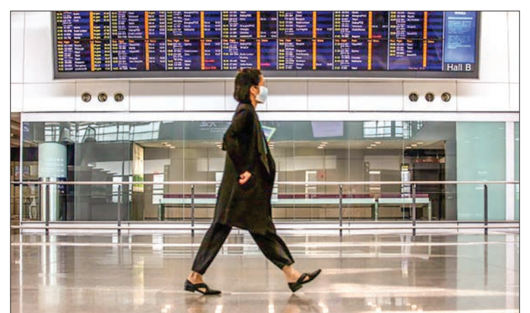
Hong Kong has one of the strictest mandatory COVID quarantine regimes in the world.

At present, Hong Kong allows certain groups of people to skip quarantine or isolate at home. They include diplomats and business leaders as well as some mainlanders with Hong Kong resident cards.—AFP ■