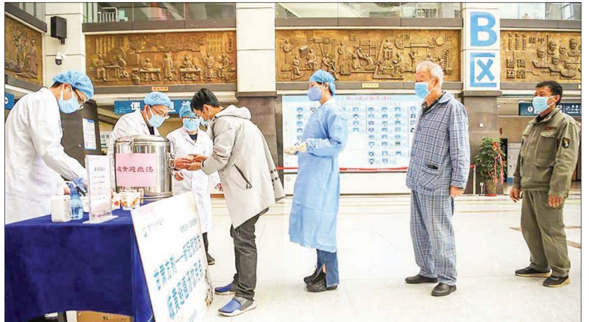
People queue up to get decoctions for COVID-19 prevention and control at Gansu Provincial Hospital of Traditional Chinese Medicine (TCM) in Lanzhou, northwest China's Gansu Province, 23 October 2021.

In Beijing — which reported three new cases Tuesday — access to tourist sites has been limited and residents advised not to leave the city unless necessary.