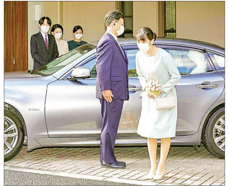
Japan's Princess Mako bows before leaving her home in Akasaka Estate in Tokyo on 26 October 2021.

was made public. Former Princess Mako Komuro said her new husband is "irreplaceable" and that their marriage was a "necessary choice" despite controversy over the union stemming from a family financial dispute. Speaking in front of the press at a Tokyo hotel, Kei Komuro said he will "do whatever possible" to solve the money trouble involving his mother and her former fiancée.—Kyodo News ■