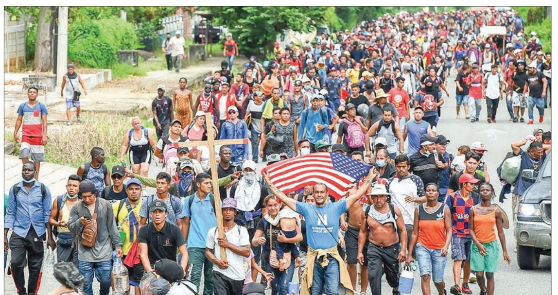
Around 1,000 migrants are marching through southern Mexico towards the capital seeking refugee status.

The family spent two months in Tapachula, where the migration authorities and Mexico's refugee commission told them