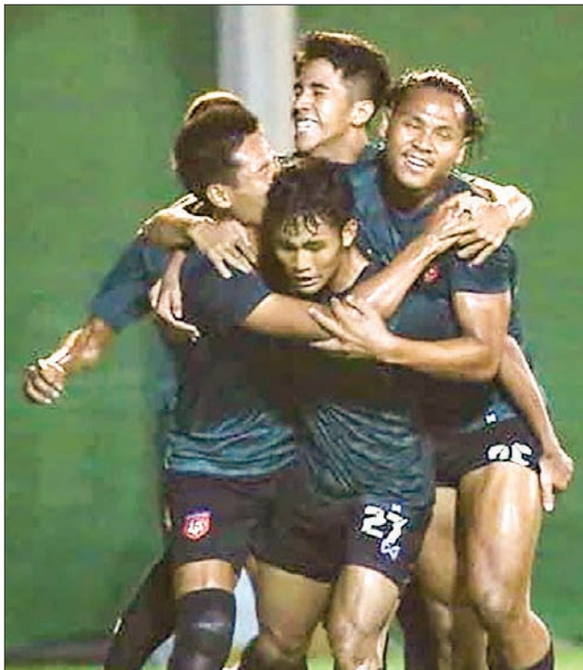
The Myanmar U-23 football team.

The tournament is divided into 11 groups, with the top 11 teams in each group and the top four runners-up will advance to the next