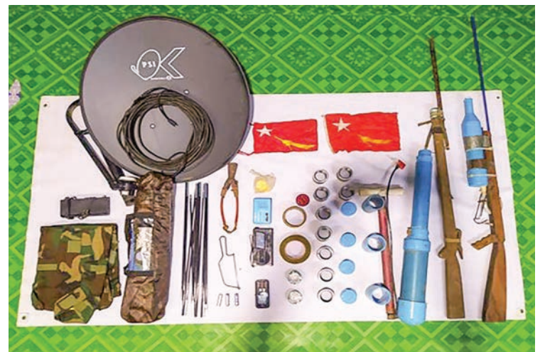
Seized weapons, ammunition, explosives and related materials.