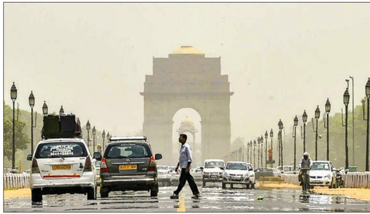
India and other Asian countries have suffered deadly heatwaves in recent years.

China suffered an estimated $238 billion, followed by India at $87 billion, Japan with $83 billion and South Korea on $24 billion.