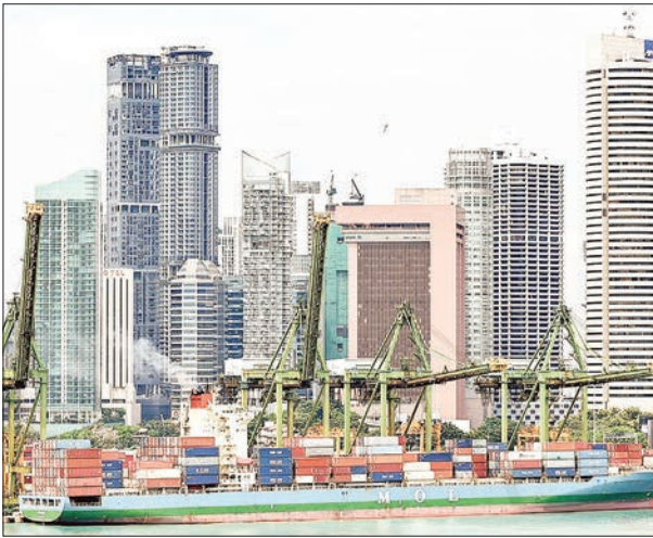
Vessels berth along the pier of the Keppel container terminal next to the business district of Singapore.

In September, Singapore's food inflation on a year-on-year basis rose to 1.6 per cent as the prices of non-cooked food and prepared meals increased at a slightly faster pace. Meanwhile, the accommodation costs grew by 1.9 per cent year-on-year, compared to 1.7 per cent in the previous month, as housing rents rose at a faster rate. MTI and MAS reiterated that the MAS core inflation will come in