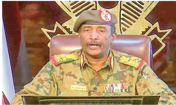
Chairman of Sudan's Sovereign Council Abdel Fattah Al-Burhan said on Monday that the division among partners in the transitional government prompted the military intervention to prevent the country from chaos.

The Sudanese army chief expressed commitment to the constitutional document but announced suspension of the items relating to the coalition with the Freedom and Change Alliance, the civilian component