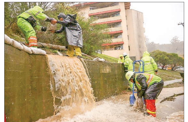
Workers try to divert water into drains in Marin City, California.

Meteorologists say the desiccated landscape of the US west finds it difficult to absorb heavy rains, and water just washes destructively off the surface.—AFP ■