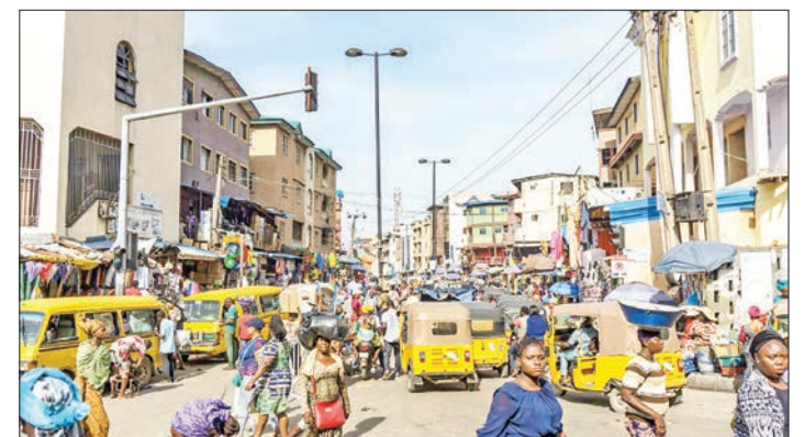
In recent years Lagos, Nigeria's biggest city, has become Africa's most attractive tech hub for investors

'Increasing the tax base' But in spite of the central bank ban, many Nigerians still skirt traditional sectors to use cryptocurrency for overseas transactions.—AFP ■