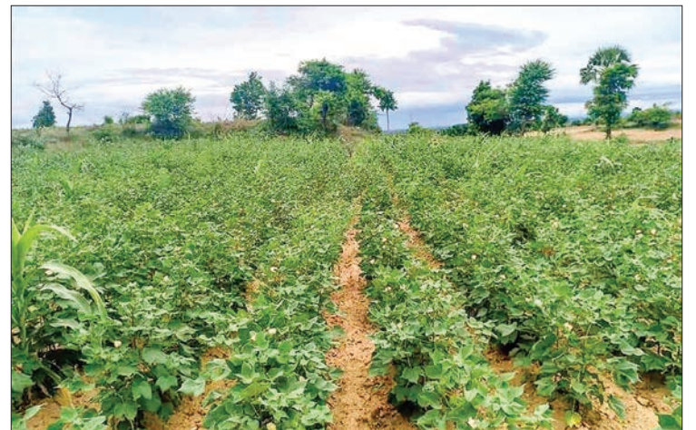
In the 2021-2022 financial year, the Agriculture Department targeted to grow 79,346 acres of cotton crop in the Sagaing region. And, the department has cultivated 74,964 acres of the cotton crop from June to September 2021.

THE cultivation of cotton crop has succeeded in 19 townships of Sagaing, Monywa, Yinmabin, Shwebo and Kanbalu districts, in Sagaing Region.