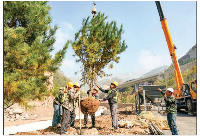
By 2025, China's energy consumption per unit of GDP will be lowered by 13.5 per cent from the 2020 level, the forest coverage rate will have reached 24.1 per cent, and the forest stock volume will have risen to 18 billion cubic meters. Photo taken on 27 September 2020 shows workers planting trees for the 2022 Beijing Winter Olympics in Yanqing District, Beijing, capital of China.

By 2025, China's energy consumption per unit of GDP will be