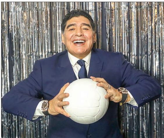
Diego Maradona is pictured prior to the Best FIFA Football Awards at The London Palladium in London, England, 23 October, 2017.

BARCELONA and Boca Juniors, two of Diego Maradona's former clubs, will play a friendly in honour of the late Argentine great on 14 December in Saudi Arabia.