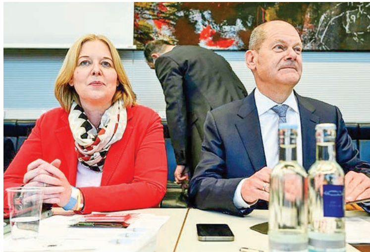
Social Democrat Baerbel Bas, shown next to Finance Minister Olaf Scholz, is expected to become the third woman speaker of the Bundestag.

GERMANY'S new parliament will sit for the first time Tuesday after last month's election, ushering in a post-Merkel era that is more female, younger and more ethnically diverse.