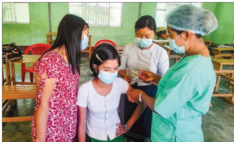
An above 12-year-old student gets jabbed in Zalun Township of Ayeyawady Region.

The middle and high school students aged over 12 are prioritized for vaccination in Zalun Township and the health officials checked the body temperatures and blood pressure of the students before the jab.