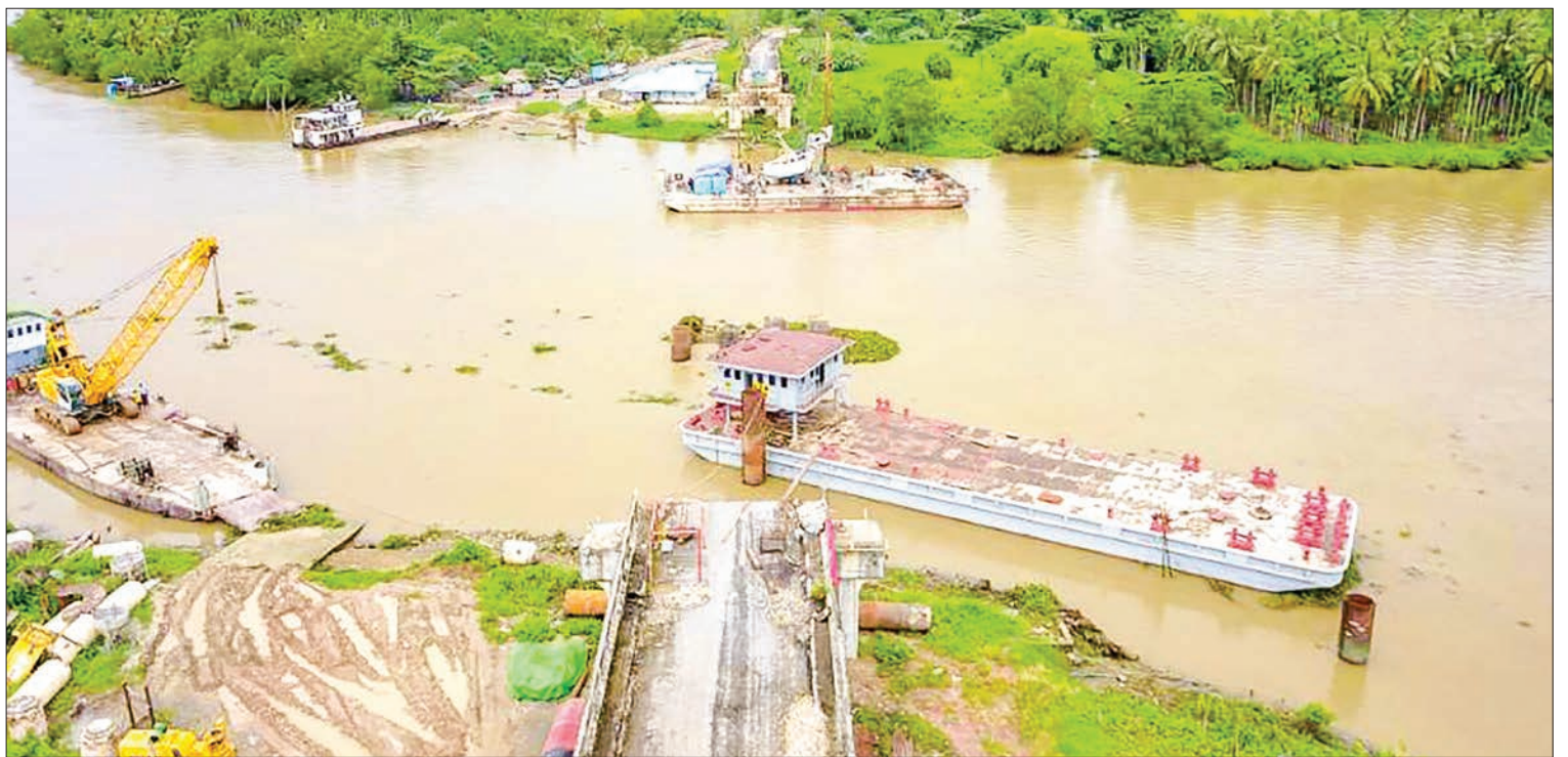
The upgrade works started on 2 October 2020 and are estimated to complete in the 2022-2023 financial year, according to the ministry.

The new two-lane bridge is 1,260 feet long and 31 feet wide with a 24 feet wide motor road. The waterway clearance is 200 feet in width and 20 feet in height. It has a capacity of H.S 25 (Load Class) 60 tonnes. There will be three spans for the main bridge section and six spans on the side