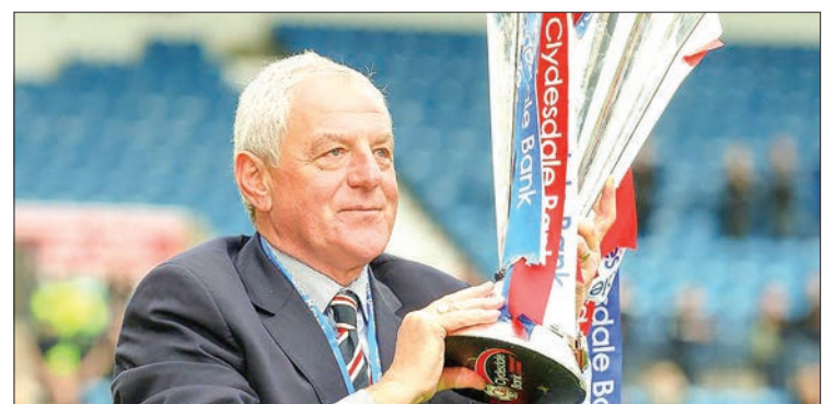
Former Scotland and Rangers manager Walter Smith has died at the age of 73, the Glasgow giants confirmed on Tuesday.

was appointed full-time manager at Ibrox in 1991 and won seven league titles in eight years to lead the club to a record-equaling nine consecutive Scottish league titles. After a four-year stint at Everton and a brief spell as Alex Ferguson's assistant at Manchester United, he was appointed manager of Scotland in 2004. In 2007, he returned to Ibrox, winning three more league titles and guiding Rangers to the UEFA Cup final in 2008 before retiring in 2011. — AFP ■