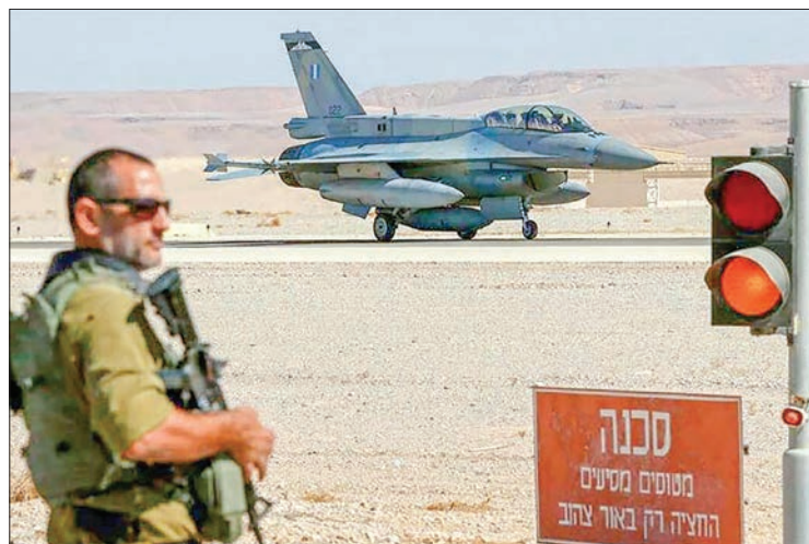
An Israeli soldier stands guard as an F-16 fighter lands during the Blue Flag multinational air defence exercise.

ISRAEL is holding its largest-ever air force exercise this week, joined by several Western countries and India,