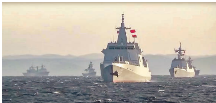
A group of naval vessels from China and Russia sails during joint military drills in the Sea of Japan, in this still image taken from video released on 18 October.

DEFENCE Minister Nobuo Kishi said Tuesday a joint Chinese and Russian naval flotilla seen recent-