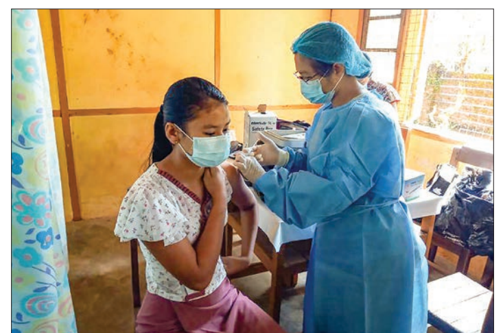
Covid immunization is underway in Kyaikto Township.

MYANMAR'S COVID-19 positive cases rose to 495,898 after 924 new cases were reported on 26 October 2021 according to the Ministry of Health. Among these confirmed cases, 460,224 have been discharged from hospitals. Death toll reached 18,582 after 22 died.