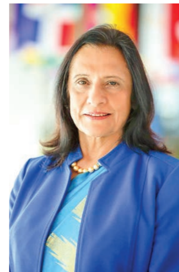
Dr Poonam Khetrapal Singh, Regional Director of the WHO South-East Asia Region.

Third, we must ensure access for all to rights-based, stigma-free, quality-assured and people-centred services. Such services must provide the full spectrum of care, from preventive, diagnostic and treatment care, to rehabilitative and palliative care, with a focus on reaching marginalized and vulnerable groups. If appropriately leveraged, key technologies such as artificial intelligence-based screening can not only increase