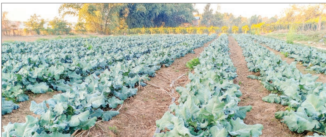
Myanmar agro products are primarily exported to China, Singapore, Malaysia, the Philippines, Bangladesh, India, Indonesia, and Sri Lanka.

The Commerce Ministry is working to help farmers deal with challenges such as high input costs, procurement of pedigree seeds, high cultivation costs, and erratic weather conditions. — KK/GNLM