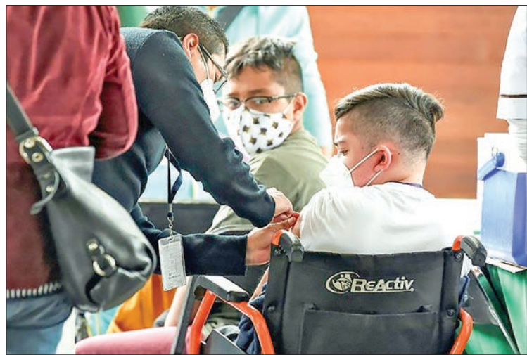
A minor in Mexico City is inoculated with the Pfizer-BioNTech vaccine against COVID-19 as part of the capital city's plan to vaccinate at-risk youths.

MEXICO on Monday began COVID-19 vaccinations for adolescents with chronic diseases in the capital, the latest step in an immunization drive in one of the countries hit hardest by the pandemic.