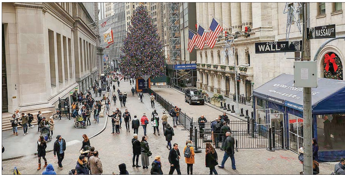
Democratic senators are expected to soon detail the proposal that would allow Washington to reap revenue from the increase in value of stocks, property and other assets of the wealthiest Americans, which generally is not taxed unless it is sold. People walk in front of the New York Stock Exchange (NYSE) at the end of the trading day on 4 December 2017 in New York City, United States.

US President Joe Biden's Democratic allies are considering imposing a tax on the wealthiest Americans, a longstanding goal of the political left that could finally be enacted to pay for a massive social spending plan. Democratic senators are expected to soon detail the proposal that would allow Washington to reap revenue from