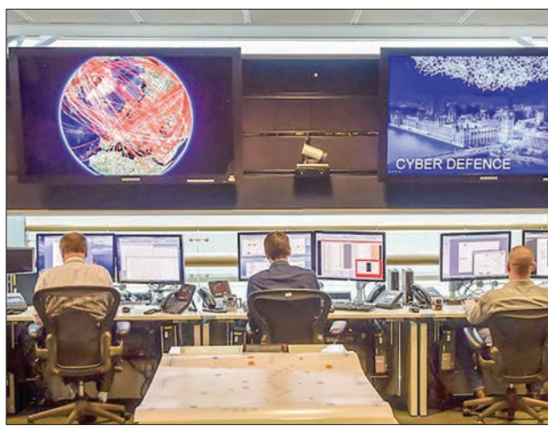
The secret contract was signed this year and experts estimate its value at £500 million ($690 million) to £1 billion.

UK intelligence agencies have entrusted classified data to Amazon's cloud computing arm AWS in a deal designed to vastly