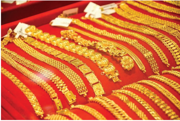
Gold jewellery is seen at one of the gold outlets in Yangon.

Therefore, there is a gap of over K1,000 in the forex market within a month, while the gold price was down by K440,000 per tical.