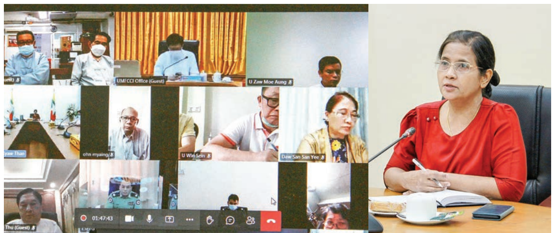
The CBM Deputy Governor and responsible officials attend the online coordination meeting on 25 October.

During the meeting, the officials discussed the arrangements to strengthen the reporting system to the Financial Intelligence Unit for the gold and real estate transactions, the maximum amount of cash that can be paid in cash the use of the banking system in the excess of a fixed amount.