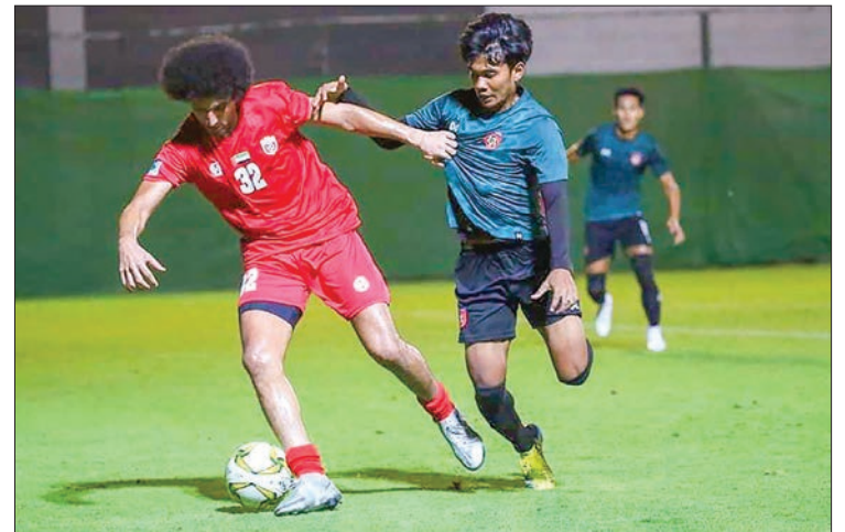
Myanmar team player (green) tries to clear the ball against the UAE first division club player (red) during their international friendly match in Dubai, the UAE on 24 October.

The Asian Cup U-23 Championship (I) matches will be held in Kyrgyzstan from 27 October to 2 November and Myanmar is included in the same group with China Taipei and Viet Nam teams.