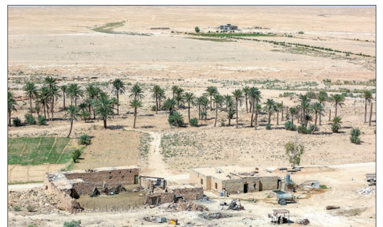
A picture taken on 16 September 2021, shows a view of the Iraqi village of Al-Sahl in Wadi Houran, in the central Anbar governorate. In Iraq's vast western desert, some 200 families live in al-Sahl, a hamlet largely cut off from the rest of the world, their only neighbour one of the country's biggest military bases.

Yet the closest hospital is more than half an hour's drive away along a bumpy road, the only education facility is a primary school, and residents rely on livestock and farming to survive.