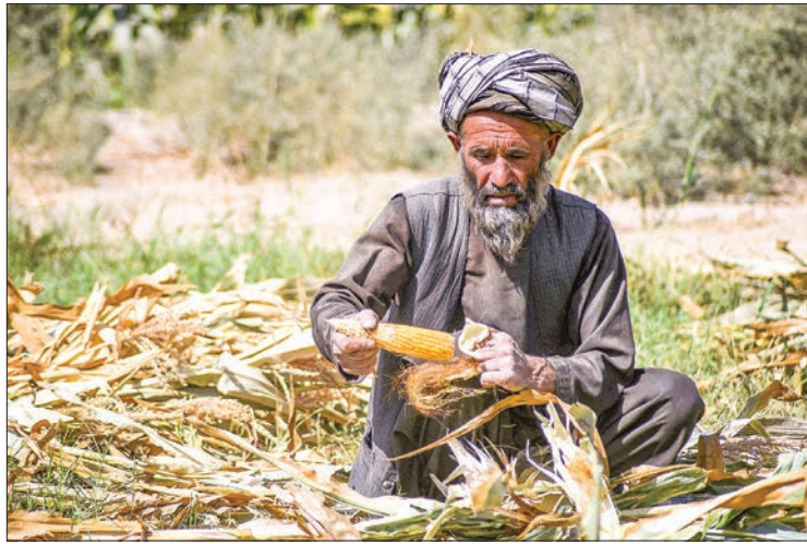
A worker collects corn cobs in a field in Panjwai district on 24 October 2021.

"Afghanistan is now among the world's worst humanitarian crises – if not the worst – and food security has all but collapsed,"