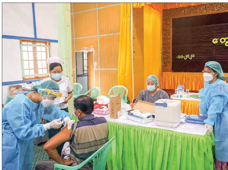
A Pakokku local aged above 55 receives vaccination.

Pakokku Township COVID-19 Prevention and Emergency Response Committee.