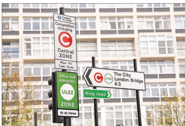
New signs for the ultra-low emission zone (Ulez) are pictured in central London on 8 April 2019.

LONDON greatly expanded from Monday the area in which it charges the drivers of older polluting cars to help clean up the city's air, despite objections from some that it is too costly.