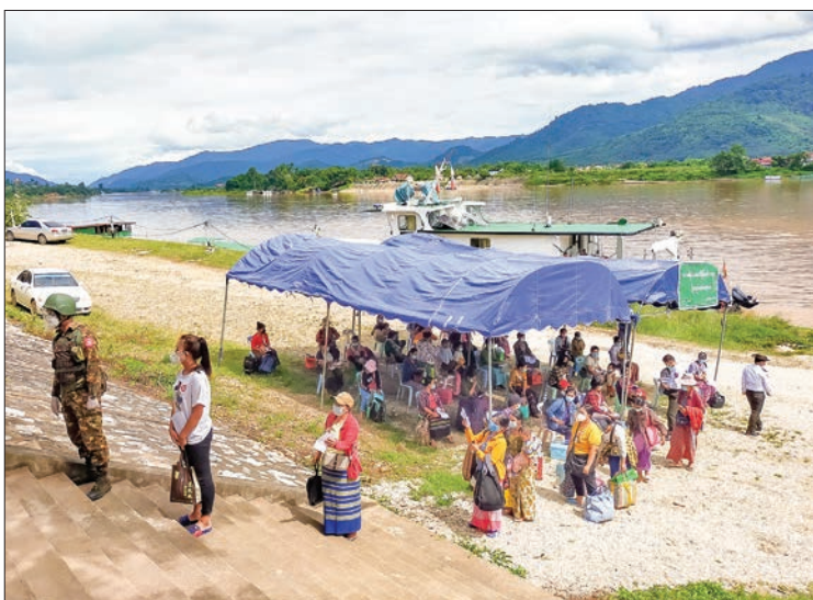
Myanmar returnees from Laos check in at the reception site.

Myanmar has been receiving returnees from Laos since 30 July, and yesterday was the 14 th time acceptance of returnees. As of yesterday, a total of 4,075 Myanmar nationals have returned home from Laos. — Yasay (IPRD)/GNLM