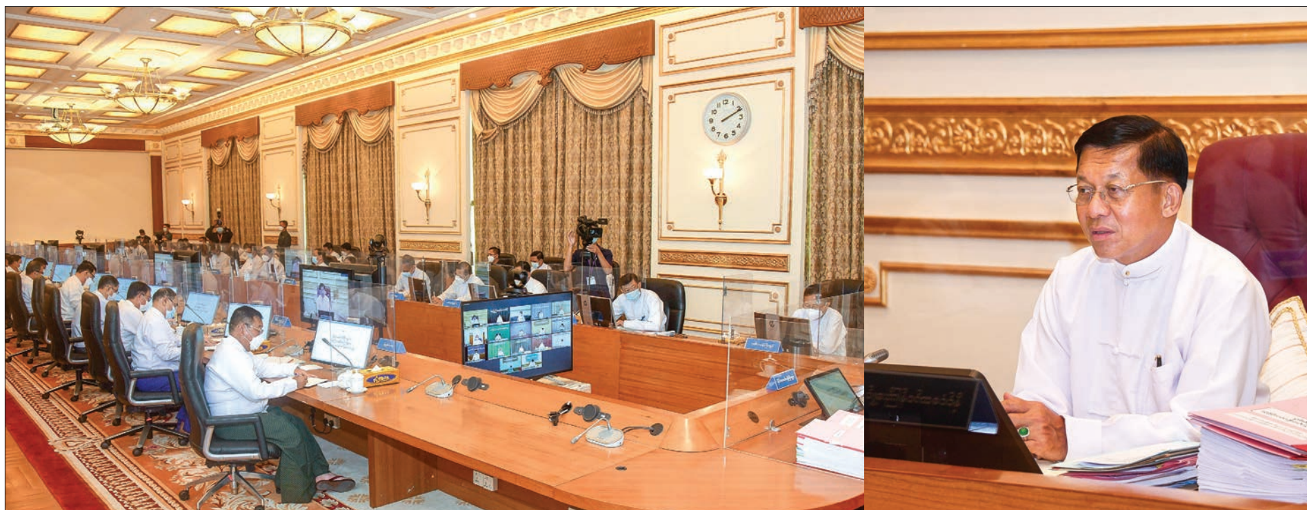
State Administration Council Chairman Prime Minister Senior General Min Aung Hlaing addresses the meeting 2/2021 of the Union Government of the Republic of the Union of Myanmar in Nay Pyi Taw on 25 October 2021.

As the country needs the educated human resources in building the Union based on democracy and federalism without fail, regions and states with weak education should encourage academic matters, said Chairman of the State Administration Council Prime Minister Senior General Min Aung Hlaing at the meeting 2/2021 of the Union Government of the Republic of the Union of Myanmar at the office of State Administration Council Chair-