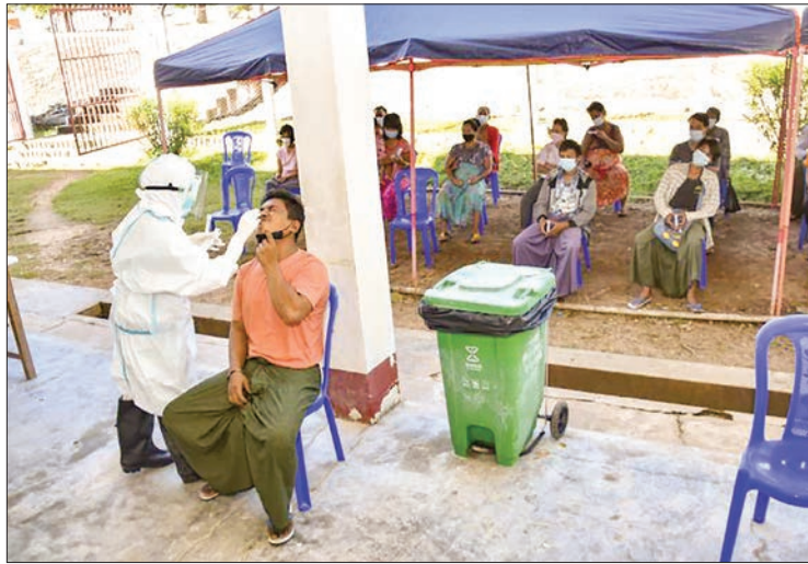
Health staff examine one of the COVID patients at the centre.

As of 7 pm last night, the Nay Pyi Taw transit centres received a total of 167 people (99 men and 68 women) who needs to be monitored, and Hline Township transit centres