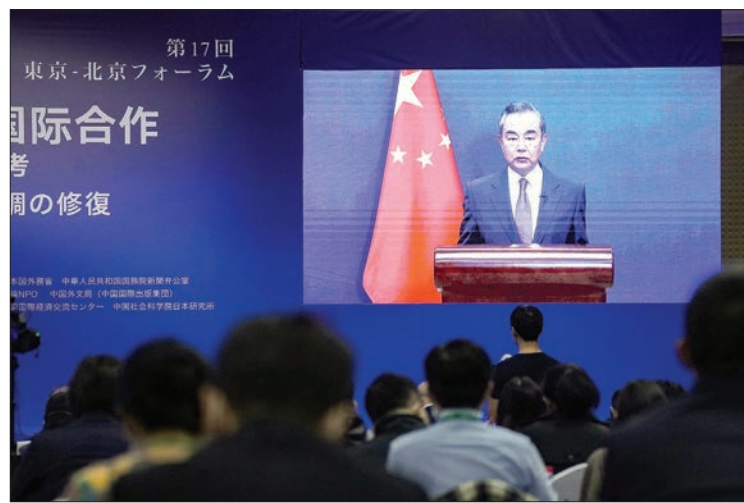
Chinese Foreign Minister Wang Yi (on screen) speaks during the Tokyo-Beijing Forum on 25 October 2021, held virtually amid COVID-19 worries.

line for the second consecutive year against a backdrop of the outbreak of the novel corona-