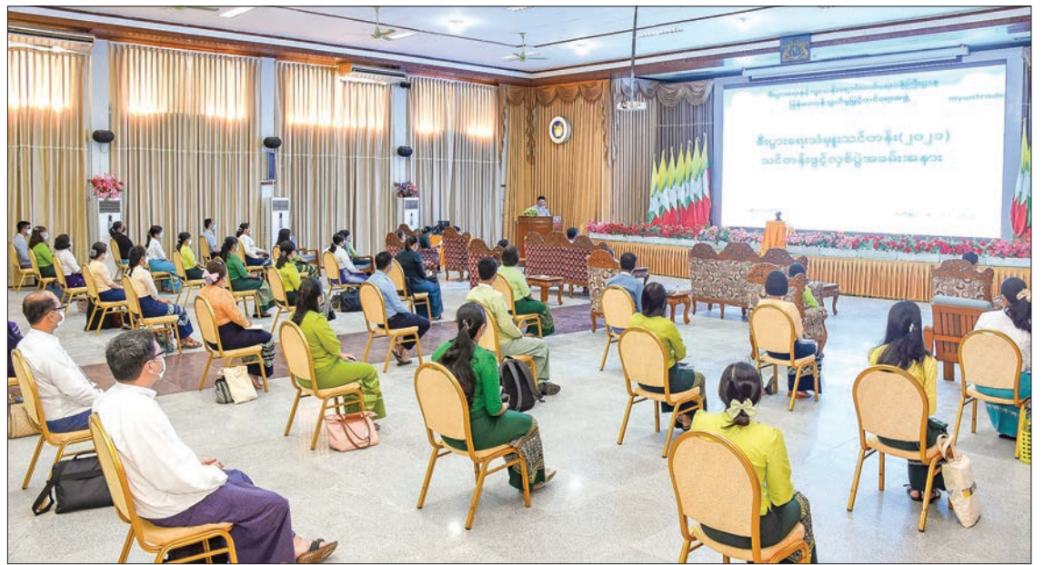
The Commercial Attaché Training Course in progress.

Afterwards, the Deputy Minister said that in the current situation, the western countries where commercial attachés have been sent have little cooperation