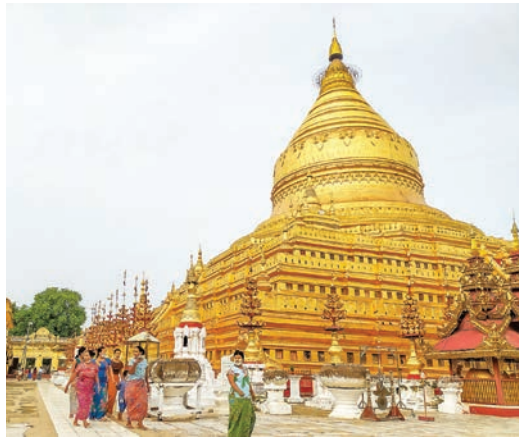
The pilgrims must strictly obey the health guidelines issued by the Ministry of Health.

The local pilgrims are interested to observe the temples, stupas and mural paintings. They usually learn about the history of the temples before the visit. The majority of the visitors were seen in the famous historical temples of Bagan city; Shwezigon Pagoda, Tuyintaung Pagoda, Tantkyitaung Pagoda, Htilominlo Temple, Ananda Pagoda, Bu