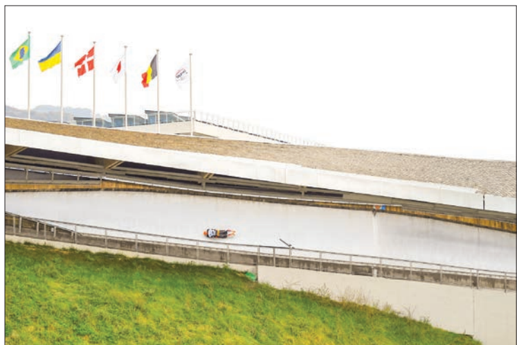
Germany's Christopher Grotheer competes during the men's skeleton in an IBSF sanctioned race, part of a 2022 Beijing Winter Olympic Games test event, at the Yanqing National Sliding Centre in Beijing on 25 October 2021.

TENS of thousands of people in northern China were placed under strict stay-at-home orders on Monday as authorities sought to stamp out a growing Covid outbreak in the run-up to the Beijing