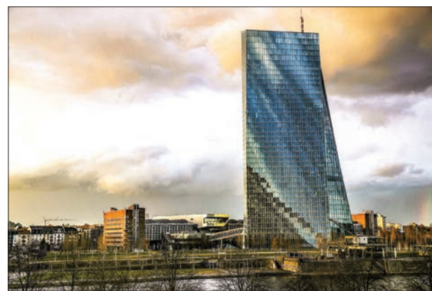
(FILES) In this file photo taken on 11 March 2021 the headquarters of the European Central Bank (ECB) is pictured in Frankfurt am Main, western Germany. Pressure is growing on the European Central Bank to respond to rising inflation in the eurozone, as its counterparts in the United States and the United Kingdom signal willingness to take action. ECB policymakers will meet on 28 October 2021.

Members of its policy-making committee also expect the Fed to start raising interest rates at the end of 2022 — a pros-