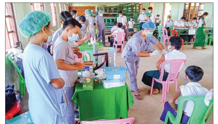
Inoculation roll-out for schoolchildren in Taungup.

HEALTH officials gave Sinovac COVID-19 vaccines to above 12-year-old students at basic education high schools in Taungup Township, Thandwe District, Rakhine State yesterday.