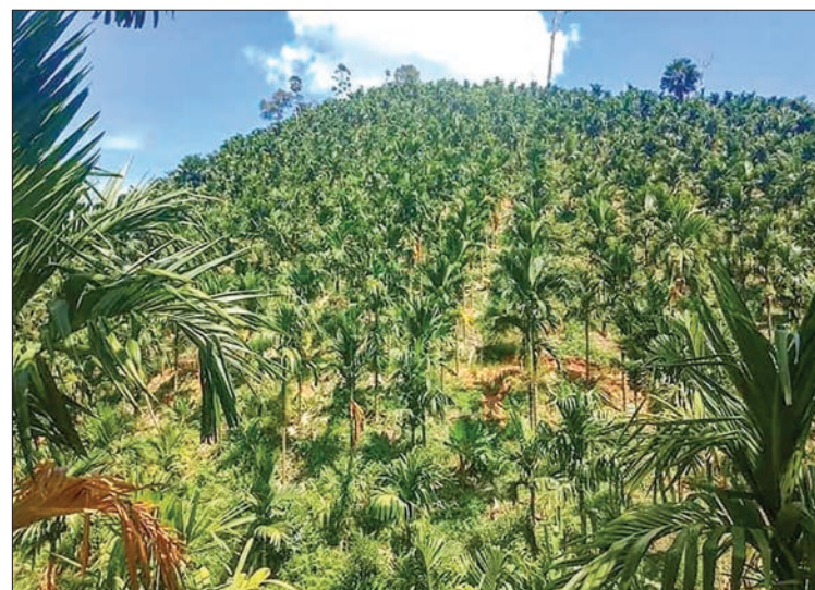
Mon State, Kayin State, Ayeyawady Region, Bago Region and Taninthayi Region are the main producers of betel nuts. The betel nuts from Toungoo and Myeik are popular in the market.

Mon State, Kayin State, Ayeyawady Region, Bago Region and Taninthayi Region are the main producers of betel nuts. The betel nuts from Toungoo and Myeik are popular in the market. There are 20,483 acres of betel nut trees in Taninthayi Township, 5,572 in Kyungsu, 4,523 in Myeik and 11,090 in Palaw, totalling 41,668 acres in Myeik District of Taninthayi Region. About 12.649 million visses of betel nut are produced in the district, according to the data of the Myeik District Agriculture Department.—Myint Oo(Myeik) /GNLM