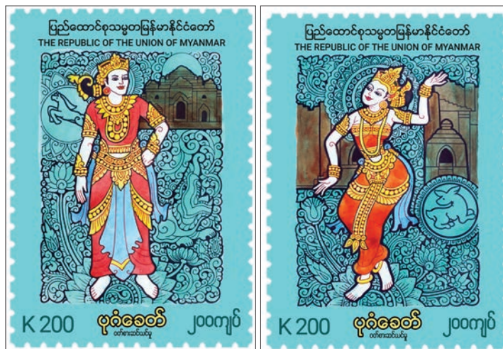
Two new special postage stamps.

TWO new special postage stamps (K200) with pictures of men and women in the Bagan-era dresses will be sold at