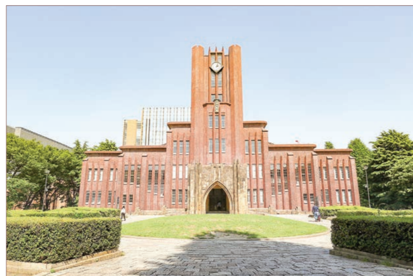
For over 132 years, the University of Tokyo or "Todai" has consistently been one of the top schools in Japan.

A Japanese government-affiliated institution will resume receiving dozens of foreign researchers next Thursday, even as entry restrictions due to the coronavirus pandemic remain, an official said.