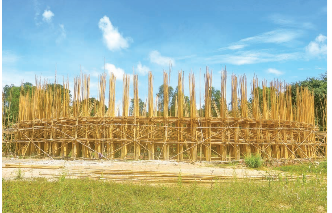
The stake driving ceremony was conducted on 12 June and it was completed up to 15 feet in October.

It is important to use the best quality and mature bamboo in building the pagoda and it will