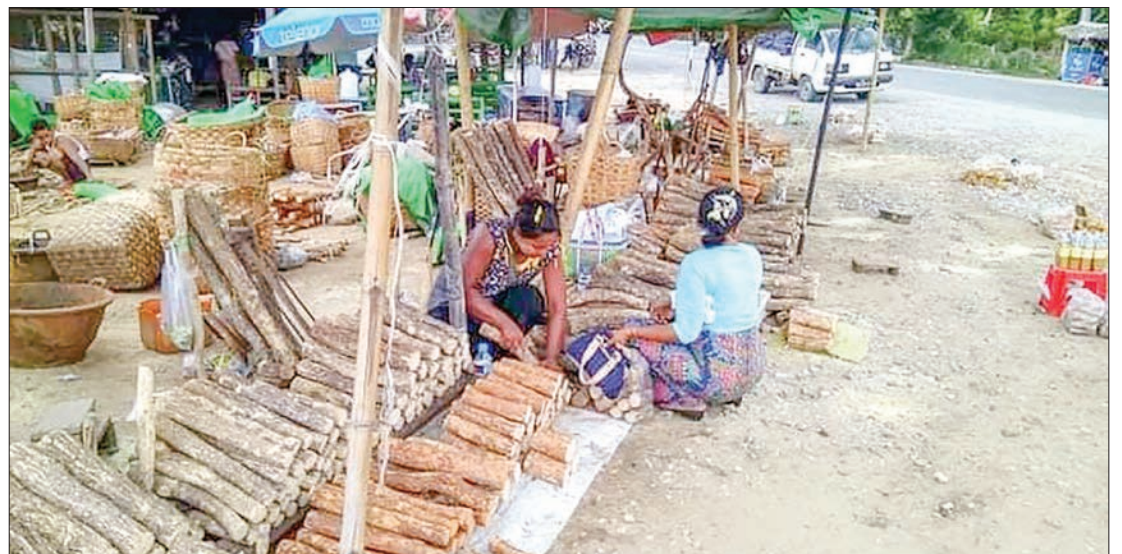
Pakokku Thanaka warehouse, Mandalay Thanaka warehouse and Ayadaw Thanaka warehouse are the main suppliers of Myanmar Thanaka.

THE Thanaka market has recovered during Thadingyut Festival (mid-October) after the market slowdown during the pandemic, said Thanaka growers from Ayadaw Township.