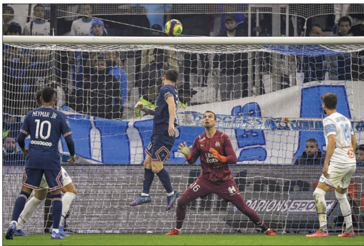
Paris Saint-Germain's Argentinian forward Lionel Messi (C) heads the ball and misses the target next to Marseille's Spanish goalkeeper Pau Lopez Sabata (2 nd R) during the French L1 football match between Olympique Marseille (OM) and Paris Saint-Germain's (PSG) at Stade Velodrome in Marseille, southern France, on 24 October 2021.

LIONEL Messi was kept quiet as 10-man Paris Saint-Germain settled for a 0-0 draw with bitter rivals Marseille in a heated atmosphere in Ligue 1 on Sunday.