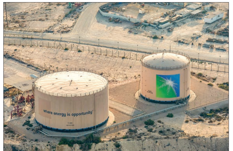
(FILES) In this file handput photo provided by Saudi oil giant Aramco on 11 February 2018, shows its Dhahran oil plants, in eastern Saudi Arabia. The climate crisis threatens a double blow for the Middle East, experts say, by destroying its oil income as the world shifts to renewables and raising temperatures to unlivable extremes.

For Ben Cahill, senior fellow at the Centre for Strategic and International Studies, the kingdom "will have to make a massive push on energy efficiency and decarbonizing the power sector". — AFP ■