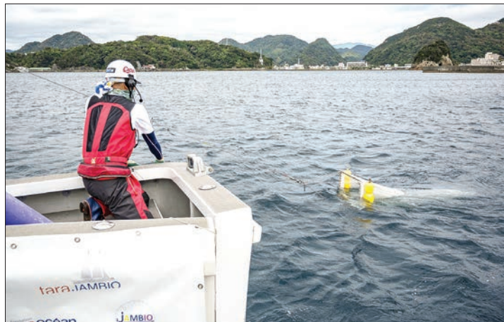
This photo taken on 14 October 2021 shows a researcher pulling a funnel-shaped net nicknamed "the sock" on the water's surface during a joint project of the French Tara Ocean Foundation and Japanese marine-station network Jambio onboard a boat off the coast of Shimoda, Shizuoka prefecture. A boat's crew casts a net into the seemingly clean waters off Japan's Izu peninsula, but not to catch fish – they are scooping up microplastics to learn more about the pollution's impact on marine life.

"This blue stuff is microplastics, and that's polystyrene, I believe," Agostini said. — AFP ■