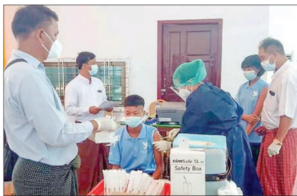
An above 12-year-old student gets jabbed.

HEALTHCARE officials gave the first doses of COVID-19 vaccines to above 12-year-old schoolchildren from Youth Training Centre in Hopin, Mohnyin District,