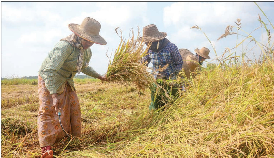
Farmers are seen harvesting the rice.

mestic price of rice is likely due to less demand for rice, said U Zaw Khaing, CEC of