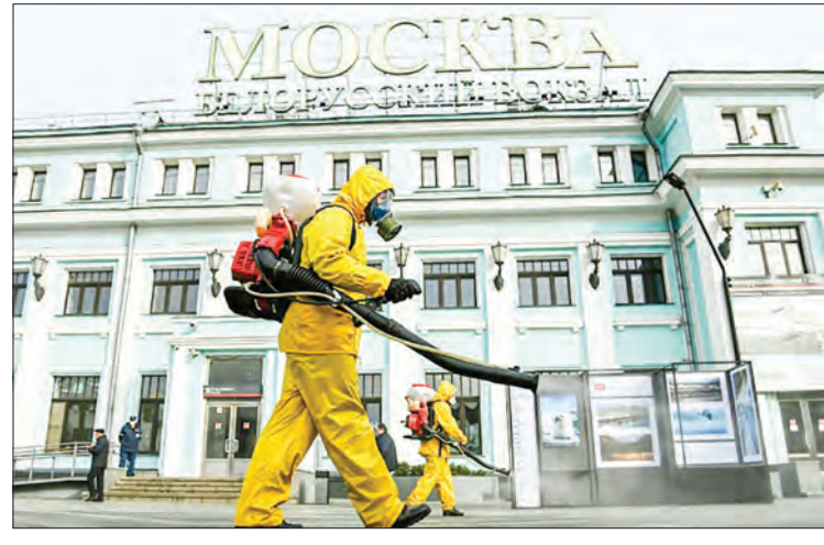
Russia reported a record 1,036 Covid-19 deaths in a single day Thursday, but officials have warned the worst is yet to come.

MOSCOW, the capital of Europe's worst Covid-hit nation, will shut non-essential servic-