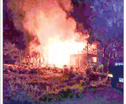
Fire breaks out at Basic Education Middle School, Zetaw village, Yesagyo Township, triggered by terrorists