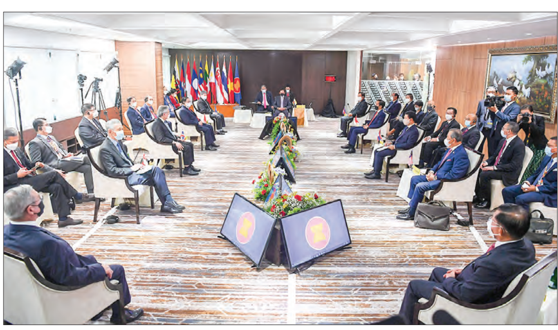
ASEAN Leaders' Meeting is in progress on 24 April 2021.