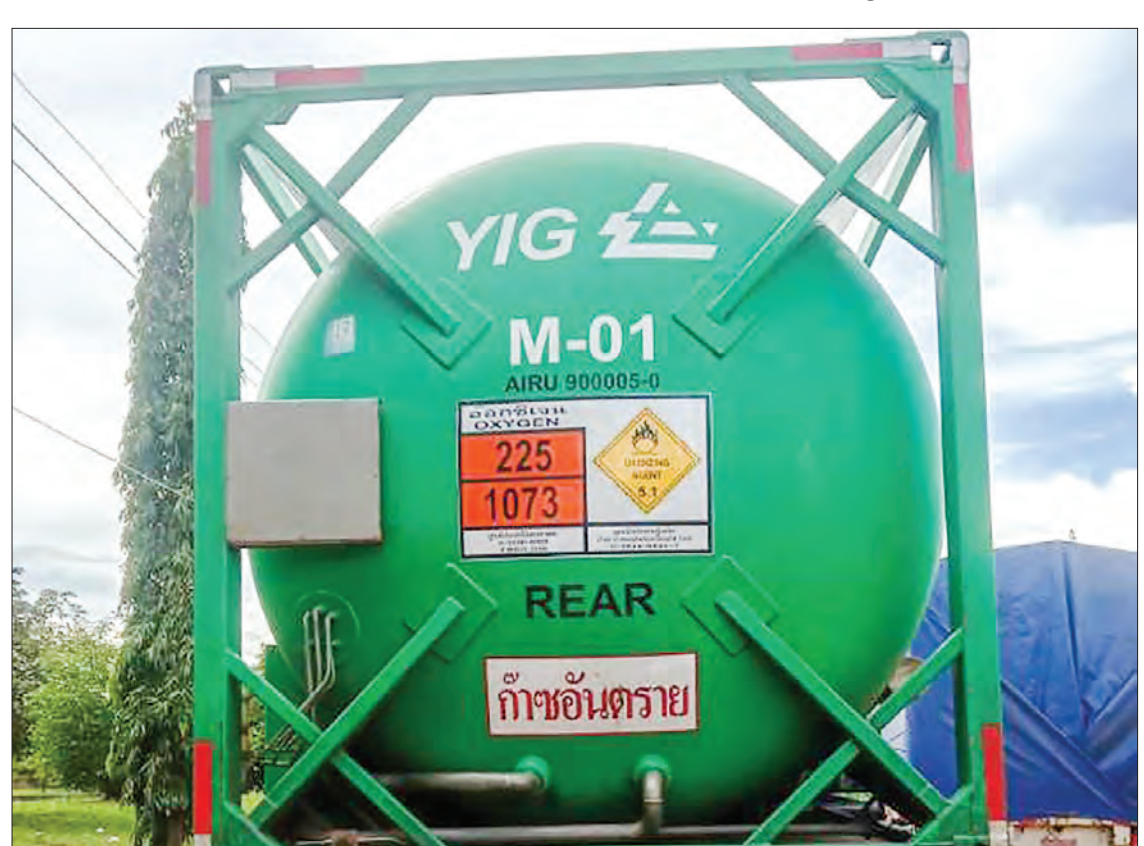
A bowser is carrying liquid oxygen from Myawady to Yangon.

It is reported that the Ministry of Commerce is coordinating with relevant departments, treatment of COVID-19, as well as contact persons for inquiries can be reached through the Ministry's Website—www.commerce.gov.mm. — MNA