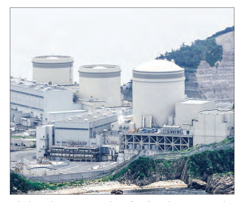
File photo taken 23 June 2021, shows (from front) the No. 3, No. 2 and No. 1 reactors of Kansai Electric Power Co.'s Mihama nuclear power plant in Fukui Prefecture, central Japan.

A nuclear reactor in central Japan's Fukui Prefecture was halted on Saturday, just four months after its restart as it could not meet a deadline set by regula-