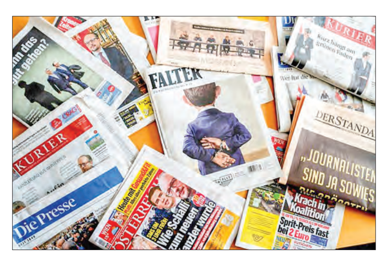
Prosecutors are probing allegations the inner circle of fallen right-wing Chancellor Sebastian Kurz used public money to pay for polls skewed to boost his image and fawning press coverage.

Kurz and all those under investigation deny any wrong-doing. But the fact that government adverts are used as a means of influencing the press has long been an "open