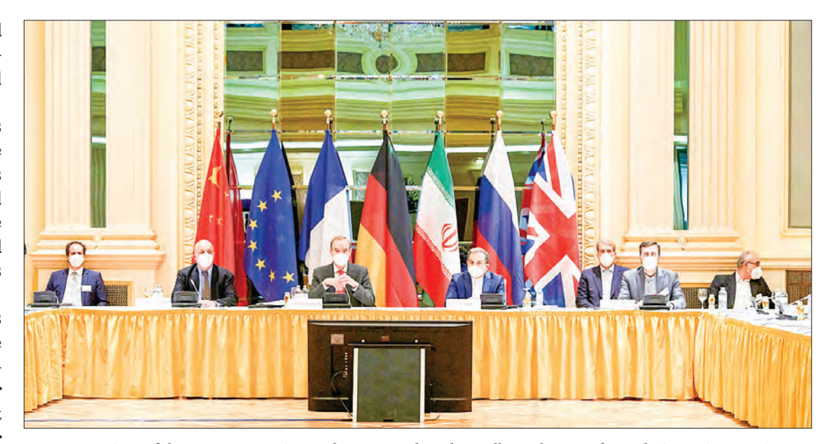
Representatives of the European Union and Iran attend nuclear talks at the Grand Hotel Vienna in Austria on 6 April 2021.

Malley's trip to Paris comes after he visited the Gulf for talks with allies Qatar, Saudi Arabia and the United Arab Emirates which are all deeply concerned