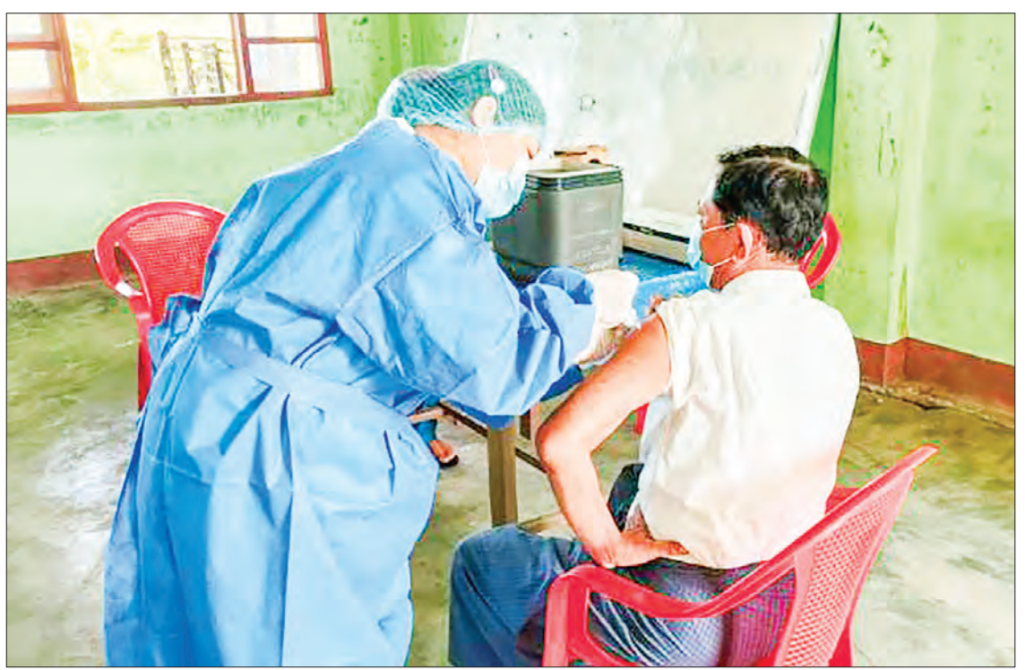
A health staff injects anti-COVID-19 vaccine into a local.

MYANMAR has vaccinated over 16 million people for COV-ID-19 as of 19 October, 2021, the Ministry of Health stated.