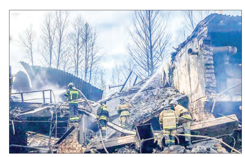
Russia's emergencies ministry said the fire could have broken out as a result of "violations of technological processes and safety measures".

Russia's emergencies ministry said the fire could have broken out as a result of "violations of technological processes and safety measures" at the local PGUP Elastic factory.—AFP ■