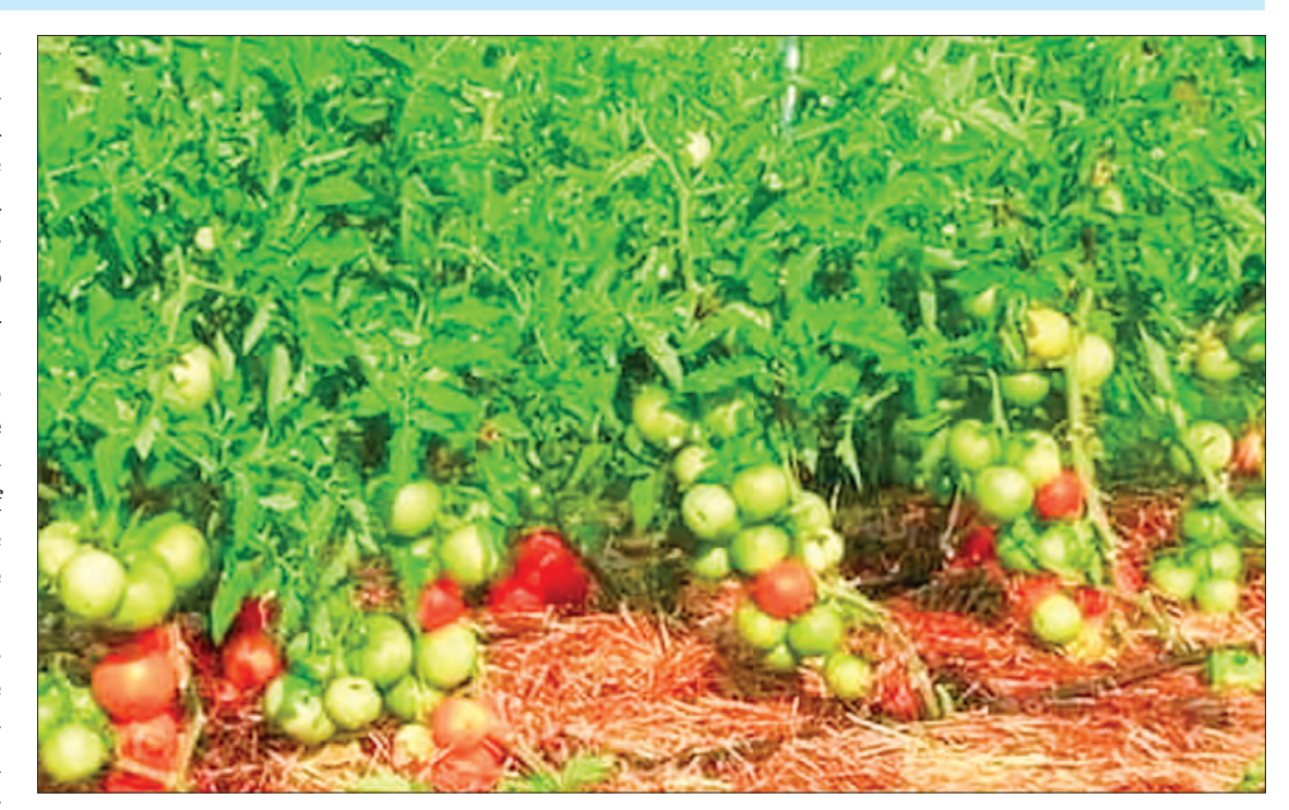
Tomato plants are bearing ripen fruits at patches.

At present, all kinds of corps are getting good prices, and the growers are doing well by growing those crops this year.