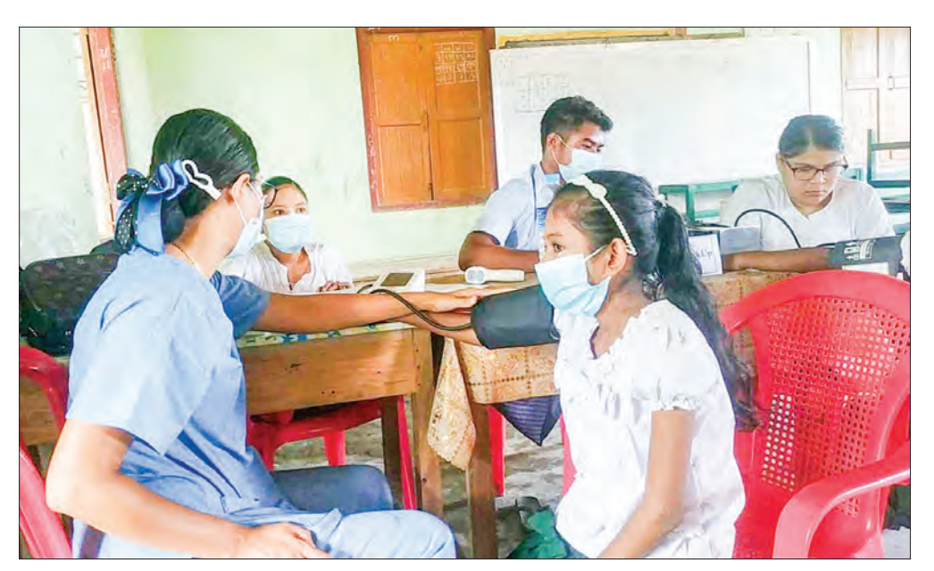
Health staff perform medical tests on students before vaccination against COVID-19 in Sittway.

HEALTH officials gave Sinovac COV-ID-19 vaccines to internally displaced persons and over 12-year-old, middle and high school students in Sittway Township and Bengali villages in Rakhine State yesterday morning.