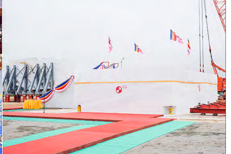
Members of the Sangha recite Jayanto Bodhiyamule gatha