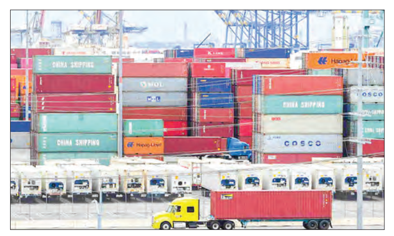
This file photo shows containers at the Port of Los Angeles in San Pedro, California.

President Joe Biden's Democratic party is currently working to pass two huge legis-