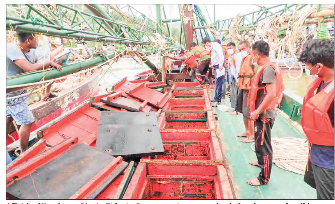
Officials of Kawthoung District Fisheries Department inspect trawlers before departure for offshore the coast.

"And if the fishery trade is good, then all the connections are good, so it can be said that the economic chain is developing.