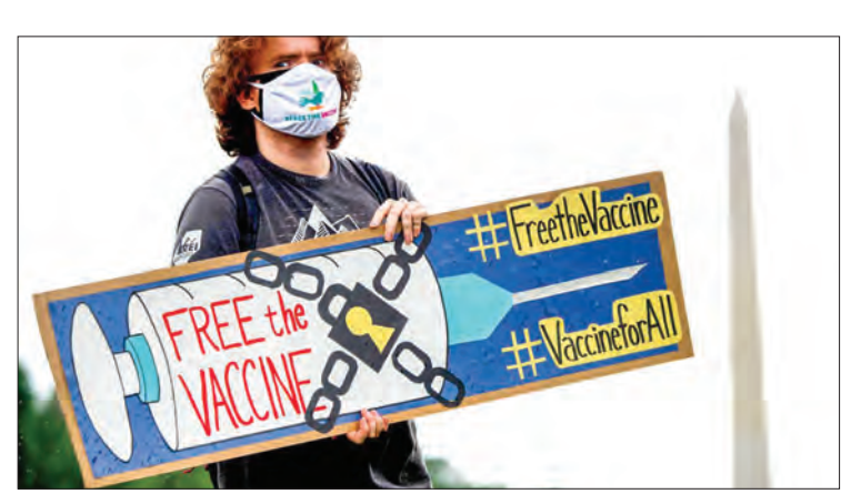
Developed countries need to waive intellectual property rights to ensure equitable access to Covid-related medicines by poorer nations.

Such a mechanism should be linked to international agencies such as the World Health