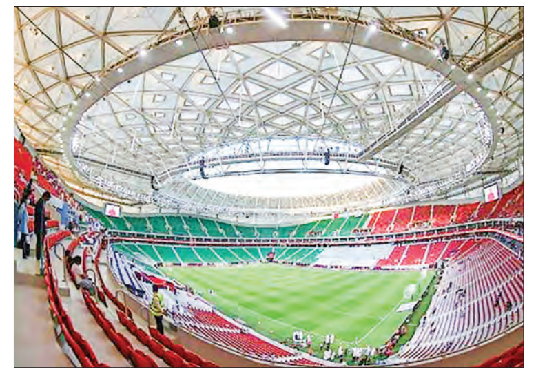
Al-Thumama Stadium in the Qatari capital Doha ahead of its inauguration.

Following the World Cup, Al Thumama's capacity will be reduced to 20,000, with a sports clinic and a boutique hotel set to open on site.—AFP ■