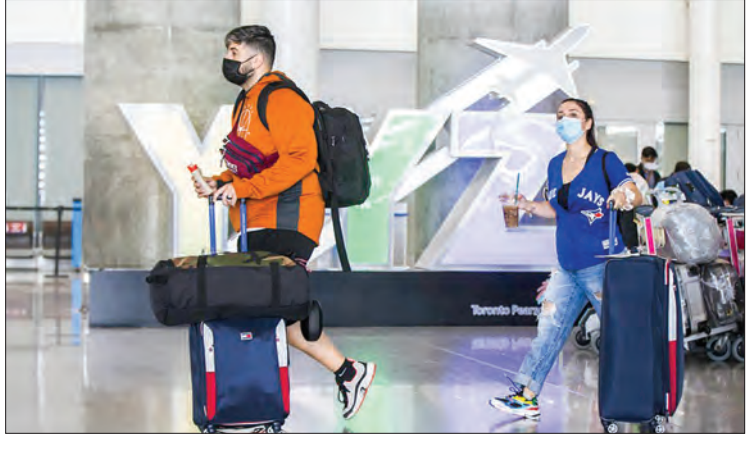
Travellers wearing face masks walk through the arrivals hall at Toronto Pearson International Airport in Mississauga, Ontario, Canada, on 7 September 2021.

ed 926 new cases of the COVID-19, increasing the cumulative total to 1,694,095 cases, including 28,687 deaths, according to CTV.