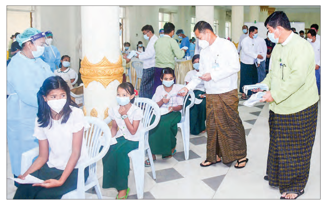
Vice-Chairman of State Administration Council Deputy Prime Minister Vice-Senior General Soe Win cordially converses with students at vaccination programme.

The government made a plan to vaccinate 11,556 students over 12 against COVID-19 at Mingala Byuhar hall starting from 12 October, and 3,814 students received their vaccines until yesterday.-MNA