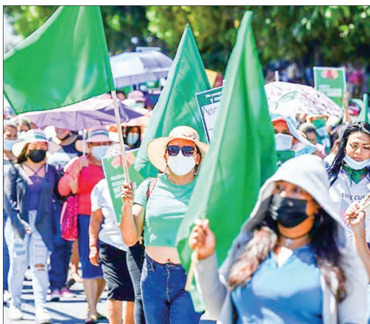
People march demanding the decriminalization of abortion in San Salvador.

The proposed changes would have allowed terminations to save the mother's life; in the case of a life-threatening fetal deformity; and if the pregnancy "is the result of sexual violence". But on Wednesday the petition was overwhelmingly rejected in Congress.—AFP ■