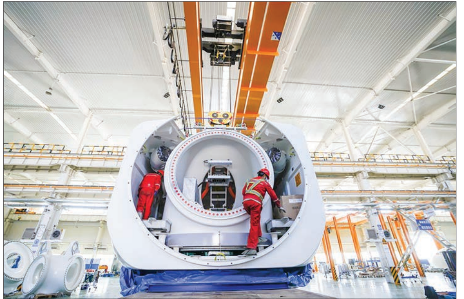
Employees work at a wind turbine plant of Goldwind Science and Technology Co., Ltd. in Hami, northwest China's Xinjiang Uygur Autonomous Region, 25 April 2020.