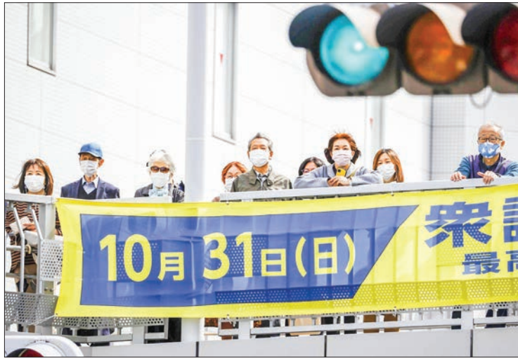
Voters listen to a candidate for the 31 Oct Lower House election in Itami, Hyogo Prefecture, on Wednesday.

In its election campaign pledges, the ruling Liberal Democratic Party vows to crack down on irresponsible animal dealers and facilitate the adoptions of cats and dogs rescued after being abandoned by their original owners while seeking to reduce the number of euthanized pets