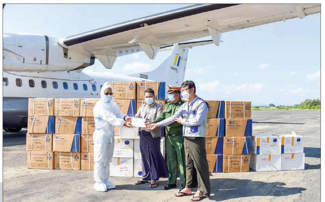
Tatmadaw aircraft transports the Covid vaccines to Kachin State where officials receive them (in picture).