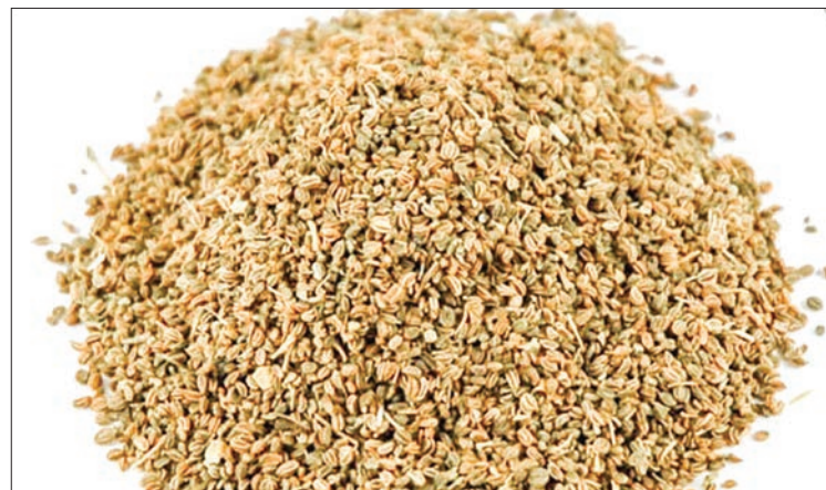
The prices of fennel seeds increased from K1,600 to K2,600 per viss (a viss is equal to 1.6 kg), while the black fennel seeds soared from K4,500 to K7,500 per viss. The price of black fennel seeds edged up to a record high this year.

The fennel seeds and coriander seeds are cultivated as winter crops in Mandalay and Sagaing regions, with a view to export targeting.