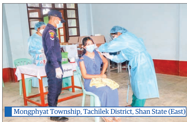
Mongphyat Township, Tachilek District, Shan State (East)