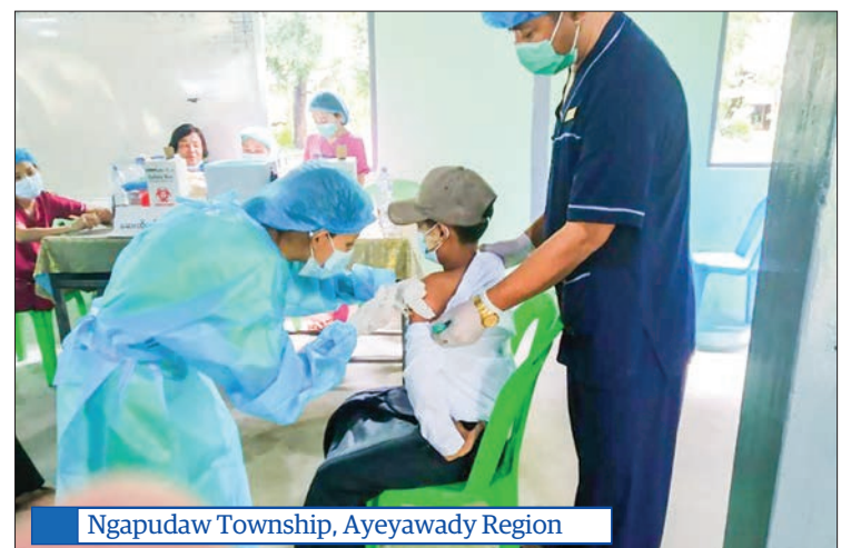
Ngapudaw Township, Ayeyawady Region