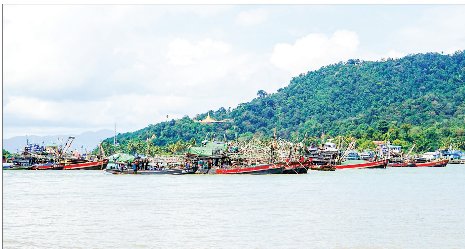
Squid boats are seen docking along the coast in Myeik and preparing to catch squids offshore.