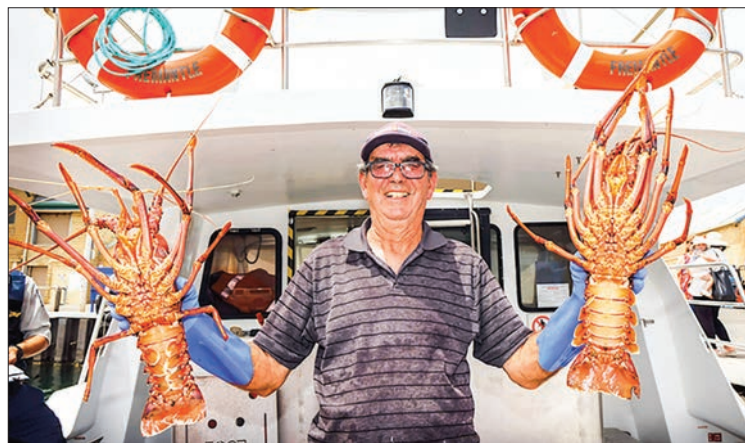
Lobsters are one of a number of products from Australia that China has restricted imports of as relations between the countries plunged.

RAMPANT smuggling of Australian rock lobsters into mainland China is a national security threat, Hong Kong's new customs chief said Thursday as she vowed to crack down on the trade.