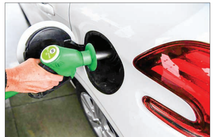
Pump prices of diesel hit a record high in France, while those of petrol neared their 2012 peak.

the party not to come away empty handed, Biden is stepping up efforts to broker a truce between more conservative members and the left-leaning progressive wing. At issue are the items on Biden's original wish list and how to pay for it all. He originally pushed for $3.5 trillion in spending on the social support bill, but the latest figure under consideration is about $2 trillion.—AFP ■