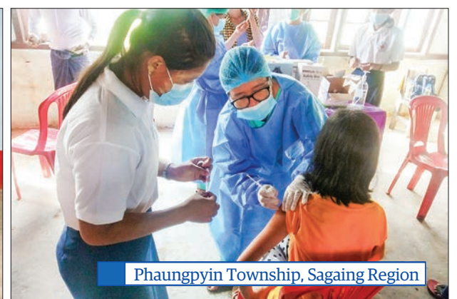
Phaungpyin Township, Sagaing Region