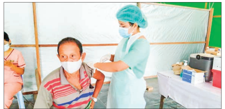
An older person gets jabbed in Yathedaung Township Rakhine State.

Departmental staff, members of the fire brigade, members of the Red Cross and volunteers provided necessary assistance during the vaccination.