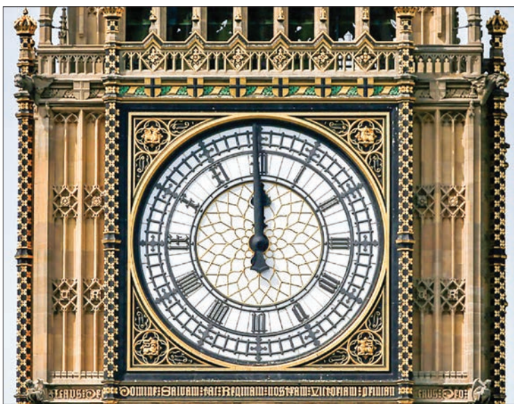
Big Ben, the nickname for the Great Bell of the striking clock of the Elizabeth Tower at Westminster, has been silent while undergoing its own restoration work.

IT has been an enduring symbol of democracy since the 19th cen-