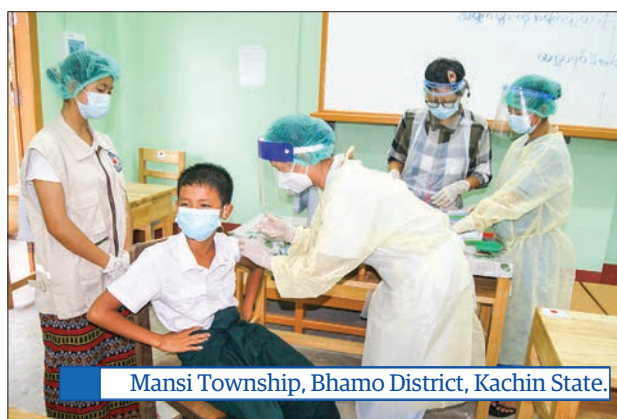
Mansi Township, Bhamo District, Kachin State.