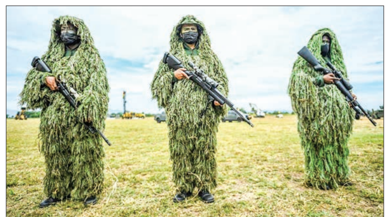
The Colombian army said it had killed 10 dissidents members of the FARC guerrilla group in a shootout. PHOTO: AFP

Guerrillas from both groups in the area compete for income from drug trafficking because of its proximity to the Pacific coast.—AFP ■