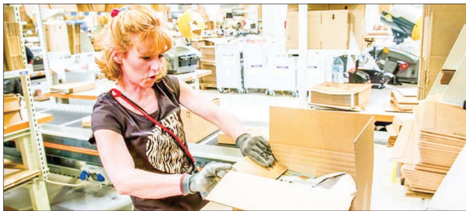
An Amazon employee seen working on 11 April 2015, in Lauwin-Planque in northern France.

THE United States has resolved a key point of trade friction with Europe after inking a deal to end controversial digital services taxes on American tech giants. Washington said Thursday it will remove