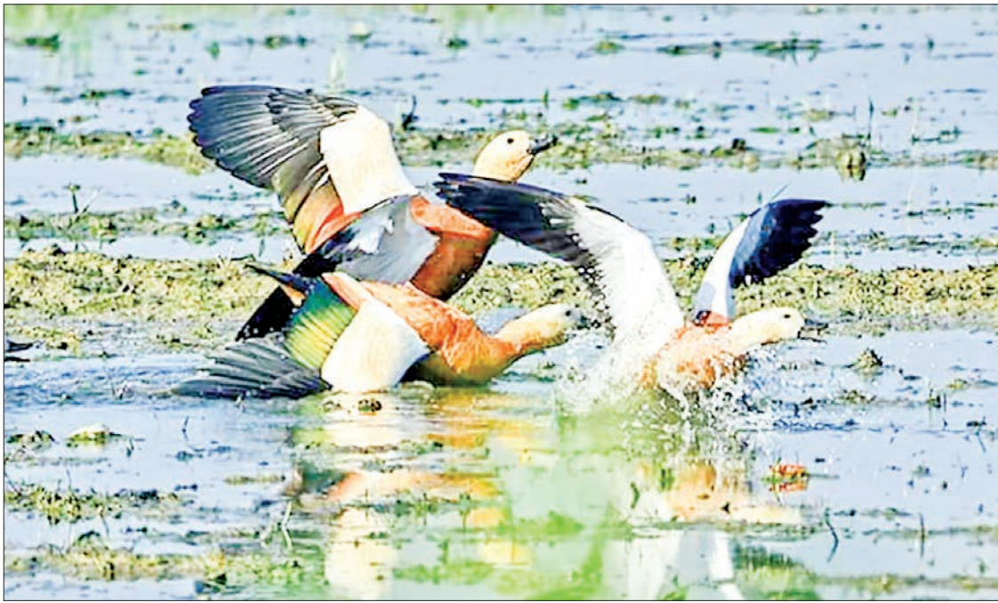
Every year, migratory birds flock to the freshwater lake, where there is abundant food, away from colder regions with frozen lakes and a short food supply that make it difficult for them to survive.

It is of vital importance to protect the migratory birds that flock to the Ramsar site and inland regions for winter in Myanmar. Every year, migratory