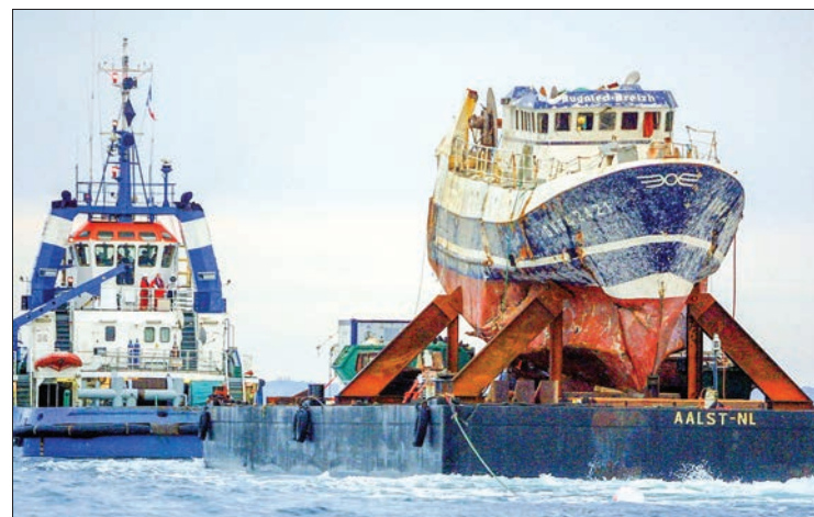
Five crew died on the Bugaled Breizh when it sank off the coast of Cornwall, southwest England, on 15 January 2004.