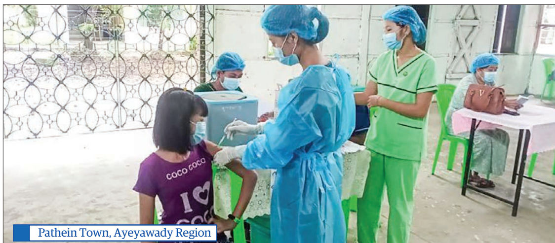
Pathein Town, Ayeyawady Region