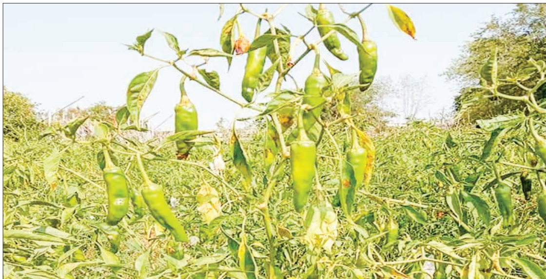
There are over 50 acres of chilli pepper in the Sagaing Region, with 17 acres in Mawlaik Township, 27 in Phaungbyin and seven in Dabayin.

“The chilli pepper is priced at about K1,100-K1,300 per viss (a viss equals 1.6 kg). The price relies on foreign demand. To maintain the foreign market demand, we need to come up with a technique,” said a grower