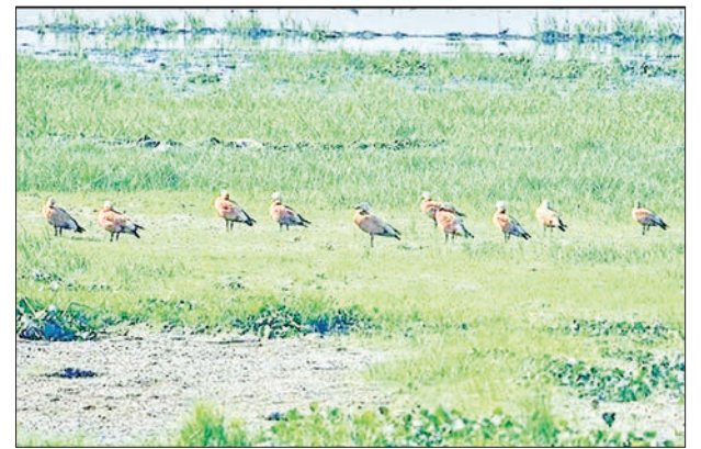
There are 1,136 bird species found in Myanmar, including 400 migratory bird species, as per the bird researchers’ data.