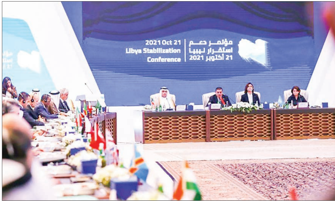
The Libya Stabilization Conference was the first of its kind to be held in the country for years, with representatives from about 30 nations attending.

LIBYA'S fragile unity government hosted an international conference Thursday to build support ahead of the war-battered country's landmark December election.