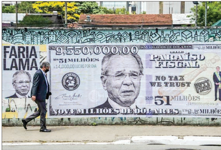
Brazilian President Jair Bolsonaro is proposing a controversial and expensive welfare programme a year before elections he is expected to lose.

The government announced earlier this week that it was setting up a new social welfare programme to replace the "Bolsa Familia" system created by the