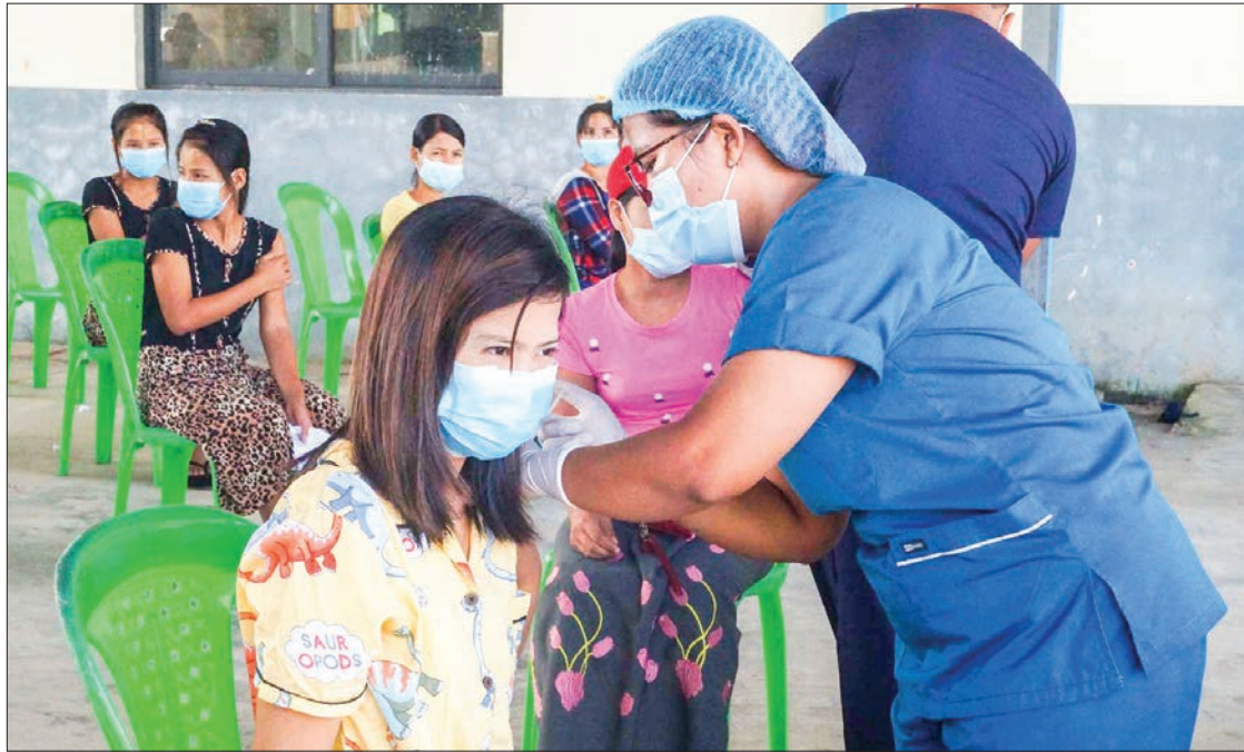
Inoculation drive for factory workers in progress in Htantabin.

On 16 October, 363 workers from the Hydrodynamic plant, 113 workers from GBL Bags Factory, 23 workers from Hui