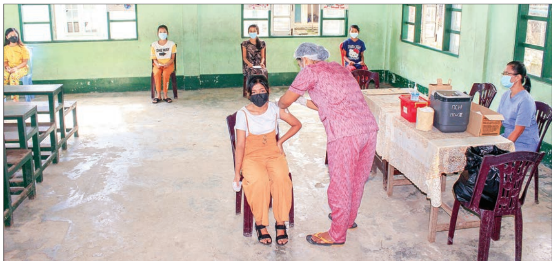
Inoculation drive for above 12-year-old students in Dala.

There are a total of 4,982 students aged 12 and above in the 2021-22 academic year. On 17