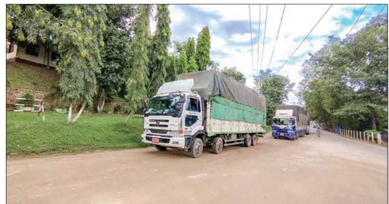
Lorries are transporting the imported anti-Covid medical supplies to states/regions.

It is reported that the Ministry of Commerce is coordinating with relevant departments, treatment of COVID-19, as well as contact persons for inquiries can be reached through the Ministry's Website— www.commerce.gov.mm . — MNA