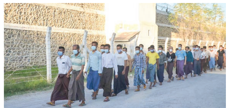
Releasees from the Mandalay Central

A total of 171 prisoners, including 162 men and nine women, were released from various prisons in Mandalay Region.