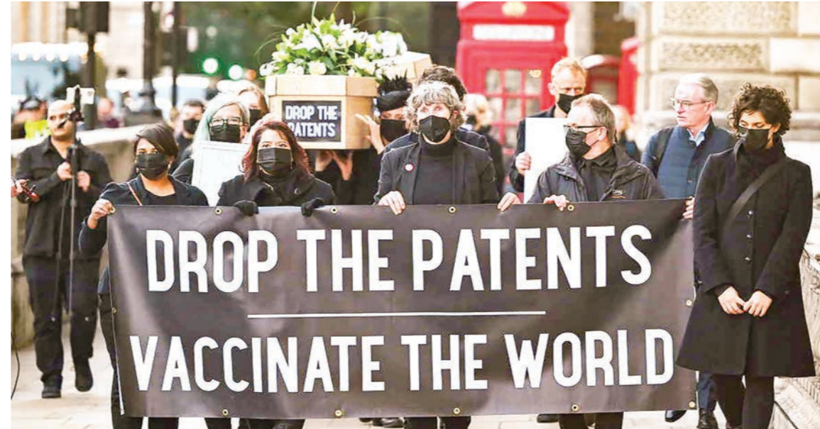
Protesters walk with coffins from Parliament Square to Downing Street during a protest organised by Global Justice Now, against the UK's blocking of a waiver for the patent of the COVID-19 vaccine, in central London on 12 October 2021.

"A positive and meaningful outcome... would not only send a powerful message of global solidarity, but would also be proof