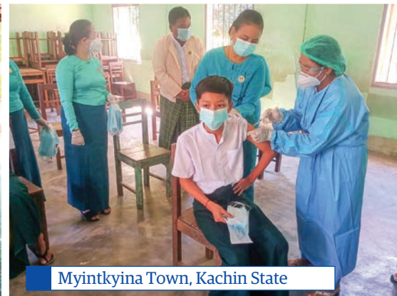
Myintkyina Town, Kachin State