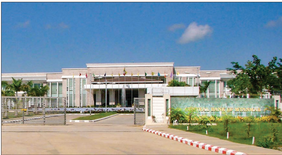
The Central Bank of Myanmar.

THE Central Bank of Myanmar (CBM) sold US$50 million at its FX auction rate of K1,820 on 18 October.