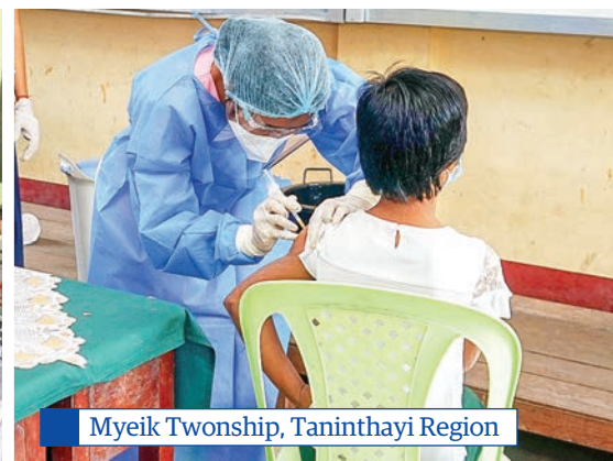
Myeik Twonship, Taninthayi Region