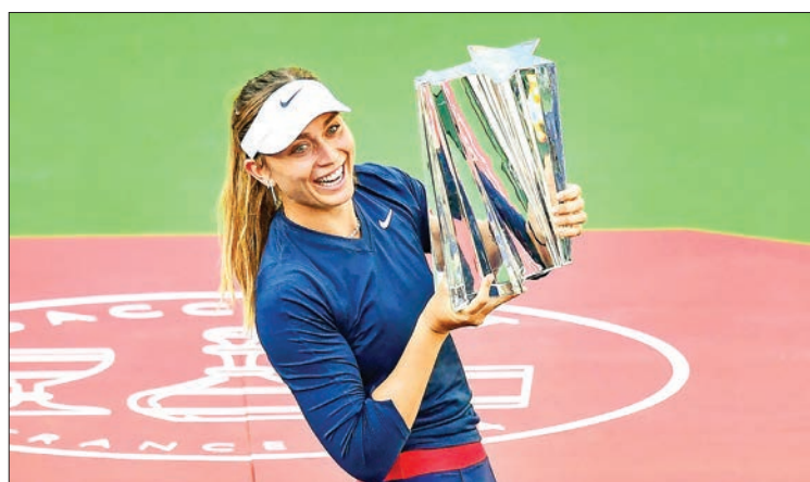
Paula Badosa of Spain holds the winners trophy following victory over Victoria Azarenka of Belarus in their women's final match at the Indian Wells tennis tournament on 17 October 2021 in Indian Wells, California.

PAULA Badosa demonstrated her mental toughness to become the WTA Indian Wells champion in her desert debut on Sunday with a hard-fought, three-set victory over two-time champion