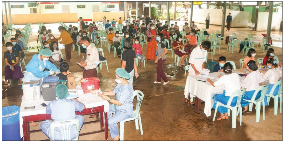
Immunization programme is underway.

for half an hour to find out if there are any health problems and to report everything immediately," officials added.