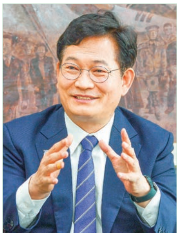
Song Young Gil, the leader of South Korea’s ruling Democratic Party, speaks in an interview with Kyodo News at the National Assembly in Seoul on 18 October 2021.

“We are going to prioritize practicality the most, and I am sure that the Democratic Party