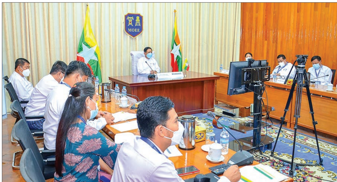
MoEE delegation participates in the online 2 nd Belt and Road Energy Ministerial Conference.

THE 2 nd Belt and Road Energy Ministerial Conference is being held on 18 and 19 October in the People's Republic of China.