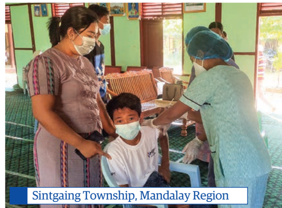
Sintgaing Township, Mandalay Region