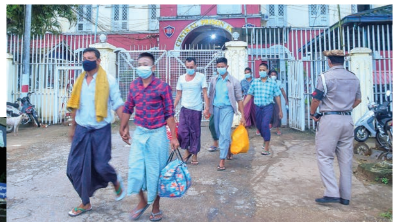
The released are seen returning to their home townships.

yesterday, 99 were male prisoners and 150 were females, and the remaining 497 will be