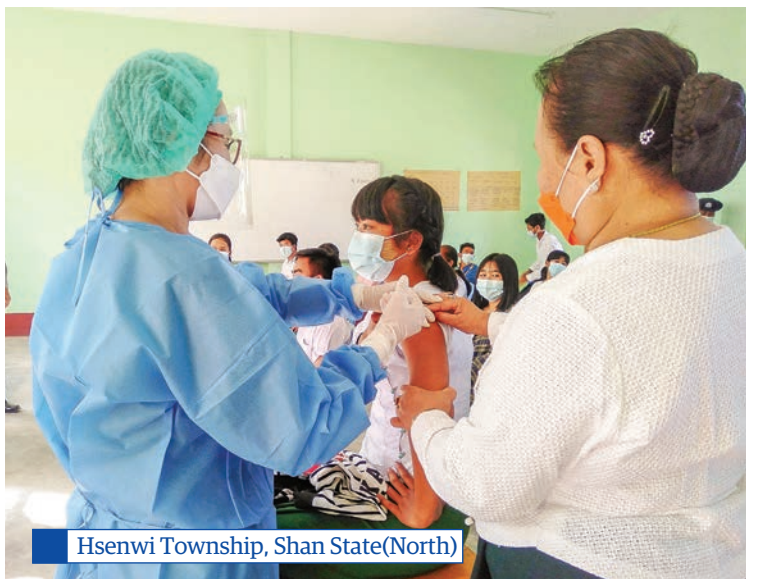
Hsenwi Township, Shan State(North)