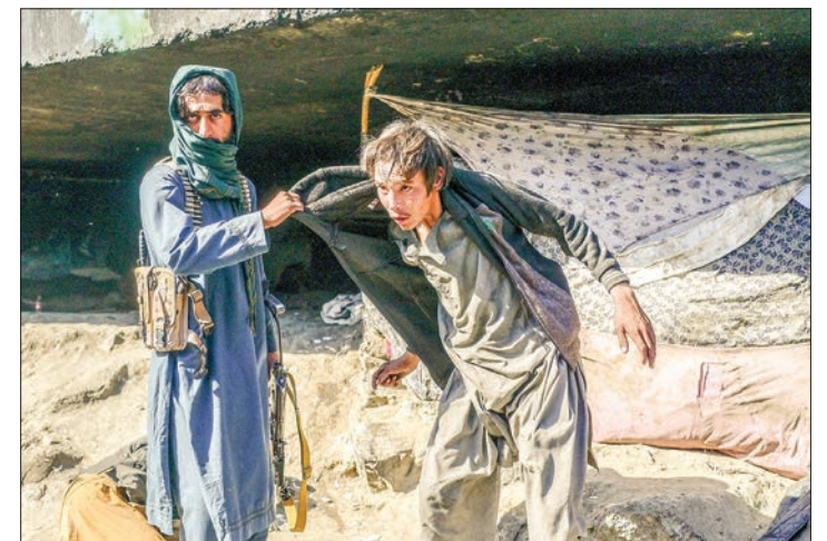
This picture taken on 16 October 2021 shows a Taliban member detaining a drug addict under a bridge where hundreds of addicted people gather in Kabul. With shaved heads, oversized tunics and the frightened gaze of hunted animals, the drug addicts rounded up by the Taliban brace for 45 days of painful and anxiety-ridden withdrawal.

The gunmen fire a few shots into the air to assert their authority and shock the addicts, before about 20 are rounded up and whisked away. — AFP ■