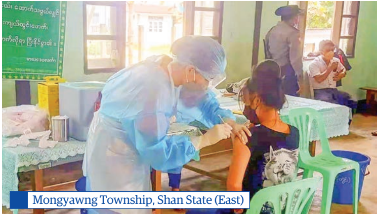
Mongyawng Township, Shan State (East)