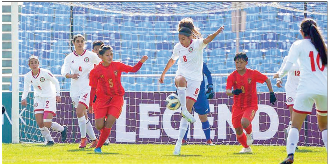
Myanmar women's national football team beat Lebanon women's team 4-0 in the opener of the 2022 AFC Women's Asian Cup Qualifiers, which was played yesterday at Spartak Stadium in Bishkek, Kyrgyzstan.

"I'm not great, but I'm happy with the result. I'm happy to have best understanding