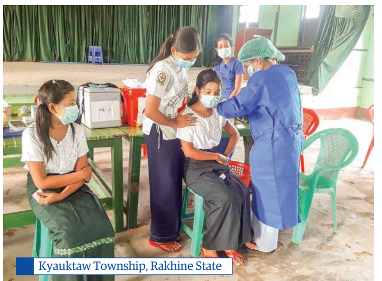
Kyauktaw Township, Rakhine State