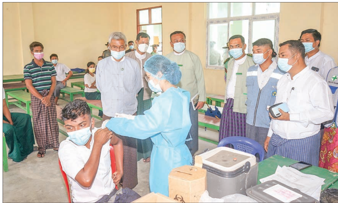
The MoI deputy minister and party view the vaccination in Maungtaw Township.

The Deputy Minister, together with the Chairman and members of the Maungtaw District Administration Body, encouraged the vaccinations to the students in Maungtaw Township, and cordially met with students, parents and teachers. The vaccination to the students at the age of 12 and above started on 17 October and 1,404 students of 7,297 students in the township have been vaccinated as of yesterday.