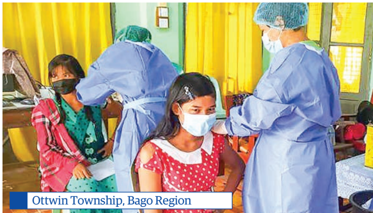
Ottwin Township, Bago Region