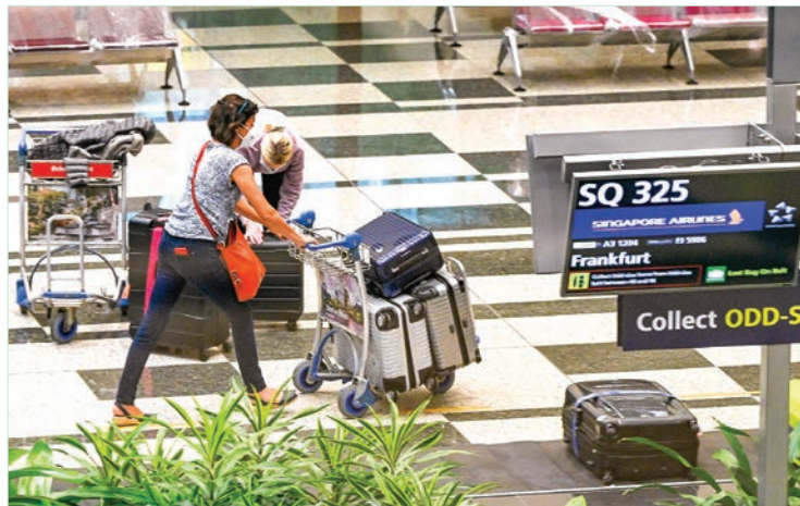
Passengers on Singapore Airlines flight SQ325 – the first flight to arrive under the new Vaccinated Travel Lane (VTL) – are pictured in the baggage hall at Changi Airport in Singapore on 8 September 2021, as travellers vaccinated against the Covid-19 coronavirus arrive from Frankfurt, Germany and are able to enter Singapore without quarantine.