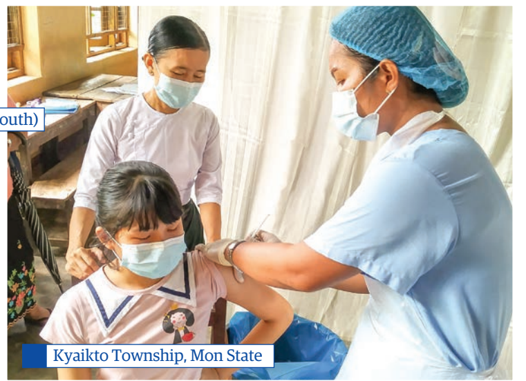
Kyaikto Township, Mon State