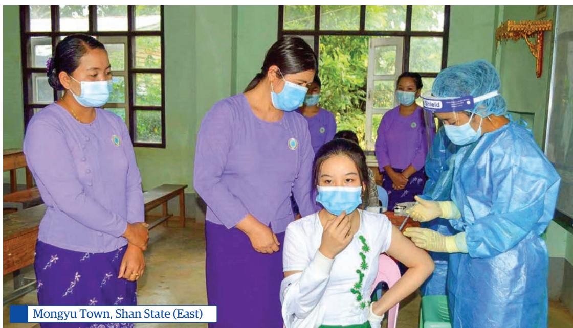
Mongyu Town, Shan State (East)