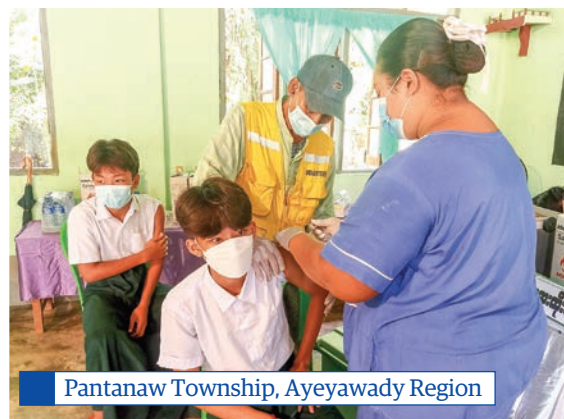
Pantanaw Township, Ayeyawady Region