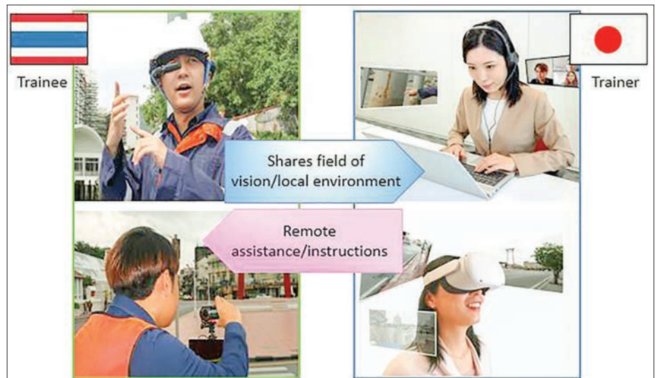
The Association for Overseas Technical Cooperation and Sustainable Partnerships, NTT Docomo Inc and Mobile Innovation Co have agreed on a tie-up for a trial of remote technical training using 5G network solutions.

Its collaboration with NTT Docomo came as a number of Japanese companies have faced dif-