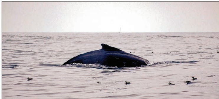
A humpback whale is seen off the coast of Punta Choros, in La Higuera, Chile, on 6 October 2021. The Dominga mining project, to be built in La Higuera, is expected to cost 2,500 million dollars and will include the extraction of iron and copper concentrates. Its closeness to the Humboldt Archipelago, which is composed of eight islands and islets with one of the richest ecosystems in the world, has caused the rejection of environmental organizations.

THE Humboldt archipelago off the northern Pacific coast of Chile is a “natural treasure” and refuge for unique species of fauna, including a particular