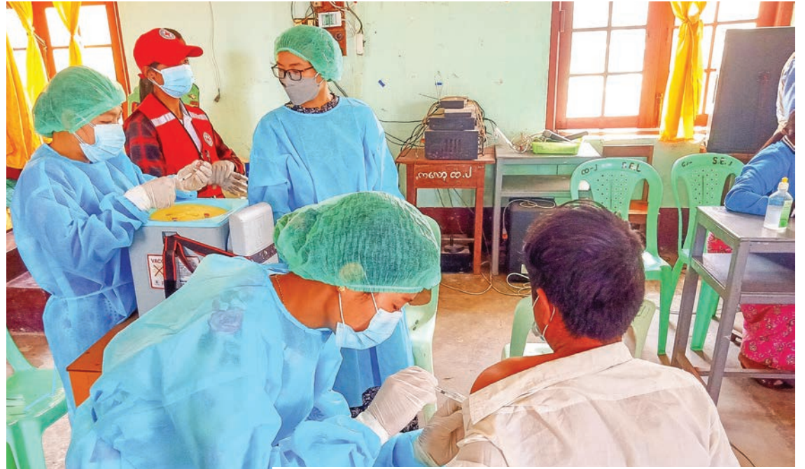
Kalaw Township, Shan State(South)