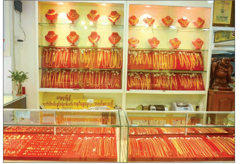
One of the gold jewellery outlets.

The global gold price stood at above US$1,766 per ounce, while a US dollar exchange rate was around K2,000. — NN/GNLM