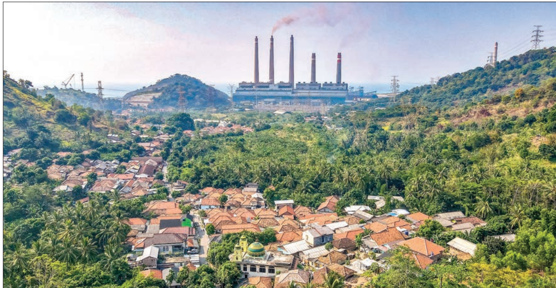
This photo taken on 21 September 2021 shows village houses as smoke rises from the chimneys at the Suralaya coal power plant in Cilegon. Smokestacks belch noxious fumes into the air from a massive coal-fired power plant on the Indonesian coast, a stark illustration of Asia’s addiction to the fossil fuel which is threatening climate targets.

“We are moving much slower than the impact of climate change. We are running out of