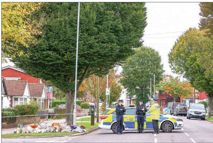
Police officers staff a cordon next to floral tributes left near the scene of the fatal stabbing of British lawmaker David Amess close to Belfairs Methodist Church in Leigh-on-Sea, a district of Southend-on-Sea, in southeast England on 17 October 2021.

BRITISH lawmakers will on Monday pay tributes in parliament to their fallen colleague David Amess, as counter-terrorism police probed whether a suspect arrested was motivated by Islamist extremism.