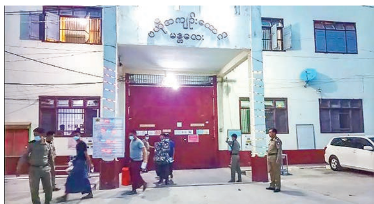
Releasees from the Mandalay Central Prison.

THE State Administration Council yesterday announced amnesty order No. (186/2021) that 1,316 prisoners were released from various prisons across the country and thus 80 prisoners were also released from Mandalay