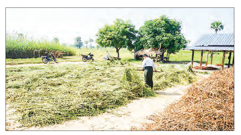
Normally, Myanmar exports about 80 per cent of sesame production to foreign markets. China is the main buyer of Myanmar sesame, which was also shipped to markets in Japan, South Korea, China (Taipei), the UK, Germany, the Netherlands, Greece, and Poland among the EU countries.

The volume of sesame exports was registered at over 96,000 metric tons, worth $130 million, in the financial year 2015-2016; $100,000 tonnes, worth $145 million, in the FY2016-2017; 120,000 tonnes, worth $147 million, in the FY2017-2018; 33,900 tonnes valued $43.8 million in the 2018 mini-budget period, 125,800 tonnes, worth $212.5 million in the FY2018-2019 and over 150,000 tonnes of sesame, worth $240 million in the FY2019-2020, the trade data of Central Statistical Organization indicated. - KK/GNLM