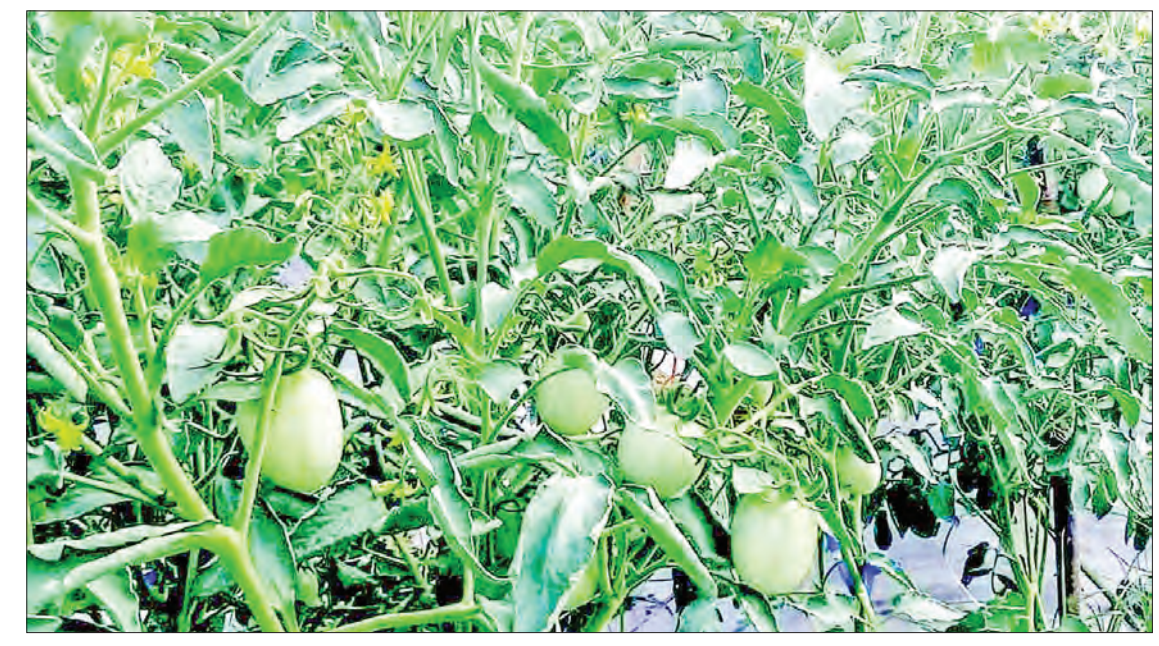
The growers from Pwintbyu township are engaging with the agriculture and they are growing paddy, sesame, green gram, chickpea, sunflower, maize and other vegetables.

This year, the local farmers are happy because of the good yield following reasonable rains and availability of underground water in Pwinbyu