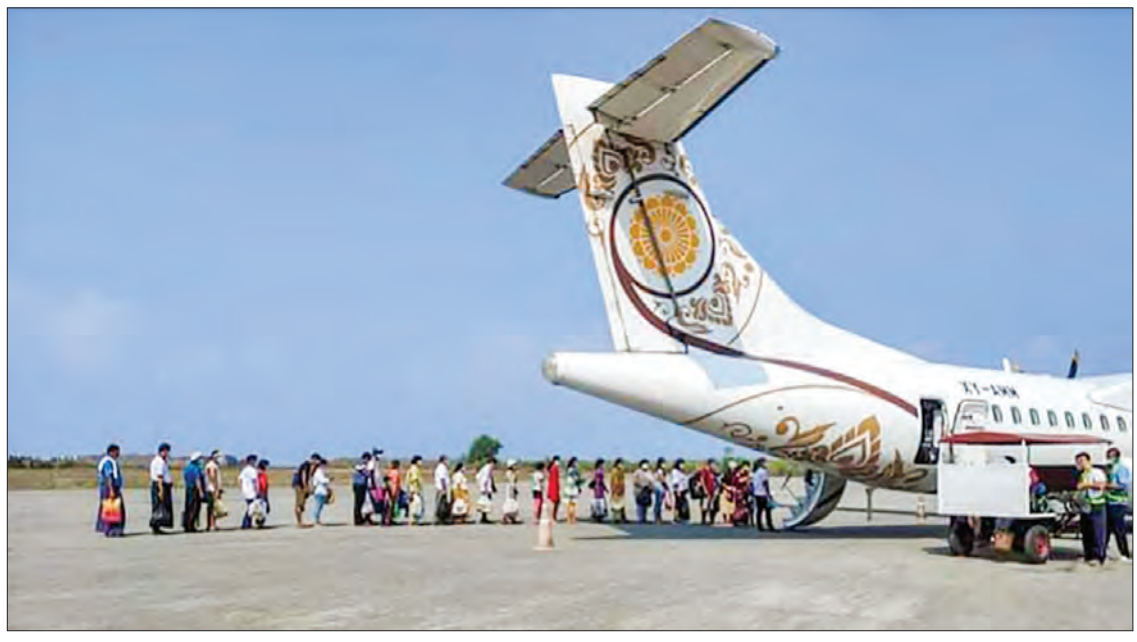
Passengers go on board one of the MNA flights.

Amid the spread of COV-ID-19 Delta Variant in Thailand and India, which border Kawthoung and Kalay respectively, the flights were suspended in June this year. As the Ministry of Health has finally lifted the suspension, flights to Kawthoung and Kalay from Yangon are running at the same rates as before to make it easier for locals to travel, according to