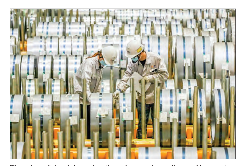
The prices of aluminium, zinc, tin and copper have all surged in recent days.

A key index tracking the prices of industrial metals, including aluminium, copper and zinc, has struck record heights as soaring energy prices reduces their