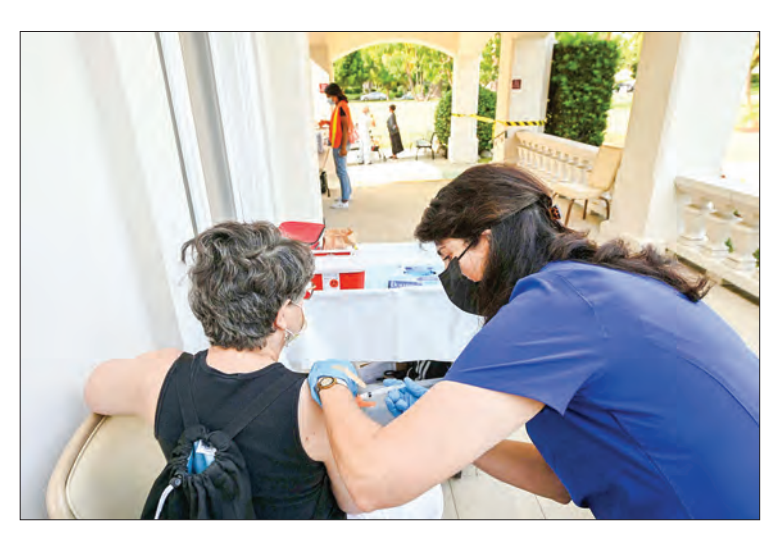
People who received Johnson & Johnson's Covid-19 vaccine may benefit from a booster dose of Pfizer or Moderna, preliminary results of a US study published Wednesday showed.

PEOPLE who received Johnson & Johnson's Covid-19 vaccine may benefit from a booster dose of Pfizer or Moderna, preliminary results of a US study published Wednesday showed.