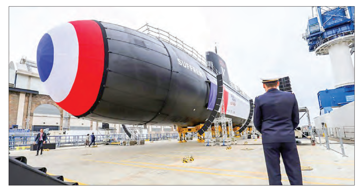
A new nuclear submarine called "Suffren" is seen in the Naval Group shipyard in Cherbourg, northwestern France, ahead of its unveiling ceremony on 12 July 2019.

"That's it, that's over. Let's move forward." France last month recalled its ambassadors, accusing the United States of deceit and Australia of backstabbing, after Canberra scrapped a multi-billion-dollar contract for French conventional submarines.