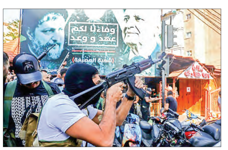
A member of Lebanon's Hezbollah movement fires his gun during the funeral Friday of members who were killed during violence in the Tayouneh neighbourhood of the capital Beirut a day earlier.