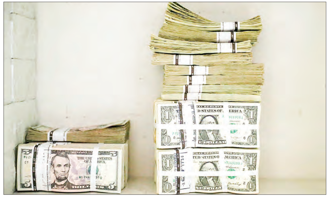
Myanmar imports around 6 million tonnes of fuels yearly, according to the Ministry of Commerce.

THE central bank of Myanmar (CBM) needs to stabilize dollar exchange rate, said U Win Myint, chairman of the Myanmar Petroleum Trade Association (MPTA).