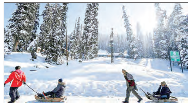
Tourists enjoy in the snow at Gulmarg near Srinagar.