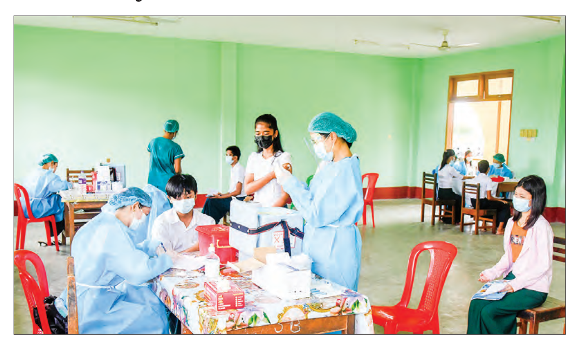
No.20 BEHS, Pobbathiri.

TO provide students with educational opportunities, healthcare officials gave COVID-19 vaccines to students aged 12 and above in Nay Pyi Taw Council area yesterday.