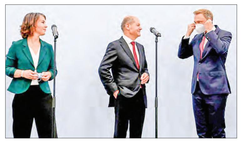
(L-R) Co-leader of Germany's Greens (Die Gruenen) Annalena Baerbock, German finance minister, vice chancellor and the Social Democratic SPD Party's candidate for chancellor Olaf Scholz and leader of Germany's free democratic FDP party Christian Lindner prepare to leave after giving a statement following a session of exploratory talks between leading members of the social democratic SPD party, the Greens and the free democratic FDP party on 15 October 2021 in Berlin.