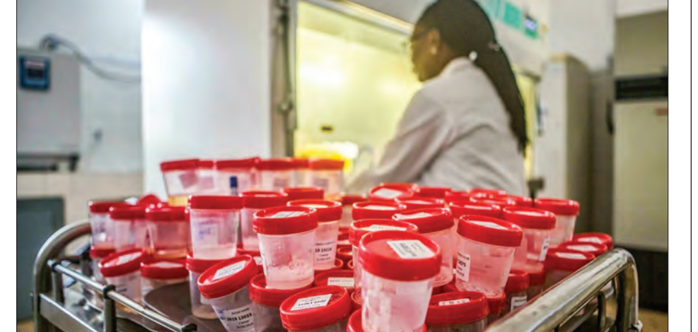
Tuberculosis the world's second top infectious killer.

Most TB cases occur in just 30 countries, many of them poorer nations in Africa and Asia, and more than half of all new cases are in adult men. Women account for 33 percent of cases and chil-