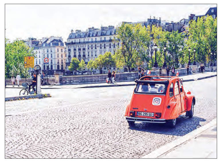
France on Friday stopped offering Covid tests free of charge for everyone, in the government's latest effort to incite holdouts to get vaccinated against the virus.

On Thursday, the health authorities reported just over 5,000 new Covid cases in the previous 24 hours. Also starting Friday, some 2.7 people working in hospitals, clinics and care homes as well as firefighters and ambulance drivers must produce proof