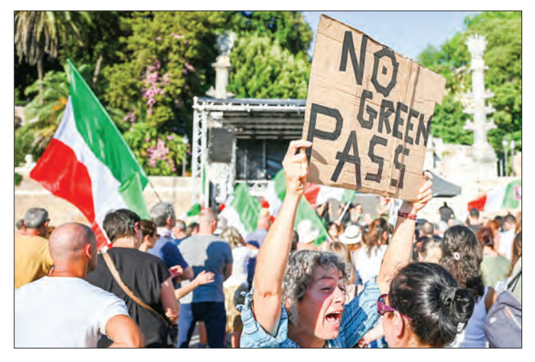
From Friday, all workers must show a so-called Green Pass offering proof of immunity or a negative test. Members of the 'No Vax' movement take part in a demonstration against the introduction of a mandatory green pass at the Piazza del Popolo in central Rome on 7 August 2021.

In Genoa, the small blockade was peaceful early Friday, according to an AFP journalist, although some truck drivers reported delays.—AFP■