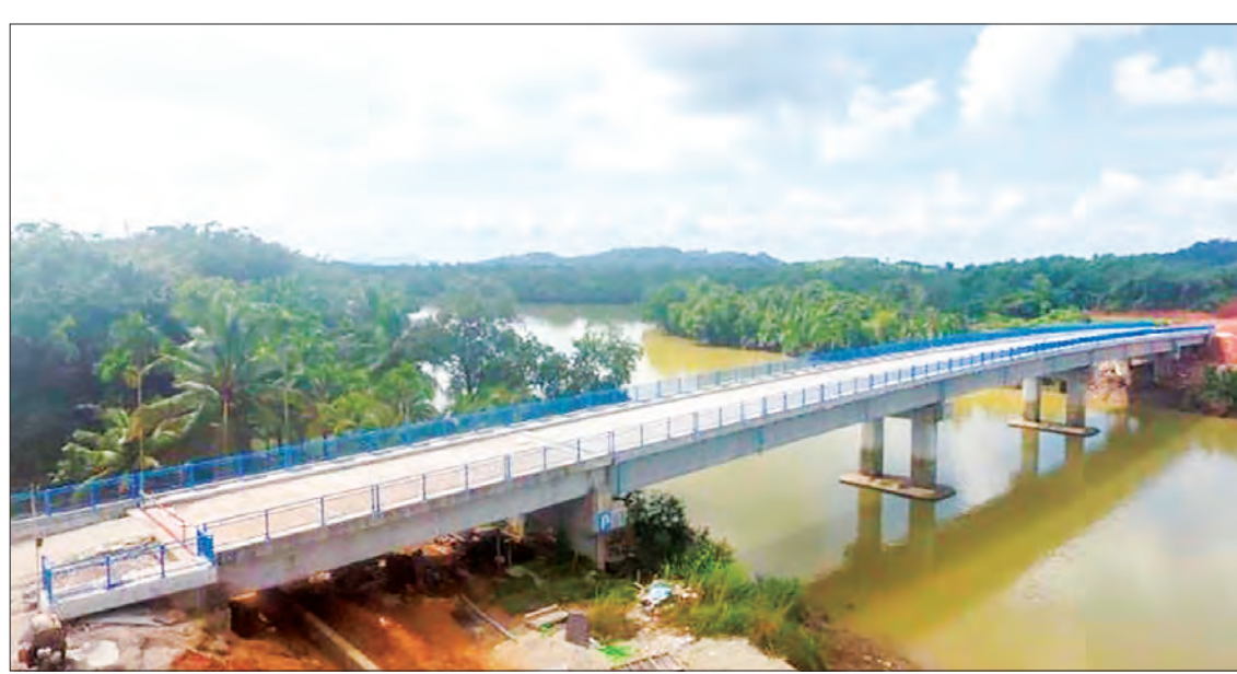
An aerial view of the Yezin Chaung Bridge.

According to the Ministry of Construction, the new Yezin Chaung Bridge is being built to improve access to education, health, social and economic ser-