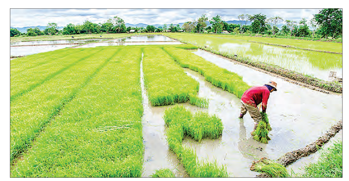
Massive agricultural subsidies, especially those used in rich countries, continue to distort global trade and create unfair competition for farmers in poor countries, WTO chief Ngozi Okonjo-Iweala said Friday.

MASSIVE agricultural subsidies, especially those used in rich countries, continue to distort global trade and create un-