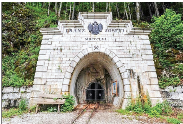
Scientists made the discovery by analyzing samples of human excrement found at the heart of the Hallstatt mine in the Austrian Alps.

HUMANS’ love for cheese and beer goes back a long way. But according to a scientific study published Wednesday, workers