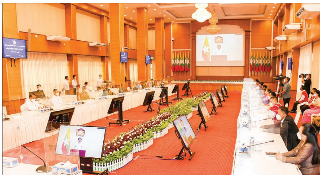
The Sixth Anniversary of signing the NCA in progress.

First, State Administration Council Chairman Prime Minister Chairman of National Unity and Peacemaking Central Committee Senior General Min Aung Hlaing sent a video message to mark the 6 th Anniversa-