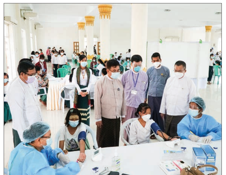
Inoculation drive for students is underway.

After that, the Union Minister inspected the construction of the school stadium inside the high school and ordered necessary matters. — MNA