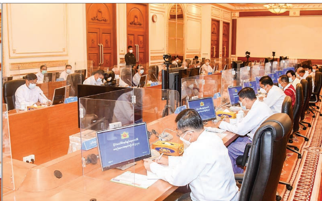
State Administration Council Chairman Prime Minister Senior General Min Aung Hlaing addresses the SAC meeting 16/2021 in Nay Pyi Taw on 15 October 2021.

THE government discussed matters related to standing with the ASEAN Charter and ASEAN pledge, and the discussions are being held to ease tensions as much as possible as the later political performance of solving the problems consists of some interferences, said Chairman of the State Administration Council Prime Minister Senior General