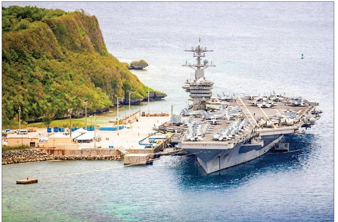
The aircraft carrier USS Theodore Roosevelt moored at Naval Base Guam last May after being forced to port due to a Covid-19 outbreak that infected around one-quarter of the vessel’s 4,800 crew.