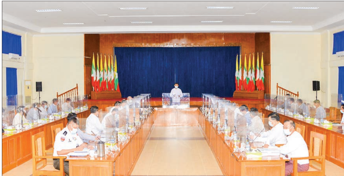
The MoD Union Minister remarks at the meeting yesterday.

Then, Secretary of the Committee Deputy Minister U Zaw Aye Maung clarified the meeting minutes of the previous meeting (13/2021) and ongoing work plans.