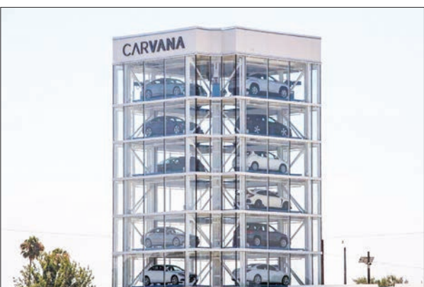
An eight-storey car vending machine in Huntington Beach, California, USA, operated by the online used car dealer Carvana, that dispenses purchased cars to customers. PHOTO: MARK RALSTON / AFP

Online marketplaces for used cars have grown during the COVID pandemic.—AFP ■