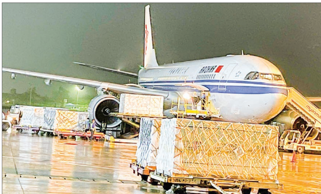
Sinopharm vaccines bought from China arrive in Yangon International Airport yesterday.

Those who have received their first dose of the vaccine are encouraged to visit the nearest immunization centre for the second dose, and the people are urged to actively participate in the vaccination activities. — MNA