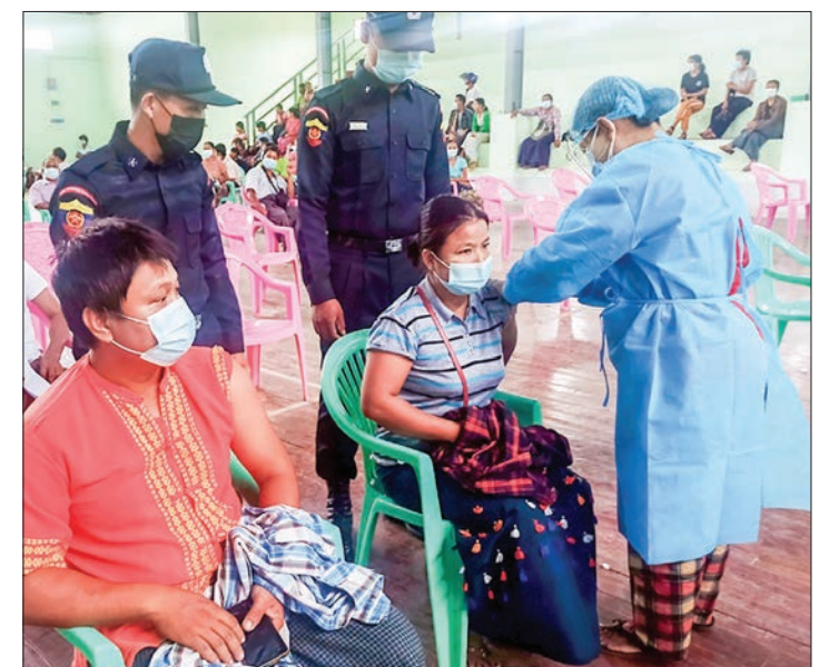
Inoculation campaign in Gangaw in Magway Region.

PEOPLE over the age of 18 in Gangaw Township in Magway Region continued receiving the Sinopharm COVID-19 vaccine yesterday.