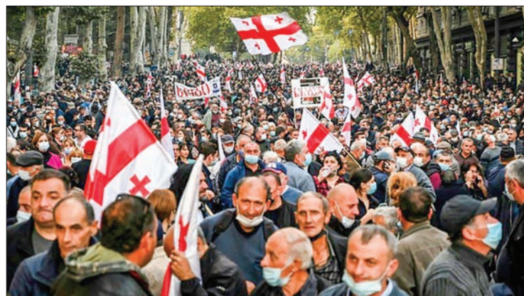
Tens of thousands of Georgians took to the streets of central Tbilisi to demand the release of jailed ex-president and opposition leader Mikheil Saakashvili.

The 53-year-old founder of Georgia's main opposition force, the United National Movement (UNM), has declared a hunger strike and doctors have ex-