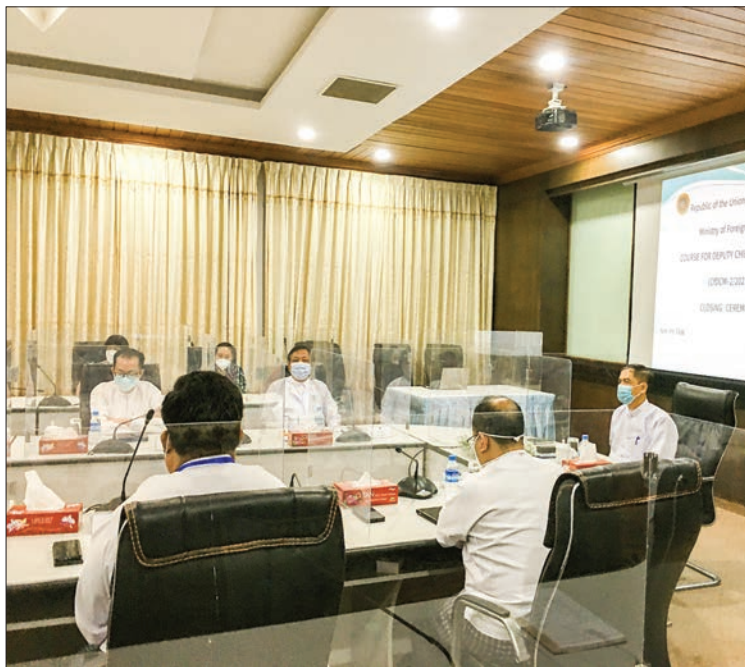
The course winding up ceremony in progress.

CLOSING ceremony of the Training Course for Deputy Chief of Mission (CfDCM) 2/2021 took place at the Ministry of Foreign Affairs in Nay Pyi Taw yesterday at 2 pm. On the occasion, U Ko Ko Hlaing, Union Minister for International Cooperation delivered closing remarks through virtual platform.