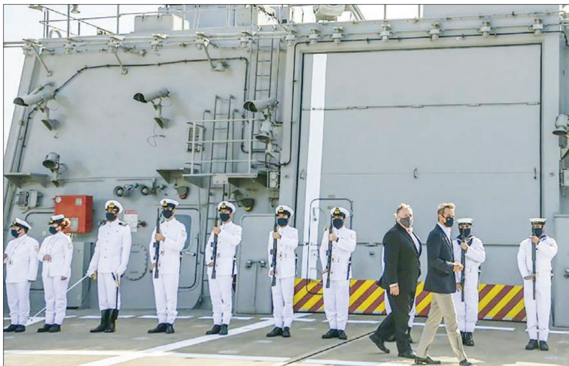
Then US secretary of state Mike Pompeo meets Greek Prime Minister Kyriakos Mitsotakis before a frigate at Souda Bay in Crete, the foremost US naval facility in the eastern Mediterranean, in September 2020.

Greece will also allow a greater US troop presence in sites including Alexandroupolis—a port near the Turkish border—as well as the key US hub of Souda Bay in Crete. Signing the agreement with Secretary of State Antony Blinken, Greek