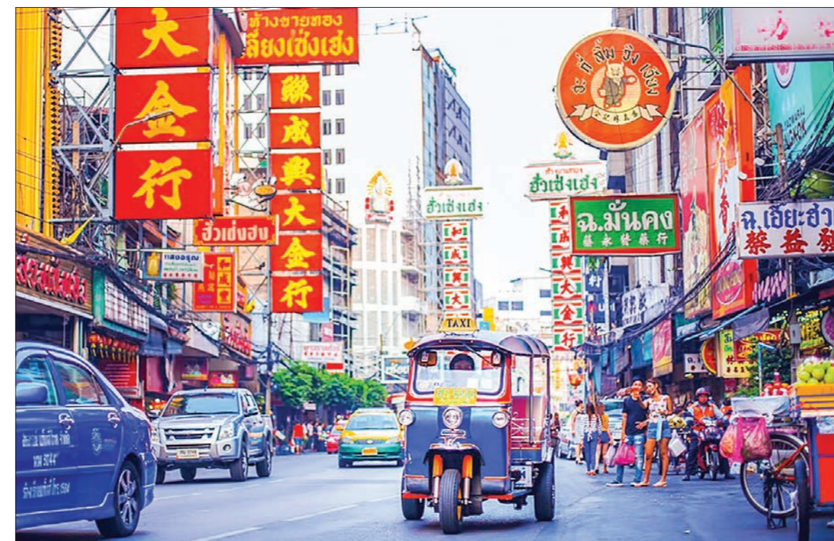
Thailand is preparing to open more of the country to international tourists in November.