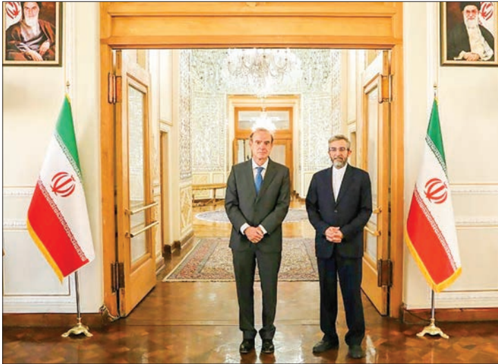
Iranian Deputy Foreign Minister Ali Bagheri meets with European External Action Service deputy secretary general Enrique Mora in Tehran.

THE EU envoy charged with coordinating talks on reviving the Iran nuclear deal, Enrique Mora, met Iranian deputy foreign minister Ali Bagheri in Tehran on Thursday, the Iranian ministry said.