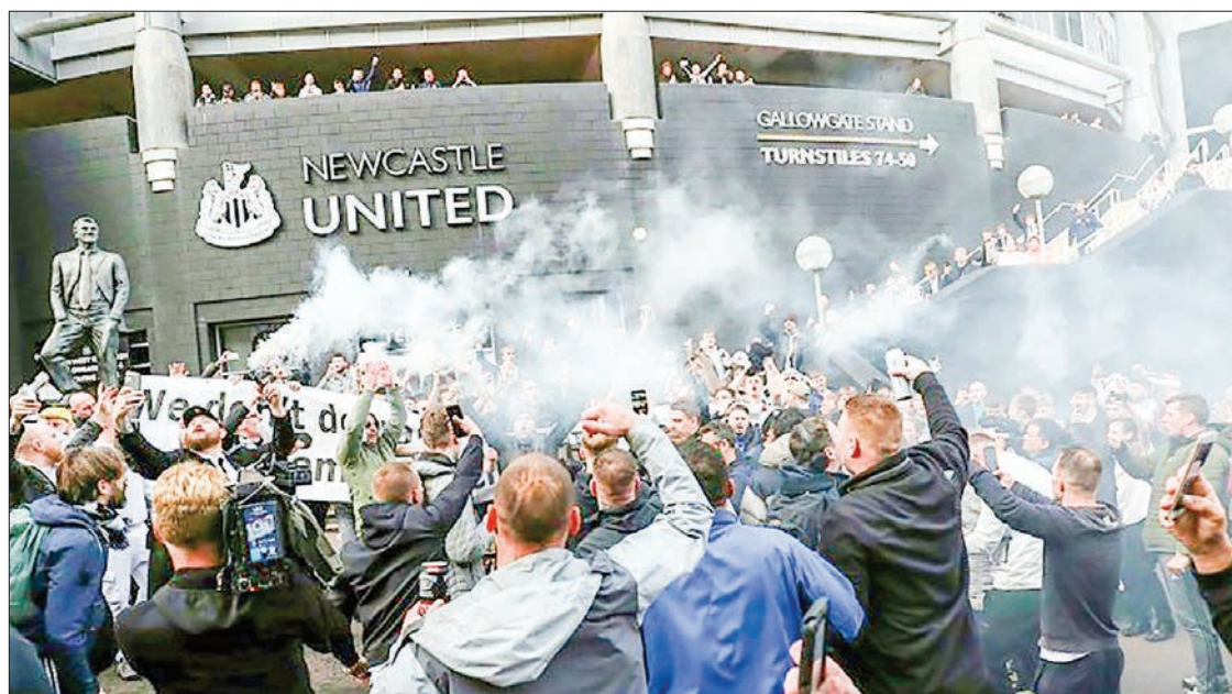
Newcastle fans outside St James' Park after the club's recent takeover.

AFP Sport takes a look at some of the talking points ahead of the weekend action: