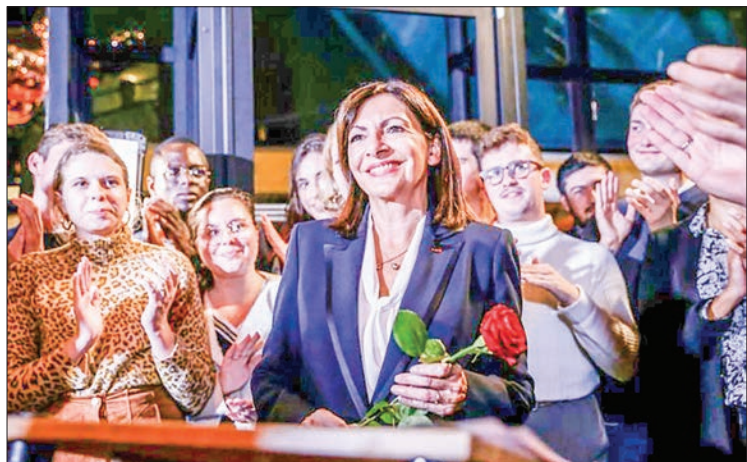
Paris Mayor Anne Hidalgo won more than 72 per cent of votes from Socialist members to become the party's presidential candidate.