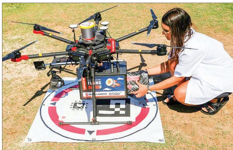
The delivery demonstration was part of a 20 million shekel initiative to advance Israel's drone technology.

"Our goal is to create a competitive market in Israel, not dominated by one company," she said.—AFP ■