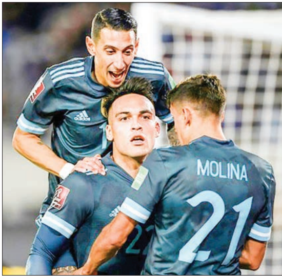
Argentina's Lautaro Martinez (centre) celebrates opening the scoring against Peru in a World Cup qualifier.

ARGENTINA took their unbeaten run to 25 matches and moved a step closer to qualifying for the World Cup with a hard-fought 1-0 win over Peru on Thursday. Lautaro Martinez scored the only goal of the game two minutes before the break with a powerful header while Yoshimar Yotun missed a second half penalty for Peru.