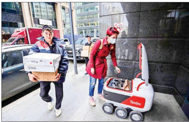
A woman taking a food bag out of a Yandex.Rover, an autonomous delivery robot for small-size cargos developed by Russian internet giant Yandex, in central Moscow.