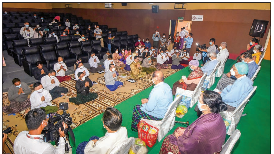
The 44 th event to pay respect to the film artistes aged above 70 is held in Yangon on 13 October 2021.

Then, the Union Minister talked about those who leave