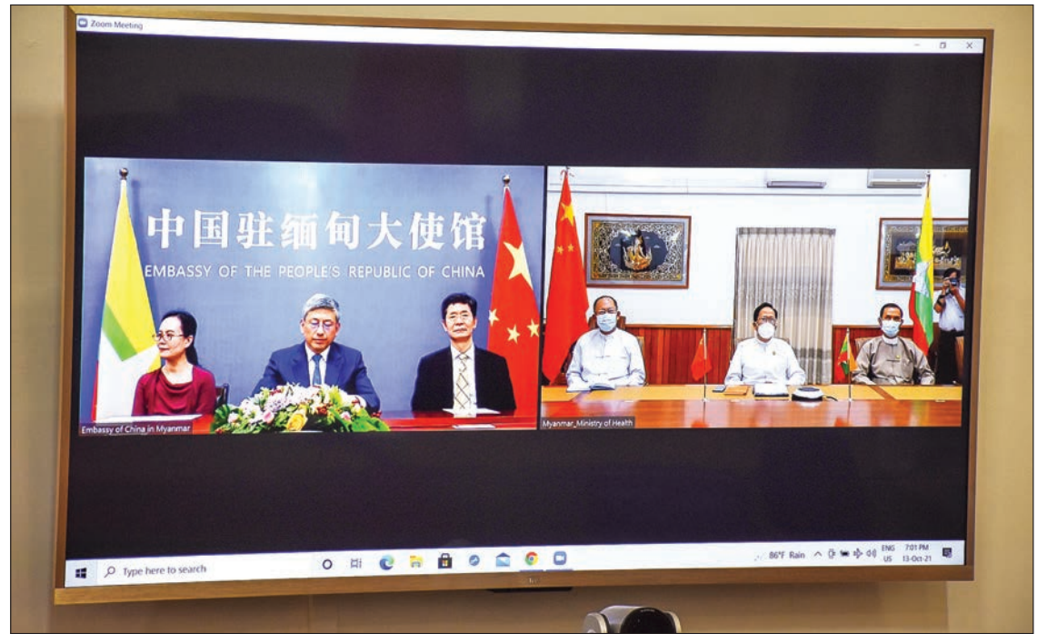
The online handover event in progress.

Then, the Union Minister gave words of thanks expressing the effective use of received vaccines under the guidance of the State Administration Council. The country received 3.5 million Sinopharm doses from China and they are used in line with the National Vaccine Deployment Plan. The