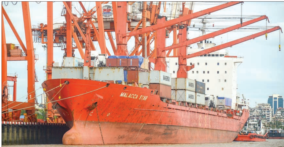
An overseas-going container cargo vessel is seen docking at Yangon Port.

Over the past months, Myanmar's export was worth over $14.93 billion, which plunged from $17.68 billion registered a year-ago period. Meanwhile, the country's import was valued $14.66 billion, showing a