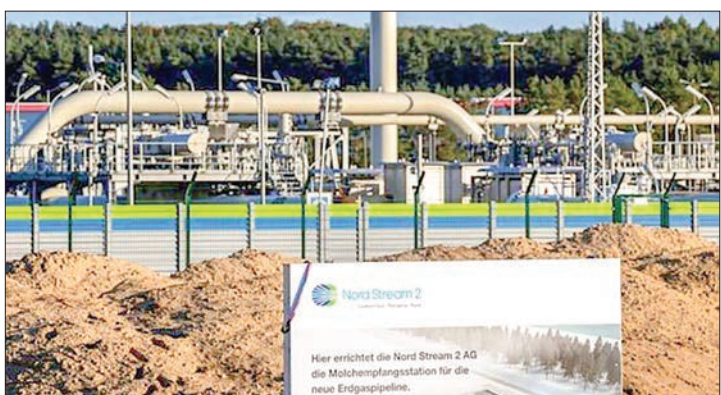
Ukraine's president has spoken out against Nord Stream 2, a Baltic Sea pipeline set to double natural gas supplies from Russia to Germany.

Over the next decade, France would aim to become a global leader in green hydrogen, which companies and governments are increasingly putting at the centre of efforts to de-carbonise economic sectors that rely most on fossil fuels for their energy needs.—AFP ■