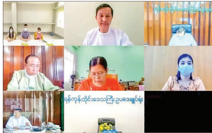
The YRIC greenlights one FDI and two local businesses.

To simplify the verification of investment projects, the Myanmar Investment Law allows the region and state Investment Committees to grant permissions for local and foreign proposals, where the initial invest-