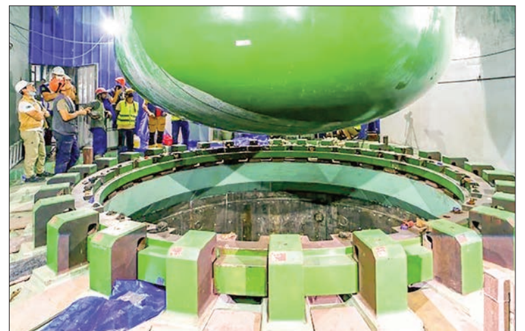
Rooppur 1’s reactor pressure vessel is manoeuvred into position.

Since nuclear power is low-carbon, Hasina continued, “it is therefore environmentally friendly and helps to combat the adverse effects of climate change.—ANI ■