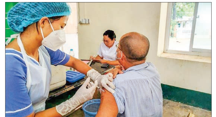
A health staff injects the first dose of vaccine to a local in Hlaingbwe.

In Hlaingbwe Township, a total of 4,905 people were vaccinated at Aung San Hall of Hlaingbwe Township, Shwe Gun Station Hospital, Myaing Gyi Ngu Station Hospital and Paikyon Station Hospital as of 10 October. —Hlaingbwe IPRD/GNLM