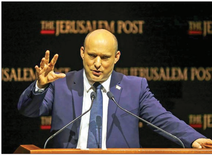
Israeli Prime Minister Naftali Bennett will travel to Russia, a signatory to the Iran nuclear deal.

ISRAEL'S prime minister will fly to Sochi in Russia next week to meet President Vladimir Putin for talks including on Iran's nuclear programme, Naftali Bennett's office said on Tuesday.