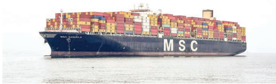
The California ports are a key gateway for goods made in Asia. A Mediterranean Shipping Company cargo ship filled with containers waits offshore for entry to the Port of Los Angeles on 6 October. A record number of cargo ships have been stuck in limbo off the southern California coast waiting for entry.

THE Port of Los Angeles and its longshoreman union will provide 24-hour service to alleviate backlogs that have exacerbated global supply chain problems, senior Biden administration officials said Wednesday.