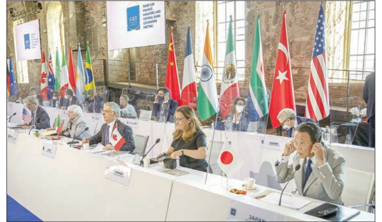
File photo shows a meeting of the Group of 20 finance chiefs in Italy in July 2021.

Momentum for setting new universal taxation rules for businesses operating across borders has been increasing in recent years amid mounting criticism that major US tech companies such as Google LLC and Apple Inc. book profits in low-tax jurisdictions. The governments joining the deal, including all of the G-20 members and several low-tax jurisdictions that had initially resisted, such as Ireland and Hungary, are slated to formulate a multilateral treaty next year, while preparing for