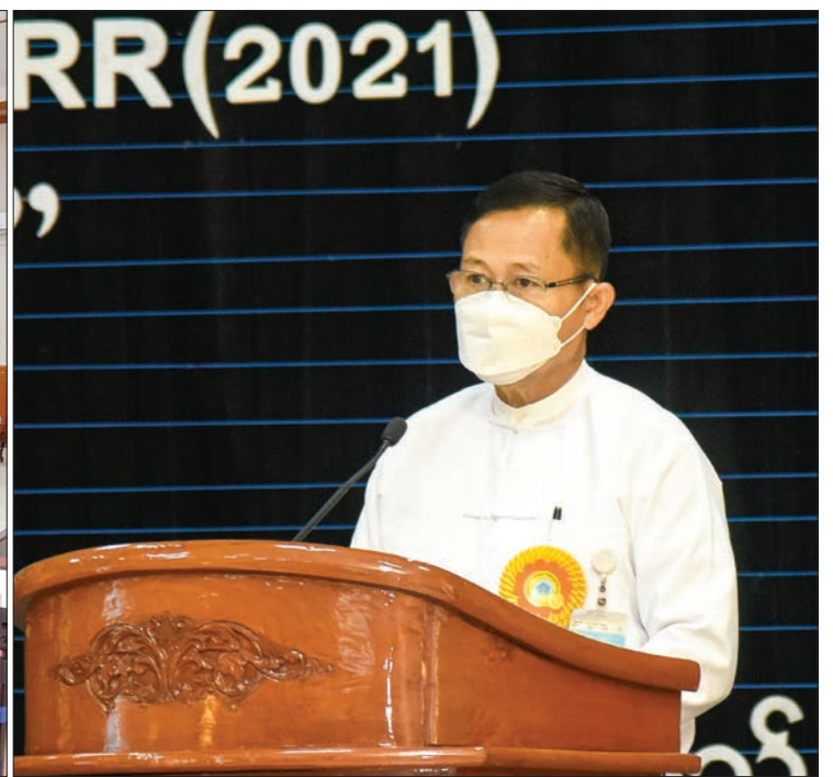
State Administration Council Vice-Chairman Deputy Prime Minister Vice-Senior General Soe Win speaks on the occasion to mark the international day for disaster risk reduction 2021 in Nay Pyi Taw on 13 October 2021.

T HE cyclonic storm Nargis which hit in 2008 was the most destructive natural disaster recorded as the most terrible climate change for the history of natural disasters in Myanmar as well as in the Asian Continent after 1991, said Chairman of the National Disaster Management Committee Vice-Chairman of the State Administration Council Deputy