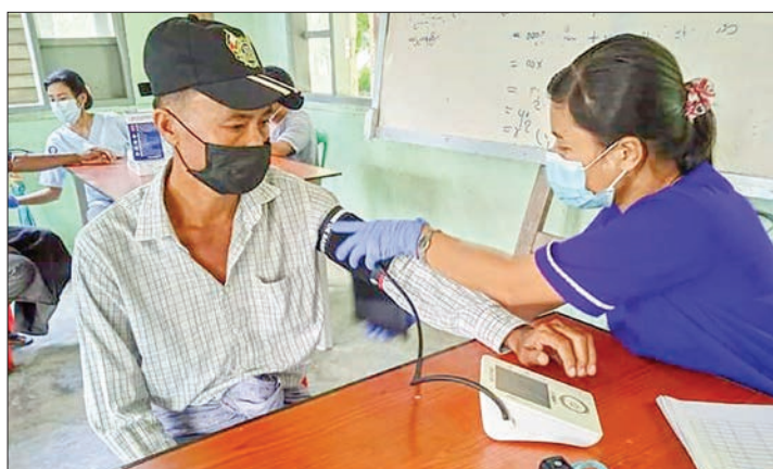
Thegon local gets blood pressure measured before vaccination.

people in Thegon Township, Pyay District, Bago Region yesterday. Officials measured