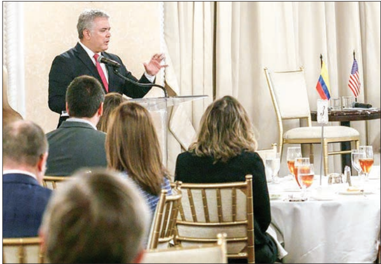
Colombian President Ivan Duque delivers a speech at the Chamber of Commerce in Washington on 11 October 2021, during a three-day official visit to the United States.

COLOMBIAN President Ivan Duque said Tuesday that his government is aware of cases of so-called "Havana Syndrome" at the US Embassy in Bogota, but is leaving the investigation to