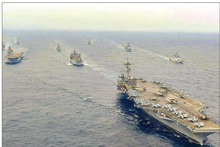
Supplied photo shows the Malabar joint exercise by the naval forces of the United States, Japan, Australia and India in the Bay of Bengal on 12 October 2021.

THE naval forces of the United States, Japan, Australia and India have started a joint exercise, Pentagon press secretary John Kirby said Tuesday, in the face of China's maritime assertiveness in the region. The four nations, known as the "Quad," will hold the Malabar exercise until Thursday in the Bay of Bengal in the northeastern Indian Ocean, according to Japan Maritime Self-Defence Force.