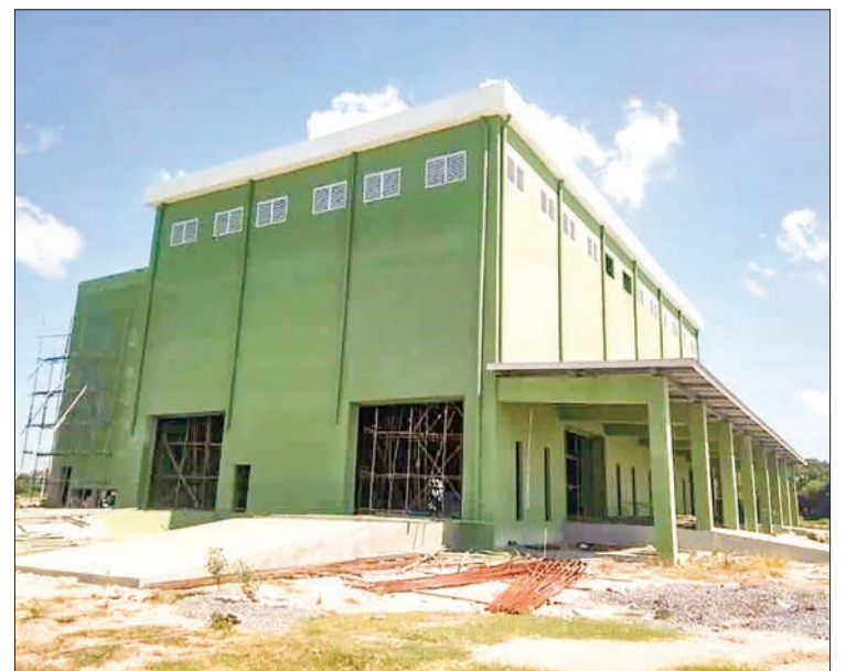
The Shwebo seed processing plant seen complete and ready to operate in December.

The Seed Project was implemented in Shwebo, Wetlet, KhinU, Dabayin and Taze townships of Sagaing Region with JICA loans. The Agriculture Department, farmers, seed production organizations and other related companies are also working together to provide quality rice seeds to the farmers.