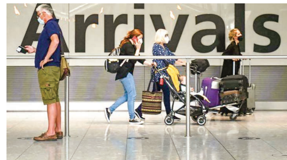
The report said the government mistakenly implemented 'light-touch border controls' only on countries with high Covid rates. Travelers walk through Heathrow airport in London, on 3 June 2021.