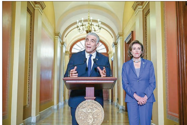
Israeli Foreign Minister Yair Lapid gives remarks after being welcomed by House Speaker Nancy Pelosi.

Former president Donald Trump considered the so-called Abraham Accords to be a crowning achievement for his administration as the United Arab Emirates, followed shortly afterward by Bahrain and Morocco, became the first Arab states to normalize relations with Israel in decades.