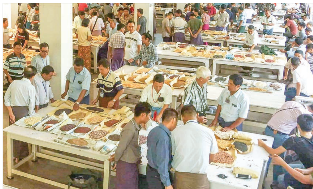
Besides, the other pulses such as pigeon pea, green gram, corn kernel have also declined by K10,000 per bag, according to the Mandalay pulses traders (in picture).

The black bean plantations are yielding around 400,000 tonnes annually in Myanmar. Moreover, Myanmar also produces about 50,000 tonnes of pigeon pea yearly. —ACM/GNLM