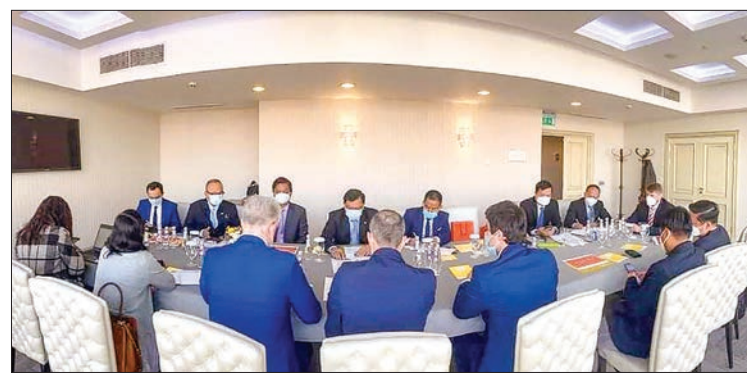
Myanmar and Russian delegations hold talks on electricity and power.

He also met the officials of LLC (DOLSPECEXPORT) to discuss investment and technology development in the power and energy sectors. — MNA