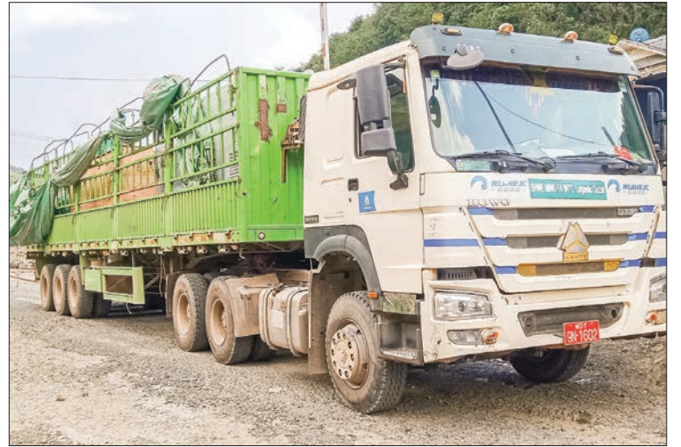
Anti-Covid medical supplies are daily imported and transported by lorries (in picture) to states/regions.

It is reported that the Ministry of Commerce is coordinating with relevant departments, treatment of COVID-19, as well as contact persons for inquiries can be reached through the Ministry's Website — www.commerce.gov.mm . — MNA