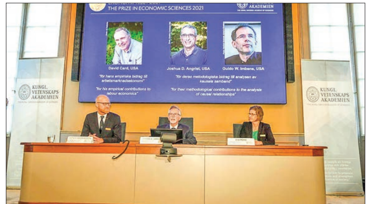
Royal Swedish Academy of Sciences and Nobel Economics Prize committee members announcing the winners of the 2021 Sveriges Riksbank Prize in Economic Sciences in Stockholm, on 11 October 2021.

Card won half of the 10-million-kronor ($1.1 million, one million euro) prize for work focused on the labour market effects of minimum wages, immigration and education.