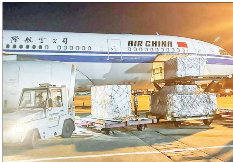
One million doses of Sinovac vaccines donated by China arrive at Yangon International Airport on 13 October 2021.

two countries are working hard in carrying out the COVID-19 prevention, control and treatment activities. Among these vaccines, 1 million Sinopharm vaccines are used for those living in the border area.