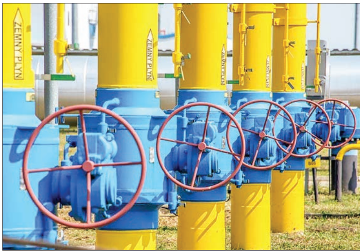
Energy prices have taken off this year as economies bounce back from the effects of the Covid pandemic.

THE EU on Wednesday will present a “toolbox” of measures to mitigate an energy crunch that threatens to send Europeans’ power bills soaring.