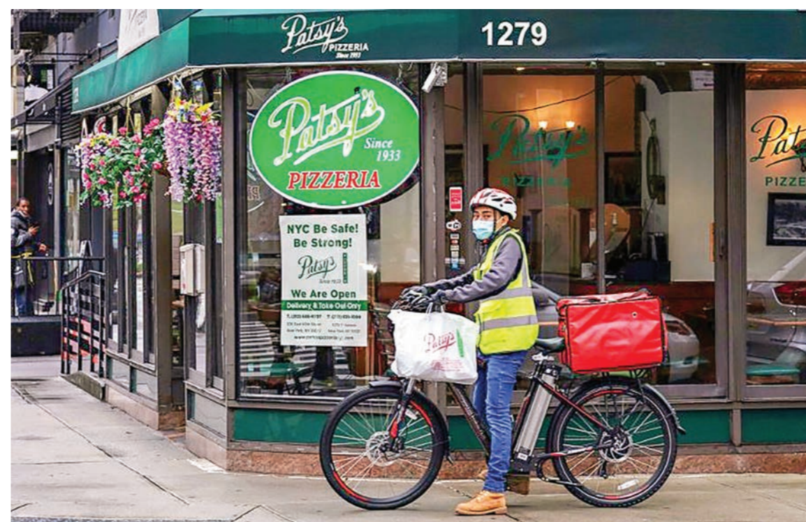
"At the end of the day, they take it all," says one restaurant owner about delivery services' commission fees.

"The only way to get this resolved is going to be by the technology platforms, using the same