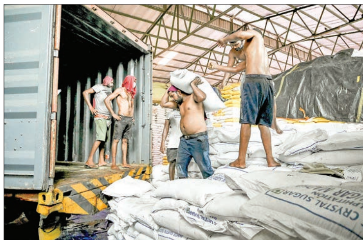
Workers load sugar into a container truck at a private warehouse after Sri Lankan officials seized the stocks as part of a crackdown on hoarding in Wattala, outside Colombo on 1 September 2021, a day after Sri Lanka declared a state of emergency over food shortages as private banks ran out of foreign exchange to finance imports.

Foreign reserves were $7.5 billion when Rajapaksa took office