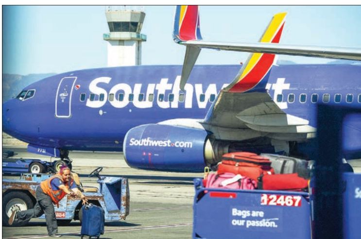
A baggage handler pushes a bag near a Southwest Airlines airplane at Hollywood Burbank Airport in Burbank, California, 10 October 2021.

SOUTHWEST Airlines cancelled more than 1,000 flights Sunday, part of a major weekend service disruption that the carrier attributed to weather and air traffic control issues.