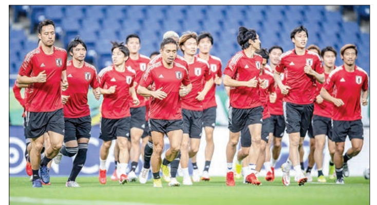
Japan's players attend a training session at Saitama Stadium in Saitama on 11 October 2021, ahead of their FIFA World Cup Qatar 2022 Asian qualification football match against Australia.

He performed impressively in the Nations League Final Four in Italy, pulling a goal back with France two down in their 3-2 win over Belgium on Thursday and levelling the scores on Sunday night with a sumptuous curling shot just after Mikel Oyarzabal had put Spain ahead. "From a personal perspective he's no longer the same person," he's matured. — AFP ■