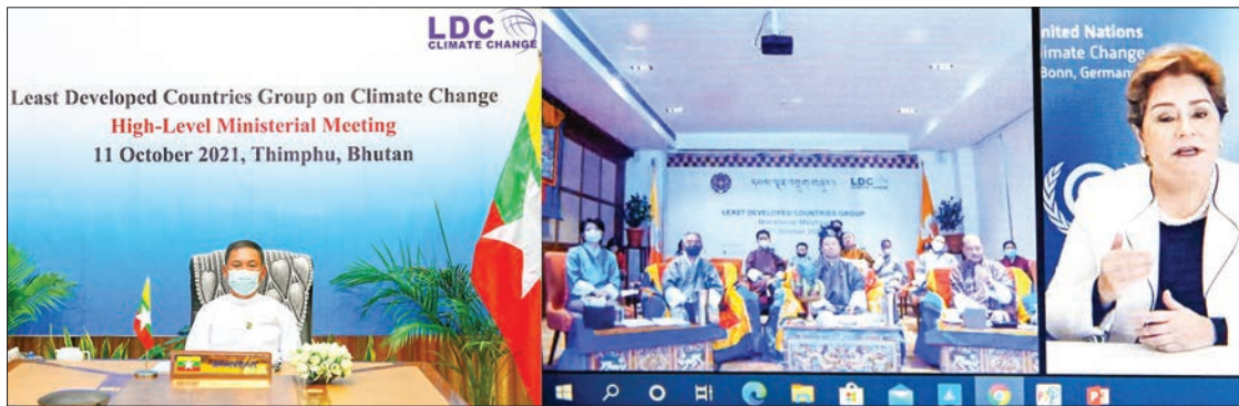
The online LDC Ministerial Meeting in progress.

Foreign Affairs Minister of Bhutan Dr Tandi Dorji and other leaders respectively made opening speeches. Then, the ministers of LDCs discussed the objectives and priorities to be highlighted at the November 26 th Conference of the Parties (COP-26).