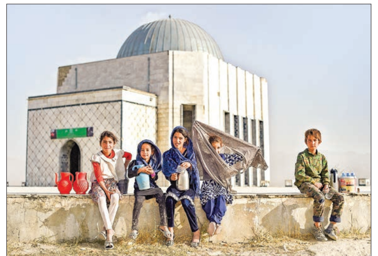
Afghan children selling tea and water wait for customers at Nadir Khan hilltop in Kabul on 10 October 2021.

many foreigners have left Afghanistan, but some journalists and aid workers remain in the capital. The well-known Serena, a luxury hotel popular with business travellers and foreign guests, has twice been the target of attacks by the Taliban. In 2014, just weeks before the presidential election, four teenage gunmen with pistols hidden in their socks managed to penetrate several layers of security, killing nine people, including an AFP journalist and members of his family. — AFP ■