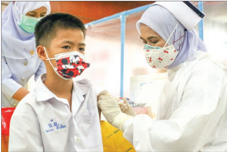
A medical worker administers a dose of the Pfizer vaccine against the Covid-19 coronavirus to a school student at a vaccination centre in southern Thailand's Pattani province on 7 October 2021.

VACCINATION is highly effective at preventing severe cases of Covid-19, even against the Delta variant, a vast study in France has shown.