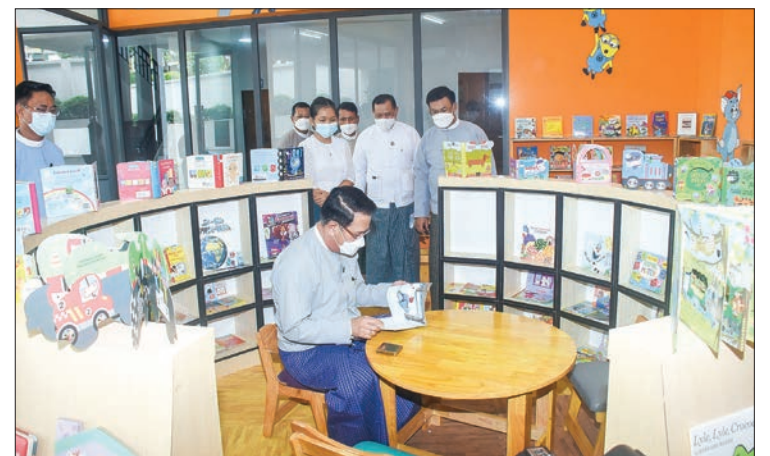
At the children library. The Union Minister views around the mini-museum at the Bahan Community Centre. (Top Photo)