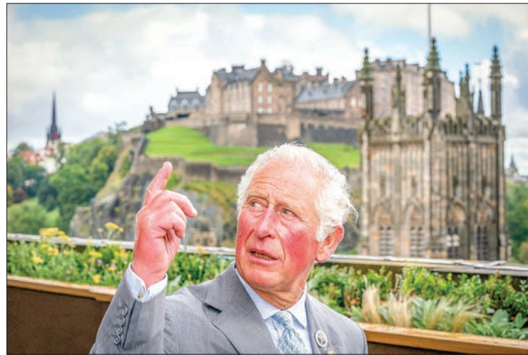
Britain’s Prince Charles, Prince of Wales, known as the Duke of Rothesay when in Scotland, reacts during his visit to Johnnie Walker Princes Street in Edinburgh on 1 October 2021, where he to officially opened the new global visitor whisky experience.

“All these young people feel nothing is ever happening so of course they’re going to get frustrated,” he added, stressing: