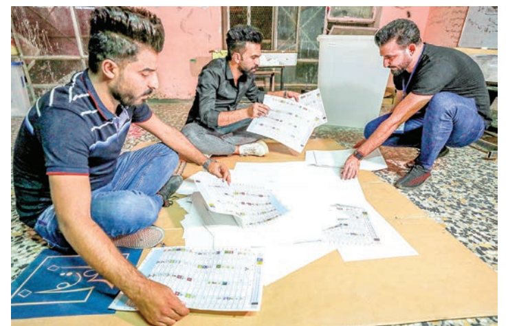
Iraqi election officials conduct a manual count of votes on a ballot box picked at random, as part of the verification process for the electronic count, at a polling station in the capital Baghdad during the early parliamentary elections on 10 October 2021.

“This is a clear political signal, and one can only hope that it will be heard by the politicians and by the political elite of Iraq,” she said. — AFP ■