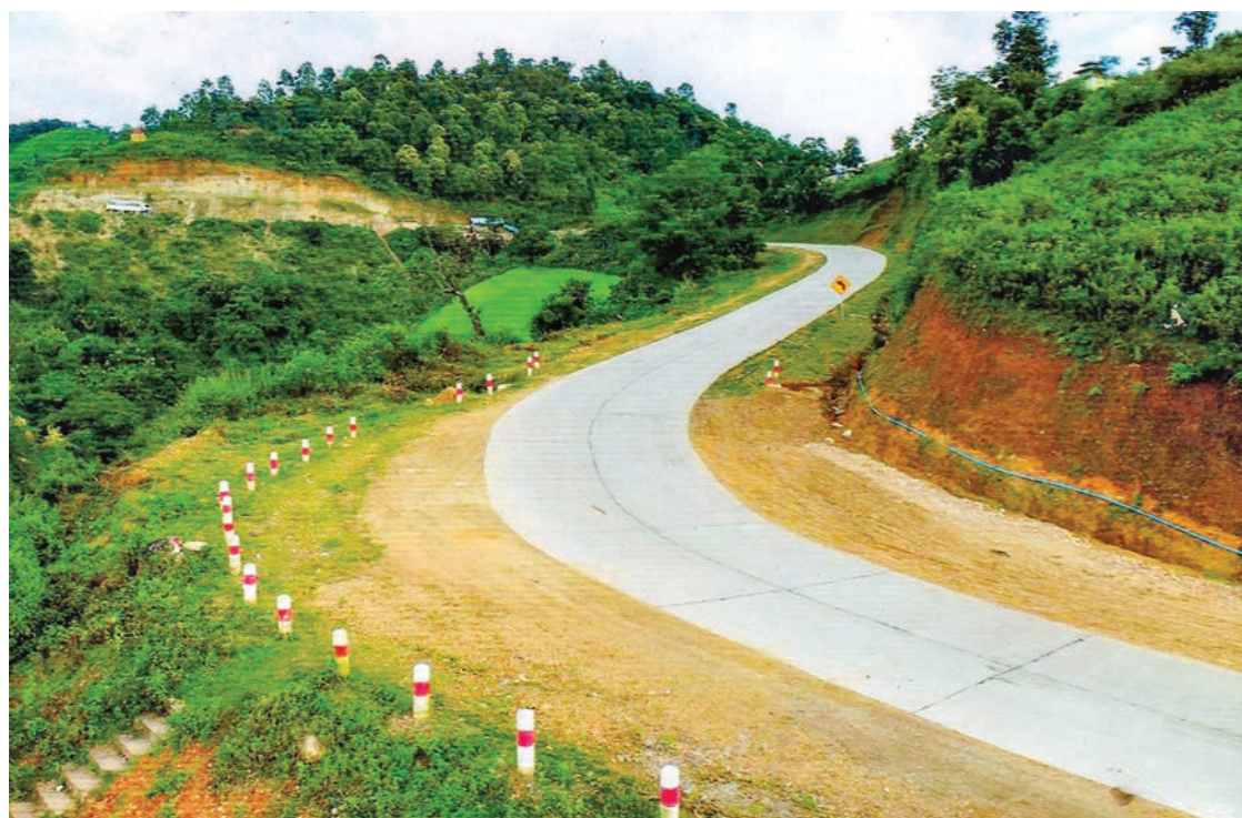
An aerial view of the Meiktila-Taunggyi-Kengtung-Tachilek road section.

In the 2020-2021FY, Road Special Task Force (3) and Kengtung District Highway Department implemented 8 types of work plans, including AC paving programmes for 1/1.2 miles (18 feet), paving of tar road for 2/5.2 miles and expansion of mountain road spaces for 4/6.3 miles using K4.5 billion, and the operations are almost complete.