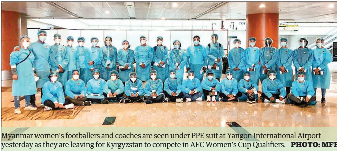
Myanmar women's footballers and coaches are seen under PPE suit at Yangon International Airport yesterday as they are leaving for Kyrgyzstan to compete in AFC Women's Cup Qualifiers.