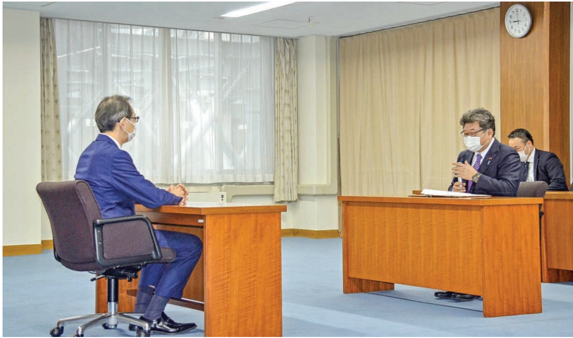
Industry minister Koichi Hagiuda (R) and Fukushima Gov. Masao Uchibori hold talks at the Fukushima prefectural government office on 10 October 2021.