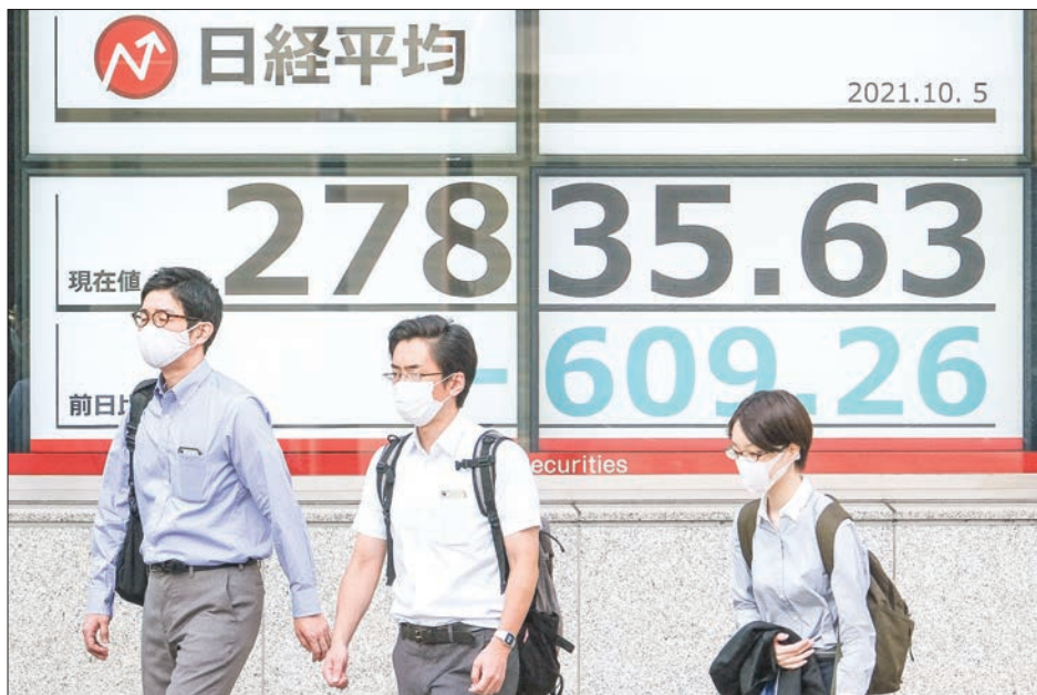
Pedestrians walk past an electronic quotation board displaying share prices of the Tokyo Stock Exchange in Tokyo on 5 October 2021.

MOST Asian markets rose on Monday to extend last week’s rally after US lawmakers averted a painful debt default, but another jump in oil prices added to inflation concerns as the Federal Reserve prepares to taper its ultra-loose monetary policy.