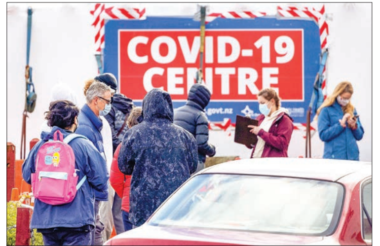
People visit a Covid-19 testing station during a nationwide lockdown in Wellington on 18 August 2021.

Ardern said the highly transmissible Delta variant had proved a "game-changer" that could not be eliminated. — AFP ■