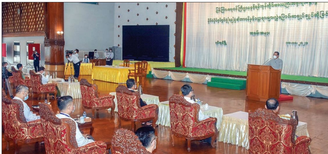
The Union Minister addresses the signing event to hand over 13 State-owned cinemas to the Yangon regional government.

The Union Minister also urged the attendees to focus on youth development activities and youth-centred programmes in the community-based centres and provided gifts and cash assistance. — MNA