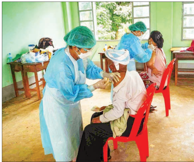
Locals receive Covid jabs in Hsihseng Township, Shan State (North).

A total of 15,430 local people from Hsihseng Township, Parlaw Parkae Village, Sightkaung Village, Banyin Village, Tabat Village, Taung Shae Village, Naung Kyawt Village, Naung Mon Village and Lweput Village received the COVID-19 vaccines.