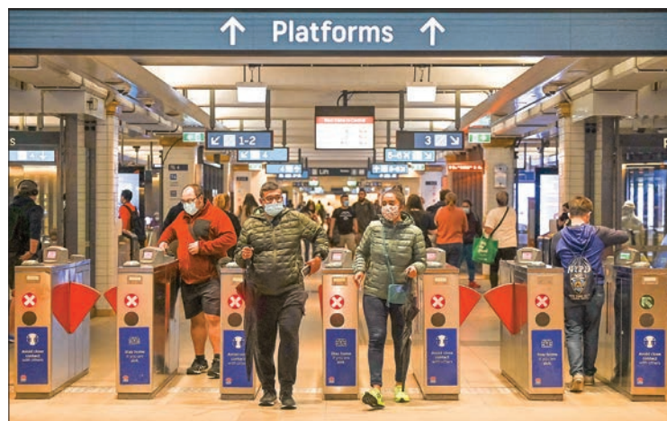
Commuters walk through a turnstile at Town Hall train station on 11 October 2021, as Sydney ended their lockdown against the Covid-19 coronavirus after 106 days.

From midnight pubs, restaurants and cafes began throwing open their doors to anyone who could prove they were vaccinated. They included 32-year-old