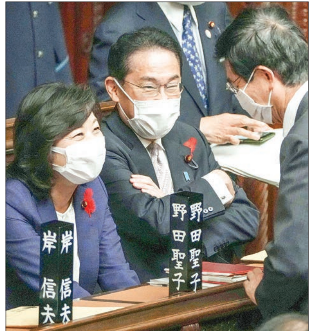
Japanese Prime Minister Fumio Kishida (2 nd from L) and Seiko Noda (L), the minister in charge of gender equality and children’s policies, are pictured before a parliament session to listen to questions from party leaders in Tokyo on 11 October 2021.

Edano also criticized the government’s coronavirus response, ascribing the slew of deaths of COVID-19 patients forced to recuperate at home due to a shortage of hospital beds in the fifth wave of infections this summer to “the failure of the government of the Liberal Democratic Party,” now led by Kishida. — Kyodo News ■