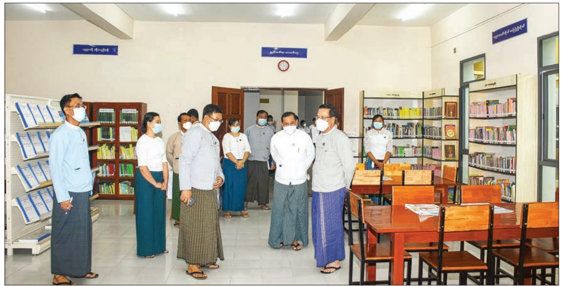
Union Information Minister U Maung Maung Ohn looks around the library at the Bahan Community Centre yesterday.

He said artistes are resuming filming under the COVID-19 rules and regulations, and the