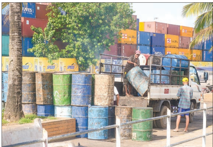
The domestic consumption of edible oil is estimated at one million tonnes per year. The local cooking oil production is just about 400,000 tonnes. To meet the self-sufficiency in the domestic market, about 700,000 tonnes of cooking oil are yearly imported.

The domestic consumption of edible oil is estimated at one million tonnes per year. The local cooking oil production is just about 400,000 tonnes. To meet the self-sufficiency in the domestic market, about 700,000 tonnes of cooking oil are yearly imported. — NN/GNLM