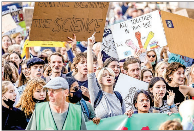
Protesters take part in a demonstration against climate change in Brussels, on 10 October 2021, ahead of the COP26 climate summit. The COP26 climate summit is held from 31 October to 12 November 2021.

“There are three major outcomes I hope to see. The first one is: when we look at the countries today, who made commitments for net zero (emissions) by 2050, even if those commitments were to be fulfilled, we are far from