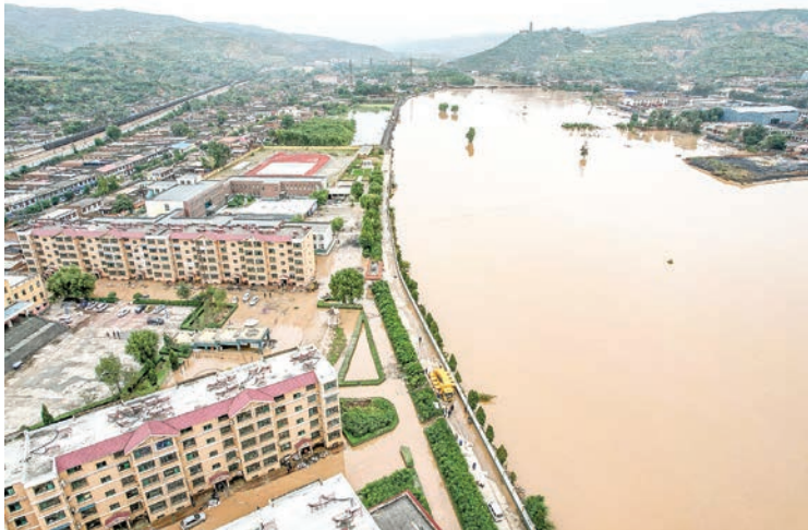
This aerial photo taken on 10 October 2021 shows a flooded area after heavy rainfalls in Jiexiu, in Jinzhong city, China's northern Shanxi province.

MORE than 120,000 people have been evacuated, coal mines shut and crops destroyed after unseasonably heavy rainfall flooded