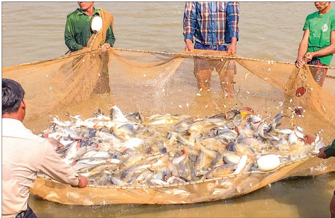
To meet international market standards, fishery products must be sourced only from hatcheries that are compliant with GAQP. The MFF is working with fish farmers, processors, and the Fisheries Department under the Ministry of Agriculture, Livestock, and Irrigation to develop the GAQP system.

"If the border posts resume the trade activity, the trade will go smoothly. The closure of the border posts is triggered by the COVID-19 threats. The cross-border between Myanmar and Bangladesh is still open for trade. The federation is planning to export fishery products to Bangladesh.