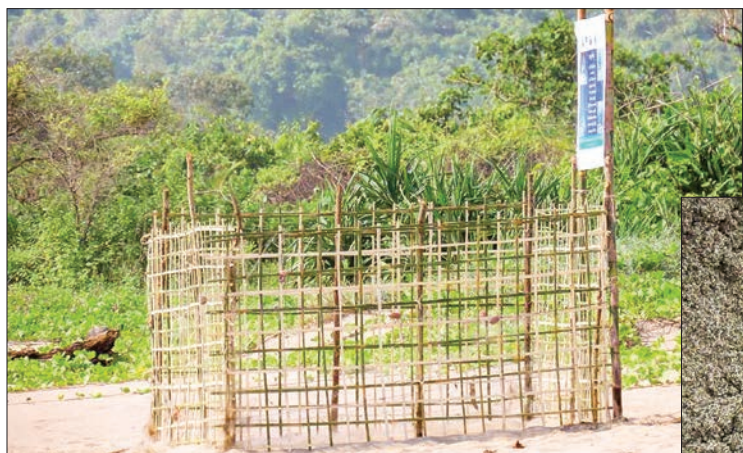
Signboards were erected and the eggs laid by sea turtles were fenced. Local people were provided with information on how to protect sea turtles from extinction.

more than 100 eggs at a time, and it takes about three hours for her to return to the sea from the shore after laying eggs. During the egg-laying season, the turtle eggs in these three zones are being monitored at dusk and dawn by fishermen in collaboration with the Kisca to prevent them from being consumed by local people. Although five species of turtles can be seen in the Rakhine coastal areas, only one species locally called 'baby' turtles are usually seen. Only with the cooperation of the local people, sea turtles can be protected from extinction, said Ko Thagyi, a member of the turtle conservation group. — Yan Nyein/GNLM