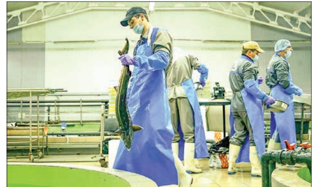
The white caviar is packaged in containers made of pure gold to match the roe's colour. PHOTO: AFP

15 years after a brief civil war that saw Transnistria break away from Moldova in the wake of the Soviet Union's collapse — stumbled on some 20 of the albinos when purchasing their first stocks. "They had just arrived into the world and we immediately brought them here," Grimakovskaya recalls.—AFP ■