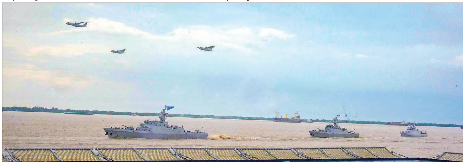
Pictures show the Senior General on board the Naval Vessel "Mottama" takes the salute of the Guard of Honour along with a single line formation of naval vessels led by Aung Zeya Frigate.