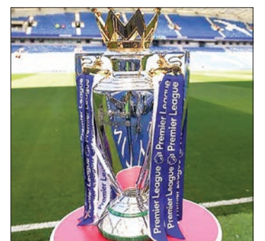
The Premier League trophy.

“It’s low, not just in the Premier League but in the Football League as well. It’s very low,” said former Manchester United