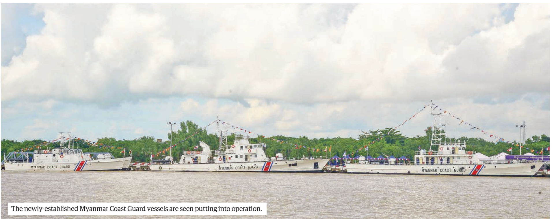
The newly-established Myanmar Coast Guard vessels are seen putting into operation.

The ceremony was also attended by media personnel from local news agencies, daily newspapers, local TV channels and local-based foreign news agencies. —MNA