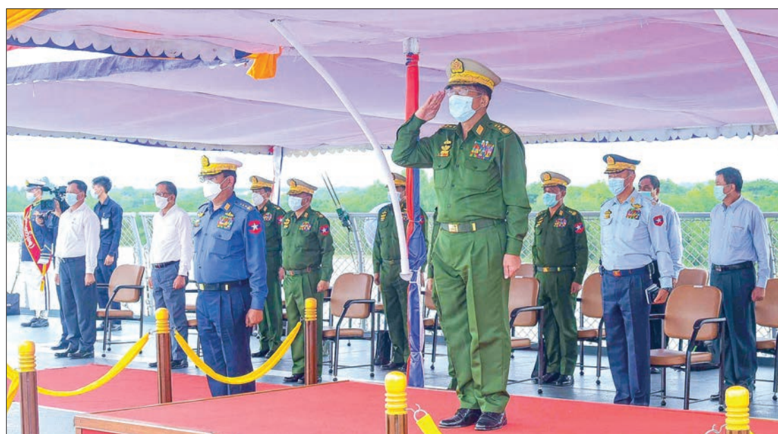
State Administration Council Chairman Commander-in-Chief of Defence Services Senior General Min Aung Hlaing attends the ceremony to establish the Myanmar Coast Guard and commission its vessels into services at No 3 Naval Jetty in Yangon on 6 October 2021.