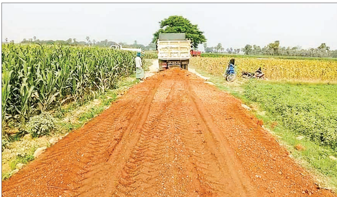
One of the rural road development sites in Mandalay Region.

IN the six months of the 2021-2022 financial year, a total of 13 rural roads will be developed in 13 townships in Mandalay Region at the cost of over K800 million, according to the Mandalay Region Rural Development Department.