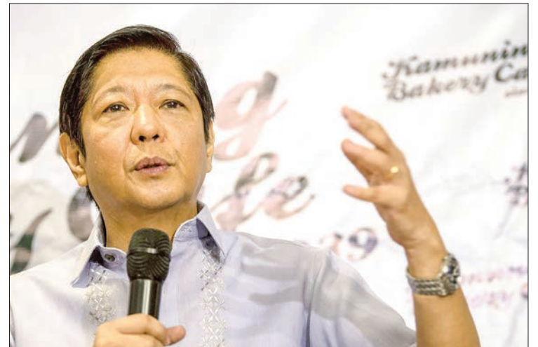
The son and namesake of the Philippines' former dictator Ferdinand Marcos has said he will run for president in the 2022 election.

A tilt for the country's highest office comes after Marcos Jr's failed bid for the vice presidency in 2016, which he narrowly lost to Leni Robredo. Losing the election was a blow for the