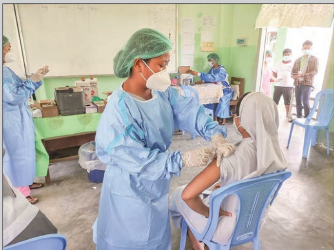
Inoculation for above 18-year-olds in progress.

The second batch of the vaccine will be given starting from 14 October, officials said. —Myitkyina District IPRD/GNLM