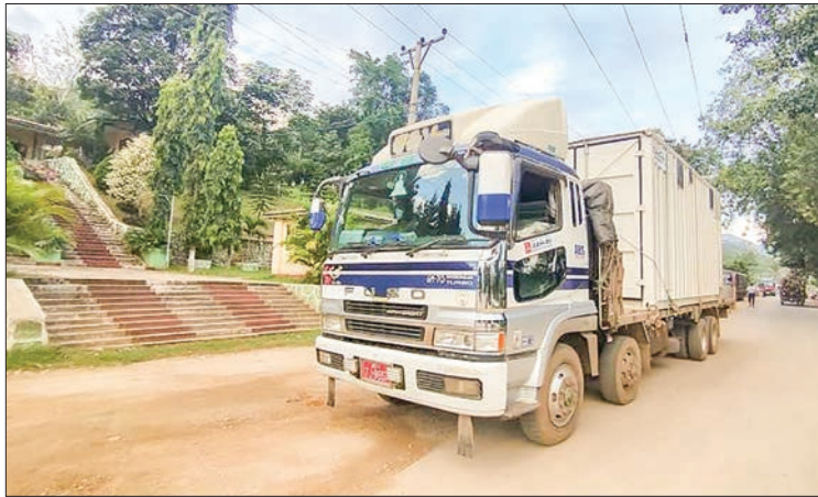
A lorry is seen transporting anti-Covid equipment to the needed area.

THE Ministry of Commerce is making efforts to ensure people have access to the essential medical supplies that are critical to the COVID-19 prevention, control and treatment activities, including liquid oxygen and oxygen cylinders, by arranging continuous importation through trading posts, international airport and seaports with Standard Operating Procedures (SOPs).