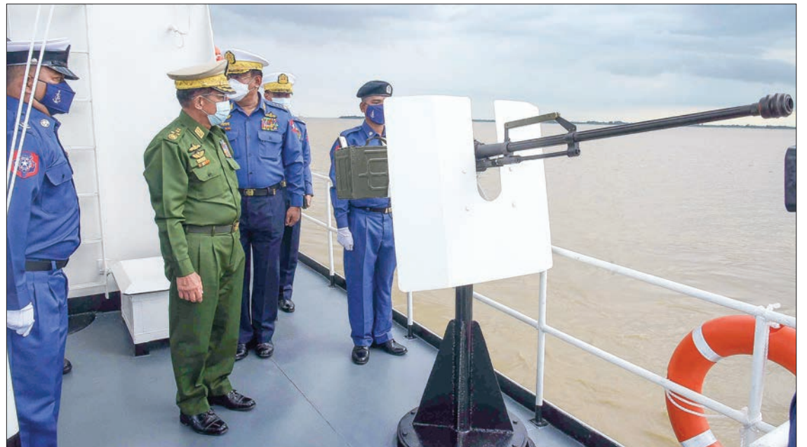
The Senior General attends the event to establish and put into operation the Coast Guard of Myanmar yesterday.

The Tatmadaw (Navy) has rescued more than 4,000 persons from the sea from 2000 to 2021 and brought back more than 1,150 Myanmar citizens from Malaysia and India by war vessel. The coast guard needs to cooperate with the Tatmadaw (Navy) in doing so. The government formed the coast guard in line with the international rules and regulations for ensuring the peace and stability of the State and improvement of the economy, and development of the socio-economic status of the entire people. The theme of the guard