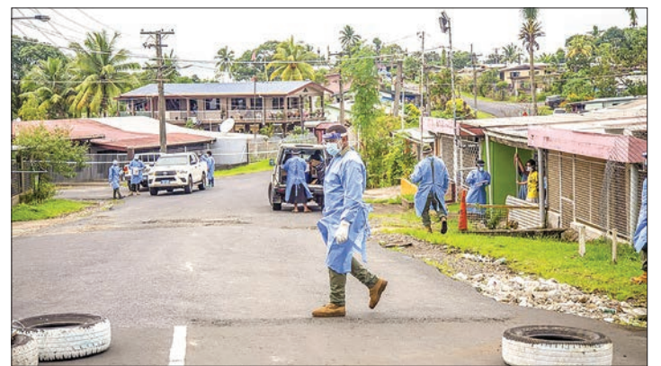
Health workers conduct investigation to trace chains of infection to curb the spread of COVID-19 in Suva, Fiji, 26 May 2021.