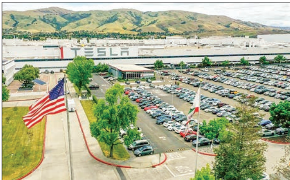
A US jury awarded a former Tesla employee $137 million over workplace racism at the electric car maker's Fremont plant.

In his lawsuit filed in 2017, Diaz said African-American employees at the factory, where his son also worked, were regularly subjected to racist epithets and derogatory imagery.—AFP ■