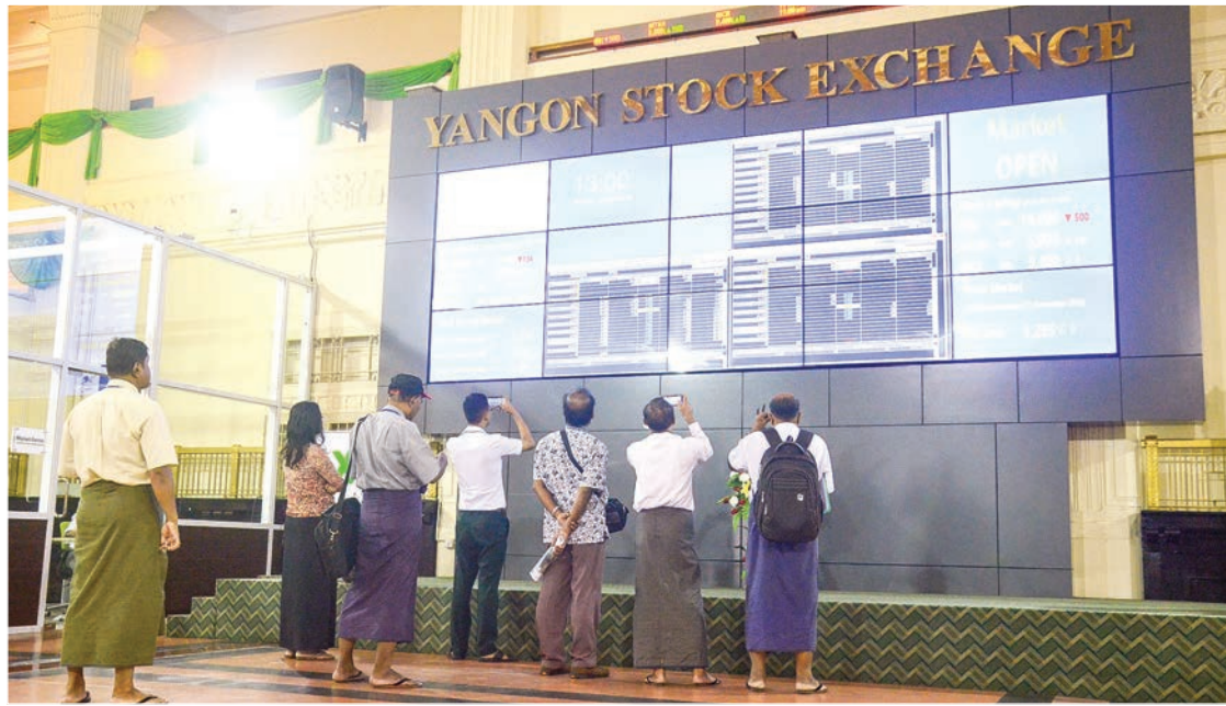
Under Section 4 of the Trading Business Regulations, the stock trading was closed from 16 to 20 August 2021 as the long public holidays for COVID-19 prevention, control and treatment activities. The market resumed on 23 August 2021 as usual.

Under Section 4 of the Trading Business Regulations, the stock trading was closed from 16 to 20 August 2021 as the long public holidays for COVID-19 prevention, control and treatment activities. The market