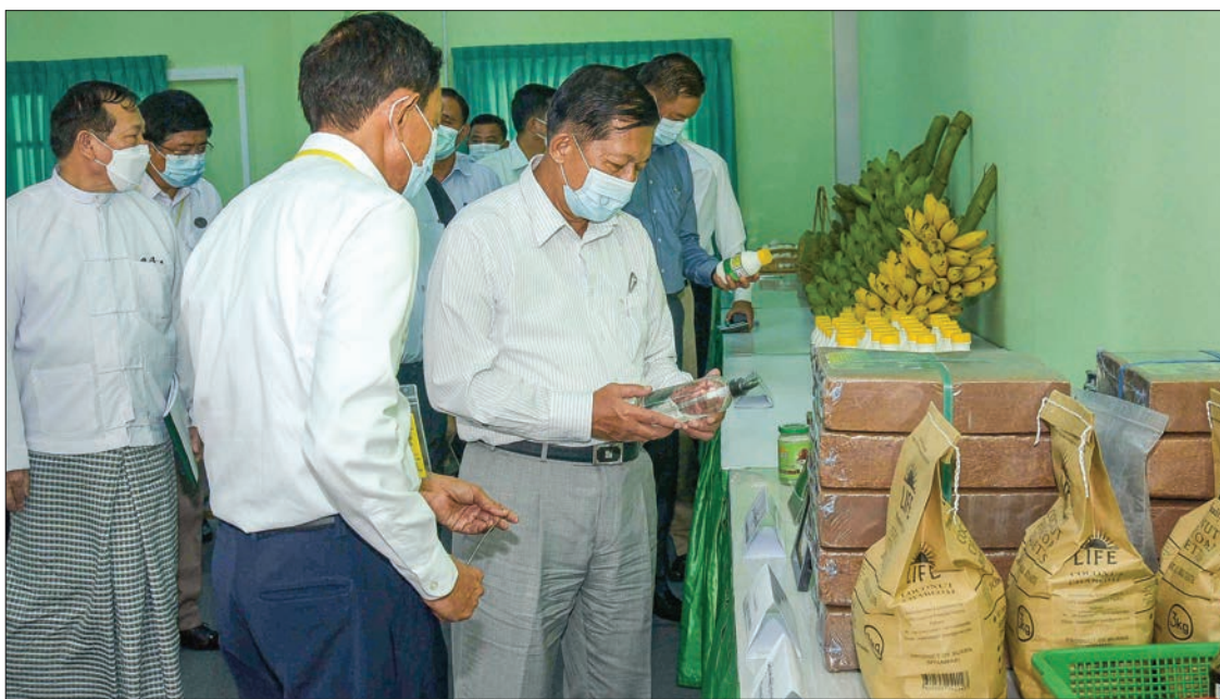
State Administration Council Chairman Prime Minister Senior General Min Aung Hlaing inspects the functioning of the Thilawa Multi-purpose Agriculture and Livestock Breeding Zone in Kyauktan Township, Yangon Region yesterday.

IN livestock breeding undertakings, regional self-sufficiency must be prioritized and then surpluses are to be exported as frozen meat and finished products, said Chairman of the State Administration Council Prime Minister Senior General Min Aung Hlaing in inspecting the functioning of the Thilawa Multi-purpose Agriculture and Livestock Breeding Zone located between the Yangon River and Hmawwun Creek in Kyauktan Township, Yangon Region, yesterday morning.