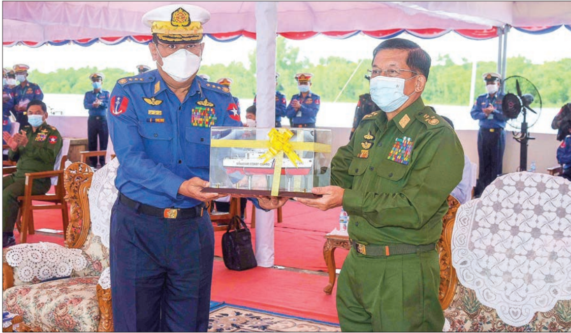
The Senior General receives the scale model naval vessel presented by the Commander-in-Chief (Navy).