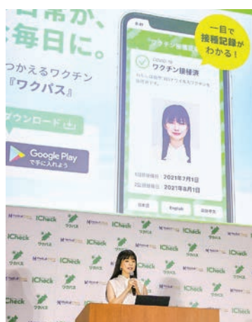
Photo taken 6 October 2021, in Tokyo, shows a presentation for a new smartphone app that shows proof of COVID-19 vaccination.

JAPANESE companies will collaborate to offer special benefits to customers who utilize a new smartphone app showing proof of COVID-19 vaccination when using restaurants and hotels, the app providers said Wednesday.