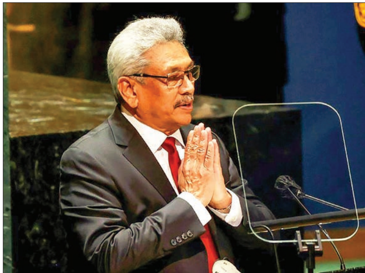
Gotabaya Rajapaksa was the top defence official in 2009 when his president brother Mahinda crushed the Tamil rebel leadership and declared an end to 37 years of guerrilla war.

SRI Lanka's president vowed anti-terror legislation to retain "immediate steps" to amend a lucrative trade status with the