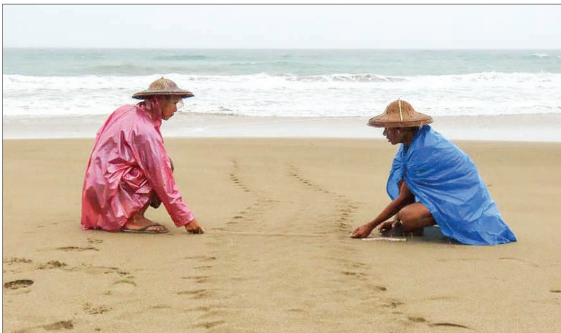
The Department of Fisheries in Kyeintali town, in collaboration with the Sea Turtle Conservation Group (Kisca), made a field trip to Jainggyi village to prevent the consumption of sea turtle eggs.

THE Department of Fisheries in Kyeintali town, in collaboration with the Sea Turtle Conservation Group (Kisca), made a field trip to Jainggyi village to prevent the consumption of sea turtle eggs.