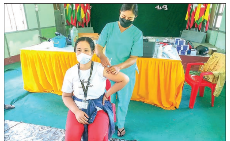
Health staff administers the Covid jab to a local in Kyeintali in Rakhine State.

Security forces from the Kyeintali police station and members of the Fire Brigade also assisted