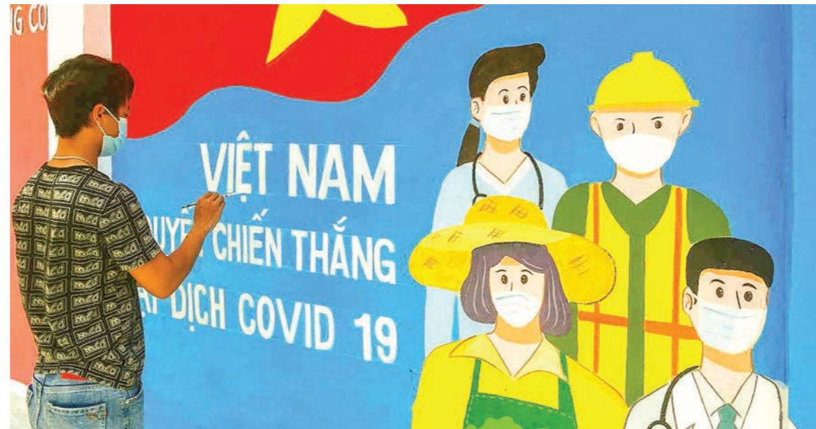
A street artist paints a mural depicting COVID-19 coronavirus frontline workers along a street in Hanoi on 15 June, 2021.