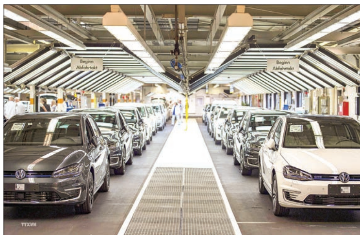
Volkswagen is among manufacturers feeling the pinch of global supply chain disruption.

Carmakers including Volkswagen have scaled back production of their vehicles in response to the limited supply of computer chips, a crucial component in both conventional and electric vehicles.—AFP ■