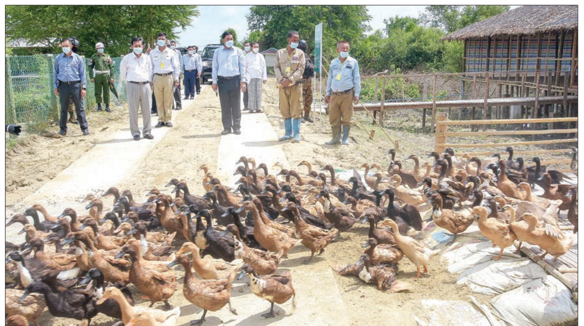
The Senior General pays an inspection tour around the duck farm in the livestock zone yesterday.

In livestock breeding undertakings, regional self-sufficiency