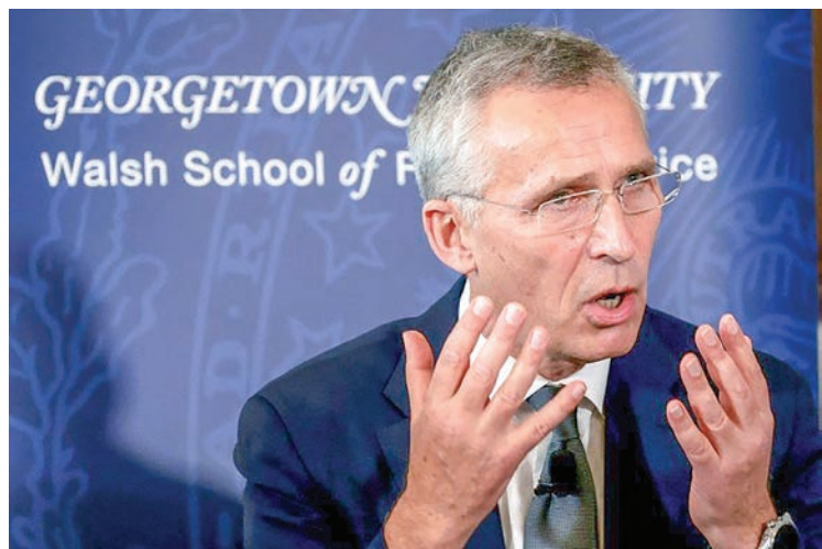
NATO Secretary-General Stoltenberg Speaks At Georgetown University.

NATO Secretary General Jens Stoltenberg said Tuesday that support for a parallel European-only mutual defence organization risks dividing and weakening the Atlantic alliance.