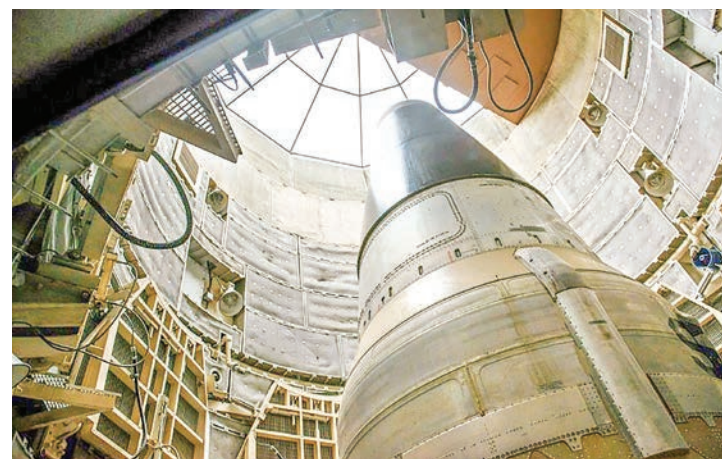
A deactivated US Titan II nuclear ballistic missile.

"Increasing the transparency of states' nuclear stockpiles is important to nonproliferation and disarmament efforts," the State Department said in a statement. Trump, who pulled the United States from the Iran nuclear deal and the Intermediate-Range Nuclear Forces (INF) treaty with Russia, also left another crucial pact, the New Start Treaty on the rocks last year before its scheduled expiration on 5 February. New Start caps the number of nuclear warheads held by Washington and Moscow, and letting it expire could have sparked a reversal of warhead reductions on both sides.—AFP ■