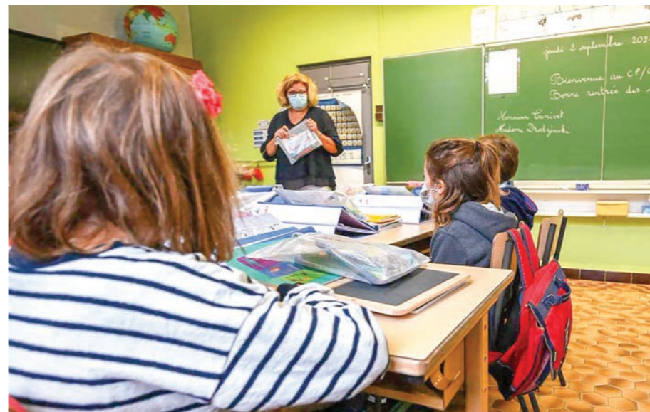
World Teachers' Day is observed every year on 5 October across the globe. It is a day, which celebrates the efforts of teachers, who play an important role in our lives.

The five-day series of events will include panel discussions and online sessions to examine effective policies, evidence and innovative practices to support teachers for successful recovery, build resilience and reimagine education in the post-pandemic world, and advance the fourth Sustainable Development Goal (SDG 4) of inclusive and equitable education. UNESCO/UNICEF/World Bank and OECD survey in July, reveals: