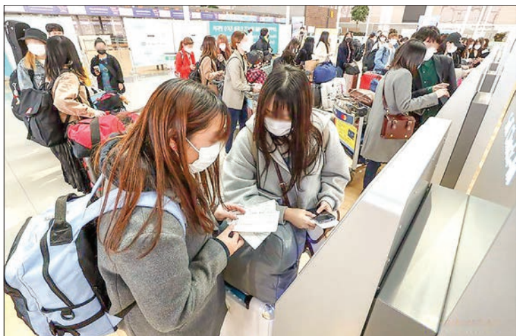
Passengers heading to Tokyo of Japan check in at Incheon International Airport in Incheon, South Korea, 2 April 2020.

A total of 1,528 more patients were discharged from quarantine after making full recovery, pulling up the combined number to 284,197. The total recovery rate was 88.44 per cent.—Xinhua ■