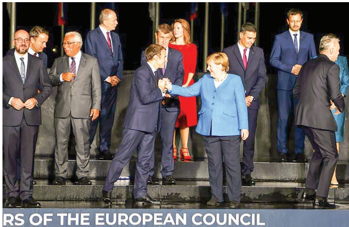
MEMBERS OF THE EUROPEAN COUNCIL

Bulgaria has since become the main obstacle to progress, refusing to let North Macedonia