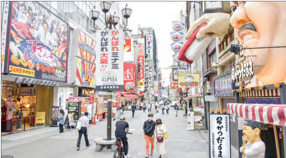
Businesses have welcomed the government's decision to lift the COVID-19 state of emergency in Tokyo and across 18 prefectures.

Kishida plans to offer ministerial posts to education minister Koi-