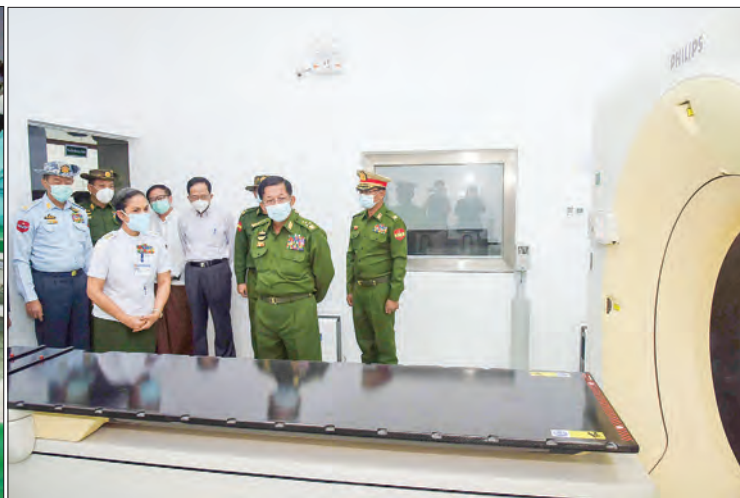
The Senior General looks around the military hospital in Aungpan of Shan State yesterday.