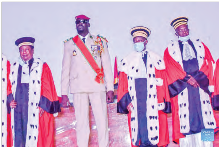
Mamady Doumbouya (2nd L) attends his swearing-in ceremony as transitional president in Conakry, Guinea, on 1 Oct 2021.

"Me Mamady Doumbouya, President of the Transition, I swear before the people of Guinea to preserve in all loyalty the national sovereignty, to respect and to ensure respect for the provisions of the Charter of the Transition, human dignity, the laws and regulations of the Republic, to fulfill my functions in the best interests of the nation, to consolidate the democratic gains, to guarantee the inde-