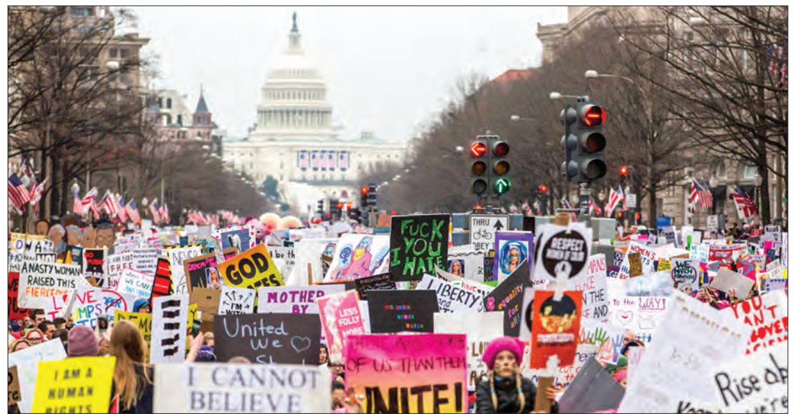
More than three million people across the United States turned out for the January 2017 Women's March, with the central focus in Washington DC, seen here.

THE abortion rights battle takes to the streets across America Saturday, with hundreds of demonstrations planned as part of a new "Women's March" aimed at countering an unprecedented conservative offensive to restrict the termination of pregnancies.