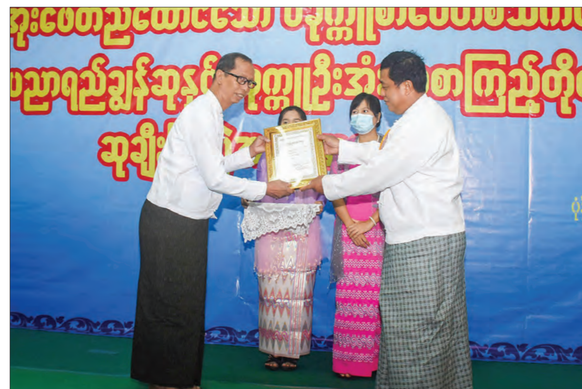
Pakokku U Ohn Pe Literary Awards, Scholarships and Pakokku U Ohn Pe Library Book Awards-giving Ceremony in progress.