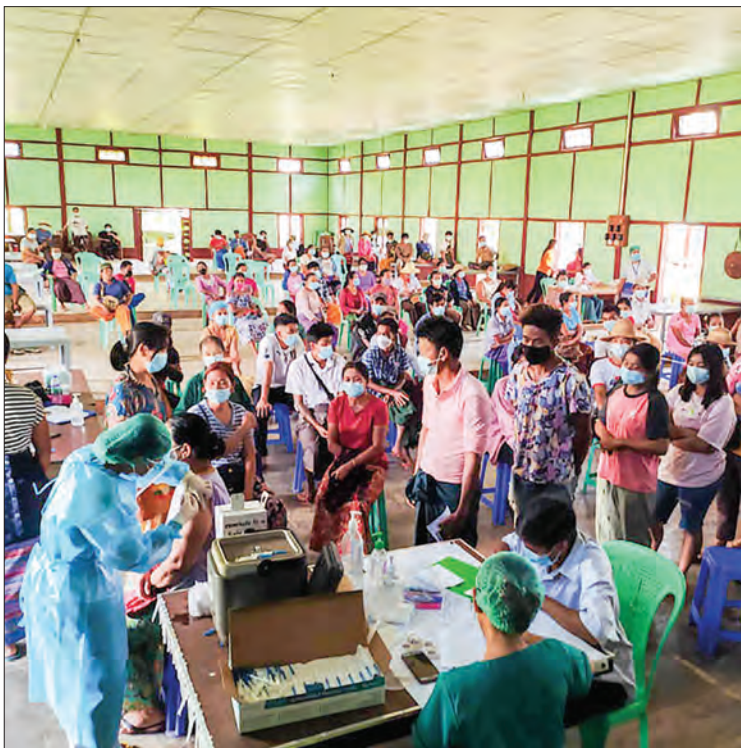
Inoculation drive is underway in northern Shan State.

A total of 855 people were vaccinated yesterday in Mongyai Township, it is reported. —IPRD/GNLM