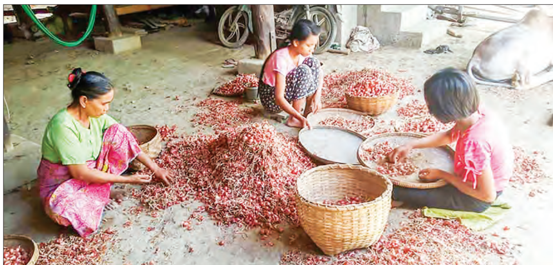
The onions are primarily grown in Mandalay, Magway and Yangon regions, Nay Pyi Taw and Shan State.

THE onion growers in Myothit Township, Magway Region is planning to scale down the sowing acreage this year, following the negative consequences of the COVID-19.