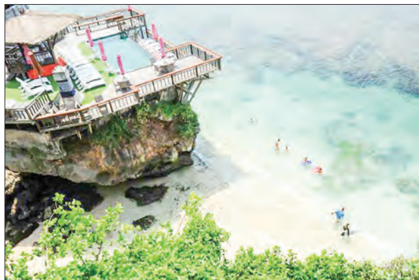
Tourists at Uluwatu beach in Badung regency on Bali island.

AS many as 1,061,530 Indonesia in the January-August period 2021, foreign tourists visited