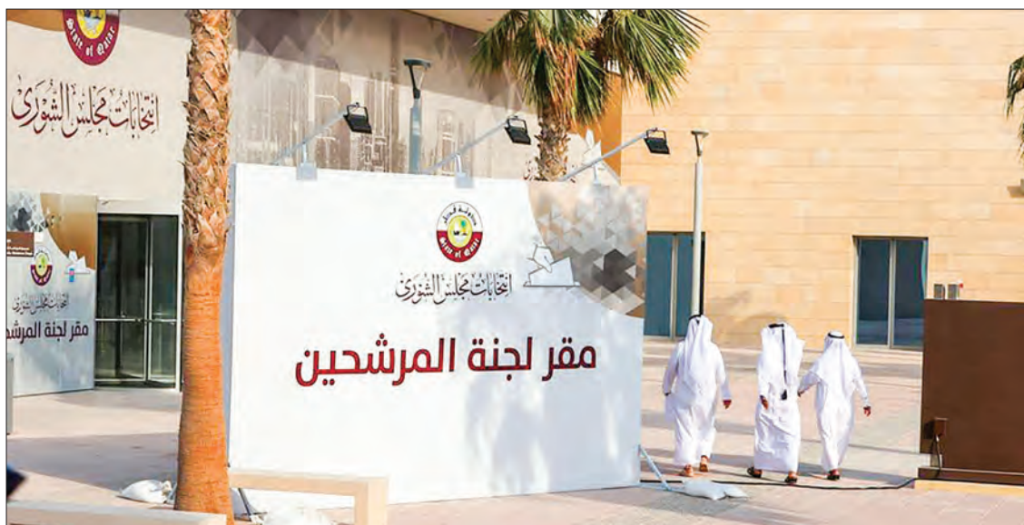
The first legislative elections will see native Qatari citizens elect 30 candidates of the 45-member Shura Council, in a landmark step towards a more representative system of governance.

QATARIS began voting in the emirate's first legislative election Saturday in a symbolic nod to democracy that analysts say will not lead to power shifting away from the ruling family. The vote for the advisory Shura Council has also stirred domestic debate about electoral inclusion and citizenship.