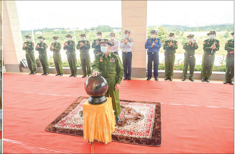
SAC Chairman Commander-in-Chief of Defence Services Senior General Min Aung Hlaing presses the ceremonial opening button for a new radiation treatment unit at the military hospital in Aungpan of Shan State yesterday.

A ceremony to commission the radiation treatment centre and the operation theatre for cancer disease into service took place at the military hospital in Aungpan of Shan State (South) yesterday afternoon, attended by Chairman of the State Administration Council Commander-in-Chief of Defence Services Senior General Min Aung Hlaing.