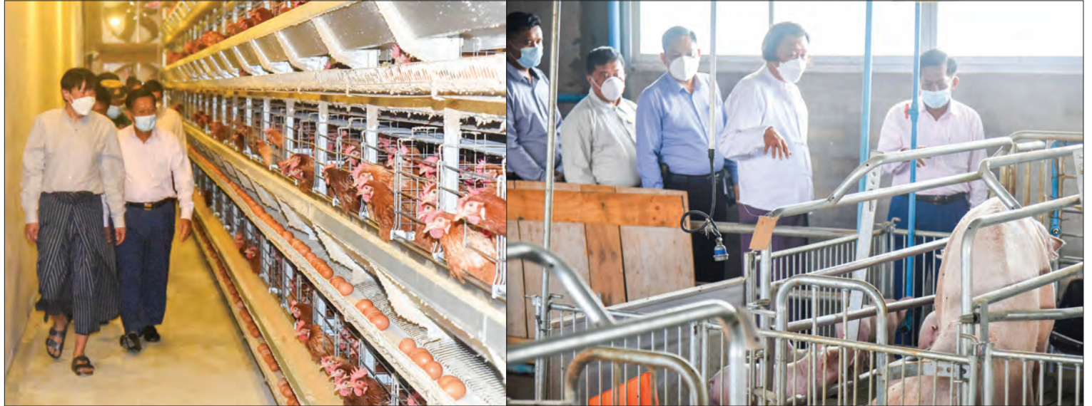
The Senior General and party pay an inspection tour around the Shan Yoma Livestock Zone in Taunggyi on 2 October 2021.

The Senior General stressed the need to move residence on the island from the water of Inlay Lake not to increase the population in the lake. It is necessary to reduce works on the floating lands. Locals and administrative bodies need to join hands in environmental conservation. In his past visits, the Senior General said he donated two aquatic weed harvesters for cleaning the weeds and water hyacinths in the lake. Efforts must be made for the production of fertilizers with the use of weeds and water hyacinths to create jobs for the