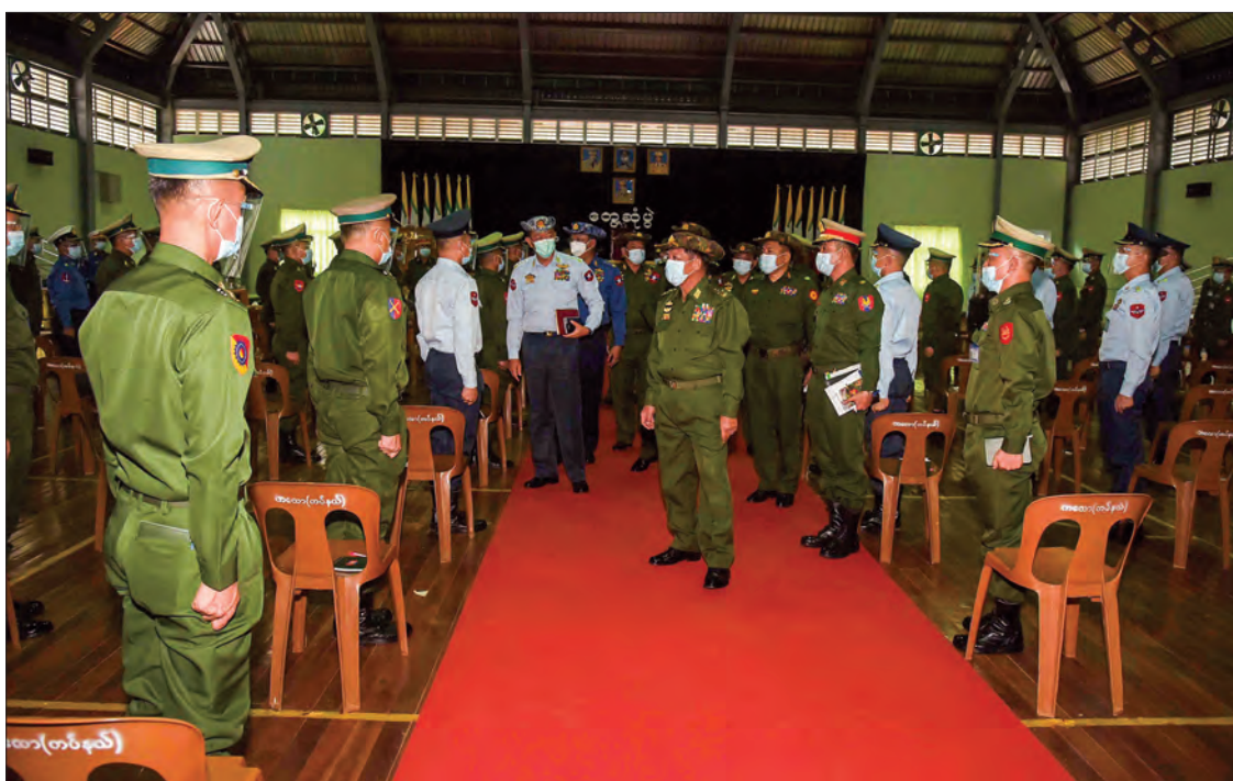
The Senior General and party warmly greets the military senior officer trainees in Kalaw yesterday.

At the meeting, the Senior General said the training course of the Command and General Staff College is the highest among the military training courses conducted by the Tatmadaw to give training on military leadership to the senior