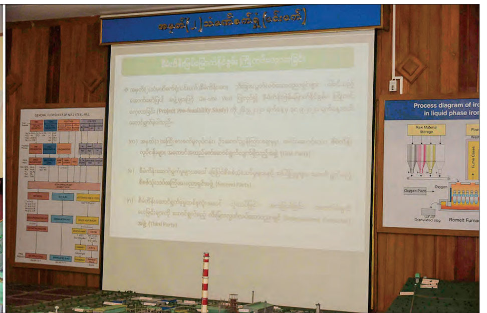
State Administration Council Chairman Prime Minister Senior General Min Aung Hlaing hears the reports on the No.2 Steel Factory (Pinpet) in Taunggyi Township of Shan State on 1 October 2021.

CHAIRMAN of the State Administration Council Prime Minister Senior General Min Aung Hlaing, accompanied by the SAC members, Union Ministers, the Shan State Chief Minister, senior military officers of the Commander-in-Chief of Defence