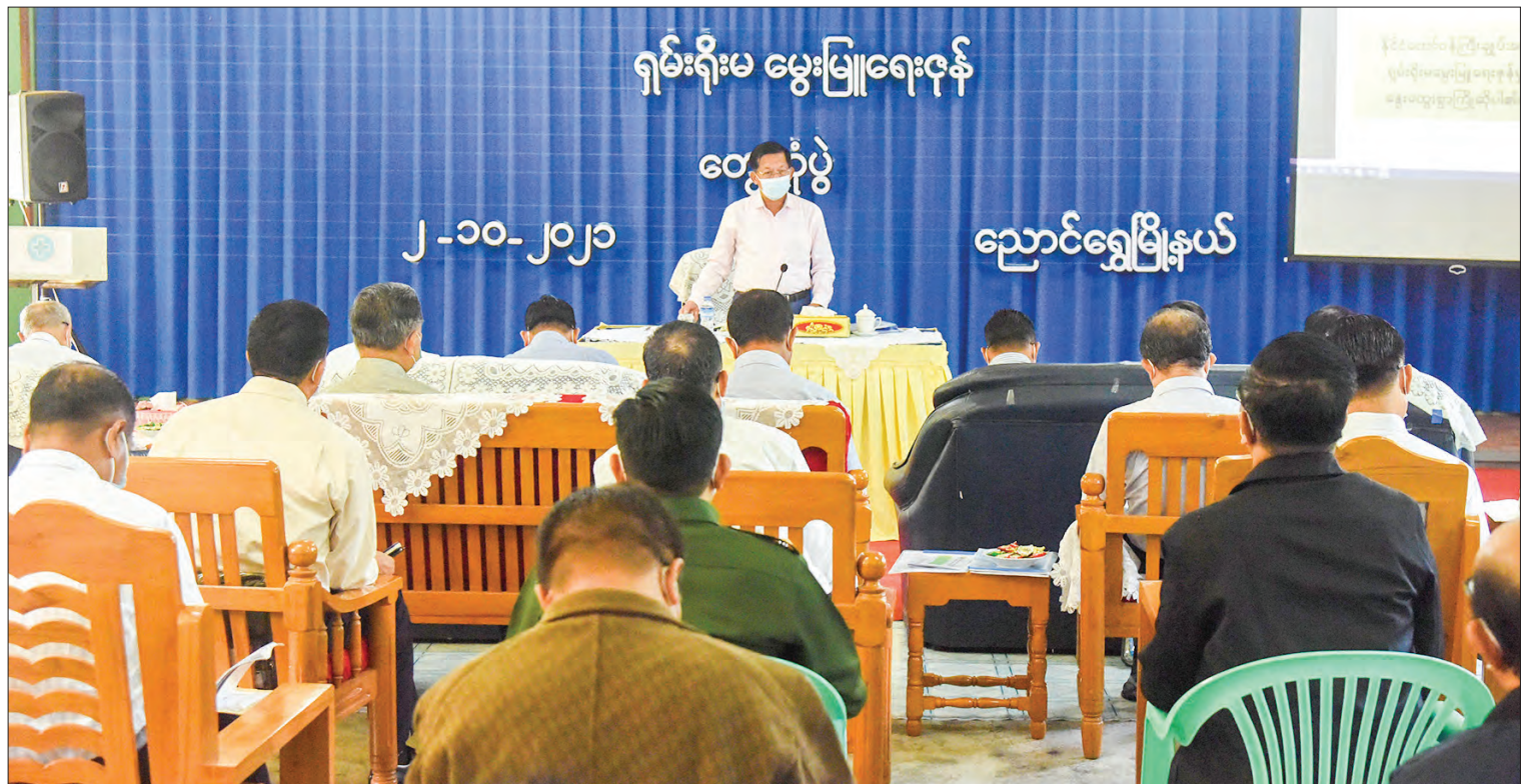
State Administration Council Chairman Prime Minister Senior General Min Aung Hlaing meets officials at the Shan Yoma livestock zone in the Ayethaya Industrial Zone in Taunggyi, Shan State on 2 October 2021.

After hearing the reports, the Senior General expressed his pleasure for the efforts of local people in successfully raising the layers. He stressed the need to successfully emerge the breeding of dairy cows and produce livestock, fish and other agricultural products in the industrial zone. Efforts must be made for manu-