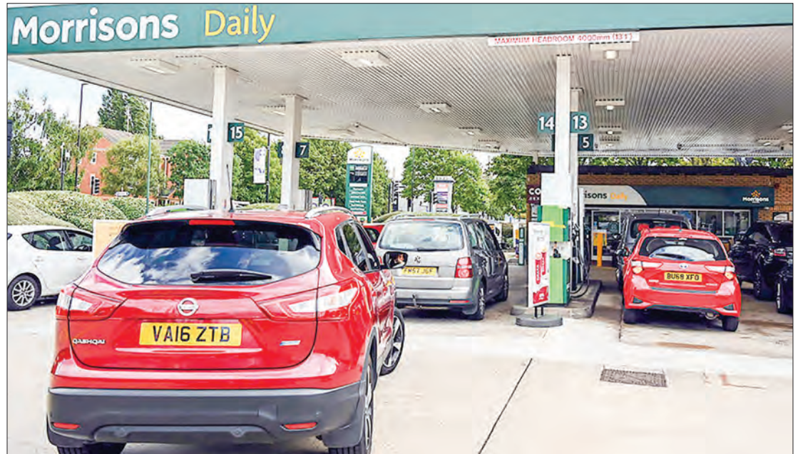
Motorists queue at a petrol station in Coventry, central England on 28 September 2021.

"It's important to stress there is no national shortage of