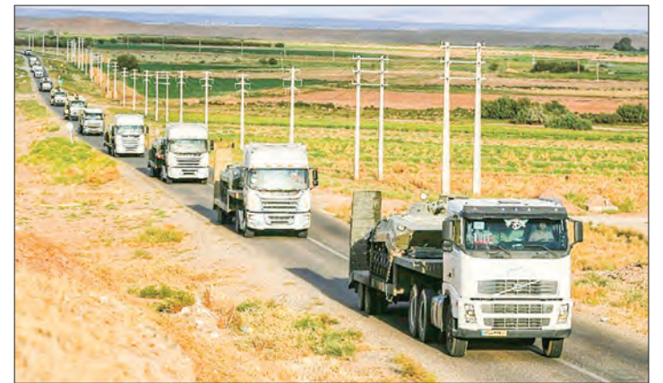
Iranian army equipment on the move during a military exercise in the country's northwest close to the Iranian-Azerbaijani border.

"Every country can carry out any military drill on its own territory. It's their sovereign right. But why now, and why on our border?" he told Turkish news agency Anadolu.—AFP ■