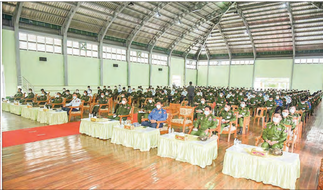
SAC Chairman Commander-in-Chief of Defence Services Senior General Min Aung Hlaing addresses the meeting with senior officer instructors and senior officer trainees of the Command and General Staff College in Kalaw yesterday.

THE training gives theory and principle to the trainees who need to secure success in the practical field with critical thinking and initiatives, said Chairman of the State Administration Council Commander-in-Chief of Defence Services Senior General Min Aung Hlaing at the meeting with senior officer instructors and senior officer trainees of the Command and General Staff College in Kalaw at the hall of Kalaw Station yesterday afternoon.