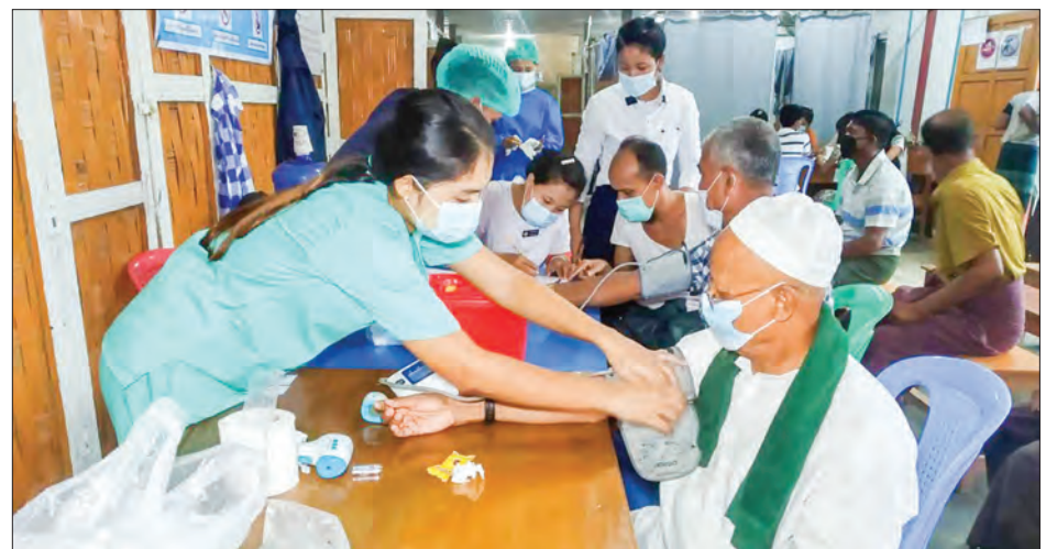
Inoculation continues for the IDPs in Pauktaw Township, Rakhine State.

Vaccines were already given at Sin Tat Maw Village IDP Camp and Anouk Ye IDP Camp and a vaccination programme