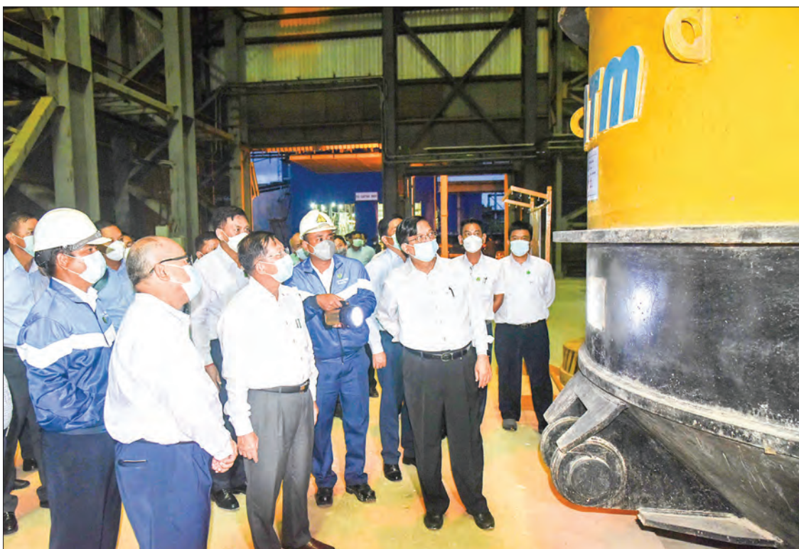
SAC Chairman Prime Minister Senior General Min Aung Hlaing and party pay an inspection tour around the No.2 Steel Mill Project (Pinpet) in Taunggyi Township on 1 October 2021.

The No (2) Steel Mill Project (Pinpet) was developed by Russian company Tyazhpromexport (TPE) and the Myanmar Economic Corporation (MEC) on 5 September 2006. The project was transferred to the Ministry of Industry on 1 October 2012. The operation was suspended for four years and six months. Currently, the officials plan to resume the project in the 2023-2024 financial year.—MNA