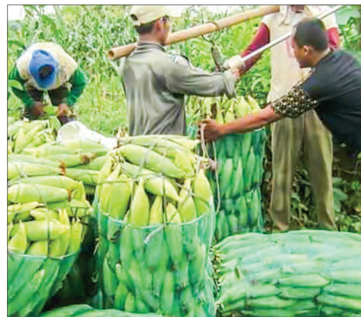
At present, corn is abundantly produced in Shan, Kachin and Kayah states. It is soon to be harvested in Nay Pyi Taw areas (Tatkon and Pyinmana townships).

The corn can be planted in multiple cropping forms. At present, corn is abundantly produced in Shan, Kachin and Kayah states. It is soon to be harvested in Nay Pyi Taw areas (Tatkon and Pyinmana townships).