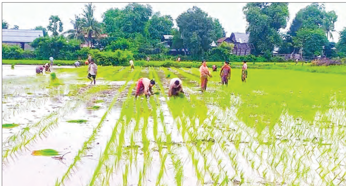
Sagaing Region Agriculture Department made the five-year project (from 2021 to 2025) to produce 100 baskets of monsoon rice paddy per acre.

“The number of targeted acreages is 1,825,000 and 1,858,335 acres have been planted. It exceeded the target amidst the difficulties in the industry. The department urged the growers to achieve the target. Additionally, the pedigree seed production was successfully implemented