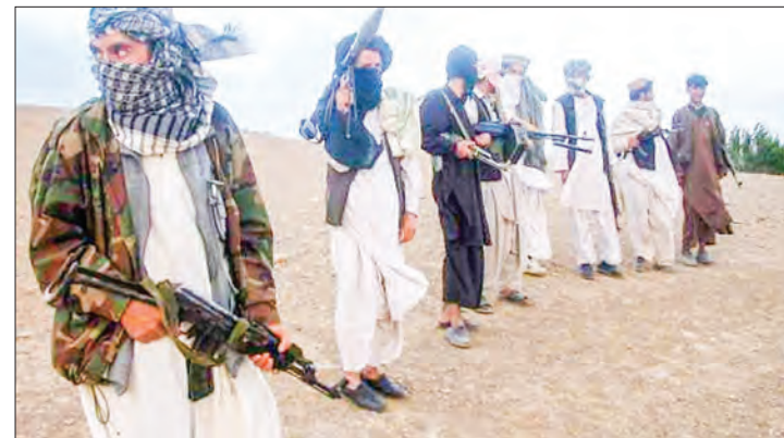
The Pakistani Taliban, also known as Tehreek-e-Taliban Pakistan, are a separate insurgent group from the Afghan Taliban.

The prime minister said that through the reconciliation process he expects the government to "forgive" the militants and expects them to be reintegrated into society as "normal citizens."—Kyodo ■