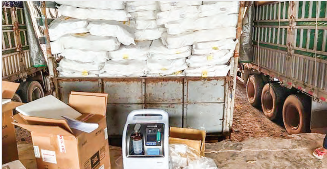
Picture shows the imported anti-Covid equipment via Myawady.

From 1 September to 2 October, 537 vehicles carrying 831 tonnes of liquid oxygen bowser, 127 tonnes of liquid oxygen, 60 tonnes of oxygen gas, six storage