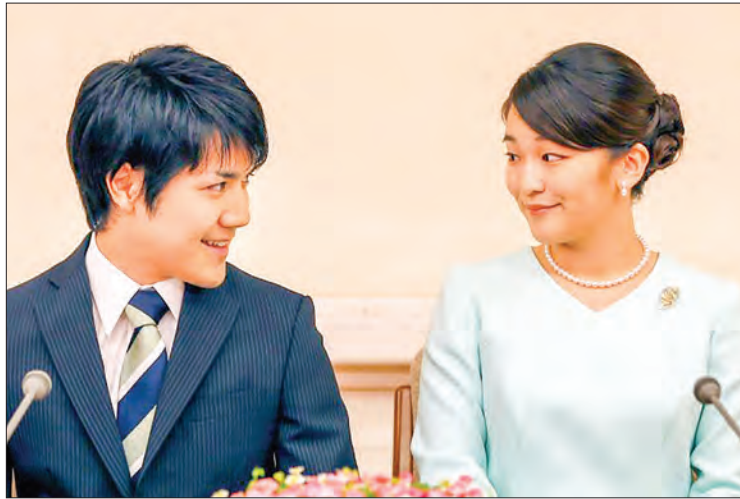
Princess Mako will marry fiancé Kei Komuro later this month after years of delay and controversy.

Mako, the daughter of Japan's crown prince, has endured years of sniping and stalling over her plans to marry Komuro, also 29.