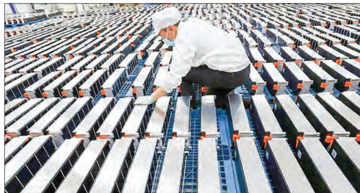
The scramble for lithium and other metals used to make electric car batteries has been called a 21st century "gold rush".

MEXICO plans to move towards a state monopoly in the exploration and mining of lithium, a vital material in the production of electric car batteries, the government said Friday.