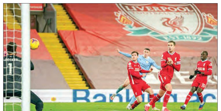
Premier League leaders Liverpool face Manchester City at Anfield on Sunday.

"They are still really, for me, probably the best team in Europe in the moment and it's a tough one," said Klopp on Friday. "Last weekend, they played Chelsea and everybody was talking about Chelsea, how good they are — and they are good, oh my God, they are really good — but City was clear, clear better that day."—AFP ■