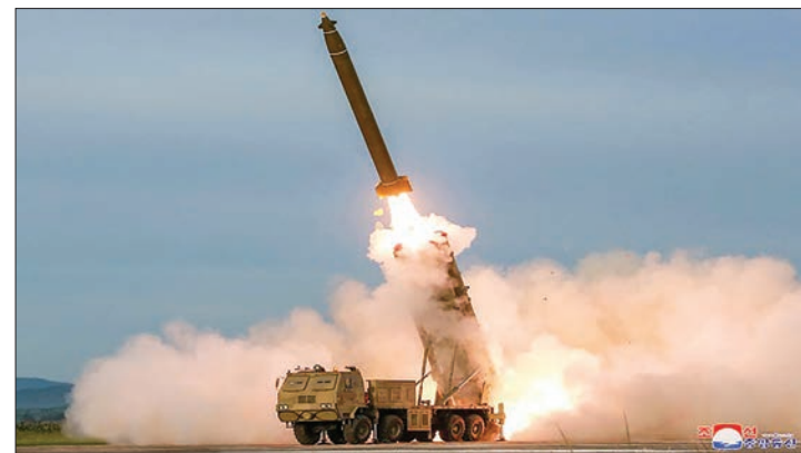
Thursday's missile launch was the latest in a flurry of weapons tests by the nuclear-armed nation.

The news followed Kim saying the country's weapons are "being developed at an extremely fast speed" during a speech on Wednesday at a session of the country's top legislature, the Supreme People's Assembly, according to a report by KCNA on Thursday.—Kyodo News ■