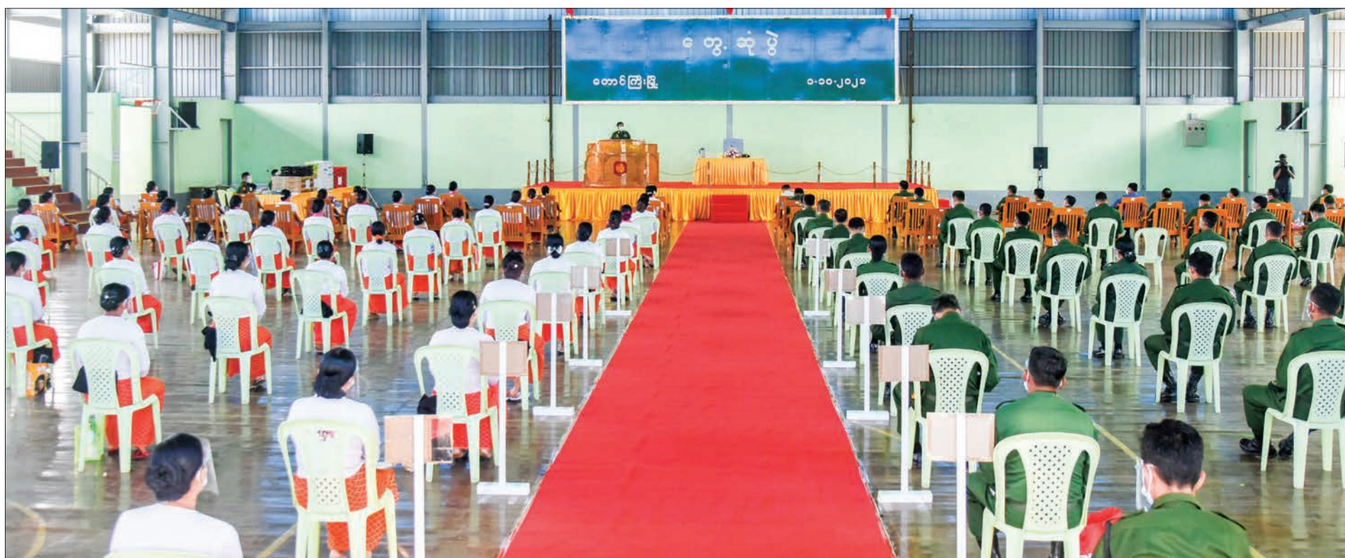
State Administration Council Chairman Commander-in-Chief of Defence Services Senior General Min Aung Hlaing meets officers, other ranks and family members of Taunggyi Station in Taunggyi, Shan State on 1 October 2021.

ALL Tatmadaw members must conscientiously serve daily duties in individuals to show their good military discipline and obedience. As all systematic behaviours from the head to toe in line with military disciplines