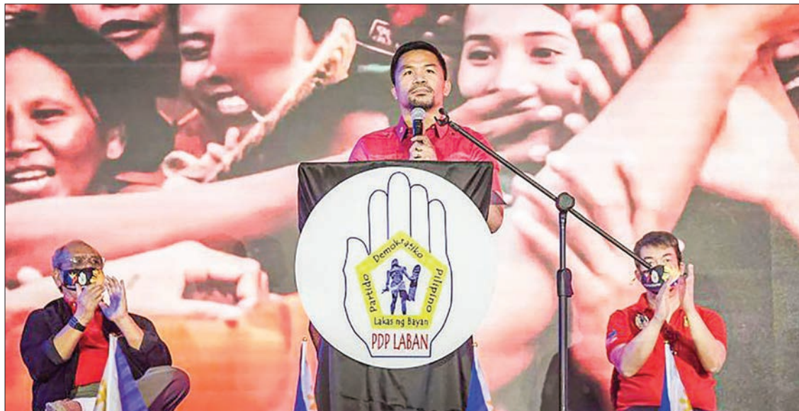
Election campaigns in the chaotic democracy are normally raucous and star-studded with contenders deploying celebrities to pull crowds to rallies. Philippine boxer-turned-politician Manny Pacquiao (C) speaking during the PDP-Laban national assembly in Manila.

THE Philippines' election season kicked off Friday with TV celebrities, political scions and at least one inmate expected to be among thousands of candidates vying for posts from president to town councillor.