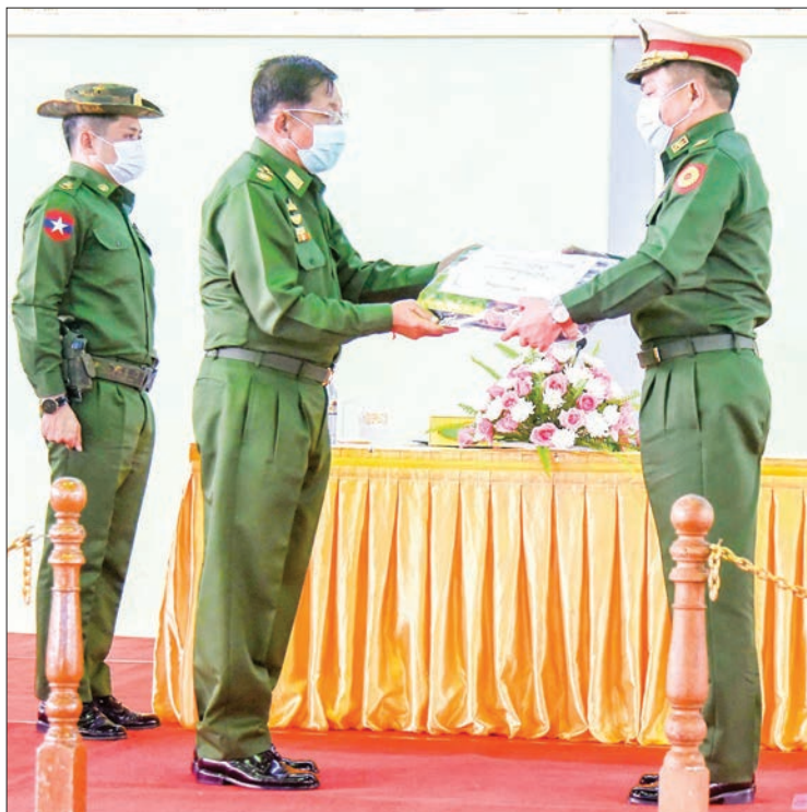
The Senior General gives foodstuffs to the Eastern Command Commander.

Tatmadaw members need to take training to be capable Tatmadaw of dutifully discharging the State defence duty. Training and professional courses are conducted for enhancing the capacity of officers and other ranks to dutifully serve their tasks. Since its birth, the Tatmadaw has been good in discipline and obedience, and it must