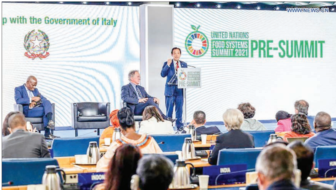
Qu Dongyu, the director-general of the Rome-based UN Food and Agriculture Organization, addresses the UN food systems pre-summit in Rome, Italy, 28 July 2021.

THE director-general of the Rome-based United Nations Food and Agriculture Organization (FAO) on Wednesday called for countries to redouble efforts to halve food waste by the end of this decade.