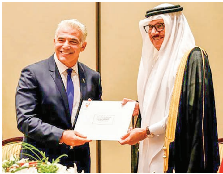
Bahrain's Foreign Minister Abdullatif Al-Zayani (R) and his Israeli counterpart Yair Lapid smile after signing agreements between their countries in the Bahraini capital Manama, during Lapid's landmark visit.

The Bahrain flight and Israel's first bilateral ministerial visit to the Gulf country are part of a thaw in regional relations after the United Arab Emir-