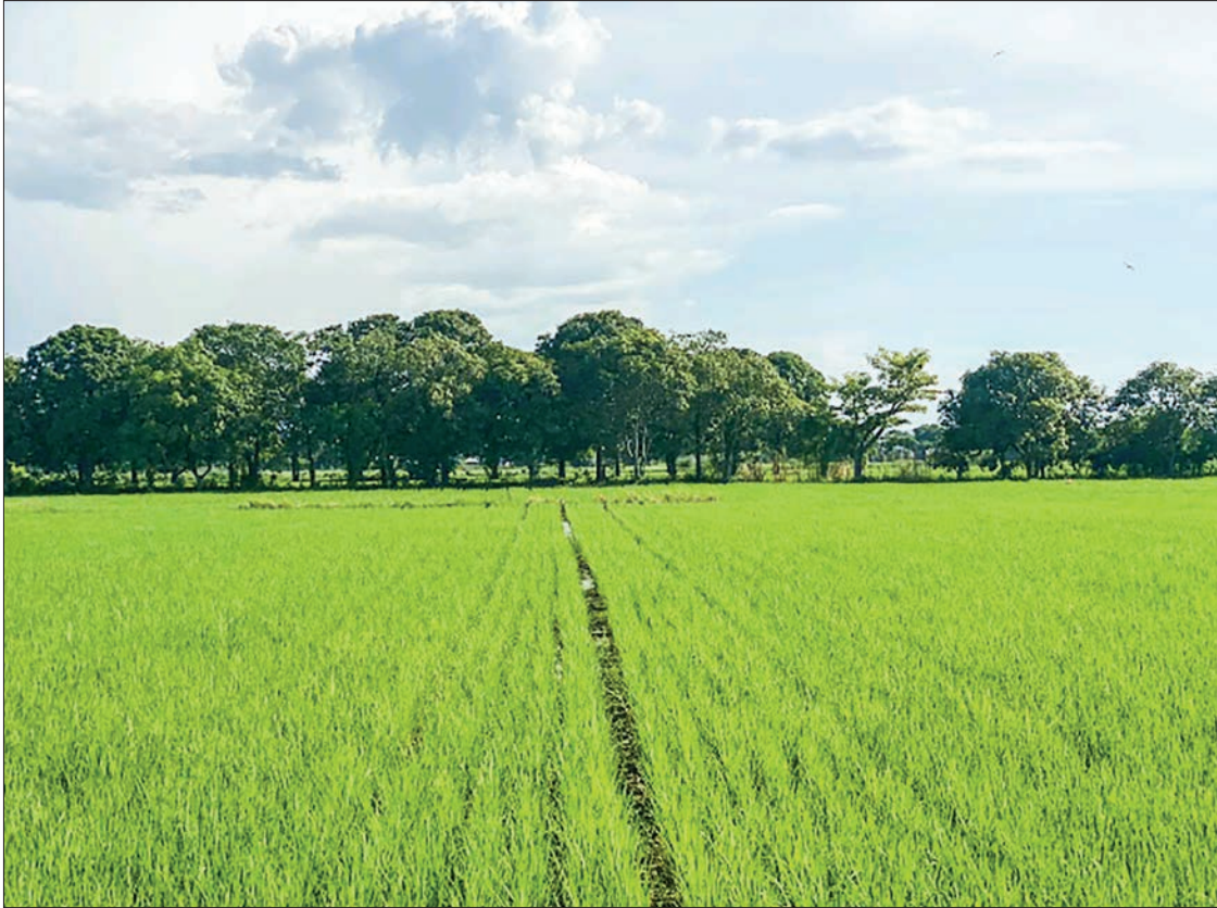
The government designated the places of Tamote Soe Village-tract of Amarapura Township, where the high-quality agricultural machinery is implemented, to plant the paddy to produce 100-basket per acre.