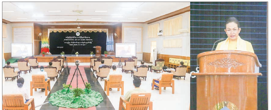
MSWRR Union Minister Dr Thet Thet Khine speaks on the occasion of International Day of Older Persons yesterday.

tional Day of Older Persons, the Ministry of Social Welfare, Relief and Resettlement will be supporting K1 million each to the oldest man and woman in Myanmar through the respective regions/states, as in previous