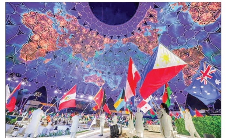
Flag-bearers for participating countries enter during the opening ceremony of the Dubai Expo 2020, on 30 Sept 2021.

The ceremony kicks off a six-month world fair attended by more than 190 countries, despite the European parliament's call for member states to boycott over the United Arab Emirates' human rights record. Organizers are hoping for 25 million visits to Expo 2020, the first in the Middle East, which is set to be the most attended event since the pandemic. This year's Tokyo Olympics went ahead largely without fans. However, travel restrictions remain in place around the globe during a spectacle that was conceived pre-Covid-19 and is starting a year late.—AFP ■