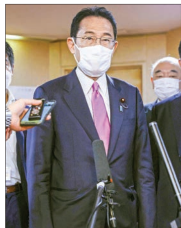
Kishida, the new leader of Japan's ruling Liberal Democratic Party, speaks to reporters at the party headquarters in Tokyo on 1 Oct 2021.

FUMIO Kishida, the new leader of Japan's ruling Liberal Democratic Party and presumed next prime minister, on Friday unveiled a lineup of party executives that will be tasked with buoying public support ahead of next month's general election.