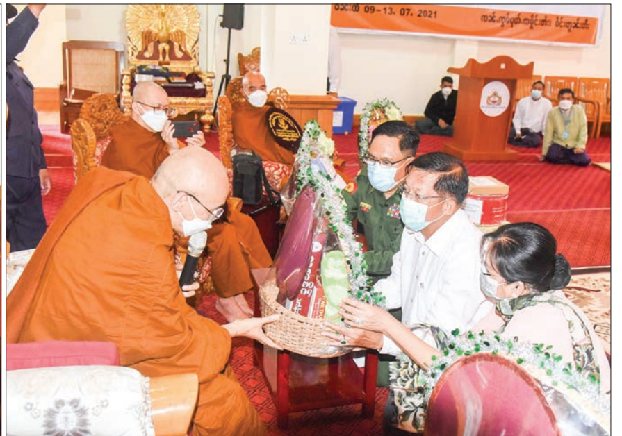
The Senior General and wife offers the donations to the Sayadaw and monks.