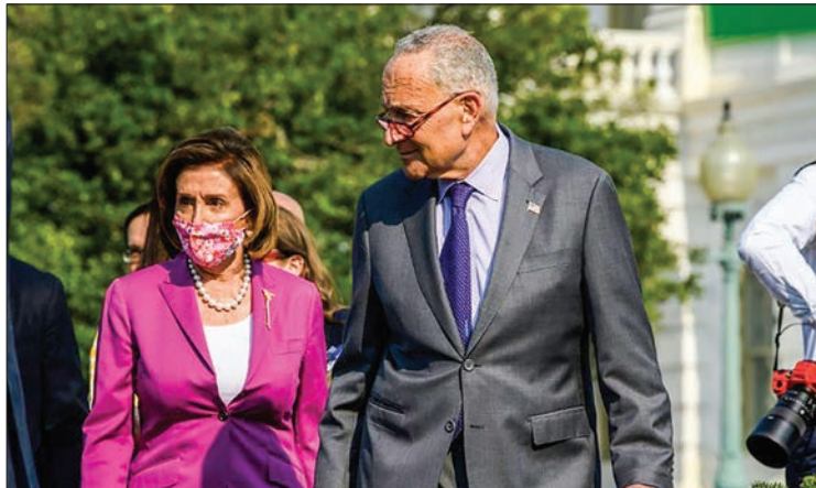
US House Speaker Nancy Pelosi and Senate Majority Leader Chuck Schumer are struggling to pass President Joe Biden's spending plans.

dilemma: bring the infrastructure bill to the floor, where it has very little Republican support and would likely be sunk by Democratic liberals, or risk the ire of moderates by announcing a delay.