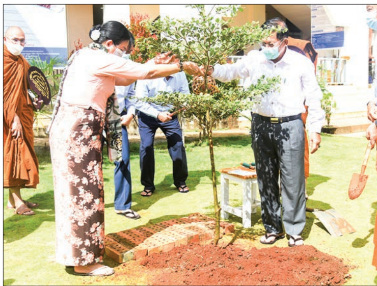
The Senior General and wife plants the badum tree at the university.