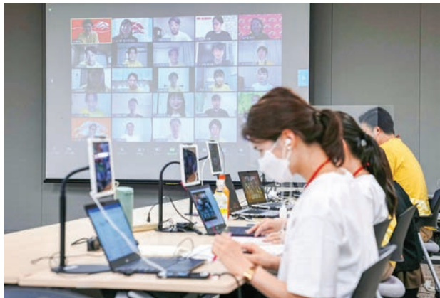
Kirin Holdings Co. holds an online ceremony for students who had received job offers from the company in Tokyo on 1 Oct 2021.