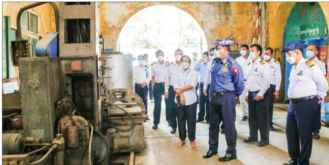
MoTC Union Minister Admiral Tin Aung San inspects the Myanmar Railways workshops yesterday.

The Union Minister and party inspected the workshop and the three plots of land to be