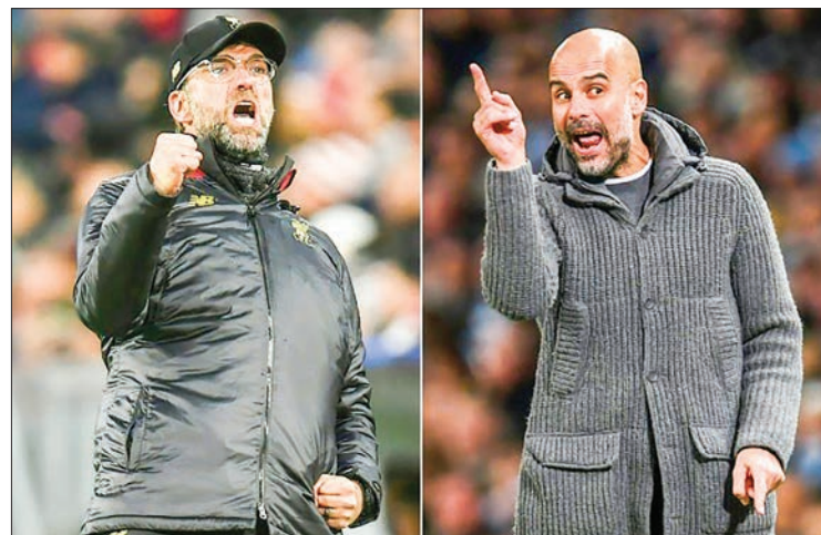
Liverpool and Manchester City have become the dominant forces in English football under Jurgen Klopp (left) and Pep Guardiola.

City ended their long wait for a win away to Liverpool in emphatic fashion with a 4-1 victory in February but they have not won in front of a crowd at Anfield since 2003. —AFP ■