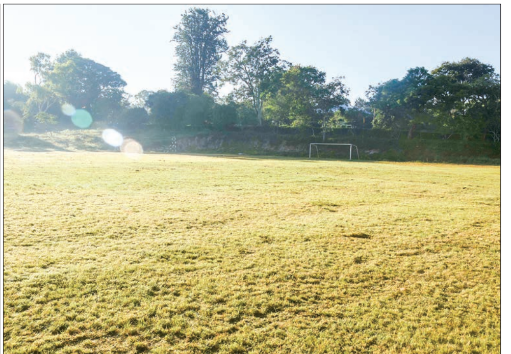
The SAC Chairman Commander-in-Chief of Defence Services Senior General and party inspect the upgrade of the Taunggyi Station sports ground in Eastern Command, Shan State on 1 October 2021.