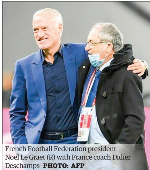
French Football Federation president Noel Le Graet (R) with France coach Didier Deschamps

He was more reserved about having more regular men's World Cups but admitted: "Personally, I am not opposed to the idea, but I wouldn't give carte blanche to it either. —AFP ■