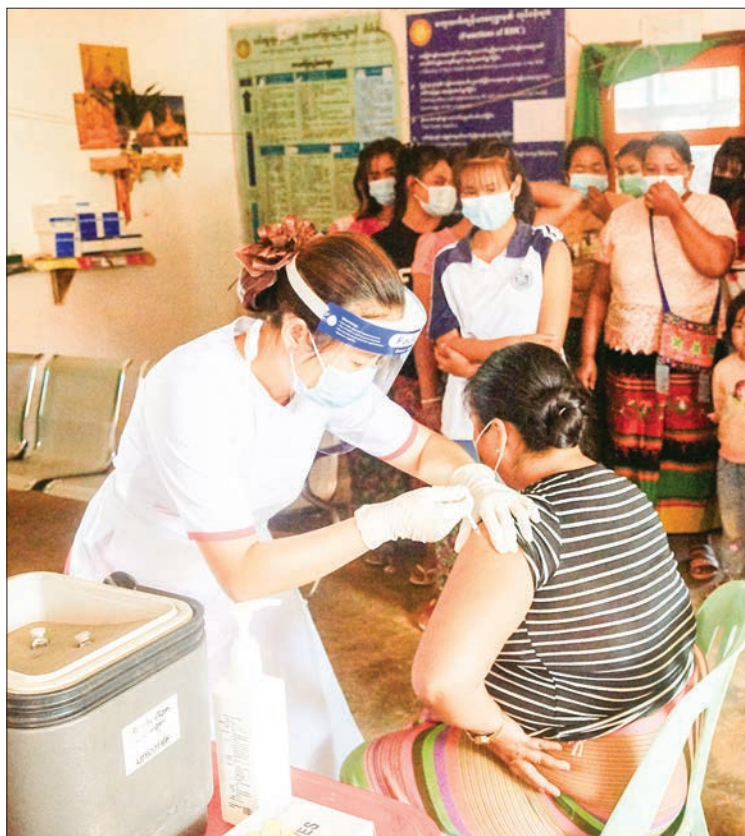
A local receives Covid jab in Mongyan Township, Shan State.

PEOPLE from the less accessible areas across the country are being provided with vaccination against the COVID-19 virus, and on 29 September, the vaccines were administered in Yann Kaung village-tract in Mongyan Township in Kengtung District, Shan State (East).