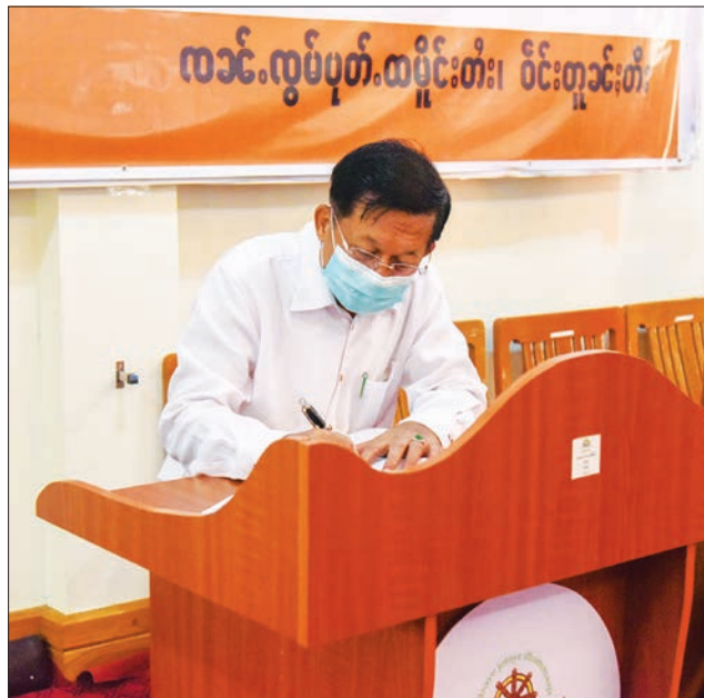
The Senior General signs in the visitor's log of the university.

Then, the Senior General supplicated health-related matters of Sayadaw, construction of Mara Wizaya, Bhumi Phassa Mudra Sitting Buddha Image in Dekkhinathiri Township of Nay Pyi Taw with four objectives: to show the world that Theravada Buddha Sasana is shining brightly in Myanmar; to bring peace and tranquility to the country; to make the regions prosperous with local and foreign pilgrims to the image and to be a supportive action for the development of the country,