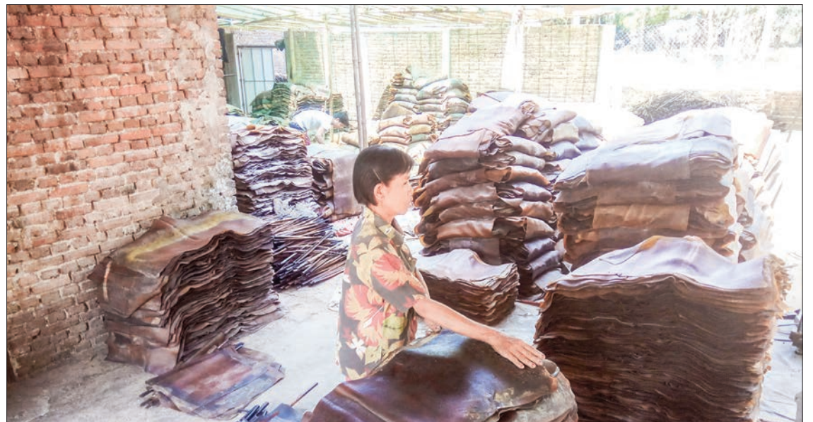
Rubber is primarily produced in Mon and Kayin states and Taninthayi, Bago, and Yangon regions in Myanmar. As per 2018-2019 rubber seasons’ data, there are over 1.628 million acres of rubber plantations in Myanmar, with Mon State accounting for 497,153 acres, followed by Taninthayi Region 348,344 acres and Kayin State with 270,760 acres.

THE price of rubber in Mon state are hiking this year compared to the same period of last year, said Myanmar rubber entrepreneurs.