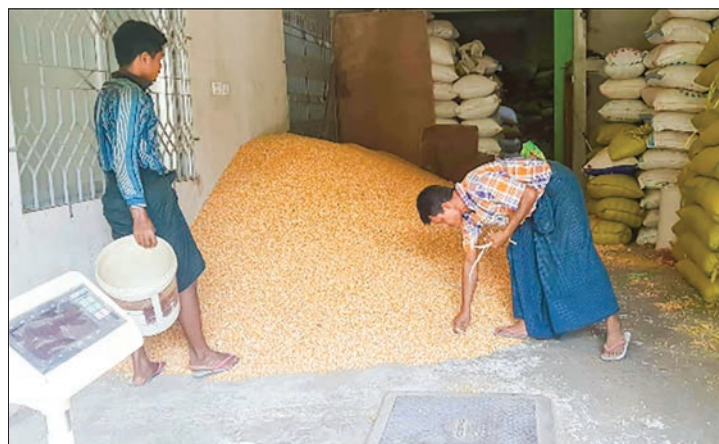
The chickpea is cultivated in Yangon, Mandalay, Bago, Sagaing and Ayeyawady regions and Nay Pyi Taw. There are 890,000 acres of chickpeas across the country.

The pea is cultivated in October and November and they are harvested in January-April period. — KK/GNLM