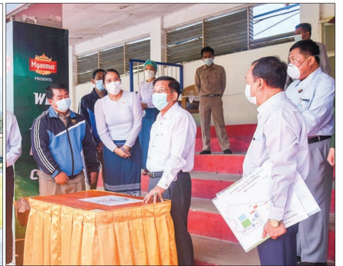
The Senior General inspects the upgrade work of the Taunggyi Sports Ground yesterday.