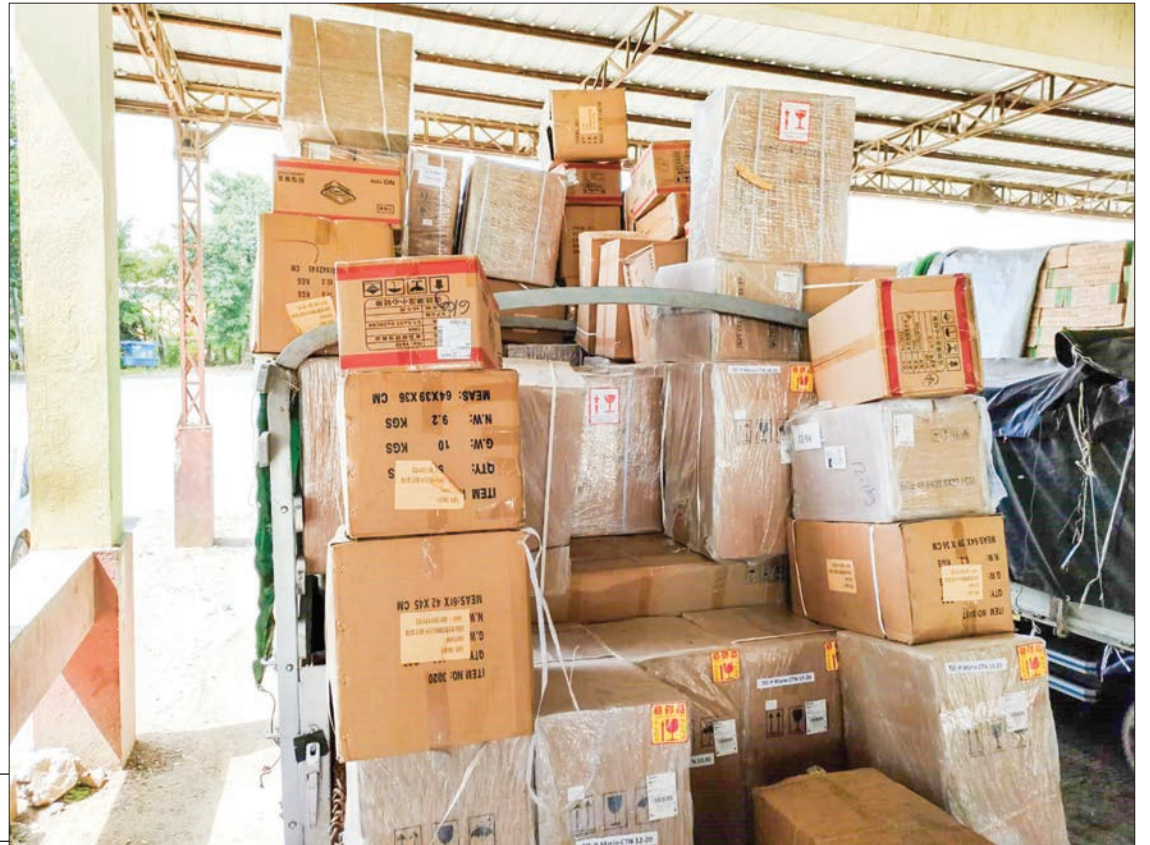
Anti-Covid equipment and medical supplies (in picture) are daily imported via land borders.

It is reported that the Ministry of Commerce is coordinating with relevant departments, facilitating the importation of essential medical supplies required in prevention, control and treatment of COVID-19, as well as contact persons for inquiries can be reached through the Ministry's Website — www.commerce.gov.mm . — MNA