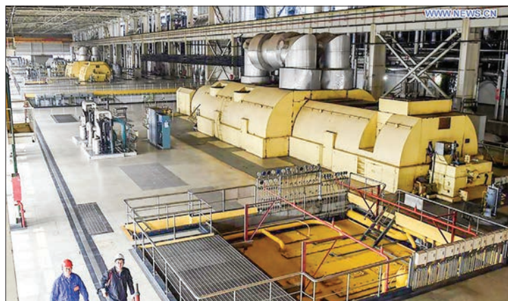
An energy crunch in China has led some banks to lower their growth forecasts for the economy this year. Photo taken on 18 March 2017 shows a coal-fired generating unit at China Huaneng Group's Beijing Thermal Power Plant in Chaoyang District of Beijing, capital of China.

"It is probably a strong signal about how concerned China is regarding keeping industry going, and more importantly, the winter that is just around the corner," said Jeffrey Halley, senior market analyst at OANDA.—AFP ■