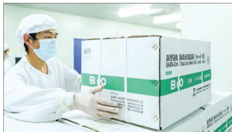
A staff member at a packaging plant for COVID-19 inactivated vaccine products in the Beijing Biological Products Institute Co Ltd in Beijing, 25 Dec 2020.

Phonepaseuth also said the Pfizer and Sinopharm vaccines will be offered to students in Grade 7 of secondary schools