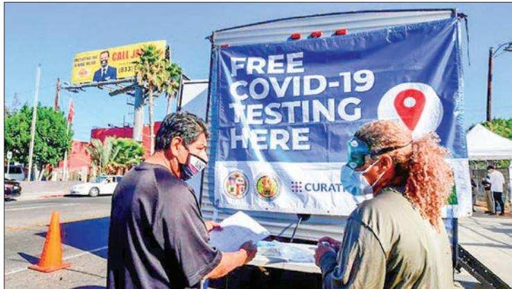
A man asks a volunteer questions at a pop-up COVID-19 test site in Los Angeles on 29 Oct 2020.

among the most aggressive large companies in embracing the policy, said the number of workers scheduled to be terminated for refusing vaccines dropped to 320 from 593, after the airline announced Tuesday it planned to fire anyone who had not received