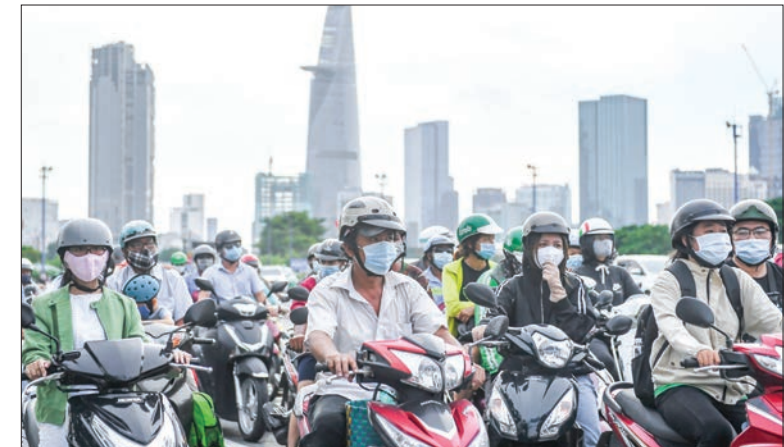
Motorists wait on their motorcycles at a traffic light during rush hours in Ho Chi Minh City.

Ho Chi Minh City on Friday lifted a stay-at-home order that had kept its nine million residents indoors for three months and devastated business in Vietnam's economic hub.