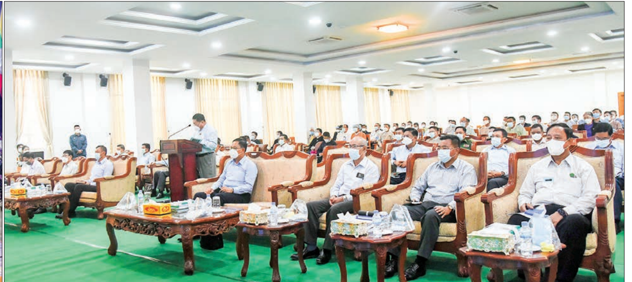
SAC Chairman Prime Minister Senior General Min Aung Hlaing meets members of Shan State government, officials of Self-Administered Zones, departmental personnel, local authorities and town elders in Taunggyi yesterday.

A LL the people need to happily work for the prosperity of the nation in a stable condition with good income, said Chairman of the State Administration Council Prime Minister Senior General Min Aung Hlaing in meeting with members of Shan State government, officials of Self-Administered Zones, departmental personnel, local authorities and town elders at the office of Shan State government in Taunggyi yesterday morning.