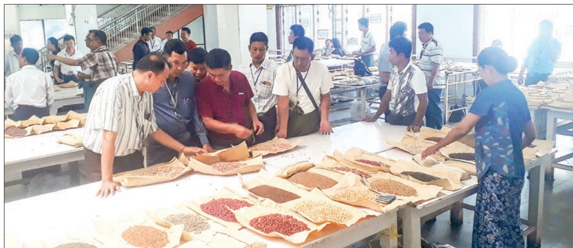
The black gram fetched only K1,805,000 per tonne in the domestic market on 28 September, whereas it touched a high of K2,000,000 per tonne (FAQ/RC) on 29 September. The figures show a remarkable increase of K195,000 per tonne in one day.

THE price of black gram (urad called in India) hit an all-time high of K2 million per tonne on 29 September, which is a large gap of K200,000 per tonne in one day, according to Yangon Region Chambers of Commerce and Industry (Bayintnaung Wholesale Centre).