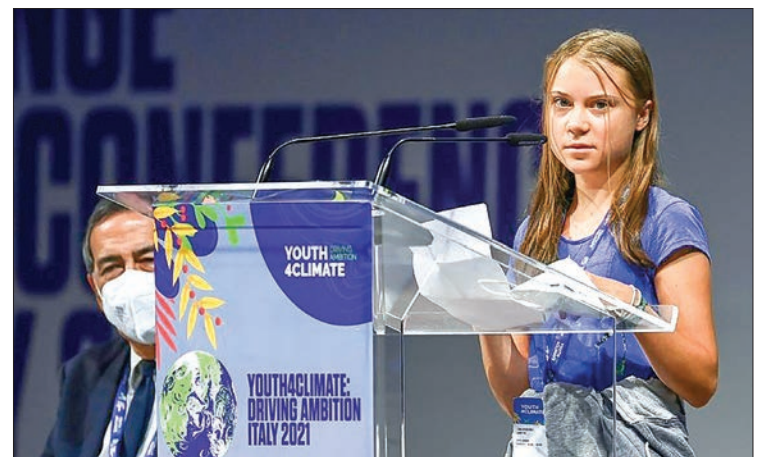
Speaking just weeks ahead of a crunch UN climate summit in Glasgow, Thunberg accused governments of "shamelessly congratulating themselves" for insufficient emissions cutting pledges and finance promises.

about some expensive politically correct dream of bunny hugging, or build back better, blah blah, green economy, blah blah, net zero by 2050, blah blah, climate neutral blah blah. "This is all we hear from our so-called leaders: words, words that sound great but so far have led to no action, our hopes and dreams drowned in their empty words and promises," said Thunberg.