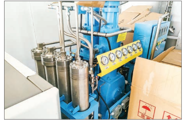
Picture shows an oxygen plant among the imported anti-Covid devices.

Officials from the relevant departments are cooperating to facilitate and expedite the Standard Operating Procedures (SOPs) for better importation.