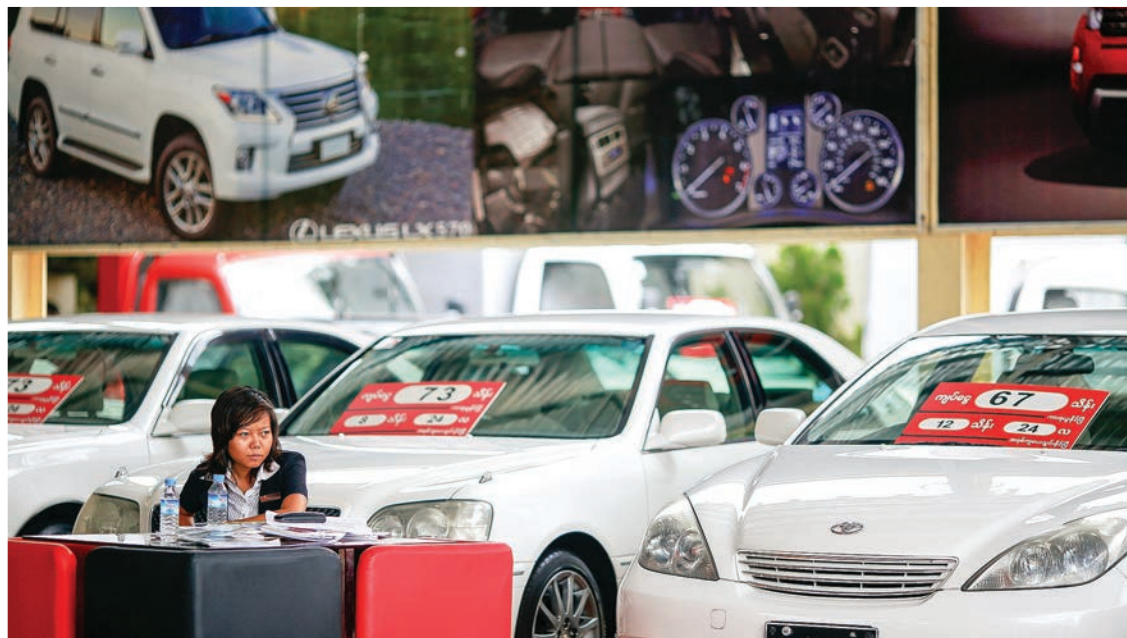
Importing the vehicles costs a lot owing to the Kyat depreciation, double shipping rate and price volatility with the tax in the previous months. At present, the automobile market for new vehicles and second-hand cars are leading to a downward trend during the financial hard times.

Importing the vehicles costs a lot owing to the Kyat depreciation, double shipping rate and price volatility with the tax in the previous months. At present, the automobile market for new vehicles and second-hand cars are leading to a downward trend during the financial hard times. — KK/GNLM