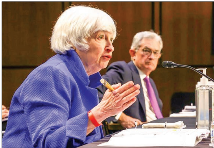
Treasury Secretary Janet Yellen and Federal Reserve Chairman Jerome Powell have warned of the dire consequences of not raising the debt ceiling, and markets are growing nervous.

Wall Street finished decisively lower, with the S&P 500 losing two percent and the tech-heavy Nasdaq falling nearly three percent as Treasury Secretary Janet Yellen urged Congress to quickly raise the debt ceiling to keep the US government from