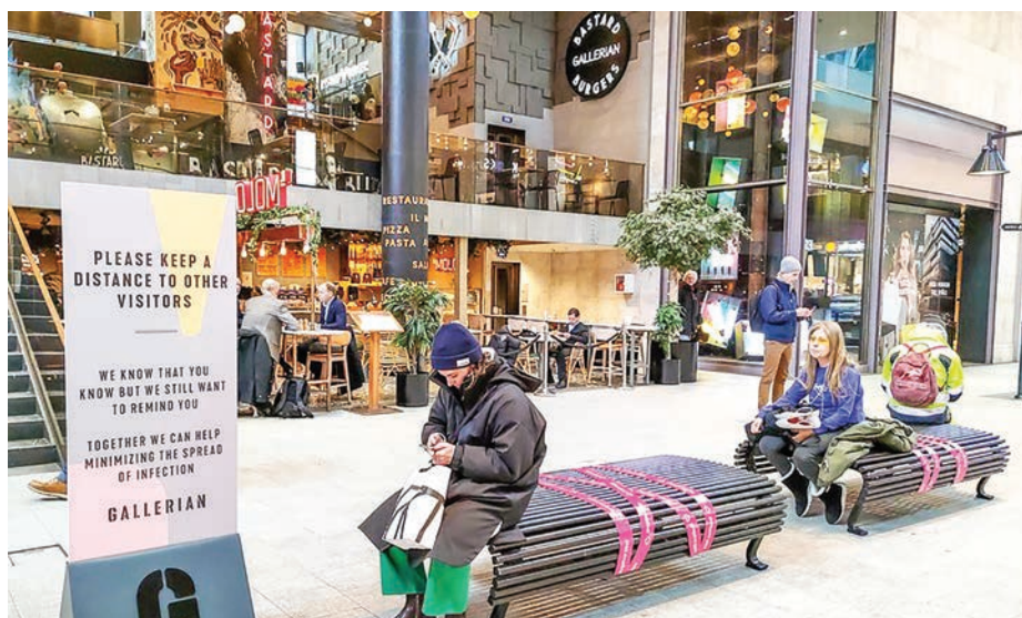
People sit on benches marked with tapes to keep a distance at a shopping mall in Stockholm, Sweden, on 10 February 2021.