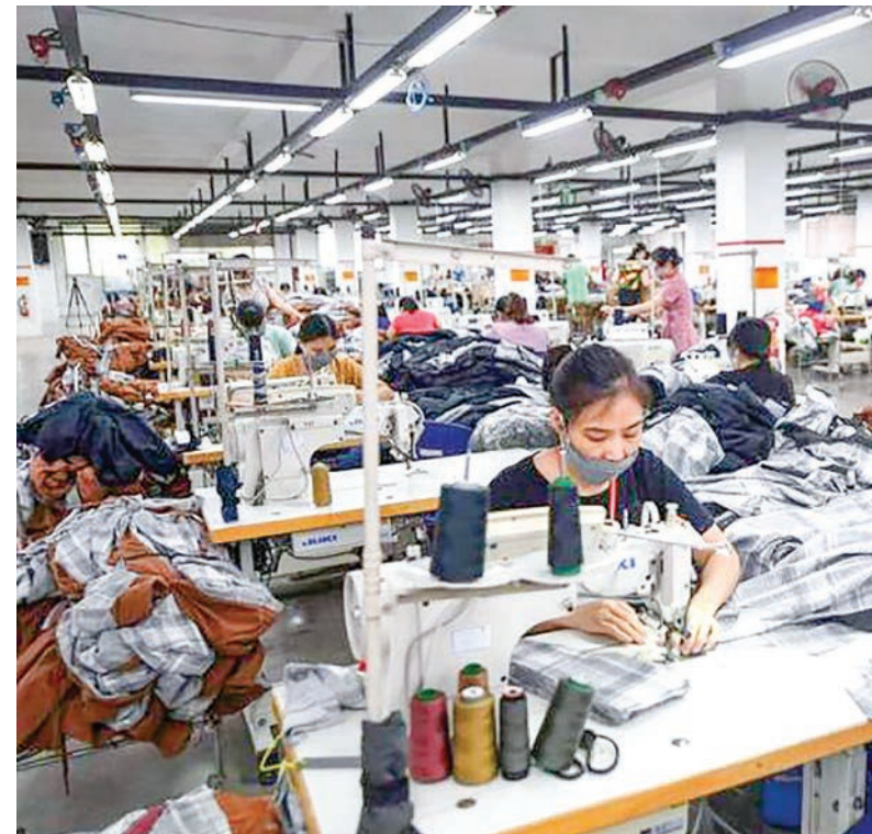
Vietnam's economy suffered its heaviest contraction on record in the third quarter after a devastating wave of Covid-19 forced the widespread suspension of manufacturing.

While lockdowns are gradually loosening across the country as infections steadily decline, millions of Vietnamese have been under stay-at-home orders for months.