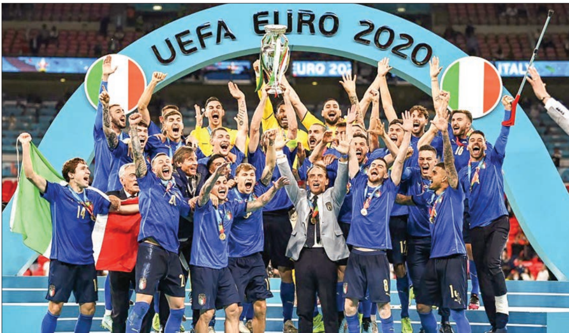
Euro winners Italy will face South American champions Argentina next June.

ITALY and Argentina will face each other next June 2022, in a first meeting between the winners of the Euro and the Copa America, UEFA and CONMEBOL announced on Tuesday.