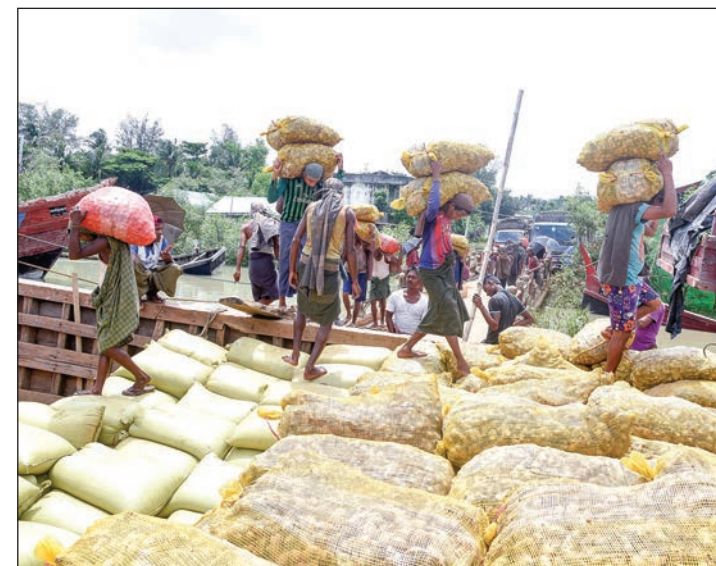
Between 1 October and 17 September of this FY, the Myanmar-Bangladesh trade through border checkpoints has touched $35.41 million, with exports worth $16.98 million and imports amounting to $18.43 million.

The products traded between the two countries include bamboo, ginger, peanut, saltwater prawns and fish, dried plums, garlic, rice, mung beans, blankets, candy, plum jams, footwear, frozen foods, chemicals, leather, jute products, tobacco, plastics, wood, knitwear, and beverages. — ACM/GNLM