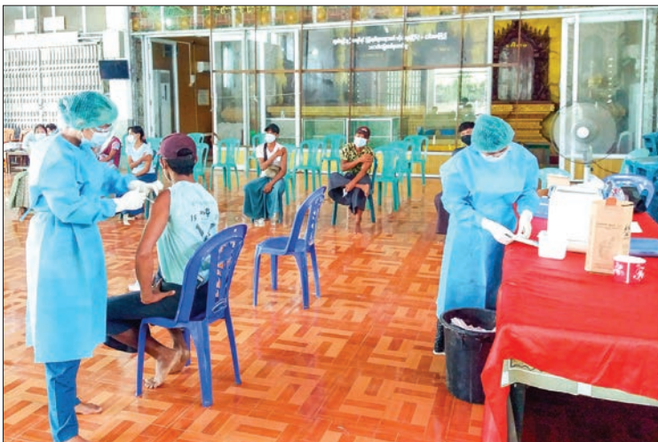
Above 18-year-olds are receiving the first shot of COVID vaccine in Yenangyaung Township.

A total of 16,405 above 18-year-old locals have already been vaccinated in the second batch with the first dose of the Sinopharm vaccine in Yenangyaung Township, Magway Region, officials said.