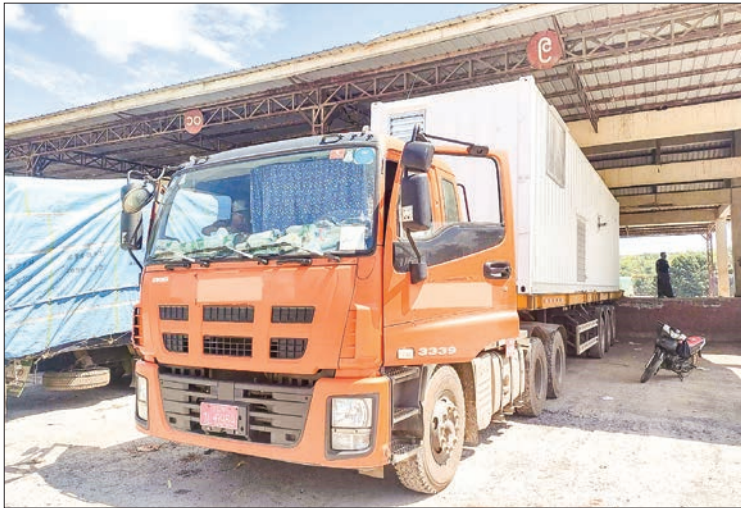
A lorry is seen carrying imported anti-Covid devices.

THE Ministry of Commerce is making efforts to ensure people have access to the essential medical supplies that are critical to the COVID-19 prevention, control and treatment activities, including liquid oxygen and oxygen cylinders, by arranging continuous importation through trading posts, international airport and