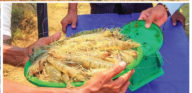
The state is striving for the development in livestock and aquaculture sectors to generate more revenues from exports and fulfil the needs of the local consumption.

helped boost Kyaukpyu shrimp production. The saltwater shrimp production project in Sittway was liable to a Thailand company under the MoU agreement. The project was halted amidst the COVID-19 impacts. The project period was extended again under