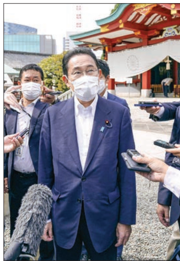
Former Japanese Foreign Minister Fumio Kishida, a candidate in the Liberal Democratic Party's upcoming presidential election, speaks during his visit to Tokyo's Hie Shrine on 27 Sept, 2021.

Factional alliances did not play a decisive role in the first round as most allowed their members to make independent