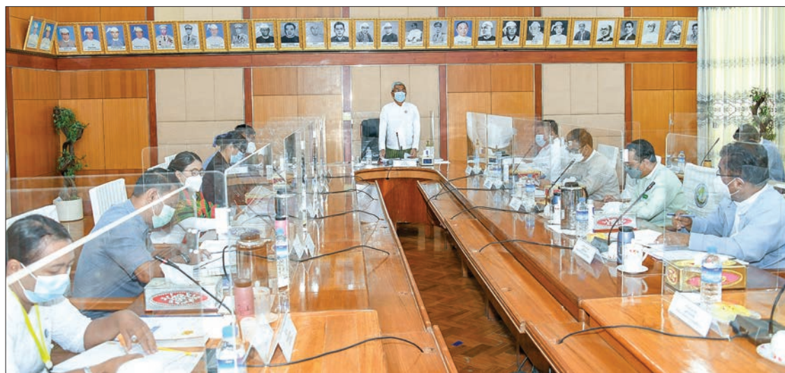
The MoI Deputy Minister chairs the coordination meeting 1/2021 of the Myanmar Child Labour Eradication on Knowledge Dissemination and Capacity-Building Working Committee in Nay Pyi Taw on 29 September 2021.

At the meeting, Chairman of the Working Committee Deputy Minister U Ye Tint said child labour includes works that can have a negative impact on the physical, mental and social development of the child; works that disrupt the education of the child; works that block access to school; works that cause the child to drop out of school prematurely; and children who have to do hard work for a long period of time after school.