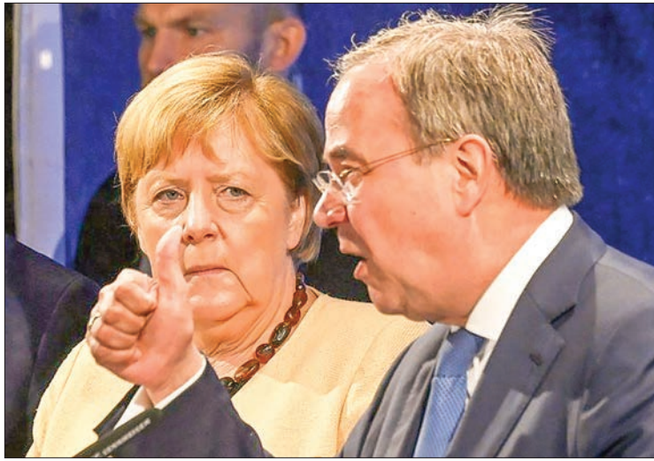
The conservatives lost the constituency Angela Merkel (L) had held since 1990.