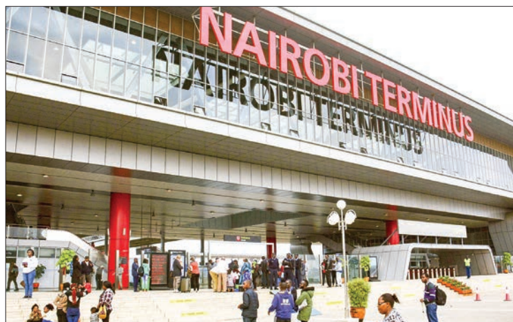
File photo taken in August 2018 shows a railway station in Nairobi that was constructed with loans from China.

CHINA’S annual average spending on overseas development projects showed “a dramatic expansion” to $85 billion in the five-year period from 2013, far outpacing