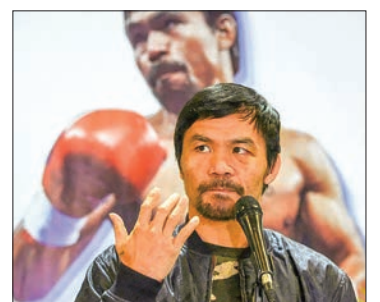
Philippine boxing icon Manny Pacquiao has retired from the ring.

Pacquiao, who entered politics in 2010 as a congress-