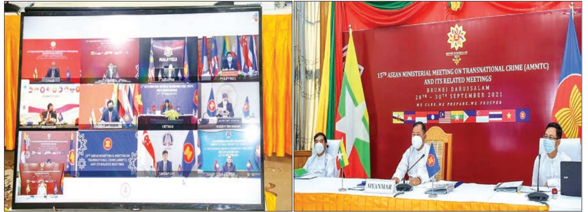
The MoHA Union Minister participates in the online 15 th ASEAN Ministerial Meeting on Transnational Crime (AMMTC) and its related meetings yesterday.

During the discussion, Myanmar AMMTC Leader, Union Minister for Home Affairs Lt-Gen Soe Htut said the need to eradicate terrorism so that there will be no opportunity for violence in the field of transnational crime; the need to cooperate in various sectors to prevent terrorism as violence, arms smuggling, illegal drugs and human trafficking are interrelated. He added that extremist ideologies are developing as false news spreads significantly faster than true news with the advancement of technology, and it is necessary to increase the efficiency of information exchange and border management in the region. He suggested establishing and implementation of a cyber-security and technology cooperation programme in the ASEAN region, as it has become easier to incite violence on the cyber