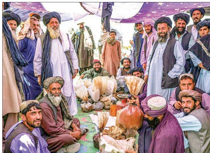
Opium vendors and buyers chat over green tea around sacks of opium and hashish.

Since the Taliban overran Kabul on 15 August, the price for opium — which is transformed into heroin either in Afghanistan, Pakistan or Iran before flooding the European market — has more than tripled. Masoom said smugglers are now paying him 17,500 Pakistani rupees ($100, 90 euros) per kilogramme. In Europe it has a street value of over $50 a gramme.—AFP ■