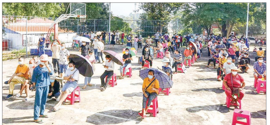
Chinshwehaw locals are seen waiting for inoculation following protective protocol against COVID-19.

COVID-19 immunization was carried out in Chinshwehaw, Kokang Self-Administered Zone, beginning from 28 September, and a total of 640 people — 343 men and 297 women—received first doses of COVID-19 vaccine. The immunization was carried out at the pre-primary school in the ward (1), and Kokang Literature School and people from three wards in