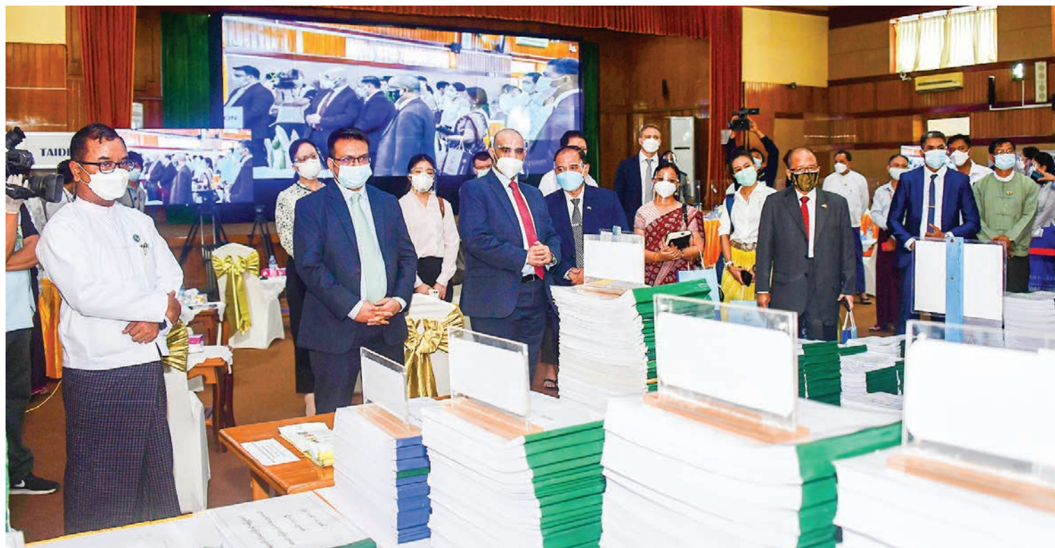
Representatives of international embassies are seen viewing around the documents and facts displayed at the State Administration Council's Information Team press conference 8/2021 in Nay Pyi Taw on 27 August 2021.

Efforts are ongoing to improve stability and peace, to address crises and rectify past mistakes. The trust and cooperation between the government and the people have contributed to the reduced impact of the third wave of COVID-19 in August. The people, the government and the Tatmadaw will need to continue working together for a better future, building national unity and writing a new democratic chapter in the history of the nation.