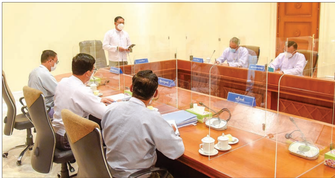
The SAC Central Committee on Ensuring Smooth Flow of Trade and Goods meeting in progress.

THE Meeting of the Central Committee on Ensuring Smooth Flow of Trade and Goods of the State Administration Council was held at the meeting hall of the Office of the State Administration Council yesterday afternoon.