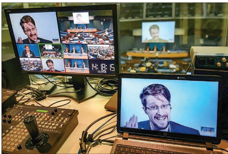
Former US National Security Agency contractor and whistle-blower Edward Snowden was forced into exile after leaking government secrets.

FOUR Sri Lankan refugees who hid Edward Snowden in their tiny Hong Kong apartments when he