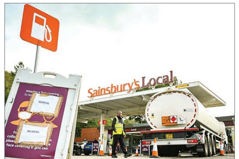
A lack of tanker drivers and panic buying has caused many filling stations to run dry.

shunned by Britons because of low pay and antisocial working hours. Britain has a shortage of about 100,000 lorry drivers,