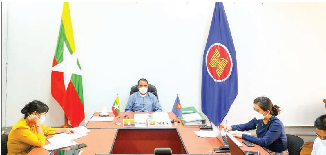
Myanmar delegation attends the 31 st ASEAN Senior Officials Meeting on Socio-Cultural Community.

THE 31 st ASEAN Senior Officials Meeting on Socio-Cultural Community was held on the morning of 28 September with a video