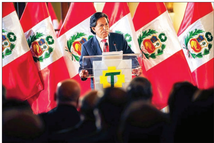
Alejandro Toledo during a press conference in Lima, Peru, in 2010.

A California federal court on Tuesday authorized the extradition of former Peruvian president Alejandro Toledo to