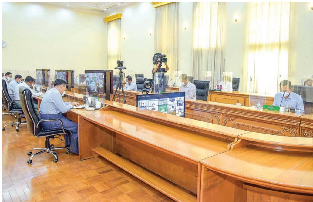
Chairman of State Administration Council Prime Minister Senior General Min Aung Hlaing delivers the address at the eighth coordination meeting for prevention, control and treatment of COVID-19.

The Ministry of Foreign Affairs issued a press release on 9 August strongly condemning the statement of the Permanent Representative of the United States of America to the United Nations issued on 8 August. The press release stated that the remarks of the US Permanent Representative had violated the principles of the Vienna Convention on Diplomatic Relations by making unfounded accusations against another UN Member State. U Kyaw Moe Tun had been dismissed as a civil servant under the prevailing laws and regulations of Myanmar and is currently under warrant of arrest for committing high treason and following the instructions of unlawful and terrorist organizations, the so-called Committee Representing Pyidaungsu Hluttaw (CRPH) and the so-called National Unity Government (NUG). The USA had not complied yet with Myanmar's request for the extradition of U Kyaw Moe Tun. Myanmar strongly condemns the US support for U Kyaw Moe Tun, which contravenes the ethics among the UN Member States. Moreover, Myanmar urged the