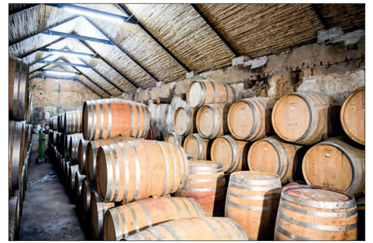
Photo taken on 21 Sept 2021 shows wine barrels in a wine cellar at Vondeling Wines in Paarl, Cape Winelands, South Africa. With traditional markets in Europe, the South African wine industry is now seeking to export more of its products to a developing market -- China, which has already become a focus market of South Africa.

Hosted by China Construction Bank Johannesburg Branch, the exhibition aims to promote ongoing cooperation between South African high-quality wine producers and Chinese importers.—Xinhua ■