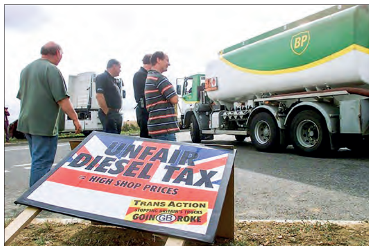
In late 2000, anger over high fuel prices and the government's refusal to waive or reduce duty triggered a blockade of oil refineries, bringing the country to a virtual halt.