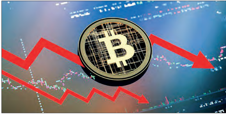
The global values of cryptocurrencies including Bitcoin have massively fluctuated over the past year partly due to Chinese regulations.

CHINA'S central bank on Friday said all financial transactions involving cryptocurrencies are illegal, sounding the death knell for digital currencies in China after a crackdown on the volatile trade.