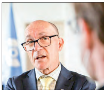
Robert Floyd is the head of the Comprehensive Nuclear-Test-Ban Treaty Organization.

Since 24 September 1996 there have been only a few dozen tests, carried out by India, North