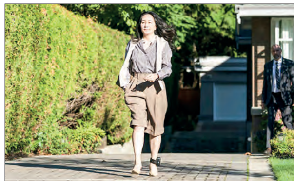
Huawei CFO Meng Wanzhou walks out of her home on 28 September 2020 in Vancouver, Canada.

withdrew its request that Meng be extradited from Canada.—Kyodo ■