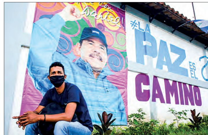
Nicaragua's long-time President Daniel Ortega will take part in a presidential election with all his main rivals under arrest.

The president accuses those arrested of seeking to overthrow him with US backing. — AFP ■