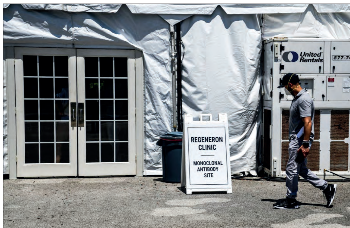
Monoclonal antibody treatments use COVID survivors' own antibodies.

The Regeneron cocktail of synthetic antibodies — casirivimab and imdevimab — has been