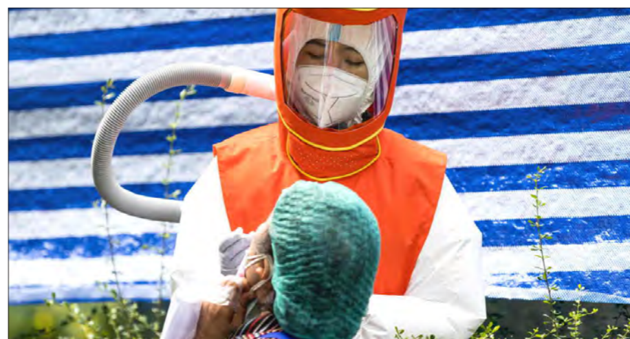
A health worker wearing personal protective equipment (PPE) administers a COVID-19 coronavirus nasal swab during a round of testing of workers outside a market in Bangkok on 4 September 2021.

tral Europe, Africa, Asia, Israel, Canada, El Salvador, Belize — cases are increasing exponentially, so we can't say the pandemic is behind us," he said.