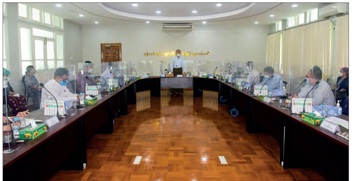
The MIFER Union Minister holds talks with the responsible personnel from the Myanmar Fertilizer, Seed and Pesticides Entrepreneurs Association yesterday.

After that, the Union Minister initiated a meeting with responsible personnel from the Myanmar Fertilizer, Seed and Pesticides Entrepreneurs Association and discussed matters regarding the productivity of fertilizers, facilitation of investment activities for fertilizer