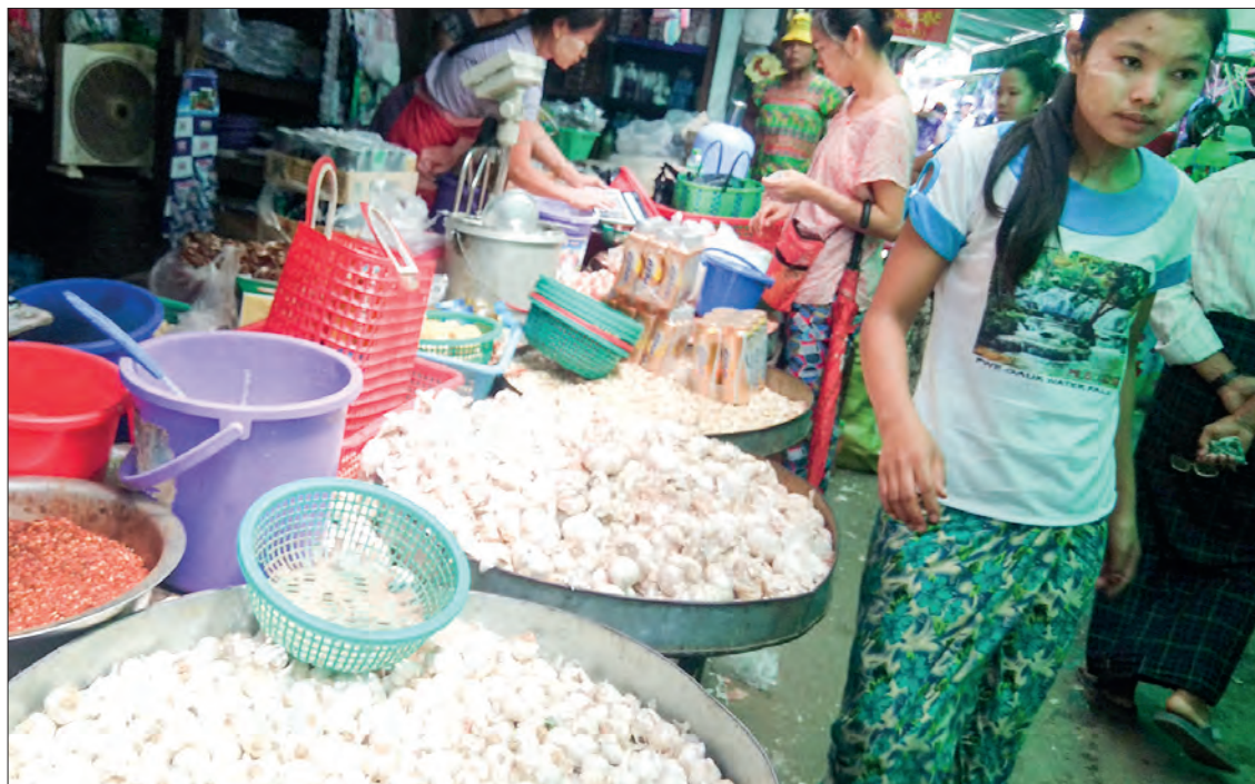
Based on their size and quality, the prices of garlic (Kyukok) vary from K2,650 to K2,750 per viss (3.6 pounds) in the local market. The garlic price has increased by K250 per viss in a week.

THE price of garlic (Kyukok) has increased within a week in the local market because of the high demand by the local consumers, according to the online and offline garlic markets.