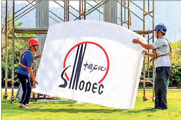
Workers change the billboard at a Sinopec gas station in Fuzhou, Fujian province.

HOW many carbon emissions will be generated if 30,000 metric tons of crude oil, mined from Angola, West Africa, is transported all the way to China, made into refined oil products, and finally burned by ter-