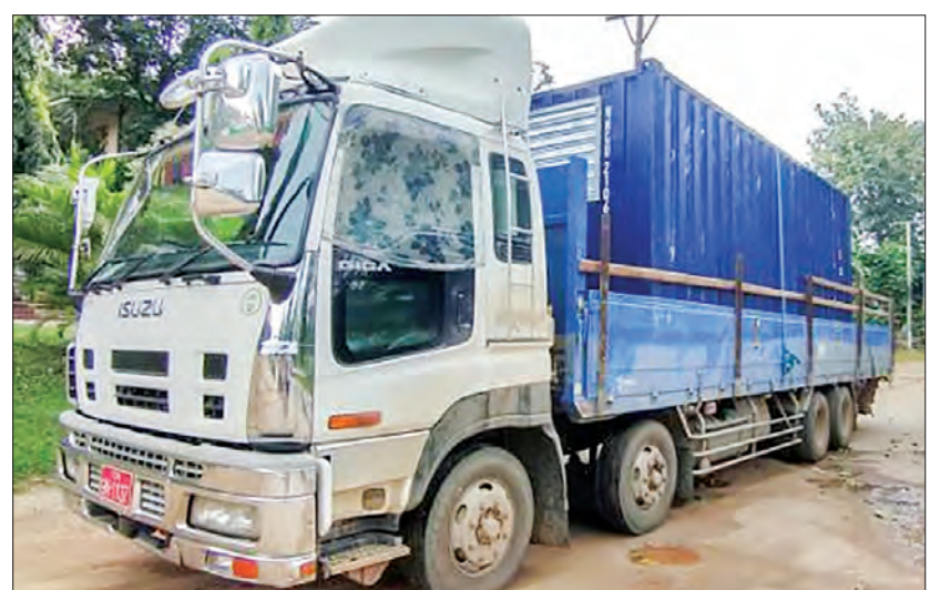
A lorry is seen transporting the imported COVID-19-related devices to the needed areas.