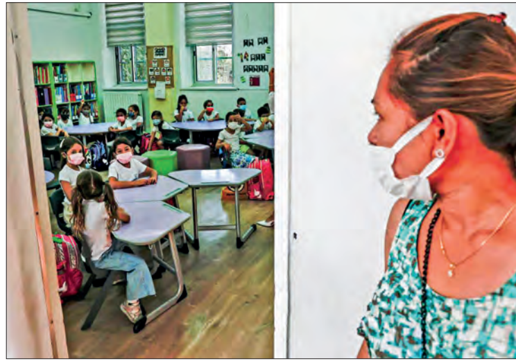
A woman looks at Israeli pupils wearing protective face masks upon their return to the new school year amid a surge of Covid-19 cases in Israel, at Beit Hakerem elementary school in Jerusalem, on 1 Sept 2021.

Under the instructions of the ministry, the teachers of schools and kindergartens who do not meet these conditions will not be paid for the days of absence, nor will they be allowed to teach remotely through Zoom.—ANI ■