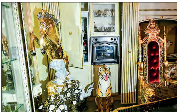
The villas revealed the ‘eccentric aesthetic taste’ of a clan of particularly fierce loan sharks with a penchant for bling.