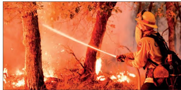
A US power company whose cables sparked a devastating California fire that killed four people has been charged with manslaughter, prosecutors said Friday.

"Their failure was reckless and was criminally negligent, and it resulted in the death of four