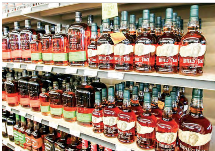
Bourbon bottles are seen on a liquor store shelf in Louisville, Kentucky in June 2018.

FIRST it was computer chips, and now spirits: Global supply chain woes are shaping up as the party pooper in some parts of the