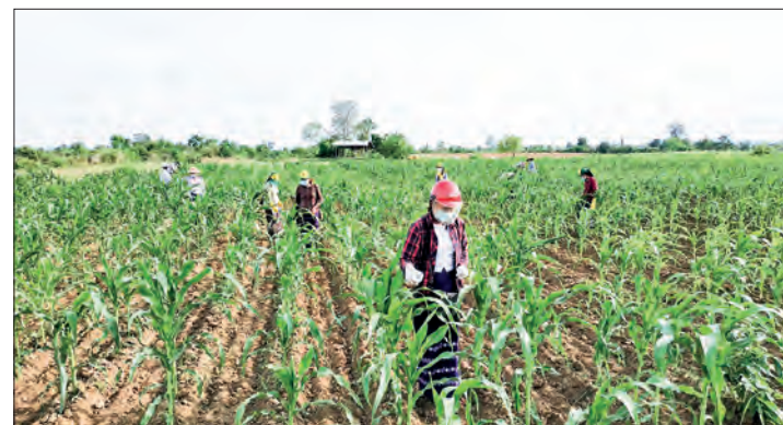
Myanmar is the second-largest exporter of maize among regional countries. At present, maize is cultivated in Shan, Kachin, Kayah and Kayin states and Mandalay, Sagaing and Magway regions.

During the last FY2019-2020, the country exported 2.2 million tonnes of maize to the external market, with an estimated value of $360 million, the Ministry of Commerce's data showed. — NN/GNLM