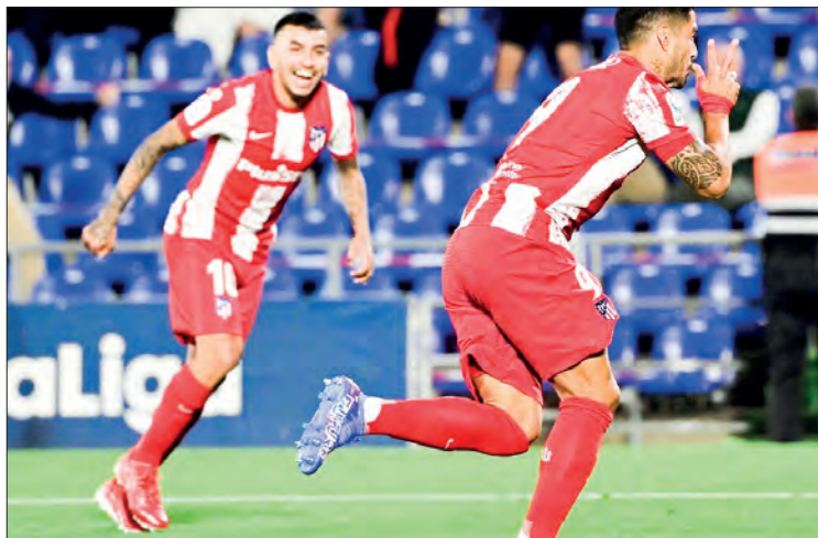
Angel Correa (left) and Luis Suarez (right) celebrate Atletico Madrid's late goal against Getafe on Tuesday.

Unlike Real Madrid and Barcelona, Atletico were bolstered not weakened in the summer transfer window, with Antoine Griezmann and Rodrigo de Paul arriving and the framework of last season's side left almost entirely untouched. —AFP ■