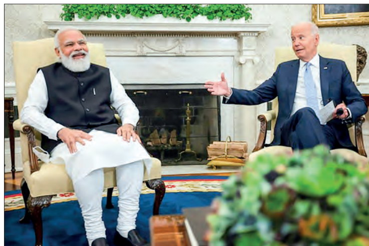
US President Joe Biden meets with Indian Prime Minister Narendra Modi in the Oval Office of the White House.

Khan spent much of his speech defending the record of Pakistan, which was the main