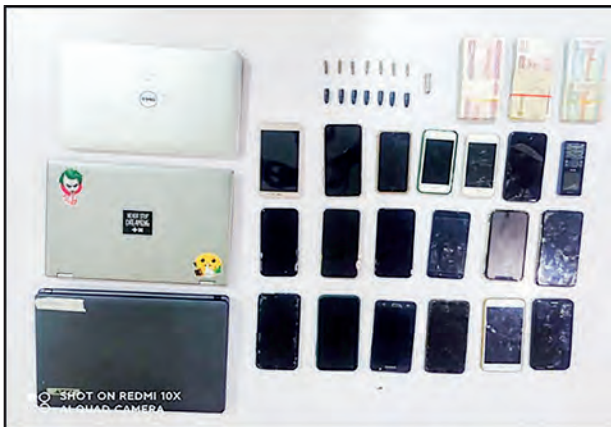
Seized ammunition and related materials in Mayangon Township.

The arrested terrorists will be taken effective action under the law and the people are requested to work together in the fight against terrorism in the country. It is also reported that those who report information about them will be kept confidential and rewarded covertly.