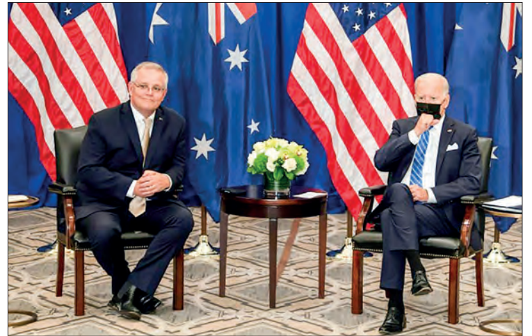
Australian Prime Minister Scott Morrison meets with US President Joe Biden at the UN ahead of a Quad regional meeting in the White House.

The other two are the Five Eyes intelligence-sharing alliance, comprising Australia, Canada, New Zealand, the United Kingdom and the United States, and the newest arrival on the block -- AUKUS.—AFP ■