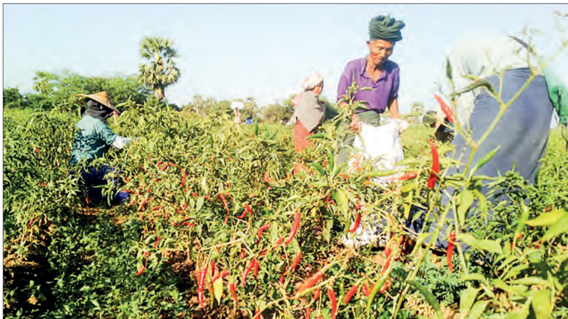
Although Myanmar fresh chilli is currently exported to Thailand and China, the major border checkpoints between Myanmar and China were halted starting from 8 July. Consequently, the chilli supposed to be sent to China was exported to Thailand through the Myawady border post.

Moreover, the fresh chilli to Thailand via cross-border trade sharply dropped this year.