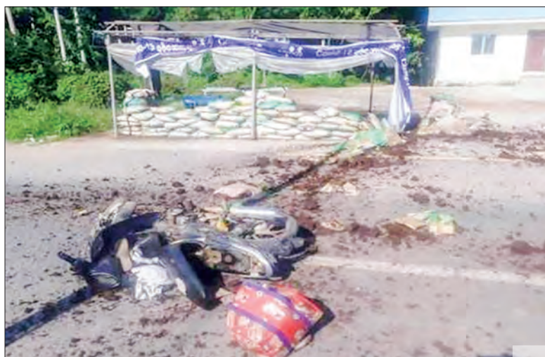
Damages are seen after the manmade bomb blast in Patheingyi Township.

The arrested suspects will face legal actions under the law. Security forces will also investigate to arrest the absconders. Moreover, announcements are also released that the entire people can participate in the fight against terrorism in order to arrest perpetrators as quickly as possible, confidentially report to the officials about their hiding places and activities, and the whistle-blowers and those who help arrest the suspects will be covertly rewarded.