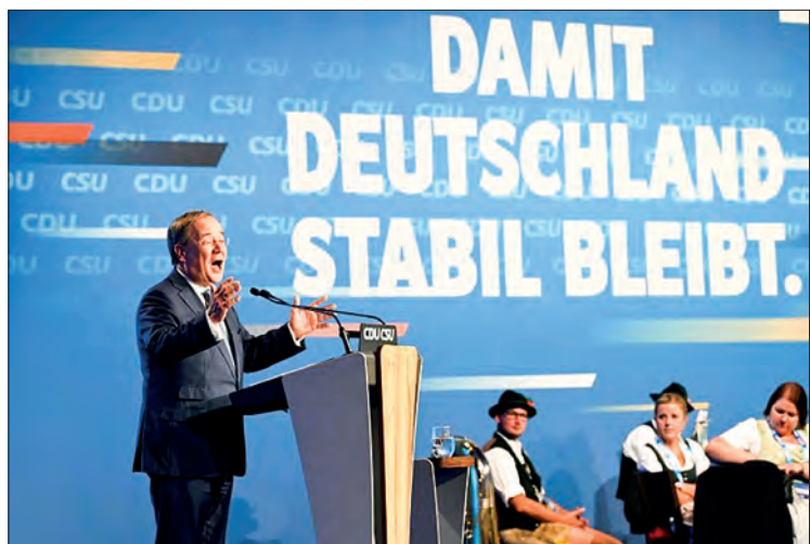
'To keep Germany stable, Armin Laschet must become chancellor,' Merkel said, referring to the conservative Christian Democratic Union (CDU) leader.

CHANCELLOR Angela Merkel travels Saturday to Aachen, hometown of her would-be successor Armin Laschet, in a last-ditch push to shore up his beleaguered campaign 24 hours before Germans vote.