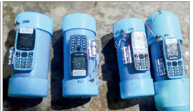
Confiscated manmade bombs in South Okkalapa Township.