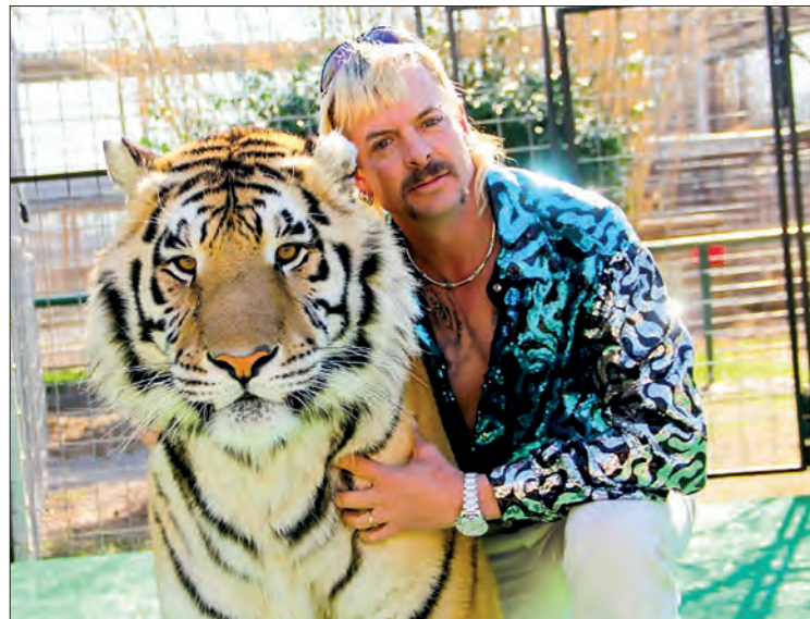
"Tiger King 2" will apparently feature Joe Exotic phoning in from prison where he is serving time for attempted murder.

The trailer for the sequel series includes a billboard asking "Who murdered Don Lewis" and offering a $100,000 reward for information about the fate of