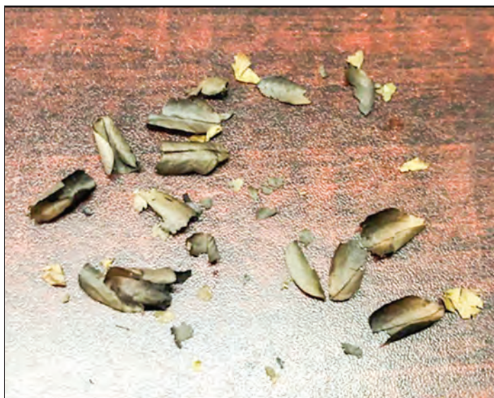
An act of vandalism with leaves.

put leaves in the pitot tubes of flight number XY-AMN and XY-AMP.