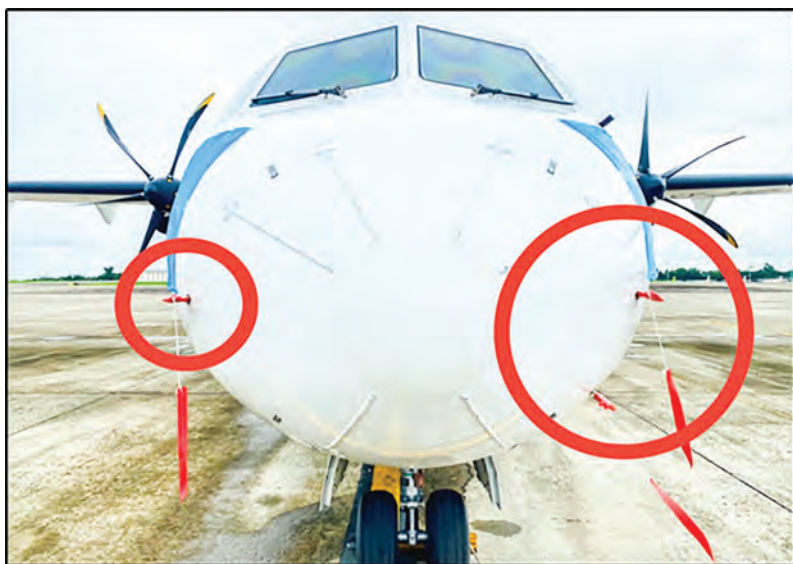
Pitot tubes or pitot probes (circled in left photo).