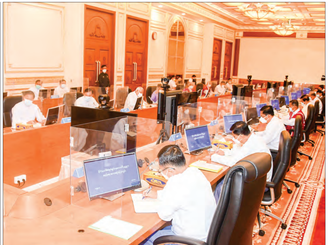
State Administration Council Chairman Prime Minister Senior General Min Aung Hlaing addresses the SAC meeting 15/2021 in Nay Pyi Taw on 24 September 2021.

POLITICIANS whose ideologies are diverse for the peace need to cooperate with each other through correct attitude over the multiparty democratic system, said Chairman of the State Administration Council Prime Minister Senior General Min Aung Hlaing at the meeting 15/2021 of the State Administration Council at the Office of SAC Chairman in Nay Pyi Taw yesterday afternoon.