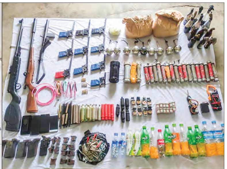
Seized firearms and related materials in Dagon Myothit (Seikkan) and Dagon Myothit (South).

tember together with 2 homemade guns, 23 9MM bullets and 1 homemade mine.