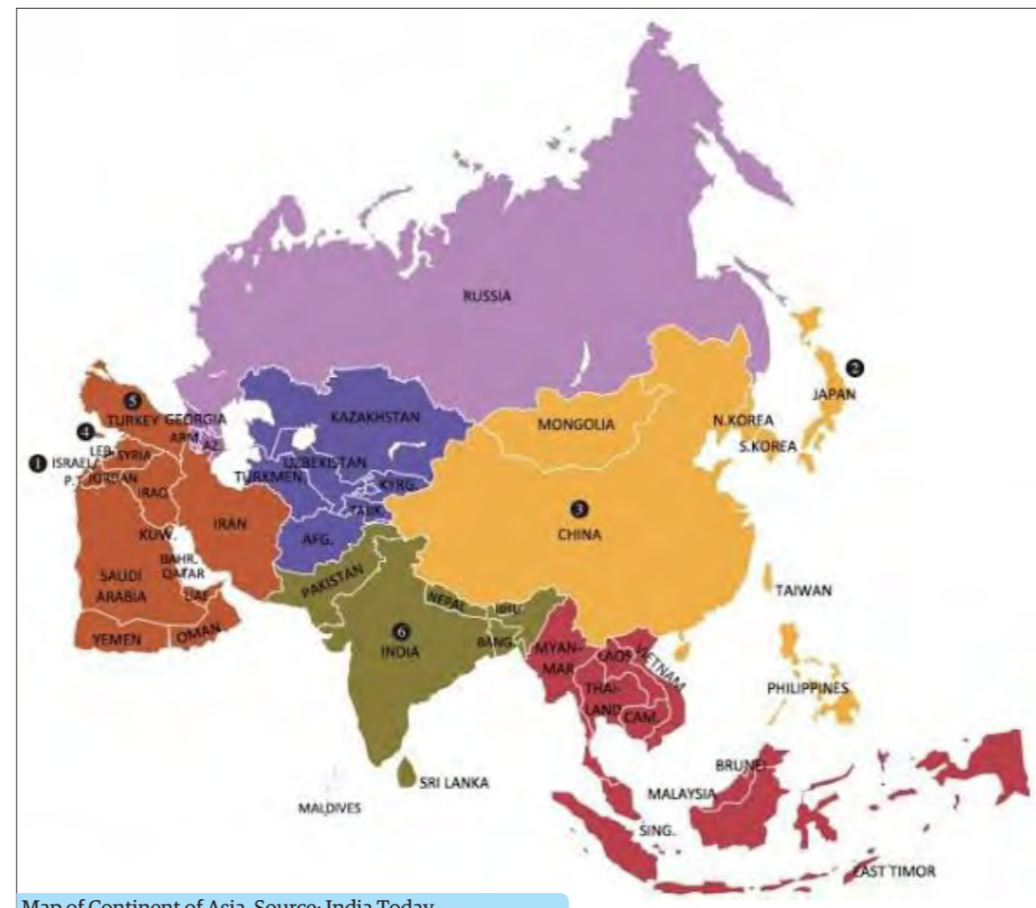
Map of Continent of Asia.

such as Ancient Sumer and the ancient Assyrian, Babylonian, and Akkadian empires. Meanwhile, the Indus Valley Civilization (or Harappan Civilization) was the first known civilization formed in South Asia, and in East Asia, the Xia Dynasty would be the first recorded account of Ancient China.