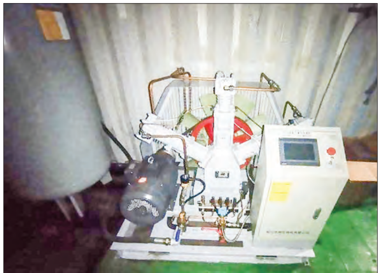
Anti-Covid medical aids are imported daily through land borders.

THE Ministry of Commerce is making efforts to ensure people have access to the essential medical supplies that are critical to the COVID-19 prevention, control and treatment activities, including liquid oxygen and oxygen cylinders, by arranging continuous importation through trading posts, international airport and seaports with standard operating procedures.