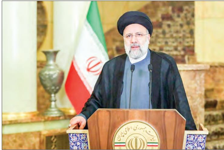
A handout picture provided by the Iranian presidency on 21 September 2021 shows Iranian President Ebrahim Raisi addressing the 76th Session of the UN General Assembly from Tehran.

"We're pretty much prepared to return to Vienna to continue the talks. And the question is whether—and if so when—Iran is prepared to do that," Blinken