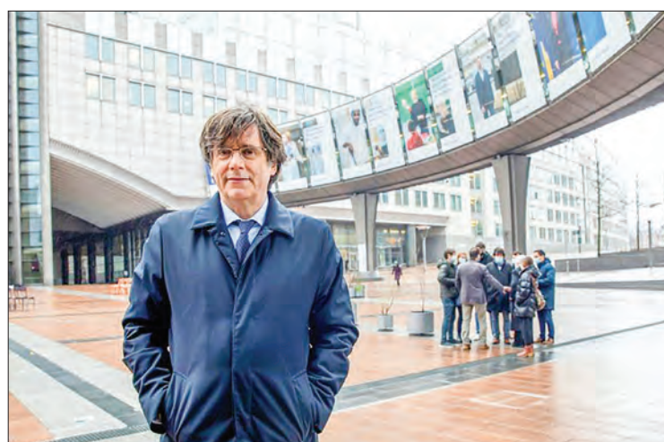
Former Catalan president Carles Puigdemont is wanted in Spain on allegations of sedition following an attempt to gain independence through a referendum.

Puigdemont, 58, is wanted in Spain on allegations of sedition over his attempts to have Catalonia break away from Madrid through the 2017 referendum.—AFP ■