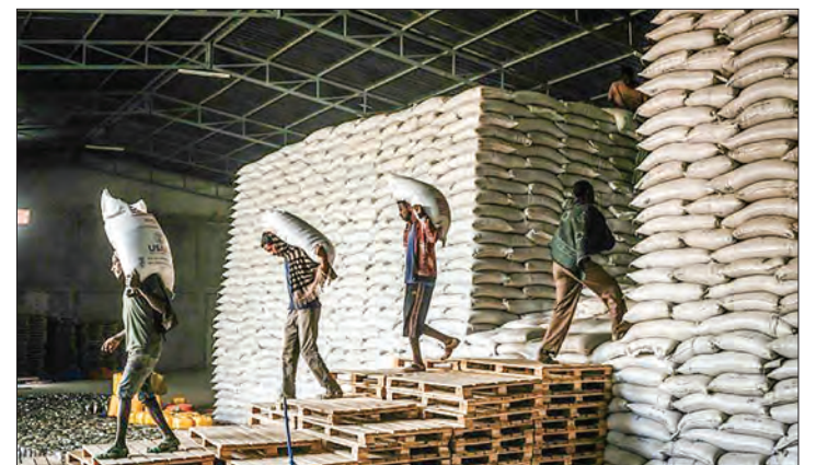
A de facto blockade is preventing most aid from reaching Tigray.

"We also agreed that there will not be any communication about the child's situation," Moran said.—AFP