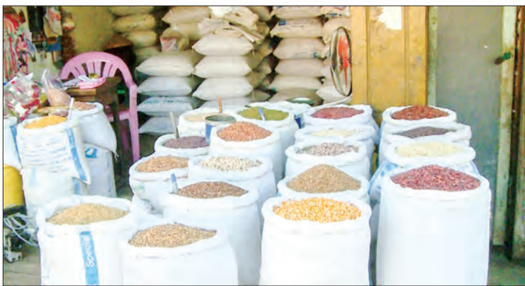
Although the black bean price on 1 September was K1,348,000 per tonne, the price jumped to K1,660,000 per tonne on 24 September, an increase of over K310,000 per tonne in over 20 days, according to the bean market data.

Other pulses including green gram and pigeon pea are grown in Africa and Australia in addition to Myanmar, according to Myanmar Pulses, Beans and Sesame Seeds Merchants Association. — NN/GNLM