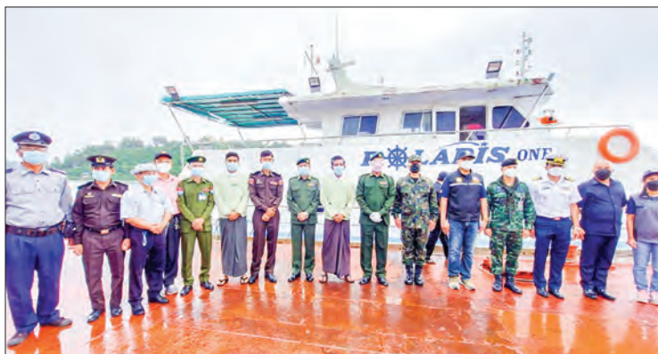
A handover event in progress.

The vessel carrying 24 people—22 Thais and 2 Myanmar nationals—was seized by the Myanmar Navy in Myanmar waters at about 14 nautical miles of Roe Bank Island on 7 November 2020. They were transferred to a coordination unit on 13 Novem-