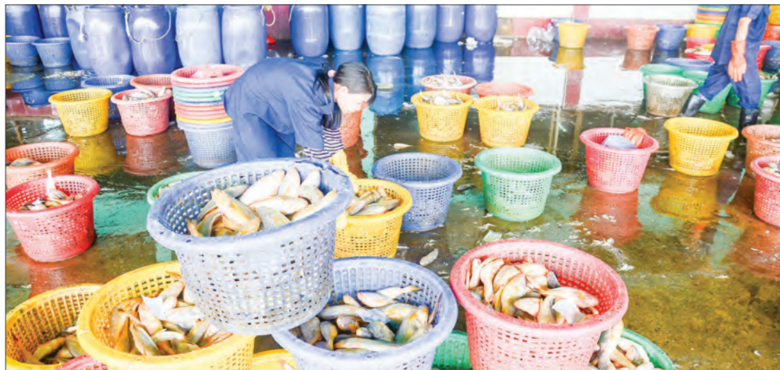
There are 480,000 acres of fish and prawn breeding farms across the country and more than 120 cold-storage facilities in Myanmar.

"If the border post resumes the trade activity, the trade will go smoothly. The closure of the border posts is triggered by the COVID-19 threats. The cross-border between Myanmar and Bangladesh is still open for trade. The federation is planning to export fishery products to Bangladesh. Myanma Port Authority is also ensuring smooth freight flow with non-stop operation. The federation is attempting to tackle this fishery export hurdles," said Dr