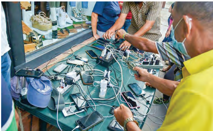
The EU is a massive market of 450 million people, and the imposition of the USB-C as a cable standard could have a decisive effect on the global smartphone market.

"We gave industry plenty of time to come up with their own solutions, now time is ripe for legislative action for a common charger," she said.—AFP