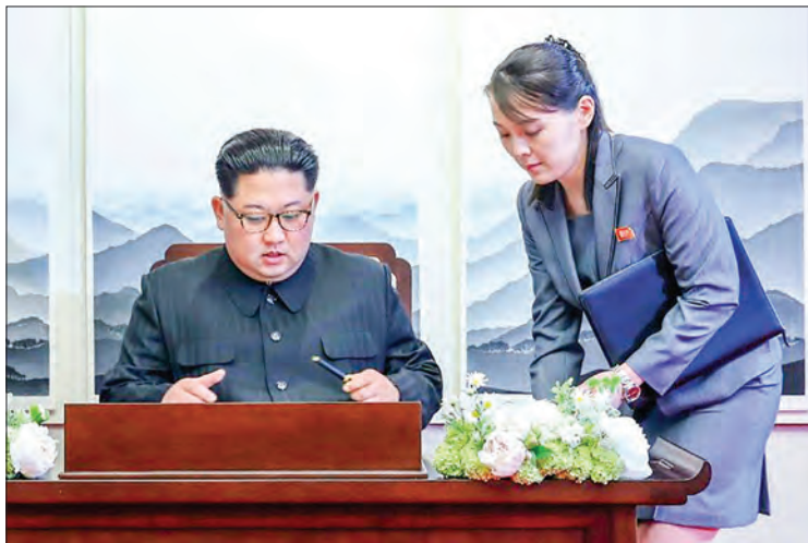
Kim Yo Jong (R) is a key policy adviser to her brother Kim Jong Un.

In a speech at the UN General Assembly earlier this week, Moon proposed the declaration of an end to the conflict that