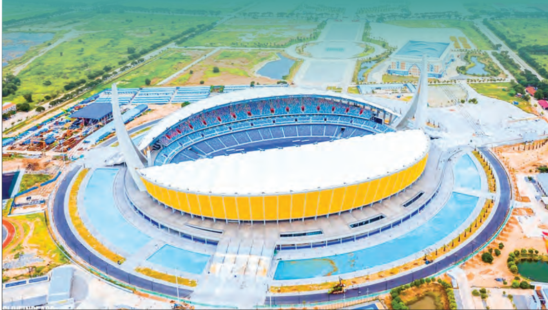
Morodok Techo Stadium in Cambodia, built for the 2023 SEA Games.

THE ASEAN Football Confederation (AFC) will reaffirm its host country for the ASEAN Suzuki Cup, which will run from 5 December 2021 to 1 January 2022.