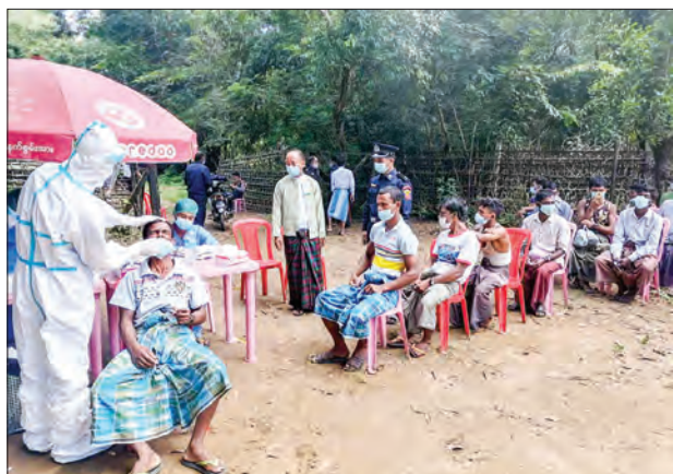
Covid tests are undertaken for locals and travellers in Sittway.

The test was free of charge and those diagnosed with COVID-19 have been sent to respective township hospitals for medical treatment, under the COVID-19 rules and regulations.