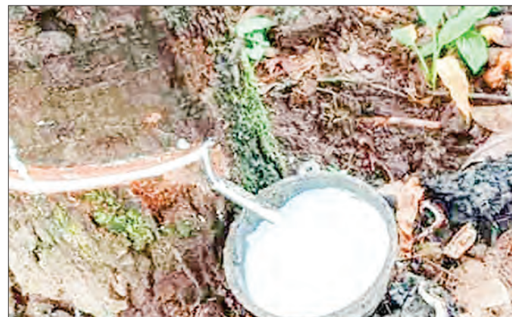
About 300,000 tonnes of rubber is produced annually across the country. Seventy per cent of rubber produced in Myanmar goes to China. It is also shipped to Singapore, Indonesia, Malaysia, Viet Nam, Korea, India, Japan, and other countries.

At present, Myanmar is exporting only rubber sheets owing to a lack of machinery and technology. Export rubber varieties include synthetic rubber, ribbed smoked sheet RSS 1,3,5, Myanmar Standard Rubber MSR-20, Technically Specified Rubber