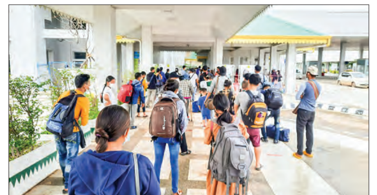
Returnees queue up for reception process at the Myanmar-Thailand Border Friendship Bridge, Myawady.

MYANMAR nationals from abroad are being welcomed back through various land borders, officials said.