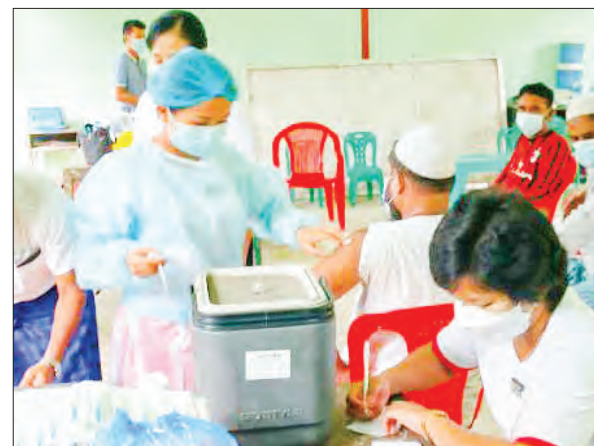
Inoculation is underway in Maungtaw Township.

only those with normal health conditions are vaccinated, officials said.