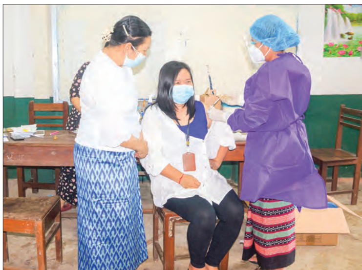
Health staff injects the first Covid vaccine shot to a media person.

A total of 1,970 people and more than 5,000 workers were vaccinated in Botahtaung Township in August. More than 1,900 people have been vaccinated in September, and of 7,900 staff from the city development committee, more than 2,500 staff have been vaccinated. It is also reported that the rest of the media persons will continue to be vaccinated.—Nyein Thu (MNA)/GNLM