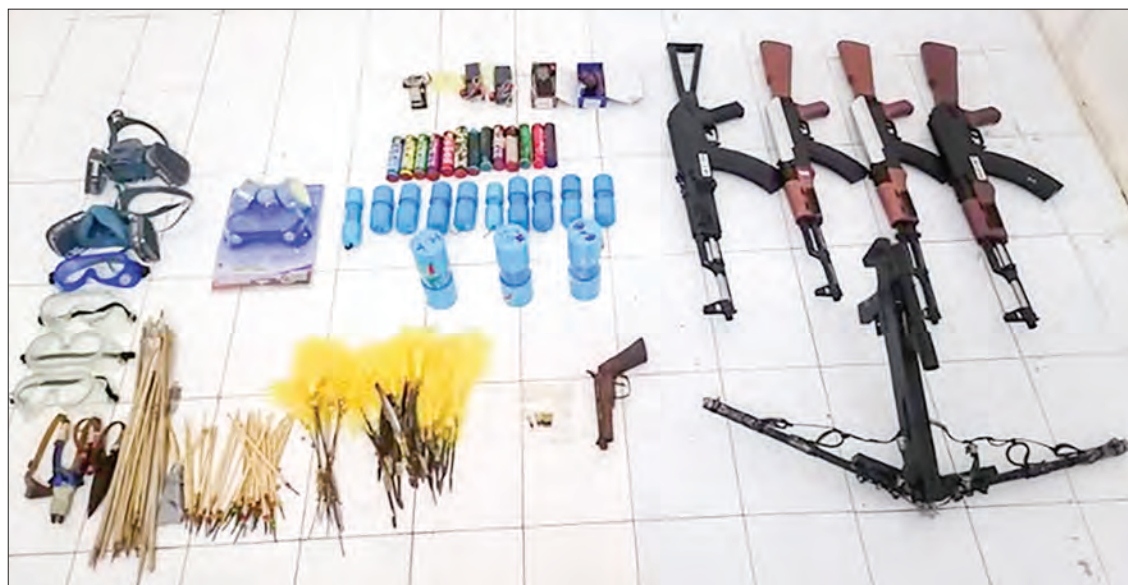
Confiscated weapons and ammunition in Mayangon Township.