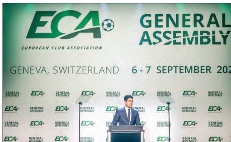
The ECA has nearly 250 members from across Europe with Paris Saint-Germain's Nasser al-Khelaifi its chairman.

THE European Club Association has said it is willing to “engage” with FIFA over potential changes to the international calendar but has hit out at world football's governing body for its attempts to