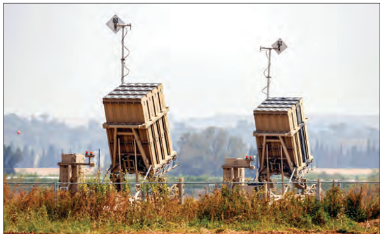
Iron Dome defence missile systems, designed to intercept and destroy incoming short-range rockets and artillery shells, are pictured in the city of Sderot, Israel, 24 April 2021.

US lawmakers green-lit $1 billion Thursday to resupply Israel's Iron Dome missile defence system after funding was controver-