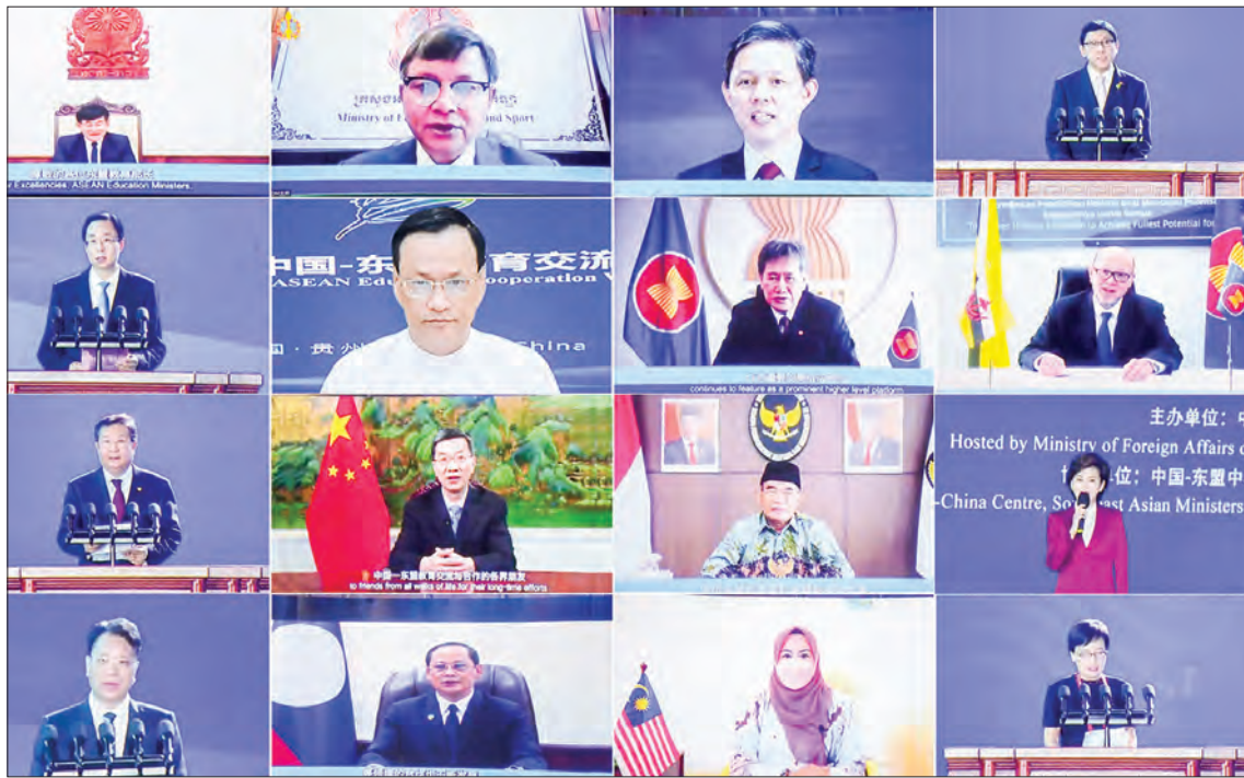
The China-ASEAN Education Cooperation Week 2021 commences online.

A series of activities covering higher education, and vocational education including medical science, agricultural science and business management, and engineering were focused on the event. Discussions of basic education school heads are also being held online from 24 to 26 September. —MNA