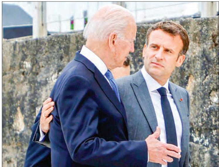
The call between Biden and Macron was the first slackening of tensions since the row broke last week.

US President Joe Biden and his French counterpart Emmanuel Macron had a "friendly" phone call Wednesday to defuse a deep row over submarine sales to Australia, promising to meet in person to repair the transatlantic relationship. The call, which the White House said lasted about 30 minutes, was the first between Biden and Macron since France recalled its ambassador over the