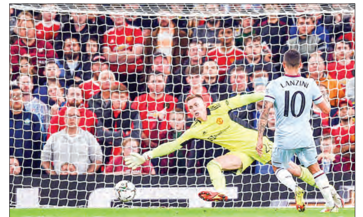
West Ham midfielder Manuel Lanzini scored against Manchester United.

It was also West Ham's first victory at Old Trafford since 2007, earning them a home tie against holders Manchester City in the last 16. —AFP ■