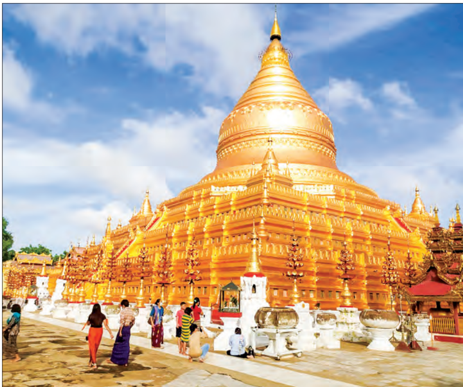
Worshippers are seen at one of the famous pagodas: Shwesigon Pagoda in Bagan.

The pilgrims from Heho, Tagaung, Taunggyi, Hopong, Natmauk, Magway, Bago, Pakokku, Kyaukpadaung, Yangon, Mandalay and Nay Pyi Taw cities visited the zone these days. Some came to Taungkalat Aba Aungminkhaung Nat Pwe (spiritual worshipping