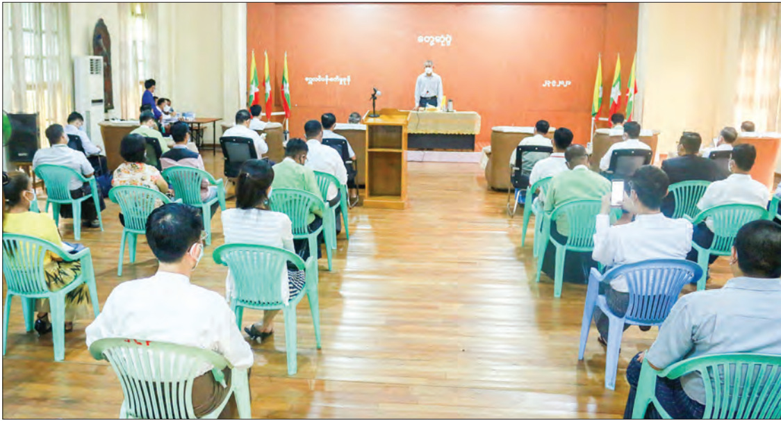
The MIFER Union Minister holds talks with business people in Hlinethaya Industrial Zone.

UNION Minister for Investment and Foreign Economic Relations U Aung Naing Oo visited the Anita Asia Company Limited, the garment industry operating in Yangon Region, North Okkalapa Township under the permission of the Myanmar Investment