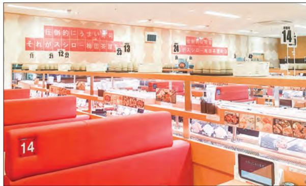
Supplied photo shows Food & Life Companies Ltd.'s Sushiro store in Osaka's Umeda area.

THE number of mergers and acquisitions involving Japanese firms is expected to hit a record