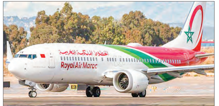
“The High Security Council has decided to immediately close the airspace to all civil and military aircraft as well as those registered in Morocco,” according to an official statement.

Relations between the neighbours have been tense for decades due to Algeria’s support for the Polisario Front, which demands a self-determination referendum in Western Sahara, while Morocco, which controls around 80 per cent of the desert territory, has offered only autonomy. The Algerian presidency said in a statement on Wednesday the decision had been made “to shut its airspace immediately to all civilian and military aircraft as well as to those registered in Morocco.” The decision was announced after a meeting of the High Security Council chaired by President