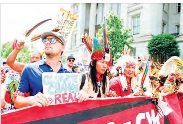
Actor Leonardo DiCaprio, shown here at a 2017 climate change march in Washington, has taken stakes in two alternative meat companies.

The Academy Award-winning actor will also act as an advisor to