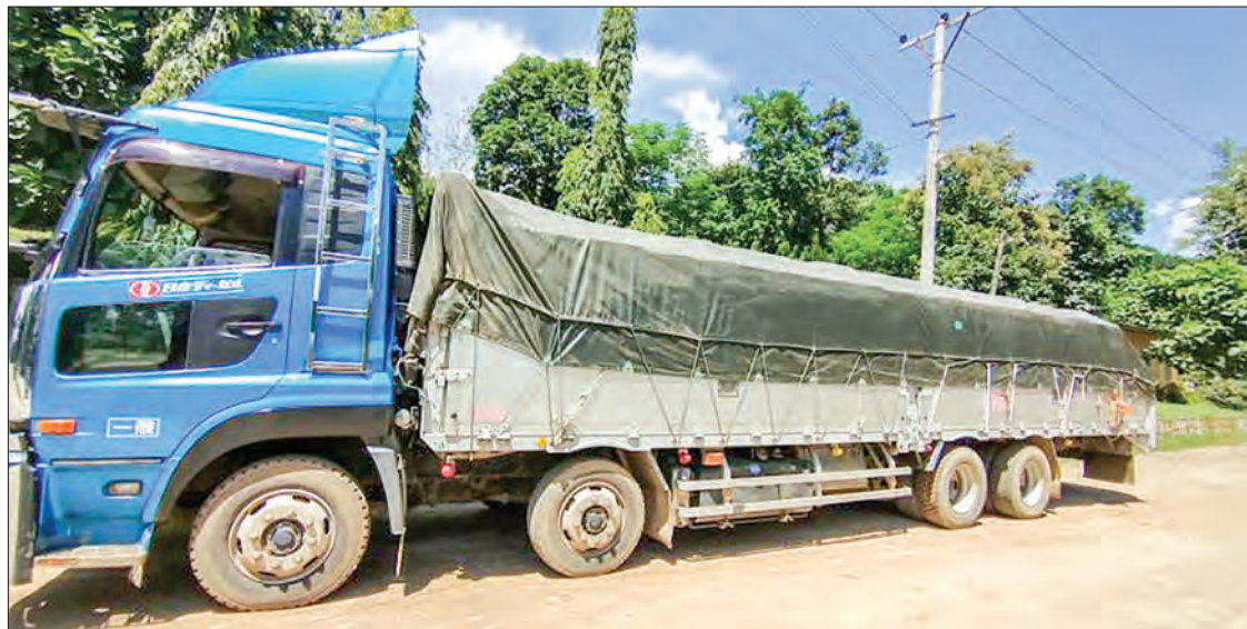
Anti Covid equipment and products are daily imported and transported to the needed areas.

A total of 20 tonnes of oxygen (liquid) carried by one