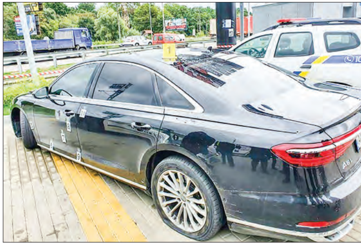
Photos published by officials showed a black Audi with bullet holes along its bonnet and on the driver-side door.

UKRAINIAN President Volodymyr Zelensky on Wednesday vowed a “strong response” after gunmen opened fire on a car carrying his senior aide, in what officials said was possible