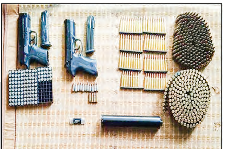
Confiscated weapons and ammunition.