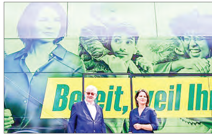
Germans are choosing a new government on Sunday.

"Of course, her departure leaves a void," Janis Emmanouilidis of the European Policy Center told AFP.— AFP ■