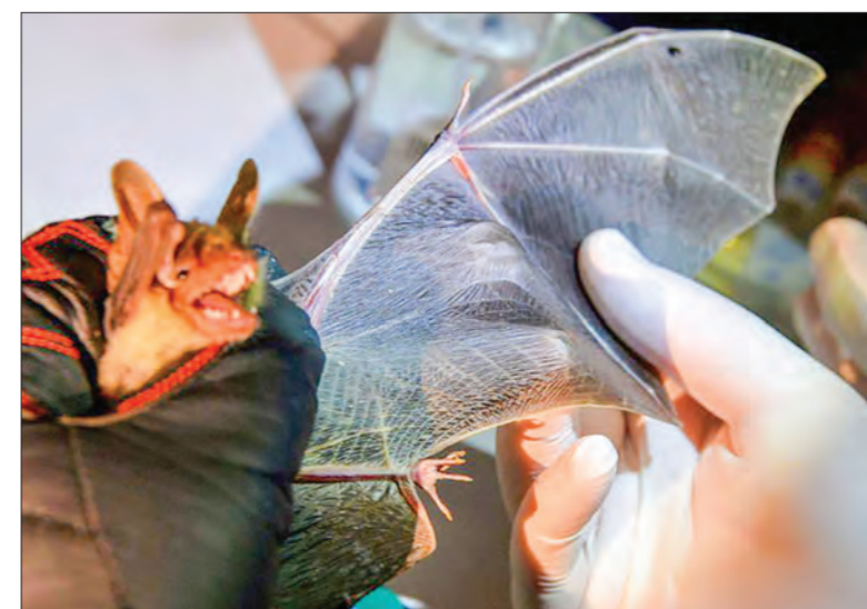
The researchers studied 645 bats from 46 species captured on four sites - in Fueng and Meth districts of Vientiane Province, and in Namor and Xay districts in Oudomxay Province - between July 2020 and January 2021. A chiropterologist checks the wing of a greater mouse-eared bat to determine its age, in Noyal-Muzillac, France.