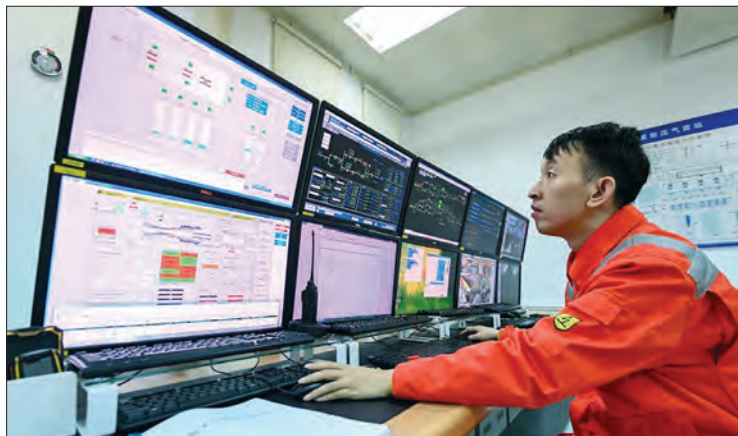
A regulating officer checks system parameters at the Horgos initial compressor station of the West Pipeline Company under China Oil & Gas Pipeline Network Corporation (PipeChina) in Horgos, northwest China's Xinjiang Uygur Autonomous Region, 4 Feb 2021.

With a total length of 2,090 km, the section runs from the city of Zhongwei in northwest China's Ningxia Hui Autonomous Region to the city of Ji'an in east China's Jiangxi Province. Once put into operation, the section would provide an additional 25 billion cubic meters of natural gas supply annually on top of the capacity provided via the existing pipelines of the country's west-to-east gas transmission project, said PipeChina, the construction com-