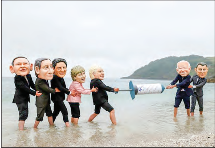
Activists have repeatedly called on the world's richest countries to waive intellectual property rights to vaccines.

COVID vaccine manufacturers are putting profit before lives, Amnesty International said on Wednesday, as it demanded two billion doses for poorer nations by the end of the year.