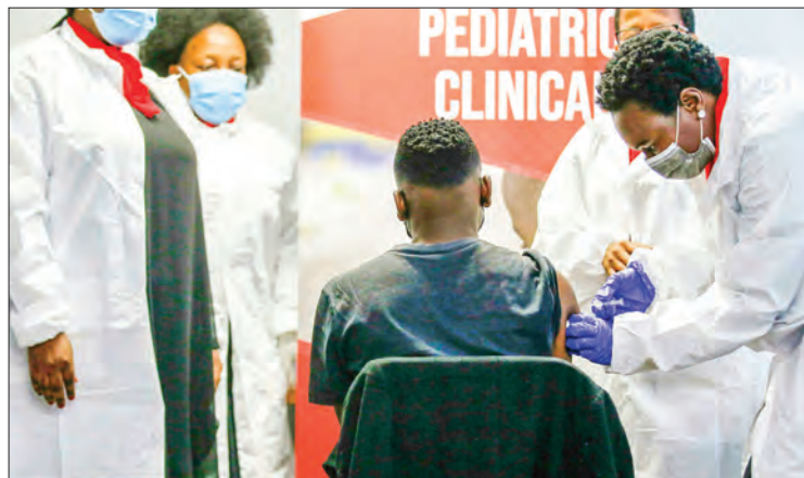
Just nine vaccine doses have been administered per 100 people in Africa, according to data compiled by AFP.

er wealthy countries have been criticized by the World Health Organization for their plans to roll out booster shots for elderly and high-risk populations, while much of the world faces a severe shortage in doses.