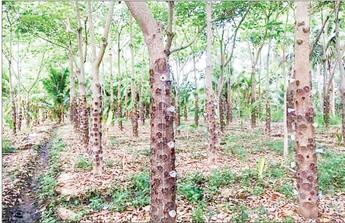
The Tragacanth Gum plants cultivation is mostly found in Ayadaw Township, constituting around 12,000 sown acres. The plant can thrive in different types of soil. The acreage of that tropical plant is expanded in the upland regions.

18,259 acres of plants in Monywa, 486 in Yinmabin, 3,571 in Shwebo, 893 in Kanbalu, 2,694