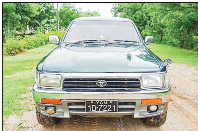
Seized vehicle (without licence).