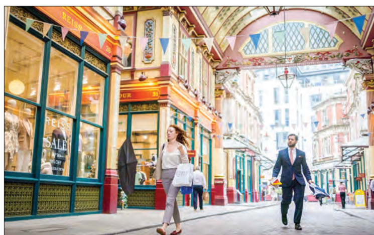
People walk past shops and restaurants at Leadenhall Market in the City of London, U.K., 27 July 2021.

THE Bank of England is expected to stay the course on interest rates and stimulus on Thursday, despite soaring inflation and fears of runaway domestic