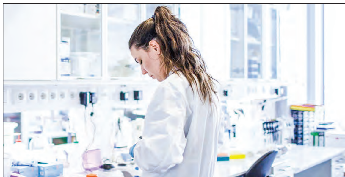
A researcher works on a vaccine against the new COVID-19 virus at the Copenhagen University research lab in Copenhagen, Denmark, on 23 March, 2020.

rea joined Switzerland, Sweden, the United States, and Britain, to make the top 5 of the GII for the first time in 2021, while four other Asian economies feature in the top 15: Singapore (8), China (12), Japan (13) and Hong Kong, China (14).