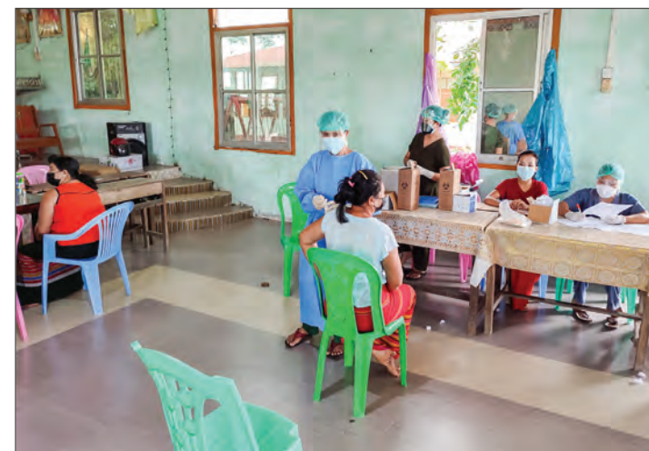
A local receives Covid jab in Paung.

During the first batch of the COVID-19 vaccine administration, a total of 9,158 people were vaccinated in Paung Township, according to the Township General Administration Department.