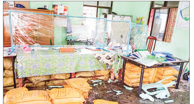
Mayangon administration body office is damaged by handmade bomb.

are also released that the entire people can participate in fight terrorism and arresting perpetrators as quickly as possible, secretly report to the officials about their hiding places and activities, and the whistle-blowers and those who help arrest the suspects will be covertly rewarded.—MNA