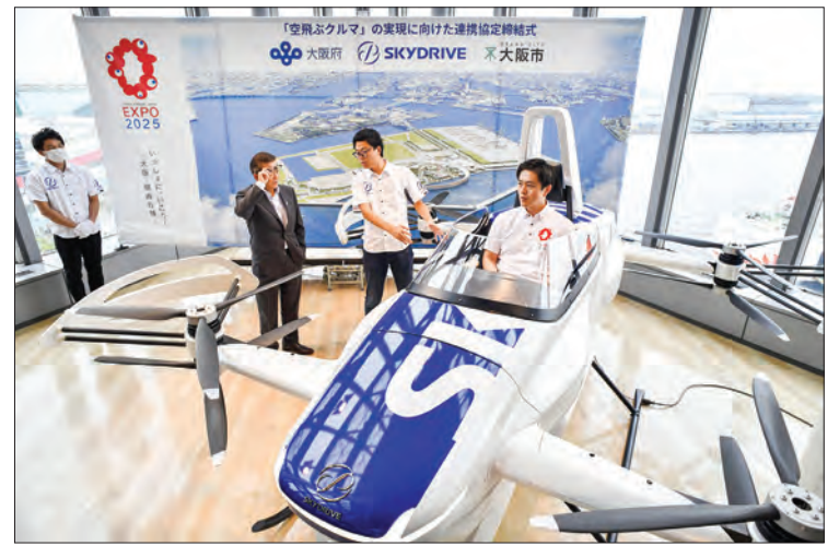
Osaka Gov. Hirofumi Yoshimura rides a full-scale "flying car" model of SkyDrive Inc. on 14 Sept 2021, in Osaka. The western Japan prefecture and city governments formed a partnership agreement with the Tokyo-based developer the same day to support the project to put it into practical use. Seen second from left is Osaka Mayor Ichiro Matsui and second from right is SkyDrive CEO Tomohiro Fukuzawa.

Osaka Gov. Hirofumi Yoshimura said this month he wants flying cars to begin carrying passengers in the Osaka Bay area in 2024, such as by shuttling the around five kilometres between Universal Studios Japan and the city's Yumeshima artificial island, the venue of the exposition.—Kyodo News ■