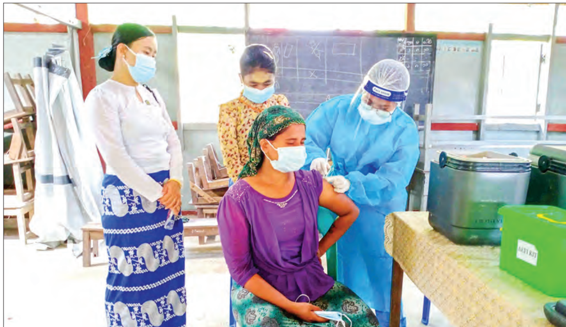
Inoculation process is underway in Kyaukphyu.

THE health workers vaccinated the people over 18 living at Kyauktalone IDP camp in Kyaukphyu Township of Rakhine State yesterday.