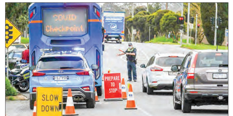
Australian police officers setting up checkpoints ahead of planned anti-lockdown protests in Melbourne, on 18 Sept 2021.

Clashes between riot police, armed with rubber bullets, and protesters that began on Monday again turned violent on Tuesday with demonstrators blocking central business district (CBD) roads, bringing traffic to a stand-still.—Xinhua ■