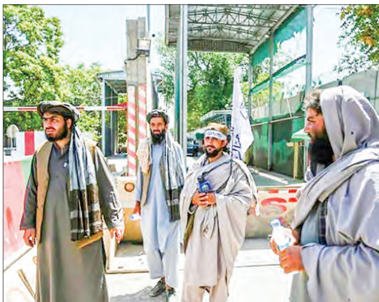
After coming to power in Afghanistan on 15 August, the Taliban had promised an inclusive government.

"I don't think anybody is satisfied with the composition of this interim government, including the Chinese," the official said.—AFP ■