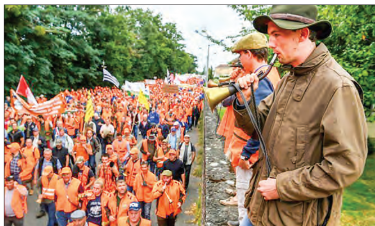
Protesters, pictured here in Redon, are up-in-arms against a ban on traditional techniques such as hunting with nets or bird cages.

THOUSANDS of hunters marched in France on Saturday to defend "rural values" and traditional bird hunting which the country's top administrative court has banned.