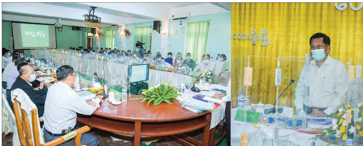
Chairman of State Administration Council Prime Minister Senior General Min Aung Hlaing meets Shan State cabinet members, officials of self-administered division and zones and officials.

In his speech, the Senior General pledged to fulfill the needs of agriculture and livestock sector, sports sector and boosting per-acre yield of tea and distribution of technique and quality strains reported in the meeting. As there are some 60,000 acres of tea plantations in Shan State, production of value-added tea products will create job opportunities for the