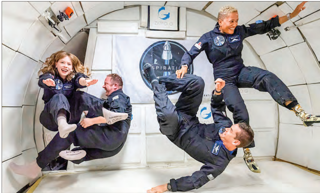
From left, Hayley Arceneaux, Chris Sembroski, Jared Isaacman and Sian Proctor, during a zero gravity flight to train for the Inspiration4 mission in July.

"That was a heck of a ride for us, and we're just getting started," billionaire captain Jared Isaacman, who financed the trip with a goal of making space a