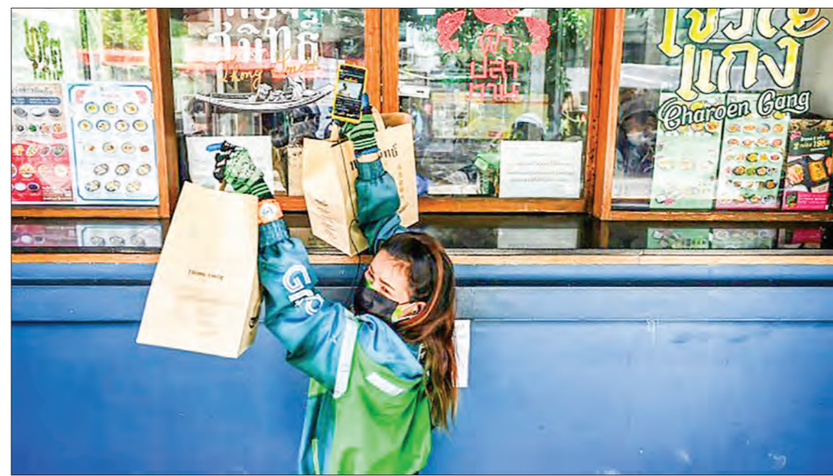
The global ghost kitchen industry is expected to grow more than 12 percent each year to be worth some $139.37 billion by 2028, according to a report by Researchandmarkets.com.