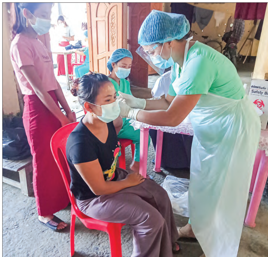
A health staff vaccinates a displaced person of IDP camp in MraukU Township.

OFFICIALS from the Township Public Health Department have been administering the Sinopharm COVID-19 vaccines to the displaced persons from five IDP Camps in MraukU Township, Rakhine State.