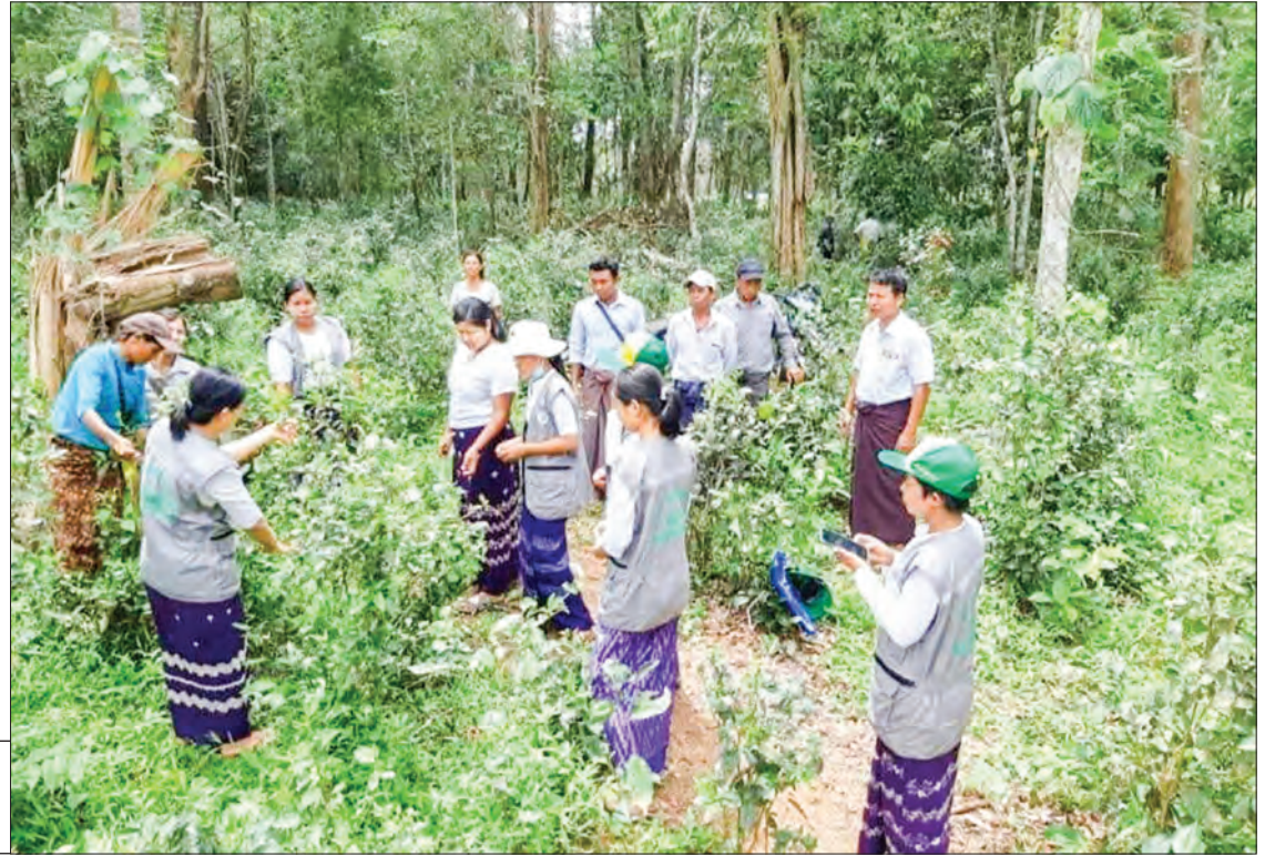
Staff of Agriculture department pick out tea leaves at the plantation.

The personnel from the respective township departments are providing technical assistance to increase the yield virtually and physically.