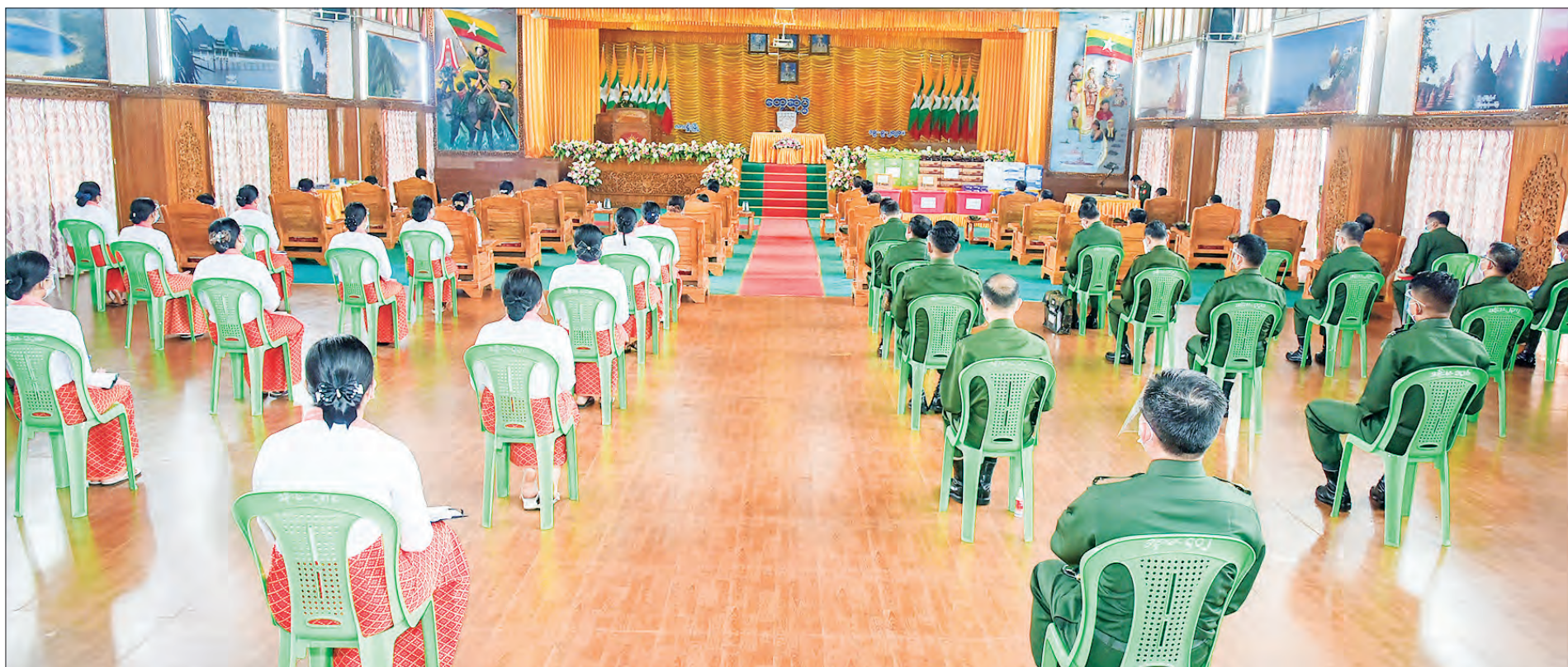
Chairman of State Administration Council Commander-in-Chief of Defence Services Senior General Min Aung Hlaing meets officers, other ranks and families of Lashio Station.

T HE Tatmadaw has been serving the State defence duty and the public interests since the successive eras till today, and it will continuously serving it in the future. As Shan State (North) is a primary home to many ethnic people, officers, other ranks and families need to solve the difficulties of the region together with local ethnic people, said Chairman of the State Administration Council Command-