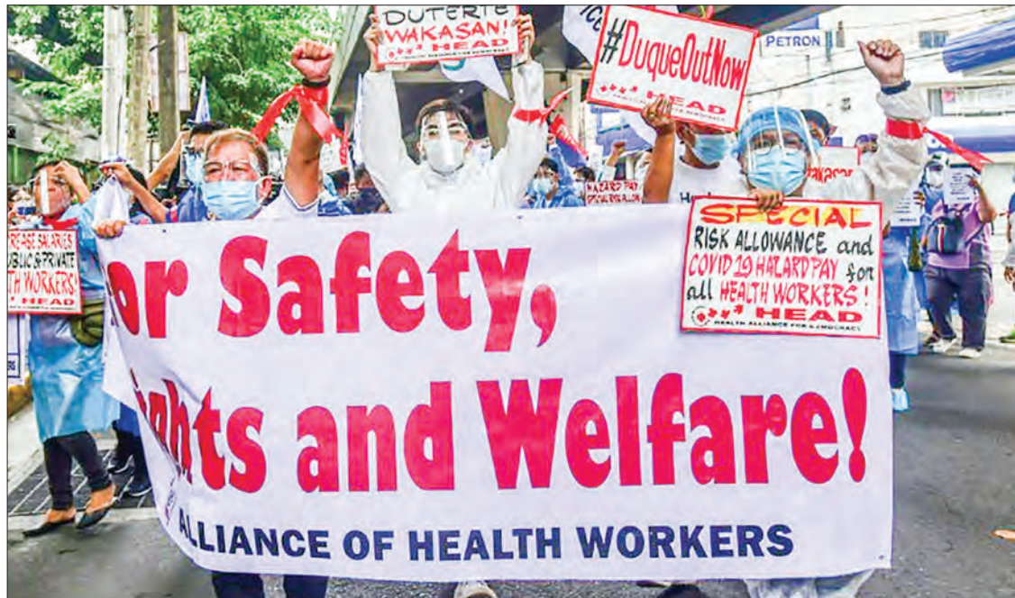
The pandemic has exacerbated a pre-existing lack of nurses in the Philippines.

The pandemic has exacerbated a pre-existing lack of nurses in the Philippines.