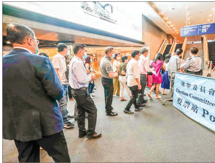
Election Committee candidates arrive at the polling station in Wan Chai.

VOTERS began to arrive early Sunday morning at the polling stations across Hong Kong to cast their ballots for the 2021 Election Committee Subsector Ordinary Elections, the first polls under the city's new electoral system.