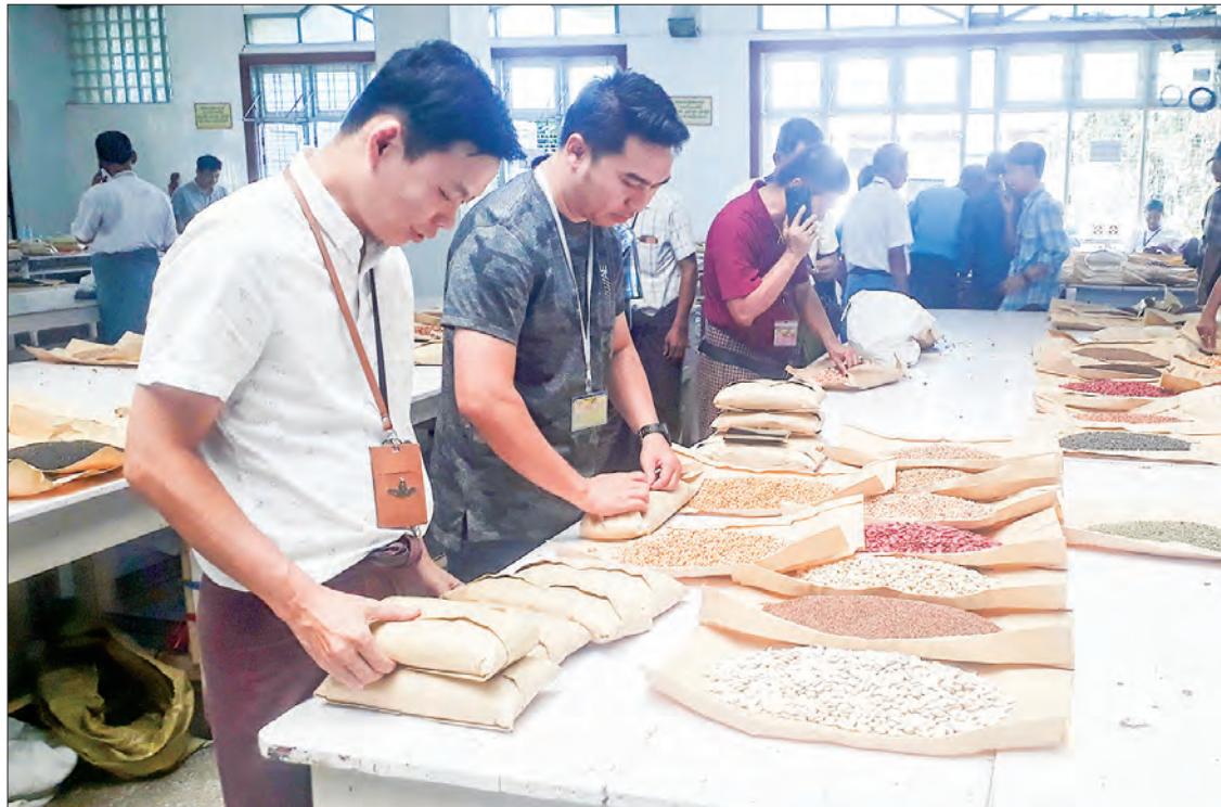
Merchants check sample butter bean at broketage.

THE exports of Myanmar’s butter bean to the international market exceeded 44,109 tonnes between 1 October 2020 and 10 September 2021 in the current financial year 2020-2021, generating revenue of US$25 million, as per the Ministry of Commerce’s data.