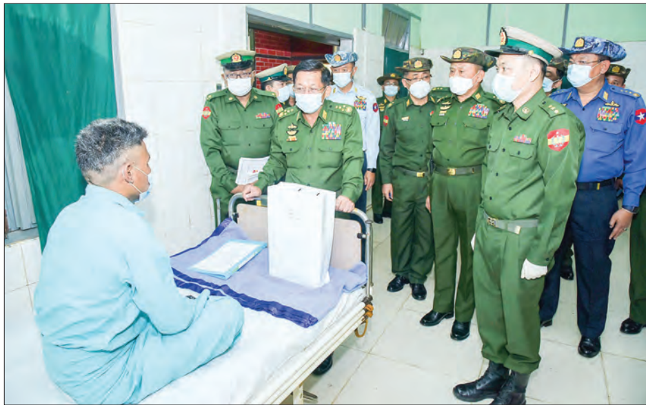
Chairman of State Administration Council Commander-in-Chief of Defence Services Senior General Min Aung Hlaing comforts a patient serviceman at military hospital.

As the reading power of an individual contributes much towards socio-economy, they need to read and train their children in order that they will not deviate from the path to education.