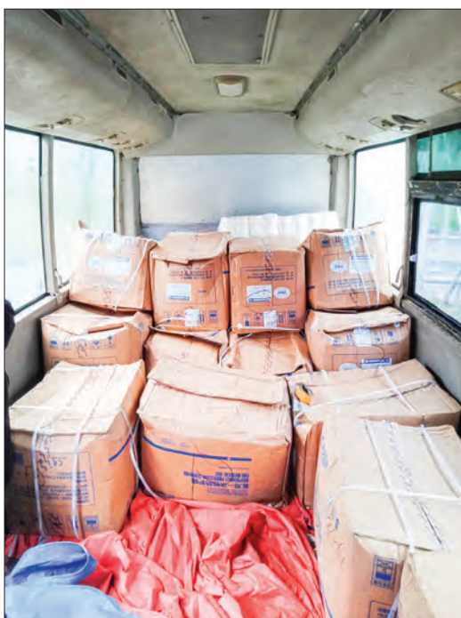
A cargo truck is filled with medical equipment.

It is reported that the Ministry of Commerce is coordinating with relevant departments, facilitating the importation of essential medical supplies required in prevention, control and treatment of COVID-19, as well as contact persons for inquiries can be reached through the Ministry's Website — www.commerce.gov.mm . — MNA