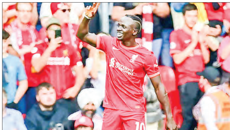
Liverpool forward Sadio Mane.

Mane's milestone strike came in his 224 th appearance for the Reds, breaking Palace's rearguard action late in the first half at Anfield. Egypt forward Mohamed Salah and Guinea midfielder Naby Keita netted in the second half to move Jurgen Klopp's team three points clear of second-placed Manchester City.