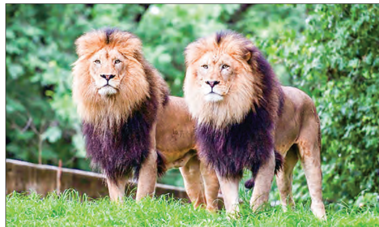
Two lions at the Washington zoo on 24 July 2020.

The bout of sickness comes as several US zoos including the one in Washington announced Tuesday the launch of a vaccination campaign for animals susceptible to Covid-19.