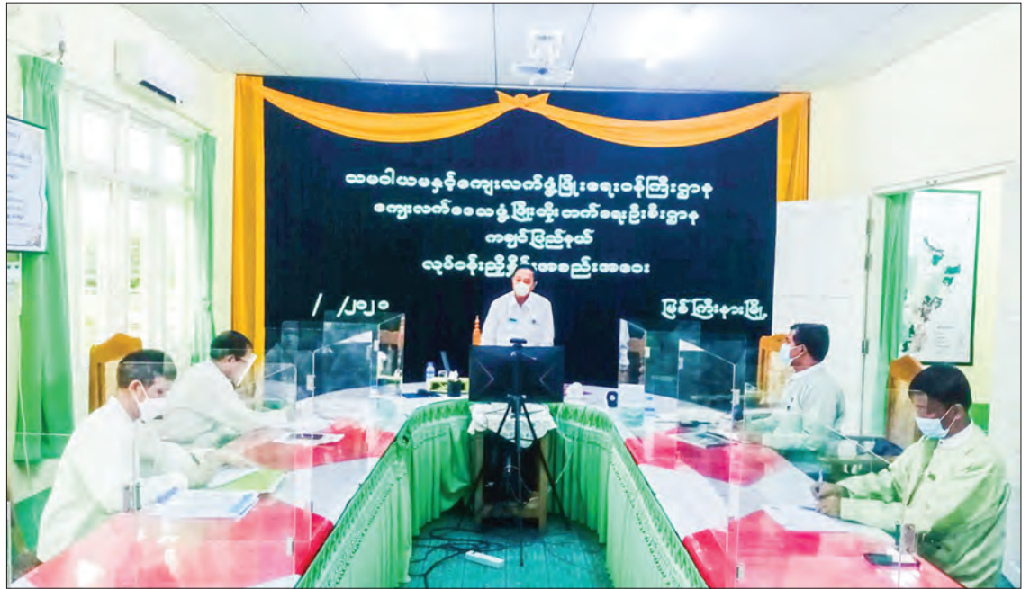
Union Minister U Hla Moe discusses development tasks and vocational training in meeting with department officials.

Then, the respective department heads reported on the regional development programmes.—MNA