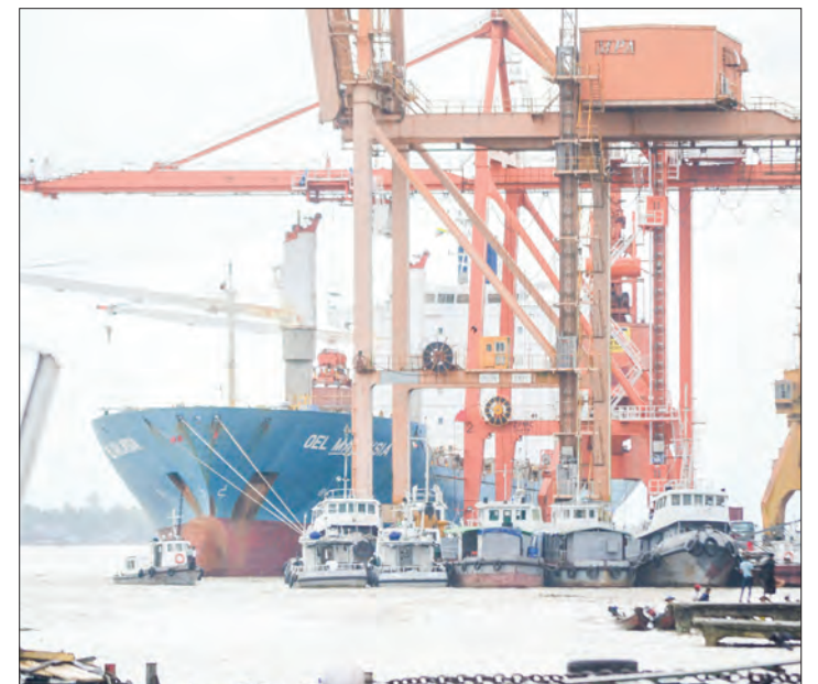
Freight handling process is seen at the port to load commodities onto vessel.

Myanmar’s bilateral trade with Singapore was registered at $3.5 billion in the last fiscal year 2018-2019, $1.99 billion in the 2018 mini-budget period, $3.83 billion in the 2017-2018 FY, $2.96 billion in the 2016-2017 FY, and $3.69 billion in the 2015-2016 FY.—KK/GNLM