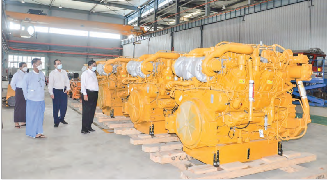
Union Minister for Industry Dr Charlie Than views round New Locomotive Assembling factory (Nay Pyi Taw)

During the tour, the in-charge of the plant explained facts related to the factory, manufacturing and assembling processes of new locomotives.