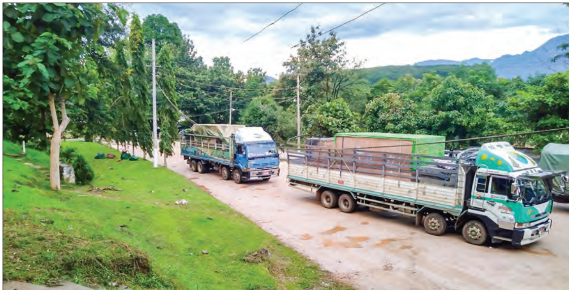
Cargo trucks are carrying medical equipment from Chinshwehaw.

THE Ministry of Commerce is striving for enabling the people to have access to the essential