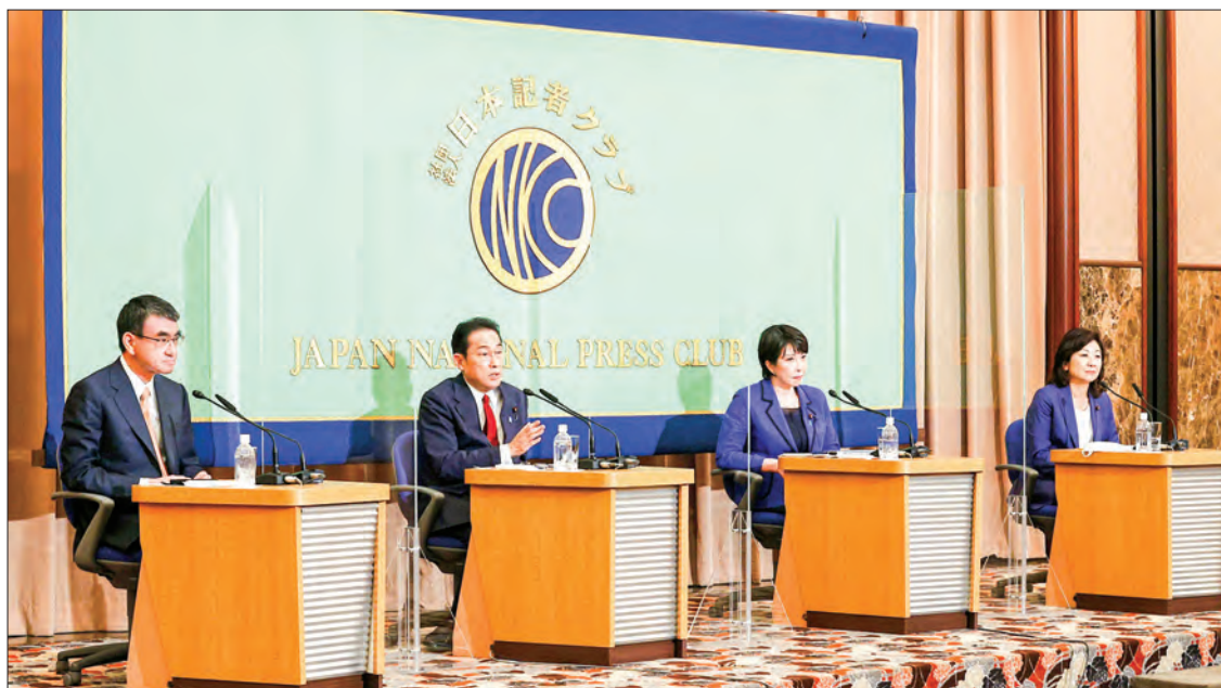
The four candidates running in the presidential election of Japan's ruling Liberal Democratic Party attend a Japan National Press Club-sponsored debate in Tokyo on 18 September 2021. The four -- (from L) vaccination minister Taro Kono, former Foreign Minister Fumio Kishida, former communications minister Sanae Takaichi and Seiko Noda, executive acting secretary general of the LDP -- are vying for the post currently held by Prime Minister Yoshihide Suga.

THE outcome of Japan's ruling party leadership race to choose the successor to Prime Minister Yoshihide Suga has become increasingly unclear as four senior lawmakers have joined the race, raising the possibility of a runoff.