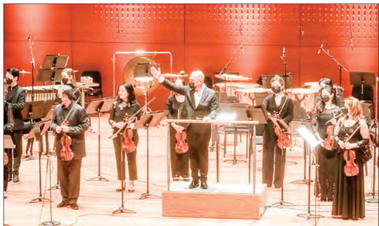
Friday's concert by the New York Philharmonic was a 'homecoming' for musicians limited to live streams, one-off and outdoor shows for more than a year.

FOLLOWING 556 days of pandemic-inflicted cancellations and unconventional concerts, the New York Philharmonic opened