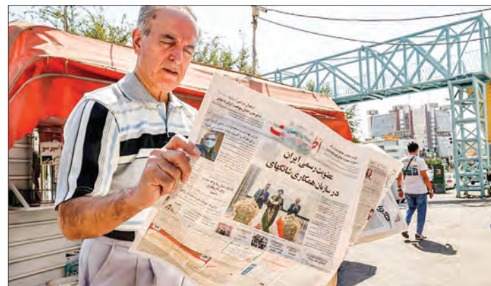
An Iranian man reads a copy of the daily newspaper "Etalaat" headlined, "Iran is a new member of the Shanghai Cooperation Organisation", at a kiosk in Tehran on 18 September 2021.

IRAN on Saturday hailed its acceptance into a China and Russia-led bloc, an eastward turn it sees as opening access to major world markets and a counter to crippling Western sanctions.