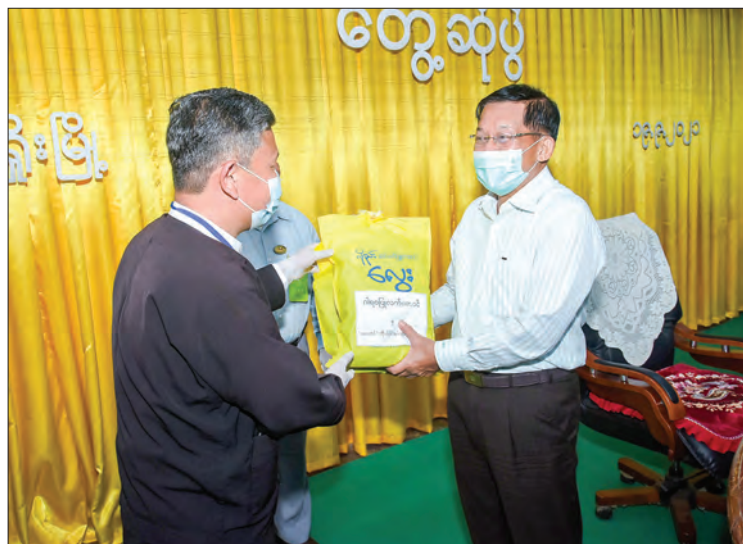
Chairman of State Administration Council Prime Minister Senior General Min Aung Hlaing accepts domestic products from an officials.

local people and improve regional economy.