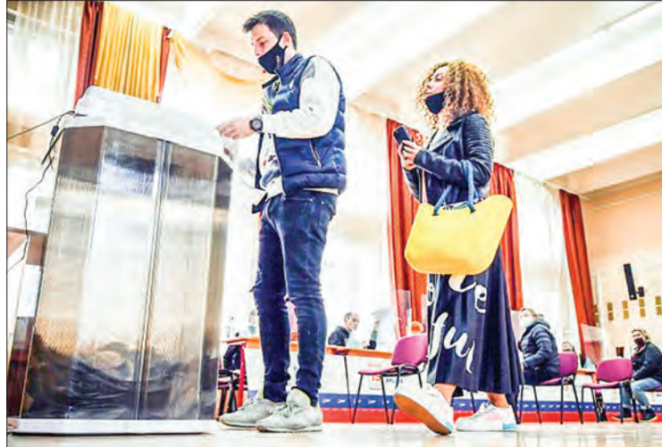
Recent surveys showed fewer than 30 per cent planned to vote for the ruling United Russia Party.

"These essentially aren't elections. People in effect have no choice," 43-year-old business-