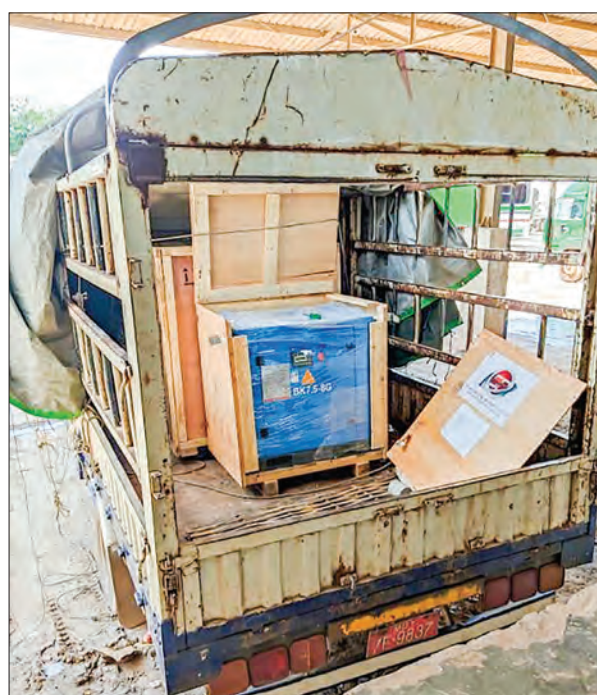
A cargo truck is loaded with medicines and medical equipment.