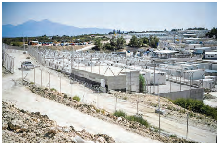
Double barbed wire surrounds the 12,000 square metre camp on the island of Samos.

Gates will remain closed at night. — AFP ■