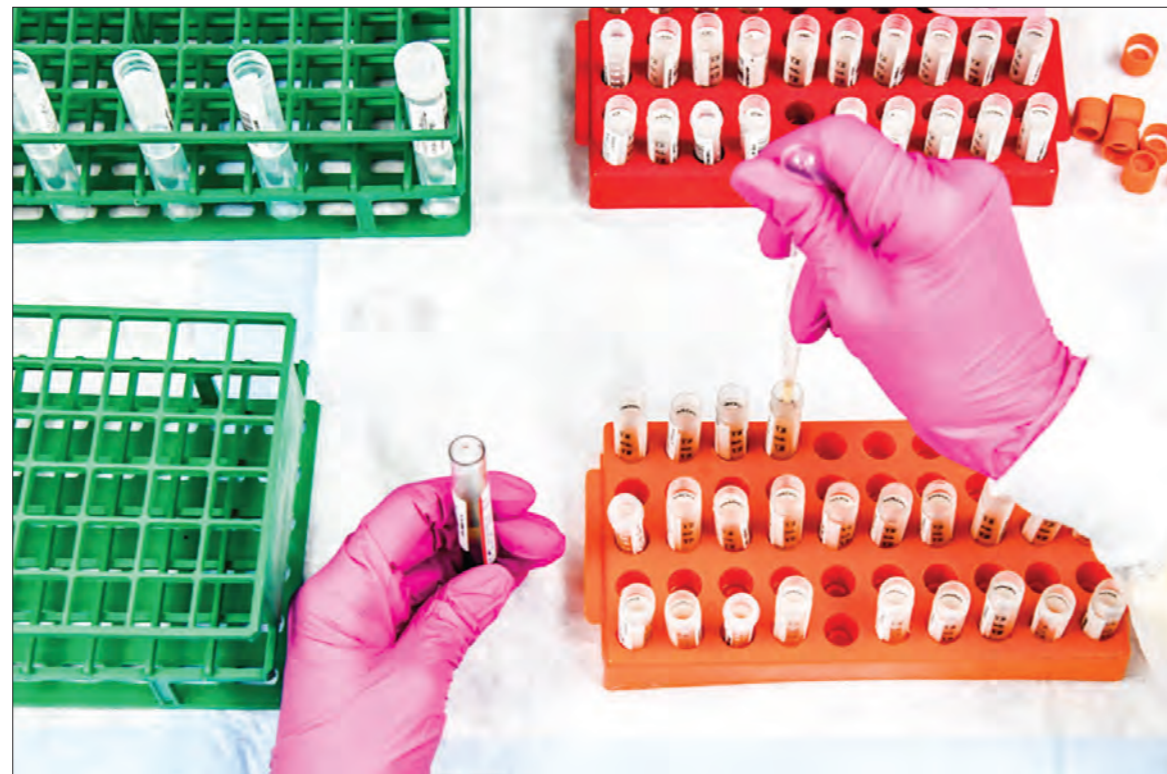
A lab technician sorts blood samples for a COVID-19 vaccination study.

However, those antibodies don't bind well to newer variants, finds a new study, published in the journal Nature Communications.