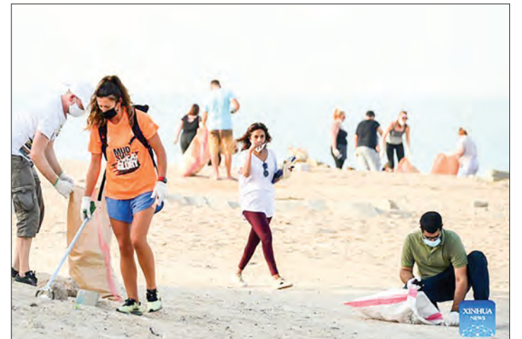
People participate in a beach cleanup campaign at a beach in Jahra Governorate, Kuwait, on 18 September 2021. Kuwait marks World Cleanup Day on Saturday by organizing a coastal cleanup campaign to raise environmental awareness and shed light on threats to the environment.

KUWAIT marks World Cleanup Day on Saturday by organizing a coastal cleanup campaign to raise environmental awareness and shed light on threats to the environment.