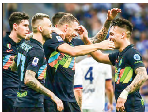
Inter Milan ran riot against Bologna to move top of Serie A.

secutive games a player has scored against one opponent. It was the ninth successive match that Mane had netted against Palace. More importantly for Klopp, Mane already has four goals this term, suggesting he is ready to put last season's disappointing personal campaign behind him. After Liverpool's lacklustre, injury-hit defence of the Premier League title, they are back in the groove in the chase to regain the trophy from Manchester City.—AFP ■