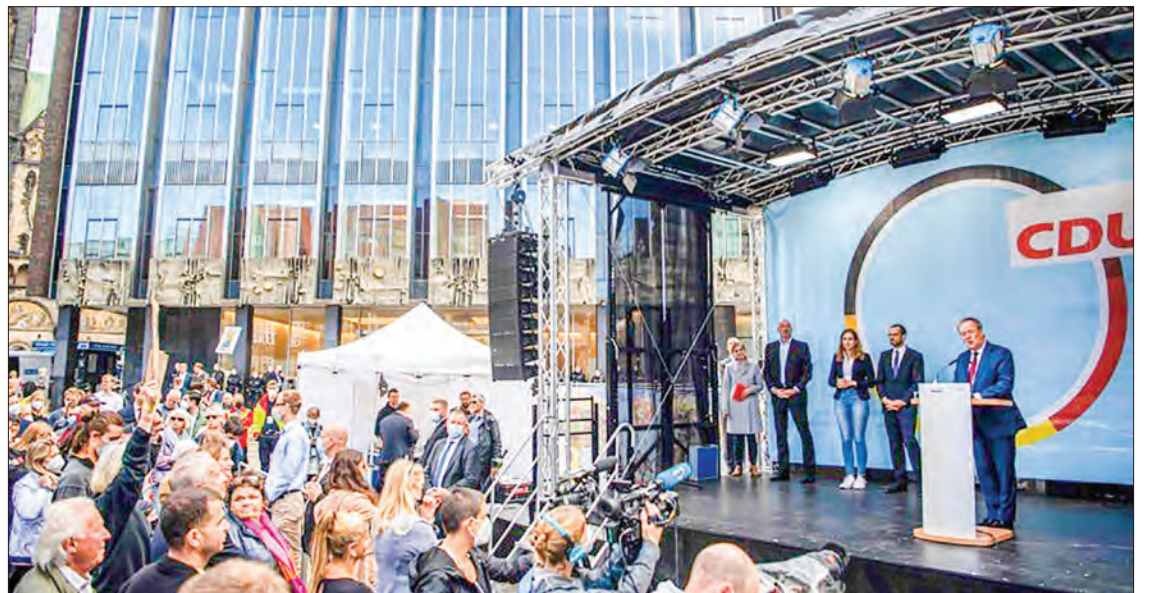
Christian Democratic Union party leader and candidate for Chancellor Armin Laschet speaks on stage during a rally in Bremen, northern Germany on 16 September 2021.

WITH Germany's Christian Democrats (CDU) trailing in the polls ahead of an election next week, grassroots party members are resorting to an activity that had almost become redundant under Angela Merkel: campaigning.