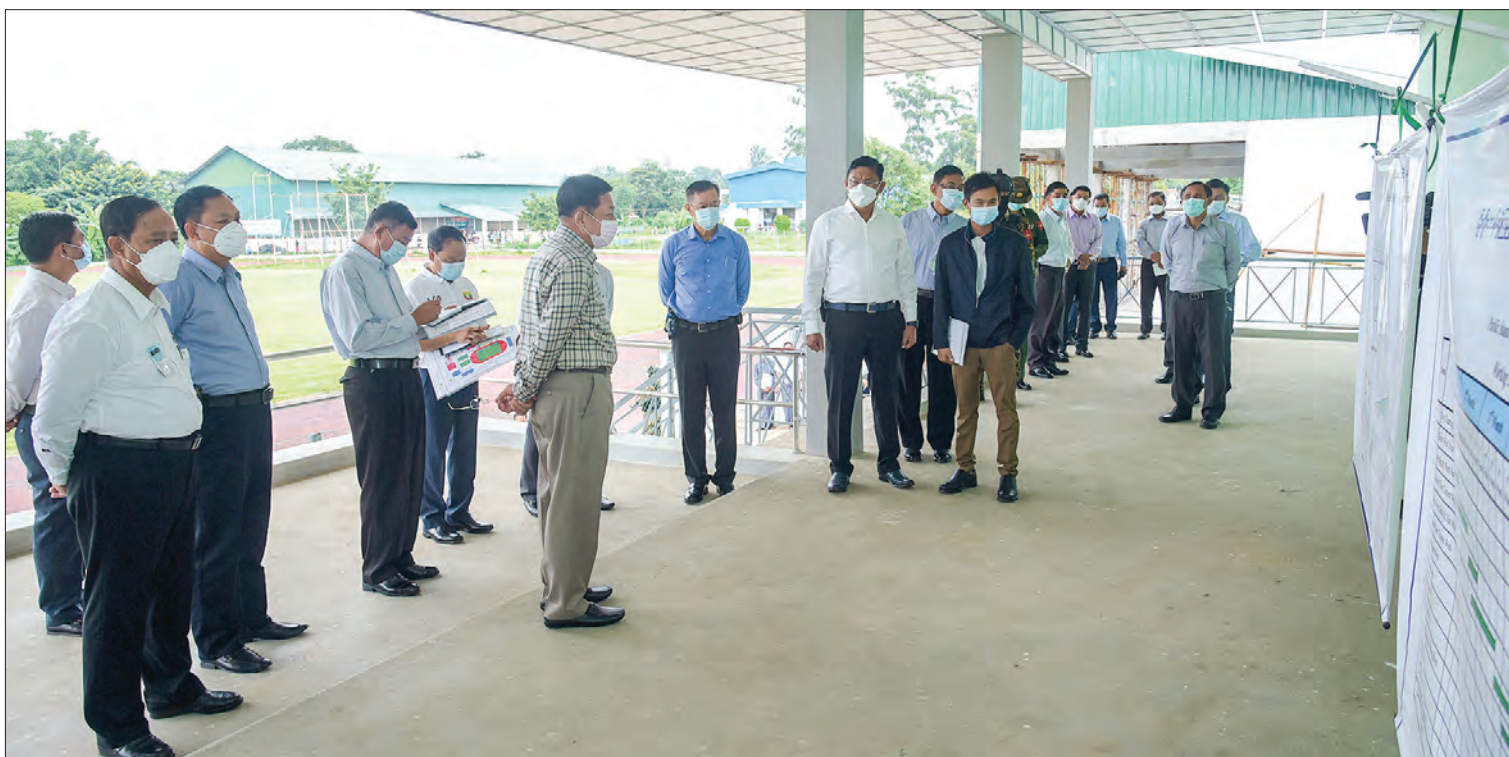
State Administration Council Chairman Prime Minister Senior General Min Aung Hlaing pays an inspection tour around the PyinOoLwin Stadium in PyinOoLwin on 17 September 2021.

CHAIRMAN of the State Administration Council Prime Minister Senior General Min Aung Hlaing yesterday morning inspected the situations to improve the sports, economic and tourism sectors in PyinOoLwin of Mandalay Re-