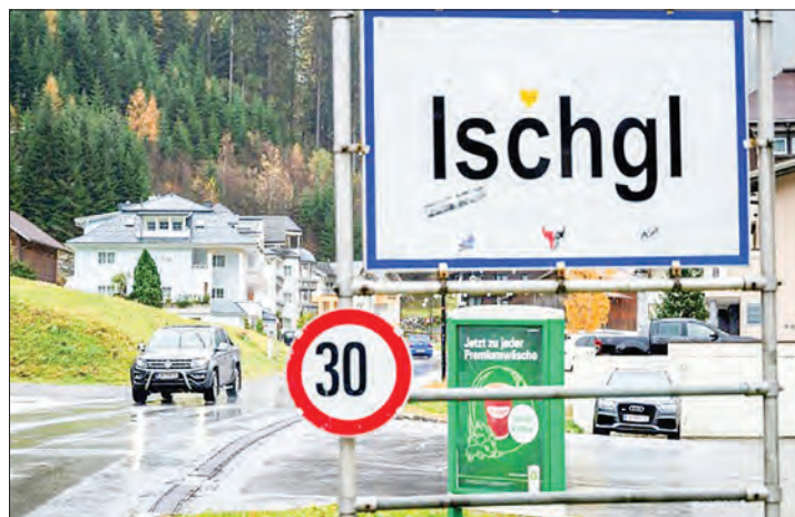
The Tyrolean ski resort of Ischgl was the site of a notorious outbreak of coronavirus in March 2020.

They also missed an opportunity to prevent more tourists coming to the valley that weekend, and the regional government cast doubt on whether the Icelandic tourists had been infected in Ischgl, he said.—AFP ■