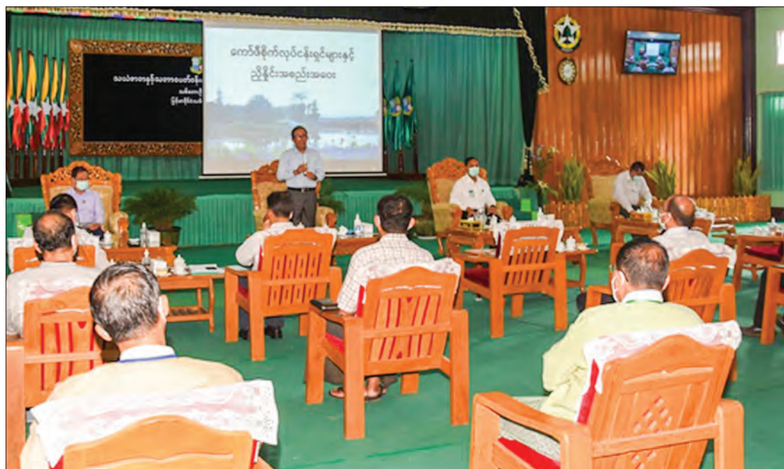
The Union ministers and Mandalay Region Chief Minister hold talks with coffee entrepreneurs in PyinOoLwin yesterday.

A coordination meeting with coffee entrepreneurs was held in line with COVID-19 health rules in PyinOoLwin yesterday.