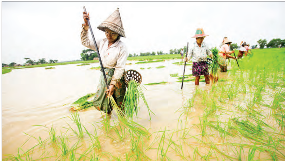
Farmers are seen growing rice this monsoon season.

This year, rice shipment to European countries is declining. However, Myanmar is delivering rice and broken rice to China and Bangladesh. The market cools down for now owing to the transport difficulties amid the closure