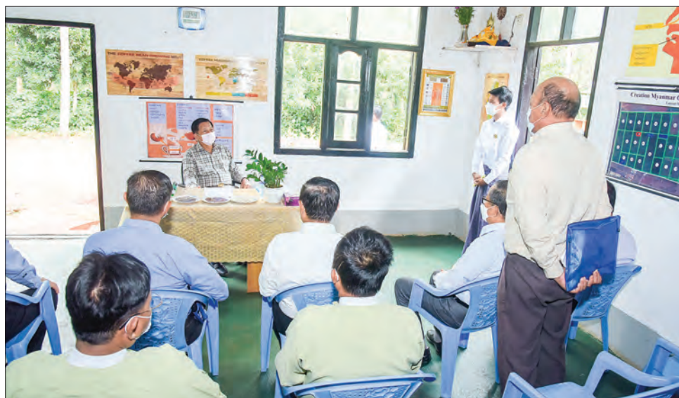
SAC Chairman Prime Minister Senior General Min Aung Hlaing hears reports on coffee production process at the Creation Myanmar Coffee Farm.

ued to say that more than 10,000 acres of land are placed under coffee plantations in PyinOoLwin, and its products are famous in the market. It is necessary to strive for the production of each model goods from the region to secure the market share through a One-Village-One Product system by using modern packaging designs. On the other hand, the tourism industry will develop with the number of local and foreign travellers. The tourism services will contribute to the trading of domestic products to increase the income of the region and raise the living standard of the local people. The Senior General met with local coffee farming businesspersons to fulfil their requirements, urging them to achieve success