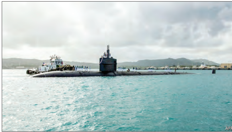
The deal extends US nuclear submarine technology to Australia as well as cyber defence, applied artificial intelligence and undersea capabilities.

China voiced anger — as did France, which called off a Washington gala to celebrate America's oldest alliance and accused Biden, in whom it placed high hopes, of being no different than his "America First" predecessor Donald Trump.