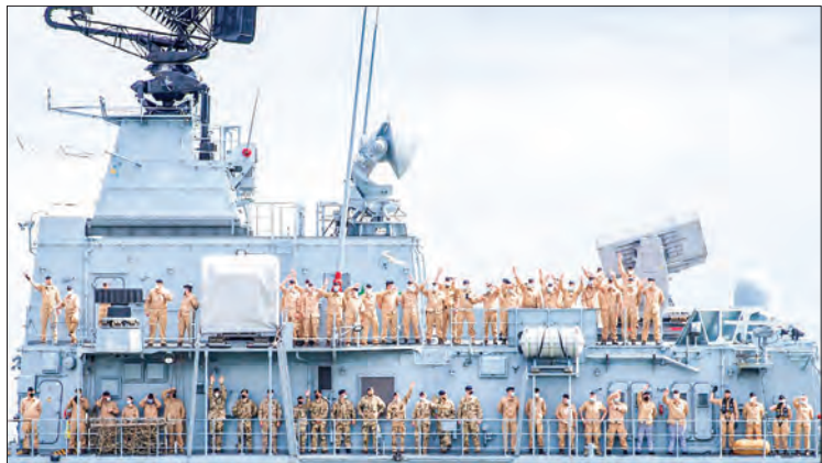
The EU is looking to increase engagement in the Indo-Pacific as the US, UK and Australia increase ties. The crew waves from aboard the frigate 'Bayern' of the German Navy, which is setting off on a voyage lasting several months in the Indian and Pacific Oceans.

THE European Union (EU) on Thursday unveiled a new strategy for enhancing its economic, political and defence existence in the Indo-Pacific region, vowing to cooperate with all actors in the region and seek no confrontation.