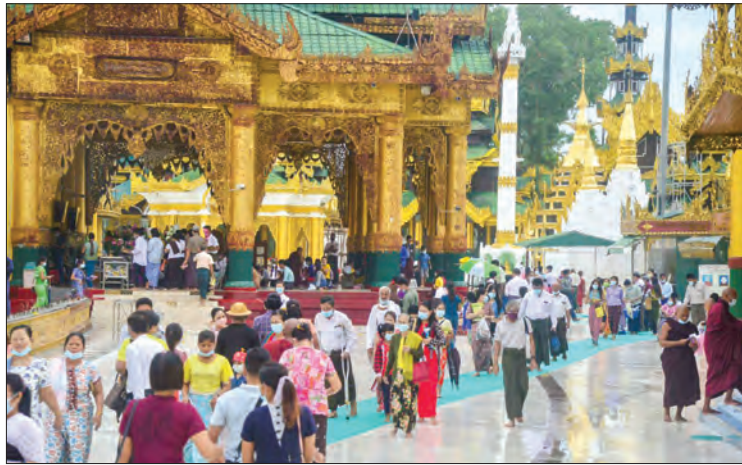
Devotees and worshippers pay homage to the Shwedagon Pagoda.

With advice of the State Sangha Maha Nayaka Committee Sayadaws and permission of the State Administration Council, pagodas were opened in accordance with the COVID-19 preventive measures and the limited numbers of monks and nuns were given priority on 8 and 9 February. Starting from 11 February,