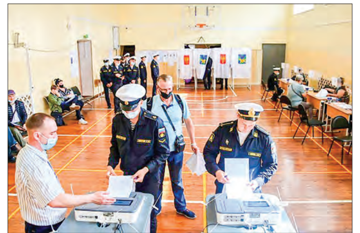
The run-up to the parliamentary polls has been marred by an unprecedented crackdown on Kremlin critics and independent media.

"They caved in to the Kremlin's blackmail," exiled Navalny ally Leonid Volkov said on Telegram. Google and Apple have not commented on the