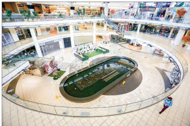
A resident walks inside a quiet Chinese shopping mall in Richmond, Canada, 2 April 2020.

INTERNATIONAL transactions in securities caused a net inflow of funds of 18.9 billion Canadian dollars (about 14.9 billion U.S. dollars) in the Canadian econo-