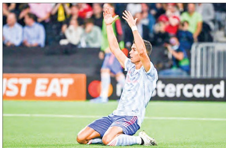
Cristiano Ronaldo has three goals in two games since returning to Manchester United.

ALL eyes are once again on Cristiano Ronaldo as Manchester United aim to make amends for a shock Champions League defeat to Young Boys when the Premier League leaders head to West Ham on Sunday.