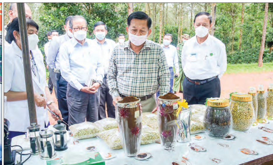
SAC Chairman Prime Minister Senior General Min Aung Hlaing looks into the coffee products at the Creation Myanmar Coffee Farm.

The products must have good fragrance, taste and colour. The products must be distributed to meet the demand depending on favourite sorts of products of the regions. Every workplace must have a research and development section to conduct the research without fail. For the first phase, it is necessary to consider the export of raw materials and then quality finished goods. As the government will provide assistance for the availability of coffee qual-