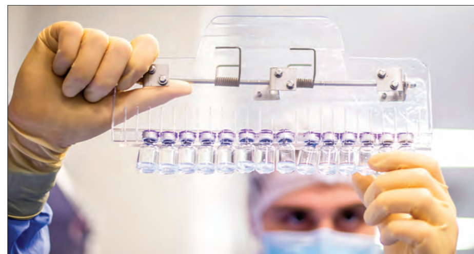
In this March 2021 photo provided by Pfizer, a technician inspects filled vials of the Pfizer-BioNTech COVID-19 vaccine at the company's facility in Puurs, Belgium.

The skepticism extends to scientists at the Food and Drug Administration (FDA), who struck a cautious tone in documents released ahead of Friday's meeting where an independent panel has been convened.