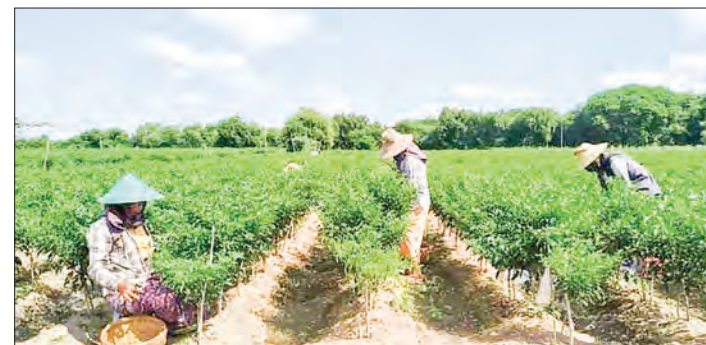
A total of 4,089 acres of kitchen crops have been cultivated in Sagaing Region so far this year. A total of 4,089 acres of kitchen crops have been cultivated in Sagaing Region so far this year.

The respective departments in each district of the Sagaing Region are sharing information on GAP, pest management technology and soil treatment to boost the yield and penetrate more markets.