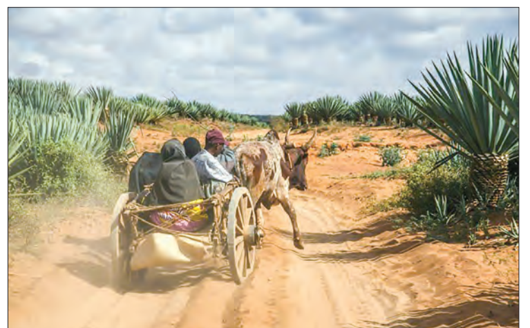
Across Madagascar's vast southern tip, drought has transformed fields into dust bowls. More than one million people face famine.

Her three oldest children have left home to look for work in other towns. She's caring for the young ones.