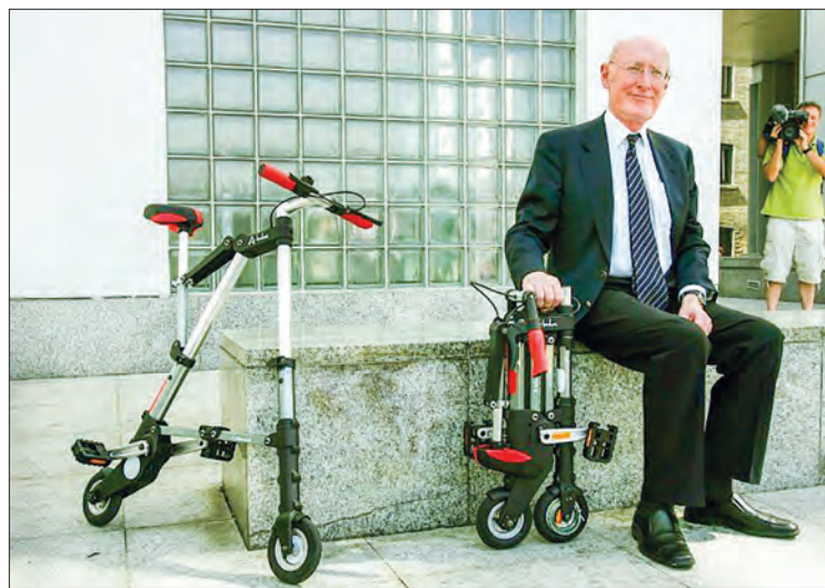
Clive Sinclair shows off one of his inventions in 2006.

CLIVE Sinclair, the British inventor who pioneered the pocket calculator and affordable home