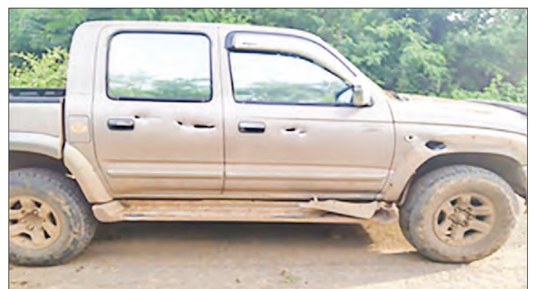
A damaged vehicle is seen after terrorists' attack.

THE armed terrorist groups attacked the convoy carrying the security members and health workers on their way back after COVID-19 vaccination processes in Kanbalu Township of Sagaing Region on 16 September.