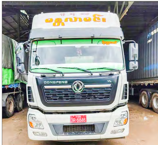
Anti-Covid devices and medical aids (right photo) are daily imported and lorries (left photo) are transporting them to the needed places.

A total of 1,000 empty oxygen cylinders, 15 oxygen plants, 367 oxygen concentrators for home use, 10,260 sets