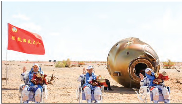
Astronauts Nie Haisheng (C), Liu Boming (R) and Tang Hongbo wave at the Dongfeng landing site in north China's Inner Mongolia Autonomous Region, 17 September 2021.

"I want to say dad, mom, I'm back! In good health and good spirits!" he said after emerging from the capsule within 30 minutes of landing. The crew of the Shenzhou-12 spacecraft were in good health, China Manned