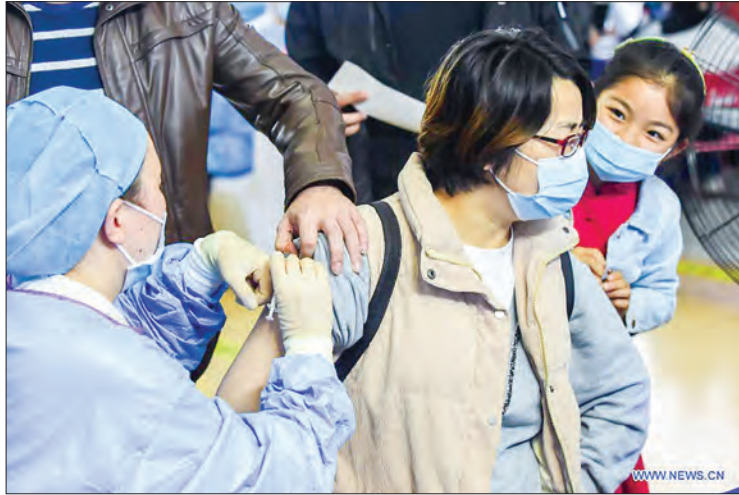
A citizen receives a dose of COVID-19 vaccine at a vaccination site in Hefei, east China's Anhui Province, 16 May 2021.

The government has not publicly announced a target for