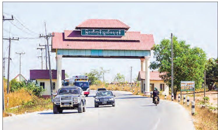
Myawady border trading zone.

THE bilateral trade with neighbouring Thailand, Myanmar's major trading partner among ASEAN, amounted to US$4.117 billion in the past ten months (October-July) of the current financial year 2020-2021, the statistics issued by the Central Statistical Organization under the Ministry of Planning and Finance indicated.