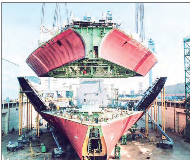
Hyundai Heavy Industries Co., Ltd. is the world's largest shipbuilding company. Its headquarters are in Ulsan, South Korea.

SHARES in the world's biggest shipbuilder Hyundai Heavy Industries more than doubled from their