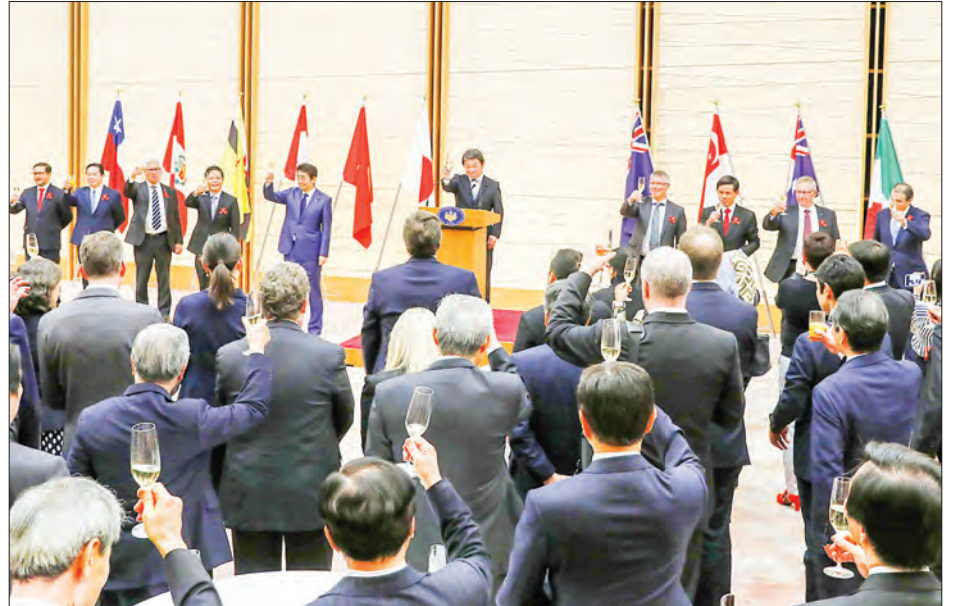
Officials of the 11 member countries of the Trans-Pacific Partnership free trade accord make a toast after a meeting in Tokyo on 19 January 2019.

ti-dumping duties on wine exports. Australia signaled on Friday that it is unwilling to accept the start of talks on China's possible participation. The country's Minister for Trade, Tourism and Investment Dan Tehan said in a statement on Friday that China would need to convince members that it has a "track record of compliance" with its commitments in the WTO and existing trade agreements, once again reiterating the need for China to restart ministerial-level talks between the two nations.—Kyodo ■