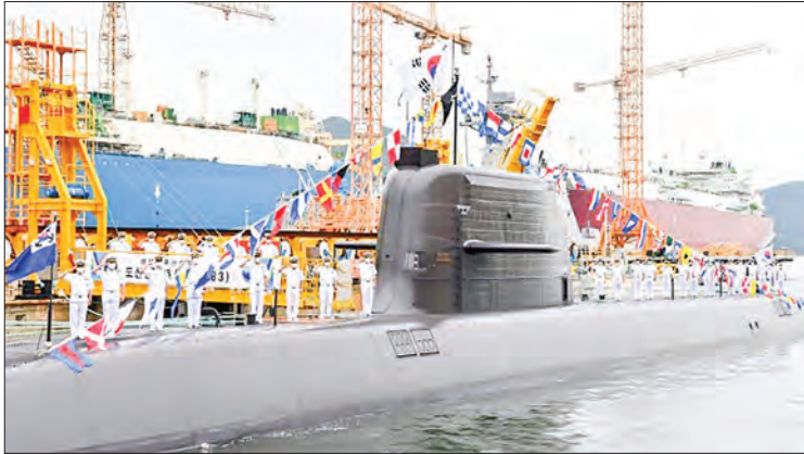
Seoul's missile was fired underwater from South Korea's newly commissioned submarine Ahn Chang-ho.

MISSILE test headlines on the Korean peninsula are almost invariably about the nuclear-armed North, but this week the South fired a submarine-launched ballistic missile of its own as it rapidly scales up its military capabilities.