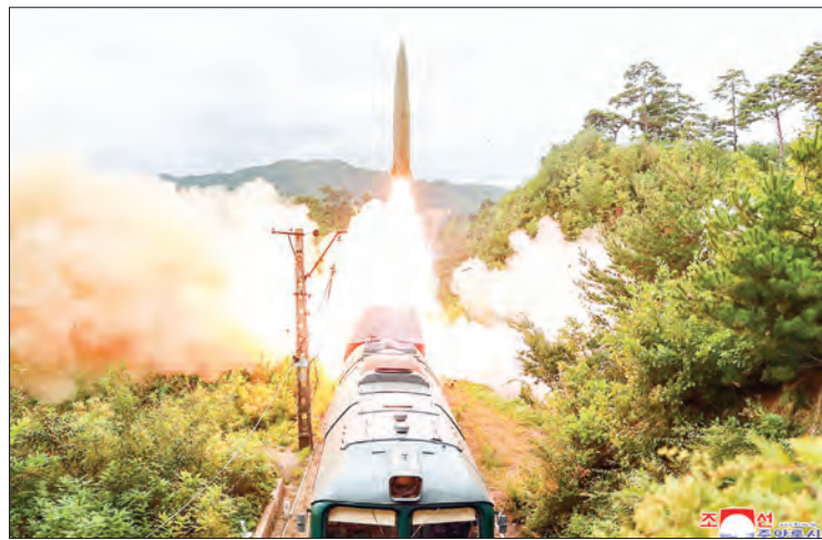
North Korea tests a "railway-borne missile system" in central North Korea on 15 September 2021.

Pak Jong Chon, a close aide to North Korean leader Kim Jong Un, observed a firing drill by a railway-borne missile reg-