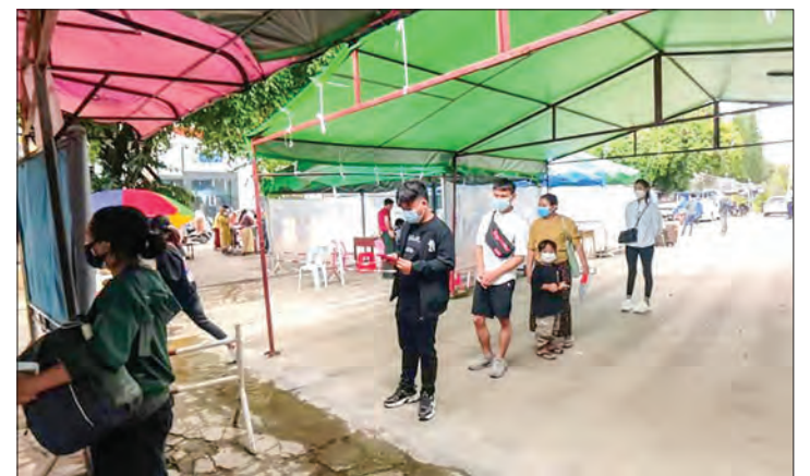
Returnees from abroad check in at the reception site.

MYANMAR nationals from abroad are being welcomed back through various land borders, officials said.