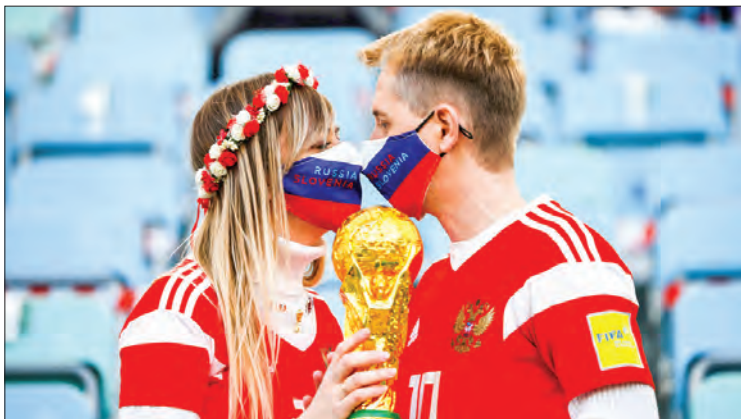
According to FIFA, most fans want a more frequent World Cup.

A majority of football supporters support the idea of a "more frequent" World Cup, according to an online poll published Thurs-