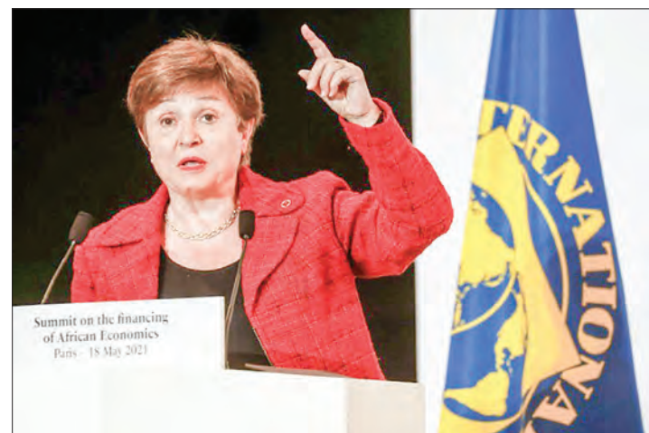
IMF Managing Director Kristalina Georgieva disagreed with an investigation showing she pushed for changes to a World Bank report to favour China.

IMF chief Kristalina Georgieva on Thursday disputed an independent investigation which found that in her previous job at the World Bank, she pressed staff to alter a report to avoid angering China.