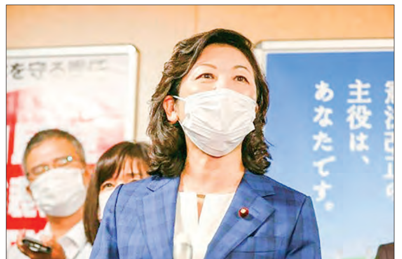
Seiko Noda was Japan's youngest post-war cabinet member in 1989 when she was 37.

A nine-term House of Representatives lawmaker who does not belong to any faction in the LDP, Noda has expressed willingness to appoint women to half of the Cabinet posts if she becomes prime minister.—Kyodo ■