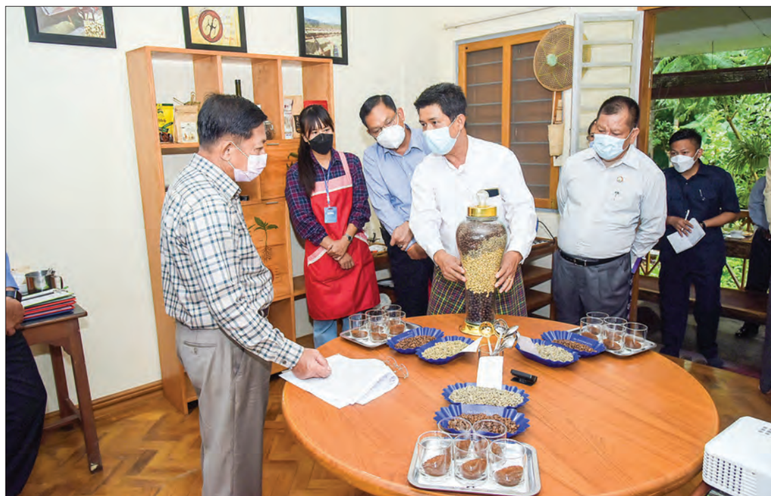
SAC Chairman Prime Minister Senior General Min Aung Hlaing visits the Sithar Coffee Co.,Ltd.

In his response to the reports, the Senior General said that there are more than 30,000 acres of coffee plantations in Myanmar with growing of Robusta and Arabica coffee strains in respective areas. As coffee farming needs a large amount of capital by taking a long term, it is necessary to strive for achieving success while continuously observing the local and international markets. Emphasis should be placed on high per-acre yield, quality products and occupying market shares.