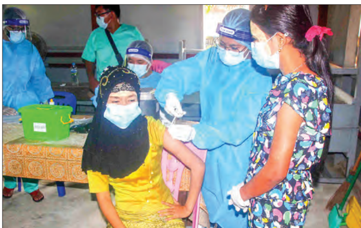
An IDP receives the first jab of COVID vaccine in Kyaukphyu Township.

THE health workers vaccinated the people over 18 living at Kyauktalon IDP camp in Kyaukphyu Township of Rakhine State for the first time yesterday.