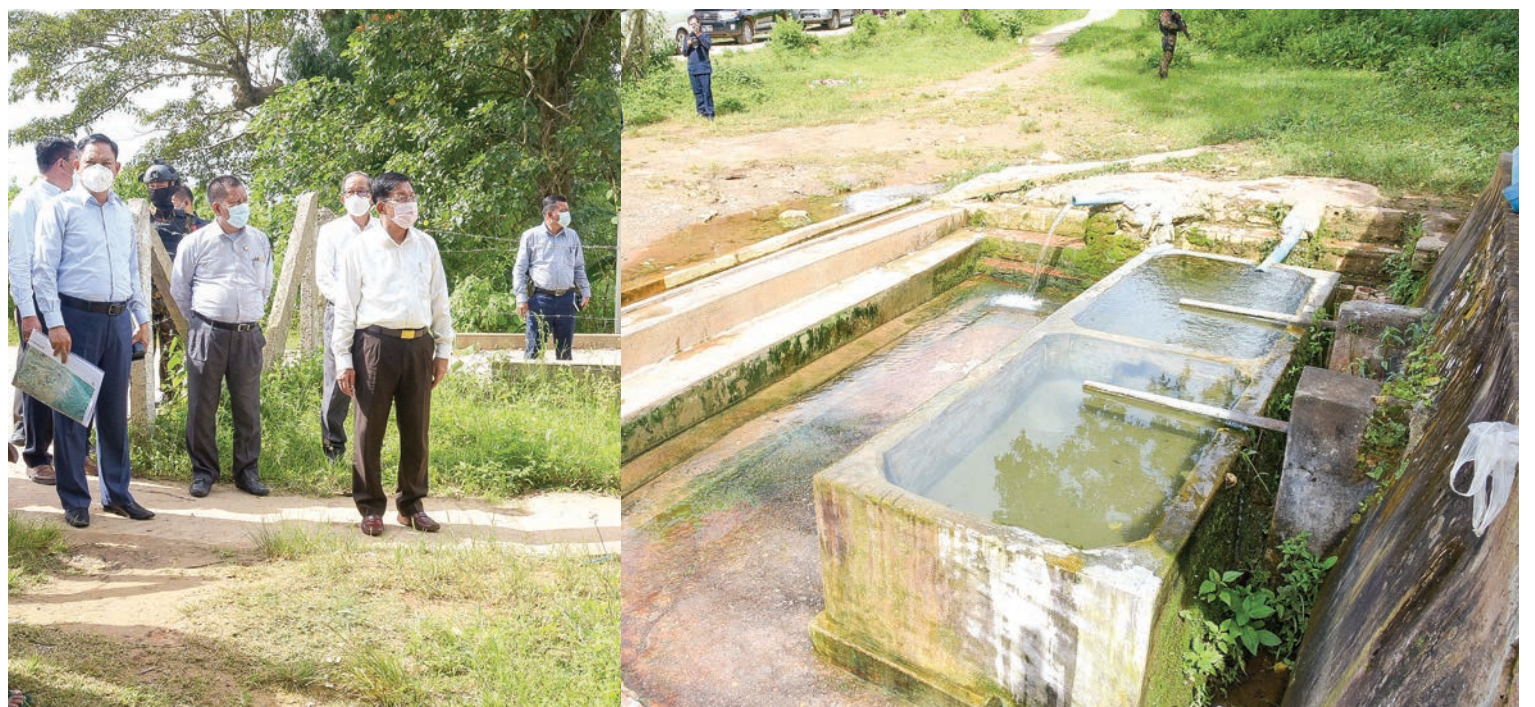
State Administration Council Chairman Prime Minister Senior General Min Aung Hlaing views around the water inlet channels of the National Kandawgyi Garden in PyinOoLwin yesterday.

In the afternoon, the Senior General and party inspected the natural spring, which is an inlet channel of water to the garden, near Nyaungni Village of PyinOoLwin Township and other water inlet channels along the circular road of the garden and gave guidance on needs of prevention for damaging the water inlet channels. —MNA