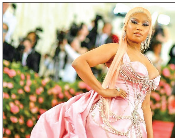
US rapper Nicki Minaj revealed to her 22.6 million Twitter followers she had not yet been vaccinated.

"There are a number of myths that fly around, some of which are just clearly ridiculous," he told reporters.—AFP ■