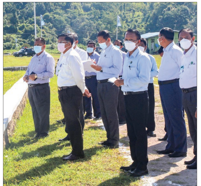
Chairman of the State Administration Council Prime Minister Senior General Min Aung Hlaing inspects the Hsinlan Dam in PyinOoLwin in Mandalay Region on 16 September 2021.

C HAIRMAN of the State Administration Council Prime Minister Senior General Min Aung Hlaing, accompanied by members of the State Administration Council, Union ministers, senior military officers and officials, yesterday