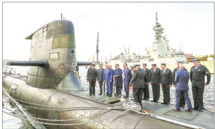
French President Emmanuel Macron (2nd L) and former Australian prime minister Malcolm Turnbull (3rd L) stand on the deck of a Collins-class submarine in Sydney in May 2018 — reports say that an expected security deal with the United States and Britain could derail Australia's plans to purchase French submarines.

NEW ZEALAND will not lift a decades-long ban on nuclear-powered vessels entering its waters in the wake of key ally Australia's decision to develop a