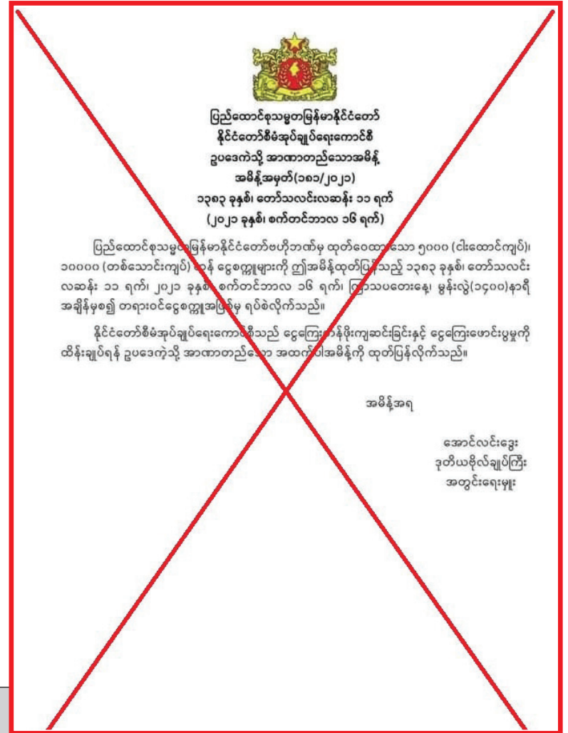
A fake viral piece of information circulating amongst the public.

"There have been similar incidents in the past that K10,000 notes are abolished. So, what I want to say to the people is that the State Administration Council strictly abides by the 2008 Constitution. As such, the legally issued notes would not be demonetized according to subsection (e) of Section 36. The people should not believe in such rumours and chaos. - MNA