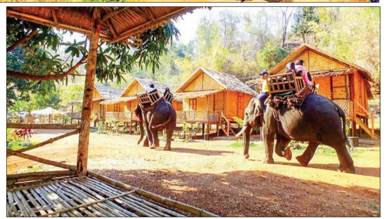
There are 11 elephants in the camp and the ride costs 10,000 kyats each for foreigners and K5,000 each for locals. During the Shwesettaw Pagoda Festival held from the month of Tabodwe for three months, pilgrims from across the country also visited the elephant camp.