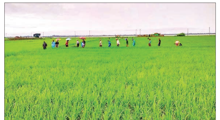
The monsoon paddy is started growing in the third week of June. So far, about 1,798,003 acres of monsoon paddy have been grown in the region.

In the 2019-2020FY, the Sagaing region grew over 1.7 million acres of monsoon paddy in 11 districts, the deputy head of the Sagaing Region Agriculture Department.