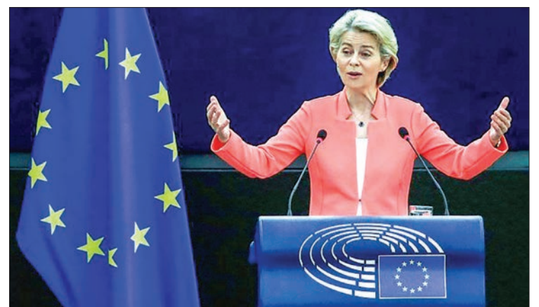
EU chief Ursula von der Leyen pledged an additional 100 million euros in aid to Afghanistan.

this mission could end so abruptly. There are deeply troubling questions that allies will have to tackle within NATO.