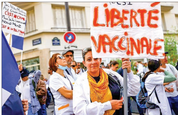
Tens of thousands of health workers and carers remain unvaccinated despite an ultimatum from President Emmanuel Macron to get the job or face suspension without pay.

THE French government faces a stand-off with tens of thousands of health workers and carers