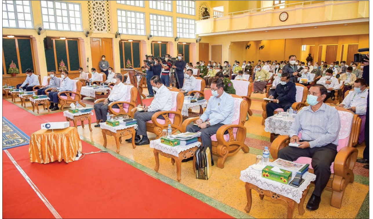
Chairman of the State Administration Council Prime Minister Senior General Min Aung Hlaing meets members of Mandalay Region and PyinOoLwin Township Administration Councils, departmental personnel and town elders at the Township Hall of PyinOoLwin yesterday.

E FFORTS must be made for the development of PyinOoLwin area through the tourism industry, said Chairman of the State Administration Council Prime Minister Senior General Min Aung Hlaing in meeting with members of Mandalay Region and PyinOoLwin Township Administration Councils, departmental personnel and town elders at the township hall of PyinOoLwin yesterday morning.