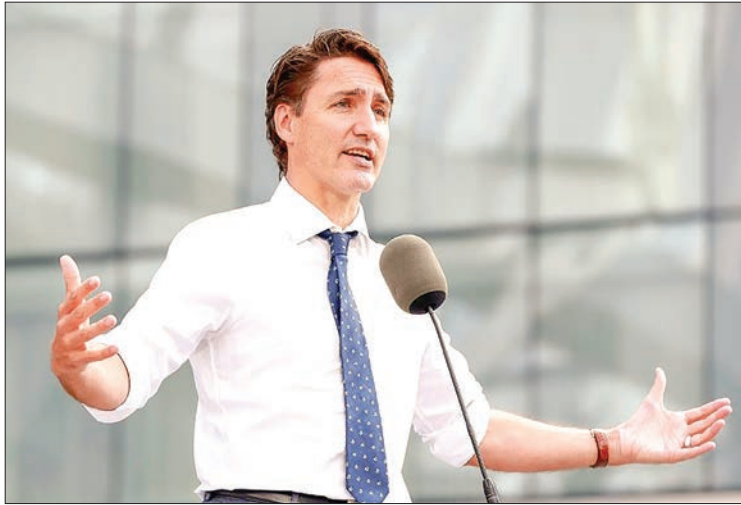
Canadian Prime Minister Justin Trudeau is in a fight for political survival after calling snap elections.

TENSIONS are mounting four days ahead of Canada's legislative elections as Liberal Prime Minister Justin Trudeau called on citizens to "vote strategically" to block a Conservative surge as he faces a potential defeat at the hands of rookie Tory leader Erin O'Toole. According to polls, the two major parties that have ruled Canada since its 1867 confederation are in a statistical dead heat, each garnering the support of 32 per cent of respondents, while the leftist New Democratic Party trails far behind.