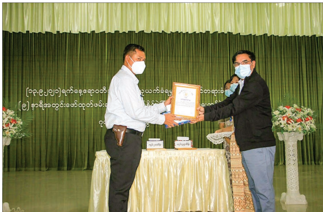
The Bago Region Chief Minister presents cash rewards and the certificate of honour to the security forces.

A dinner in honour of the security forces who managed to identify and arrest the perpetrators of the Ayeyawady Bank (AYA Bank) robbery within 9 hours was held at Bago City Hall on 15 September.