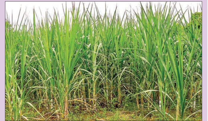
During the 2020-2021 growing season, Sagaing Region Agriculture Department targeted 170,200 acreages of sugarcane in the region.