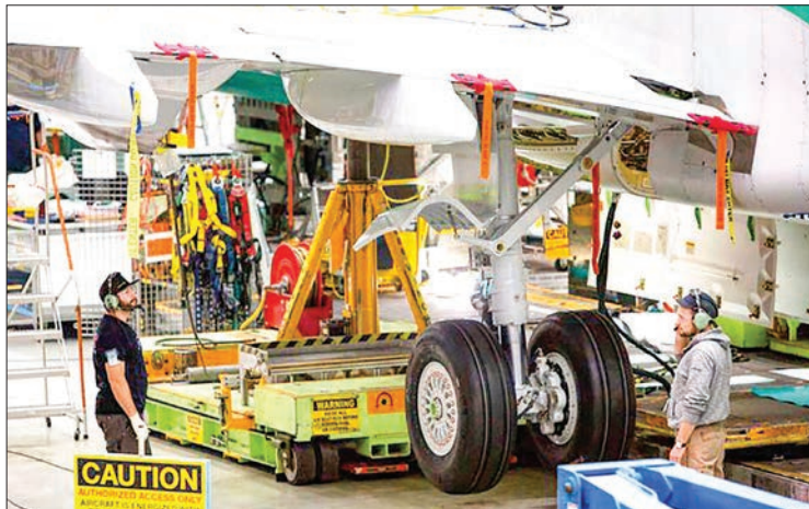
Workers stand under the wing of a Boeing 737 MAX airplane at the Boeing Renton Factory in Renton, Washington.

The monthly increase was in line with analysts' expectations and put it 0.3 per cent above its level in February 2020, the last month of normalcy before the