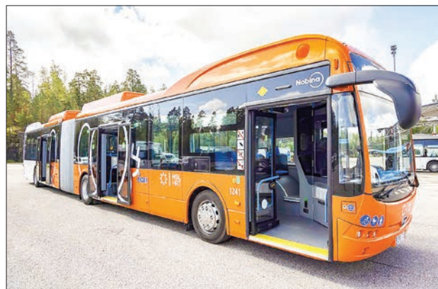
Photo taken on 10 August shows an electric bus delivered by Chinese automaker BYD to public transport operator Nobina for use in Helsinki.

THE export value of Shanghai's pure electric passenger vehicles came in at approximately 20.68 billion yuan (3.22 billion U.S. dollars), up 14.3 times year on year, in the first eight months of 2021, local customs said Thursday.