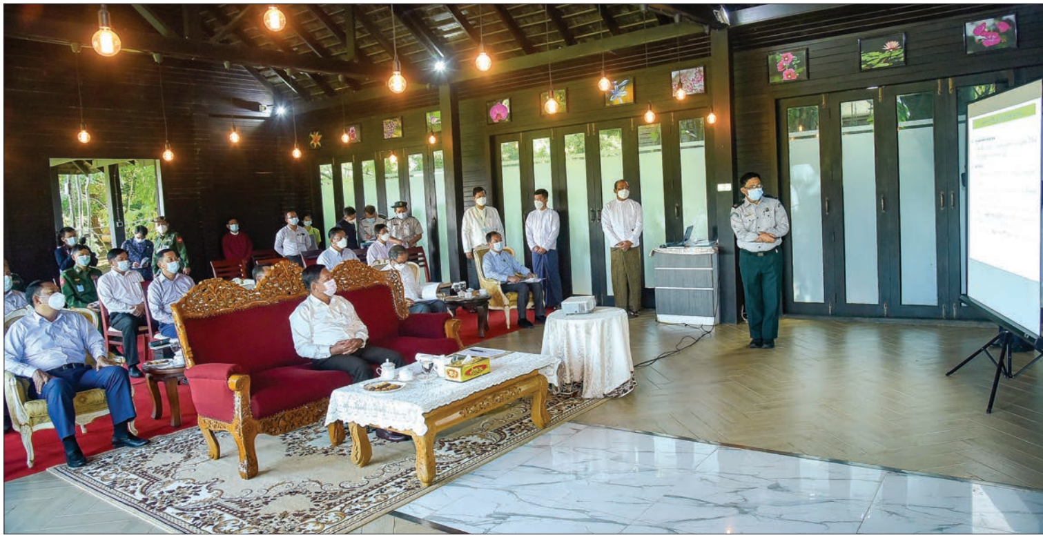
State Administration Council Chairman Prime Minister Senior General Min Aung Hlaing hears the reports on the effect of deforestation on lesser water resources and previous experience of dryness of lakes at the National Kandawgyi Garden in PyinOoLwin yesterday.