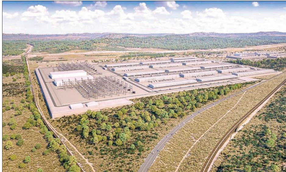
Image shows a rendering of hydrogen production facilities envisaged under a project by six Japanese and Australian companies in the Aldoga district of Queensland State in Australia.

The project follows a concept study on the production of green liquefied hydrogen and its export to Japan by Iwatani and Stanwell, an electric power firm owned by the Queensland government, from 2019 to