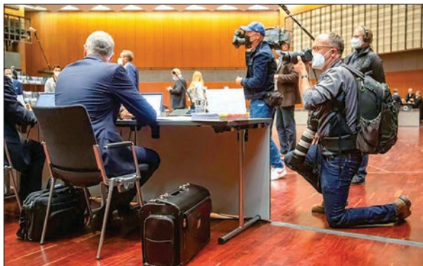
Four former Volkswagen managers are accused of organizing fraud and tax evasion in connection with the Dieselgate scandal.