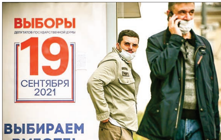
Vladimir Putin's United Russia party in recent years has become an easy target for voters frustrated by the country's struggling economy.

WHEN polls open Friday in Russia's parliamentary elections, few voters would bet against an easy win for the ruling United Russia party, even though it is more unpopular now than ever before. The party was founded by President Vladimir Putin after he came to power in 2000, with the aim of translating his personal appeal into a dominant parliamentary force. But after benefitting from the economic boom in Putin's early years, it has become a target for Russians' grievances and is