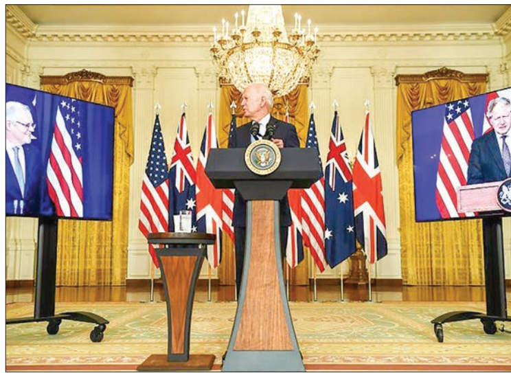
US President Joe Biden participates in a virtual press conference on national security with British Prime Minister Boris Johnson (R) and Australian Prime Minister Scott Morrison in the East Room of the White House in Washington, DC.

The defence deal "may not have got off to the shining start for which Morrison hoped, of course, when US President Joe Biden appeared to forget his name at the crucial moment", said an analysis by the Sydney Morning Herald.—AFP ■