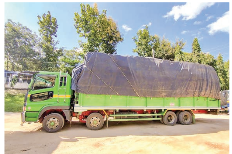
A lorry is carrying and transporting anti-Covid devices to the needed places.

ical supplies required in the prevention, control and treatment of COVID-19, as well as contact persons for inquiries can be reached through the Ministry's Website — www.commerce.gov.mm . — MNA