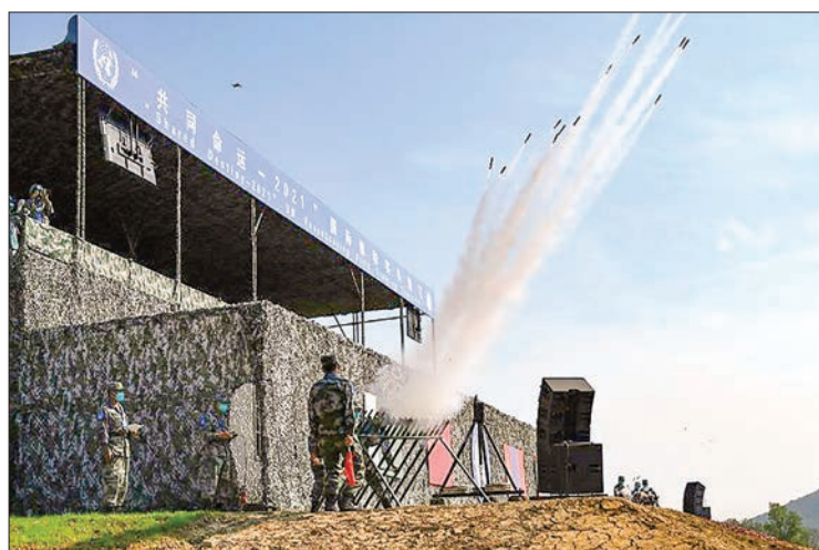
Troops from Thailand, Mongolia and Pakistan joined China's armed forces in its country's first multinational peacekeeping exercise.

As of the end of July, China was the eighth-largest contributor to peacekeeping troops, with 2,158 military personnel engaged around the world, according to UN data.—AFP ■