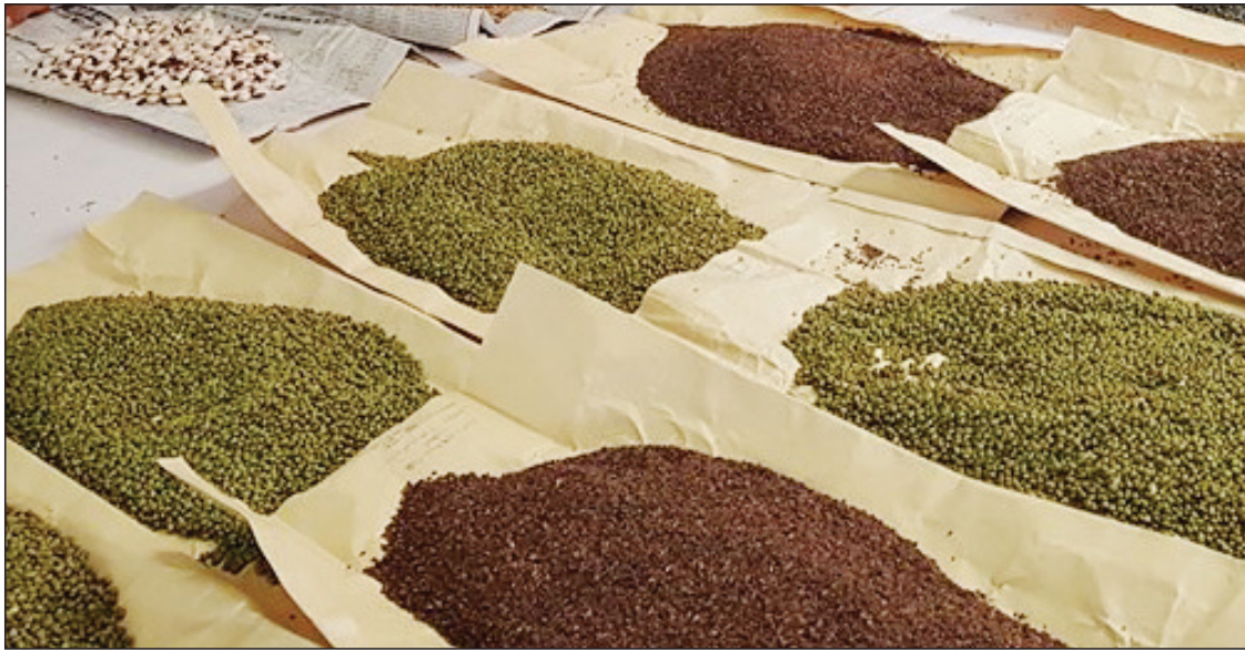
Myanmar's pigeon peas are primarily shipped to India and also exported to Singapore, the US, Canada, Pakistan, the UK, and Malaysia. But, the export volume to other countries rather than to India is extremely small.

MYANMAR exported more than 191,963 tonnes of pigeon pea to the foreign trade partners between 1 October 2020 and 3 September 2021 in the current financial year 2020-2021, generating an income of US$128 million, according to the Ministry of Commerce's trade data.