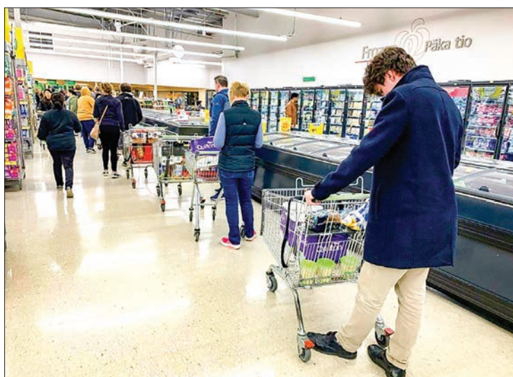
Despite a second-quarter GDP surge in New Zealand, analysts have said the country's latest Covid-19 lockdown has likely stalled momentum.

On an annual basis, the economy grew more than 17 per cent in the 12 months to the end of June, including a one-off 13.9 per cent boost in the July-September quarter after New Zealand lifted its initial