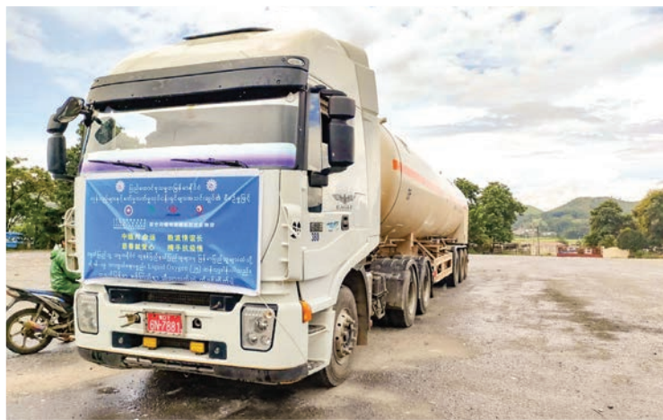
A bowser is transporting medical aids to the needed areas.

THE Ministry of Commerce is making efforts to ensure people have access to the essential medical supplies that are critical to the COVID-19 prevention, control and treatment activities, including liquid oxygen and oxygen cylinders, by