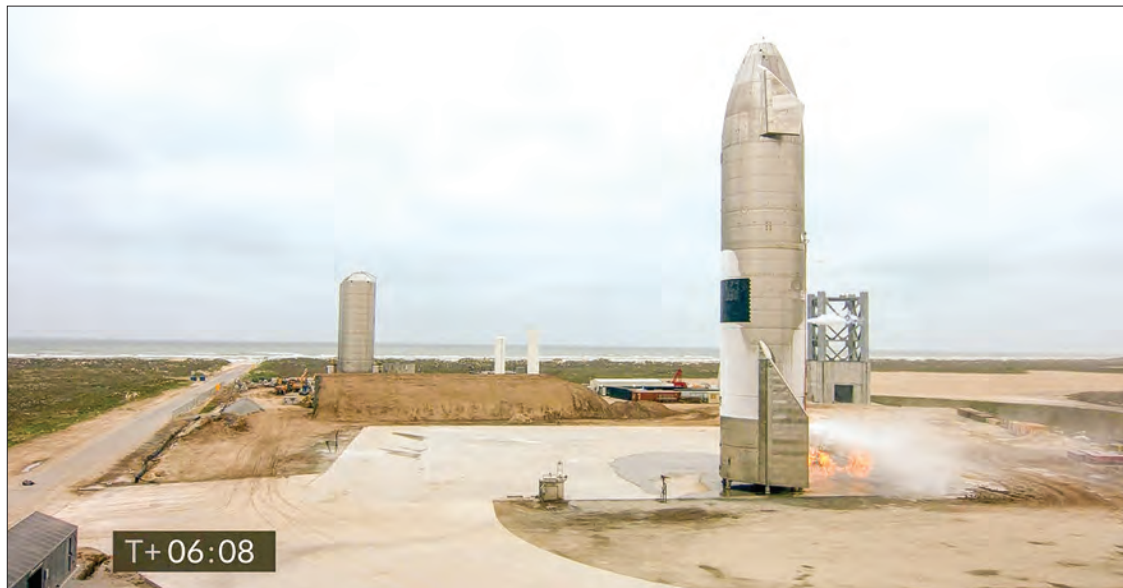
In this photo screengrab made from SpaceX's live webcast shows the Starship SN15 after landing in Boca Chica, Cameron County, Texas on 5 May 2021. SpaceX successfully landed its prototype Starship rocket on its fifth attempt, a livestream Wednesday showed. There was however a small fire at the base of the rocket, dubbed SN15, which announcers said was not unusual.

more ambitious in scope than the few weightless minutes Virgin Galactic and Blue Origin