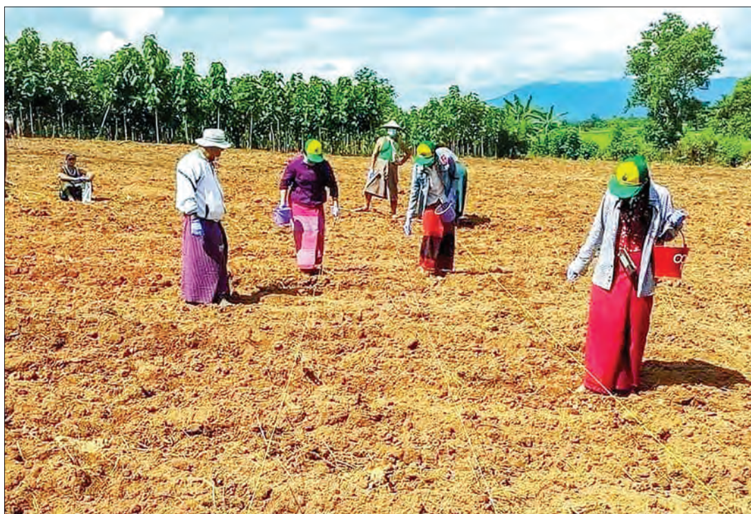
Wuntho Township started growing 25 acres of cotton yarn plantation from 12 September 2021 and the cultivation will complete in the third week of September.

The department has already provided training to 10 farmers to post-monsoon grow long-staple cotton in Wuntho township. The department also provided the fertilizers, pesticides and cotton seeds free of charge.