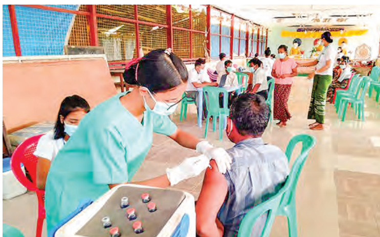
A healthcare staff administers the first shot of Covid vaccine to a local in Yathedaung Township.

HEALTHCARE officials gave the first dose of Sinovac COVID-19 vaccine to internally displaced persons over the age of 45 and lo-