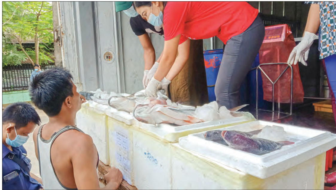
Ayeyawady Pawsan, Shwebo Pawsan, Pawkywel, short matured rice varieties (90 days) and sticky rice will be sold at a cheaper price between K23,500 and K54,000 per bag.

About one to five 108-pound bags can be individually purchased. Those who want to buy them can come and buy at the