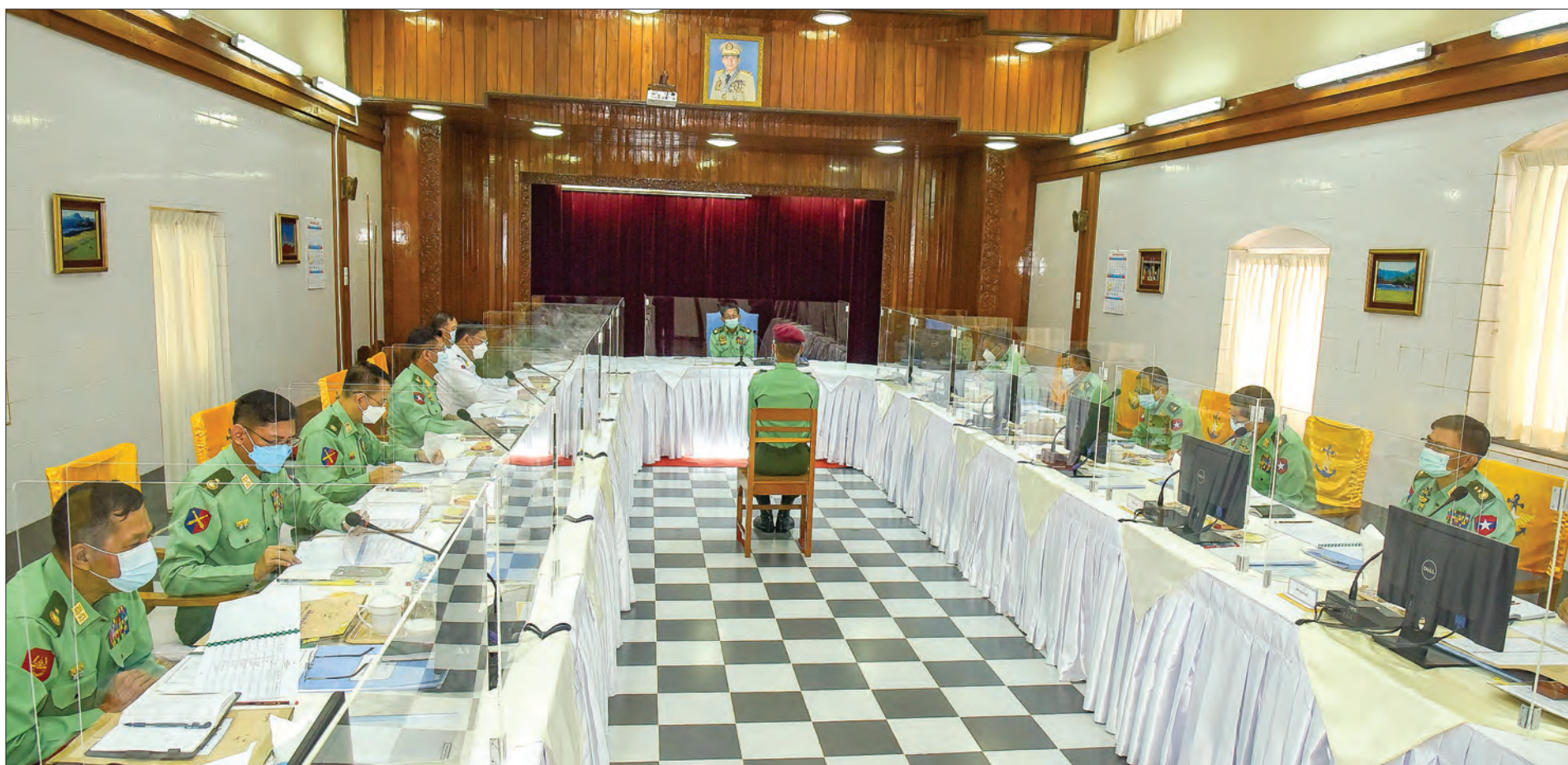
State Administration Council Chairman Commander-in-Chief of Defence Services Senior General Min Aung Hlaing attends the Choice of Arms ceremony for the 64 th Intake of the Defence Services Academy in PyinOoLwin on 13 September 2021.

C HAIRMAN of the State Administration Council Commander-in-Chief of Defence Services Senior General Min Aung Hlaing attended the ceremony of choice of arms for 64 th Intake of the Defence