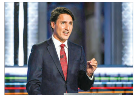
(FILES) In this file photo taken on 9 September 2021 Canadian Prime Minister and Liberal Leader Justin Trudeau speaks during the federal election English-language Leaders debate in Gatineau, Quebec, Canada.

Ultimately, the election will be a referendum on the