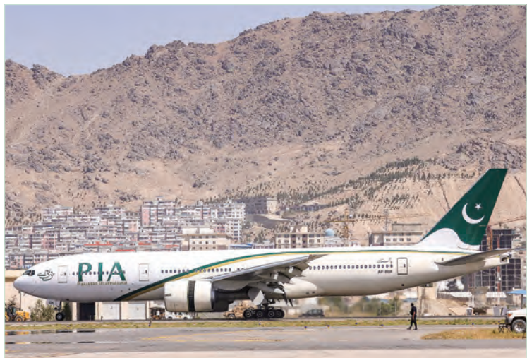
A Pakistan International Airlines plane carrying a handful of passengers, which is the first international commercial flight to land since the Taliban retook power in Afghanistan on 15 August, is seen after landing at the airport in Kabul, on 13 September 2021.

A Pakistan International Airlines (PIA) plane carrying a handful of passengers touched down at Kabul airport Monday, the first international commercial flight to land since the Taliban retook power in Afghanistan on 15 August.