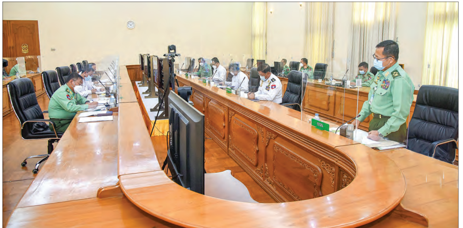
State Administration Council Vice-Chairman Deputy Prime Minister of the Provisional Government of Myanmar makes the speech at the 12 th meeting on COVID-19 prevention, control and treatment activities in Nay Pyi Taw on 13 September 2021.

Although the decrease of infection rate reaches 8 per cent, it is necessary to ensure safety for the people at less than five per cent based on the review of the Ministry of Health and inter-