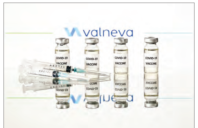
An illustration picture shows vials with Covid-19 Vaccine stickers attached and syringes with the logo of French-Austrian vaccine firm Valneva on 17 November 2020.

The laboratory had indicated at the end of August that