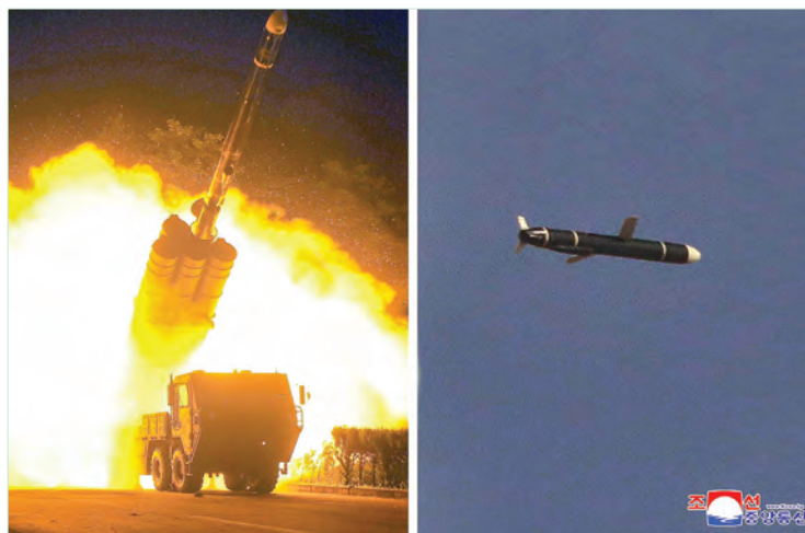
Combined photo delivered 13 September 2021 by the Korean Central News Agency shows what are described as new long-range cruise missiles being test-fired on 11 and 12 September 2021.

to North Korean leader Kim Jong Un, observed the missile test, the news agency said. He was reportedly promoted to the Political Bureau of the Central Committee of the ruling Workers' Party of Korea earlier this month.