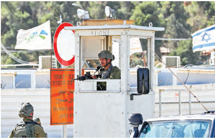
Members of Israeli security forces stand guard following a reported stabbing attack at the junction of Gush Etzion, a block of Israeli settlements near the Palestinian city of Bethlehem in the occupied West Bank, on 13 September 2021.

ISRAEL'S foreign minister has proposed improving living conditions in Gaza in exchange for calm from the enclave's Ha-