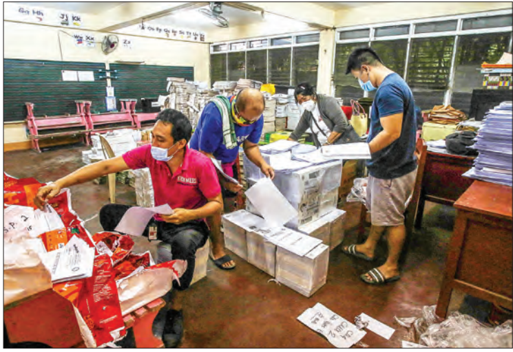
In this photo taken on 8 September 2021, teachers sort distance learning materials at a school in Quezon City, suburban Manila, ahead of another school year of remote lessons in the country due to the pandemic. Classrooms in the Philippines were silent on 13 September 2021 as millions of school children hunkered down at home for a second year of remote lessons that experts fear will worsen an educational “crisis”.