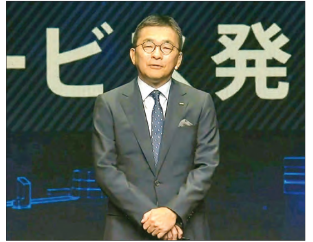
Screenshot image shows KDDI Corp President Makoto Takahashi giving an online press conference on 13 September 2021.

KDDI will finish accepting new customers for the current "povo" monthly plan, which offers 20-gigabyte services for 2,728