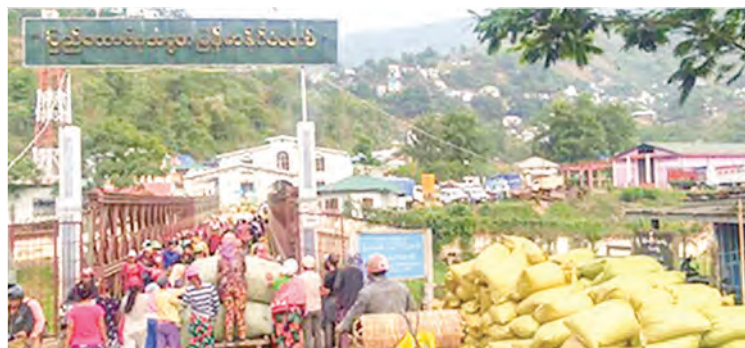
The border trade during the period increased by $106 million compared with the same period of the previous financial year.

Meanwhile, Myanmar's border trade with four neighbouring countries – China, India, Thailand and Bangladesh—totalled $8.86 billion, shared by $5.83 billion in export and $3.03 billion in import. — ACM/GNLM