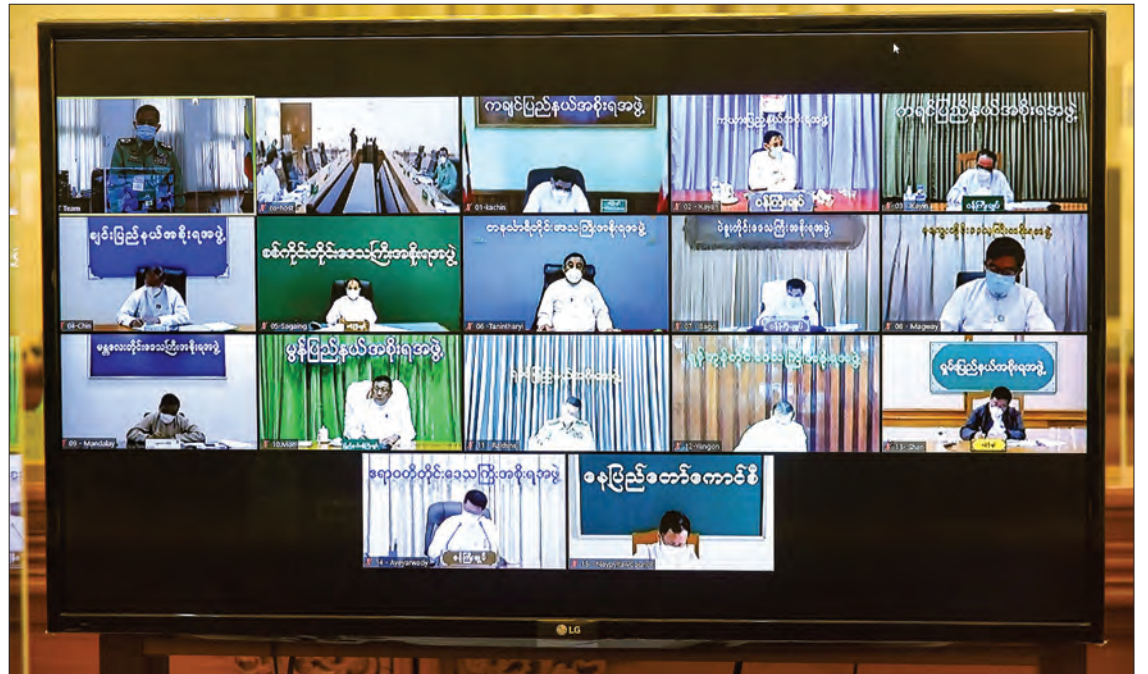
The State and Region Chief Ministers attend the 12 th meeting on COVID-19 prevention, control and treatment activities through video link.

In his concluding speech, the Vice-Senior General said as already arrived vaccines will further be distributed, a large volume of remaining vaccine stock may cause difficulty to new arrivals for storage in the cold chains. If the vaccines cannot be stored properly, they will be damaged. It is necessary to vaccinate the people in respective target groups in townships. In the vaccination process, some people do not have IDs and lose IDs in some regions, chief ministers need to form vaccination teams with some officials from the Pan