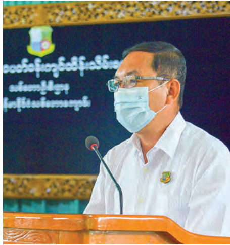
The MoNREC Union Minister meets officials from the forestry and mining sectors in Mandalay Region in PyinOoLwin yesterday.

UNION Minister for Natural Resources and Environmental Conservation U Khin Maung Yi met with officials from the forestry