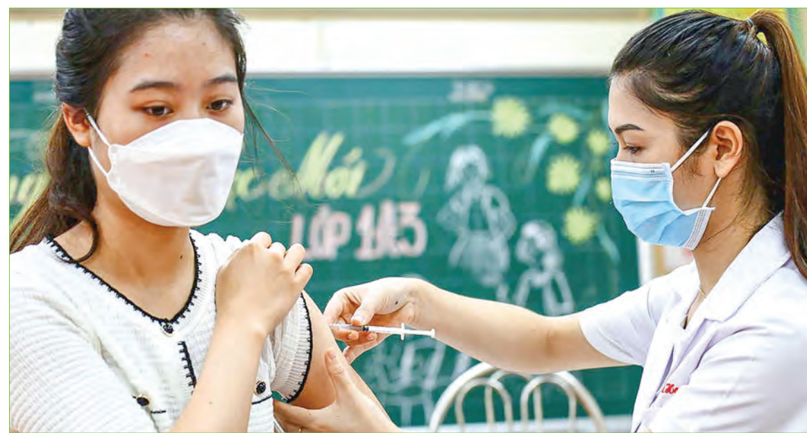
A woman (L) receives the Sinopharm COVID-19 coronavirus vaccine in Hanoi on 10 September 2021.

F ULLY vaccinated people were 11 times less likely to die of Covid and 10 times less likely to be hospitalized compared to the unvaccinated since highly contagious Delta became the most common variant, US health authorities said Friday. The data came from one of three new