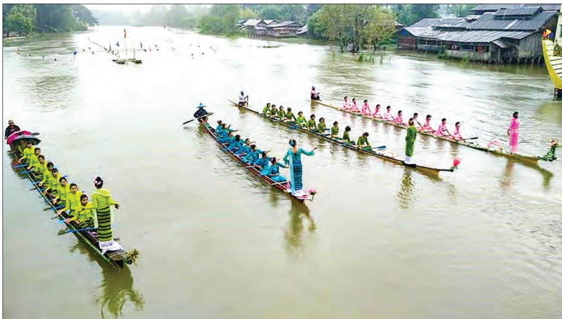
The Shin Upagutta Lighting Festival is a traditional religious festival in Kyaukkyi Township and is of great interest to the local people, especially the ploughing festival of the farmers.

This year, at a time when the world is suffering from the COVID-19 epidemic, the festival has been postponed to prevent crowds, according to the festival's organizing committee.