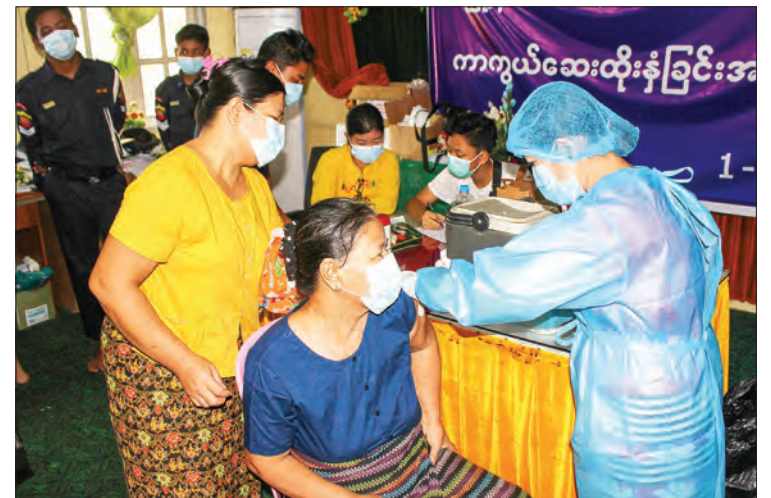
A local gets the first shot of Covid vaccine in Dala Township.

INTENDING to prevent the spreading of COVID-19, Dala township began the first dose of COVID-19 vaccination for factory workers on 13 September 2021 at Township Public Hospital.