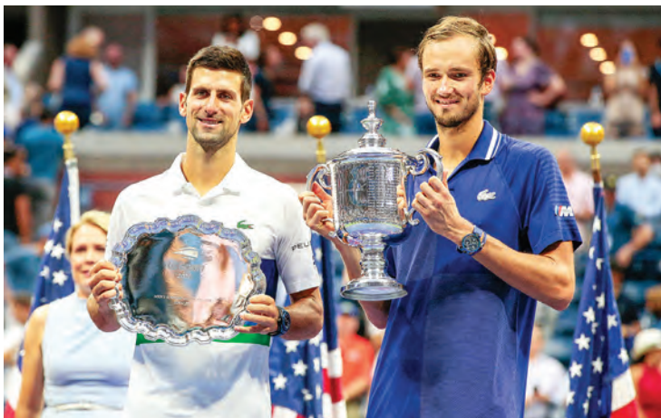
Winner Russia's Daniil Medvedev (R) and Serbia's Novak Djokovic hold their trophies after the 2021 US Open Tennis tournament men's final match against at the USTA Billie Jean King National Tennis Centre in New York, on 12 September 2021.

DANIIL MEDVEDEV shattered Novak Djokovic's Grand Slam dream with a straight sets victory in the US Open final here Sunday, denying the world number one a record-breaking 21st major men's singles title. Russia's second-ranked