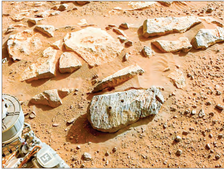
A Martian rock dubbed "Rochette" that provided NASA's Perseverance rover its first two samples.

Both samples, slightly wider than a pencil in diameter and