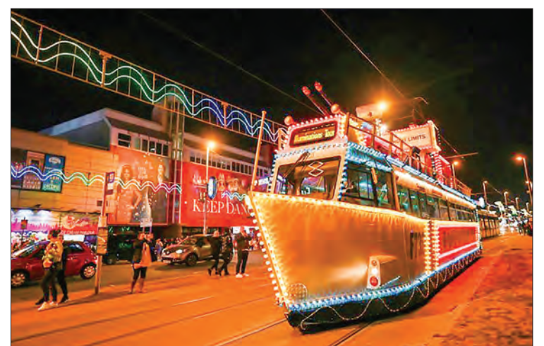
A series of lockdowns hit people and traders in Blackpool hard, exacerbating existing high levels of poverty.

Blackpool, on the Irish Sea north of Liverpool and Manchester, embodies the rise and fall of the quintessential British seaside resort. After the arrival of the railways, it became Britain's premier mass tourist destination in the 19th and 20th centuries for city dwellers to escape smog and enjoy bracing sea air and cheap entertainment.