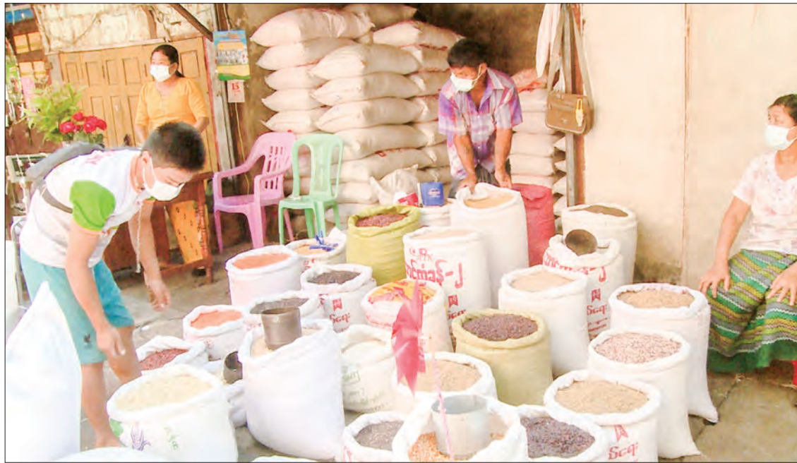
Bags of sample pulses and beans are displayed at bean brokerage.

India is the main buyer of Myanmar bean, especially black bean, green gram and pigeon pea. Besides India, Myanmar's