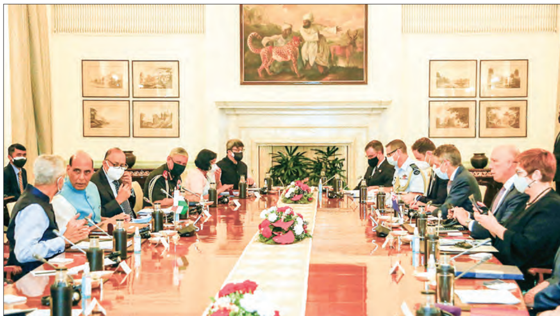
India and Australia hold "two-plus-two" security talks in New Delhi on 11 September 2021.

INDIA and Australia held their first-ever security talks involving their foreign and defence ministers in the Indian capital New