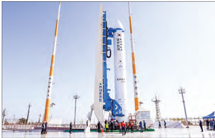
Naro Space Center is a South Korean spaceport in South Jeolla's Goheung County, operated by the state-run Korea Aerospace Research Institute. This handout photo taken on 27 November 2018 and shows a single stage rocket on its launch pad at the Naro Space Center in the southern coast county of Goheung.

THE South Korean government plans to spend 1.6 trillion won ($1.37 billion) by 2030 on developing state-of-the-art spy satellite and related rocket technology in a bid to beef up its surveillance network as North Korea continues to work on nuclear and missile development.