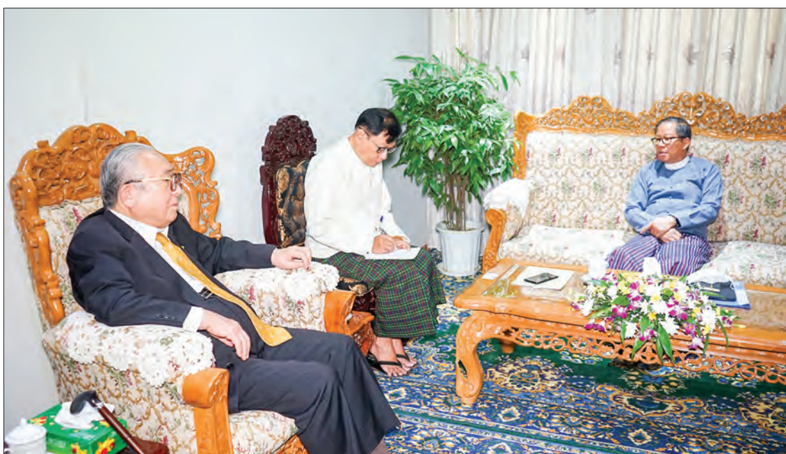
Union Minister U Tin Htut Oo and Chairman of Japan-Myanmar Association Watanabe Hideo discuss enhancement of Myanmar-Japan private sector.

UNION Minister for Agriculture, Livestock and Irrigation U Tin Htut Oo received Chairman of Japan-Myanmar Association Watanabe Hideo and party at