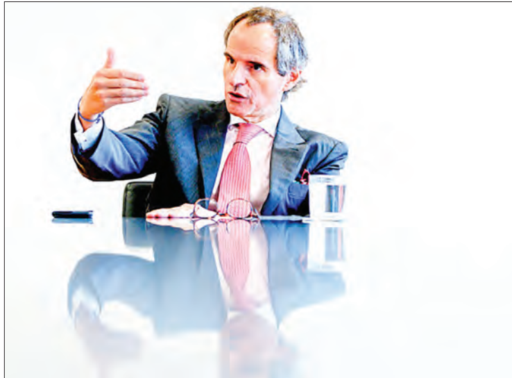
Rafael Grossi, director-general of the International Atomic Energy Agency.

The Grossi visit is being arranged for Sunday as the IAEA plans to hold a regular board