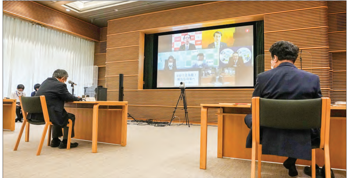
Photo shows an online meeting of Japan's National Governors' Association on 11 September 2021. During the meeting, governors expressed concerns over the potential impact of the central government's laying out of its plans for a future easing of COVID-19 restrictions.