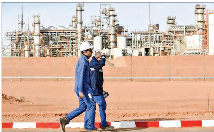
Egyptian natural gas will be piped to Lebanon via Jordan and Syria to help boost its electricity output under a plan agreed by the four governments on Wednesday to ease a crippling power crisis.

SYRIA'S Oil Minister Bassam Tohme announced on Saturday that his country will be taking a certain amount of Egypt's gas as part of the agreement to facilitate the flow of gas from Egypt to Lebanon through Syria, according to the state news agency SANA.