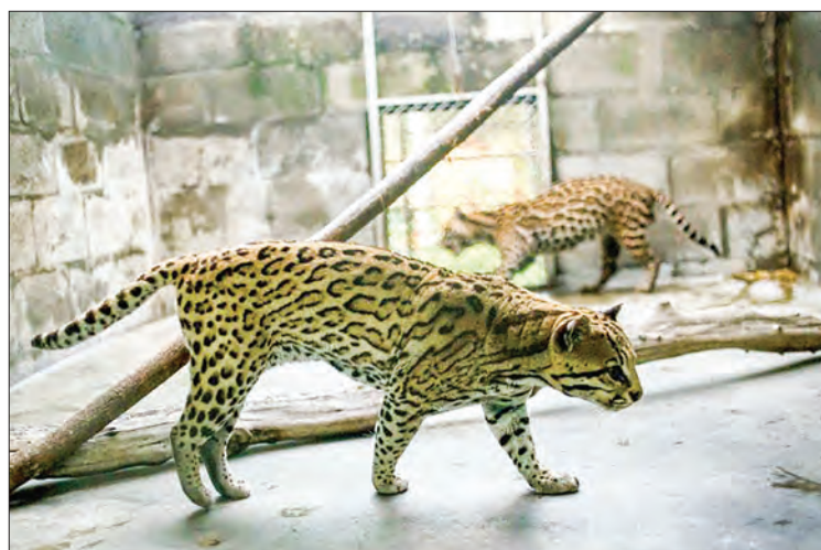
Ocelots (like these pictured in 2015 at a center in Colombia before their return to the wild) are found in the rain forest across South and Central America and even as far north as Texas.

SIX ocelots rescued from illegal wildlife traffickers have been returned to the wild in northern Ecuador, the environment ministry said on Saturday.