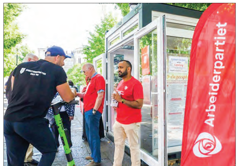
Labour Party leader Jonas Gahr Store, who is expected to become Norway's next prime minister, does not want to jeopardise the country's ties to the EU, by far its biggest trading partner.

"If I go to my wife and say 'Look, we've been married for years and things are pretty good, but now I want to look around to see if there are any other options out there'... Nobody (in Brussels) is going to pick up the phone" and be willing to renegotiate the terms, Gahr Store said in the same debate. — AFP ■