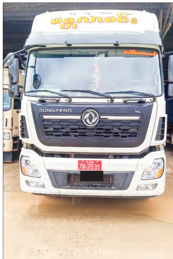
A truck is loaded with medical equipment and medicines.