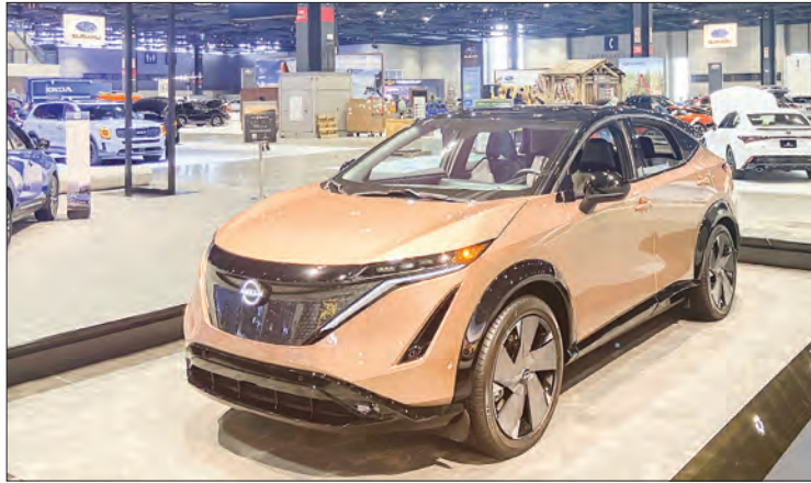
Nissan Motor Co. exhibits its new all-electric Ariya sport utility vehicle at the Chicago Auto Show on 14 July 2021.

strategic turning point in response to a major change in exhaust regulations in key markets to address global warming.