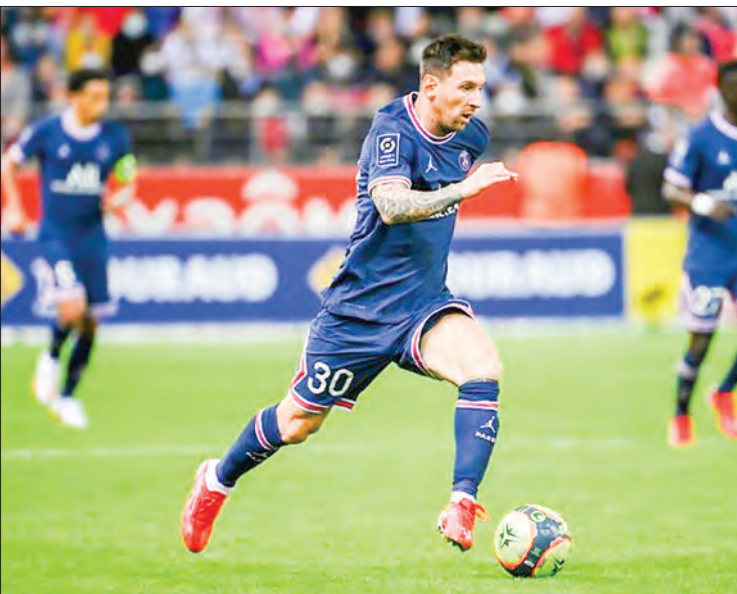
Lionel Messi could make his first start for PSG against Club Brugge in the Champions League.

AFTER a summer of eye-catching moves across Europe, the continent's top clubs begin the long road to Champions League glory next week as fans return