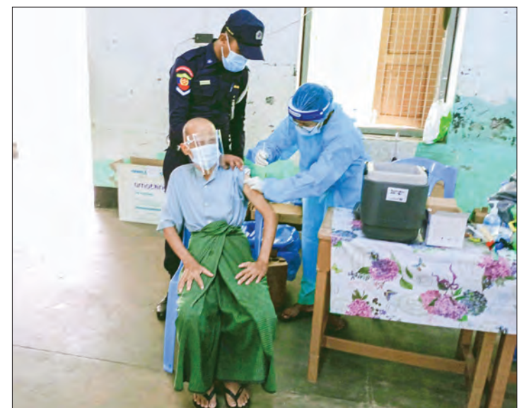
An older man receives the second jab of COVID vaccine in Kyaukpyu Township, Rakhine State, yesterday. PHOTO: TIN HTUN OO (IPRD)

On 12 September, monks and nuns from urban areas and village-tracts, elderly people, civil servants and local people received the COVID-19 vaccines, officials said. —Tin Htun Oo (IPRD)/ GNLM