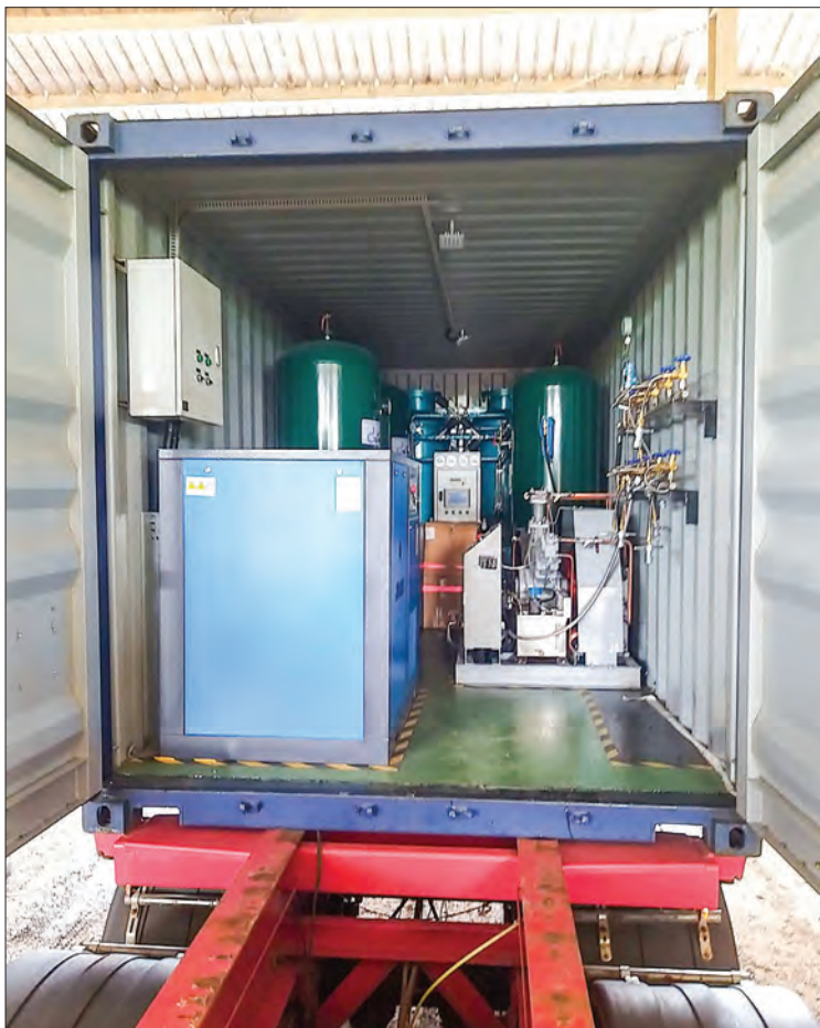
A truck is loaded with oxygen concentrators and other equipment.