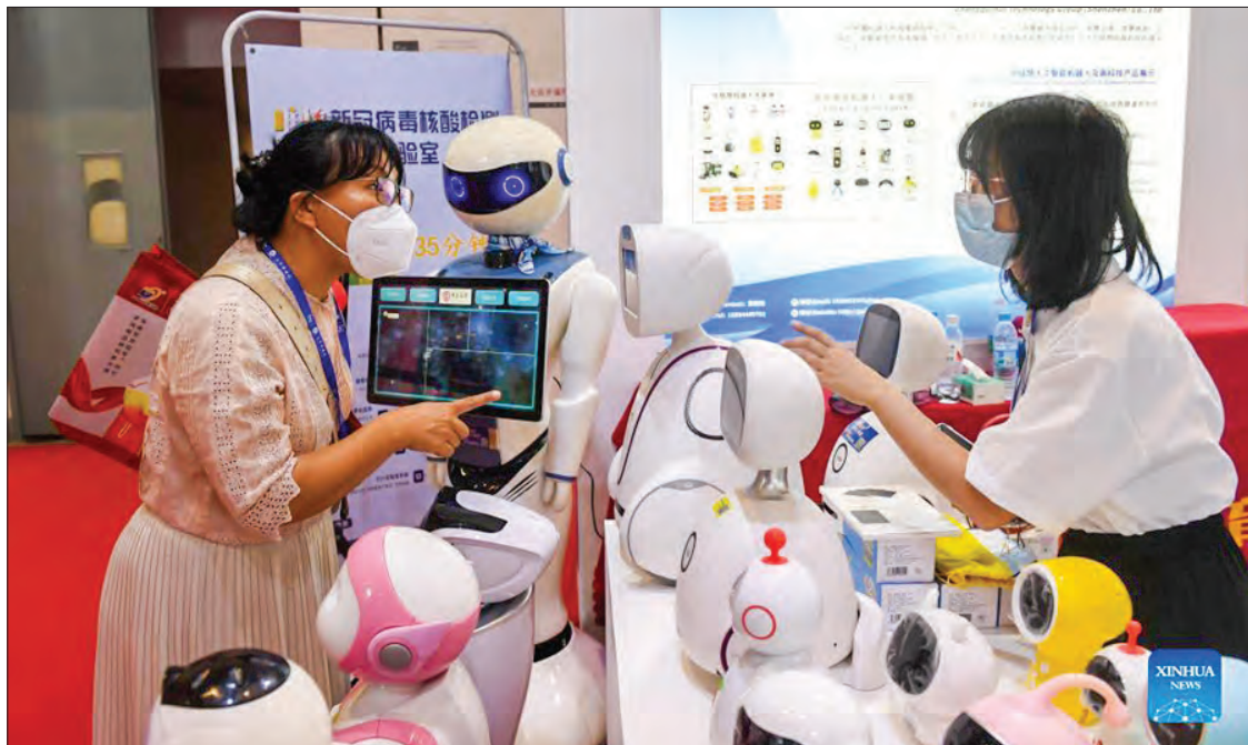
A visitor (L) learns about the performance of a robot at the 18th China-ASEAN Expo in Nanning, capital of south China's Guangxi Zhuang Autonomous Region, 11 September 2021.

"This year's expo provides an important platform to enhance trade and investment opportunities between ASEAN and China during this crucial time of economic recovery, as