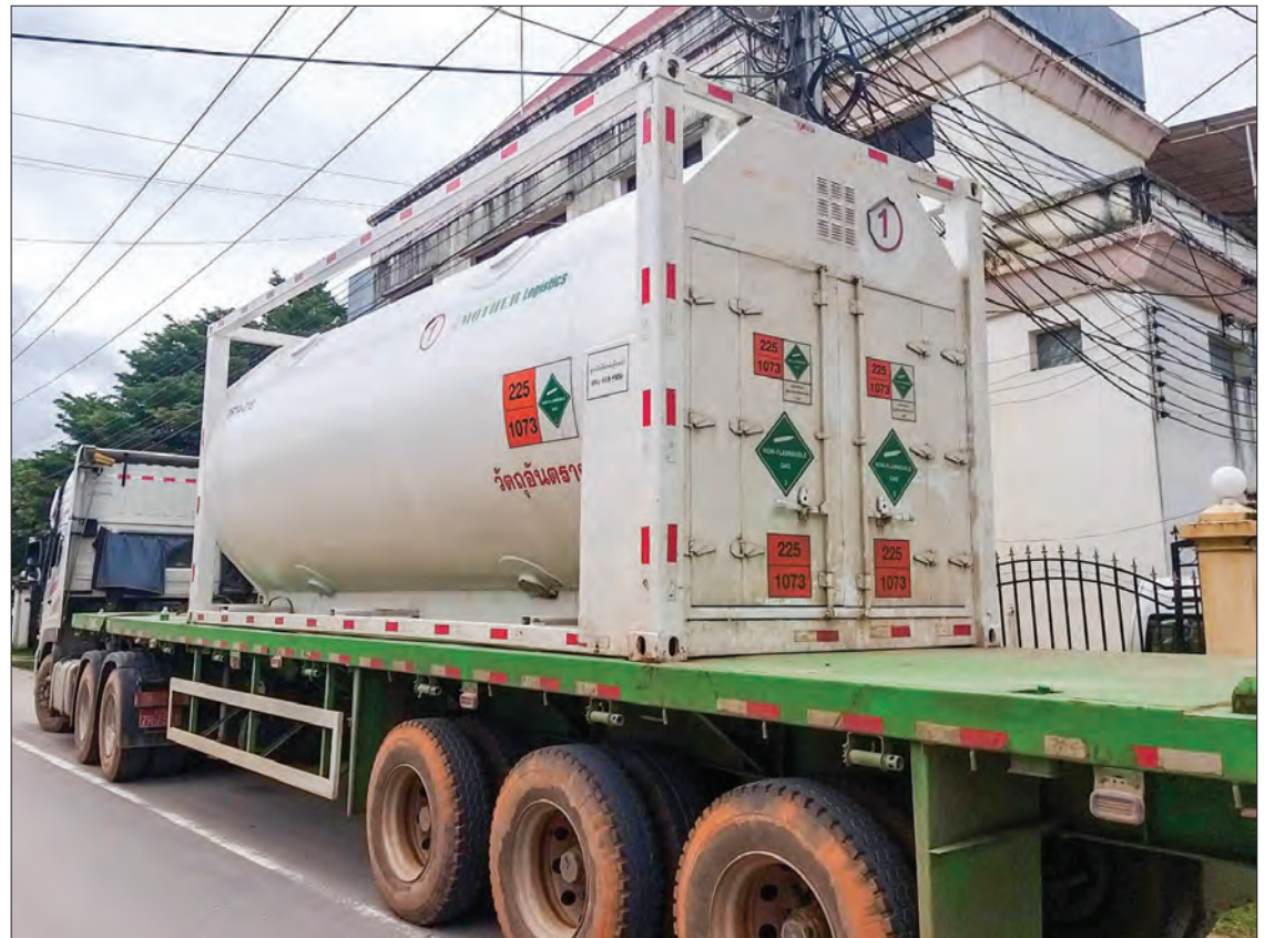
A bowser is carrying liquid oxygen to distribute it to needed people.

It is reported that the Ministry of Commerce is coordinating with relevant departments, facilitating the importations of essential medical supplies required in prevention, control and treatment of COVID-19, as well as contact persons for inquiries can be reached through the Ministry's Website— www.commerce.gov.mm .—MNA