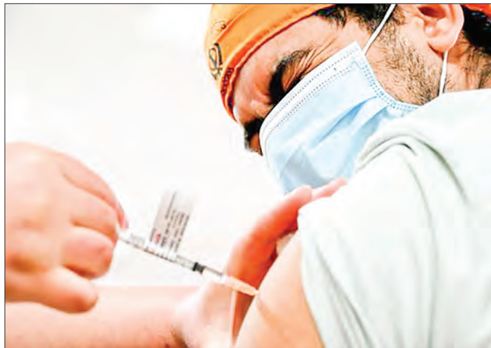
Minority communities have mobilised to battle misinformation and get people vaccinated, filling a void left by Australia's mostly Anglo-centric officialdom.

COMMUNITY groups in Australia's Covid-hit cities are battling misinformation in multiple languages as they race to vaccinate a way out of "traumatic" lockdowns.