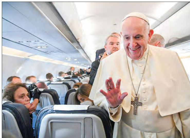
The pope's seven-hour-long stay in Hungary will be followed immediately by an official visit to smaller neighbour Slovakia of more than two days.

The pope's plane touched down just before 7.45 a.m. local time (0545 GMT), according to