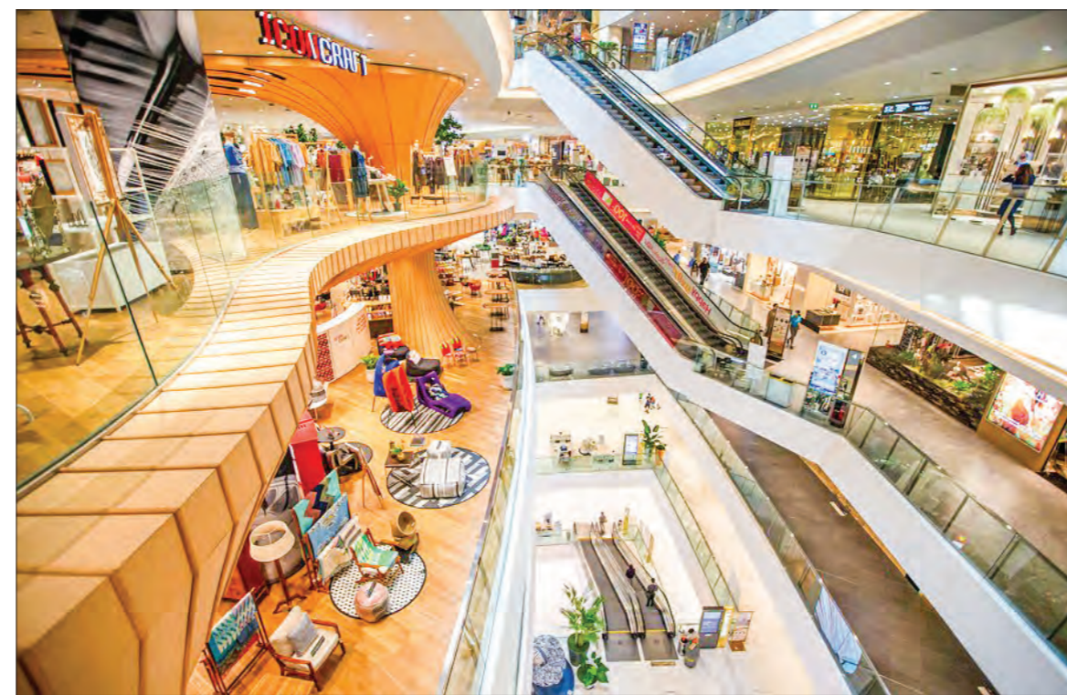
Photo taken on 1 September 2021 shows a shopping mall in Bangkok, Thailand.

The Phuket program had attracted more than 26,000 tourists during the past two months to the island, generating 1.63 billion baht (about 50 million U.S. dollars) in revenue, according to TAT. Local tourism may also get a big push as the government considered measures to encourage domestic travelling starting from mid-October if the number of COVID-19 new cases remains at a manageable level. According to Minister of Tourism