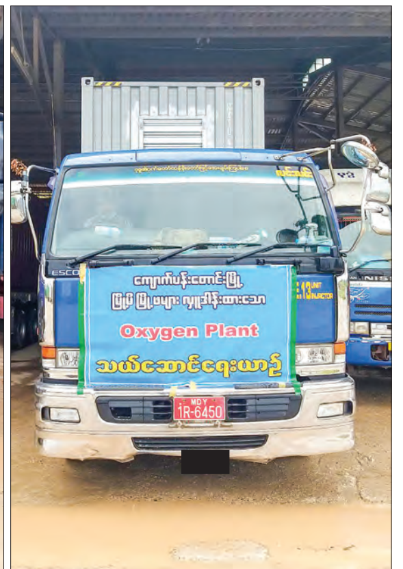
A cargo truck carrying medical equipment is ready to start transportation.