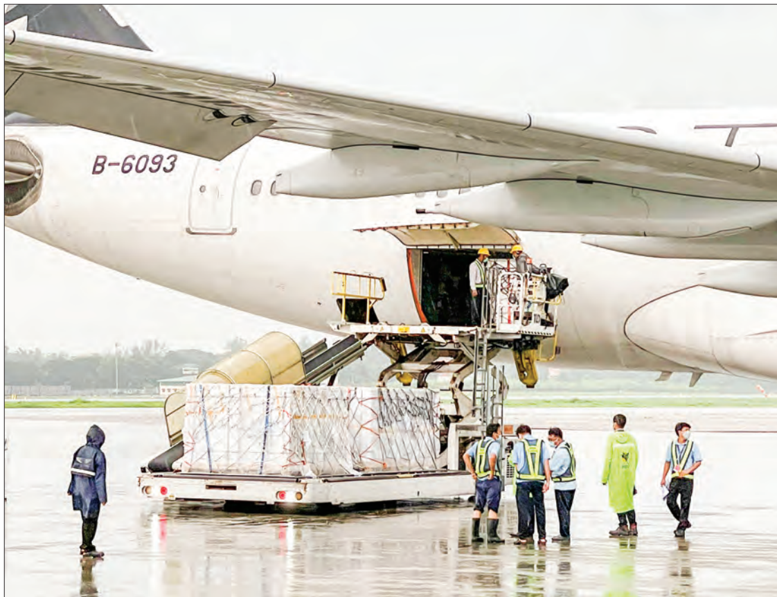
Packages of Sinopharm anti-COVID-19 vaccine are being unloaded from aboard the airplane at Yangon International Airport on 12 September 2021.