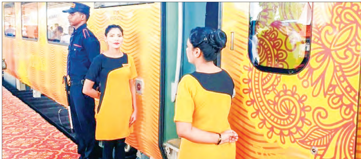
Indian Railways announced their plan to spread rail-based tourism among masses through leasing of coaching stock to interested parties to run them as theme-based cultural, religious, and other tourist circuit train.

INDIAN Railways on Saturday (September 11) announced their plan to spread rail-based tourism among masses through leasing of coaching stock to interested parties to run them as theme-based cultural, religious, and other tourist circuit train.