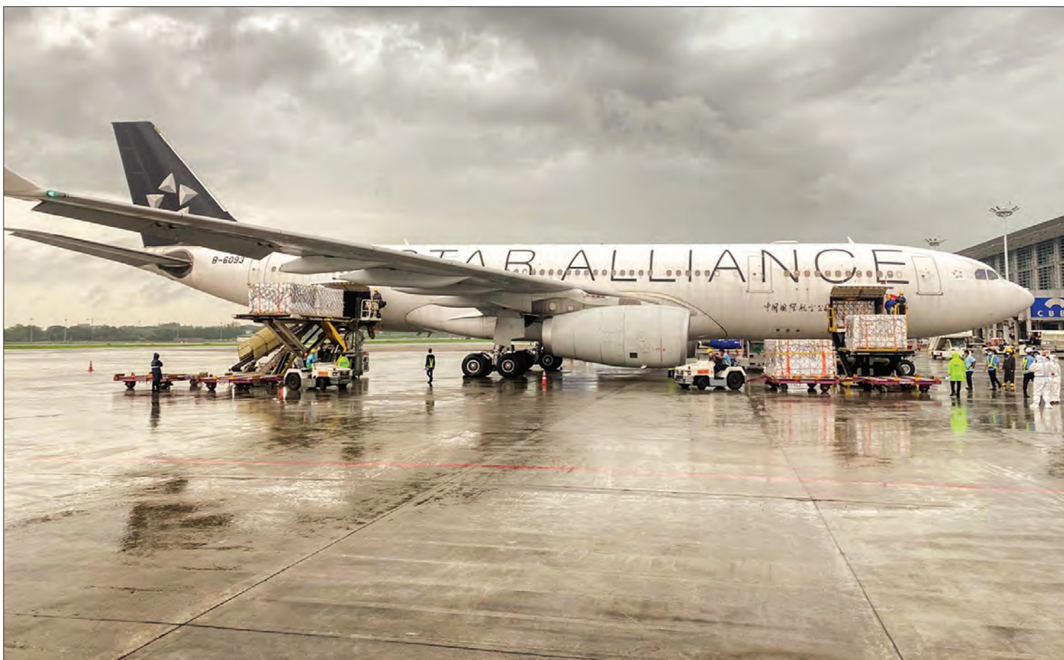
Packages of Sinopharm anti-COVID-19 vaccine are being unloaded from aboard the airplane at Yangon International Airport on 12 September 2021.

FOUR million Sinopharm vaccines out of 24 millions purchased from China arrived at the Yangon International Airport yesterday evening.