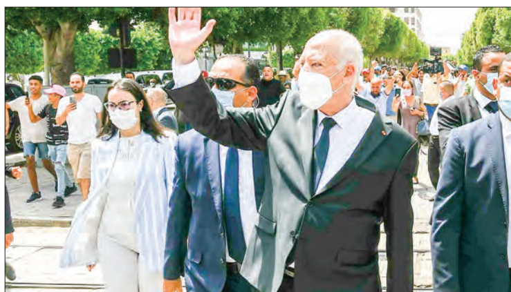
Tunisian President Kais Saied has announced plans to amend the constitution and form a new government.

"The Tunisian people rejected the constitution," he said, while adding that the charter is "not eternal". "We can introduce amendments to the text," he said. Elected in late 2019, the