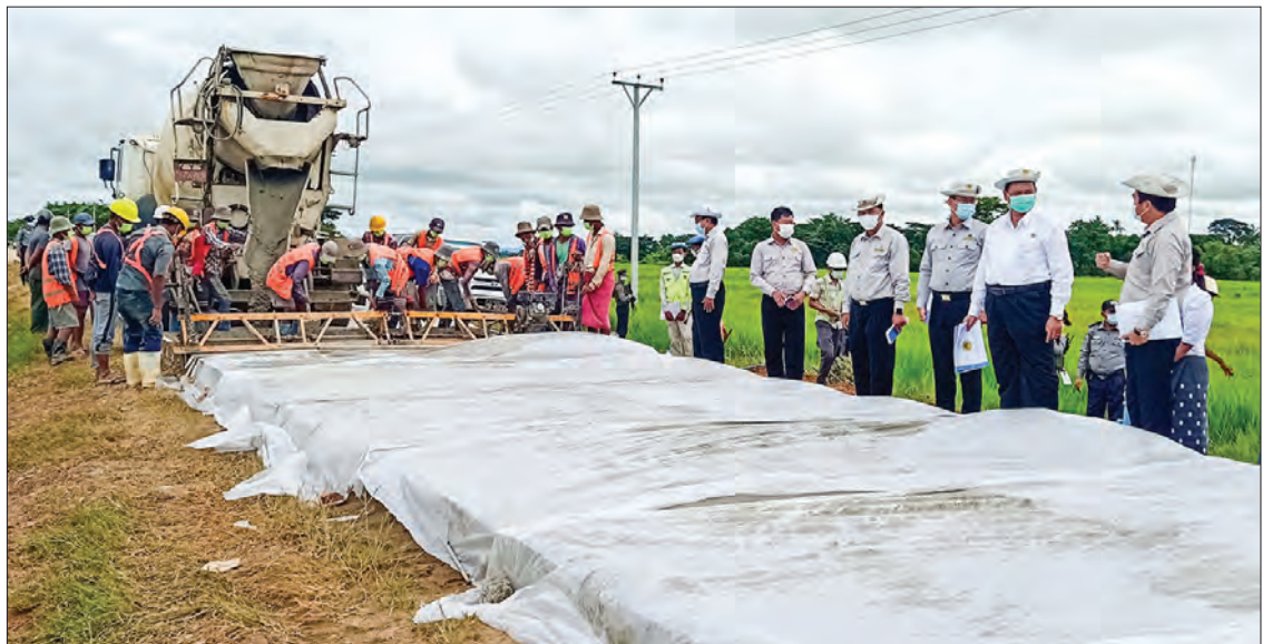
Union Minister U Shwe Lay views paving of concrete road with the use of heavy machinery.

inspected the expansion of Phayagyi-Bawnetgyi road to a four-lane, a road network to Yangon-Bago-Toungoo-Meiktila-Mandalay Union Highway and Yangon-Nay Pyi Taw-Mandalay