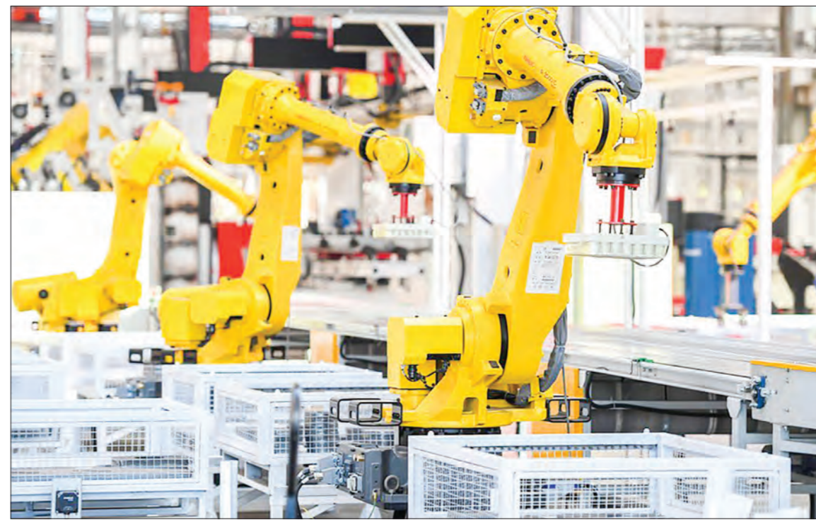
Photo shows robots working at a plant of Sany Heavy Industry in Changsha, central China's Hunan Province, 20 February 2020.

According to the ministry, over 237,000 industrial robots were produced in China in 2020, up 19 percent year-on-year. The latest data from the National Bureau of Statistics showed over 205,000 industrial robots were produced during the first seven months of this year, up nearly 65 percent year-on-year.