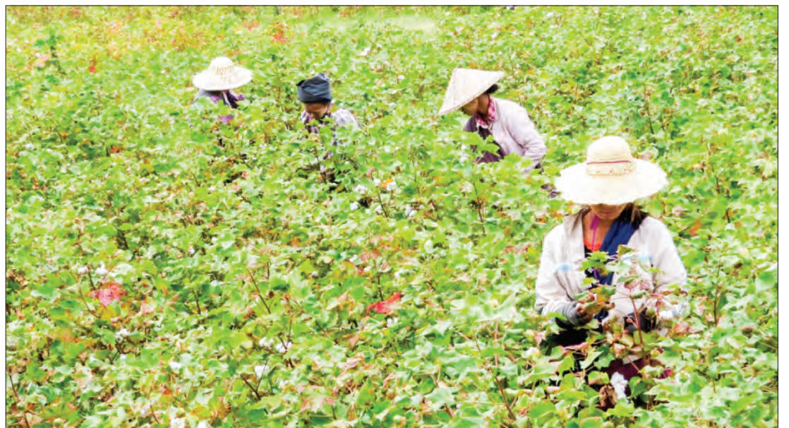
Female farming workers are picking out wools of cotton plantations.

THE prices of cotton this year touch a low of K900 per viss (a viss equals 1.6 kg), whereas it fetched up to K1,500 per viss last year, the growers stressed.