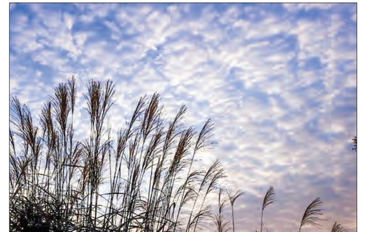
A garden favourite or an invasive pest?

THE tall and attractive stranger has showy plumes and can make itself at home at the coast, in the city or even in your garden.