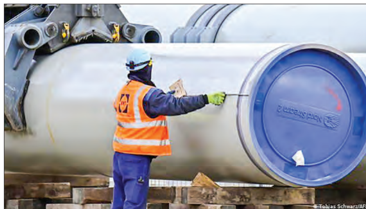
The 10-billion-euro ($12-billion) Nord Stream 2 pipeline is set to double Russian gas supplies to Germany.

MOSCOW announced Friday the completion of the controversial Nord Stream 2 gas pipeline, which critics say will increase Europe's dependence on Russian gas and bypasses a key EU