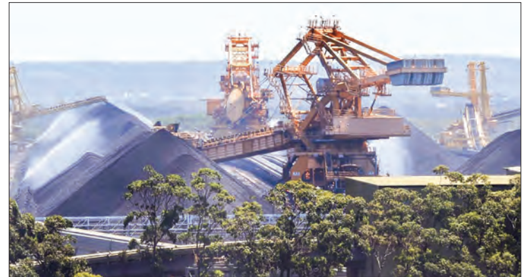
Prime Minister Scott Morrison said Australia's energy resources exports were needed to power developing countries.

"We will keep mining the resources that we're able to sell on the world market," Morrison told a news conference when asked if he would put an "expiration date" on the coal mining industry. "We obviously anticipate that over time world demand for these things may change." Under existing agreements, developing countries are able to use Australian