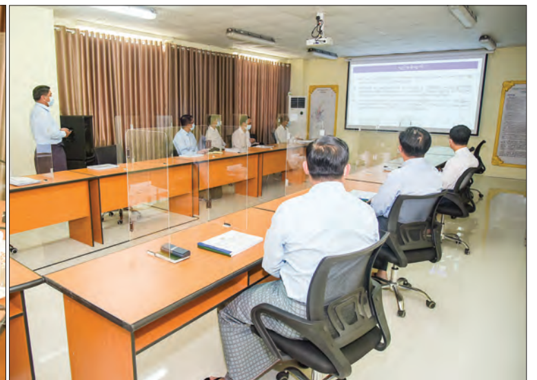
The Senior General hears the reports presented by the MoTC Union Minister and officials at the meeting hall yesterday in Nay Pyi Taw.