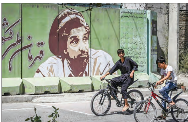
There are murals and billboards all over Kabul with the face of revered Afghan guerrilla commander Ahmad Shah Massoud.

IN the streets of Kabul, it is difficult to miss Ahmad Shah Massoud — the revered guerrilla