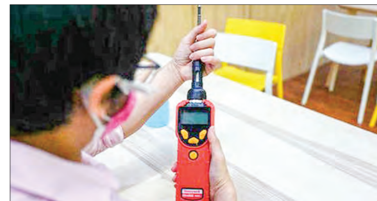
Chadin hopes the device might be rolled out as an affordable alternative to more expensive swab tests.