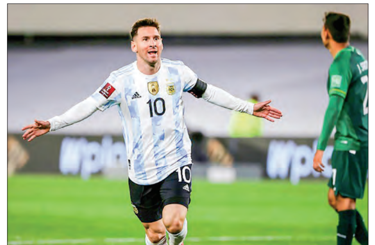
Argentina's Lionel Messi celebrates after scoring against Bolivia in a World Cup qualifier on Thursday.

The Argentina captain then moved one clear of Pele in the 64th minute with his second of the night, surging into the Bolivian box and playing a one-two with Lautaro Martin-