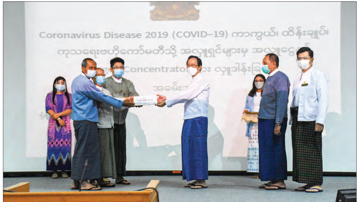
The MoH Union Minister receives the K3 million donation from well-wishers to the Central Committee on Prevention Control and Treatment of COVID-19 yesterday.

After donations, Union Minister Dr Thet Khaing Win presented certificates of honour to the donors. Afterwards, the Union Minister expressed words of thanks and appreciation for the donation of K3 million and oxygen concentrators.—MNA