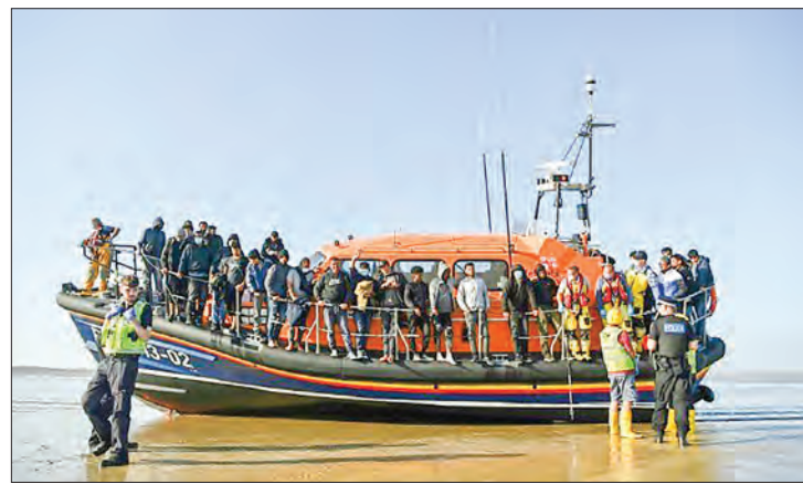
A record 828 people crossed over from France on a single day in late August

But several newspapers said she has now secured legal advice and sanctioned the use of "pushback" tactics to turn back the small boats before they reach Britain's south coast. Prime Minister Boris Johnson's Downing Street office said Thursday that "it's right that our Border Force has the right range of tactics to address this problem".—AFP ■