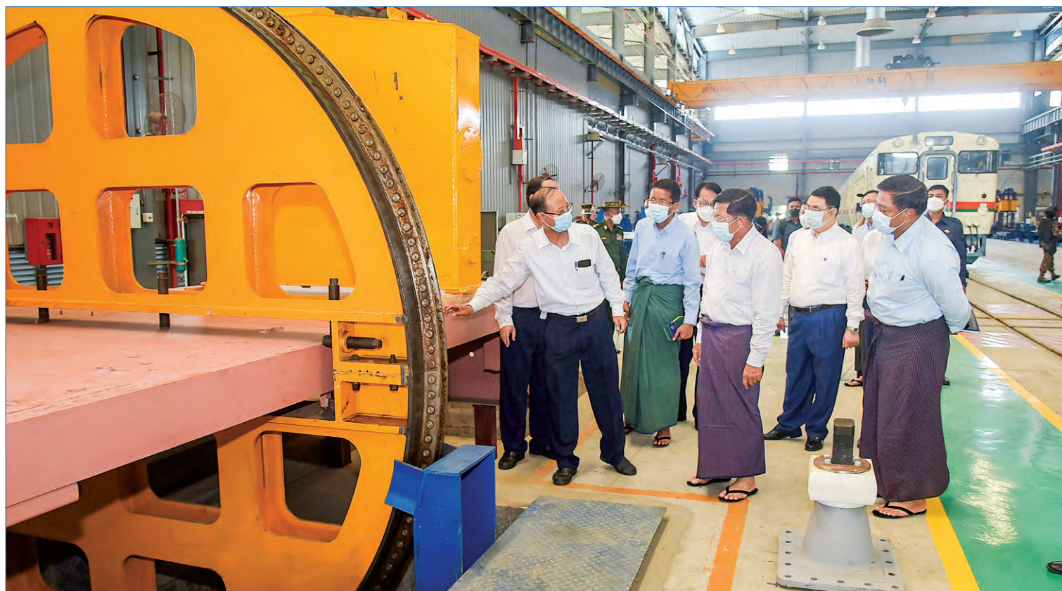
SAC Chairman Prime Minister of Provisional Government of Myanmar Senior General Min Aung Hlaing pays an inspection tour around the New Locomotive Assembling Factory (Nay Pyi Taw) on 10 September 2021.