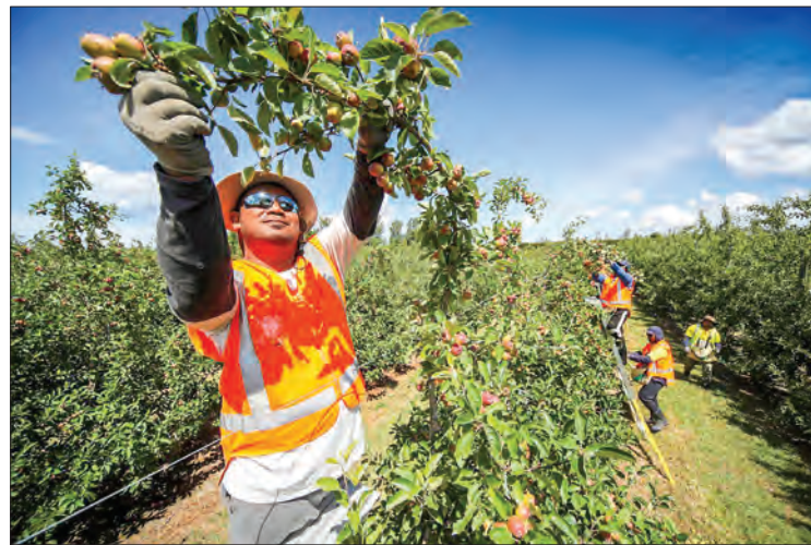
Seasonal workers from Samoa, Tonga and Vanuatu will be able to enter New Zealand to work for New Zealand's summer harvest.

"We are starting solely with RSE workers for several reasons. RSE workers come to New Zealand in a cohort, and stay in employer-arranged accommodation. This helps mitigate any additional risk from COV-