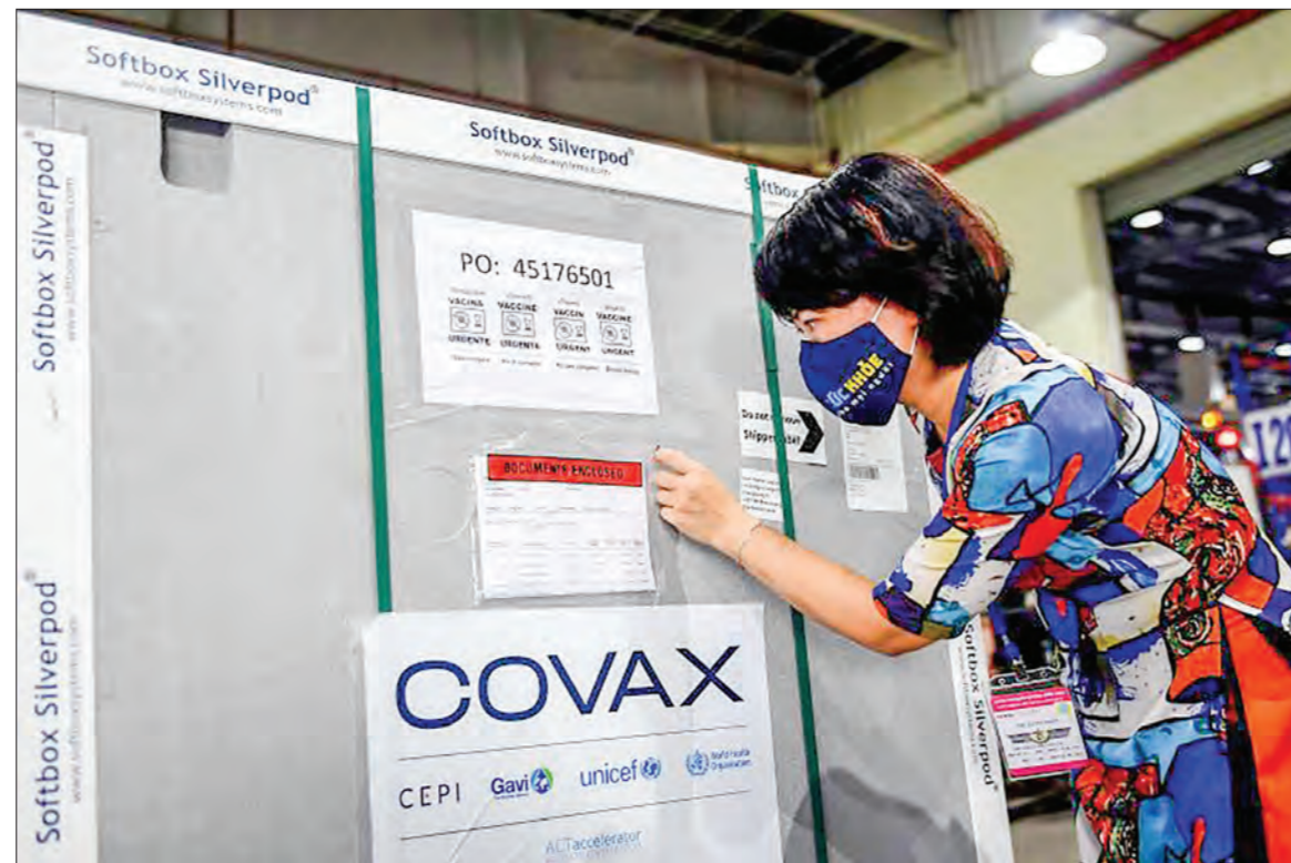
A Health Ministry official checks documents on a container carrying the first shipment of the AstraZeneca/Oxford Covid-19 coronavirus vaccine doses, as part of the UN global Covax programme, as it arrives at the Noi Bai International Airport Cargo terminal in Hanoi on 1 April 2021.

But today, the statement continues, "COVAX's ability to protect the most vulnerable people in the world continues to be hampered by export bans, the prioritization of bilateral deals by manufacturers and countries, ongoing challenges in scaling up production by some key producers, and delays in filing for regulatory approval."