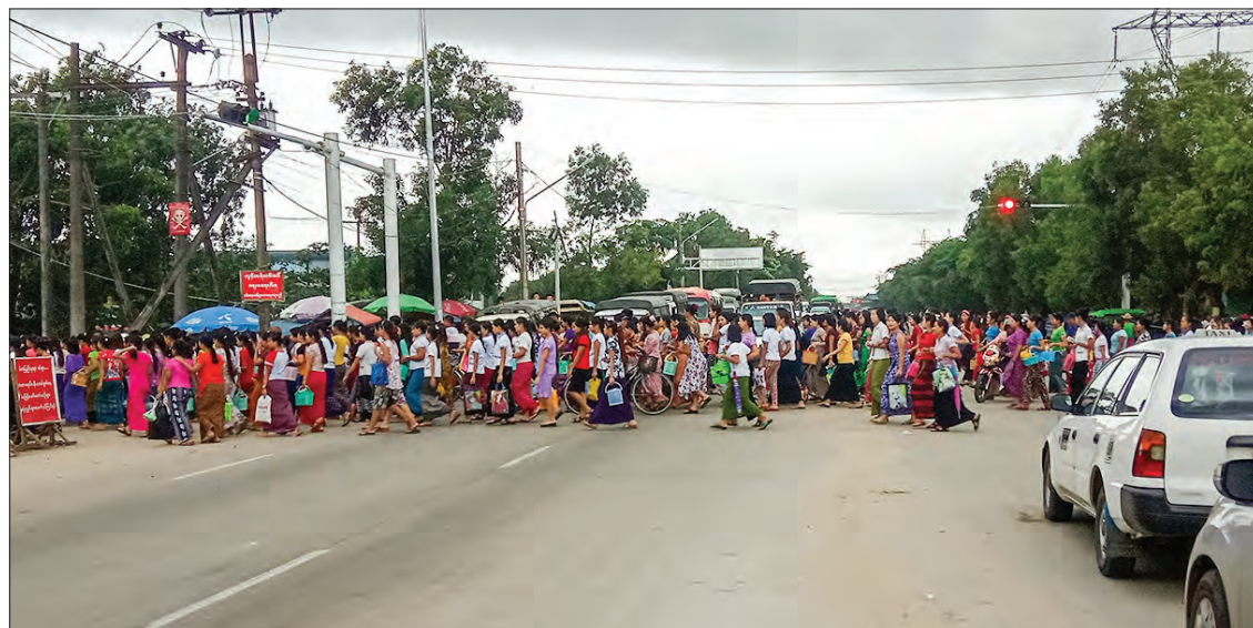
Factory workers are seen crossing the No 5 Main Express Way into the Industrial Zones 1, 2 and 3.

"We are happy at the current cooperation of ministries in import/export sectors as there is no off-day in this sector. Then, the government vaccinates the factory workers and it can grab the trust of our market, and so we are eager to run the operations. I want the government to provide the needed assistance