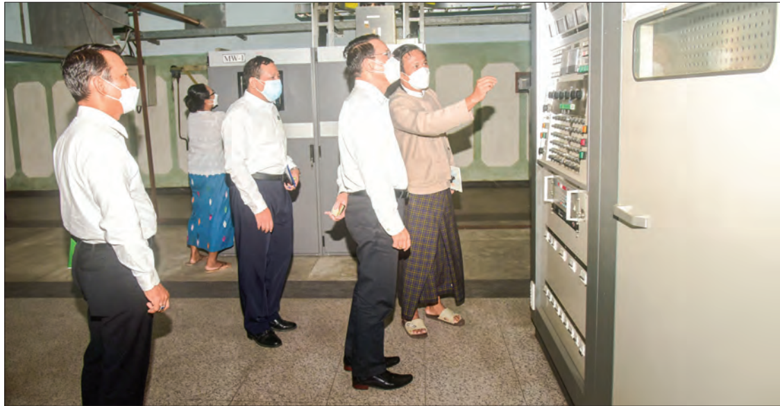
The MoI Union Minister inspects around the MRTV Yeku Broadcasting Station in Yangon yesterday.

of the GTC Publishing House, the Union Minister said it is important for the printing houses to print the required books for the state as per the time frame, and thus it is important to do the reformation. He said it is necessary to submit reports to build staff housings in each financial