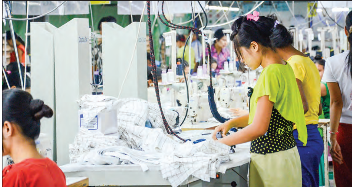
Myanmar's garment exports witnessed a decline of over 20 per cent in the past eight months (October-May) of the current financial year 2020-2021 compared with a year-ago period on the back of a slump in demand by the European Union market.

The figures plunged from $2.7 billion in the corresponding period of the last FY2019-2020.