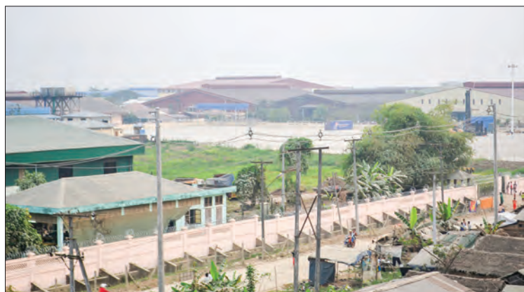
One of the Industrial Zones in Hlinethaya.