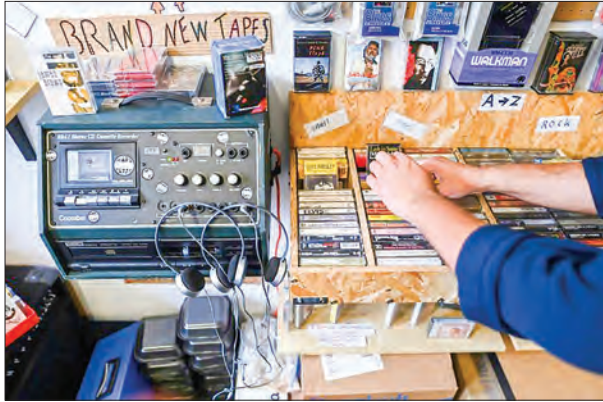
Cassettes are relatively cheap to produce and the shop sells tapes from local indie bands.

TUCKED away in a corner of the top floor of an indoor market in Manchester, northwest England, is the last shop in Britain dedicated to selling cassettes. Mars Tapes crams around 1,000 cassettes, a Coca-Cola radio, boom boxes, vintage editions of the Walkman cassette player and other tape-related accessories in a compact retail unit smaller than one of the city's