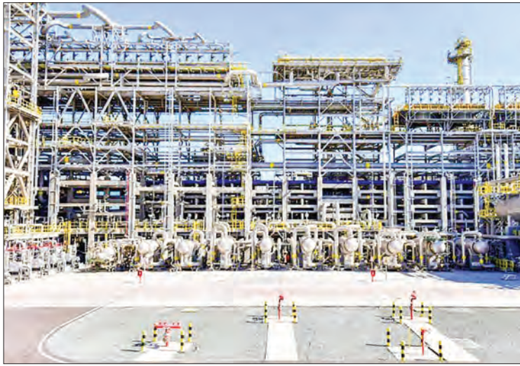
The Biden administration aims to reduce emissions from aviation fuel by 20 per cent by shifting production away from conventional jet fuel.