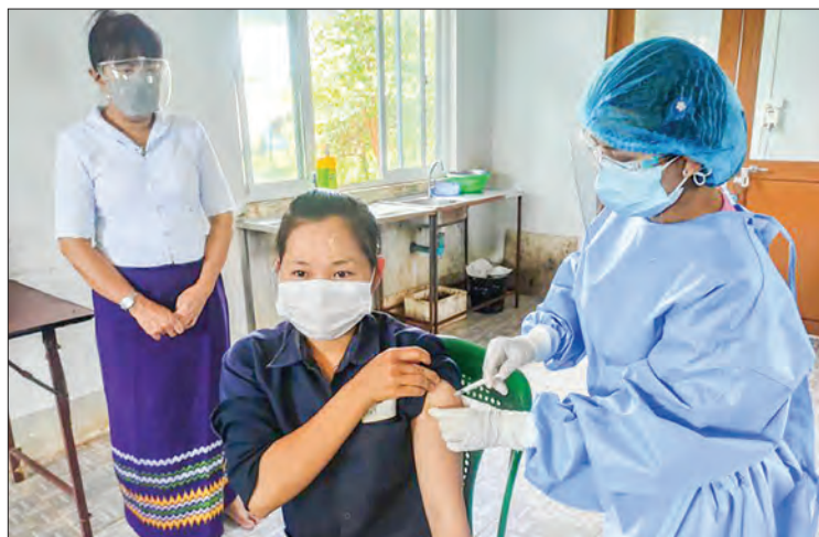
A factory worker receives the second jab of COVID vaccine in Bago Industrial Zone.

The second round of vaccination began on September 9 and the first day, a total of 2,620 workers from 17 factories received the COVID-19 jabs and on the second day, 2,599 workers from 16 factories were vaccinated.