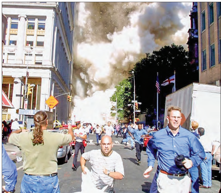
In this file photo a tower of the World Trade Center collapses in lower Manhattan, New York on 11 September 2001.