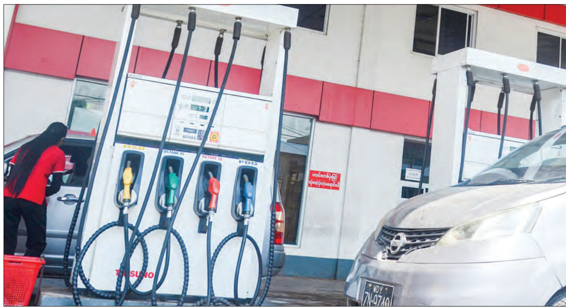
Myanmar imports around 6 million tonnes of fuel oil per year, according to the Ministry of Commerce. The imports are mainly from Singapore.

DOMESTIC fuel prices have increased by K40 to K65 per litre in 10 days, according to local filling stations.