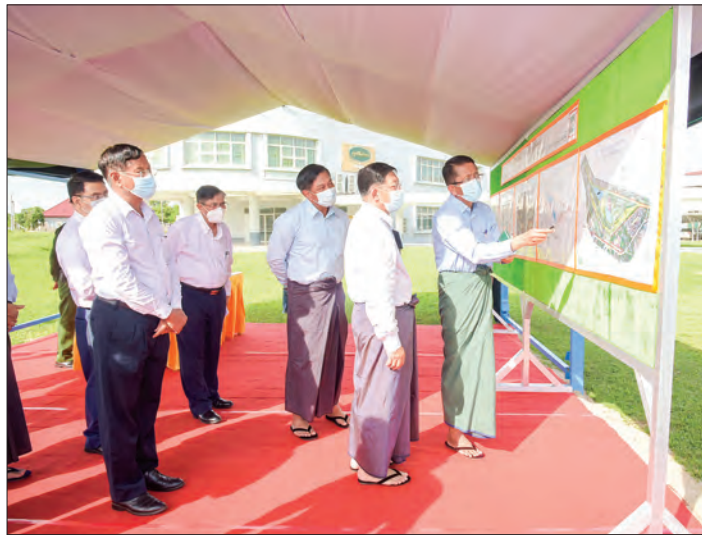
The Senior General and party inspects the preparations to build the Railway Museum at the Nay Pyi Taw Railway Station.