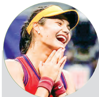
Britain's Emma Raducanu became the first qualifier to ever reach a Grand Slam final by defeating Greek 17th seed Maria Sakkari on Thursday in the US Open semi-finals.

BRITISH 18-year-old Emma Raducanu on Thursday became the first qualifier in history to make a Grand Slam final when she reached a fairytale US Open decider against another teenager, 19-year-old Canadian Leylah Fernandez.