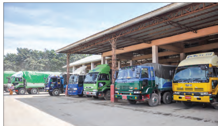
Myanmar mainly exports agricultural products, animal products, marine products, minerals, forest products, manufacturing goods and others to foreign trade partner countries while capital goods, intermediate goods and consumer goods are imported into the country.

Myanmar mainly exports agricultural products, animal products, marine products, minerals, forest products, manufacturing goods and others to foreign trade partner countries while capital goods, intermediate goods and consumer goods are imported into the country.