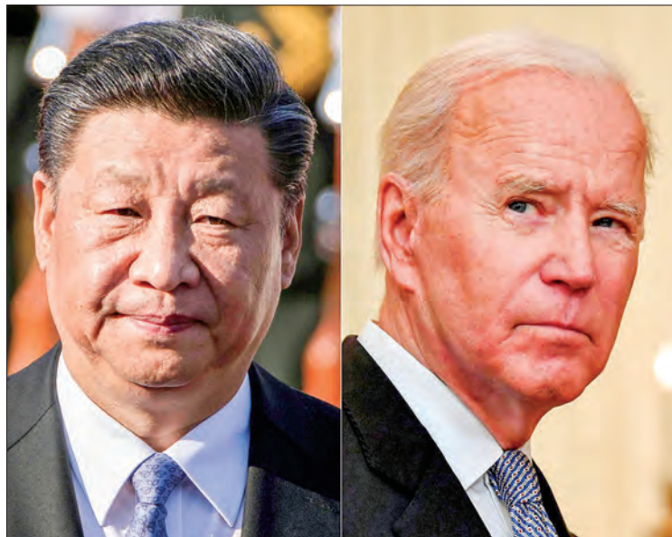
Chinese President Xi Jinping and US President Joe Biden talked by phone for the second time this year.

US-China relations went into a nosedive under Biden's predecessor Donald Trump, who launched a trade war between the world's number one and two economies and harangued the Chinese government for its handling of the coronavirus pandemic. Biden's administration, while urging multilateralism and an end to Trump's "America first" ideology, has kept trade tariffs in place and remains tough on other contentious areas of the relationship with Beijing, such