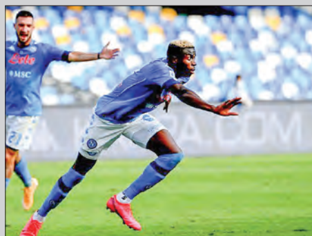
Victor Osimhen scored 10 times in 24 Serie A appearances last season.

Napoli await for Massimiliano Allegri's team who have so far managed just a point from their two league fix-