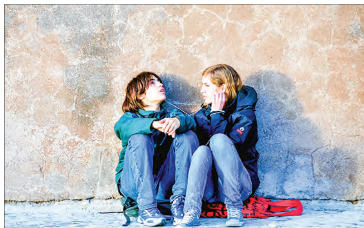
A record high number of young Australians experienced psychological distress in 2020, a survey has found.

"But also climate change has had an impact — (Young people) understand that their lives, their futures are different to previous generations," she said. The re-