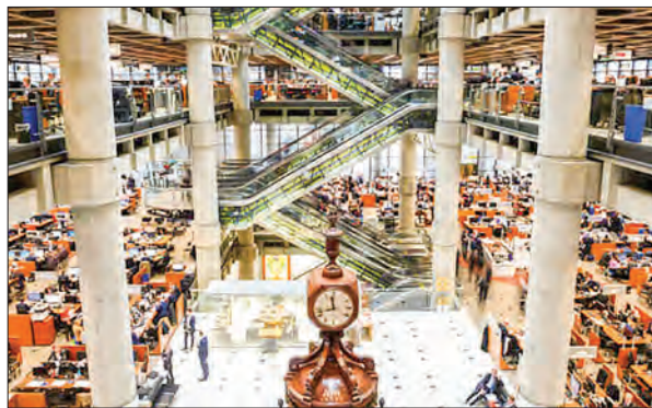
The interior of Lloyd's of London, the centuries-old insurance market, is pictured in central London on 27 April 2016.