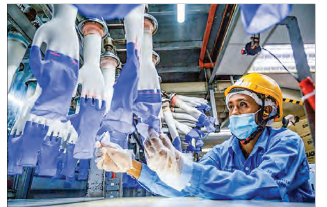
Top Glove is the world's leading surgical glove maker, capable of making up to 100 billion gloves a year.

people," it said in a statement. The firm's shares rose were up more than two percent in Kuala Lumpur. There was no immediate reaction from CBP. In an initial probe last year, CBP said it suspected there was evidence of debt bondage, excessive overtime, and abusive working and living conditions in Top Glove's production processes.—AFP ■