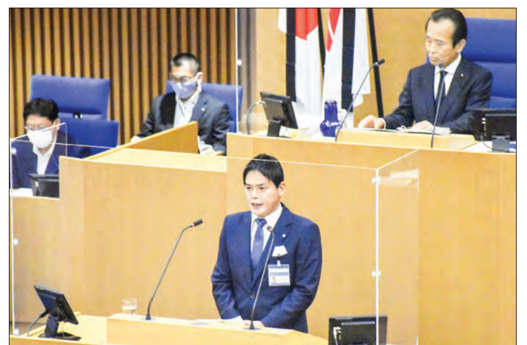
New Yokohama Mayor Takeharu Yamanaka (front C) delivers his first policy speech at a city assembly session on 10 September 2021.

and April next year for the integrated resorts under legislation that cleared parliament in 2018 to legalize casino gambling in Japan.—Kyodo ■