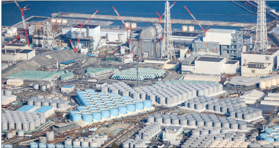
An extensive pumping and filtration system removes most radioactive elements from the water stored at the Fukushima plant.

THE UN nuclear watchdog on Thursday promised a "comprehensive" and "objective" review of Japan's controversial plan to