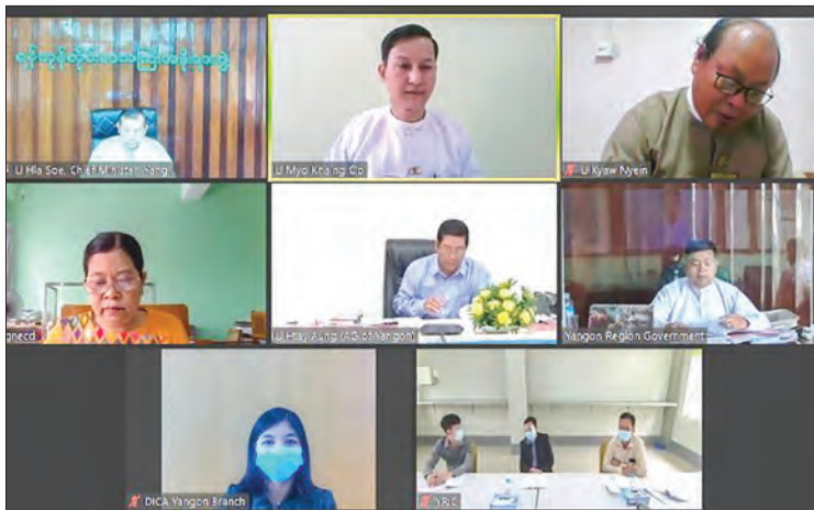
At the meeting, YRIC endorsed one foreign investment business with a total capital amount of $1.095 million in the manufacturing sector and is expected to create 851 local job opportunities. Moreover, they discussed the general issues of the other four companies.

To date, foreign investments from China, Singapore, Japan, Hong Kong, the Republic of Korea, Viet Nam, India, China (Taipei), Malaysia, the British Virgin Islands and Seychelles are arriving in the region. — Soe Myint Aung/GNLM