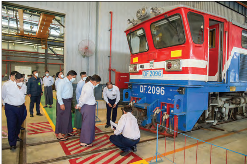
The Senior General and party observe the process at the New Locomotive Assembling Factory (Nay Pyi Taw).

riages and delay travelling. Emphasis must be placed on the maintenance of railways for the long run meeting the set standard. It is necessary to upgrade the Yangon-Pyay railway, the first facility of its kind, to the electric railway under the long-term plan but the immediate one. The Senior General stressed the need to consider the designs of building the river-crossing railway bridges in the double bridge design or parallel bridge design by taking lessons from the past wrong events.