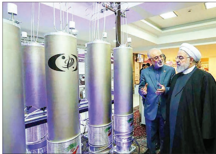
Outgoing President Hassan Rouhani inspecting one of Iran's nuclear plants.

"Since 23 February 2021 the Agency's verification and monitoring activities have been seri-