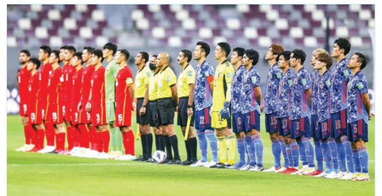
Players of Japan (blue) and China (red) stand for the national anthems prior to their World Cup qualifier match in Doha on 7 September 2021.

ers for bouncing back with a positive attitude following last Thursday's disappointing loss to Oman at Panasonic Stadium.