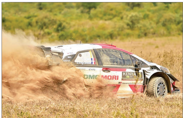
Sebastien Ogier leads the WRC standings but will not get the chance to claim the title in Japan.

THE World Rally championship event in Japan, which was due to take place in mid-November,