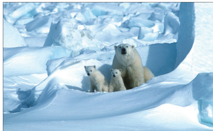
Polar bears depend on the frozen ocean to hunt for their main sources of food: seals and walrus. The bears are the bosses here, this is their home,' says Dmitry Lobusov.

A massive icebreaker cuts its way through the frozen waters of the Arctic Ocean, clearing a path to the North Pole, all white as far as