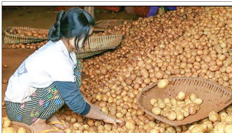
About seven to eight trucks load of potatoes are daily supplied to Thirimarla Vegetable wholesale market. The prices are higher than last year.

At present, the inflow of potatoes from the Ywangan area to the Mandalay market is steady. Meanwhile, the harvest time has already finished