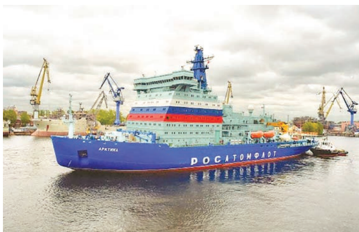
Russia has a fleet of five icebreakers and a container ship and is building four more nuclear-powered vessels within the next five years.

As an icebreaker called the "50 Years of Victory" left the port of Murmansk for the North Pole this summer, its captain told an