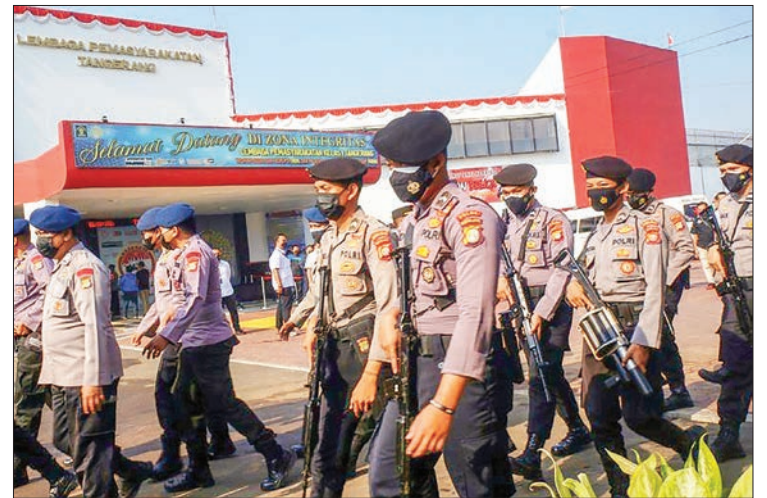
A fire at the Tangerang Penitentiary, just outside Jakarta, has killed 41 people.

Firefighters extinguished the blaze — which was mostly contained within one block that housed prisoners jailed on drug charges — at around 3:00 am (2000 GMT Tuesday) and evacuated the victims. Television footage showed a massive fire raging through the prison block, with thick smoke billowing from the building as firefighters raced to put out the flames. "Forty-one inmates died, eight were badly injured and 72 others sustained minor injuries," Jakarta police chief Fadil Imran told a press