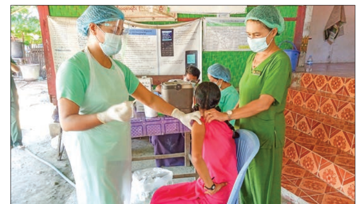
The first inoculation drive in MraukU IDP camps.

A total of 171 people from five IDP camps received their Sinopharm vaccines yesterday.