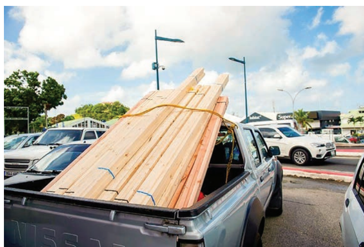
Logjam: More than half of French builders say they're experiencing problems with raw material supplies.

FRENCH builders were as busy in the first half of this year as they were before the pandemic