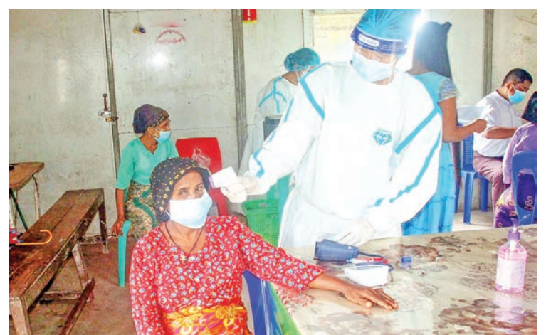
A health worker examines the body temperature of an IDP before inoculation.

“I would like to say thanks to the volunteers who assisted in the vaccination works. I would also like to thank the Head of State for providing us