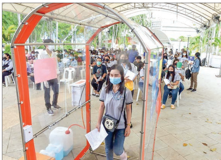
Citizens wait to receive COVID-19 vaccines in Bangkok, Thailand, 9 July 2021.

tients were discharged from hospitals over the last 24 hours after making a full recovering from the virus, almost 3,000 more than the newly infected, according to the CCSA. Since the pandemic started early last year, the accumulative number of COVID-19 stands at 1,308,343 with 13,283 total fatalities. Over 700,000 COVID-19 vaccines have been administered on Monday, making the total number of COVID-19 vaccination doses given in the country rose to above 36.6 million. About 15 per cent of the Thai population have been fully vaccinated against the virus so far.—Xinhua ■