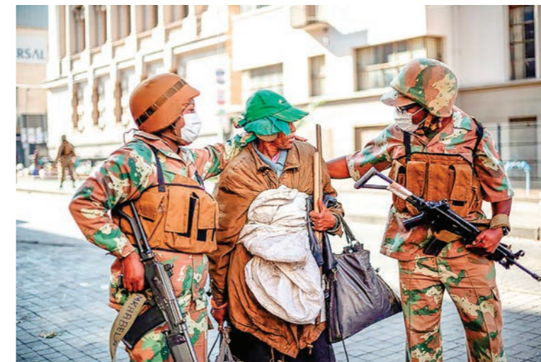
Soldiers escort a homeless woman to a gathering point in the Johannesburg CBD during the nationwide Covid-19 lockdown.