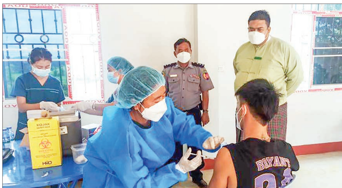
A local receives the second shot of Covid vaccine in Mongyang Township in Shan State(East).

THE second round of COVID-19 vaccination was conducted to the elderly and local people over the age of 65 at the designated vaccination centres in the villages in Monglwe village-tract, Mongyang Township, Kengtung District, Shan State (East) on 7 September.