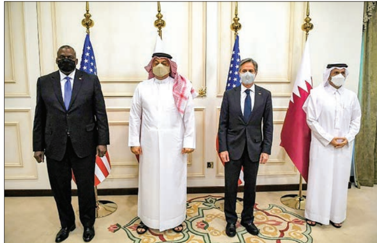
US Secretary of State Antony Blinken (2nd-R) and Secretary of Defense Lloyd Austin (L) with Qatari Deputy Prime Minister and Foreign Minister Mohammed bin Abdulrahman Al Thani (R) and Qatari Deputy Prime Minister and Defence Minister Dr Khalid bin Mohammed Al-Attiyah (2nd-L).

US Secretary of State Antony Blinken said Tuesday that the Taliban had reiterated a pledge to allow Afghans to freely depart