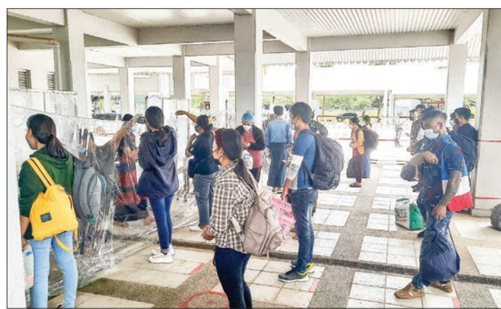
Returnees undergo reception process.

All the returnees must take COVID-19 tests and the positive ones will have to take medical treatment at Mae Kanal and Shwe Myawady