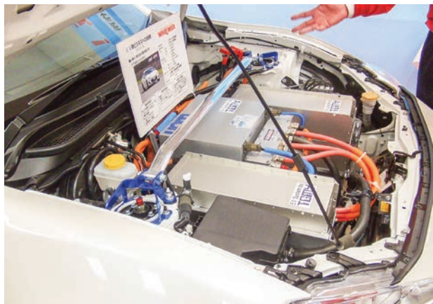
Toyota said it has not changed its target to commercialize all solid-state batteries, which enable a longer travel distance for electrified cars per charge, by the early 2020s.

TOYOTA Motor Corp. said Tuesday it will spend 1.5 trillion yen ($13.7 billion) by 2030 on the development and supply of batteries for electric and hybrid vehicles, as it pushes for carbon neutrality and competition intensifies over low emissions technology.