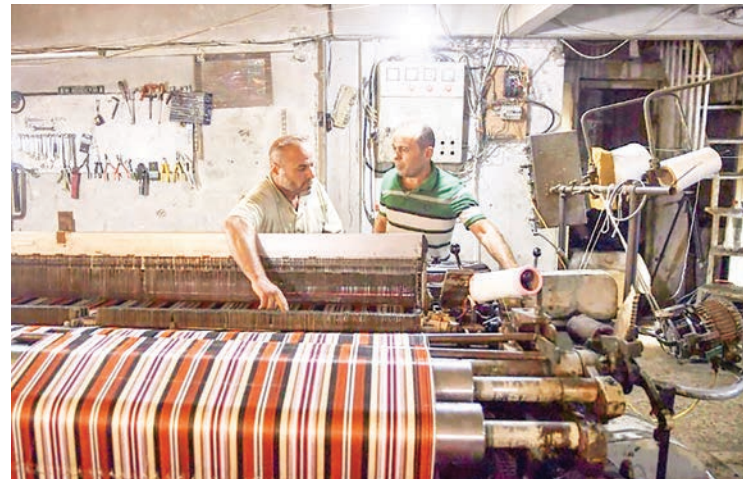
Syrian men work at a workshop in Aleppo. Syrians in government-held areas have had to adapt their lives at home and work around power cuts of up to 20 hours a day.

tricts may receive a little more power than residential neighbourhoods, but Majkini says it