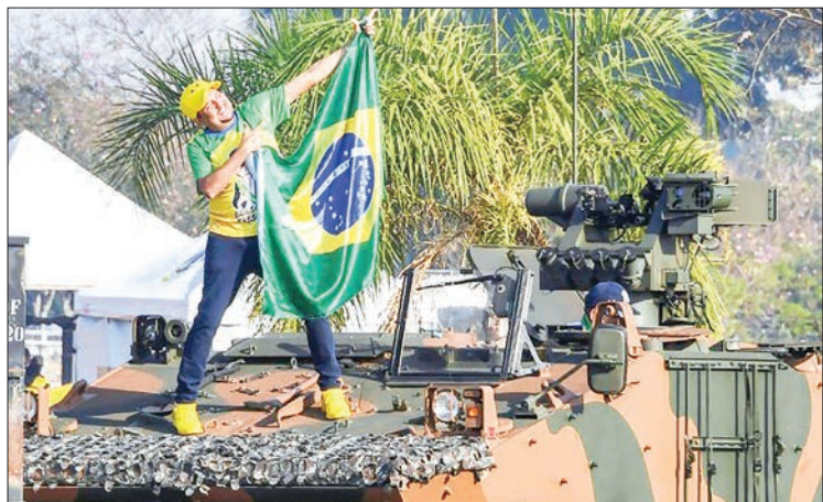
A supporter of Brazilian President Jair Bolsonaro holds a national flag while standing on a military vehicle, outside the Alvorada Palace, during the Independence Day celebrations in Brasilia.

PRESIDENT Jair Bolsonaro upped his attacks on perceived enemies including the Supreme Court and the electoral system