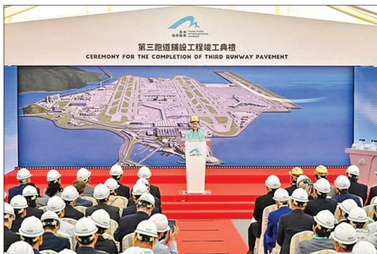
Chief executive leader Carrie Lam (centre) at the topping-off ceremony for the 3.9km runway.

The construction of new runways often faces strong opposition from environmental groups in western nations but Hong Kong's airport expansion saw little protest.