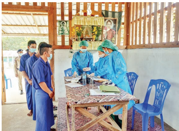
Inoculation for inmates in progress.

A total of 120 prisoners were vaccinated against COVID-19 at Natsingon labour camp, Cor-