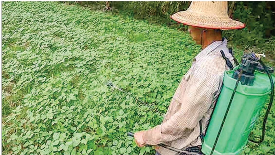
Kyat weakening against the US dollar in the forex market caused the price of black grams to spike.

THE price of black gram (urad called in India) has risen by K50,000 per tonne within a week, according to Yangon Region Chambers of Commerce and Industry (Bayintnaung Wholesale Centre).