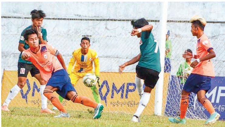
Myanmar National League allows teams from the Myanmar National League II to qualify for the League I.

THE Myanmar National League will only be able to confirm the participant teams after releasing the Myanmar National