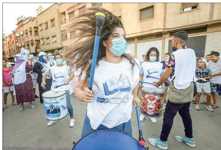
Coronavirus concerns have made energetic election rallies few and far between in Morocco.

In the final days, however, PJD and its close rival the Nation-