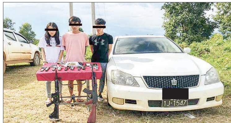
Arrestees and seized weapons, ammunition and car.

A joint team of security forces confiscated a total of 9 guns and 54 rounds of ammunition in a car while conducting a search operation in Mongyai Township, Lashio District in Northern Shan State yesterday afternoon.