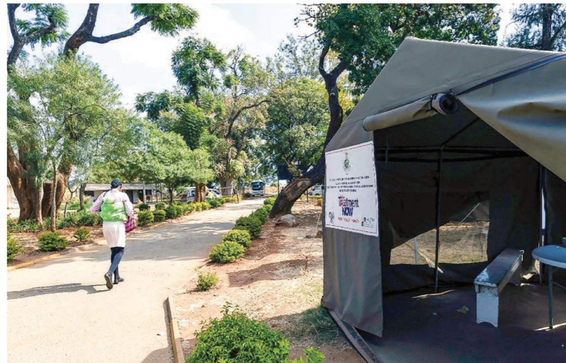
A patient walks past an HIV testing tent in Harare, Zimbabwe in June 2019.

There were "significant" declines in HIV testing and prevention services, the fund said. Compared with 2019, the