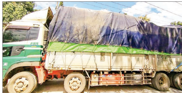
Anti-Covid equipment and medical aids are daily imported through land borders. Lorries and bowsers are transporting them to the needed areas.