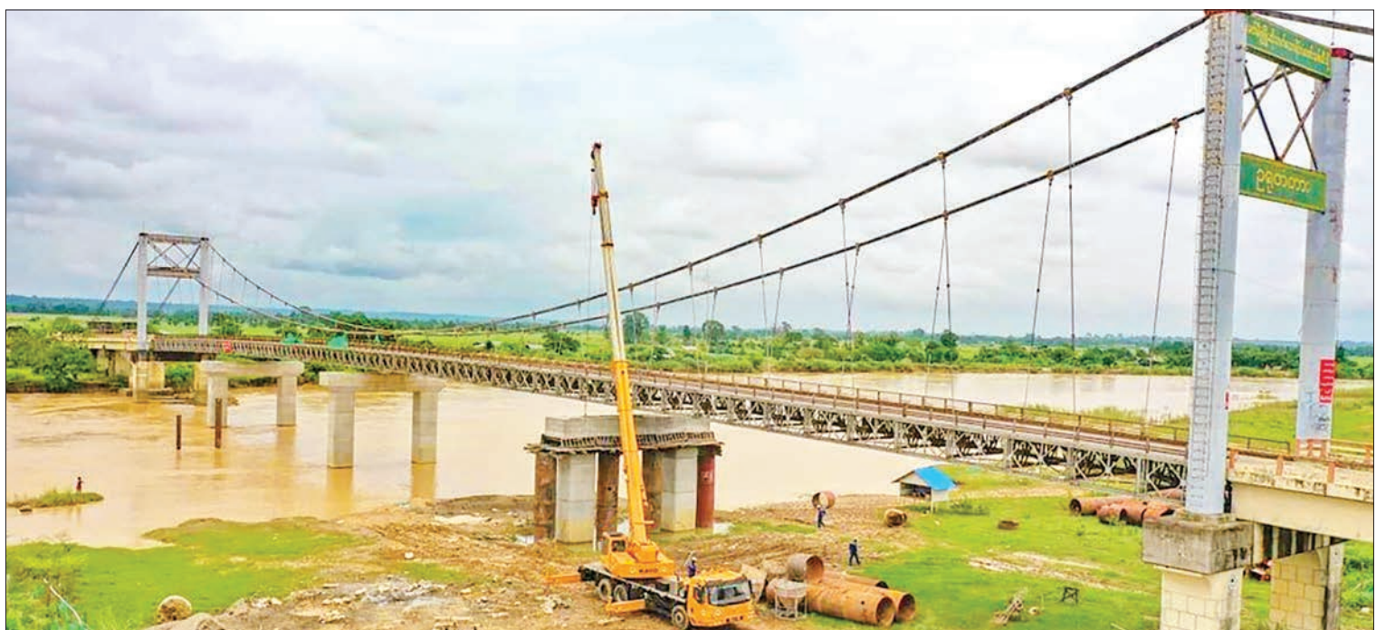
Upgrading works of Uru Bridge is underway. The new Uru Bridge is 1,090 feet long and 26 feet wide and has a 3-foot-wide pedestrian on each side. The waterway clearance of the bridge is 135 feet in width and 22 feet in height. It can withstand 60-tonne loads.