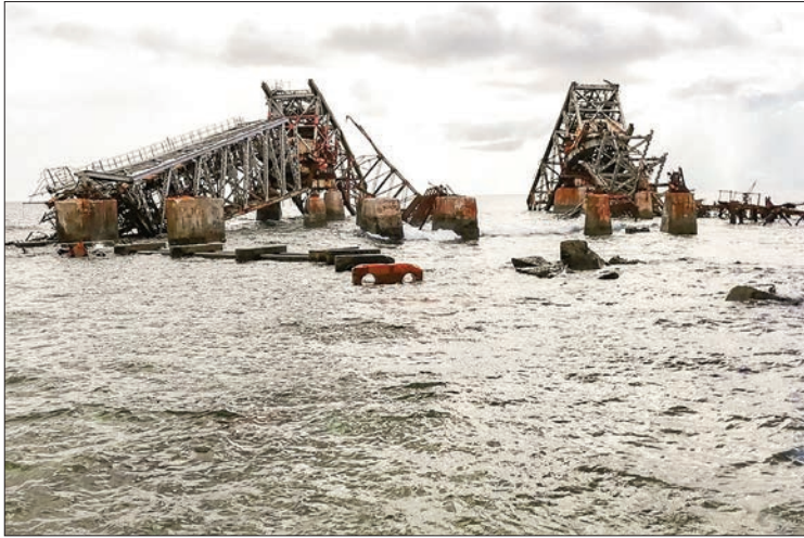
This photo taken on 30 August 2018 shows an abandoned phosphate harbour in Aiwo on the Pacific island of Nauru.

THE world's top conservation forum will vote this week on whether to recommend a moratorium on deep sea mining, with scientists warning that ecosystems degraded while dredging the ocean floor 5,000 metres below the waves could take decades or longer to heal. The proposed ban is among a score of measures deemed too controversial to be decided remotely ahead of the International Union for the Conservation of Nature (IUCN) Congress, meeting through Saturday in Marseille.