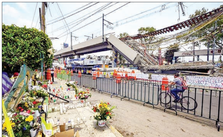
An altar with candles and flowers is seen near the section of an elevated track that collapsed bringing a train crashing down on 3 May in Mexico City.

AN investigation into the Mexico City metro disaster that left 26 people dead concluded Tuesday that the buckling of beams and problems with bolts caused the elevated track to collapse.