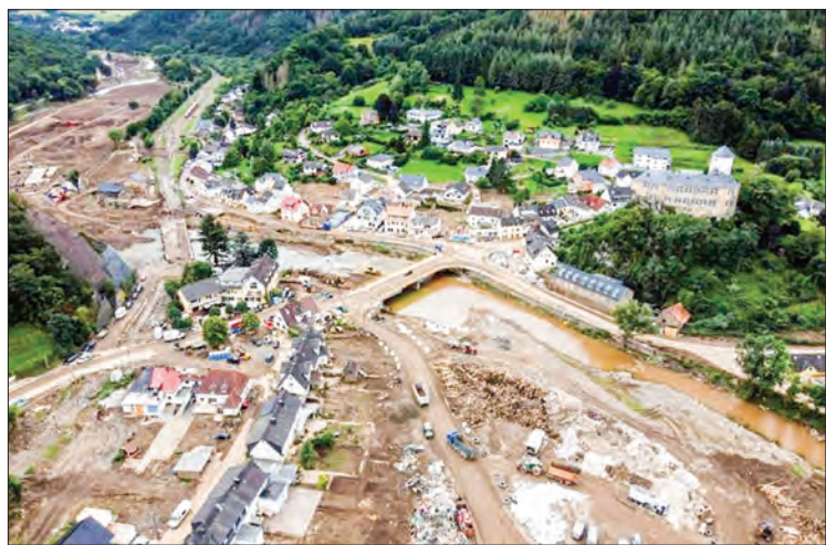
Merkel will check in on the flood-stricken community of Altenahr in Rhineland-Palatinate state.

GERMAN Chancellor Angela Merkel returned Friday to the scene of deadly flooding in the west of the country in a bid to