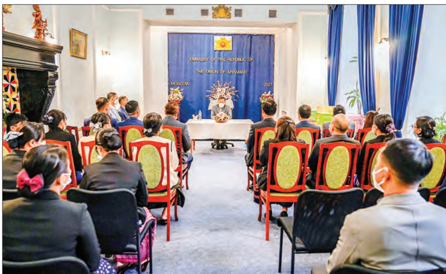
The Vice-Senior General cordially meets family members of the Myanmar Embassy and the office of the Military Attaché (Army, Navy and Air) in Moscow.