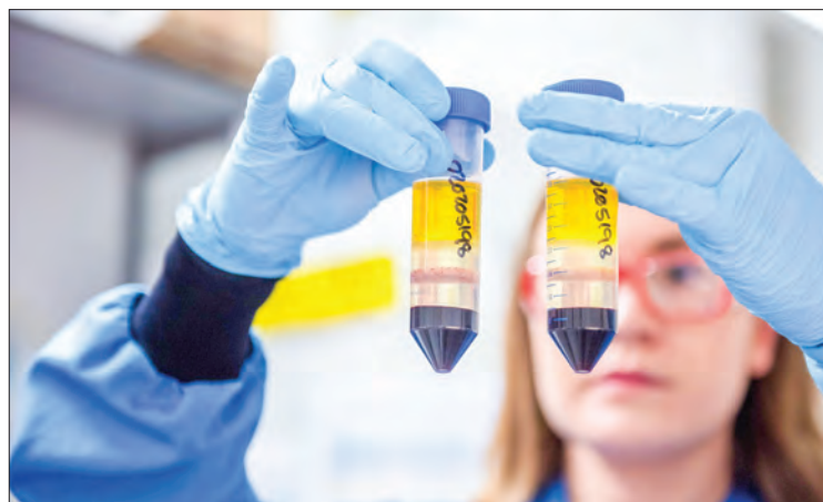
A researcher in a laboratory at the Jenner Institute in Oxford, England, works on the coronavirus vaccine developed by AstraZeneca and Oxford University.

“The vaccine technology based on viral vector is extremely powerful. In recent years we have had a new approach to treat cancer ... immunotherapy ... it has had remarkable results. But some patients immune system doesn't respond. So ... the idea here is to use a vaccine based on the Oxford technology to really to teach the immune system how to recognise cancer cells.”— AFP ■