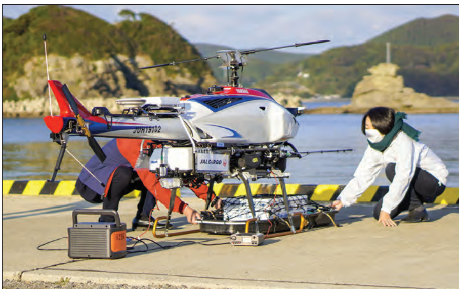
Japan Airlines Co. carries out a delivery test flight of a drone among Nagasaki Prefecture's Goto Islands in southwestern Japan in November 2020.

The two companies see the new services as playing a useful role in supporting local health care provision and disaster preparedness as well as expanding community infrastructure on remote islands and other far-flung areas. At the same time, the initiatives will help them promote management diversification and strengthen profitability as the coronavirus pandemic continues to take a toll on their overall business performances. ANA Holdings, the parent of All Nippon