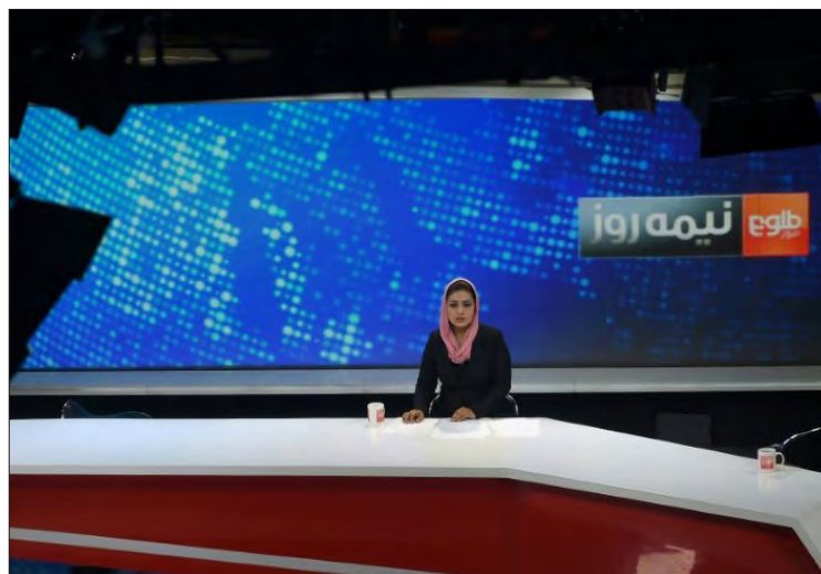
One Taliban official has sat down for an interview with a woman host on Tolo News.