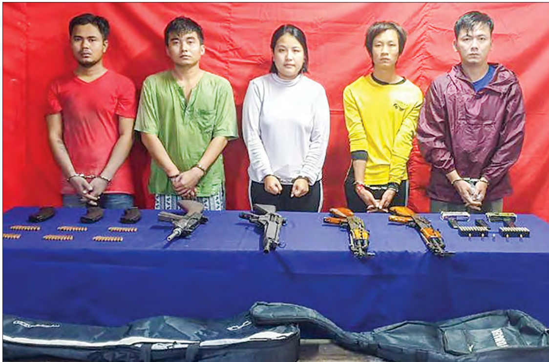
Perpetrators of armed attack arrested along with weapons and ammunition.

PERPETRATORS of the deadly armed attack that happened on the Insein-Yangon-Insein-Hlawgar-Insein circular train on 14 August 2021, which killed five policemen and injured one, were arrested together with four weapons and ammunition taken from the police force.