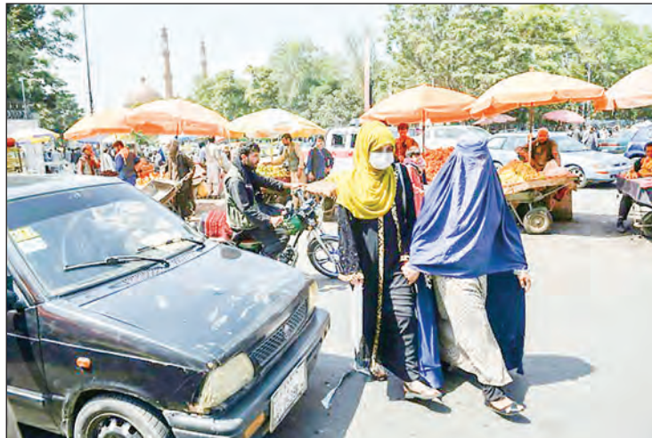
How the Taliban's pledges of a softer brand of rule will translate into reality remains to be seen.

Battered by decades of war, the country was also grappling with a prolonged drought. Then in 2020, the coronavirus pandemic added a fresh layer of strain to a barely functioning health system. The Taliban onslaught sparked a new exodus, both within and beyond the country's borders. According to the UN refugee agency, over half a million Afghans have become internally displaced this year.—AFP ■