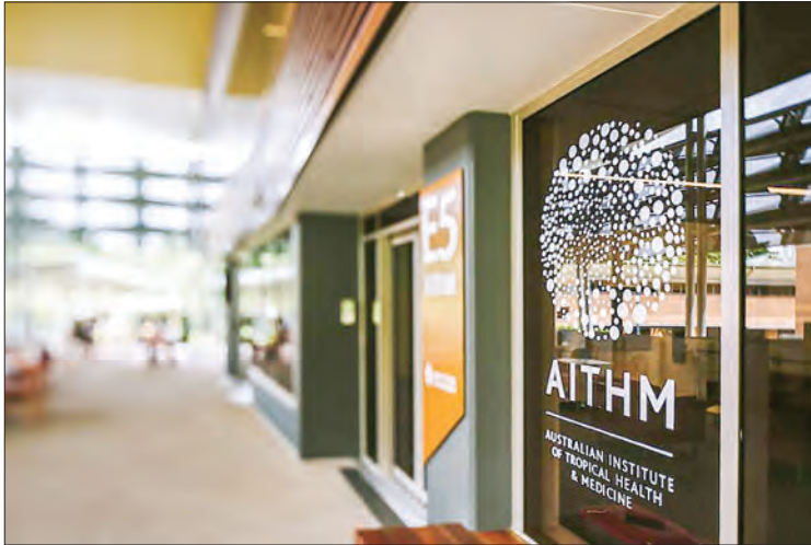
The Australian Institute of Tropical Health and Medicine (AITHM) at James Cook University is Australia's only dedicated health and tropical medicine research institute.

RESEARCHERS at the Australian Institute of Tropical Health and Medicine (AITHM) at James Cook University (JCU) have discovered gut parasites that could be used to treat coeliac disease.