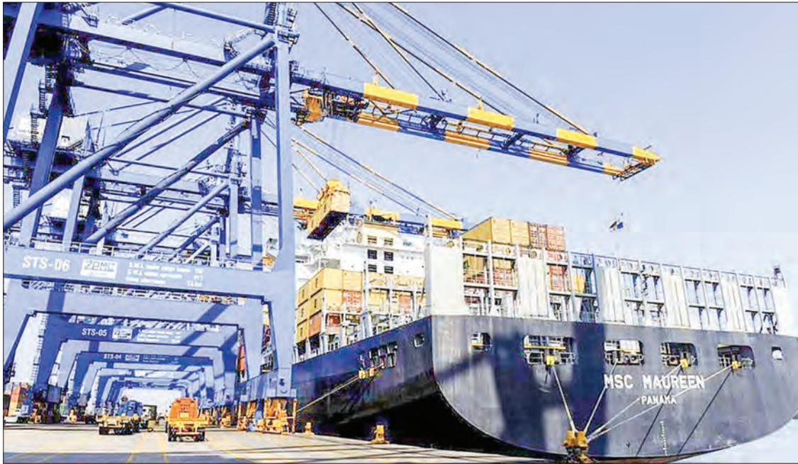
India's total exports grew by more than 45 per cent during August compared to last year, to 33.14 billion U.S. dollars, revealed the latest data released by the federal ministry of commerce and industry.

INDIA'S total exports grew by more than 45 per cent during August compared to last year, to 33.14 billion U.S. dollars, revealed the latest data released by the federal ministry of commerce and industry.