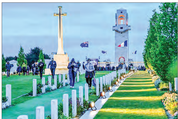
The memorial at Villers-Bretonneux has become a lightning rod for the row over wind farms.

OPPONENTS of a wind farm planned next to a battlefield in France where hundreds of Australian soldiers died during World War I are urging the government to cancel the plan, calling it an affront to the memory of the dead.