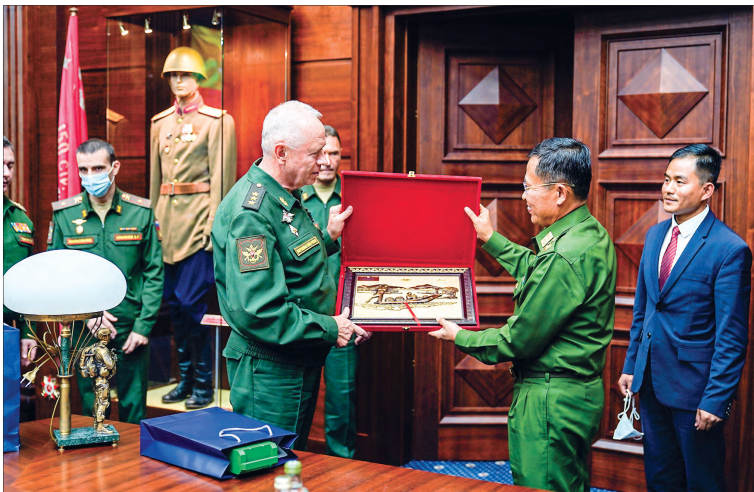
Vice-Chairman of the State Administration Council Deputy Commander-in-Chief of Defence Services Commander-in-Chief (Army) Vice-Senior General Soe Win presents a souvenir to Russian Deputy Minister of Defence Colonel-General Alexander Vasilyevich Fomin in Moscow.

They cordially exchanged views on further cooperation in the enhancement of friendly relations between Myanmar and Russia and the two armed forces, and plans of Russia to