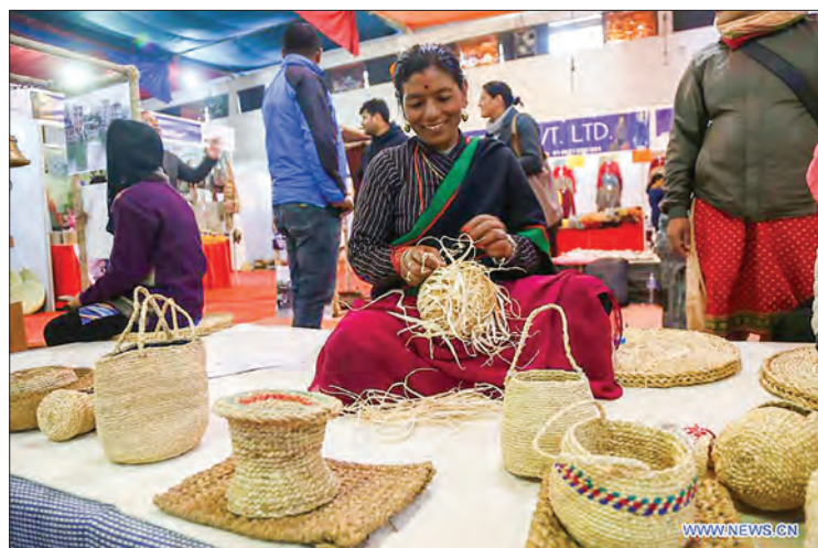
A Nepali woman prepares traditional products at a stall during the Handicraft Trade Fair in Kathmandu, Nepal, on 14 Nov 2018.

The export has suffered badly in the last two fiscal years as the COVID-19 pandemic rages, noted the bank. —Xinhua ■