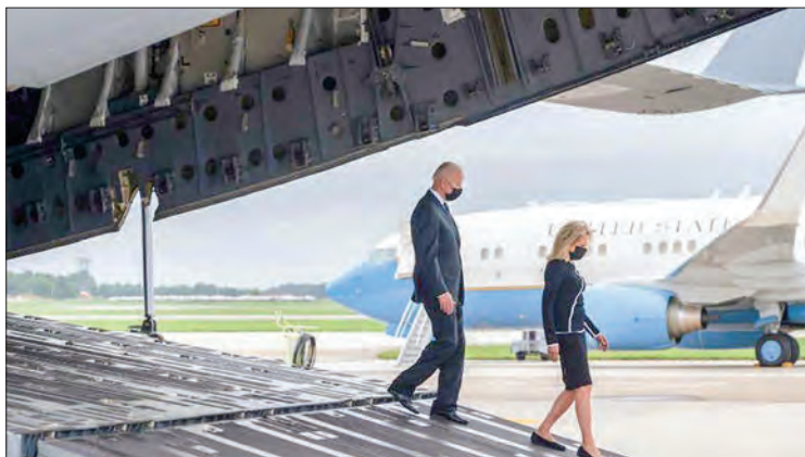
US President Joe Biden and First Lady Jill Biden walk off a military airplane following a prayer after the last American service members killed in Afghanistan were flown home.

“Human rights will be at the centre of our foreign policy but the way to do that is not through endless military deployments,” he said. “Our strategy has to change.”