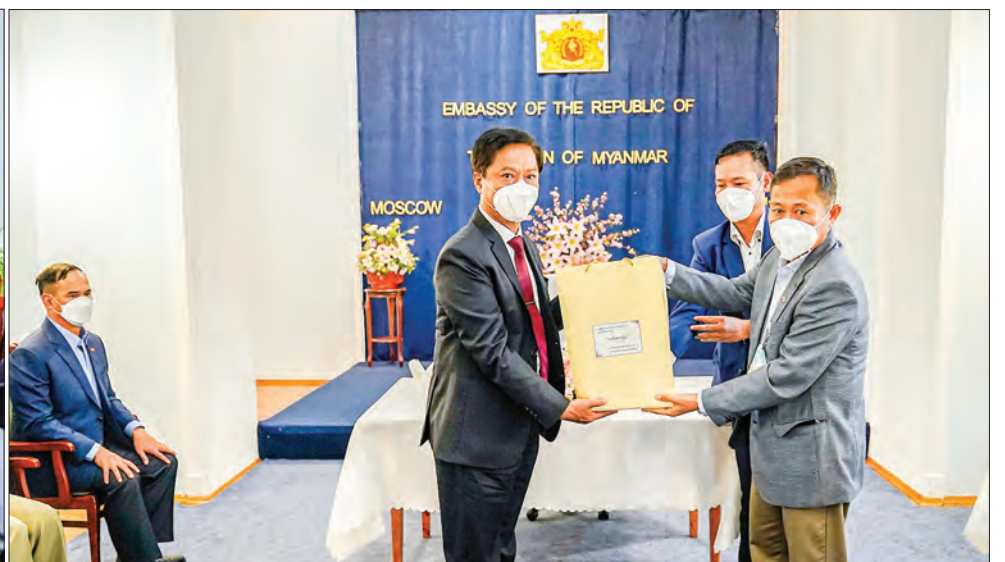
Vice-Senior General Soe Win presents gifts and cash awards for families of the Myanmar Embassy to Ambassador U Lwin Oo.

3,078 new cases of COVID-19 reported on 4 September, total figure rises to 412,587