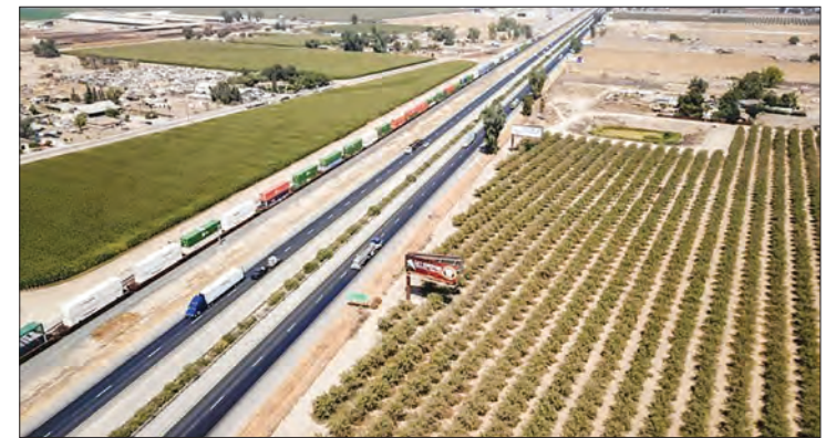
The US service sector was expanding in August, but shortages of labour and materials continued to trouble businesses, an industry survey said.

However, the report showed business activity and production falling 6.9 percentage points from July, new export orders falling more than five percentage points and new orders declining slightly.—AFP ■