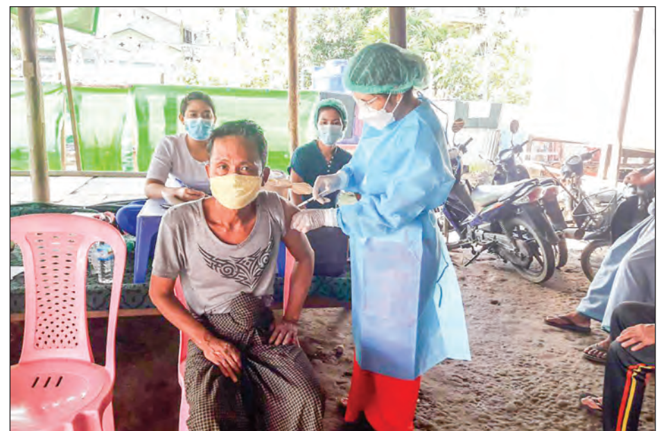
Inoculation process is underway and health workers administer the first doses of Sinopharm Covid vaccines to IDPs in Kyauktaw Township, Rakhine State.