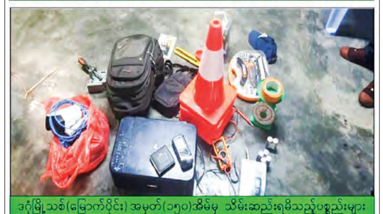
ဒဂုံမြို့သစ်(မြောက်ပိုင်း) အမှတ်(၁၅၀)အိမ်မှ သိမ်းဆည်းရမိသည့် ပစ္စည်းများ