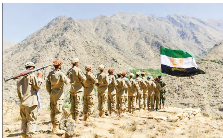
Fighters from the National Resistance Front (NRF), made up of anti-Taliban militia fighters and former Afghan security forces, are understood to have significant weapon stockpiles in the valley.