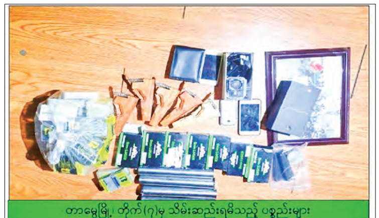
တာမေ့မြို့၊ တိုက်(၇)မှ သိမ်းဆည်းရမိသည့် ပစ္စည်းများ

The security forces confiscated those weapons on 3 September. It is reported that the security forces are making continuous efforts to arrest the rest of the perpetrators and has requested the people to work together to identify the related incidents committed by the terrorist groups.—MNA