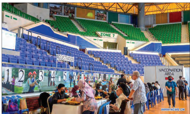
Local residents wait to get COVID-19 vaccine injection at a vaccination centre in Bandar Seri Begawan, Brunei, on 5 July 2021.

Half of the Brunei population has received at least one dose of COVID-19 vaccines under the national vaccination programme,