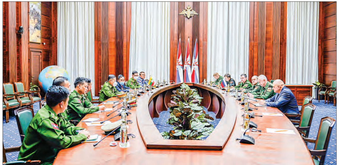
Vice-Senior General Soe Win holds talks with Russian Deputy Minister of Defence Colonel-General Alexander Vasilyevich Fomin.