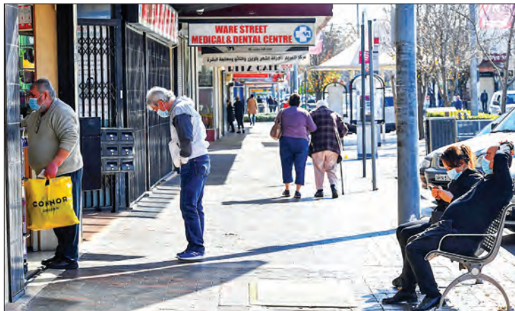
Residents visit a pharmacy in the Fairfield suburb of Sydney on 2 Aug 2021 during the city's prolonged COVID-19 coronavirus lockdown.

Berejiklian used her latest conference to praise the “outstanding” vaccine rollout efforts saying NSW was expected to become the nation's first state or territory to hit 70 per cent first-dose vaccinations.—Xinhua ■