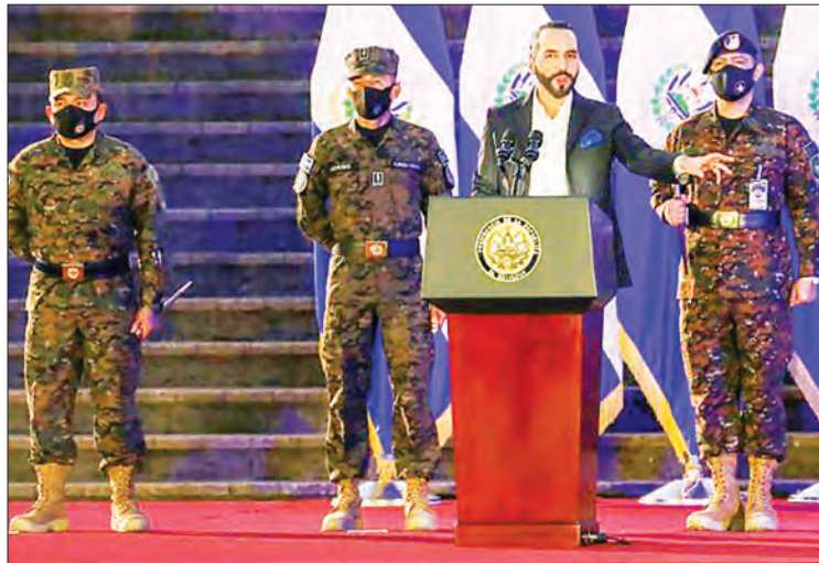
Salvadoran President Nayib Bukele enjoys broad popularity but has been accused of authoritarian tendencies.

The decision was handed down by judges appointed to El Salvador's highest court by Bukele in May after the country's parliament removed several justices critical of the government -- a move decried by critics as a "coup d'etat" and one which sparked international condemnation.