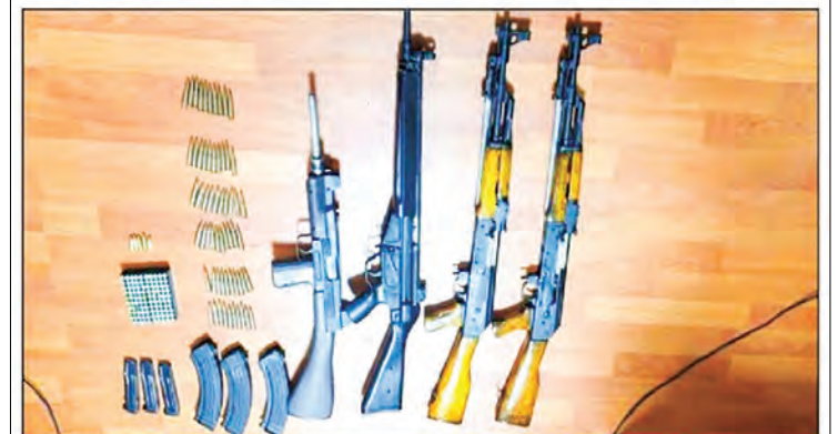
သယံဇာတကျွန်းမြို့နယ် တိုက်(၂)မှ သိမ်းဆည်းရမိသည့် ပစ္စည်းများ