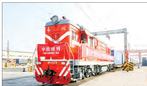
Photo taken on 21 Feb 2021 shows a China-Europe freight train departing from Chengdu International Railway Port in Chengdu, southwest China's Sichuan Province.

This was the sixteenth straight month that trips made by China-Europe freight trains had exceeded 1,000, said the company, adding that the total number of train