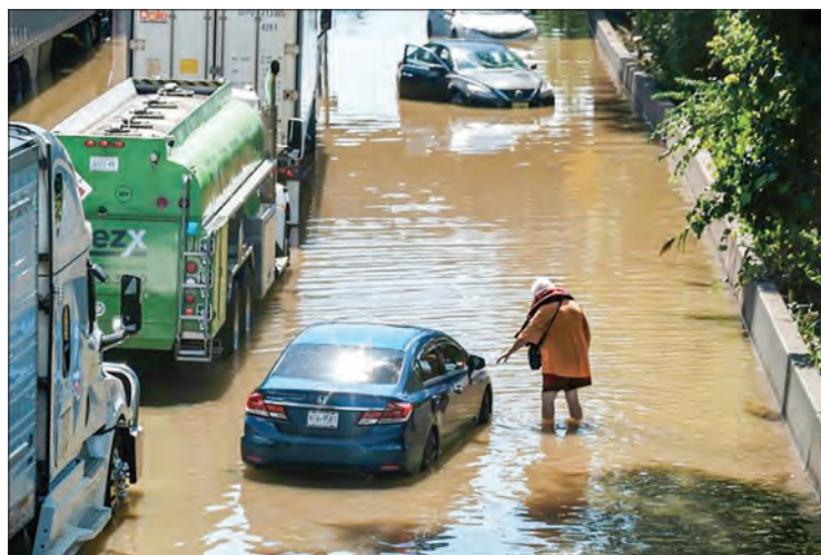
A flooded road in New York City on 2 September 2021.

A 2008 study by the Pratt Centre for Community Development found that 114,000 New Yorkers lived in illegal basement apartments but researchers say the number is now likely to be much higher. —AFP ■