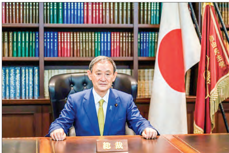
Japan's vaccine tsar and a low-key moderate are among the possible replacements for Prime Minister Yoshihide Suga.

The soft-spoken politician is seen as "moderate and capable", making him a top pick for the