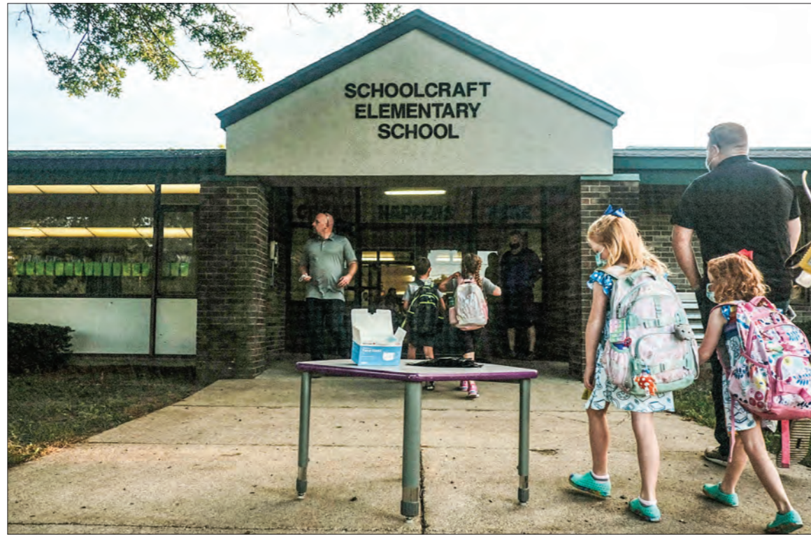
Face masks sit on a table outside of Schoolcraft Elementary for students and parents to wear when entering the building on the first day of school on August 30, 2021 in Schoolcraft, Michigan.

Weekly hospitalizations of children aged 0-17 were at their lowest between 12 June and 3 July