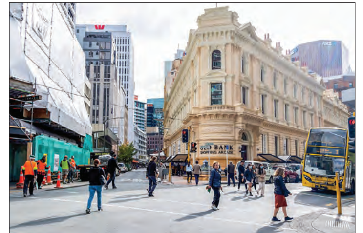
People walk on a street in Wellington on 14 May 2020.

She said one measuring station near Wellington recorded a carbon dioxide concentration of 320 parts per million in the early 1970s but the level was now 412 parts per million, up almost 30 per cent. — AFP ■