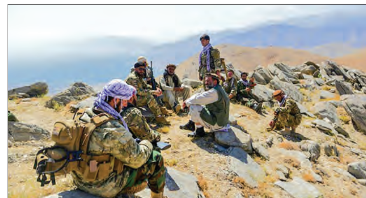
Afghan anti-Taliban forces take a rest as they patrol on a hilltop in Panjshir province.

On Wednesday, senior Taliban official Amir Khan Muttaqi issued an audio message to say their forces had surrounded the valley, calling on the people of the Panjshir to tell fighters to lay down their arms. — AFP ■