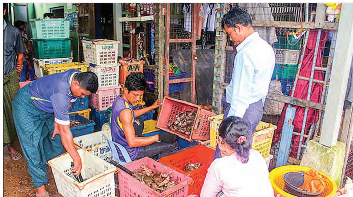
Workers sort crabs at the market in Myeik, Taninthayi Region.

Fisheries, shrimp and crab are transported from Kawthoung to Yangon and then to the market country via flight. Earlier, the foreign marketable soft-shell crab, lobster, mantis shrimp, giant sea perch, eel, cuttlefish and winkle from Rakhine State, Taninthayi and Ayeyawady regions were directly transported to foreign markets through the Yangon region within 24 hours. — Nyein Thu (MNA)/GNLM