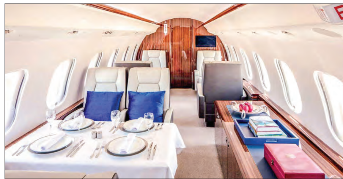
Amid the pandemic, the appeal of spaced-out seating and reduced exposure to other people is driving demand for private travel among high net worth individuals and corporations.