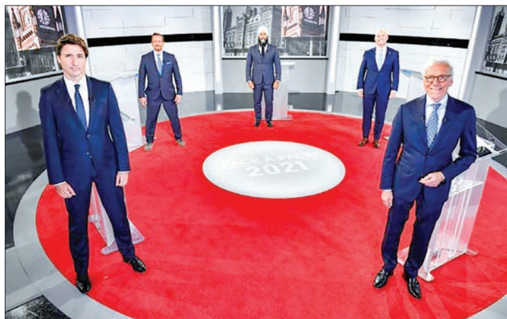
L to R: Prime Minister Justin Trudeau (L), Bloc Quebecois leader Yves-Francois Blanchet (2L), NDP leader Jagmeet Singh (C), Conservative leader Erin O'Toole (2R) and Canadian journalist Pierre Bruneau (R) at the TVA studios in Montreal on 2 Sept 2021.

CANADIAN Prime Minister Justin Trudeau came out onto a debate stage Thursday with guns blazing, needing to turn around his Liberals' faltering re-election campaign.