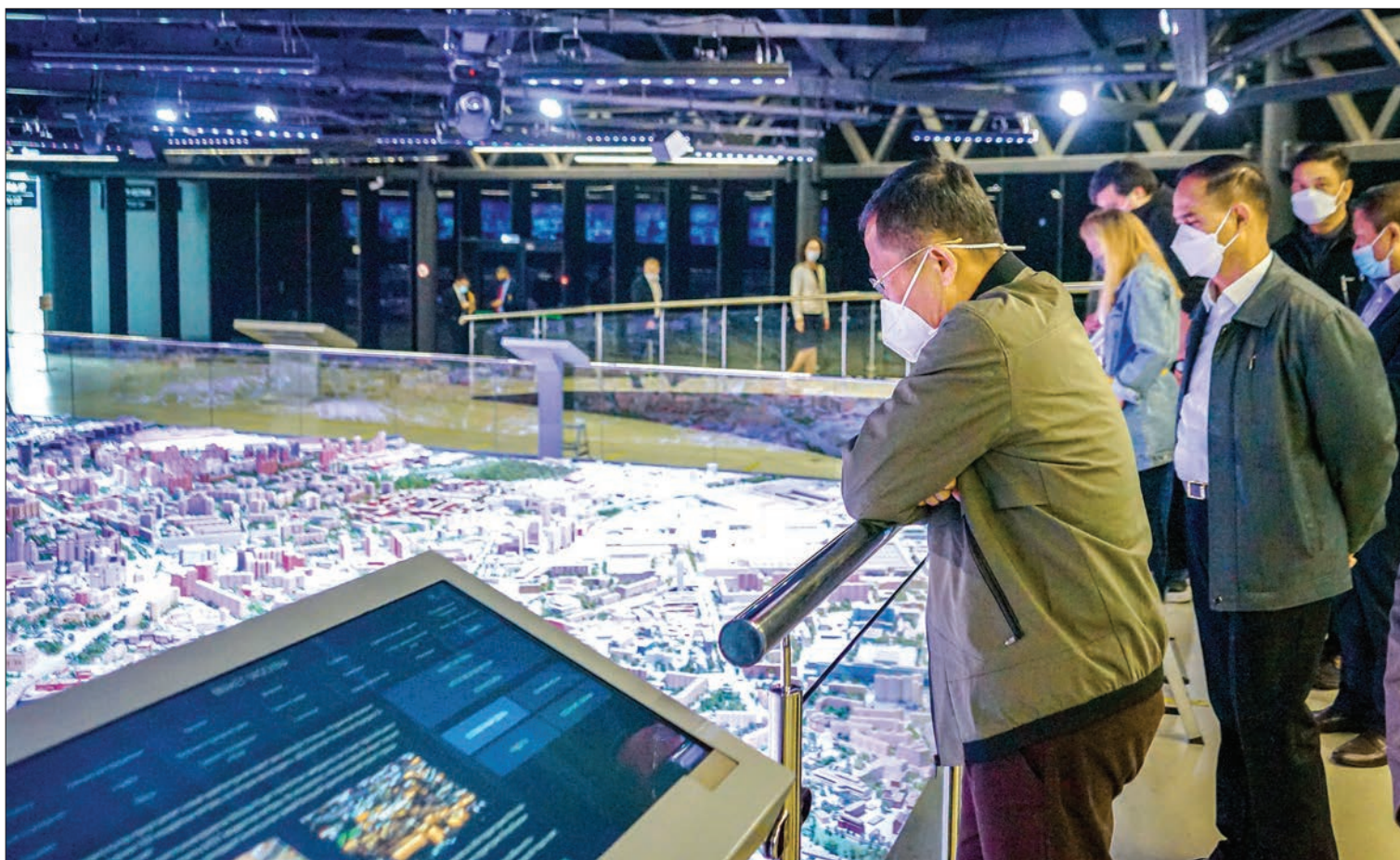
Vice-Chairman of the State Administration Council Vice-Senior General Soe Win and party view around the Exhibition of Achievements of National Economy in Moscow on 2 September 2021.

At the meeting, the Vice-Senior General explained the current political changes, needs for lending a helping hand to each other while discharging the duty of the State abroad,