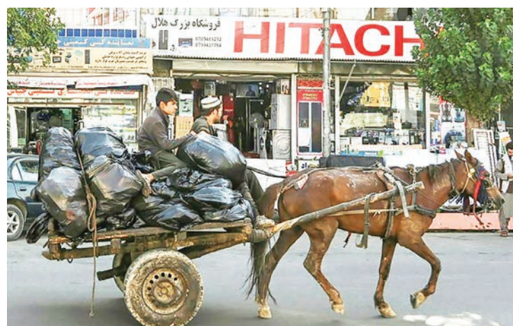
Remittances are vital for Afghanistan's economy, which was disrupted when the Taliban took over in August.

WESTERN Union and MoneyGram announced on Thursday that they would resume money transfer services to Afghanistan, allowing vital remittances into a