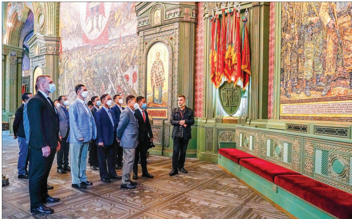
State Administration Council Vice-Chairman Deputy Commander-in-Chief of Defence Services Commander-in-Chief (Army) Vice-Senior General Soe Win makes a tour around the Main Cathedral of the Russian Armed Forces of the Russian Federation in Kubinka, southwest of Moscow, on 2 September 2021.

The Main Cathedral of the Russian Armed Forces of the Russian Federation was built in honour of the Diamond Jubilee Victory Day of the Great Patriot-