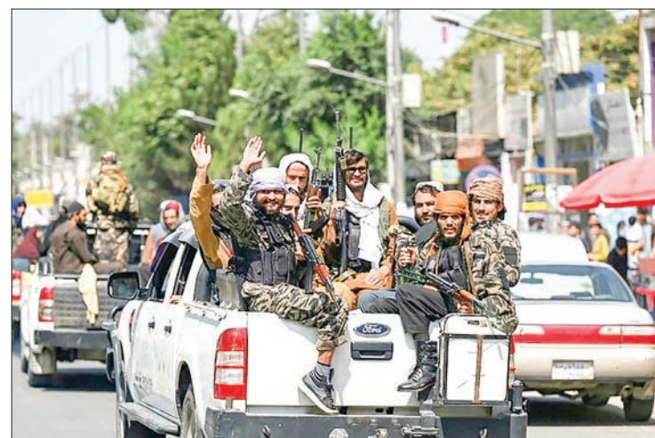
Taliban fighters wave as they patrol in a convoy along a street in Kabul on 2 September 2021.

Western Union and Moneygram said they were resuming money transfers, which many Afghans rely on from relatives abroad to survive, and Qatar said it was working to reopen the airport in Kabul — a lifeline