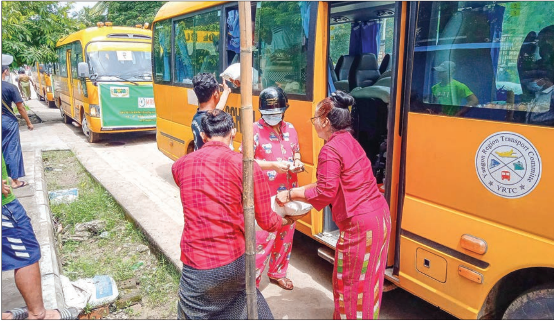
The food commodities were sold at K5,000 per five-pyi sack of low-quality rice, K8,500 per sack of high-quality rice, K1,850 per oil bottle (60 visses) and K1,300 per 10-pcs tray.

MYANMAR Rice Federation in coordination with Twantay Township Development Affairs Committee sold staple food, including rice, egg, fish and oil at fairer prices with the mobile market trucks in front of the BEHS 1 on Shwesantaw Pagoda Road in Ohnpinsu Quarter, at the Shwenyaungpin junction and Kyauktine traffic point at 9 am on 2 September.