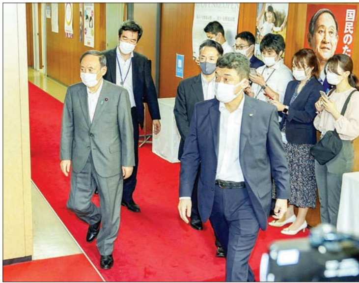
Suga announced his intention to resign at an emergency meeting of senior members of the ruling Liberal Democratic Party (LDP).

"I had planned to run, but dealing with both COVID-19 and the election would require an enormous amount of energy. I decided that there was no way