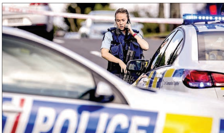
A file photo of an armed New Zealand police officer.

The attack has stirred painful memories of the Christchurch mosques shootings in March 2019, New Zealand's worst terror atrocity, when a white supremacist gunman murdered