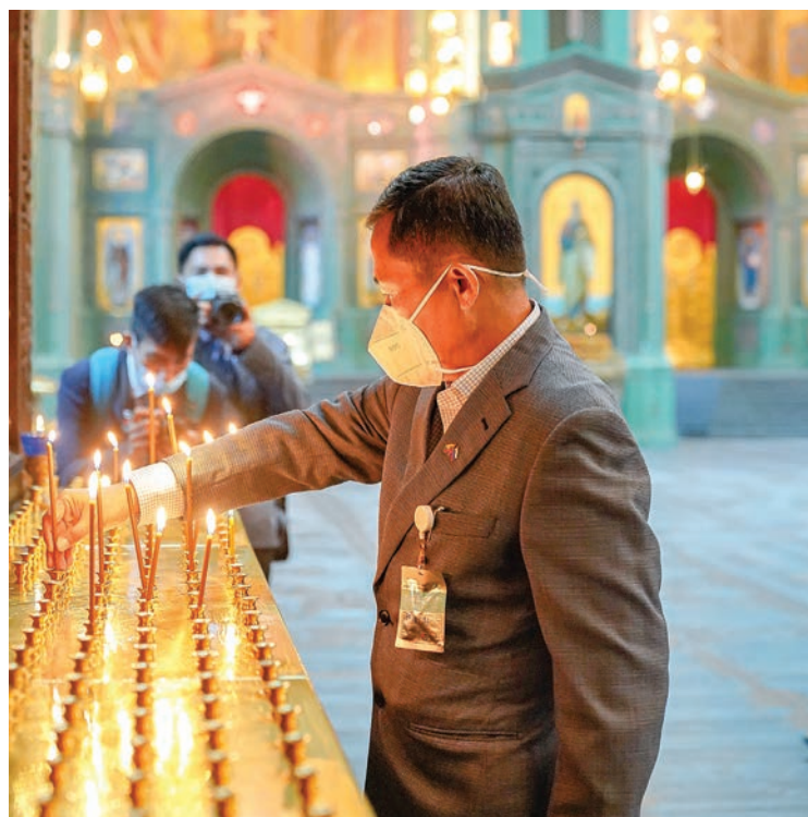
Vice-Senior General Soe Win offers the light at the Main Cathedral of the Russian Armed Forces yesterday.

ic War which fell on 9 May 2020. It aims to emerge as the Centre of Military Glory of the Russian Federation. The main building is 96 metres high together with a 75 metres high bell tower; three small buildings, four museums and parks were constructed by more than 4,000 renowned architects and artists day and night within six months. More