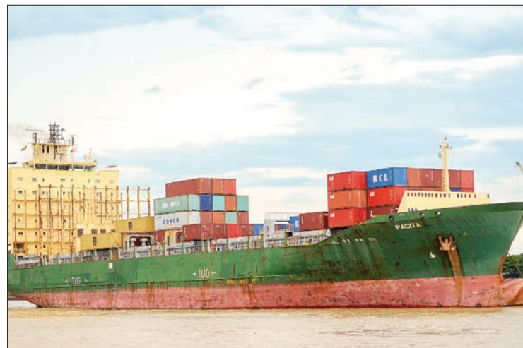
Yangon inner terminal and the outer Thilawa Port received over 152 larger ships of above 30,000 DWT (Deadweight tonnage) in the past five months (February-June) this year after the draft limit is extended up to 10 metres with the new navigation channel accessing to inner Yangon River.

Yangon inner terminal and the outer Thilawa Port received over 152 larger ships of above 30,000 DWT (Deadweight tonnage) in the past five months (February-June) this year after the draft limit is extended up to 10 metres with the new navigation channel accessing to inner Yangon River. Myanmar Port Authority is ensuring smooth freight flow with non-stop operation during the public holidays. — KK/GNLM