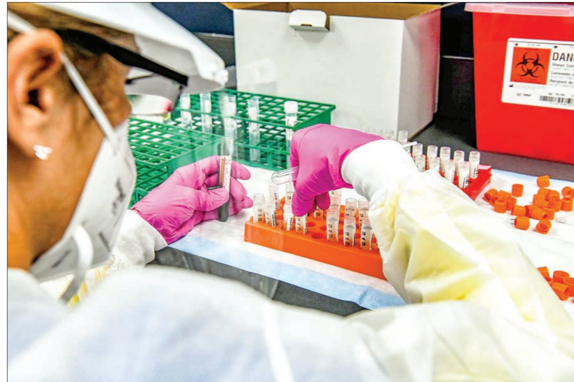
Since first emerging in Colombia in January, the variant has popped up in at least 39 countries, including in the US. A lab technician sorts blood samples inside a lab for a COVID-19 vaccine study at the Research Centres of America (RCA) in Hollywood, Florida, U.S., 13 Aug 2020.

More resistant to vaccines Mu is the fifth variant of interest to be monitored by the WHO