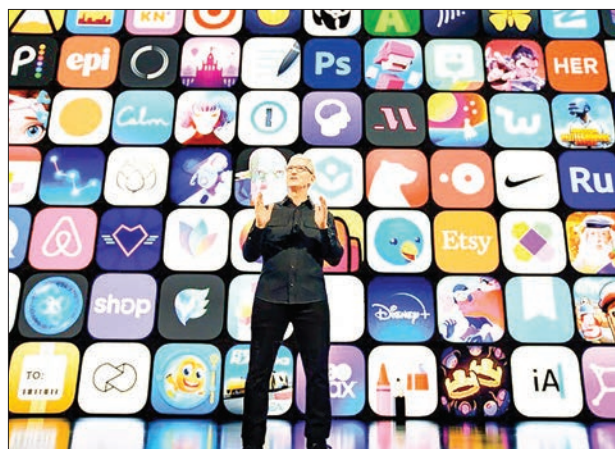
Apple is bending strategically to growing anti-monopoly pressure, analysts say.