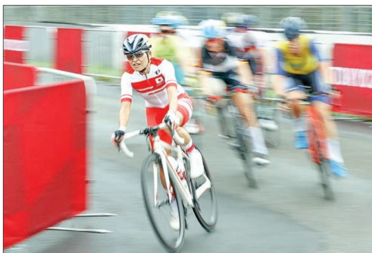
Keiko Sugiura (front) of Japan competes in the women's C1-3 cycling road race of the Tokyo Paralympics at Fuji International Speedway on 3 Sept 2021.

"I think I used up all my luck. In the toughest final stretch, I heard my coach shouting 'go,