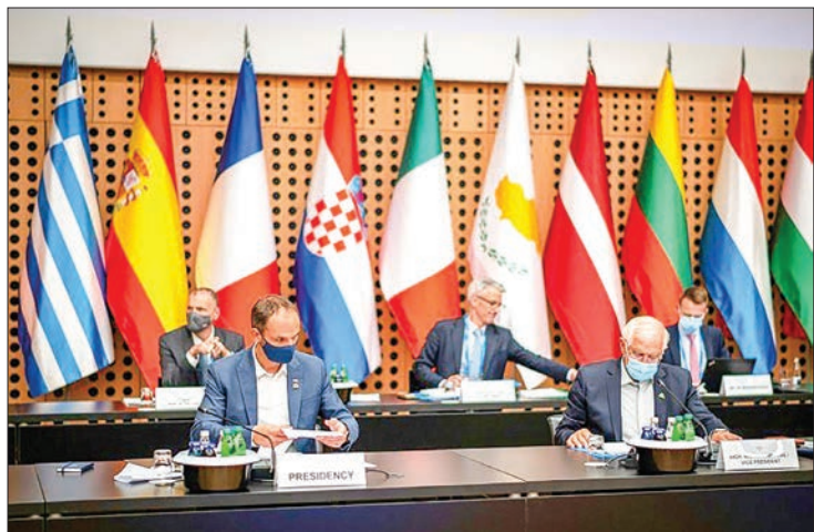
Slovenia's Foreign Minister Anze Logar (front-L) and European foreign policy chief Josep Borrell start an EU meeting in Slovenia's Brdo Castle.

EU defence ministers on Thursday weighed proposals for a European rapid reaction force after