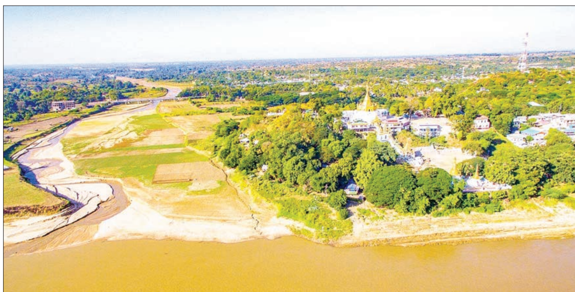
Some aerial views of sightseeing in Minbu.