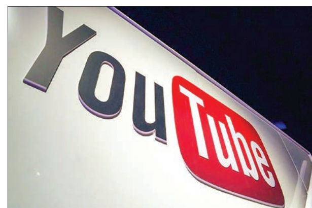
YouTube's music streaming service says it is growing quickly as it tries to catch up with rivals like Spotify.