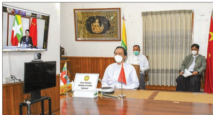
The MoH Union Minister attends the virtual event to receive one million vaccines and two-million-yuan worth of medical aids donated by China on 2 September 2021.