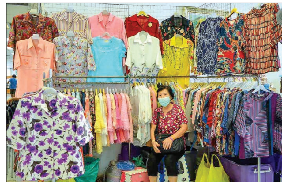
According to Thailand Development Research Institute (TDRI), the country currently has about 3 million SMEs, employing up to 12 million people or around 82 per cent of total employment. A small clothing shop in Bangkok. On the surface, the signs of a looming crisis are not clearly visible.

digital skills for building and expanding business in the future business landscape, will be offered to participating members.