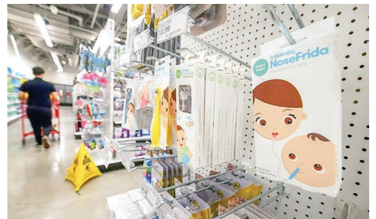
Toys and teething products will have to be displayed in a gender neutral way -- as well as in traditional fashion -- in large California department stores, under a bill passing through the state's legislature.