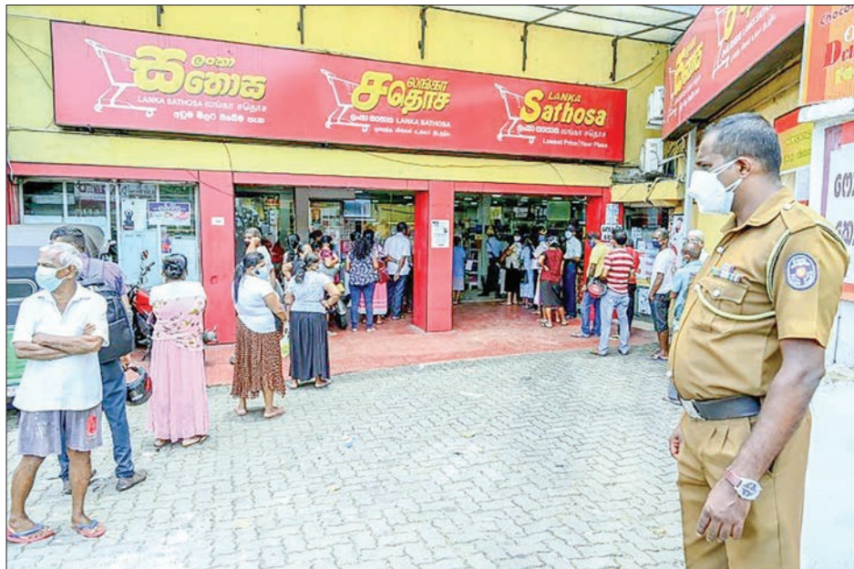
Only government stores have been opening because of a nationwide coronavirus lockdown.

Sri Lanka imposed price controls on key foods Friday as the government stepped up the use of emergency powers to counter shortages.