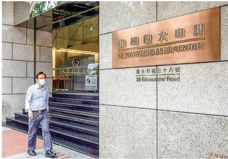
Evergrande has warned it has total liabilities of $305 billion and it faced 'risks of defaults on borrowings'.

SOME creditors of heavily indebted Chinese real estate giant Evergrande Group are demanding immediate payback of loans, a report said Friday, days after the company acknowledged it may default on some of its massive borrowings.