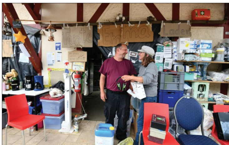
The station has been turned into a supplies shop called 'Tante Emma'.

INSTEAD of the shouts of noisy children, the halls of the primary school in the German town of